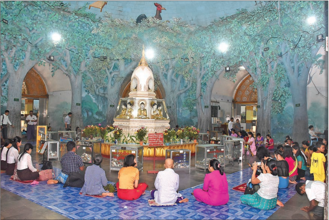
Buddhist devotees pay homage to Maha Wizaya Pagoda in Yangon on the Fullmoon of Waso.