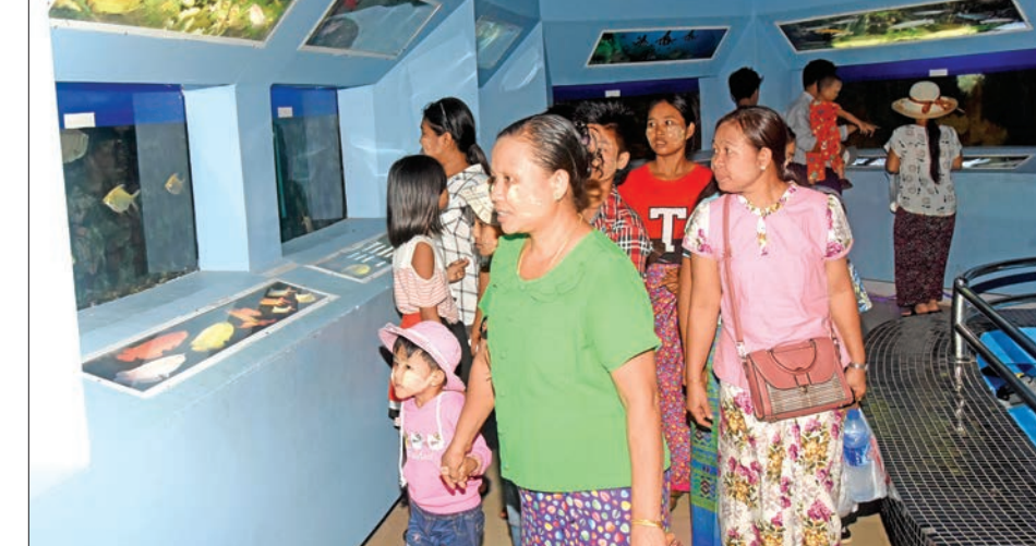
People visit Aquarium in Nay Pyi Taw on the Fullmoon of Waso.