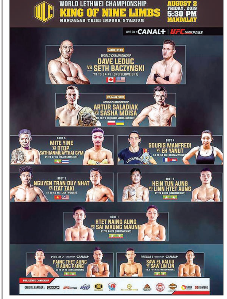
The 'King of Nine Limbs' event of World Lethwei Championship is scheduled to be held on 2 August 2019 at the Mandalar Thiri Stadium in Mandalay.