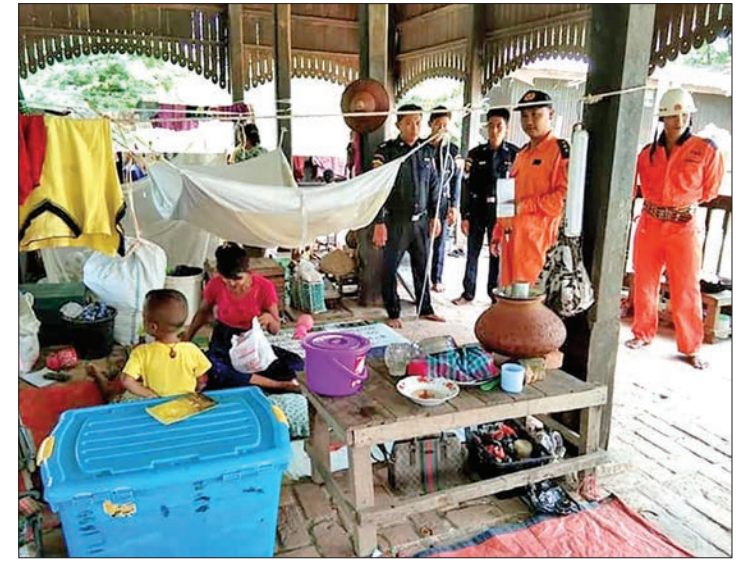
Fire Fighters and policemen collect data at the temporary shelters in Htigyaing.