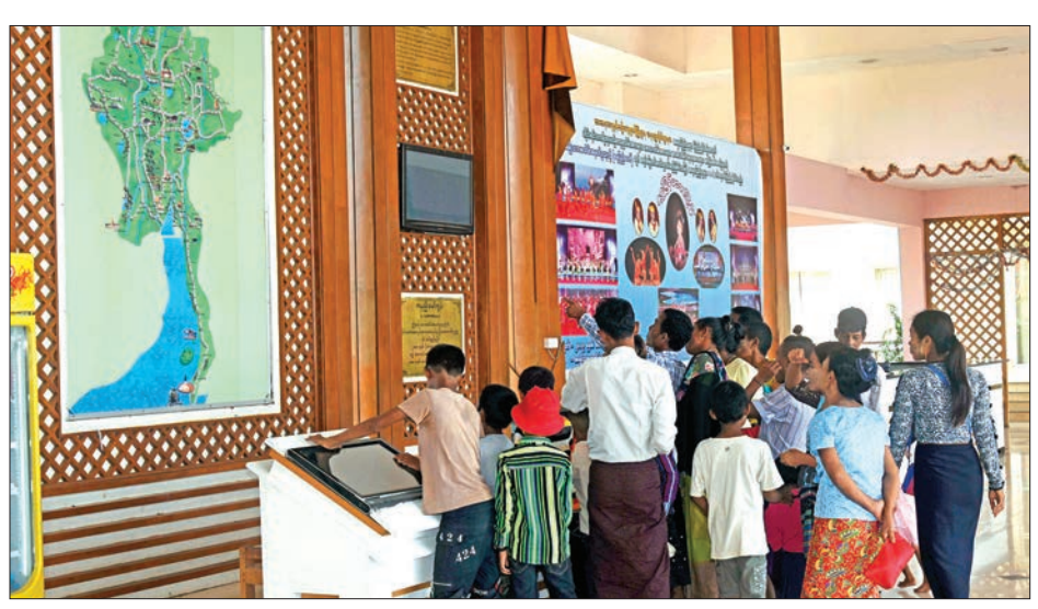
People visit National Landmark Garden in Nay Pyi Taw on the Fullmoon of Waso.