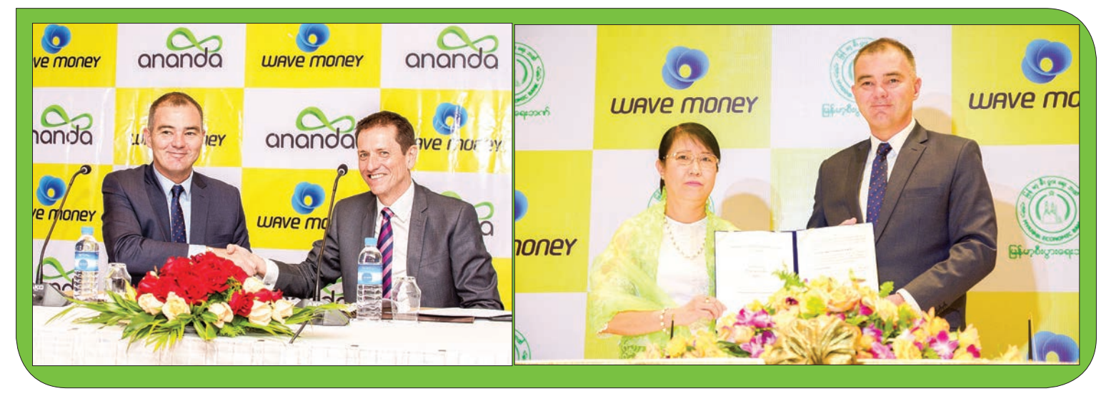
Officials of Wave Money and Ananda shaking hands at the signing Ceremony.

"The usage of mobile money continues to grow dramatically in Myanmar. For people who send and receive money,