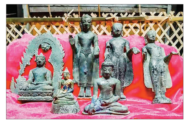
Ancient Buddha statues found in Thawuntaw village-tract, Twantay Township, Yangon.