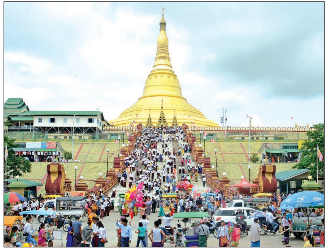
Uppatasanti Pagoda is crowded with pilgrims in Nay Pyi Taw on the Fullmoon Day of Waso.

BUDDHISTS observed the Fullmoon of Waso, also known as Dhammacakka Day, at pago-