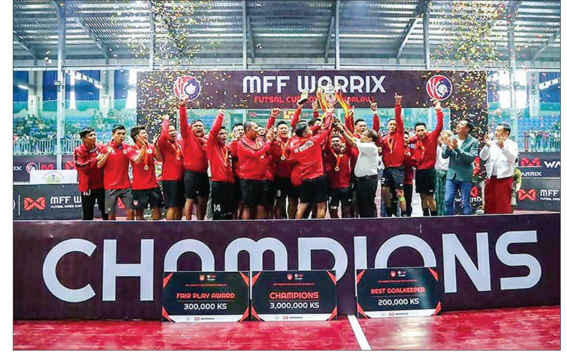
GV Athletic celebrate their win at the MFF Warrix Futsal Cup 2019 (Mandalay) awards presentation ceremony on 16 July at the Mandalar Thiri Stadium in Mandalay.

A total of 41 teams took part in the MFF Warrix Futsal Cup 2019 (Mandalay).