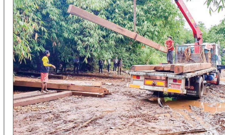
Forest Department officials check illegally timber in Kaleinaung Township, Dawei District.