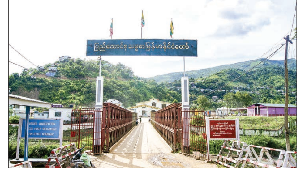
Indo-Myanmar Friendship Gate in Reedhorda Town, northern Chin State.

The value of trade between India and Myanmar totalled US$159.16 million