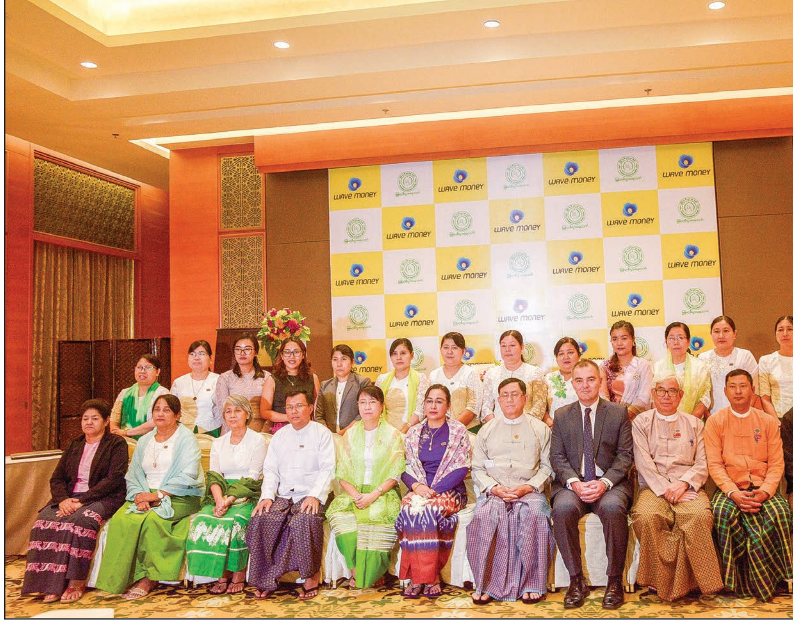
Wave Money and Myanma Economic Bank Partnership MoU Signing Ceremony.

inclusion to a new level, enabling government retirees in Myanmar to easily and securely access their pension through from more than 45,000 Wave Shops around the country, any day of the week.