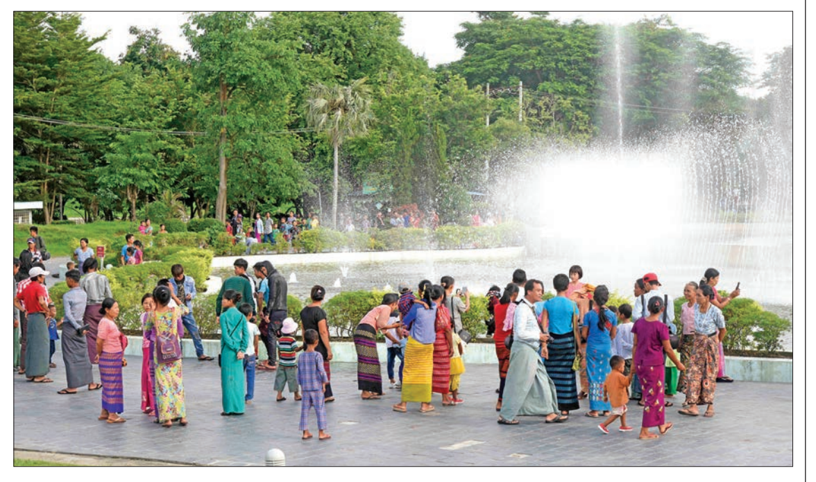
People visit water fountain in Nay Pyi Taw on the fullmoon day of Waso yesterday.

Pagodas and recreation sites in Nay Pyi Taw attracted the people on the holiday of the Full Moon Day of Waso.