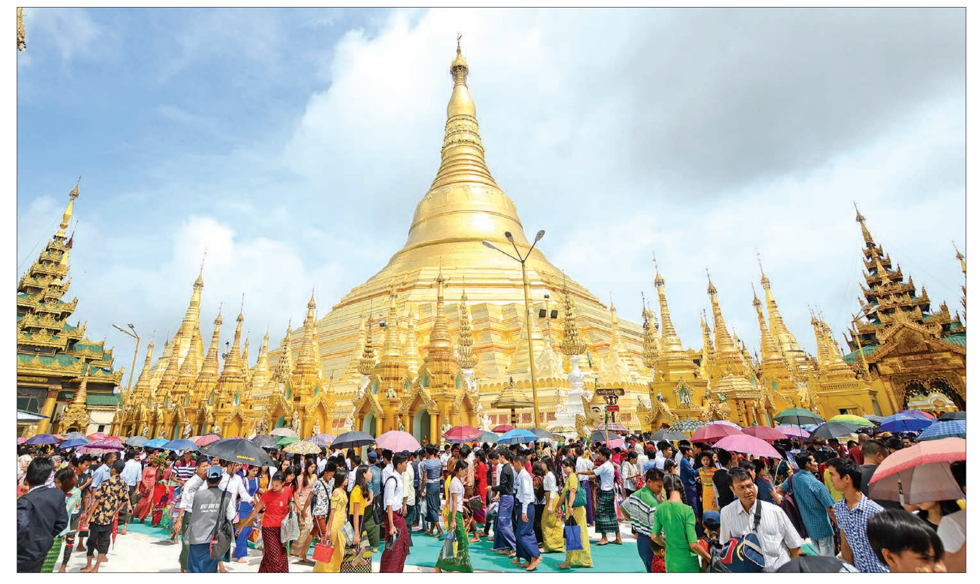
The Shwedagon Pagoda is crowded with Buddhist devotees on the Fullmoon of Waso in Yangon yesterday.

THE beginning of Waso, the L three-month Buddhist Rains Retreat, was celebrated along with the Dhammacakka Day, the Fullmoon of Waso, in pagodas across Myanmar yesterday, with