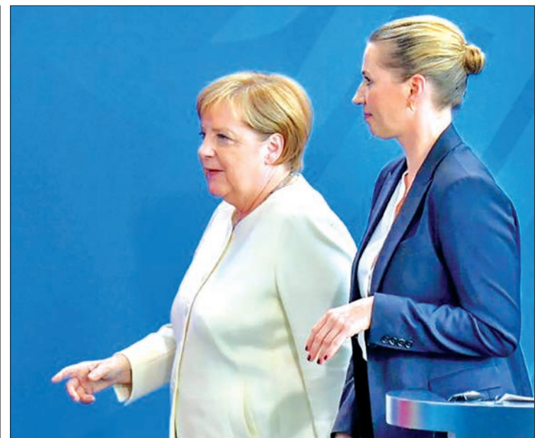
German Chancellor Angela Merkel and Denmark's Prime Minister Mette Frederiksen gave a joint news conference.

“Let them state their purpose and I will review it,” he said. When then UN rights chief Zeid Ra’ad Al Hussein raised concern about the drug war in 2016, Duterte called him an “idiot” and a “son of a bitch”. —AFP ■