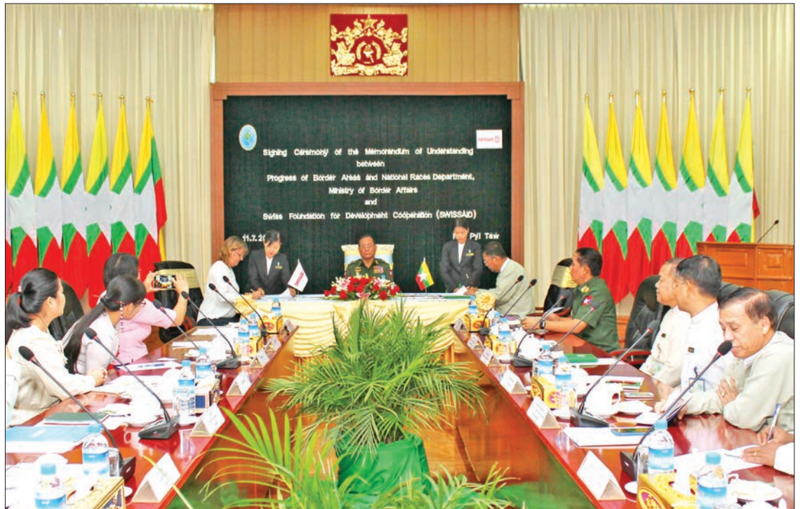
Union Minister Lt-Gen Ye Aung attends the MoU signing ceremony between Ministry of Border Affairs and SWISSAID in Nay Pyi Taw.

Officials from Ministry of Border Affairs will also be in cooperation to successfully implement the projects.