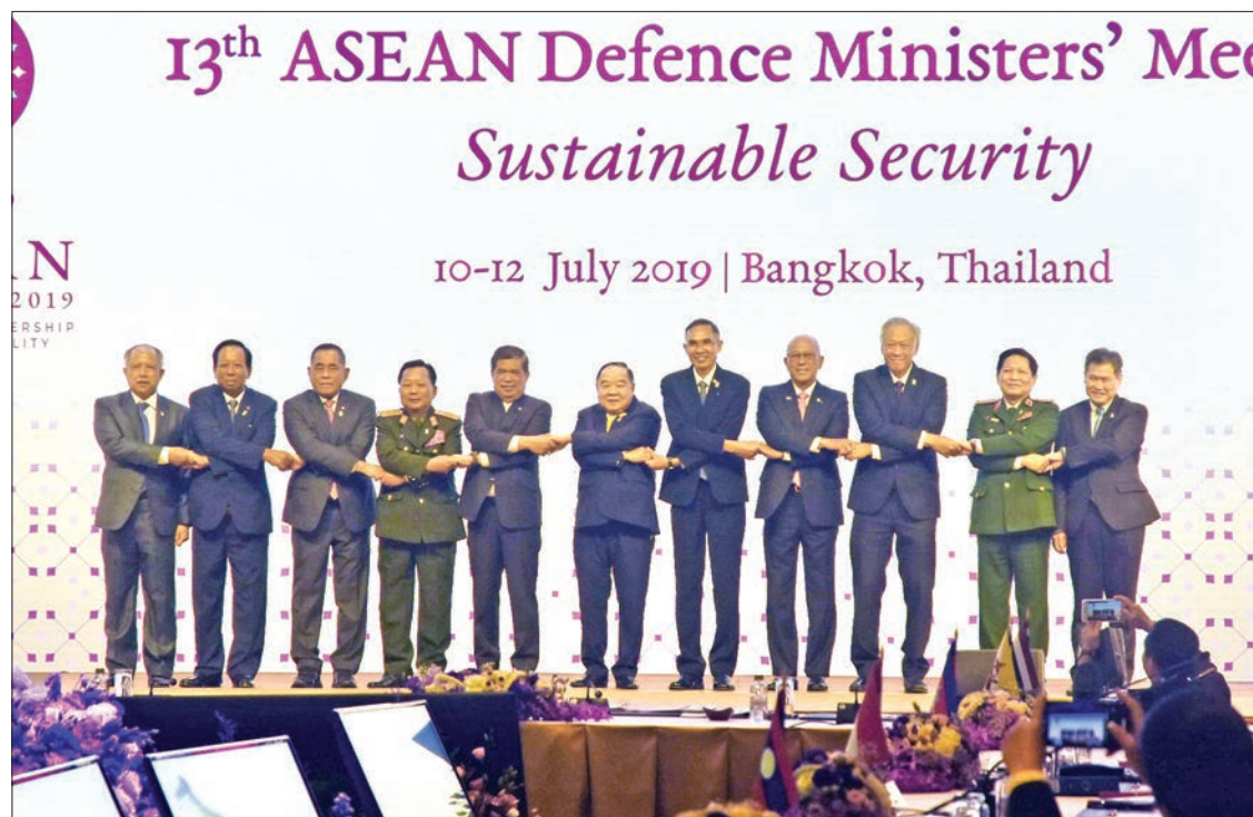
Defence ministers from the Association of Southeast Asian Nations.

The ministers also reaffirmed the importance of seeking a peaceful resolution of disputes in accordance with international law and avoiding actions that could further complicate the situation in the South China Sea.