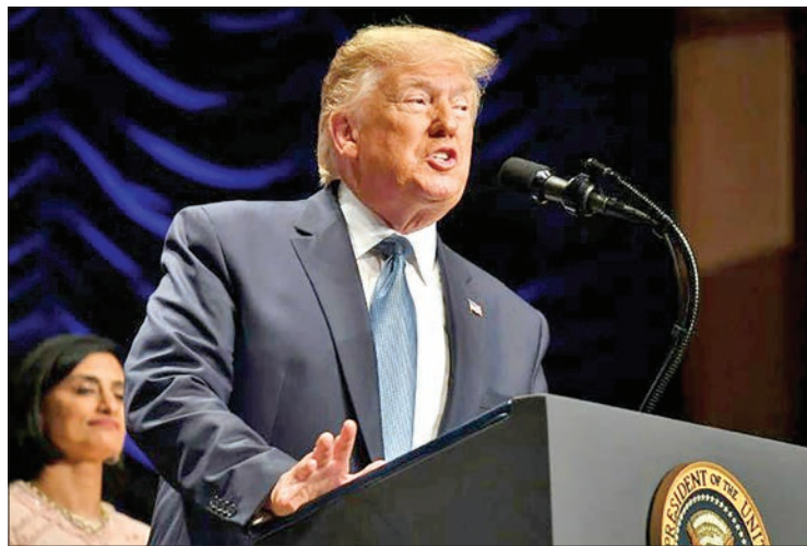
US President Donald Trump is escalating his attacks on social media, alleging bias and discrimination as he gathered with critics of Big Tech at a White House 'summit'.

The comments stoked fears that the White House may seek