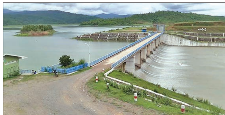
Aerial view of Yazagyo Dam.

THE Yazagyo Dam, which received reduced water supply from the Nerinjara River this