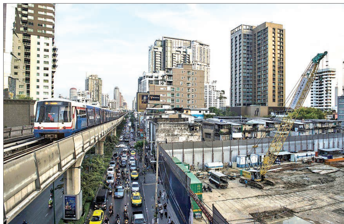
Bangkok's elevated transit system, the BTS Skytrain.

The BTS skytrain fare from Bang Wa station in the Thonburi side of Bangkok to KhuKot station would be in a maximum of 65 baht (about 2.10 US dollars), he said.—Xinhua