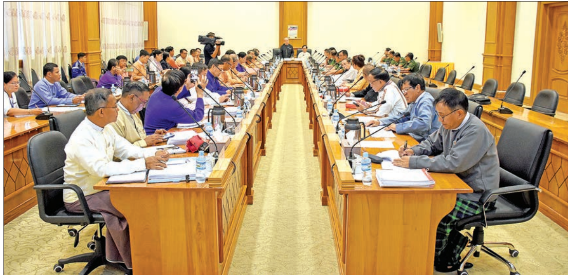
Meeting 24/2019 of the Joint Committee on amending the 2008 Constitution held in Nay Pyi Taw yesterday.

JOINT Committee on Amending the 2008 Constitution held its meeting 24/2019 at the second-floor meeting hall of Pyidaungsu Hluttaw Building D in Nay Pyi Taw yesterday.