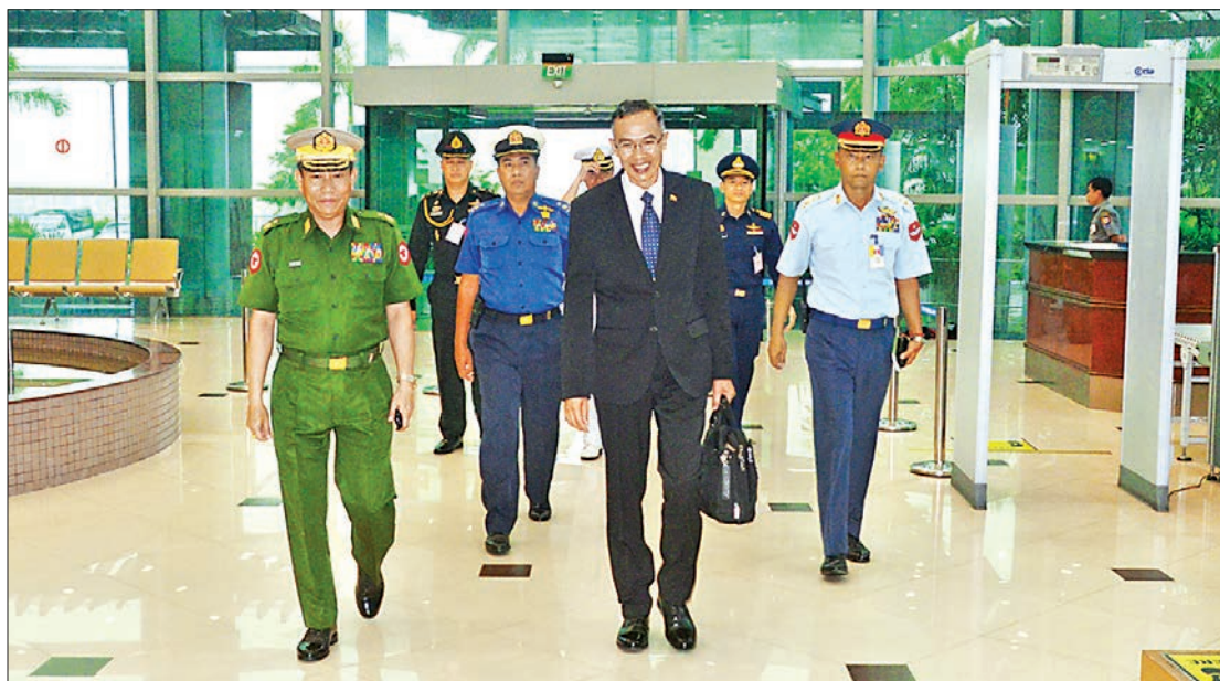
Union Minister Lt-Gen Sein Win is seen off by officials at Yangon International Airport on Wednesday as he departs for Bangkok, Thailand.

UNION Minister for Defence Lt-Gen Sein Win and party on Wednesday left from the Yan-