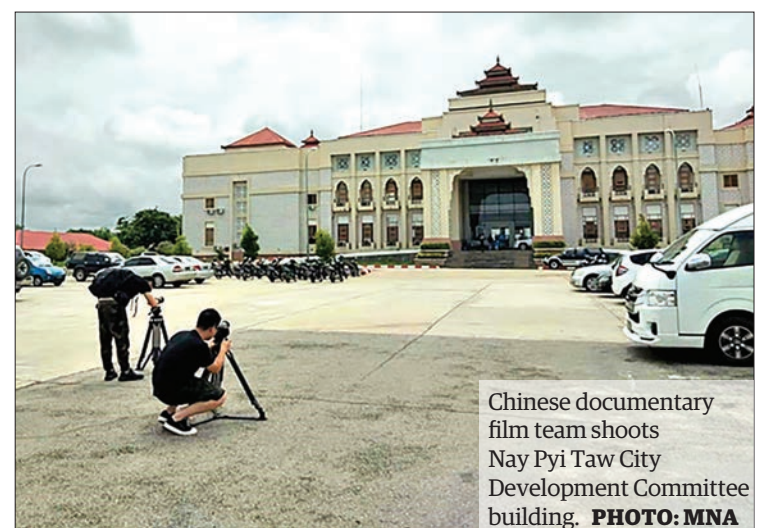
Chinese documentary film team shoots Nay Pyi Taw City Development Committee building.