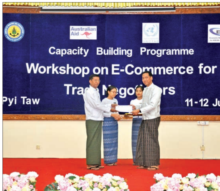
Deputy Minister for Transportation and Communications U Thar Oo presents Letter of acknowledgement to participants at the workshop on E-commerce for Trade Negotiators in Nay Pyi Taw.

Ministry of Transport and Communications aims at developing digital economy. With this aim, they are taking charge of the Regional Comprehensive Economic Partnership(RCEP) and ASEAN Coordinating Committee on E-commerce (AC-CEC). In Myanmar, they are working with Digital Economic Development Committee.