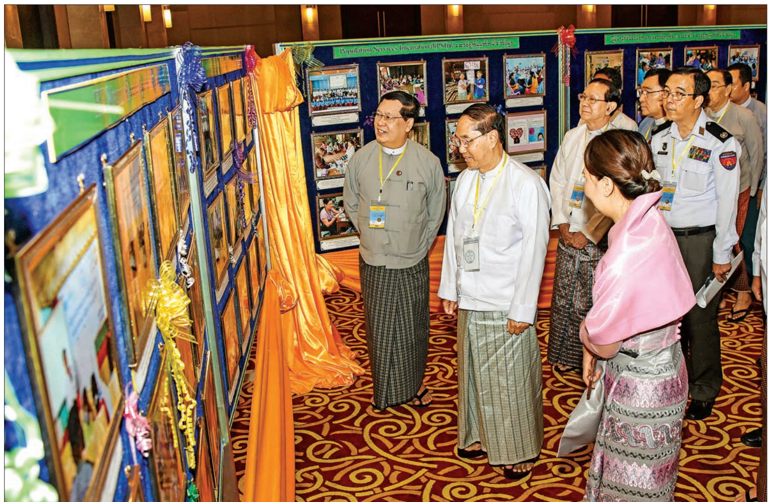
Vice President U Myint Swe looks at documentary photos displayed at the World Population Day Exhibition in Nay Pyi Taw yesterday.

World population Day events were held annually in every country of the world in order that each country and the entire world became aware