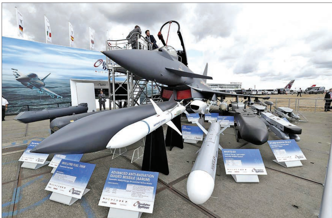
The UK's Eurofighter Typhoon military has parts made in Germany.

Only two weeks ago, the German government had set itself stricter rules for the approval of arms exports. The new rules prohibit the sale of small arms to countries outside the EU and NATO.—Xinhua ■