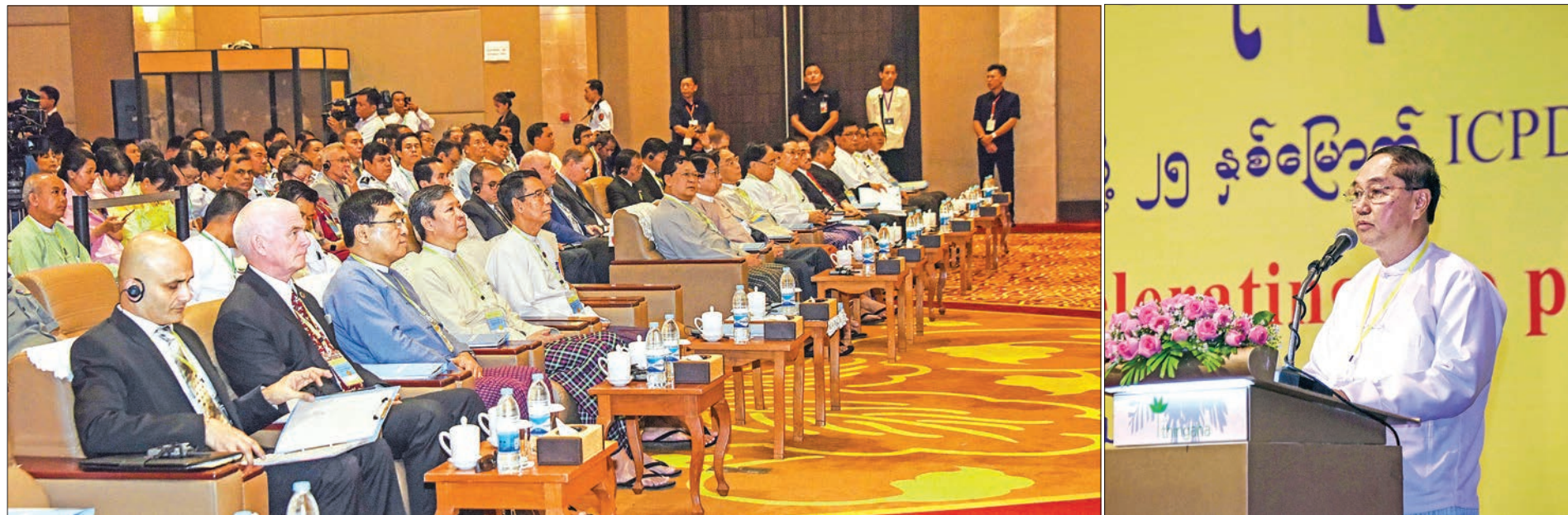
Vice President U Myint Swe delivers the opening speech at World Population Day 2019 event in Nay Pyi Taw yesterday.