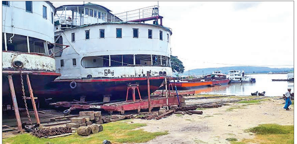
Vessels docking to repair at Mandalay Yadanarbon Dockyard.

From January to September, 2019, the Yadanarbon Dockyard