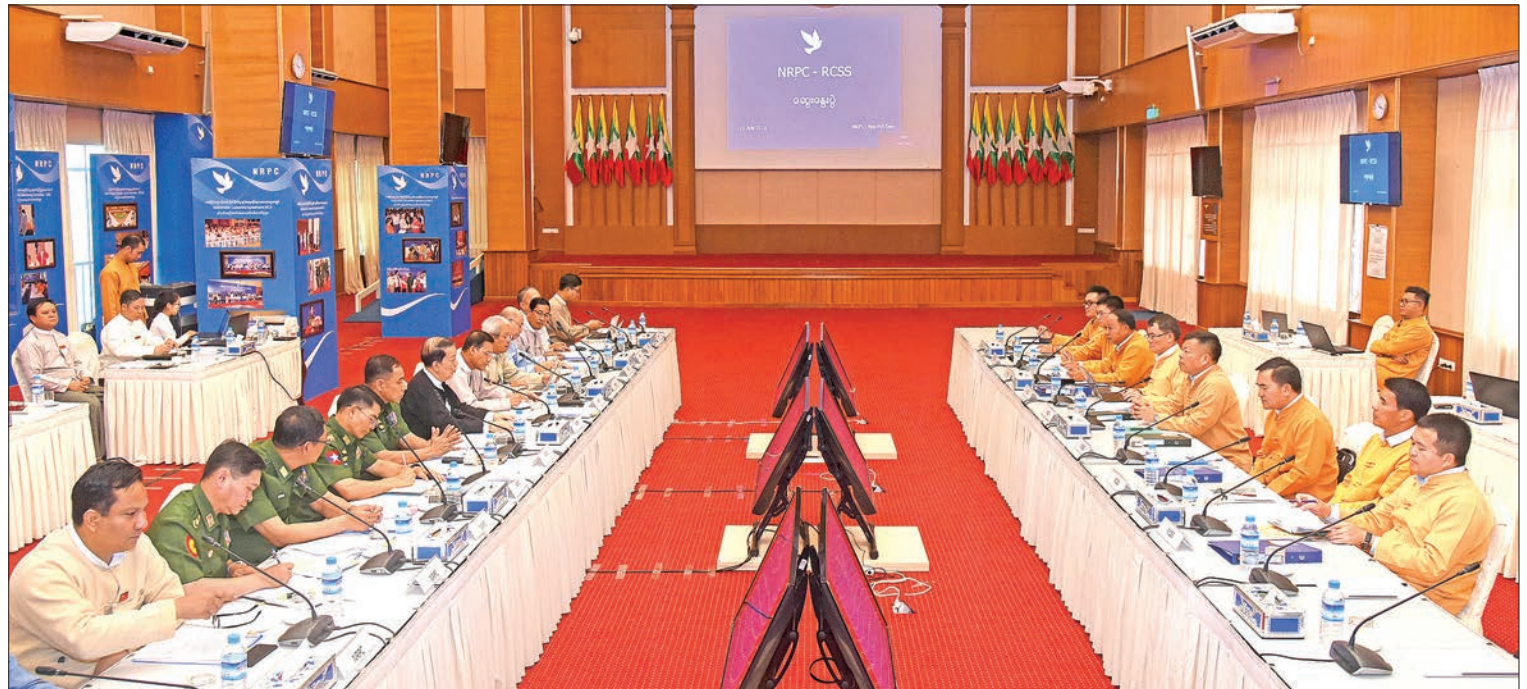
National Reconciliation and Peace Center (NRPC) delegation holds the meeting with Restoration Council of Shan State (RCSS) representatives in Nay Pyi Taw yesterday.

He said they would also discuss RCSS and the government's cooperation, the entire peace process and individual organization affairs, hence making this meeting very important. He urged everyone to offer their honest suggestions and opinions to find solutions to the issues presented