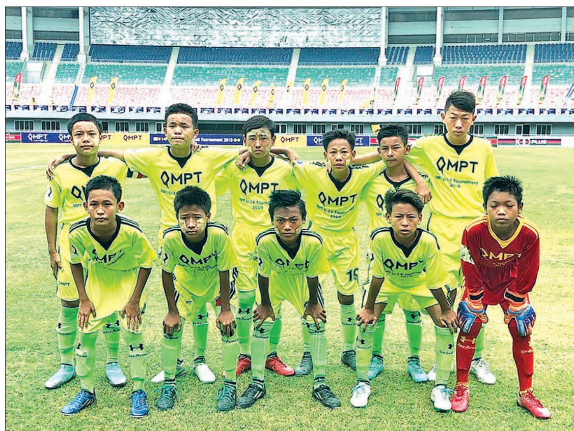
The Mandalay Youth Football Team (B) pose for a group photo before their semi-final match against the Social Welfare Youth Football Team yesterday at the Mandalay Thiri Stadium in Mandalay.