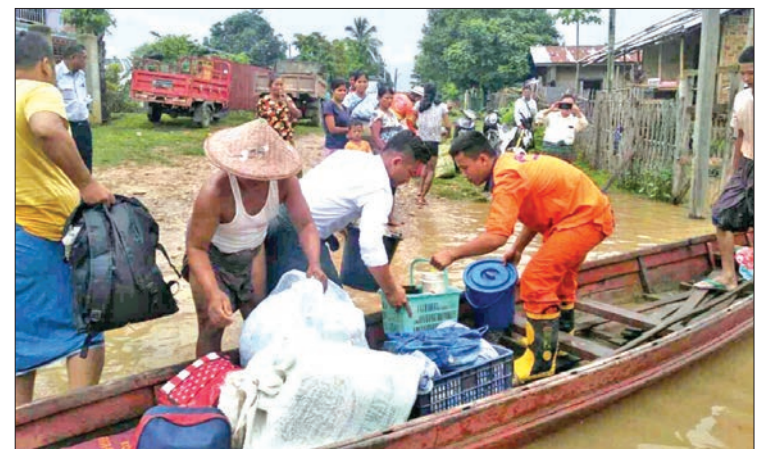
Firemen using a boat to help residents cross a flooded area.