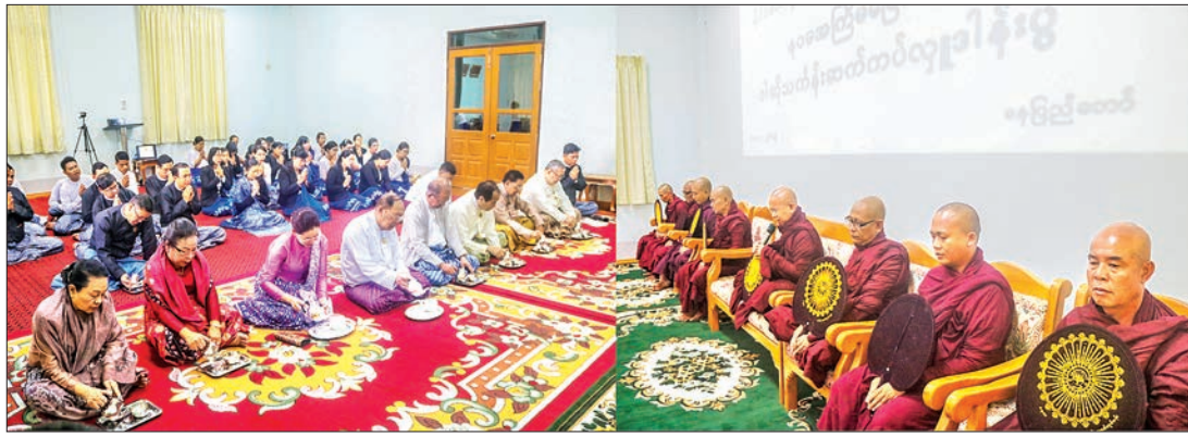
The ninth Waso robes offering ceremony of Constitutional Tribunal of the Union is in progress at the Constitutional Tribunal of Union Office in Nay Pyi Taw yesterday.

CONSTITUTIONAL Tribunal of the Union offered Waso robes to members of Sangha yesterday at the office No.54 in Nay Pyi Taw.