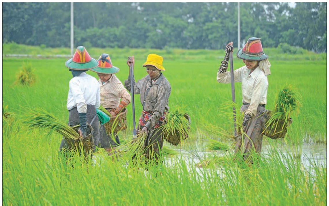
Farmers plant rice seedlings in a paddy field on the outskirts of Yangon.