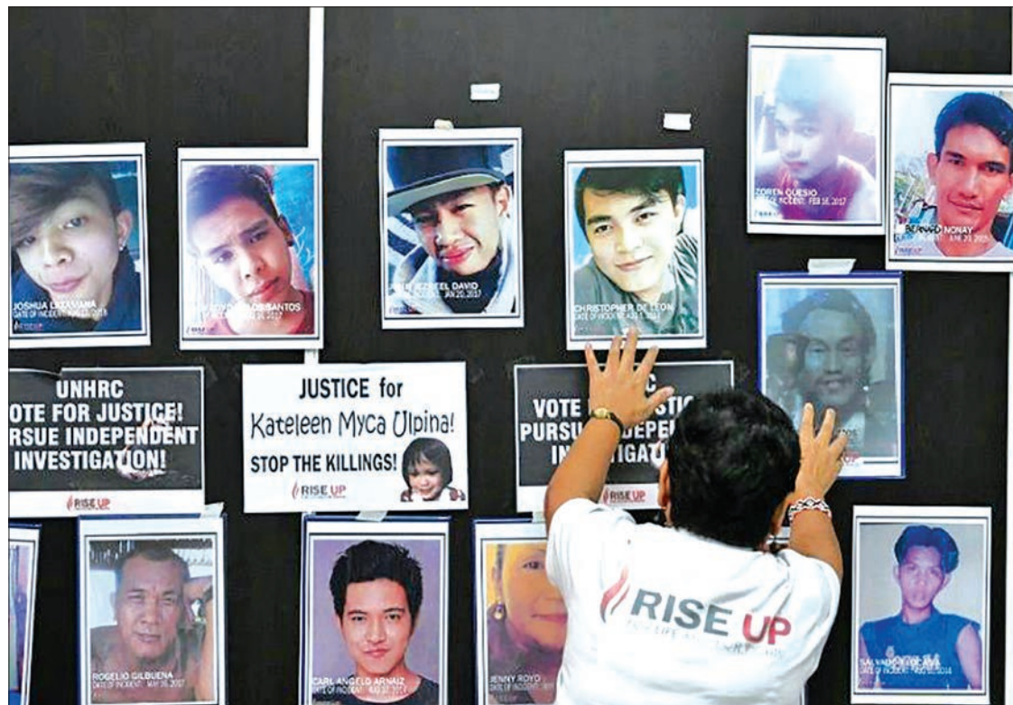
The so-called drug war launched three years ago in the Philippines has unleashed a surge of bloodshed.

Just over an hour later, she attended a press conference as planned and told journalists that her health was no cause for concern.—AFP ■