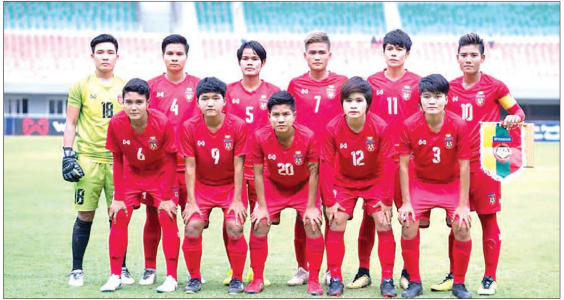
Myanmar women's national football team seen at an international football match.