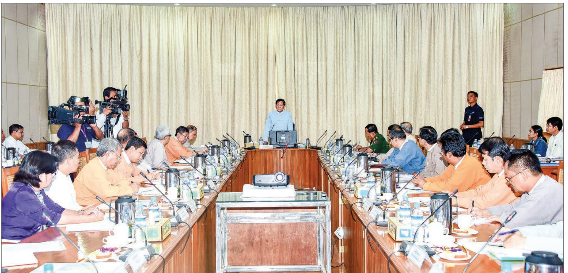
Vice President U Henry Van Thio delivers the speech at the National Water Resources Committee coordination meeting 2/2019 at the Presidential Palace in Nay Pyi Taw yesterday.

V ICE President U Henry Van Thio, who is the Chairman of the National Water Resources Committee (NWRC) attended and addressed the NWRC coordination meeting 2/2019 held at the Presidential Palace meeting hall, Nay Pyi Taw yesterday afternoon.