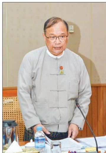
Union Minister U Thant Sin Maung.

On the other hand, such projects and studies also need to be truly effective and beneficial to our country and the majority of