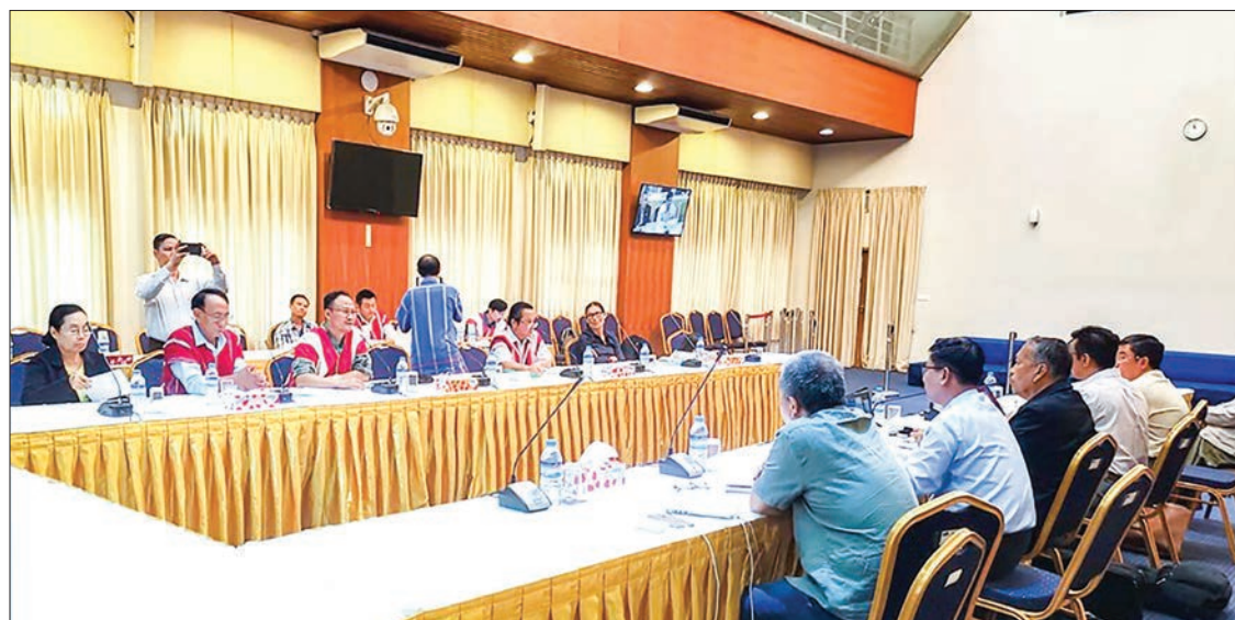
A meeting between the National Reconciliation and Peace Center (NRPC) and Karen National Union (KNU) convenes in Yangon yesterday.