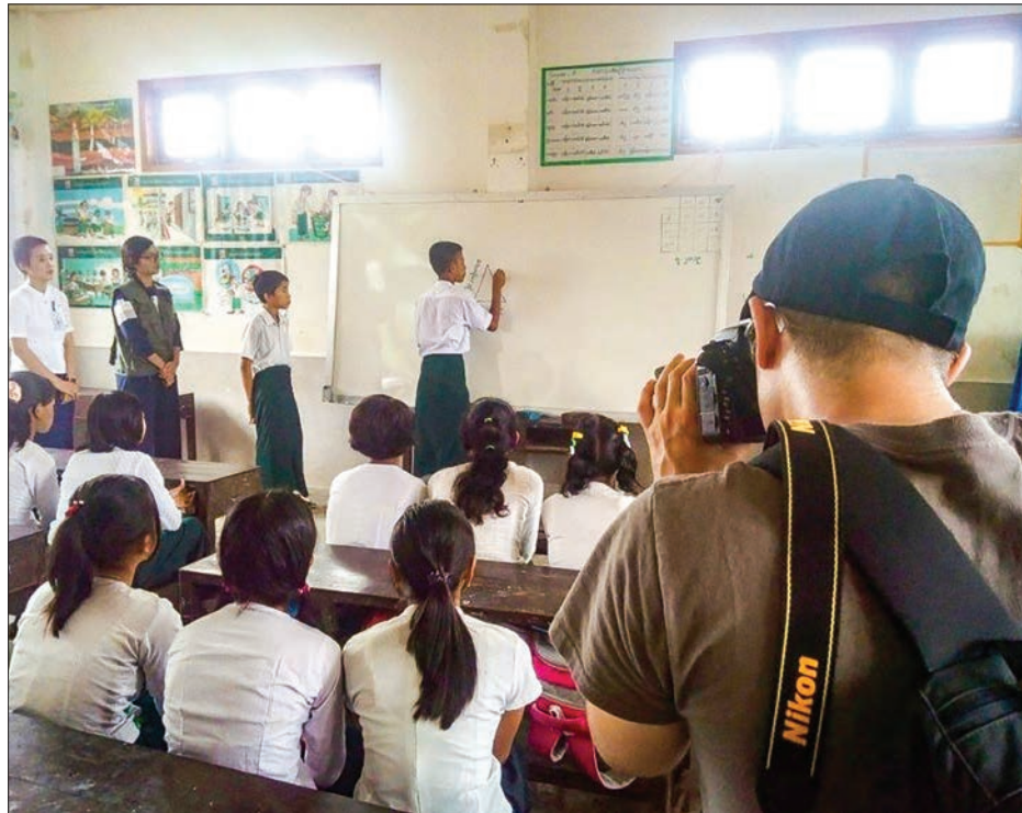
Film team shooting at basic education middle school in Seainlaygone village in Daydaye.

and at the Basic Education High Schools 1 and 2 in Bahan Township. — MNA (Translated by GNLM)