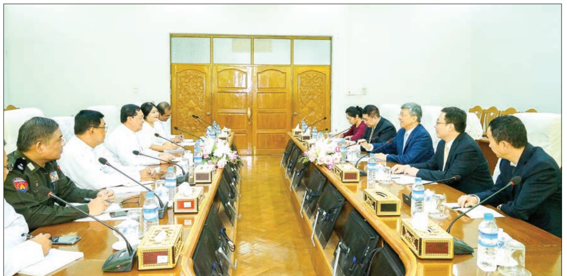
Union Minister U Thein Swe holds talks with Chinese Ambassador Mr Chen Hai at the office of the Ministry of Labour, Immigration and Population in Nay Pyi Taw yesterday.