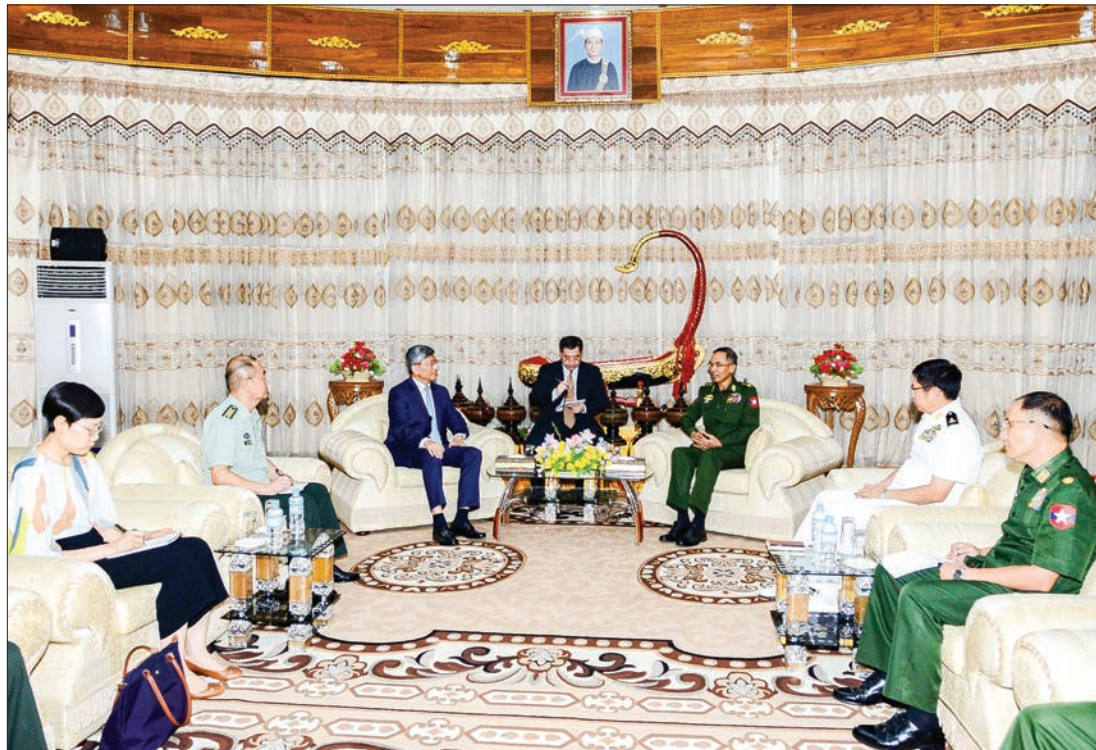
Union Minister for Defence Lt-Gen Sein Win meets with Chinese Ambassador Mr Chen Hai in Nay Pyi Taw yesterday.

UNION Minister for Defence Lt-Gen Sein Win received People's Republic of China (PRC) Ambassador Mr Chen Hai at Ministry of Defence Union