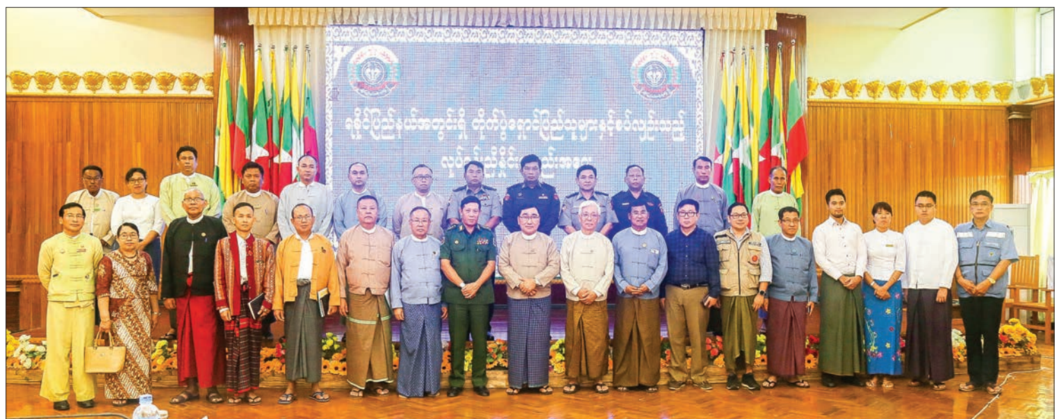
Union Minister Dr Win Myat Aye, Rakhine State Government officials and attendees pose for the photo at the coordination meeting on IDP camps and resettlements in Rakhine State yesterday.

Then, ministers of Rakhine State Government detailed