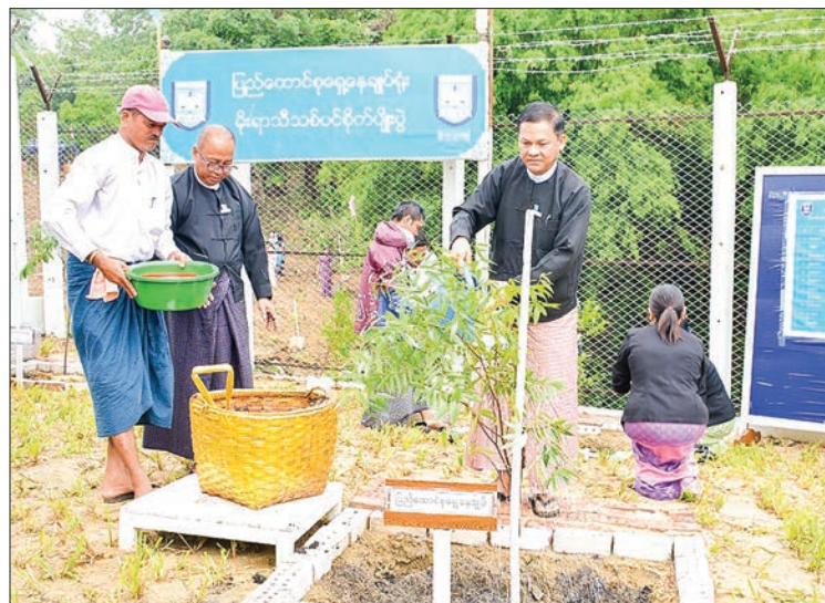
Union Attorney-General U Tun Tun Oo plants a tree at the monsoon planting event at the Union Attorney-General's Office in Nay Pyi Taw.

Office of the Union Attorney-General planted trees and released fish larvae into a reservoir yesterday at the monsoon tree planting event at the surrounding the office in Nay Pyi Taw.