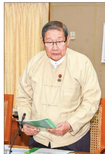
Union Minister U Soe Win.

our people. Cost and benefit need to be reviewed. Data and information on water is required to be systematically shared among ministries and departments.