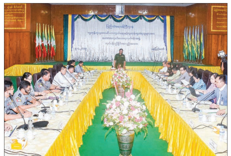
Deputy Minister for Home Affairs Major-General Aung Thu delivers the opening speech at the meeting in Nay Pyi Taw yesterday.

Police Maj-Gen of MPF Myo Swe Win also explained