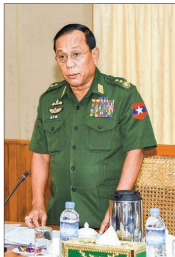
Union Minister Lt-Gen Ye Aung.