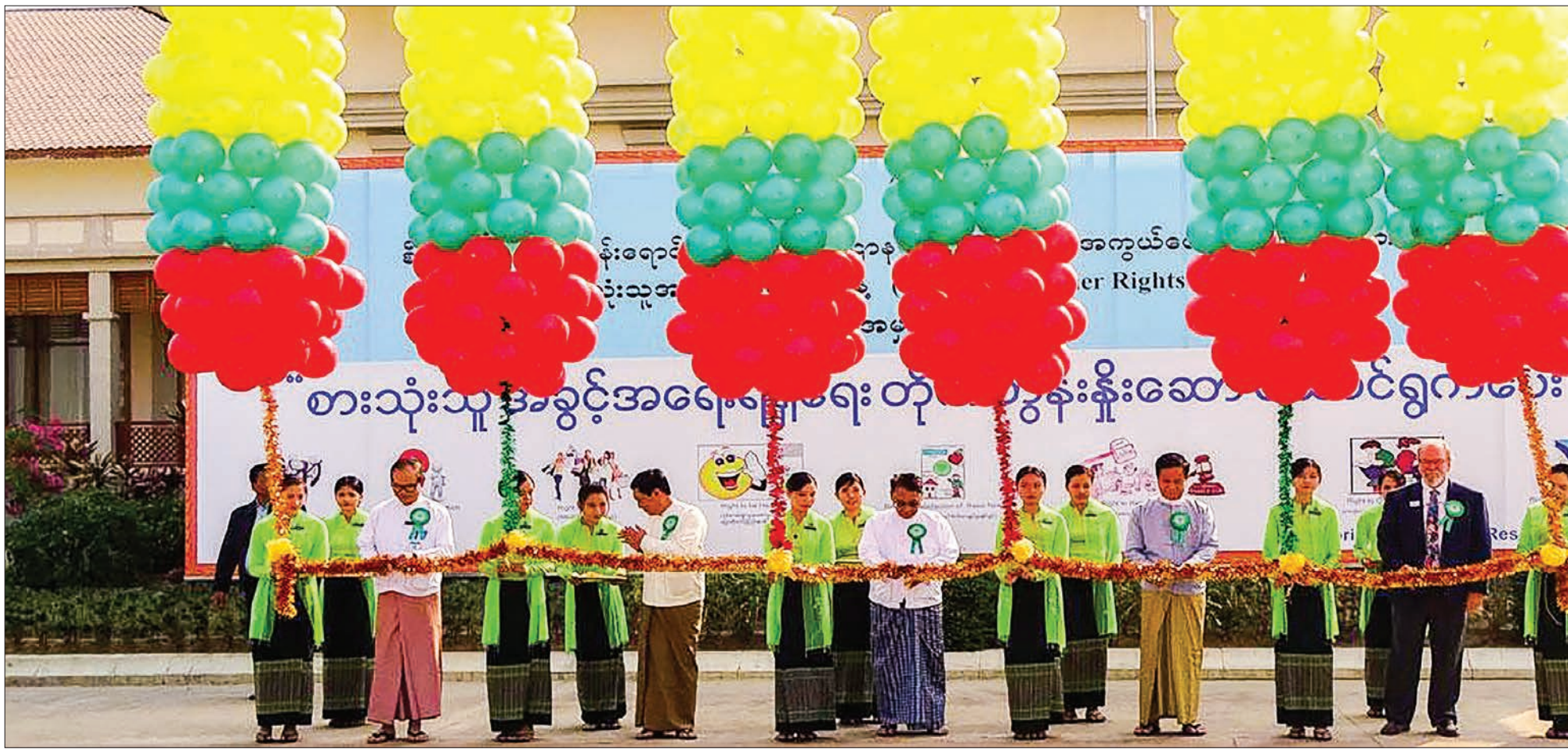
Opening ceremony of World Consumer Rights Day (2018) in progress.