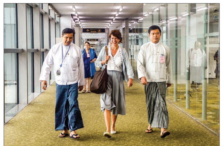
United Nations Secretary General's Special Envoy on Myanmar Ms Christine Schraner Burgener arrives at Yangon International Airport.

Officials from the Ministry of Foreign Affairs and the office of the Special Envoy of the United Nations Secretary General in Myanmar welcomed the UNSG's Special Envoy at the Yangon International Airport. — MNA