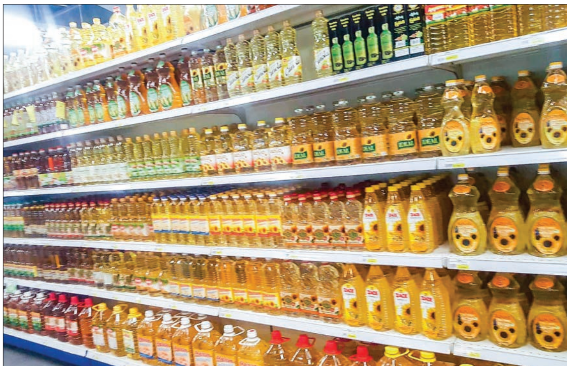
Bottles of edible oil displaying on the Stand in a super market.

8. Low quality and sub-standard electrical products causing fire and electrical shocks resulting in injury, loss of life and