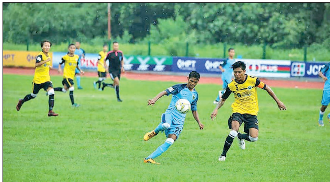
University F. C. footballer (blue) and Chin United player (yellow) vie for the ball in the match at the University Stadium on 9 July 2019.