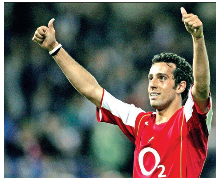
Former midfielder Edu has returned to Arsenal as the club's new technical director.