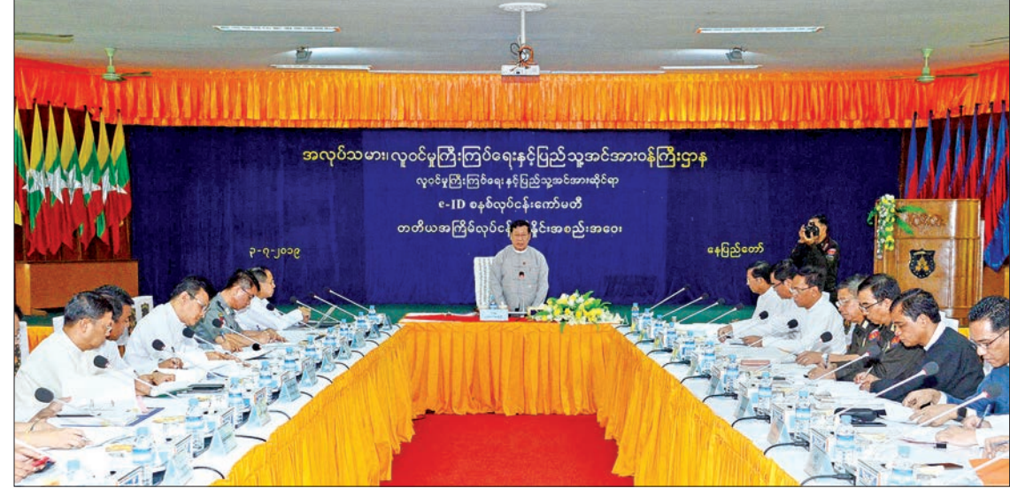
Union Minister U Thein Swe delivers the speech at the third coordination meeting of e-ID System Work Committee in Nay Pyi Taw.

THE third coordination meeting of e-ID System Implementation Committee was held yesterday morning in the meeting hall of the Ministry of Labour, Immigration and Population in Nay Pyi Taw.