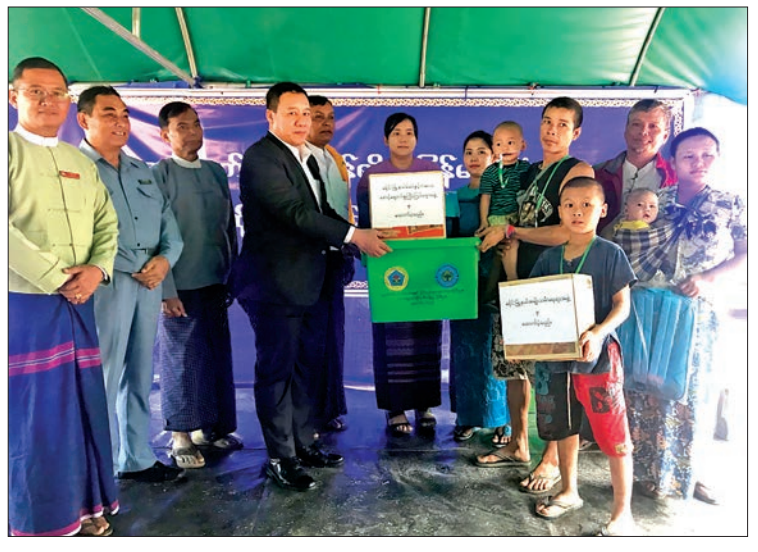
Myanmar officials hand over aids to Myanmar nationals from Thailand at Kyauk Lone Gyi camp in Myawady Township.

Through the bilateral arrangement between the Governments of the Republic of the Union of Myanmar and the Kingdom of Thailand, the fourth batch of (310) verified Myanmar nationals from Thailand were well received at the Myanmar-Thai border gates from 1 to 3 July 2019.—MNA