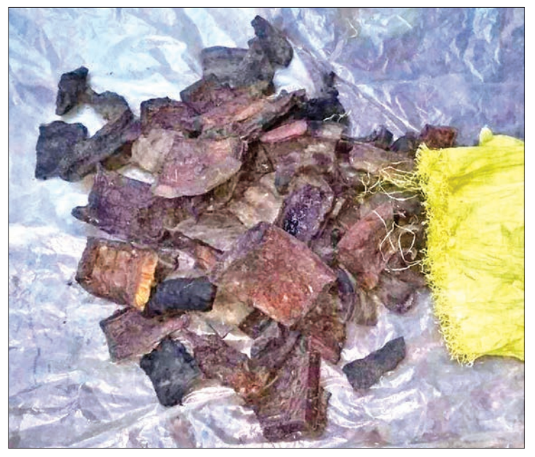
Photo shows the pieces of elephant skin seized in Yekyi Township.

Investigations are on to identify the owner of the illegal elephant skins.