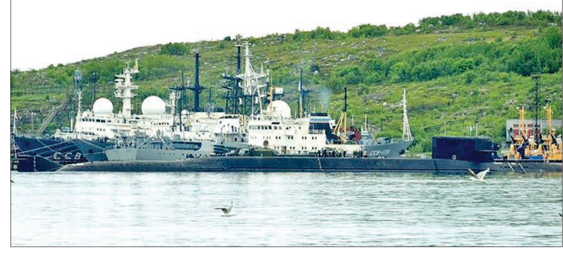
An unidentified submarine seen in the city of Severomorsk, in Russia, on 2 July.

the 14 crew were killed by inhaling poisonous fumes after a fire broke out on a "scientific research deep-sea submersible" studying the sea floor.