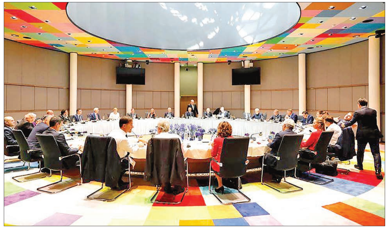
EU leaders attend the special summit of the European Council in Brussels, Belgium, on July 2, 2019. The European Union leaders on Tuesday agreed on the future leadership of the EU institutions, proposing Ursula von der Leyen, the female German Defense Minister, to be the next European Commission President. Charles Michel, the Prime Minister of Belgium, was elected to be the next President of the European Council. Christine Lagarde, the managing director of the International Monetary Fund, was nominated to be President of the European Central Bank. JosepBorrellFontelles, the Foreign Minister of Spain, was nominated to be the EU's foreign policy chief. Except Michel, other candidates would have to go through formalities to get on the job.

BRUSSELS — The European Union leaders on Tuesday agreed on the future leadership of the EU institutions, proposing Ursula von der Leyen, the female German Defense Minister, to be the next European Commission President.