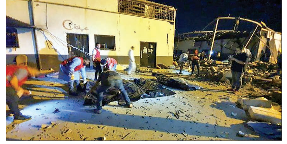
Emergency workers recover bodies after an air strike killed nearly 40 at Tajoura detention centre.

The five hangars in Tajoura held around 600 migrants and refugees, he said.