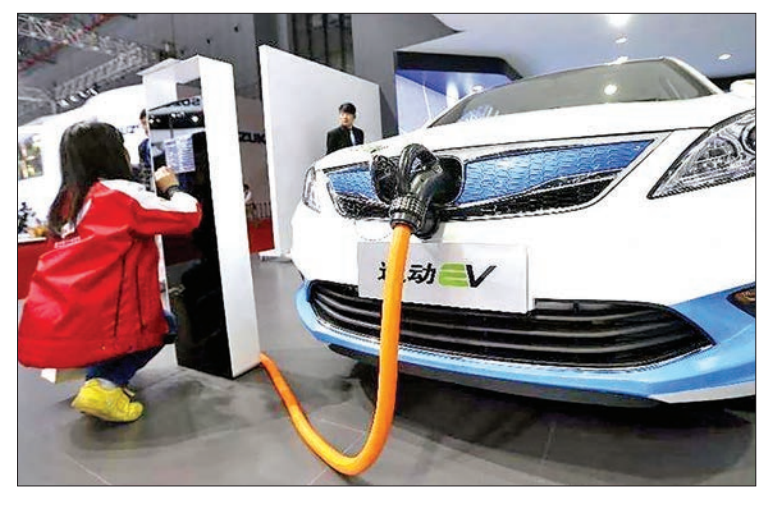
This 22 April, 2015 photo shows a new energy vehicle displayed at Shanghai Auto Show in Shanghai, East China.

Boao, southern China's island province of Hainan, Tuesday. To be concluded on