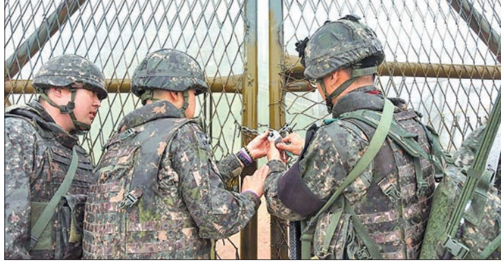
South Korean soldiers are locking a military gate as they withdraw from a border guard post in the DMZ © South Korean Defence Ministry. PHOTO: AFP