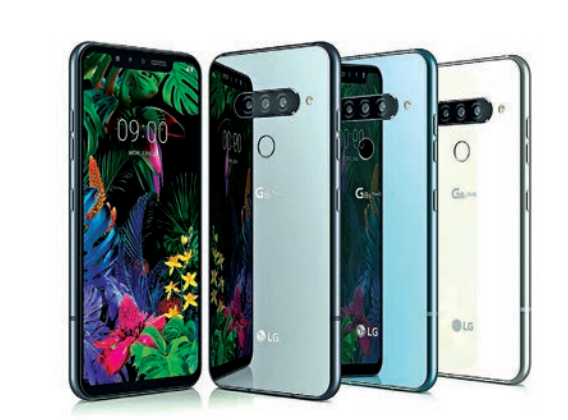
The LG G8 S should be arriving in Europe during Summer 2019. PHOTO: AFP

tion," this touchless interface allows users to undertake many actions without having to touch the screen. The idea is to be able to answer a call, take a photo, or adjust playback volume on a favorite playlist with a simple movement.— AFP