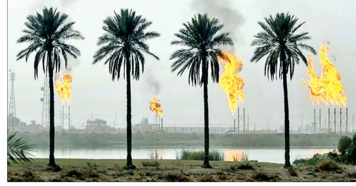
The US insists Iraq wean itself off Iranian energy, but Baghdad has said that could take up to four years.

The US embassy in Baghdad declined to comment, while Iran's embassy did not respond to an AFP request.—AFP