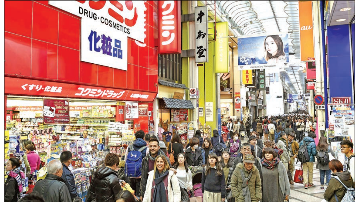
Osaka's Shinsaibashi commercial and entertainment district.

Last October, it purchased a hotel and two office buildings in the heart of the city for 5.46 billion yen ($50.5 million) and subsequently another three of-