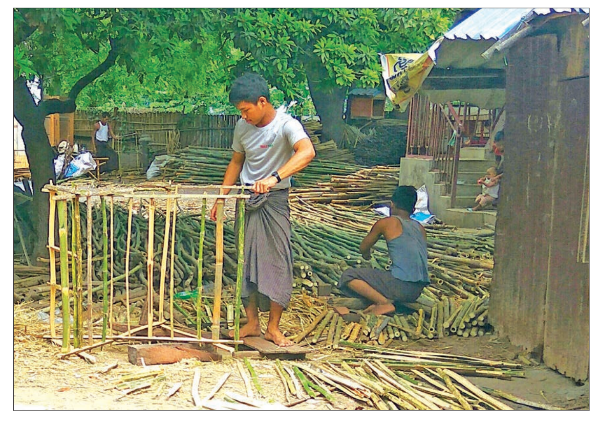
Weavers making bamboo products in Ohn Chaw Village. (Translated by La Wonn)

Bamboo chair sales are mostly the highest in the summer season, compared to the rainy and winter seasons. Earlier, raw bamboo prices ranged between K150 and K700, depending on the kind of bamboo, but now the rate has increased to K300-K1,000. With raw bamboos becoming harder to find, the number of weavers making chairs from them is also declining, according to bamboo chair weavers.—Tinzar Hlaing (IPRD)