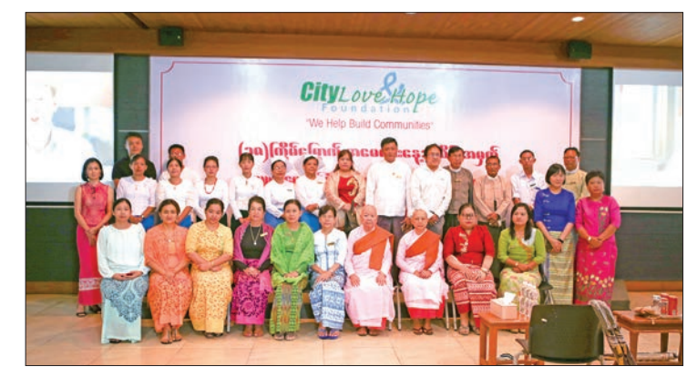
Attendees pose for the photo at the 18<sup>th</sup> cash and stationary donation ceremony to mark Mother's Day in Yangon.

City Mart Holding Co., Ltd established the City Love & Hope Foundation in February 2013 to implement Cooperate Social Responsibility (CSR).— GNLM