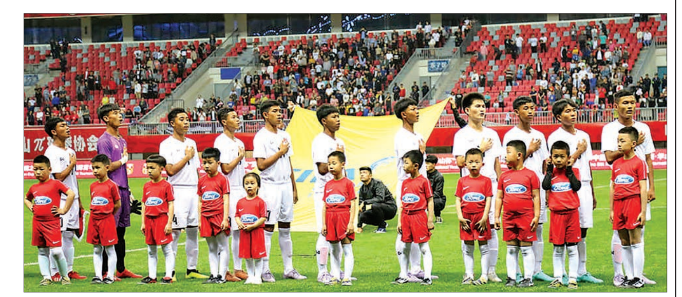
The Myanmar U-15 football squad sings the national anthem before a group match during the Hua Shan Cup International Youth Football Tournament in China on 6 April.

The Myanmar U-15 boys' football team will also compete in the 2019 AFF U-15 Boys' Championship this month in Thailand and the 2020 AFC U-16 Championship qualifiers in September.—Lynn Thit (Tgi)