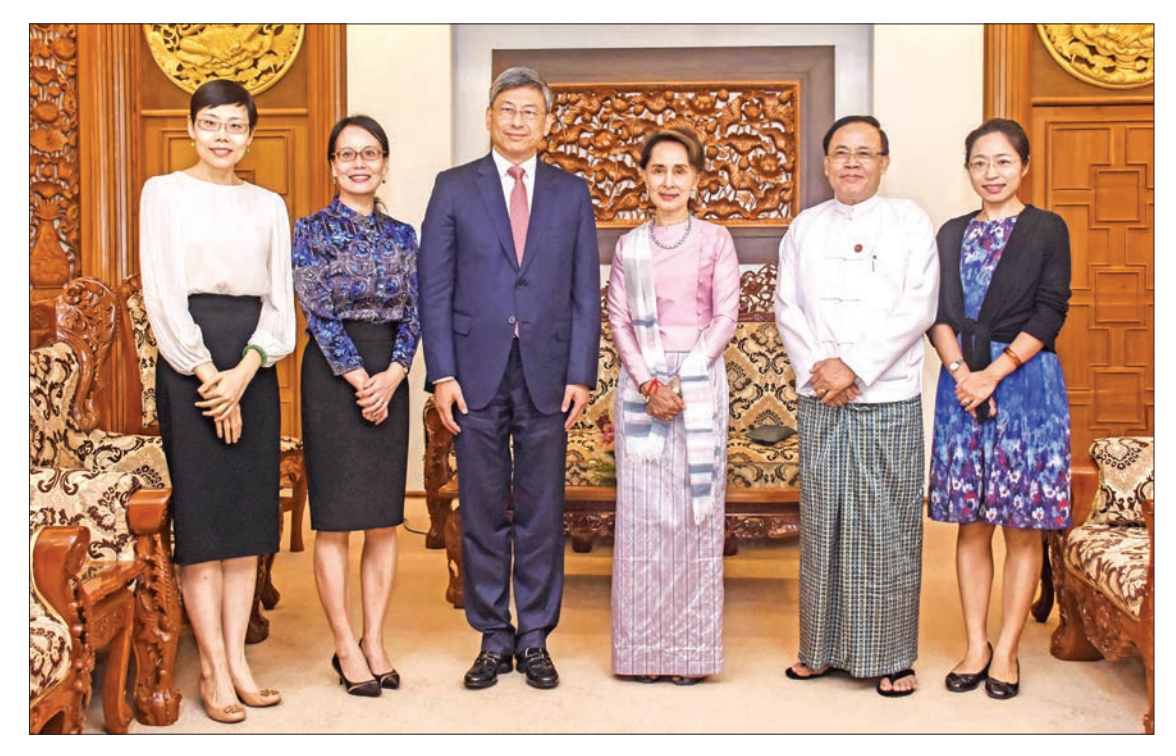
State Counsellor Daw Aung San Suu Kyi, Union Minister U Kyaw Tin, Chinese Ambassador Mr. Chen Hai and officials pose for a photo in Nay Pyi Taw yesterday.

bilateral relations and cooperation, increasing mutually beneficial cooperation under the Belt and Road Initiative, jointly holding the commemorative activities to celebrate the 70^{\text{th}} Anniversary of Myanmar-China diplomatic relations in 2020, China's continued constructive support in Myanmar government's endeavours to achieve peace and national reconciliation, and for the success of the repatriation and resettlement of displaced persons from Rakhine State.-MNA