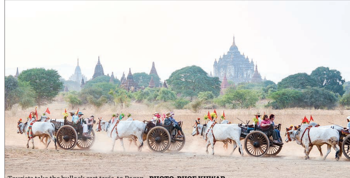
Tourists take the bullock cart taxis to Bagan.

gan for the World Heritage List in 1996 after the completion of an inventory of monuments and a zoning management plan with the support of UNESCO. Due to the high risk of inappropriate commercial development in the protected area, the requirements for inscription were not fulfilled initially. Myanmar authorities decided to try again more than 20 years later, within the framework of an overall renewed commitment towards the implementation of the 1972 World Heritage Convention. For the last six years, UNE-