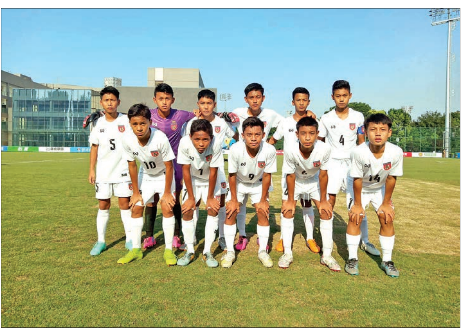
Myanmar U-14 squad seen at the International Youth Football Invitational Tournament in Wuhan, the People's Republic of China.

Myanmar team will again compete with the Group (B)'s fourth-place team.—MFF ( Translated by AH )