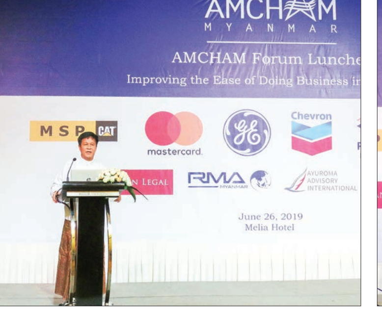
Keynote Speech by U Aung Htoo, Deputy Minister, Ministry of Commerce.

Among the attendees of the forum were U Soe Thein, Deputy Governor, Central Bank of Myanmar, Dr Ye Myint Swe, Deputy Union Minister, Ministry of Natural Resources and Environmental Conservation, U Aung Htoo, Deputy Minister,