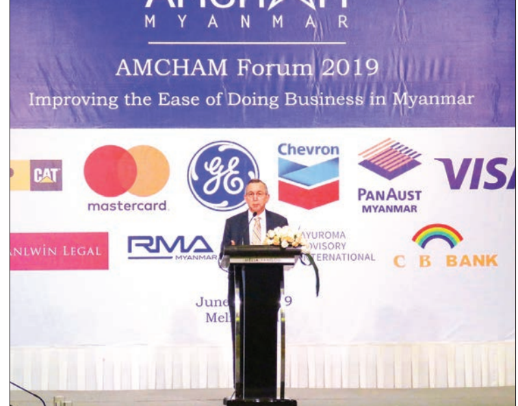
Opening Remarks by Mr Scot Marciel, US Ambassador to Myanmar.

Optimization of Processes AMCHAM Myanmar suggested ways to streamline procedures and implement clear standard operating procedures (SOPs) to make day-to-day transactions easier and more efficient. Specific recommendations that were discussed included establishing a one-stop