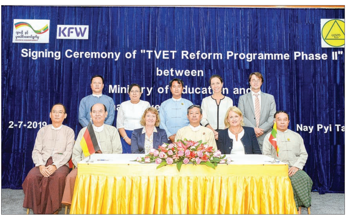
Union Minister Dr Myo Thein Gyi, members from German Development Bank (KfW) and attendees pose for the photograph at the signing ceremony between MoE and KfW in Nay Pyi Taw.