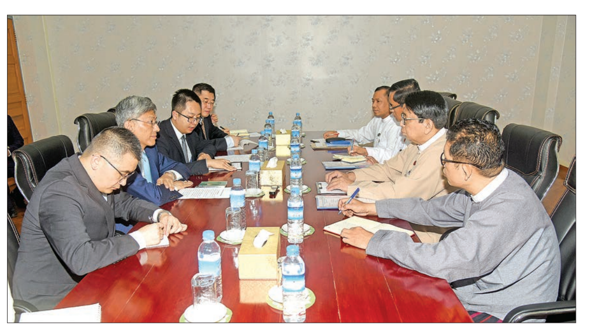
Union Minister for Information Dr Pe Myint holds talks with Chinese Ambassador Mr Chen Hai in Nay Pyi Taw.

Also present at the meeting were Deputy Minister U Aung Hla Tun and officials. — MNA ( Translated by Kyaw Zin Tun)