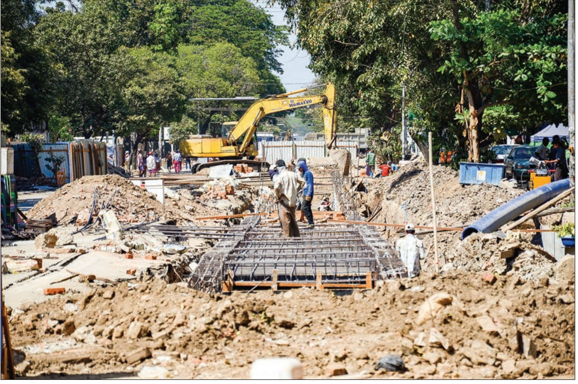
Workers seen at the upgrading of drainage system in Yangon.

"We need machines for flood management. Machine purchases were previously handled by YCDC's Engineering Department (Roads and Bridges). Now, the Yangon Mayor and our department