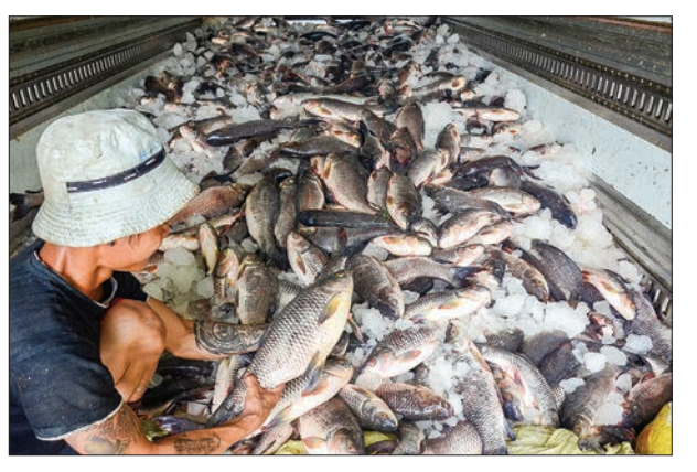
Fishery sector has attracted mainly local investment.

To simplify the verification process of investment projects, the Myanmar Investment Law allows the Regions and States Investment Committees to grant permissions to local and foreign proposals, where the initial investment does not exceed K6 billion, or $5 million.