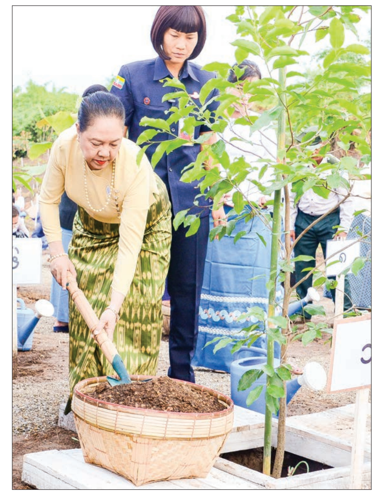
First Lady Daw Cho Cho plants a star flower tree to usher in Myanmar Women's Day in Nay Pyi Taw yesterday.