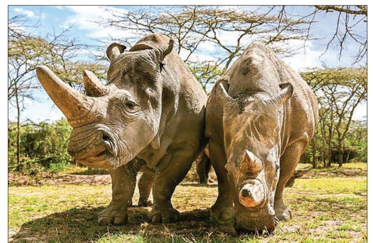
The sanctuary houses the world's last two northern white rhinos, Najin and her daughter Fatu, seen in their enclosure in the private conservancy of Ol-Pejeta in Nanyuki.

Tech advocates say advances in data collection and smart applications on game reserves could prove revolutionary, and upend decades-old approaches to conservation across the world.—AFP ■