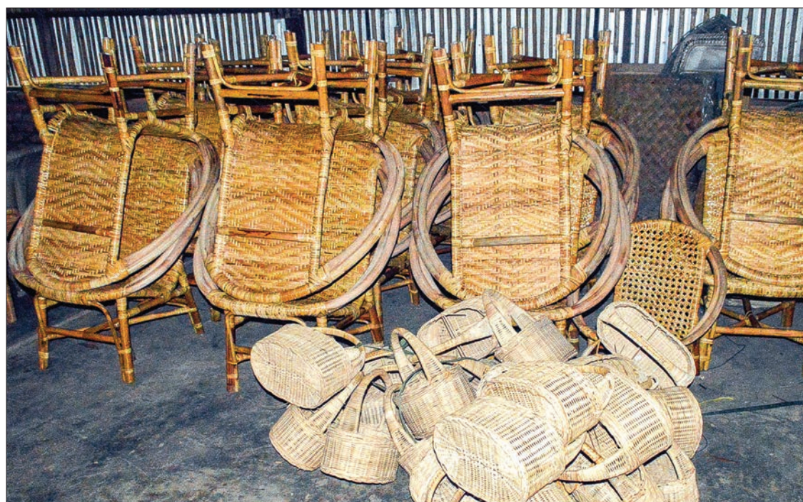
Rattan furniture and wares are seen at the Monsoon Village Rattan Furniture in Thanlyin.

Ans: I have two factories for framing and webbing. We have our raw materials and finished products stockpiled in the factories for the export market.