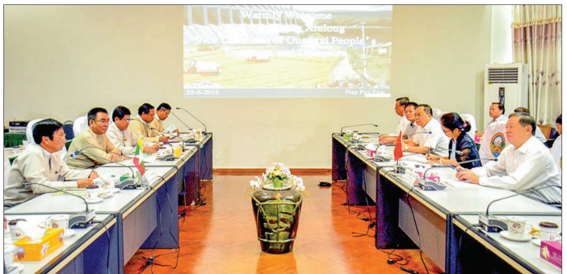
Officials of Myanmar and China hold the meeting over agriculture and livestock research and cementing friendship between Myanmar and Guangxi Zhuang Autonomous Region.