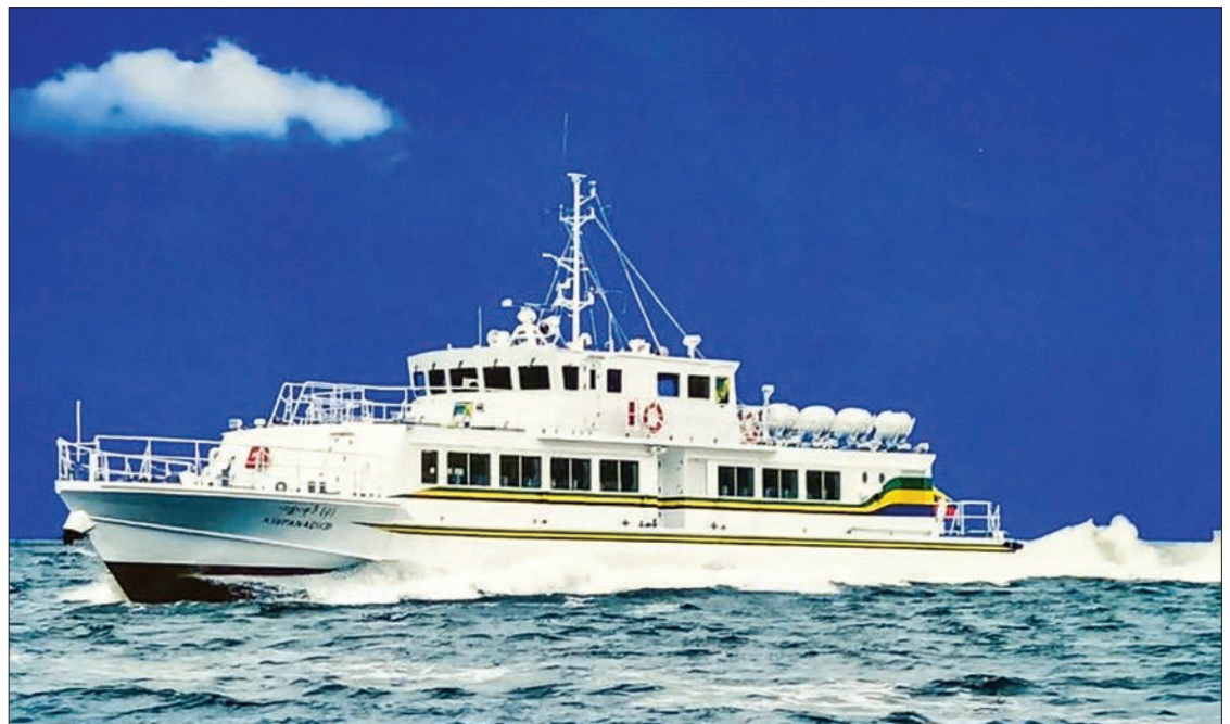
The ship named Kissapanadi-3 will operate between Sittway and Kyaukpyu along the coastal route in Rakhine State.

Kissapanadi-3 was built at a cost of 1 billion Japanese yen at the Sumidagawa Shipyard, under the Grand Aid for Economic and Social Development Programme 2016.