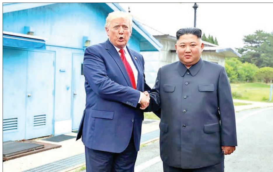
U.S. President Donald Trump meets with Kim Jong Un, top leader of the Democratic People's Republic of Korea (DPRK), in the inter-Korean border village of Panmunjom on June 30, 2019.

SEOUL —U.S. President Donald Trump held talks with North Korean leader Kim Jong Un on Sunday at the Demilitarized Zone dividing the two Koreas, where they agreed to restart denuclearization talks within weeks and invited each other to visit their capital cities. During the landmark trip to the DMZ, Trump became the first sitting U.S. president to set foot in North Korea. Trump indicated he will meet with Kim again, depending on the outcome of the working-level negotiations, raising hopes that the nuclear talks, which have been stalled following the rupture of their February summit, may move forward.