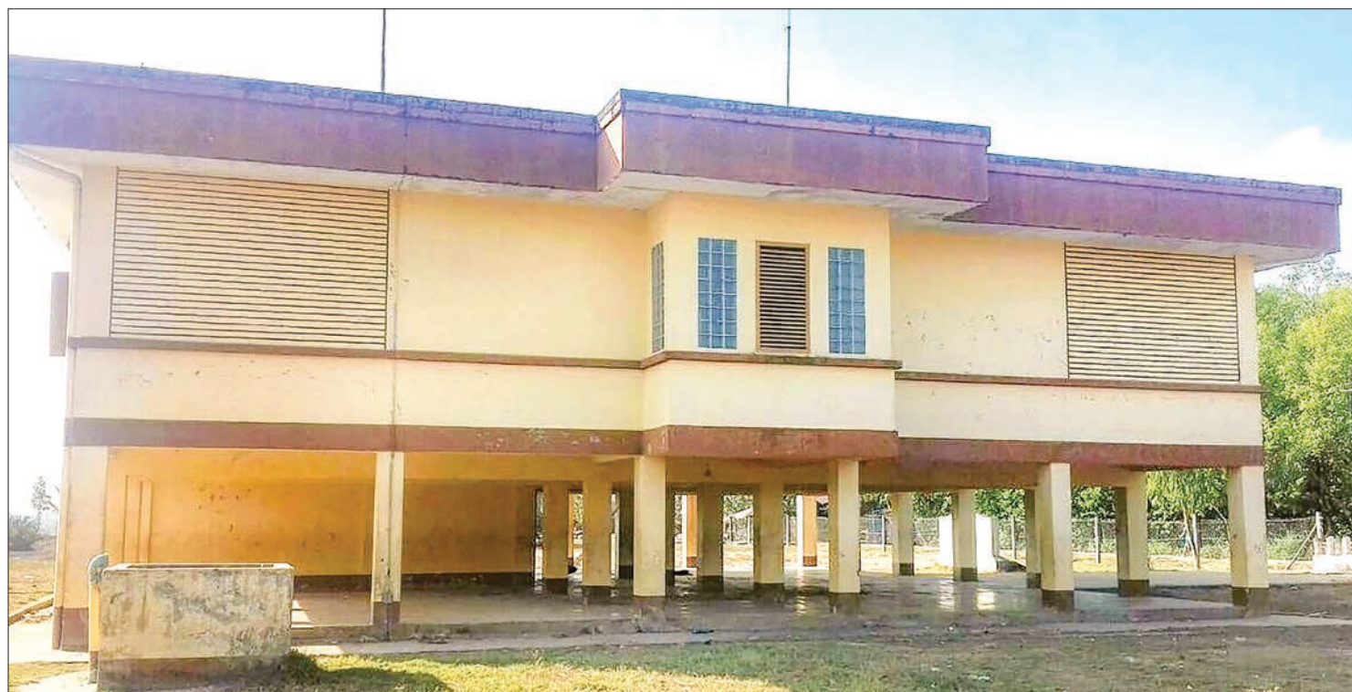
A cyclone shelter is seen in Ayeyawady Region.

F IFTY-SEVEN cyclone shelters are being constructed in Ayeyawady Region to keep people safe in the event of a natural disaster, according to the