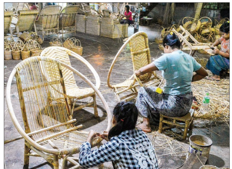
Workers make rattan furniture at the Monsoon Village Rattan Furniture in Thanlyin.