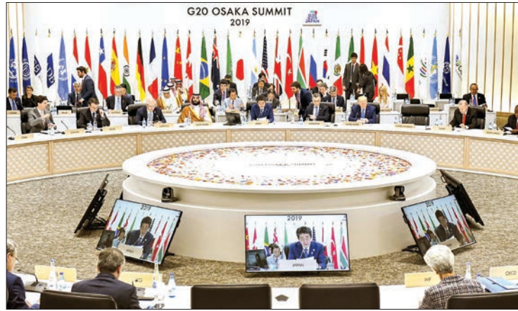
Group of 20 leaders attend the second-day session of their two-day summit in Osaka on 29 June, 2019.

The United States reiterated its position to pull out of the deal, saying it “disadvantages American workers and