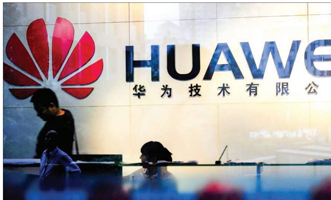
5G-related revenue of equipment and handset makers, including heavyweights like Huawei, are forecast to total 17.5 trillion yuan from 2020 to 2030.

The development of mobile technologies will drive the region’s economy. GSMA predicted that mobile technologies and services in the Asia-Pacific region will generate 1.9 trillion US dollars by 2023, increasing from 1.6 trillion US dollars, which was 5.3 per cent of the region’s GDP, in 2018.—Xinhua ■