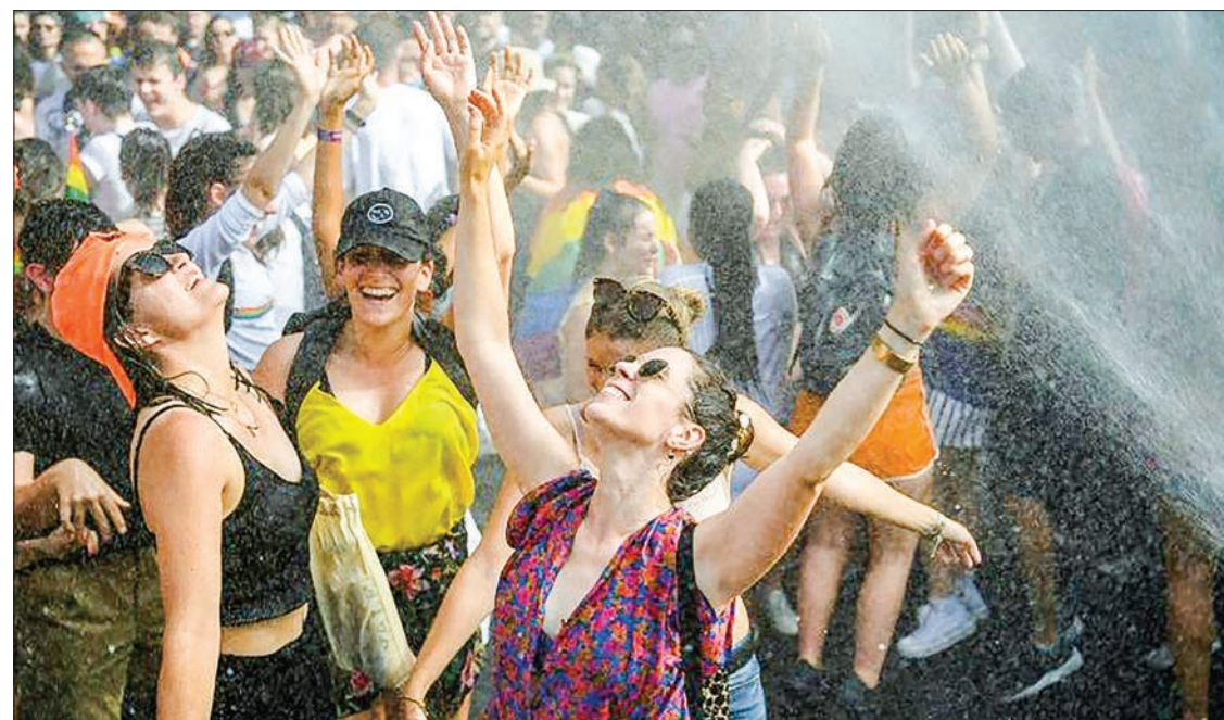
Western parts of Europe welcomed a dip in temperatures after almost a week of stifling heat and spikes in pollution.