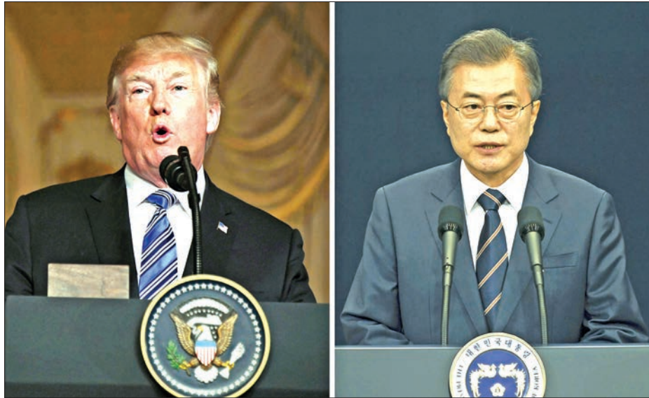
Combined file photo shows U.S. President Donald Trump (l) and South Korean President Moon Jae In.

and I were on the same page that it is very im-