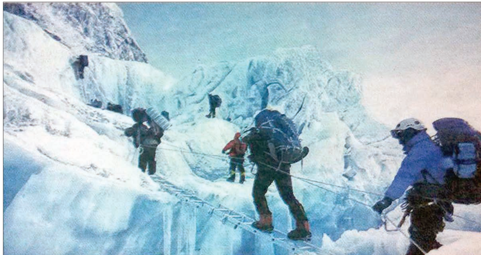
Climbing has always been a dangerous endeavour.

Practice in advance depending on the types of mountains. When a mountaineering expedition is arranged, prior rigorous exercises must be taken depending on the types of mountains. Day-trip mountaineering includes Myinmathi Mountain, Hsin Mountain, East and West Mountain, Mene Mountain and Yazatri Mountain. One or two nights spent on the mountains include Victoria Mountain. 14-15 days of return-trips include camping over 10000ft high mountains: Hponkan