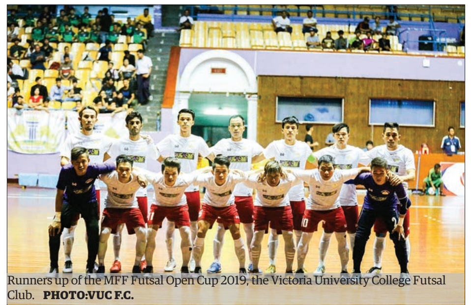
Runners up of the MFF Futsal Open Cup 2019, the Victoria University College Futsal Club.