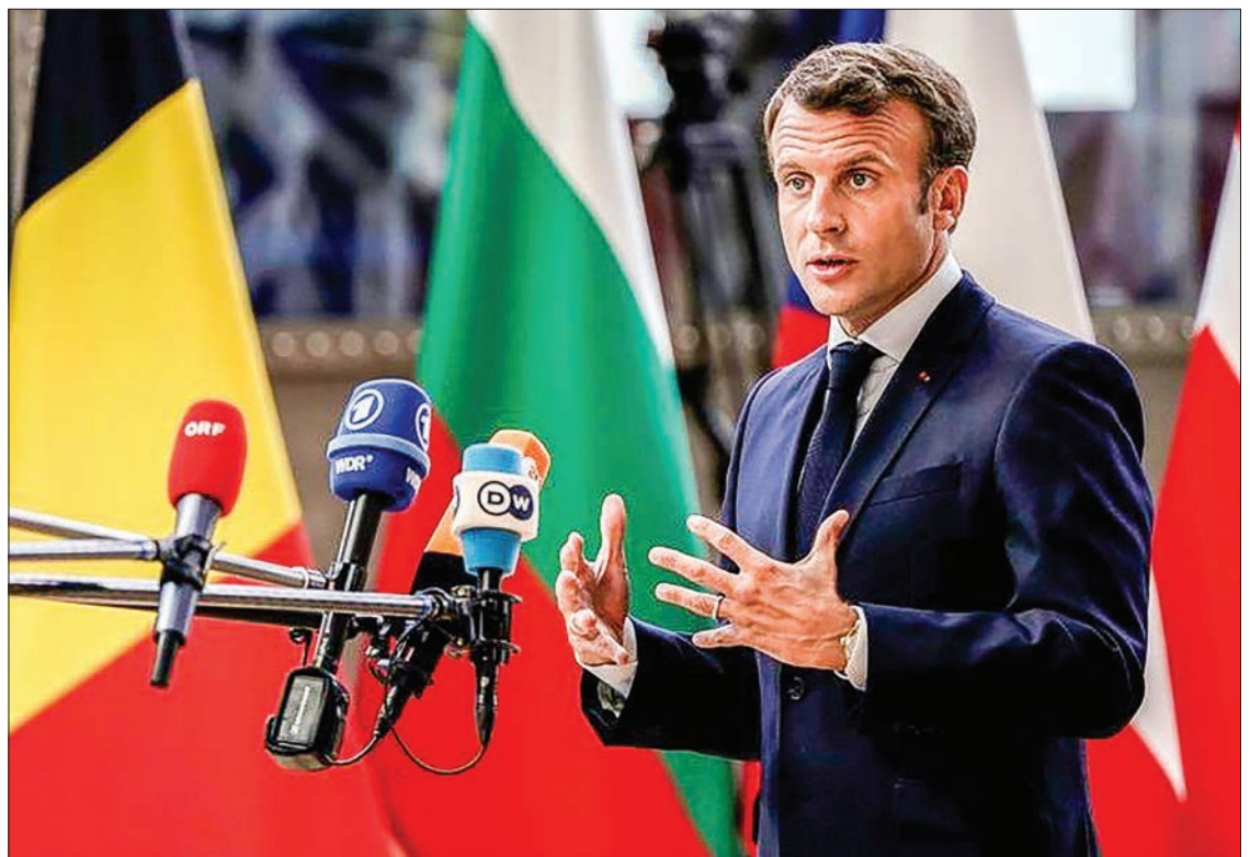
France's President Emmanuel Macron speaks to the press as he arrives for an emergency EU leaders summit to hammer out a deal on the top jobs in the bloc.

— once the candidate of Merkel to head the Commission — was ready to step aside, though his sidelining will further hurt the chancellor's fragile political standing at home.