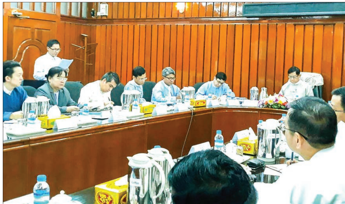
Deputy Minister U Maung Maung Win addresses the meeting for insurance development in Yangon yesterday.

been ordered to accept children aged three to five years old and not to open the schools before permission, according to the ministry.—MNA ■ (Translated by Kyaw Zin Tun)