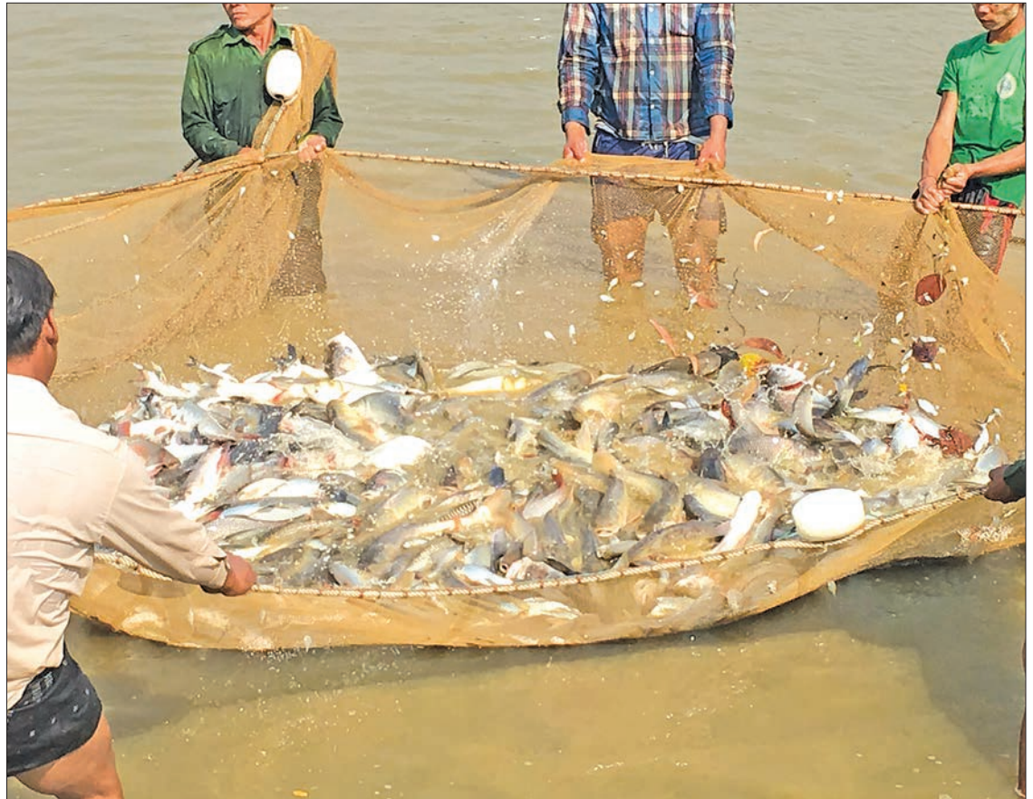
Workers harvest fish at a farm in Ayeyawady Delta.

According to the MFF, integrated poultry and fish farming cannot ensure food safety, which is a requirement for export. Therefore, the federation has asked for the formulation of a law to restrict that kind of mixed farming. Fish farming must be conducted as a large-scale project to get access to Project Bank loans, according to the MFF. ■ (Translated by Ei Myat Mon)