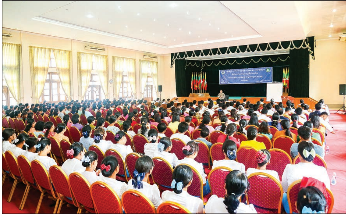
The ceremony to educate parents about early childhood development being convened in Nay Pyi Taw yesterday.

Following the meeting, the Union minister held a meeting with Nay Pyi Taw authorities