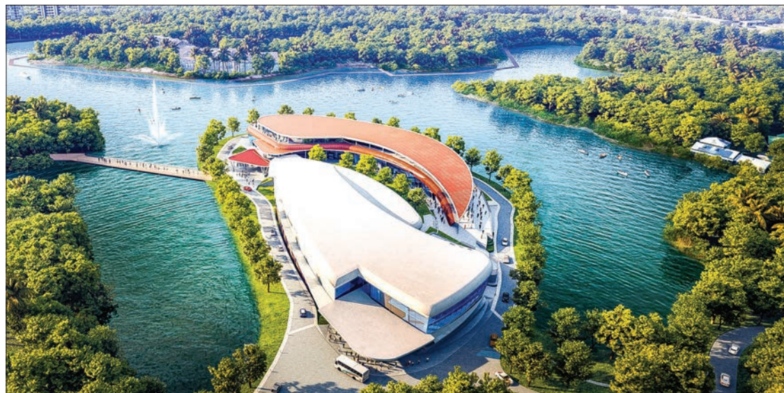
The architectural model of the Myanmar Aquarium.

Police filed charges against the suspect under the Anti-narcotic Drugs and Psychotropic Substances Law.—MNA ■ (Translated by Kyaw Zin Tun)