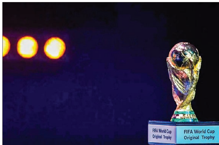
FIFA World Cup Trophy.

On Sunday, ASEAN Chairman Gen Prayuth Chan-o-cha had said that the 10 ASEAN