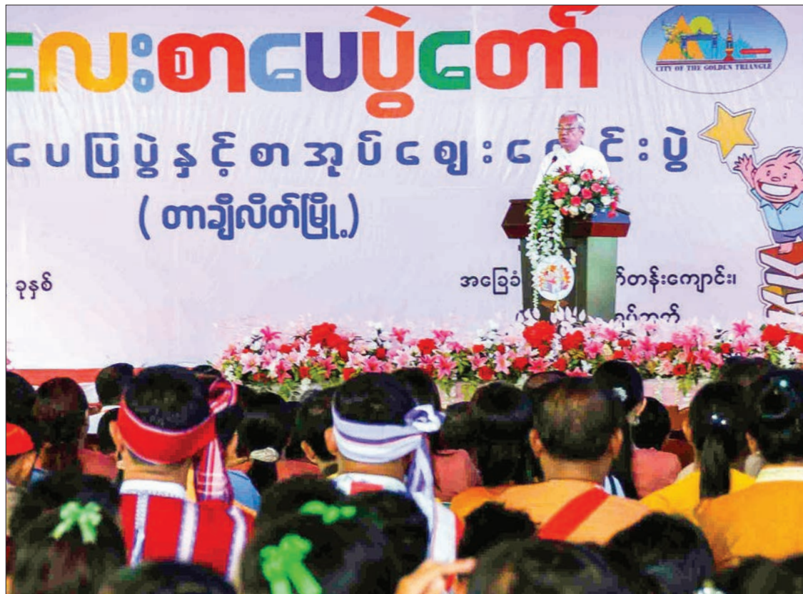
Former President U Htin Kyaw delivers the speech at the opening ceremony of Children's Literary Festival in Tachilek yesterday.

From reading, children will get to know things that they hadn't known. Children who are future leaders must enjoy reading and consider literature as a friend. Parents