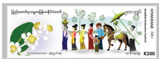
Post Office will stamp post mark and date on the commemorative stamps and First Day Covers bought on 2 nd July 2019.—MNA ■

As a special program, Nay Pyi Taw Central Post Office, Yangon Post Office and Mandalay