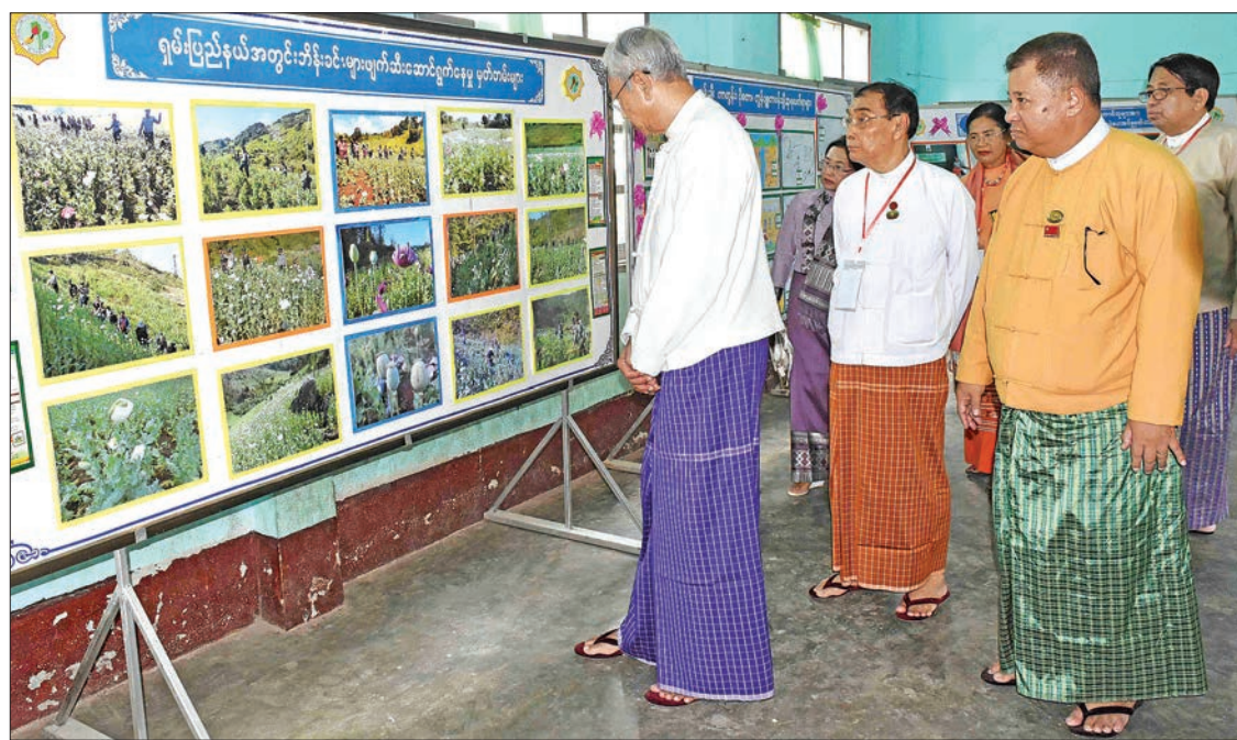
Former President U Htin Kyaw visits the booth exhibiting documentary photos on destruction of poppy plantation in Shan State at the opening ceremony of Children's Literary Festival in Tachilek.