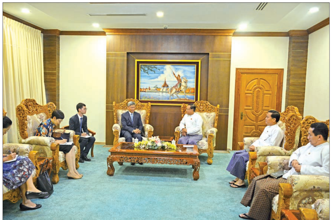
Union Minister U Kyaw Tin meets with Chinese Ambassador Mr Chen Hai at the Ministry of International Cooperation in Nay Pyi Taw yesterday.

and cooperation, promotion of cooperation under the Belt and Road Initiative, jointly holding the commemorative activities to celebrate the 70 th Anniversary of Myanmar-China diplomatic relations in 2020, Chinese government’s continued assistance for peace process and for promoting peace, stability and development in Rakhine State and ASEAN’s constructive assistance for the Repatriation of displaced persons.—MNA