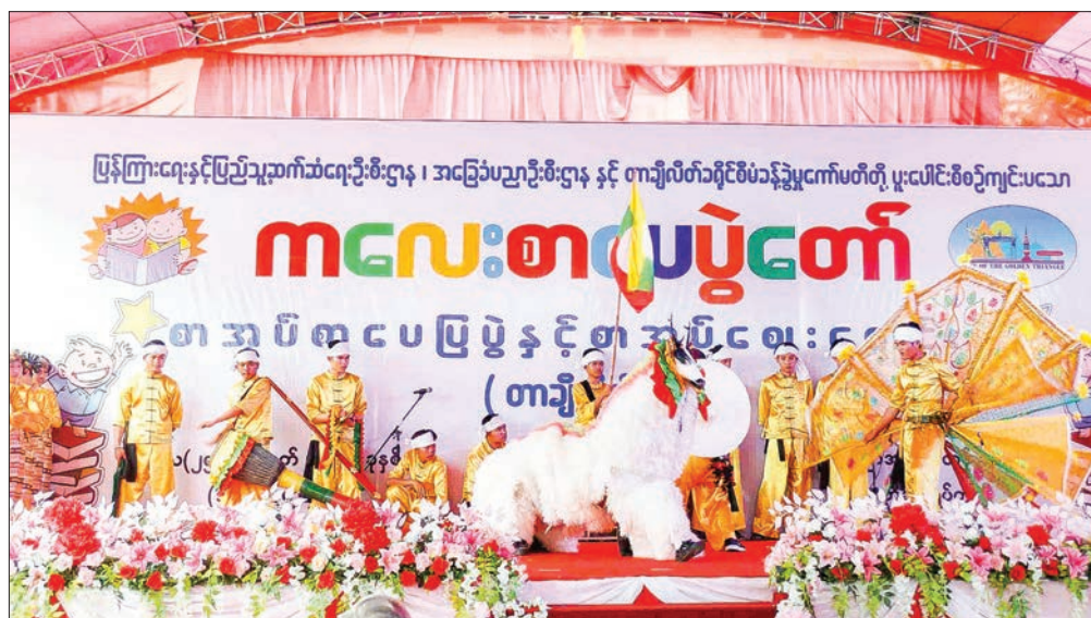
Shan ethnic school children entertain the visitors with traditional dance at the Children's Literary Festival in Tachilek yesterday.