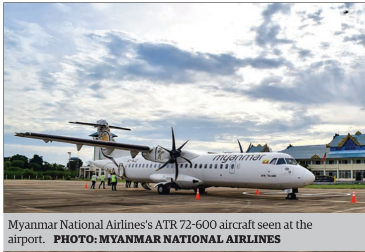
Myanmar National Airlines's ATR 72-600 aircraft seen at the airport.