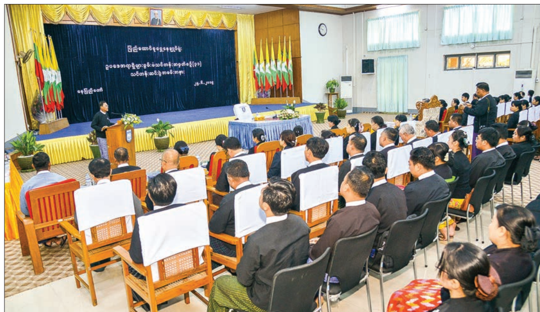
Union Attorney-General U Tun Tun Oo delivers the speech at the ceremony to conclude law officers' refresher course No.31.

THE refresher course No. 31 of the law officers of the Office of the Union Attorney General concluded yesterday in Nay Pyi Taw.