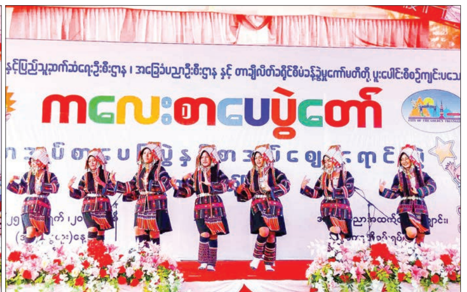
Akha ethnic women dance troupe performs at the Children's Literary Festival in Tachilek yesterday.