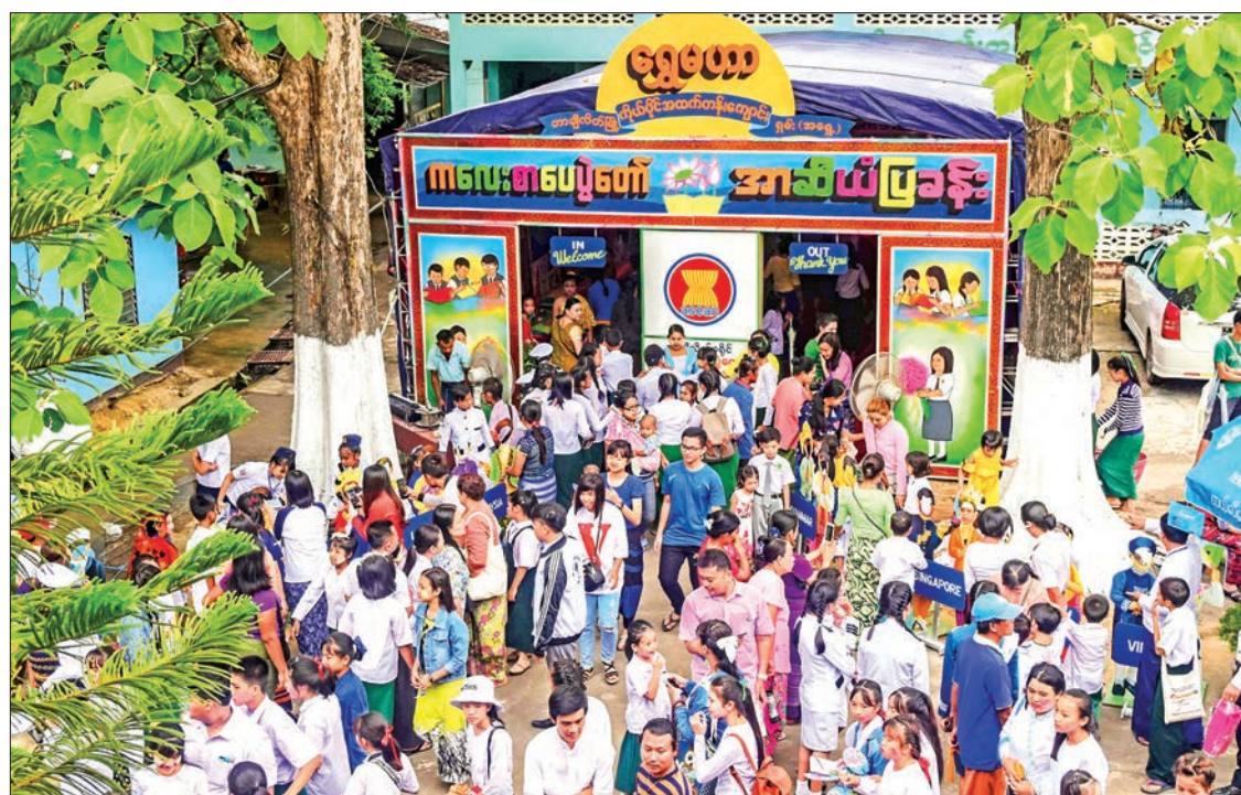
Children’s Literary Festival in Tachilek is crowded with students and people on the first day.

THE Children’s Literary Festival, held at the Makar Ho Khan Basic Education High School in Tachilek Township, registered a high turnout until the closing time of 5 pm on the first day.