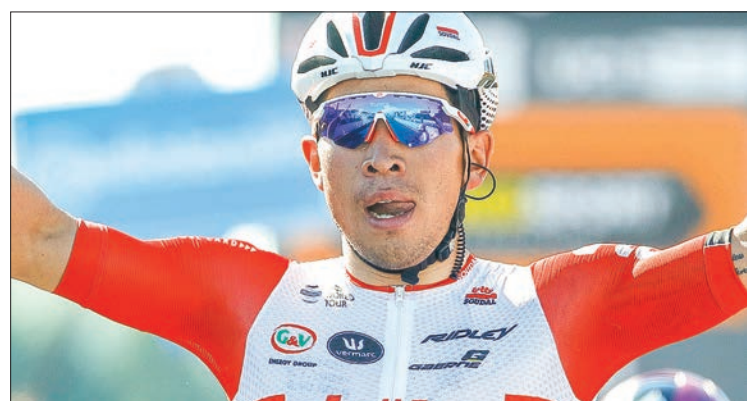
Caleb Ewan won two stages in the Giro in May.

added two more stages for Lotto in the Giro in May. His lead-out men in Italy, Belgian Jasper de Buyst and German Roger Kluge, were also in the team unveiled on Tuesday. Ewan seems to be still wrestling with some of the Tour basics. “It’s going to be a tough four weeks,” he said before correcting himself. “Or three weeks.” The eight-man team is completed by Thomas De Gendt, who has said he wants to ride in all three grand tours this year, and four more Belgians Tiesj Benoot, Tim Wellens, Jens Keukeleire and Maxime Monfort. — AFP ■