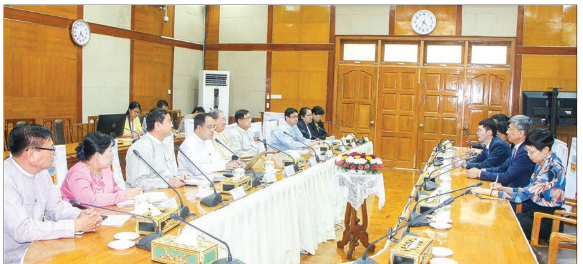
Union Minister for Planning and Finance U Soe Win holds talks with Chinese Ambassador Mr Chen Hai in Nay Pyi Taw yesterday.