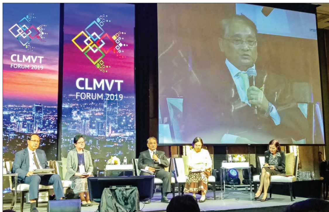
Union Minister for Commerce Dr Than Myint gives the speech at the CLMVT Forum 2019 at Renaissance Bangkok Ratchaprasong in Bangkok.