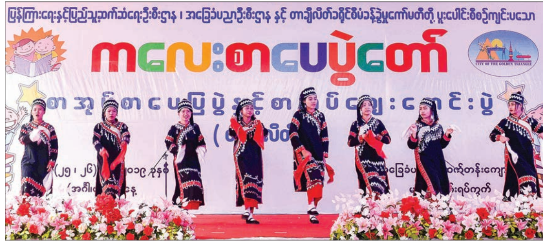
Ethnic dance troupe performs at the opening ceremony of the Children's Literary Festival in Tachilek.

encourage the inclusion in the regional curriculum the history, geography, culture and economy of the ethnic nationals in the region. Support will be provided toward including geography, history, culture and economy of the region in the regional curriculum at the six levels of fourth to ninth standards.