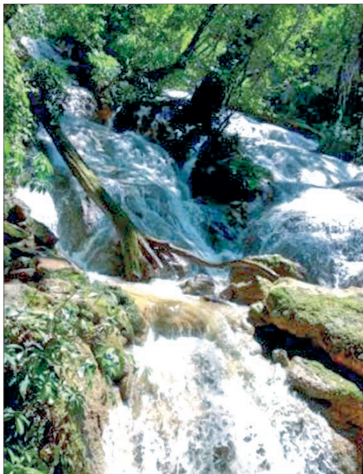
Ahlechaung waterfall.

Myathabeik Blue Water Pond and Tawkye waterfall is near Tawkye Village. Blue Water Pond was teeming with small shops selling local products such as herbs, local food, honey, flowers and gift items. There was no scientific explanation made yet for the water in the pond being