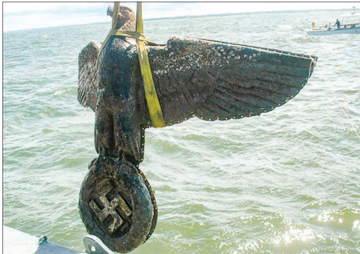
A photo of the Nazi eagle on the Admiral Graf Spee the day it was recovered in 2006.

Since it was found, the sculpture—seen as likely to fetch a handsome sum at auction—from the ship called the Admiral Graf Spee has been kept in a navy warehouse.