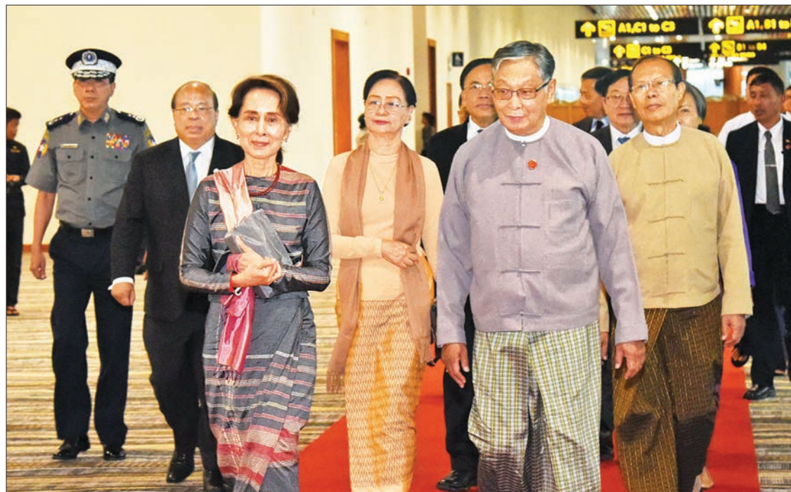
State Counsellor Daw Aung San Suu Kyi welcomed by Union Minister for the Office of the State Counsellor U Kyaw Tint Swe and officials at Nay Pyi Taw International Airport yesterday.