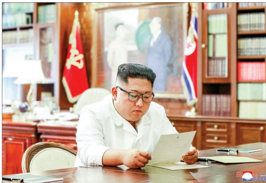
The front page of North Korea's official Rodong Sinmun newspaper carried a photo of Kim holding Trump's letter as he read it in his office.

On Sunday, the North's official Korean Central News Agency (KCNA) reported that Trump had written to Kim, who "said with satisfaction that the