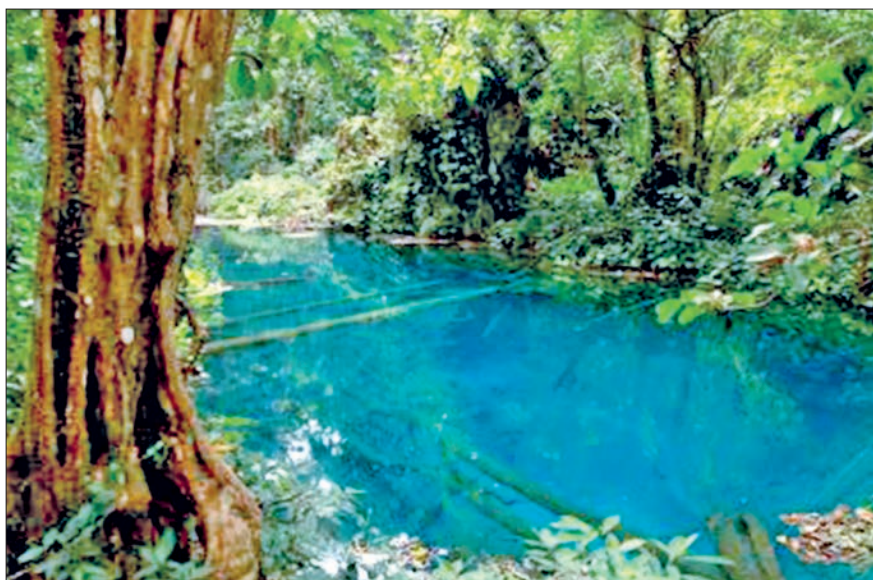
Natural clear blue water lagoon (Mya-tha-bait-yay-pyar-aing).