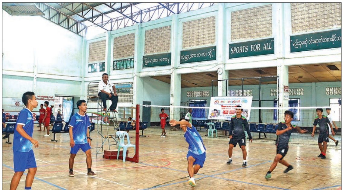
Youths competing in the Sepak takraw event at the Myoma indoor stadium in Tachilek yesterday.

Group fixture of the Sepak takraw took place at the Myoma indoor stadium yesterday. Ten teams are taking part in the contest, and the final match will be held on 26 June.