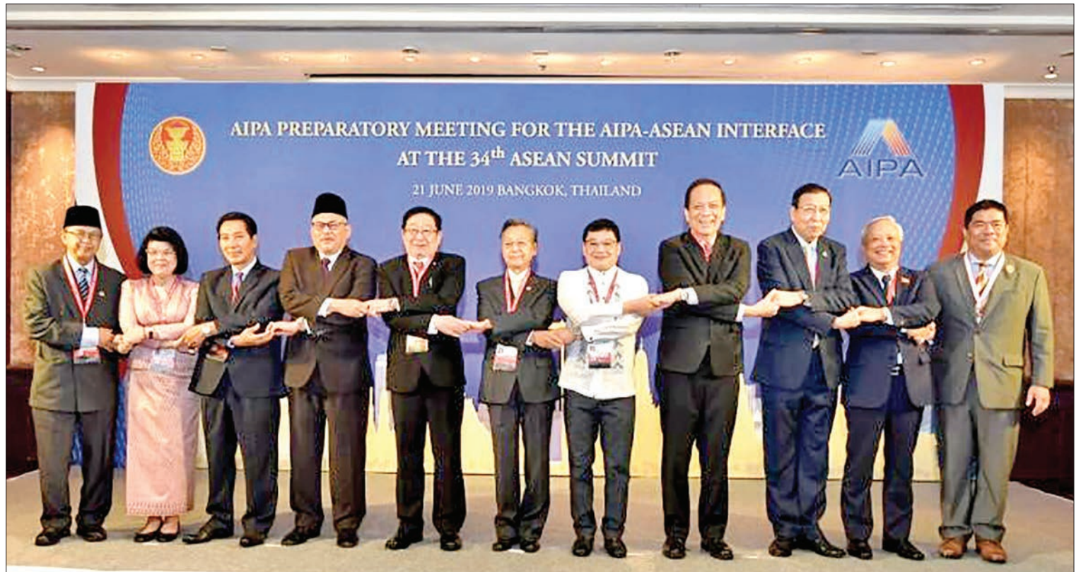
Speaker of Pyidaungsu Hluttaw and Pyithu Hluttaw U T Khun Myat poses for a documentary photo at AIPA Preparatory Meeting for the AIPA-ASEAN Interface at the 34th ASEAN Summit in Bangkok yesterday.

On 21 June morning, the delegation led by Speaker U T