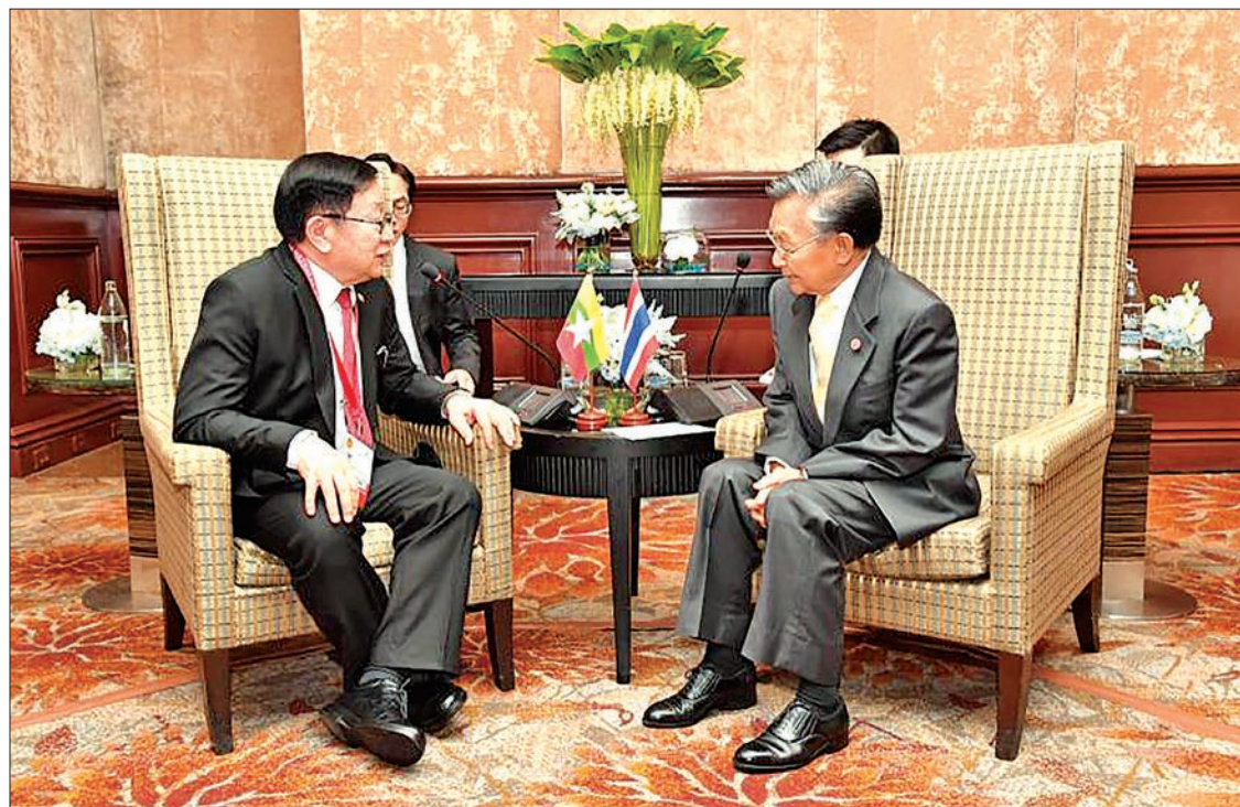
Speaker of Pyidaungsu Hluttaw and Pyithu Hluttaw U T Khun Myat meets with Thai National Assembly President Mr. Chuan Leekpai.

Khun Myat participated in the preparatory meeting of ASEAN leaders and representatives of AIPA along with parliamentary leaders and representatives of other AIPA countries: Brunei, Cambodia, Lao, Malaysia, the Philippines, Singapore, Thailand and Viet Nam.