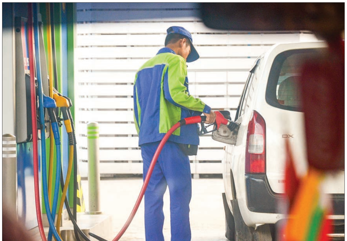
A worker fills a car with petrol at a refilling station in Yangon.