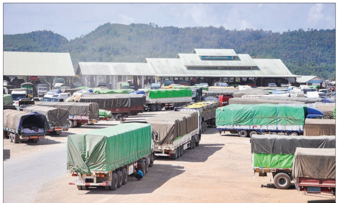
Trucks seen at 105-mile trade zone in Muse, northern Shan State.