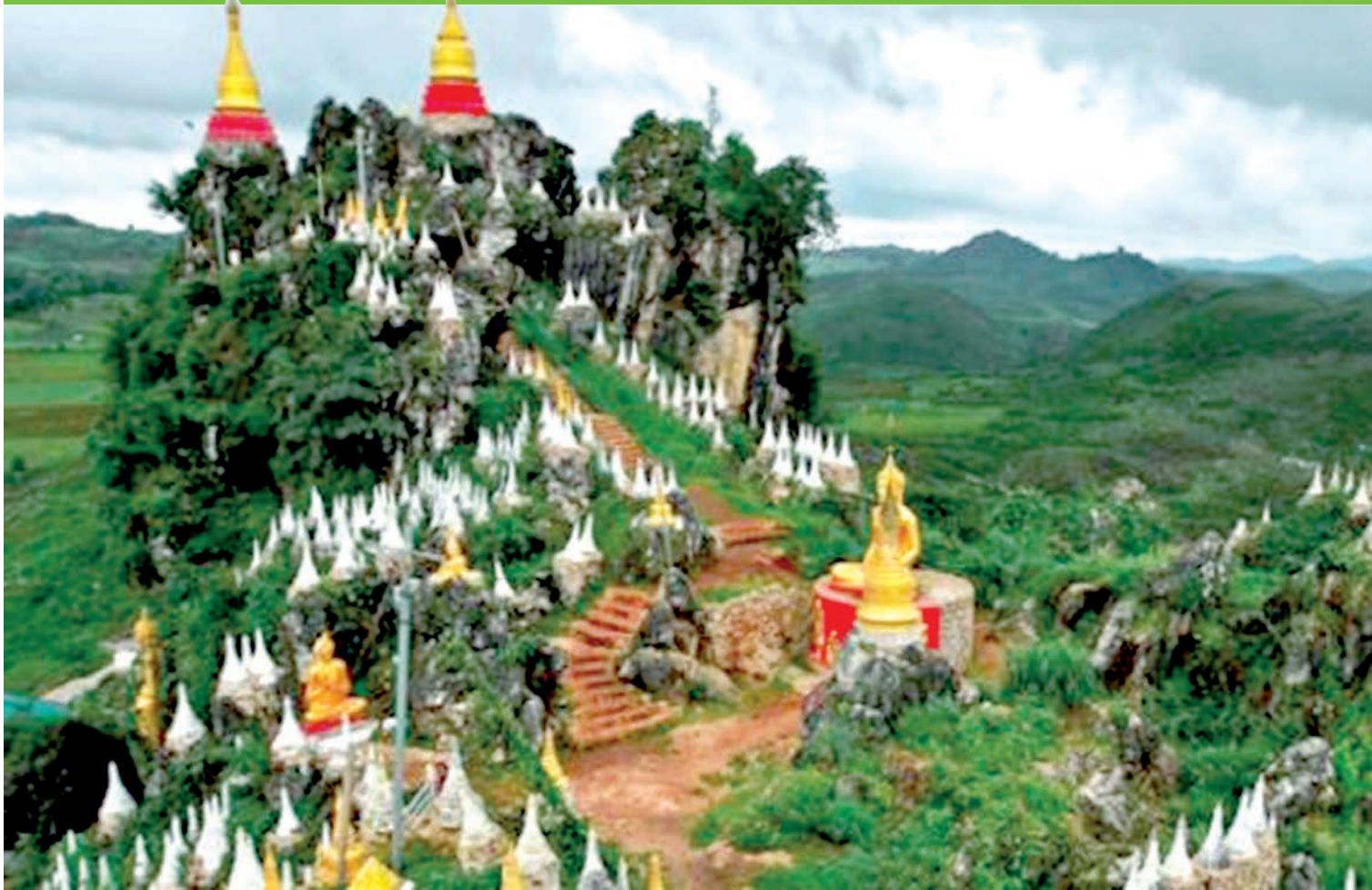
Main Ma Ye Thakhinma mountain.