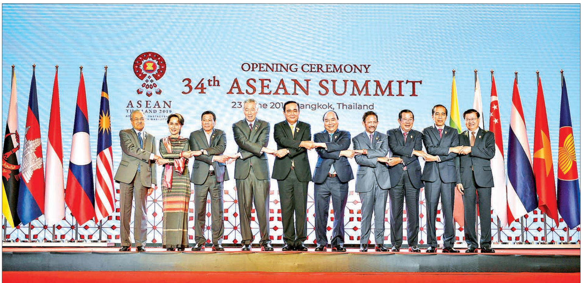
State Counsellor Daw Aung San Suu Kyi poses for a group photo at the opening ceremony of the 34 th ASEAN Summit in Bangkok, Thailand yesterday.

S TATE Counsellor Daw Aung San Suu Kyi attended the opening ceremony of the 34 th ASEAN Summit and the ASEAN Summit (Retreat) yesterday.