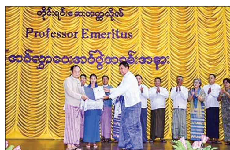
The Professor Emeritus Title conferral ceremony being held at the UTM, Mandalay on 8 June.

and practices of the teachers, e-library, documents and traditional treatises. As a part of support to implement the above activities, the MoHS awarded Professor Emeritus, Honorable Professor and Visiting Lecturer Certificates to retired professors and teachers of the University of Traditional Medicine on 8th June, 2019. It was a very first time in the history of UTM. A Technical Advisory Group (TAG) on Traditional Medicine which will serve as a think tank for holistic perspectives of traditional medicine was also founded. In conclusion, the 8 th June 2019 was an auspicious day for traditional medicine professionals and acknowledged and appreciated the retired professors and teachers who actively participated in tradi-