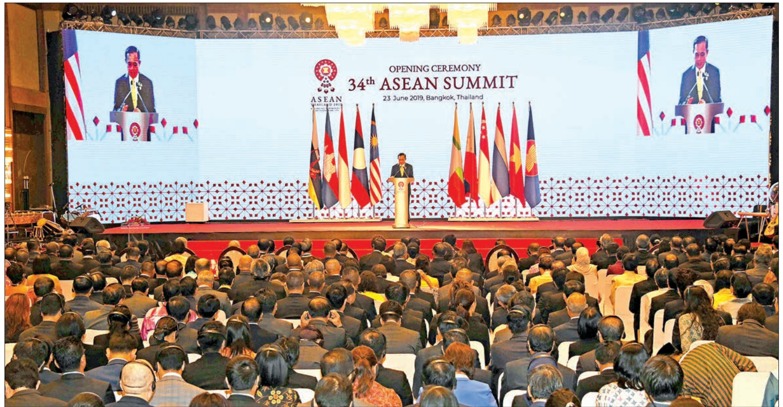
Thailand Prime Minister Prayut Chan-o-cha delivers the speech at the opening ceremony of the 34 th ASEAN summit in Bangkok Thailand, yesterday.

Also present at the Summit together with the State Counsellor were Union Ministers U Thaug Tun