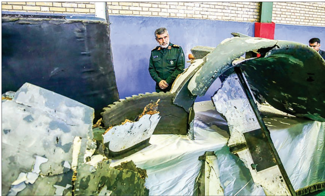
Iran has shown what it says is the debris of the US drone it shot down—a Global Hawk reconnaissance aircraft that costs more than $120 million.

On Sunday US National Security Advisor John Bolton warned Tehran against misin-