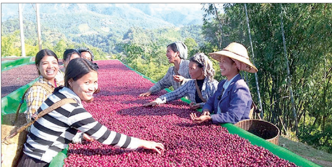
Workers dry coffee berries under the sun shine in Ywangan.

Agriculture was the main mean of livelihood in Ywangan region. Fruits and vegetables such as orange, tomato, cabbage, ginger, avocado etc. were grown but the main products were coffee and tea. Coffee and tea plantations are the usual sight seen at entrance of every village. Ywangan coffee has become known in the world for its quality and was reported to have achieved a Geographical Indication (GI), the same designation that protects the Champagne region in France from copycats. Ywangan coffee beans are of the Costa Rican variety and are grown as a substitute for poppy. The coffee is currently rated at a level of 85 in the global market under the rec-