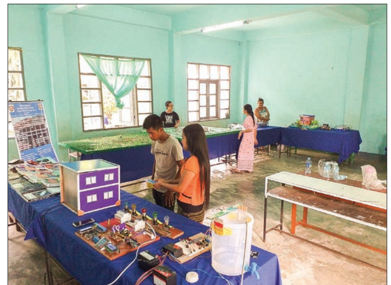
Organisers prepare the booth for Children's Literary Festival in Tachilek on 25 and 26 June.