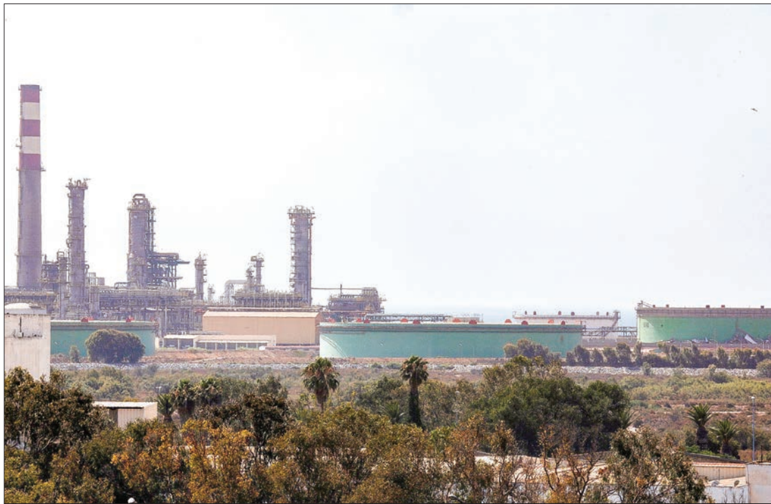
Morocco's sole oil refinery in Mohammedia, near Casablanca, has been struggling to attract a buyer and survive three years after it was liquidated for failing to honour huge debts.

Work at the refinery, which had a capacity of more than 150,000 barrels a day, had already wound down a year before it was dissolved. But nearly 800 employees remain on the payroll, albeit