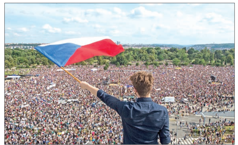
A man holds a Czech National flag during a rally demanding the resignation of Czech Prime Minister Andrej Babis on 23 June 2019 in Prague.

The Slovak-born 64-year-old is facing charges over EU subsidy fraud after allegedly taking his farm out of his sprawling