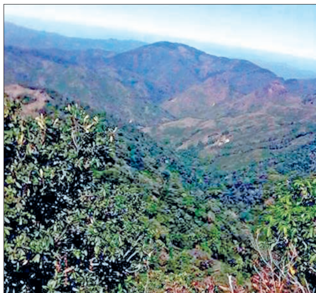
Scenery of Ywangan.

ommendations from American Coffee Specialists. Any grade of 80 or above is considered a specialty coffee. Out of 125 villages in Ywangan Township, about 90 are engaged in coffee plantation with 7,300 acres of coffee farms.