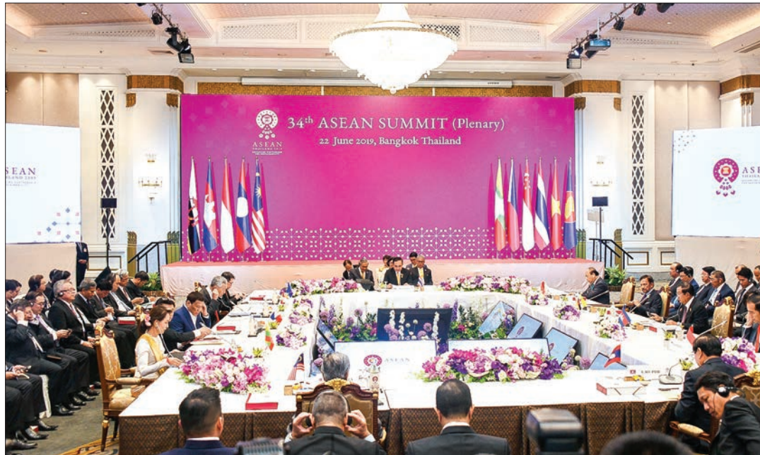
State Counsellor Daw Aung San Suu Kyi attends 34th ASEAN Summit (Plenary) in Bangkok, Thailand, on 22 June 2019.

pressed her appreciation to the Secretary General of ASEAN and the AHA Centre for their pragmatic and positive approach in seeking solution to the issue. She also said that the report of the Preliminary Needs Assessment Mission was constructive, and she welcomed the support and assistance of all ASEAN Member States. She added that Myanmar more than any other State would wish for a smooth and speedy resolution of the problems and that it is important for Myanmar and Bangladesh as well to work constantly to hasten up the implementation