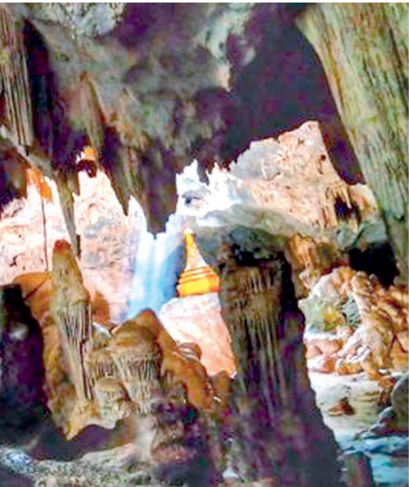
Pyadalin Cave Yawngan Township, Taunggyi, Shan State.

blue but locals believe that it was the reflection of an emerald bowl (Myathabeik in Myanmar language) at the bottom of the pond. Local superstition was such that littering, washing with the water in the pond, taking water from the pond was not done while care was taken of not speaking any word that can be deemed as offensive or rude.