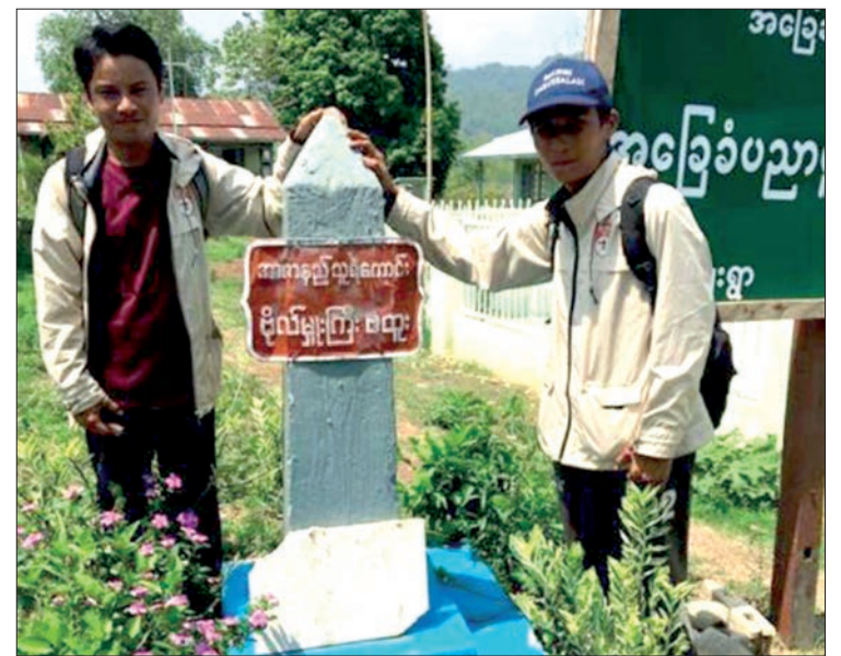
A monument to the late Col. Ba Htoo.

The village had two monasteries, named simply North