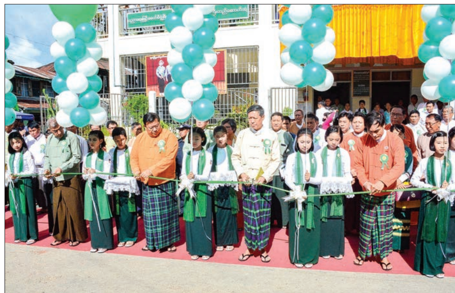
Union Minister Dr. Myo Thein Gyi and officials open the No 4 Basic Education High School in Pyapon, Ayeyawady Region yesterday.

Pyapon Township had a high matriculation pass-rate, he said, and added that making the right choice in selecting the major subject was an important factor to pass the matriculation examination. Academic skill of