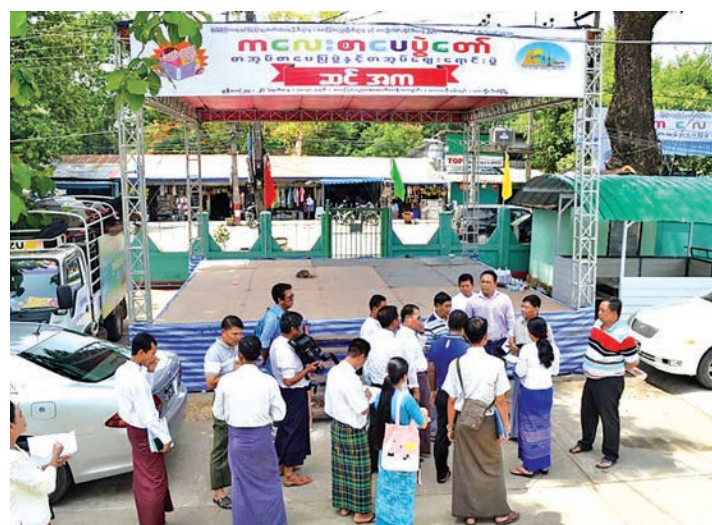
Officials inspect preparations for holding the Children's Literary Festival in Tachileik on 25 June.

The committee members reported the progress of their works in each sector to the Union Minister.—MNA (Translated by Khaing Thanda Lwin) ■