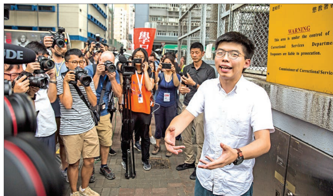
Hong Kong democracy activist Joshua Wong (R) speaks to the media after leaving Lai Chi Kok Correctional Institute in Hong Kong on 17 June 2019. Hong Kong democracy activist Joshua Wong called on the city's leader to resign.

The deal set a limit on the number of uranium-enriching centrifuges, and restricted its right to enrich uranium to no higher than 3.67 per cent, well below weapons-grade levels of around 90 per cent. It also called on Iran to export enriched uranium and heavy water to ensure that the country's reserves would stay within the production ceiling set by the agreement, yet recent US restrictions have made such exports virtually impossible.—AFP ■