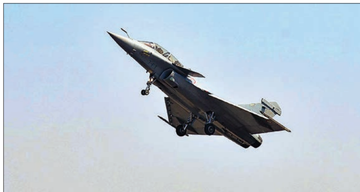
France's Dassault, producer of the Rafale fighter jet, is one firm involved in the Future Combat Air System project designed to reduce European reliance on US equipment.

It will be spearheaded by Airbus and France's Dassault Aviation, which aim to have the plane in the skies by 2040, and other nations might sign on as well.