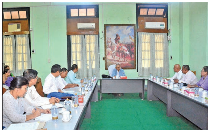
Second coordination meeting held at the Printing and Publishing Department on Theinbyu Road in Yangon yesterday.