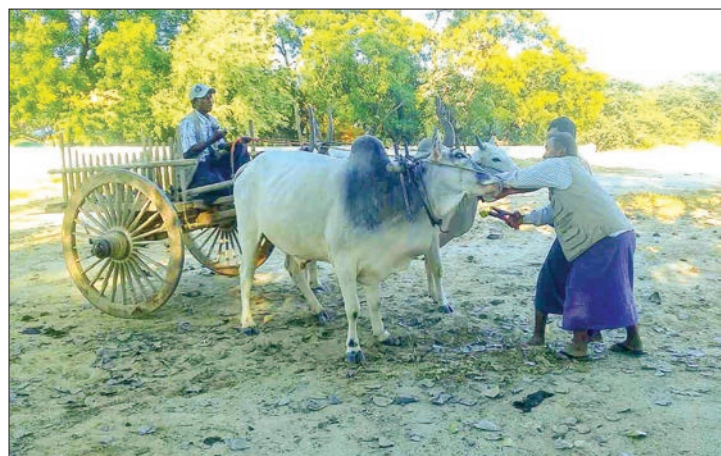
A veterinarian vaccinating cattle in a village in NyaungU Township. PHOTO: YE WIN NAING (NYAUNGU)

This programme was carried out in 24 townships in Mandalay and Sagaing regions.—Ye Win Naing (NyaungU)