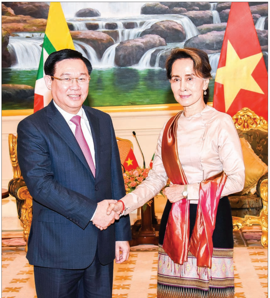
State Counsellor Daw Aung San Suu Kyi shakes hands with Vietnamese Deputy Prime Minister Mr. Vuong Dinh Hue at the Presidential Palace in Nay Pyi Taw yesterday.

H.E. DAW AUNG SAN SUU KYI, State Counsellor and Union Minister for Foreign Affairs of the Republic of the Union of Myanmar received H.E. Mr. Vuong Dinh Hue, Deputy Prime Minister and Member of the Politburo Committee of the Socialist Republic of Viet Nam at the Presidential Palace in Nay Pyi Taw on 17 June 2019 at 3:30 p.m.