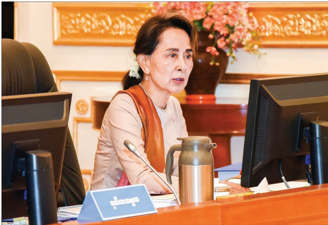
State Counsellor Daw Aung San Suu Kyi makes remarks at the National Planning Commission Meeting 1/2019.

He said it was important to assess the feasibility of each project and whether it would contribute to the public and to regional and national development while refraining from damaging the environment. He said this would allow Myanmar's limited resources to be used effectively and reasonably.