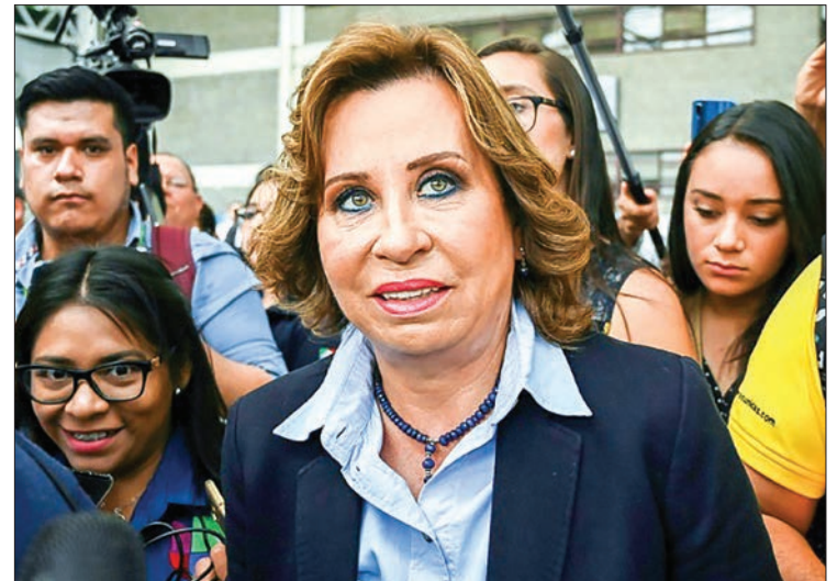
Former first lady Sandra Torres has pledged health and education reforms as well as jobs to stem the flow of migrants to the US.

GUATEMALA CITY (Guatemala)—Former first lady Sandra Torres was in the lead after partial results early Monday from Guatemala's presidential election, following a tumultuous campaign that saw two leading candidates barred and the top electoral crimes prosecutor flee the corruption-weary country.