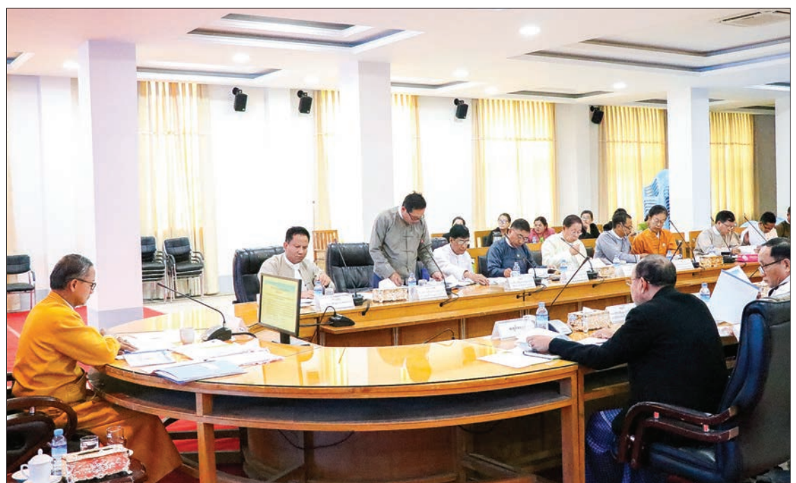
Union Minister for Hotels and Tourism U Ohn Maung attends the meeting of the Shan State Border Area Tourism Committee on Saturday, calling for community-based tourism in Shan State.