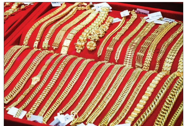
Gold jewellery displayed on a shop in downtown Yangon.