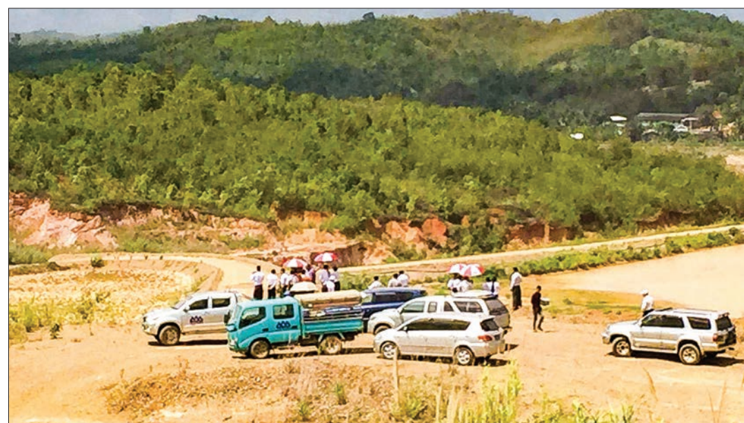
Taninthayi Region Minister for Natural Resources and Environmental Conservation U Hla Htway inspects a mining site at Heinda village in Myitta Township.

THE Taninthayi Region Minister for Natural Resources and Environmental Conservation, U Hla Htway, inspected a mining site operated by Myanmar Pongpipat Co. Ltd at Heinda Village in Myitta Township of Taninthayi Region on Sunday.