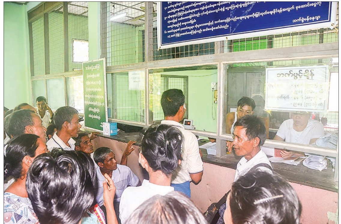
Local farmers gather at the Sittway branch Myanma Agricultural Development Bank to get loans for planting rice in rain-fed fields in Sittway Township.

Agricultural loans for cultivating rice in rain-fed fields are disbursed no later than September, and farmers who have Land Use Form-7 are eligible to obtain