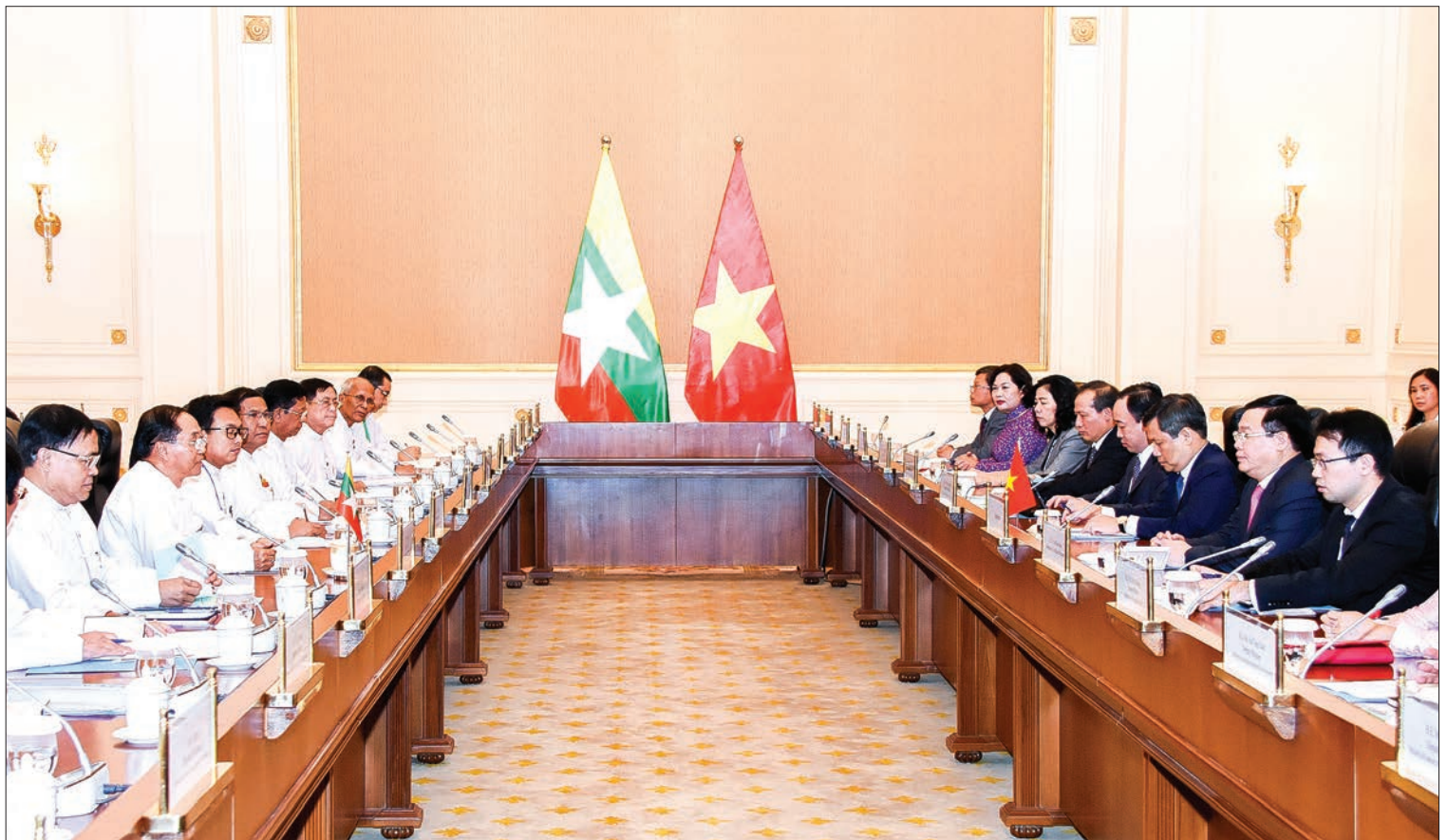
Vice President U Myint Swe holds talks with Vietnamese Deputy Prime Minister Mr. Vuong Dinh Hue at the Presidential Palace in Nay Pyi Taw yesterday.