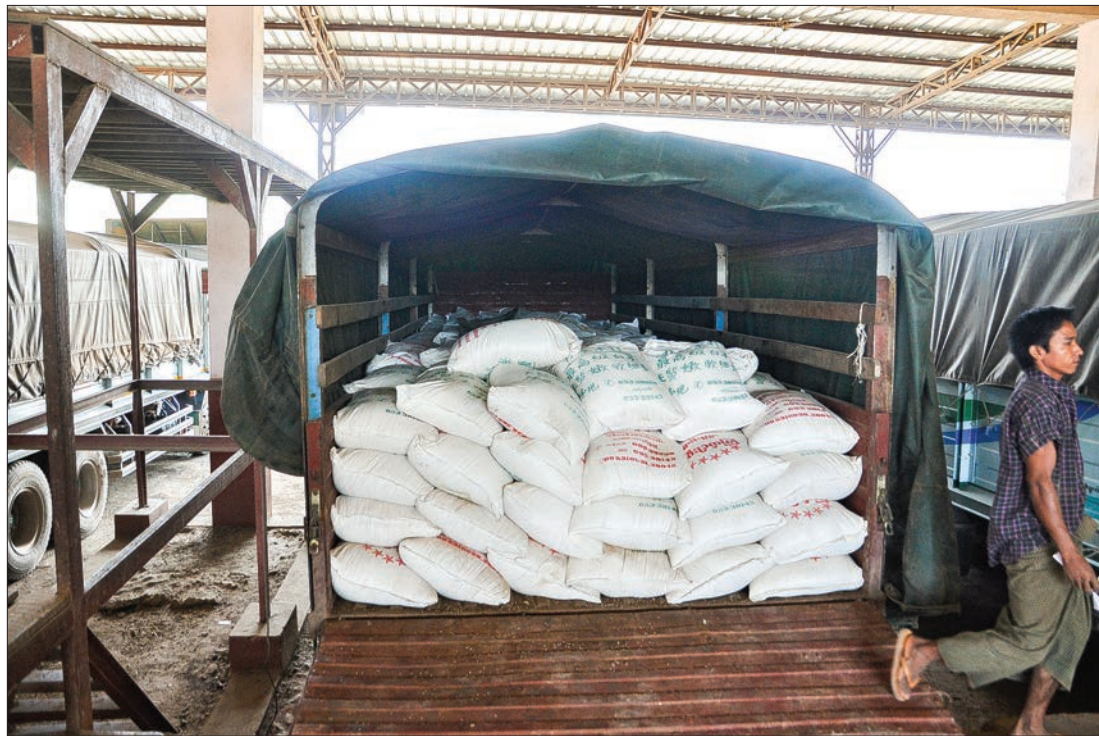
A truck is loaded with sacks of rice for export to China.