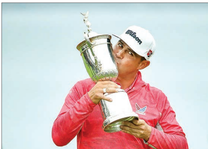
Gary Woodland poses with the trophy after winning the 2019 US Open at Pebble Beach Golf Links.

With Brooks Koepka — winner of four of his last eight majors, runner-up at this year's Masters and chasing an his-