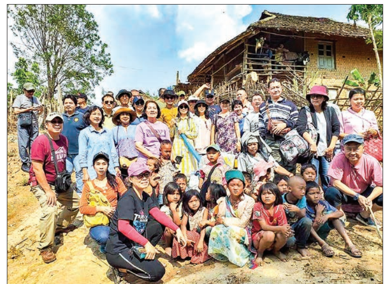
Thai tourists pose for a photograph together with local people.