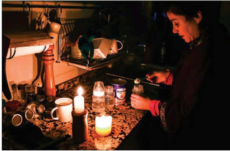
A woman prepares milk bottles by candle lights at her home in Montevideo during a massive power failure.

BUENOS AIRES (Argentina) — Electricity services have been restored to all of Argentina and Uruguay following a massive blackout that left around 48 million people without power on Sunday, authorities said.