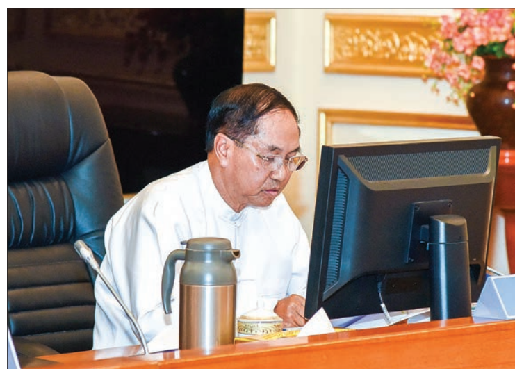
Vice President U Myint Swe makes remarks at the Finance Commission meeting 3/2019 at the Presidential Palace.