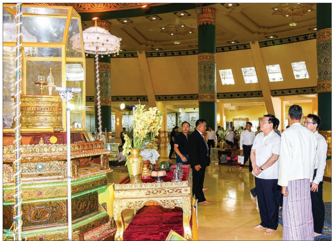
Vietnamese Deputy Prime Minister Mr. Vuong Dinh Hue visits Uppatasanti Pagoda in Nay Pyi Taw yesterday.