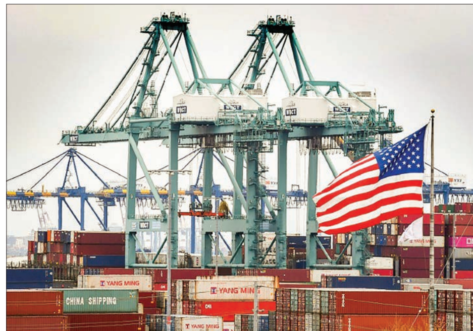
Chinese shipping containers unloaded at the Port of Los Angeles in Long Beach, California in May 2019.

"We would like it to be known that the retail segment of the economy is preparing for a big hit and pray that the present administration consults God," said an anonymous retailer in western Kentucky that imports outdoor seating and artificial Christmas trees, among other items, but supported Trump's trade policies overall.—AFP ■