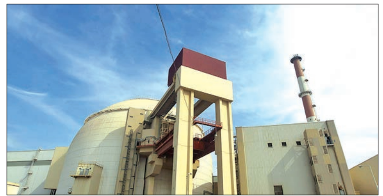
File photo shows the reactor building at Bushehr nuclear power plant in Iran.

Protesters have called on her to resign, shelve the bill permanently and apologise for police using tear gas and rubber bullets on Wednesday. They have also demanded all charges be dropped against anyone arrested.—AFP ■