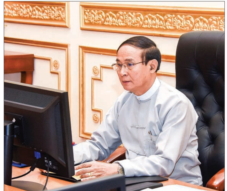
President U Win Myint delivers an address at the Finance Commission meeting 3/2019 at the Presidential Palace in Nay Pyi Taw yesterday.