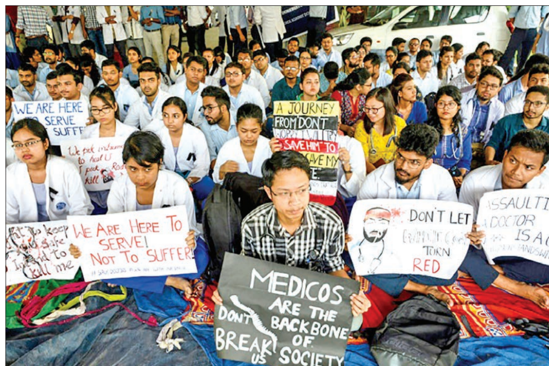
Indian doctors are striking to demand better protection from patients and their angry relatives.

On Monday doctors in the state were due to discuss the strike with Mamata Banerjee, the state premier and fierce Modi opponent. India spends less than two per cent of its GDP on health care, making it one of the lowest investors in the sector globally, with the World Health Organization placing it below both Iraq and Venezuela. However, Modicare — a quietly successful part of Modi's surprising re-election — is a huge public health initiative set to benefit the poorest. —AFP ■