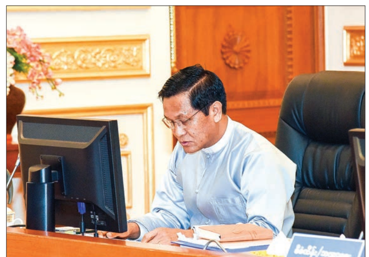
Vice President U Henry Van Thio makes remarks at the Finance Commission meeting 3/2019 at the Presidential Palace.