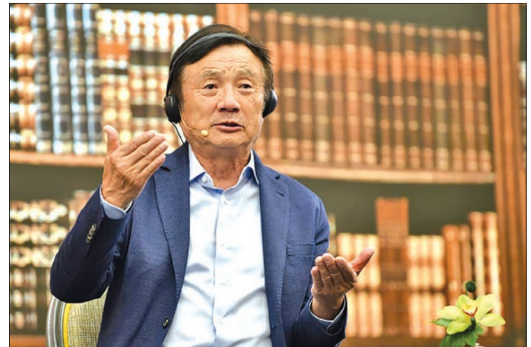
Huawei's founder says overseas smartphone sales have tumbled after US pressure on the Chinese firm.

"In 2021, we will regain our vitality and (continue to) provide services to human society," he said.—AFP ■