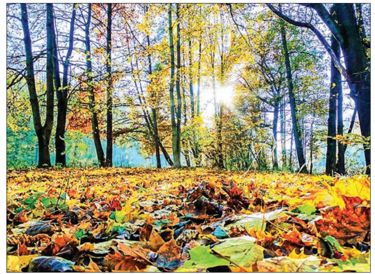
According to the study, spending at least 120 minutes a week in nature could be a crucial threshold for promoting health and well-being.

“He is perfectly familiar with the challenges of conservation on a national and international level.”—AFP ■