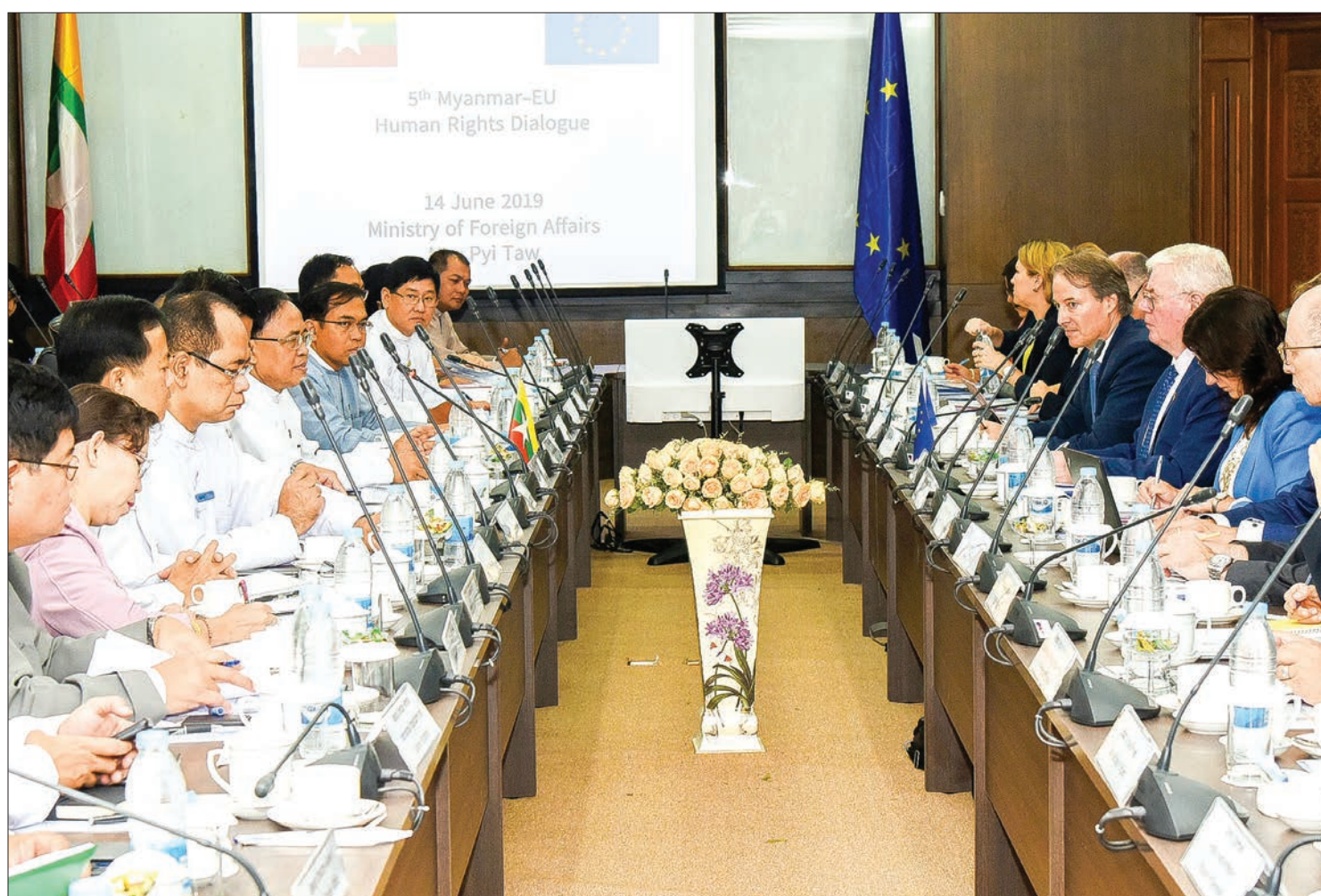
Union Minister U Kyaw Tin holds talks with a delegation led by European Union's Special Representative for Human Rights Mr. Eamon Gilmore at the Fifth Myanmar-EU Human Rights Dialogue at the Ministry of Foreign Affairs, Nay Pyi Taw, on 14 June 2019.

UPDJC Secretariat meeting likely in July