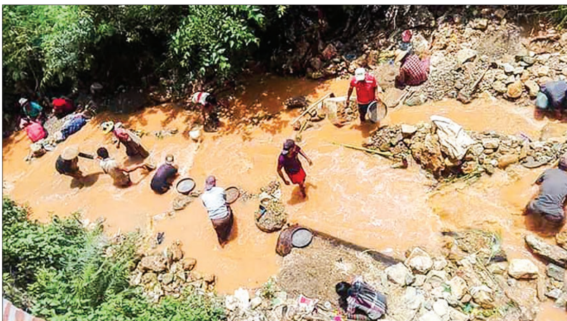
Workers search for rare gems around Kyatpyin Village in Mogok Township.