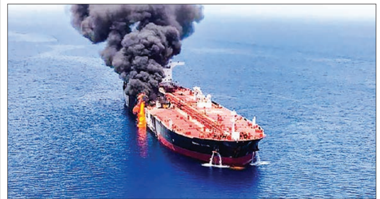
A picture obtained by AFP from Iranian News Agency ISNA on 13 June, 2019 reportedly shows fire and smoke billowing from the Norwegian-owned Front Altair tanker, one of two vessels hit by suspected attacks in the waters of the Gulf of Oman.

"This is based on intelligence, the weapons used, the level of expertise needed to execute the operation, recent similar Iranian attacks on shipping, and the fact that no proxy group operating in the area has the resources and proficiency to act with such a high degree of sophistication," he said.—AFP ■