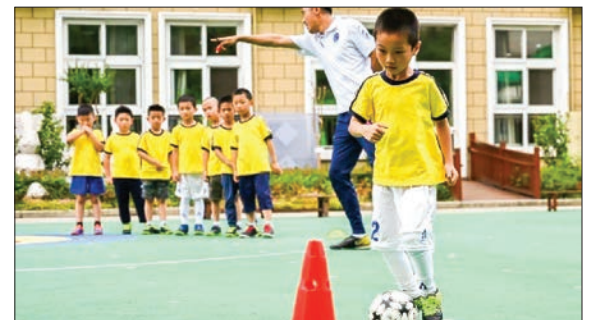
China has introduced football-focused kindergartens in a bid to produce more players.

"It's really important to lay the foundation for them at an early age."—AFP ■