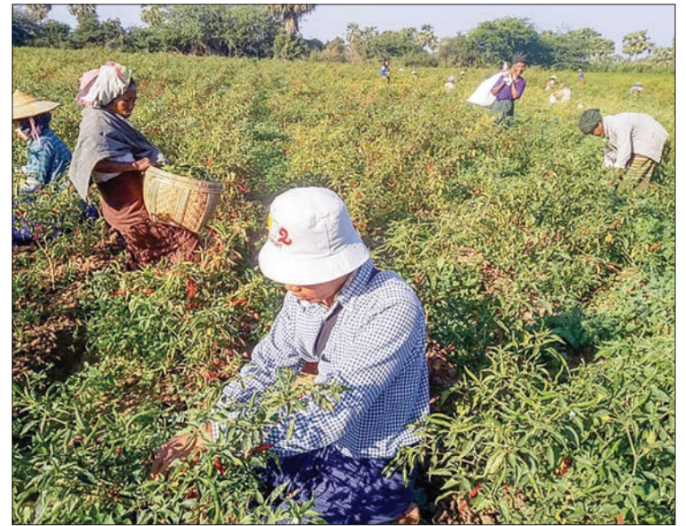
Farmers pluck chillies from a plantation in NyaungU.