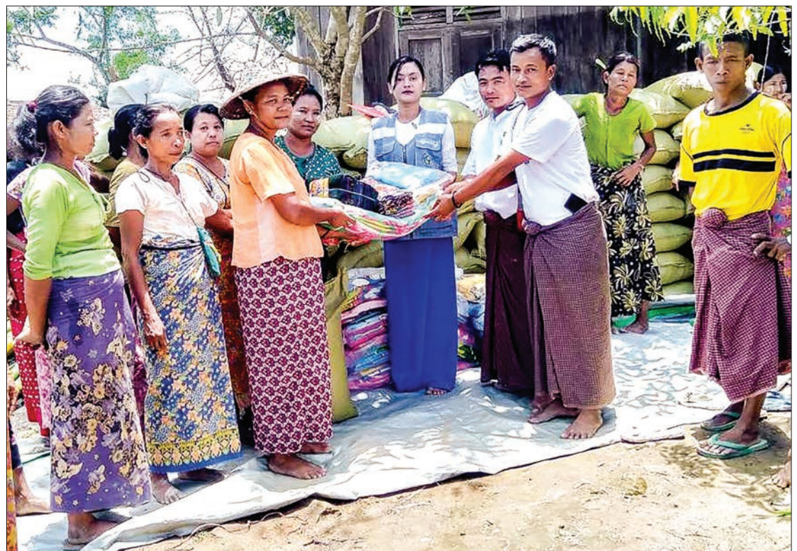
Officials provide relief supplies to IDPs in MraukU IDP camp.