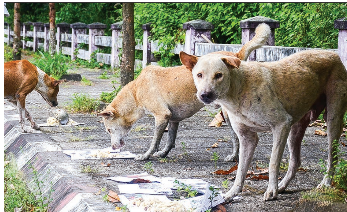
Giving food to stray dogs seen in Yangon.

According to one WHO report some years ago, a very high percentage about seventy or so of the stray dogs in Yangon were rabid. Thus Myanmar is classified as a high rabies endemic country. Although there are other animals such as, rodents, bats and cats, etc, which also carry rabies viruses, the causes of deaths due to rabies were mostly caused by dog bites. Rabies is a vaccine-preventable viral disease which occurs in more than 150 countries and territories.