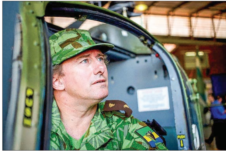
Manchester-born Lee White, a well-known conservationist, has been put in charge of Gabon’s forests.

LIBREVILLE — Here’s your new job: You have to protect the country’s precious tropical forests. You have to stop illegal logging and fight the entrenched corruption backed by powerful forces which goes with it. By the way, you are a committed environmentalist — and you are foreign-born.