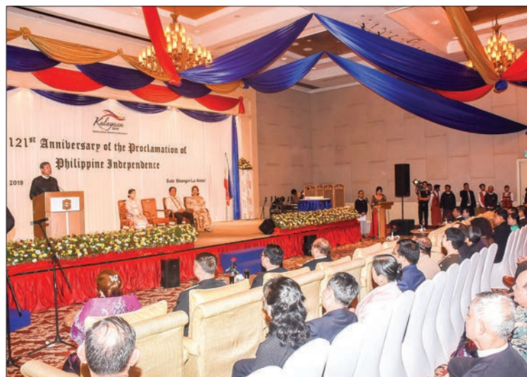
Union Minister Dr. Myo Thein Gyi delivers the speech at the celebration to mark 121st Philippines Independence Day.

The KNU failed to attend the two-day meeting. —Ye Khaung Nyunt ■ (Translated by GNLM)