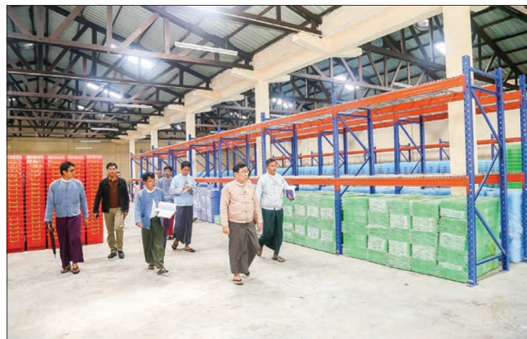
Union Minister Dr. Win Myat Aye inspects Yangon Central Depot at Yangon Region Disaster Management Department yesterday.

UNION Minister for Social Welfare, Relief and Resettlement Dr. Win Myat Aye went to inspect the Yangon Region Disaster Management Department Yangon Central Depot where emergency and relief supplies were stored to respond rapidly whenever disaster occurs.