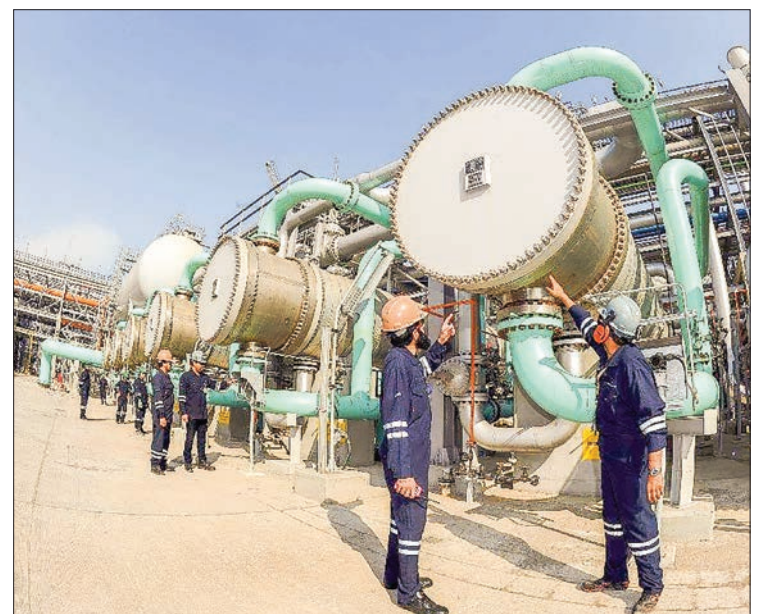
KNPC employees working on the new LPG TRAIN-4 Project at the al-Ahmadi refinery plant complex in Kuwait.

In Asia, the Hong Kong stock market was again on the back foot, losing 0.7 per cent, after the city was rocked this week by violent protests against government plans for a law that would allow extraditions to China and which observers warn could erode its attraction for businesses.—AFP ■