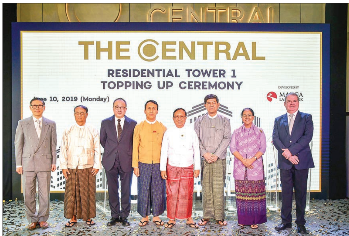
Dignitaries attend the ceremony to mark completion of building work for Residential Tower-1 in Yangon on 10 June.