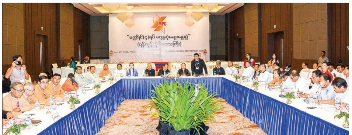
The meeting of four pillars organized by Myanmar Press Council (MPC) in progress in Yangon yesterday.

MPC had held meetings of four pillars three times in Nay Pyi Taw and nine times in nine states and regions and this is the thirteenth time such meeting was being held it is learnt.—Min Thit (MNA) ■ (Translated by Zaw Min)