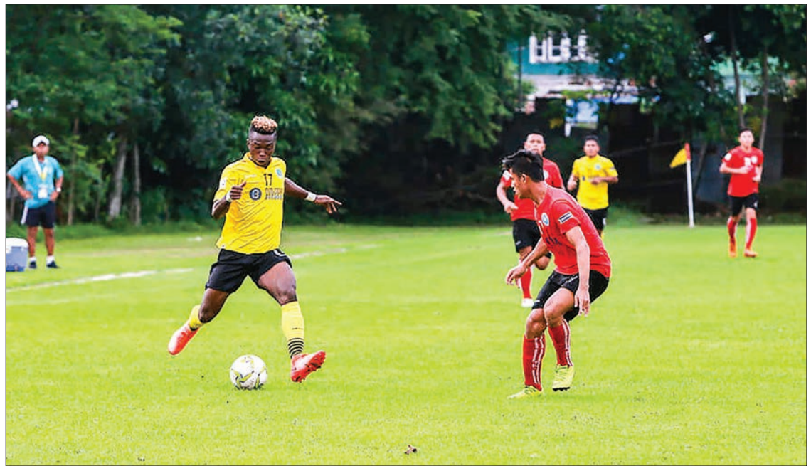
Chin United striker Taylor (yellow) tries to make a pass during the Myanmar National League II match against ISPE F.C. in Yangon yesterday.

At the final whistle, Chin United was leading by two goals.—Lynn Thit (Tgi) ■