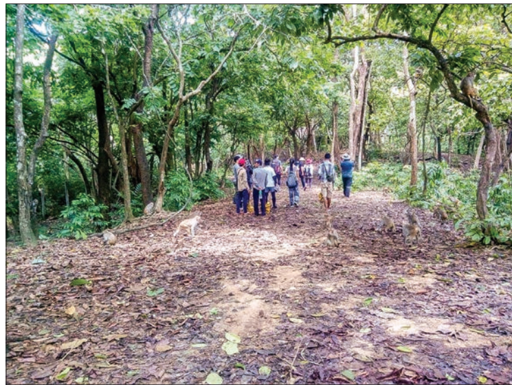
South Korean film crew feeding monkeys in Hlawga National Park in Yangon.