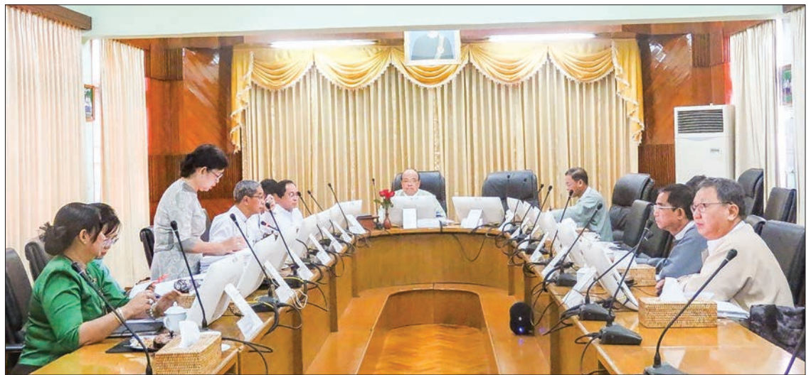
Myanmar Investment Commission holds meeting (9 / 2019) in Yangon.