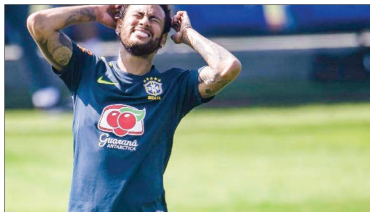
Football superstar Neymar