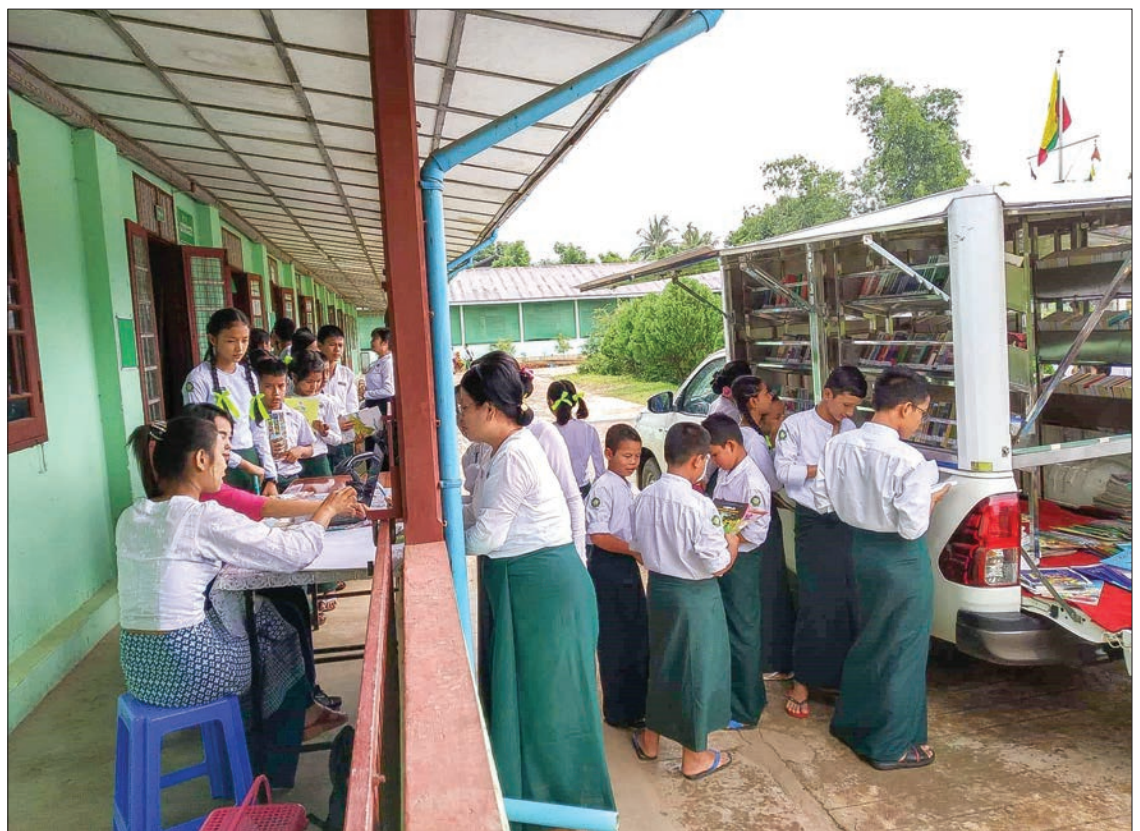
Teachers and students lend books from the mobile library of Daw Khin Kyi Foundation in Mudon.