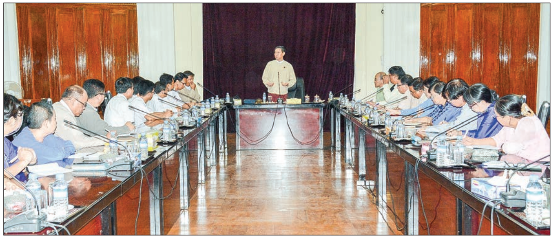
Union Minister Dr. Myo Thein Gyi delivers the speech at the meeting with rectors and professors from universities in Yangon yesterday.