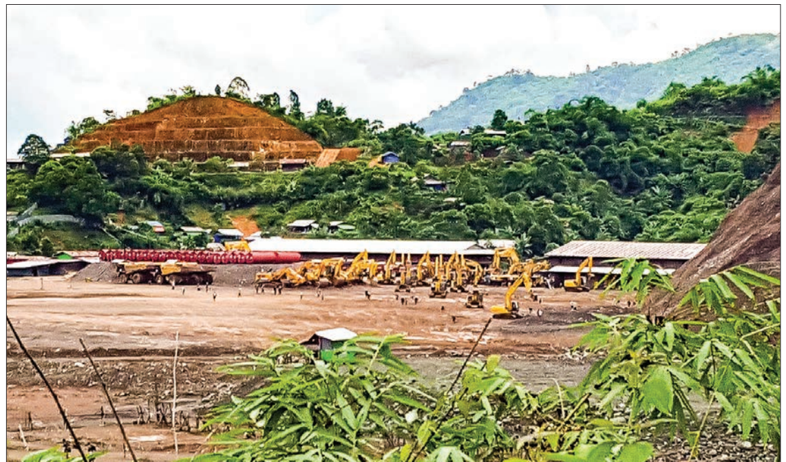
Phakant jade mining area in Kachin State.

The main dangers posed by jade mining during the rainy season include landslides, mudslides, flowing of waste soil into