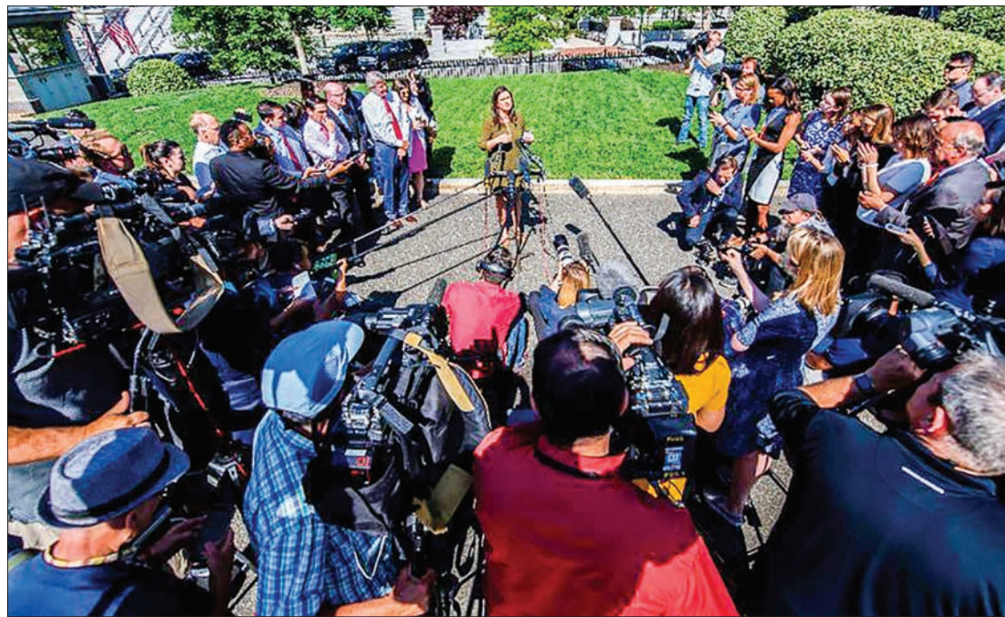
Outgoing White House Press Secretary Sarah Sanders says she loved her job, but she has been widely criticized for halting the long-established daily briefings.