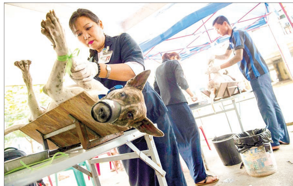
Veterinarians vaccinate and neuter stray dogs in Yangon.

Human rabies vaccines exist for pre-exposure immunization. These are recommended for people in certain high-risk occupations such as laboratory