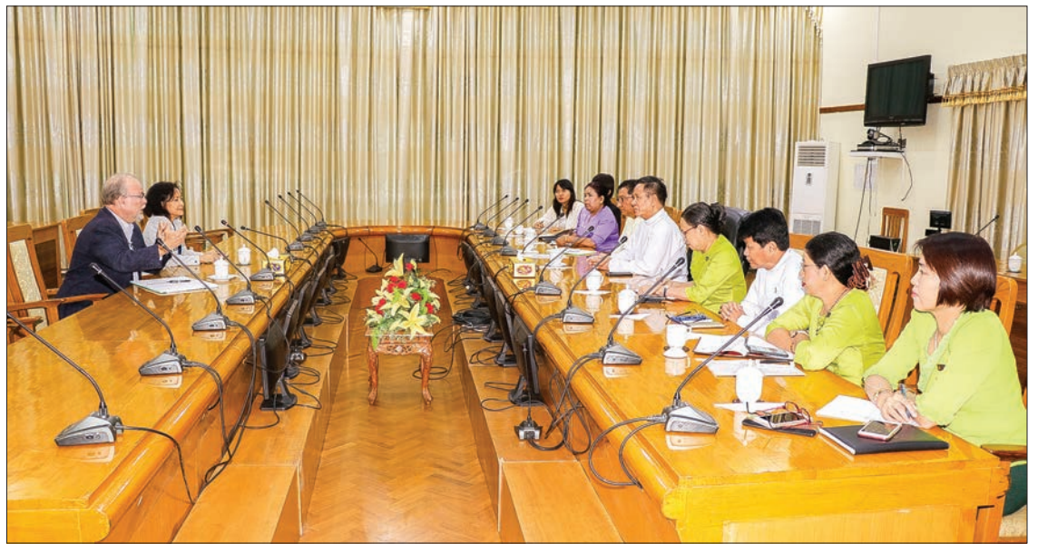
Deputy Minister U Aung Htoo holds talks with USPTO delegation led by Ms. Kitisri Sukhapinda, the Intellectual Property Attaché for Southeast Asia yesterday.

Next, the Deputy Minister met with the USPTO delegation led by Ms. Kitisri Sukhapinda, the Intellectual Property Attaché for Southeast Asia. They discussed technological, financial and expert assistance from USPTO on handling the challenges of opening Myanmar's intellectual property office, support for opening front offices and desk offices for the intellectual property office in Yangon and Nay Pyi Taw, establishing a web-