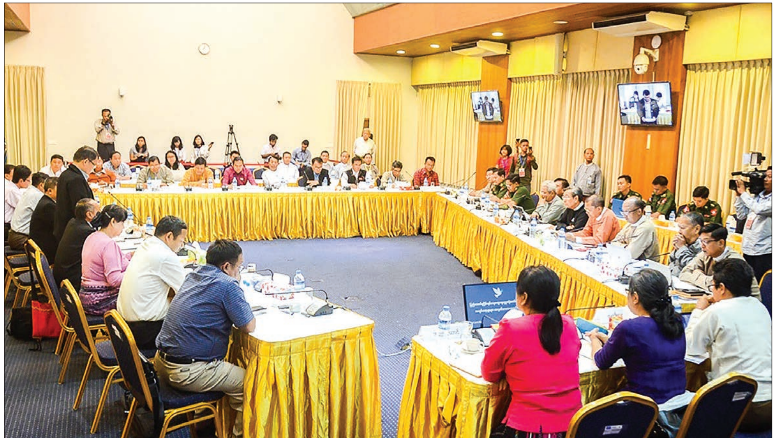
The unofficial meeting between UPDJC and signatories to NCA held.

“Leaders of the stakeholders, especially members of the