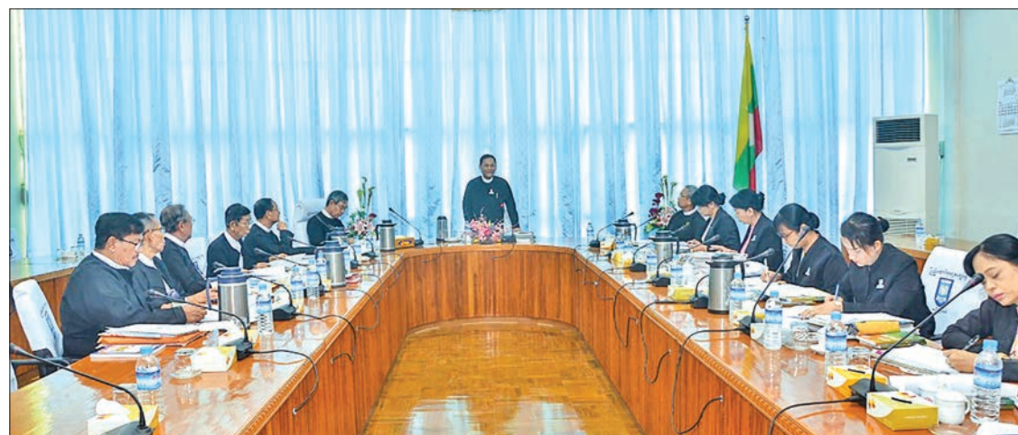
Union Attorney-General U Tun Tun Oo addresses Bar Council meeting 2/2019 in Nay Pyi Taw.

Bar Council Meeting 2/2019 was held in Nay Pyi Taw on 12 June, with an opening remarks by Attorney-General of the Union U Tun Tun Oo.