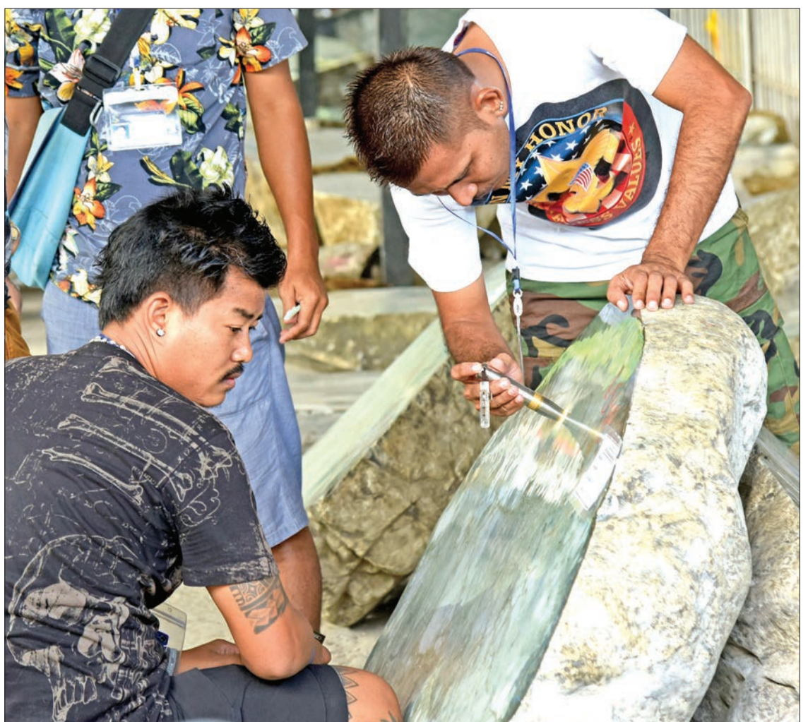
Jade merchants evaluate quality of jade stones at the Myanma Gems Emporium in Nay Pyi Taw.