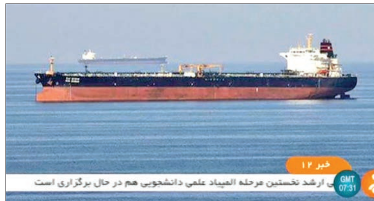
An undated picture obtained by AFP from Iranian State TV IRNN on June 13 reportedly shows the two tankers involved in an incident off the coast of Oman.

It said the vessel is about 70 nautical miles from the United Arab Emirates and just 14 from the coast of Iran.—AFP ■