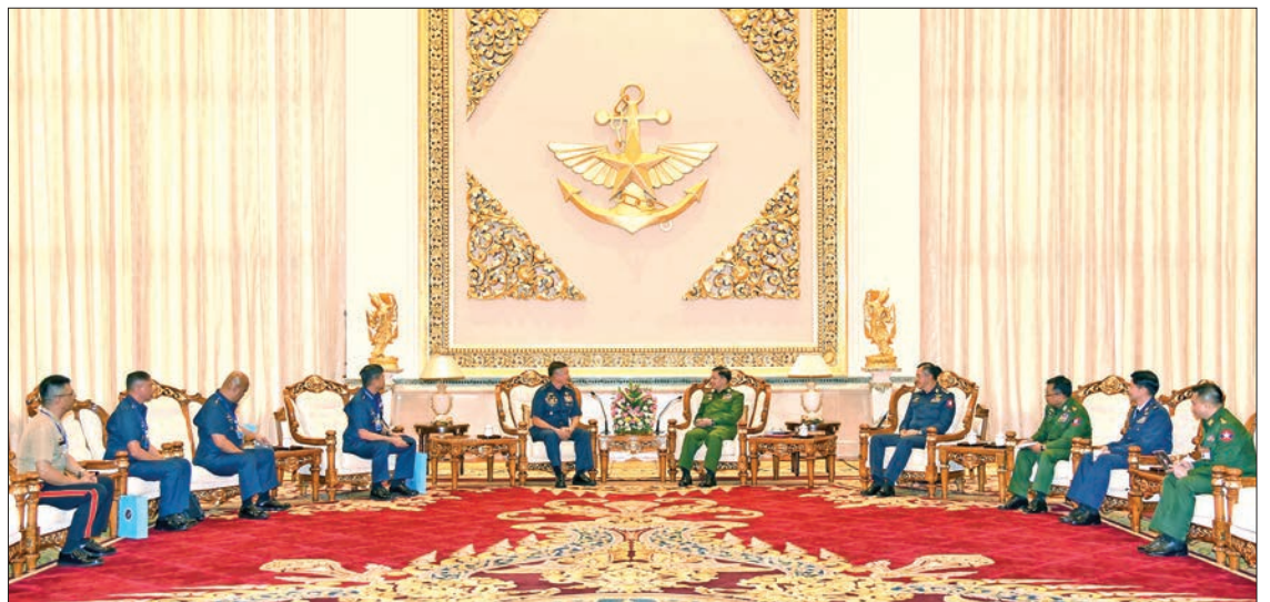
Senior General Min Aung Hlaing, centre Left, holds talks with the Commanding General of the Philippines Air Force, Lt-Gen Rozzanod Briguez, centre Right in Nay Pyi Taw.

At this meeting, matters relating to possibilities for cooperating in Myanmar's internal peace process were discussed according to news released by the Office of the Commander-in-Chief of Defence Services. —MNA