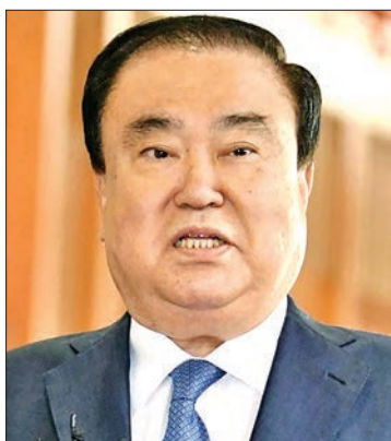
South Korea’s National Assembly Speaker Moon Hee Sang.

In interviews with several South Korean media organizations reported in mid-February, Moon doubled down on his demand for an apology from the