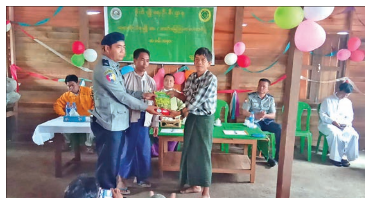
Officials distribute the seedlings to a farmer in Falam, Chin State.

TO encourage farmers to switch from growing opium, officials from the Township Agriculture