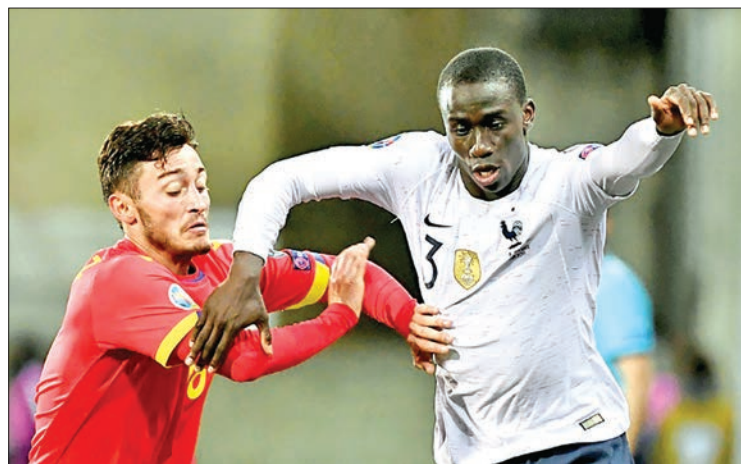
Mendy has signed a six-year contract with Madrid, who have now added four new players for next season following the arrivals of Eder Militao, Eden Hazard and Luka Jovic.

Mendy enjoyed an impressive campaign last year, playing 30 Ligue 1 matches for Lyon and helping the French side reach the Champions League round of 16. He also was handed his first call-up to the France squad in November. —AFP ■