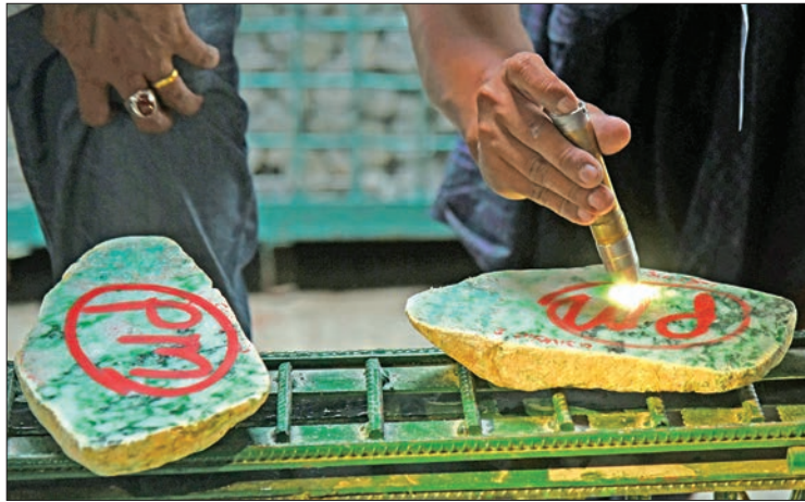
Jade stones are appraised at the Myanma Gems Emporium.