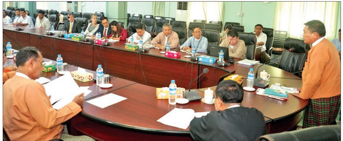
Bago Region Chief Minister U Win Thein delivers the speech at the meeting on manufacturing value-added bamboo products in Bago on 12 June. PHOTO: HEIN HTET (BAGO)

At the meeting, Chief Minister U Win Thein lauded the joint efforts made by the Myanmar Rattan and Bamboo Entrepreneurs Association and locals for manufacturing value-added bamboo products in Zaungtu area. He also urged residents to help preserve the ecosystem and par-