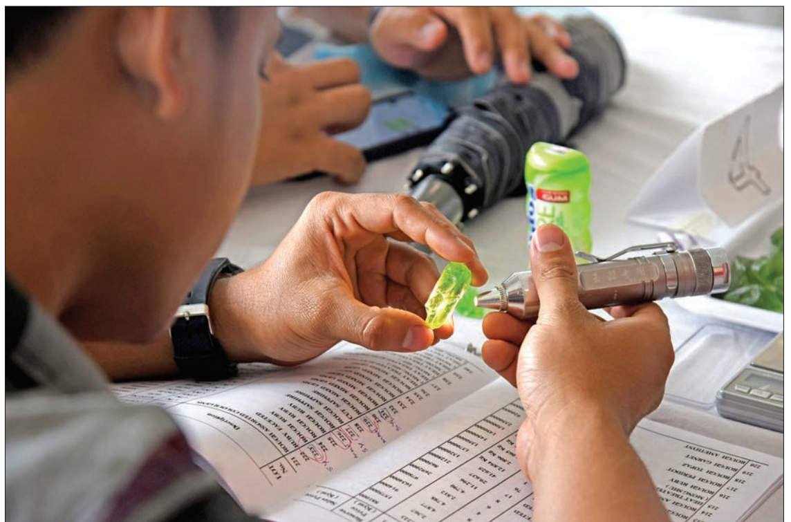
A gemstone is appraised at the Myanma Gems Emporium in Nay Pyi Taw.