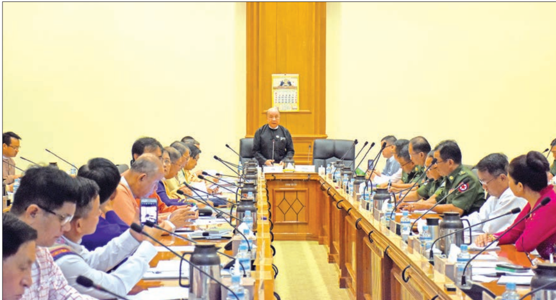
Deputy Speaker U Tun Tun Hein delivers the speech at the Meeting 21/2019 of the Joint Committee on amending 2008 Constitution in Nay Pyi Taw yesterday.

MEETING 21/2019 of the Joint Committee on amending 2008 Constitution was held at Pyidaungsu Hluttaw Building D in Nay Pyi Taw yesterday.