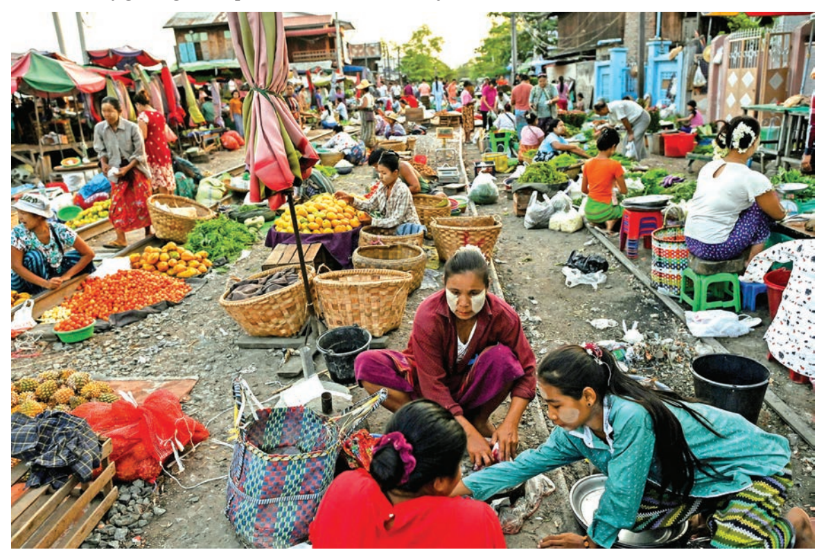
Plastic bags are popularly used by local people for shopping purposes.

The Global New Light of Myanmar is accepting submissions of poetry, opinion, articles, essays and short stories from young people for its weekly Sunday Next Generation Platform. Interested candidates can send their work to the Global New Light of Myanmar at No.150, Nga Htat Kyee Pagoda Road, Bahan Township, Yangon, in person, or by email to ce@globalnewlightofmyanmar.com with the following information: (1) Sector you wish to be included in (poetry, opinion, etc.), (2) Own name and (if different) your penname, (3) Your level of education, (4) Name of your School/College/University, (5) A written note of declaration that the submitted piece is your original work and has not been submitted to any other news or magazine publishing houses, (6) A color photo of the submitter, (7) Copy of your NRC card, (8) Contact information (email address, mobile number, etc.). - Editorial Department, The Global New Light of Myanmar