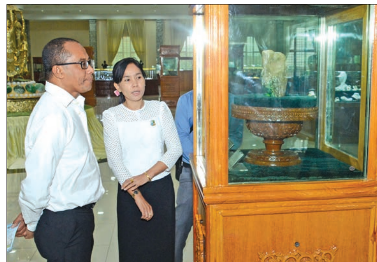
The Foreign Minister of Timor-Leste observes a raw jade stone at the Gems Museum in Nay Pyi Taw.

eign Minister and delegation departed from Nay Pyi Taw International Airport to Bang-