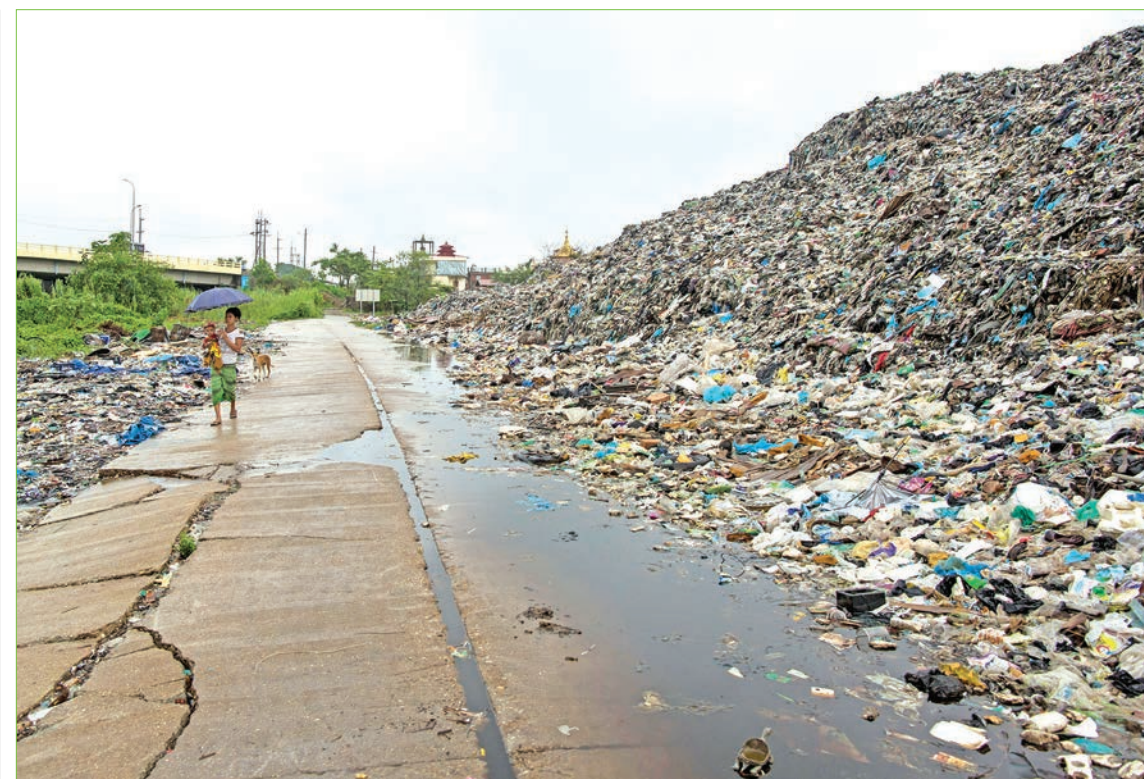
The problem of plastic waste pollution has gotten more serious.

It is dangerous to assume that the Earth would replenish the resources at a rate (or even faster) than we are using it. Hence, these resources are only sustainable with the help, care and cooperation of the people who are living on this planet.