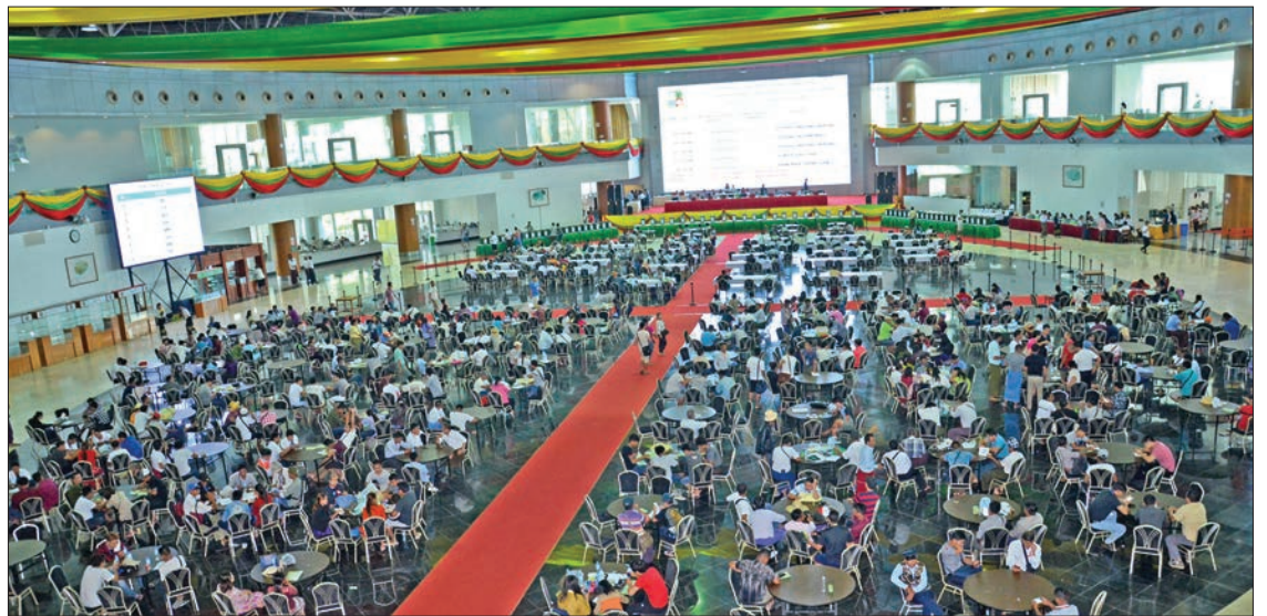
Merchants appraising gemstones at Myanma Gems Emporium on 11 June 2019 in Nay Pyi Taw.