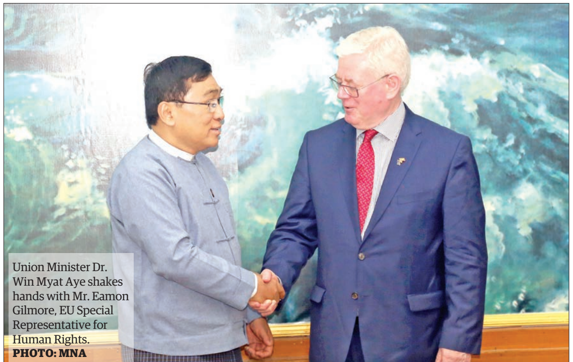
Union Minister Dr. Win Myat Aye shakes hands with Mr. Eamon Gilmore, EU Special Representative for Human Rights.