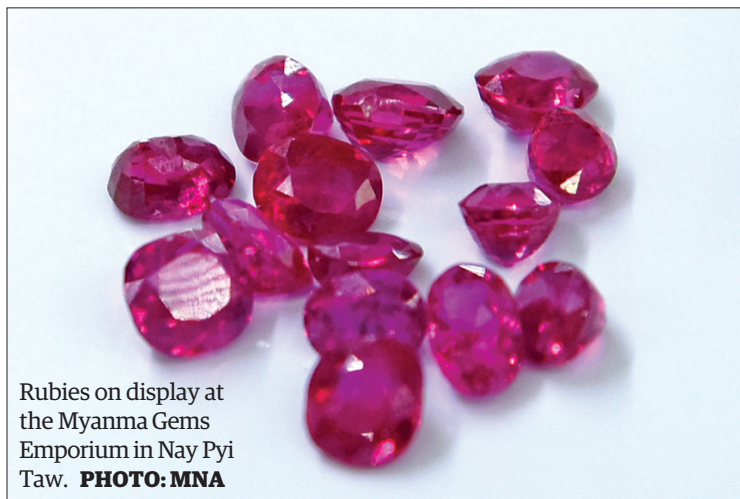
Rubies on display at the Myanma Gems Emporium in Nay Pyi Taw.