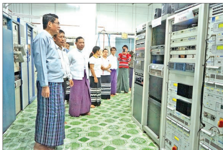
Deputy Minister U Aung Hla Tun inspects broadcasting equipment inside the TV retransmission station of Pyay District yesterday.

U Aung Hla Tun, Deputy Minister for Information, inspected the TV retransmission tower in Pyay and the Information and Public Relations Departments (IPRD) of Pyay and Thayawady districts yesterday.