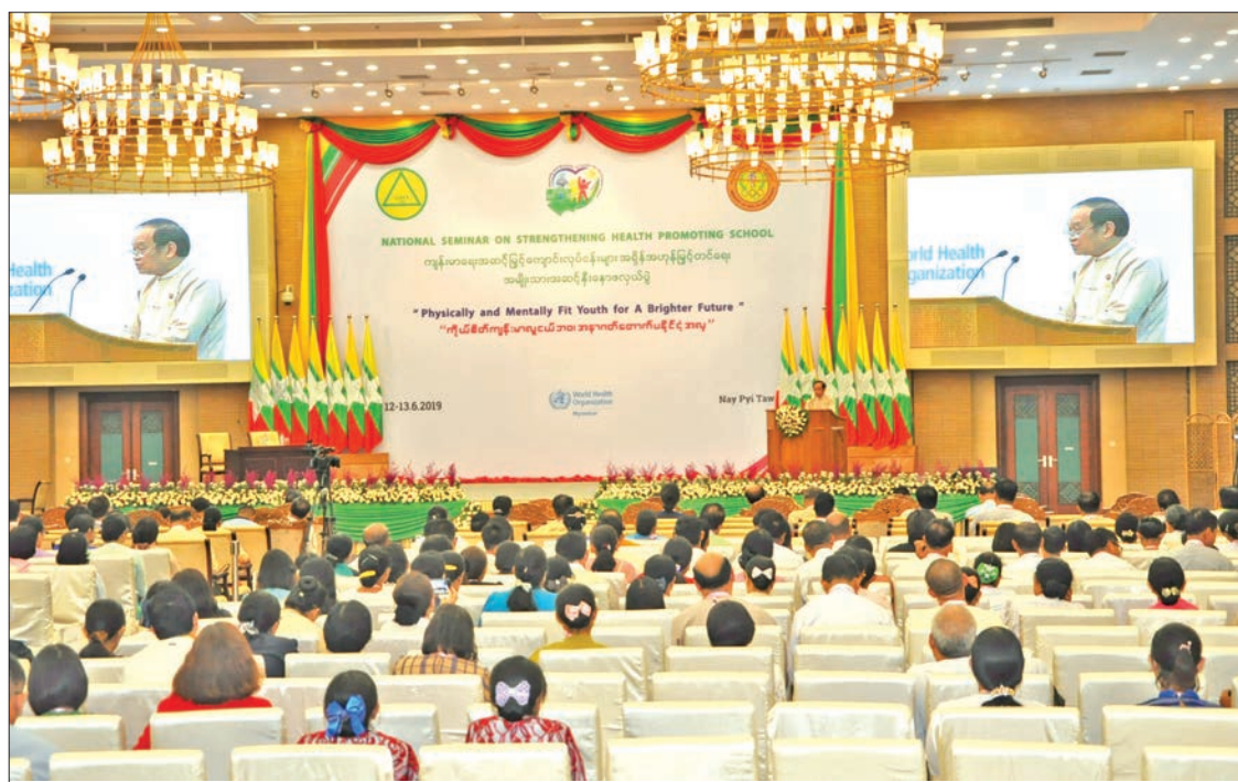
Union Minister Dr. Myint Htwe delivers the conclusion speech at the health promotion school seminar in Nay Pyi Taw.

Union Minister for Education Dr. Myo Thein Gyi delivered key note speech at the closing ceremony of the seminar in the evening. Similarly, Union Minis-