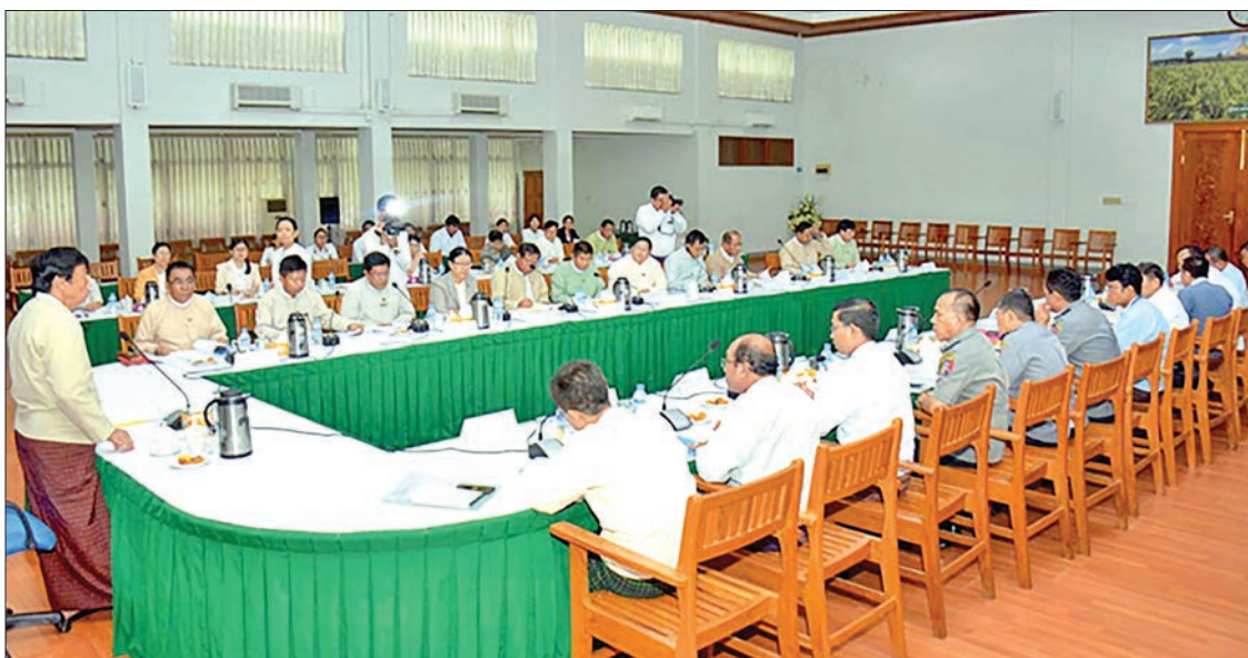
Committee Chairman Deputy Minister U Hla Kyaw delivers the opening speech at the Central Committee for Organizing BIMSTEC Meetings in Nay Pyi Taw yesterday.

Republic of the Union of Myanmar Union Election Commission Notification 88/2019 11 th Waxing of Nayon, 1381 ME 13 June, 2019