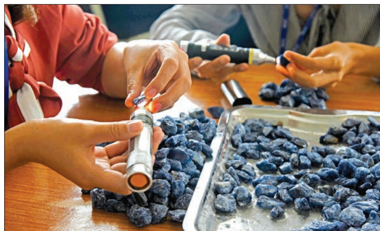
Merchants checking quality of jade stones at the Myanma Gems Emporium in Nay Pyi Taw.