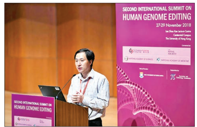
Chinese scientist He Jiankui sparked an international outcry after claiming to have altered the genes of babies.

The government can stop work carried out without proper authorisation and confiscate genetic materials.