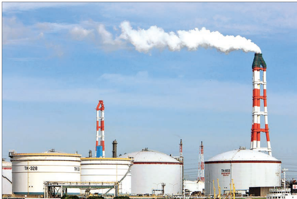
Exhaust billows out of a chimney at an oil refinery in Kamisu city, Ibaraki prefecture, Japan.