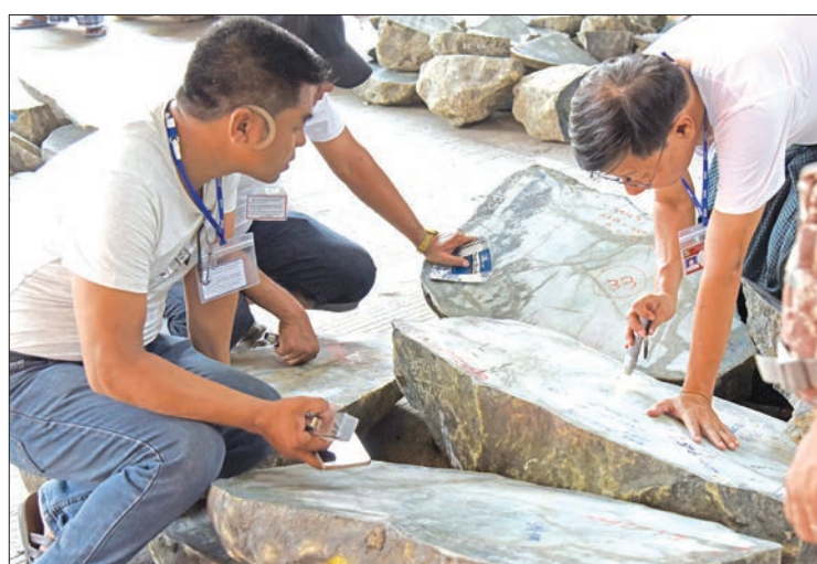
Jade merchants checking quality of jade stones at the Myanma Gems Emporium in Nay Pyi Taw.