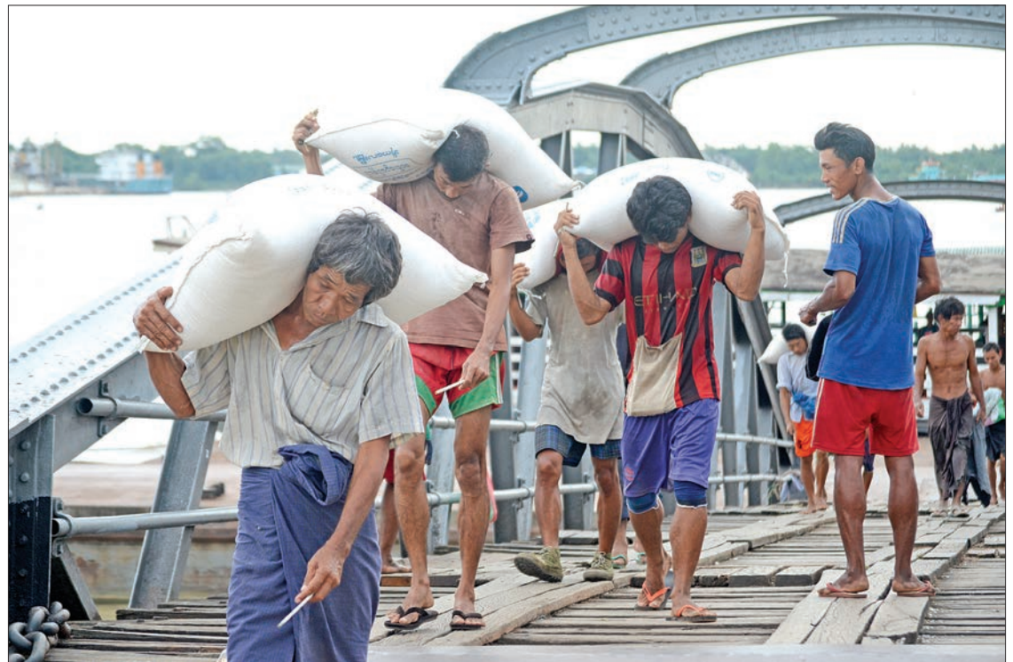
Workers unloading sacks of rice from a cargo ship at Botahtaung Jetty in Yangon.