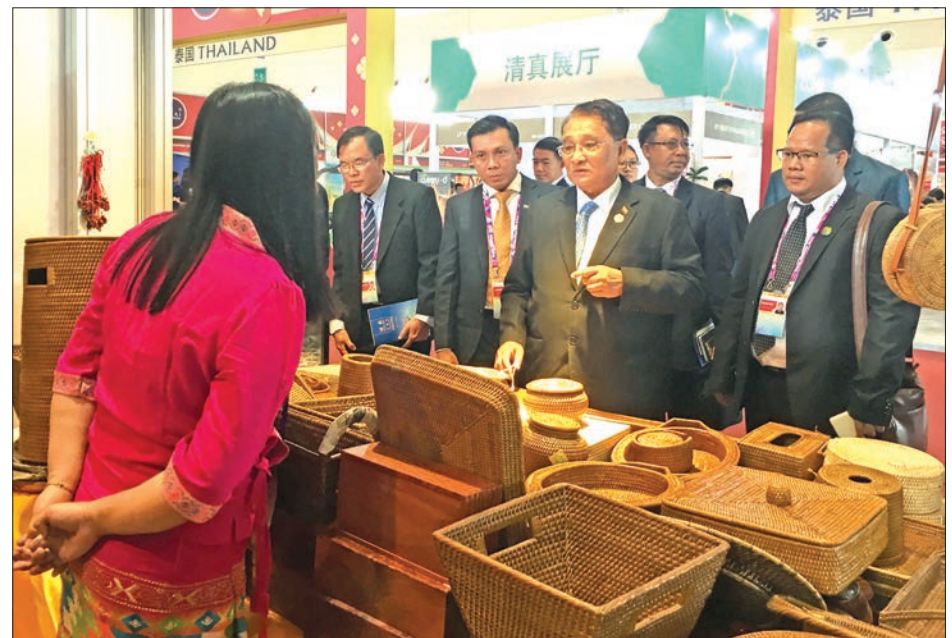
Union Minister Dr. Than Myint inspects a Myanmar booth showcasing wicker products at a commodity expo in Kunming, China.

An agreement worth nearly US$5 million on trading some 500 tons of