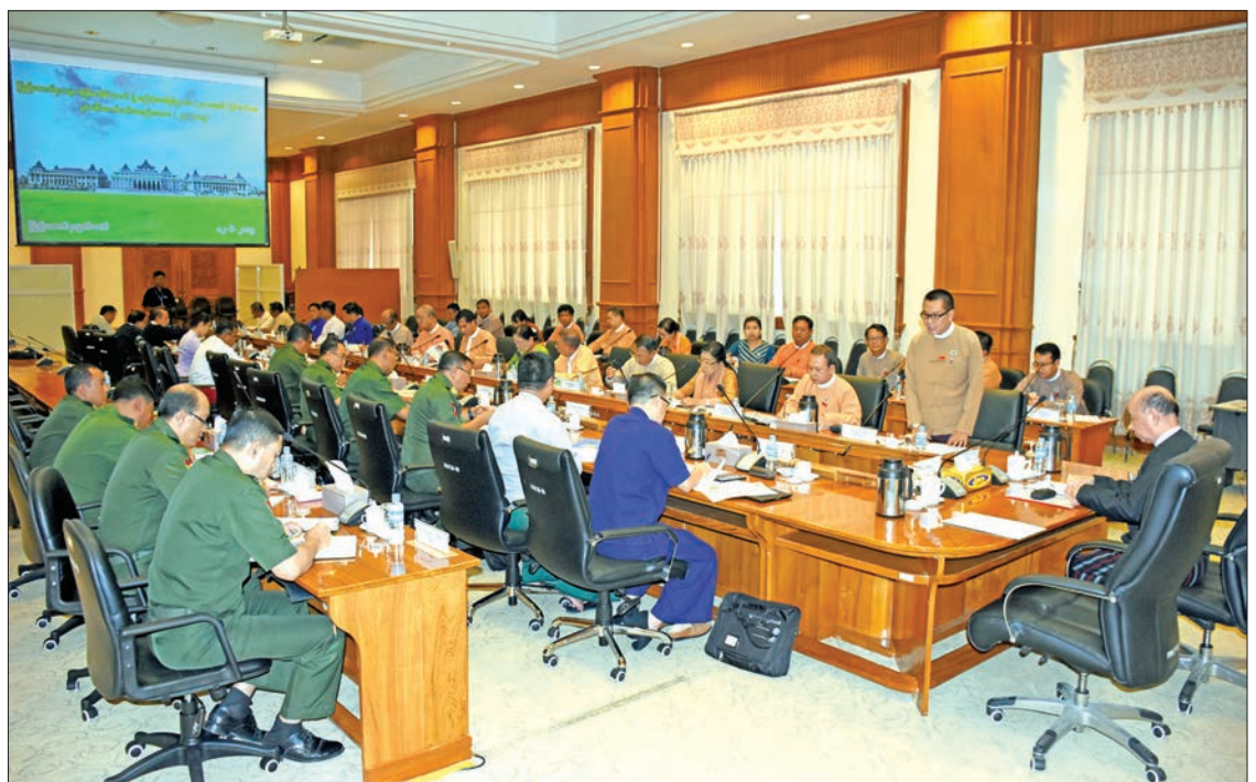
The meeting 20/2019 of Joint Committee on Amending 2008 Constitution held in progress. PHOTO: