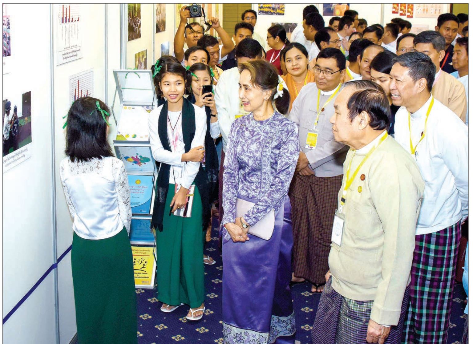
State Counsellor Daw Aung San Suu Kyi warmly greets children as she visits booths set up at the National Seminar on Strengthening Health Promoting School held in Nay Pyi Taw yesterday.

The State Counsellor expressed hope that everyone responsible for practically implementing the results of this seminar, especially the education ministry, will carry out their tasks with dedication.