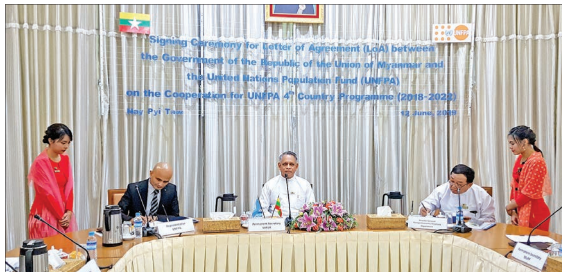
A signing ceremony for Letter of Agreement (LoA) on the cooperation for UNFPA 4 th Country Programme (2018-2022) between government and UNFPA held in Nay Pyi Taw on 12 June 2019.

and the 3 rd UNFPA program of assistance to Myanmar (2012-2017) with US$ 37.5 million were implemented in the areas of sexual and reproductive health, gender equality and women's empowerment and population dynamics.—MNA ■