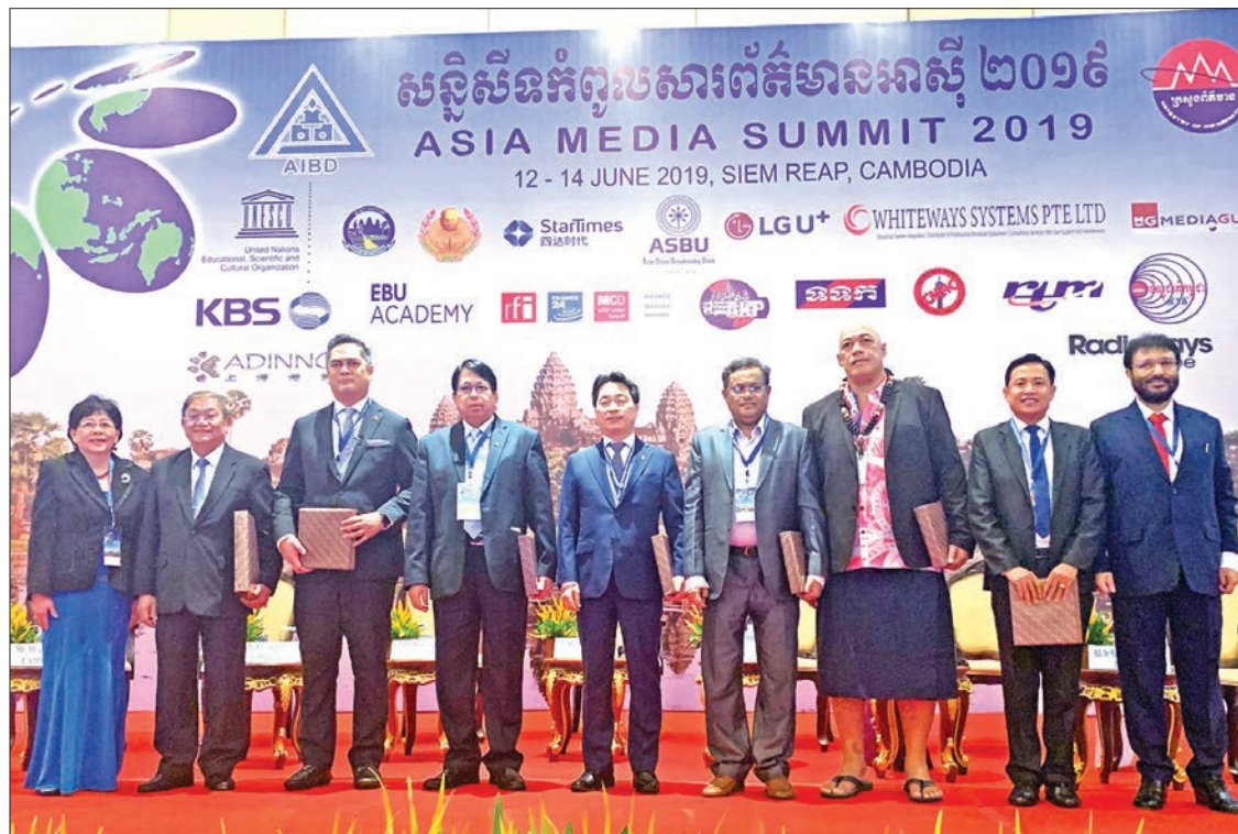
Union Minister Dr. Pe Myint and Ministers from other countries pose for a photograph at the opening ceremony of the 16 th Asia Media Summit in Siem Reap, Cambodia, on 12 June 2019.

UNION MINISTER for Information Dr. Pe Myint led a delegation to attend the 16 th Asia Media Summit in Siem Reap, Cambodia, and attended the opening ceremony yesterday.