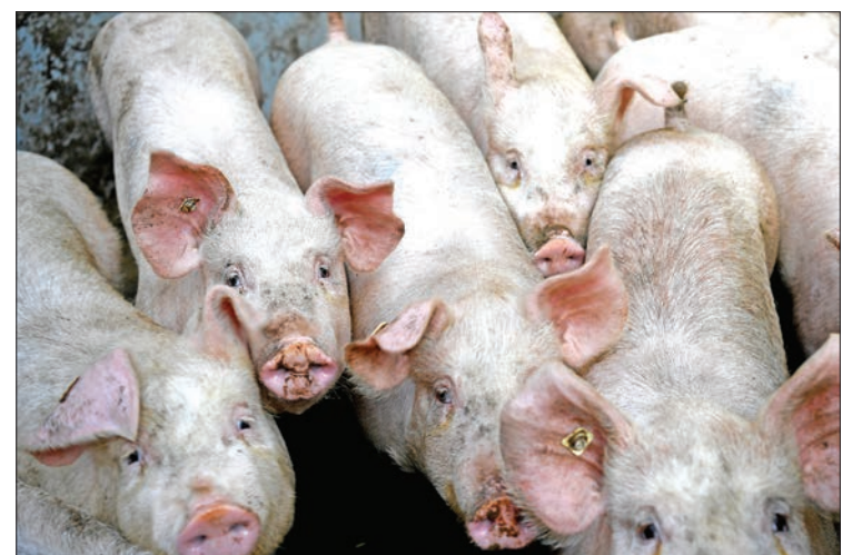
African swine fever, fatal to wild boar and pigs but harmless to humans, has cut a swathe through China, Vietnam and Mongolia.

The outbreak could worsen food shortages in the impoverished North, where food production has hit the lowest level since 2008, according to the World Food Programme. —AFP ■