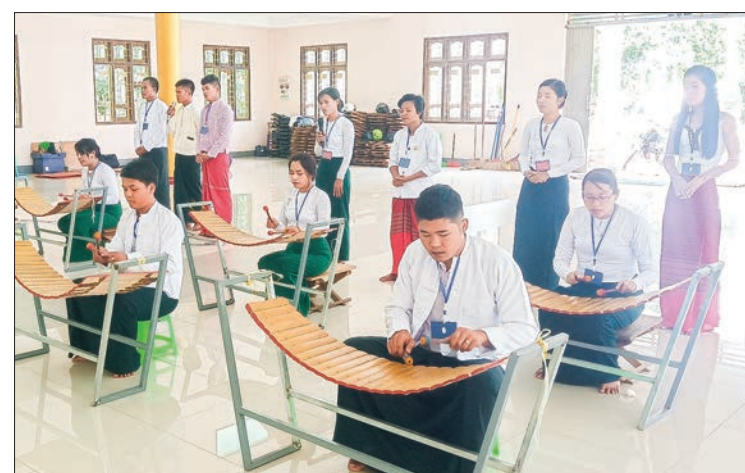
Trainees give classical music performance with bamboo xylophones in Kyaikto, Mon State.