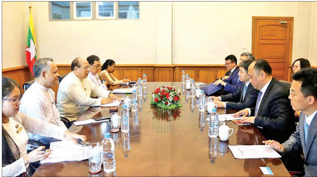
Union Minister U Thaung Tun holds talks with a delegation led by Assistant Minister for Ministry of Commerce of People's Republic of China in Nay Pyi Taw.

UNION Minister for Investment and Foreign Economic Relations, H.E. U Thaung Tun received the delegation led by Mr. Li Chenggang, Assistant Minister for Ministry