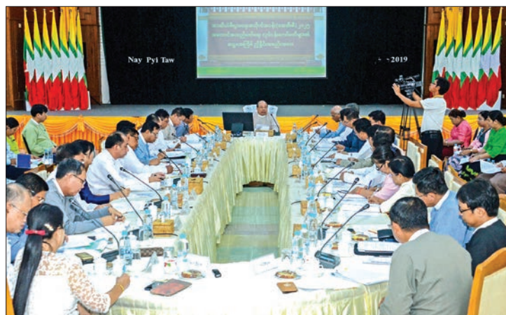
Union Minister U Thaung Tun attends the sixth coordination meeting on ASEAN Economic Community (AEC) 2025 implementation meeting in Nay Pyi Taw yesterday.

The Minister recalled that ASEAN had identified the priority measures for the implementation of AEC 2025, and that 170 Measure had been earmarked for 2019 for ASEAN as a whole.