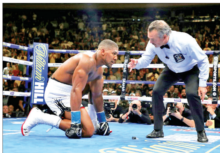
Anthony Joshua suffered a shock defeat to Andy Ruiz Jr.

"Boxing isn't rocket science and today people are trying to make it a scientist thing. If you can fight you can fight, if you can't you can forget about it." —AFP ■