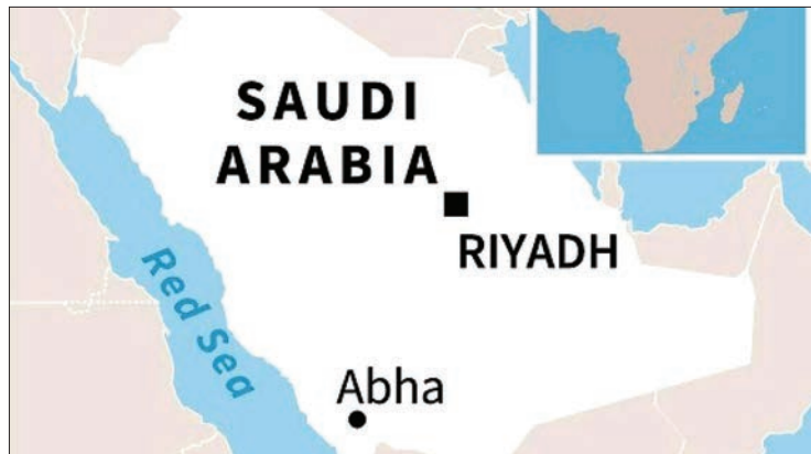
Saudi Arabia Map locating Abha, in Saudi Arabia, where 26 people were wounded in a rebel attack on the airport.

The missile caused some damage to the airport’s arrivals lounge and flights were disrupted for several hours before returning to normal.