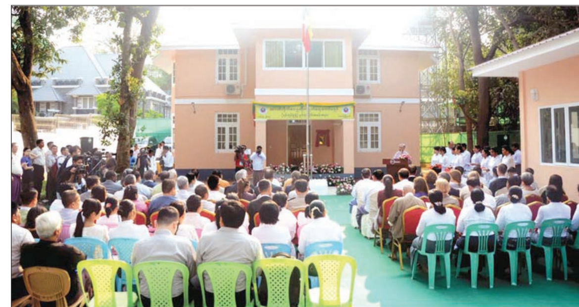
Opening ceremony of the branch office of the ACC on 16 March, 2019.

When a survey concerning bribery to government departments was carried out, the majority of public answer that it was paid because there is no other way to get the job done.