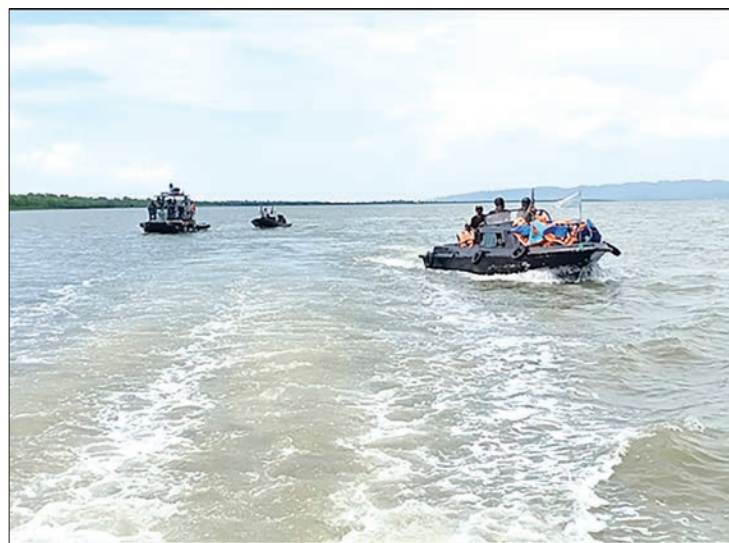
Myanmar Border Police and Border Guards Bangladesh conducting coordinated naval patrols.

MYANMAR and Bangladesh conducted a coordinated naval patrol along the Naf River on 12 June, according to the information released by Myanmar Police Force.