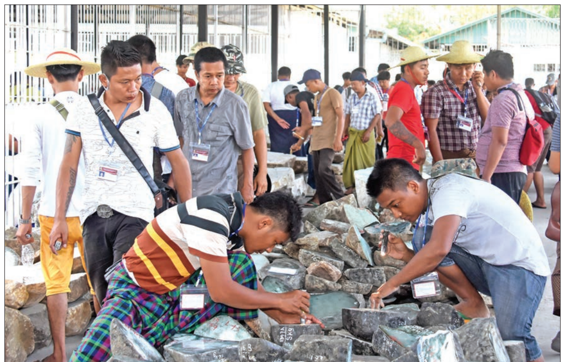
Merchants appraise jade stones at the Myanmar Gems Emporium in Nay Pyi Taw.