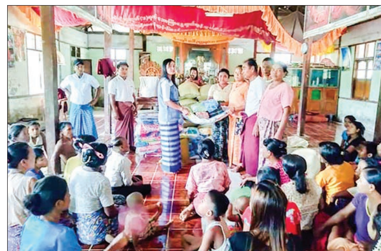
Authorities hand over aid to people in MraukU IDP camp.