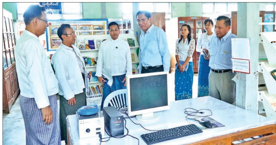
Deputy Minister U Aung Hla Tun inspects the Mini Museum of Minbu IPRD.

DEPUTY Minister for Information U Aung Hla Tun inspected Information and Public Relations Department (IPRD) offices in Magway, Minbu and Aungmyan townships and Minbu