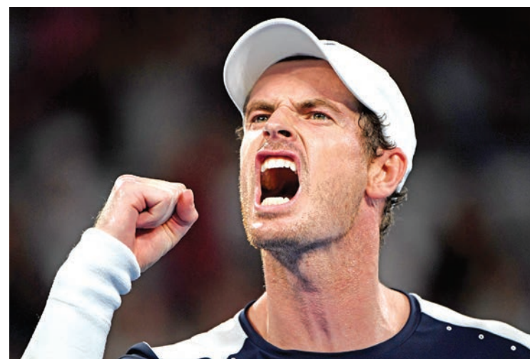
Andy Murray is eyeing a return to singles action.

At the bottom of the table stands Chin Land F.C. with 6 points from one win, three draws, and 10 losses.—Lynn Thit(Tgi) ■