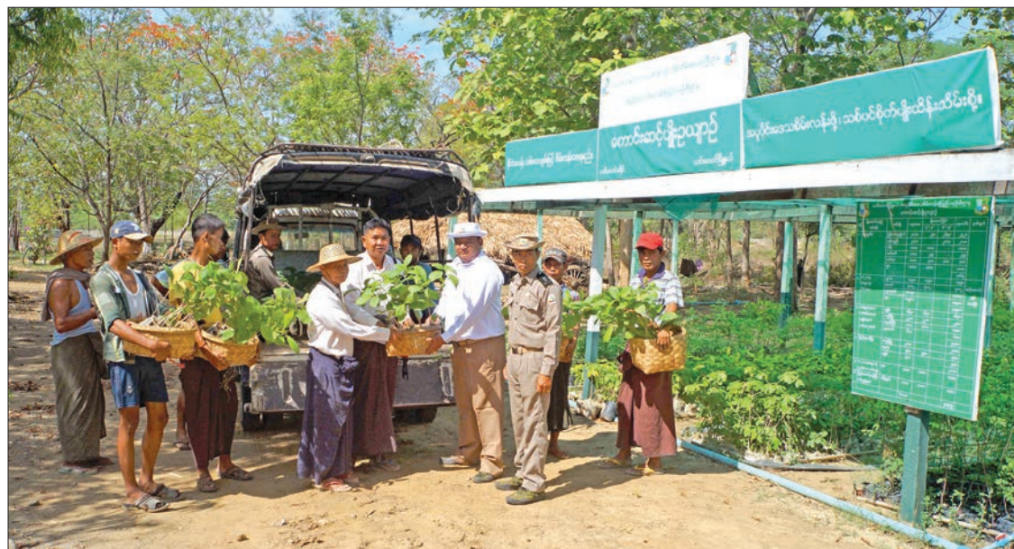
Officials from Dry Zone Greening Department distribute the seedlings to local people in Koneywar village, Yinmabin Township.

THE Dry Zone Greening Department, under the Ministry of Natural Resources and Environmental Conservation, has distributed free seedlings to the residents of Koneywar village, Yinmabin Township, Sagaing Region for plantation, as part of a program with the aim of reducing the destruction of the ecological system and the impact of climate change and global warming.