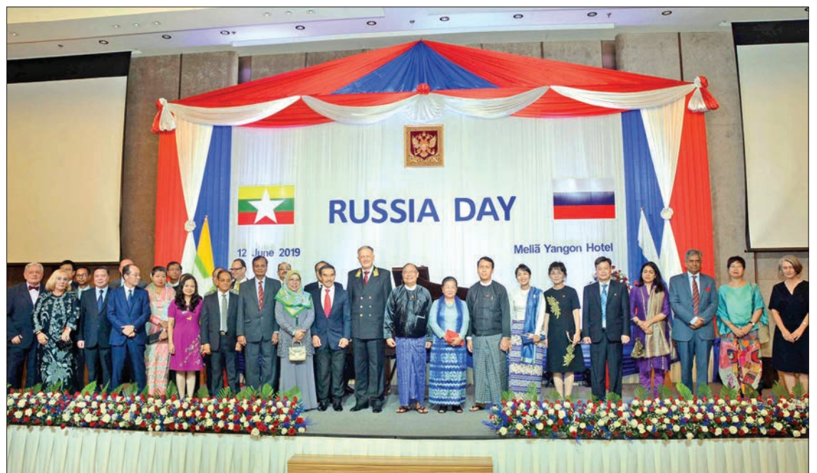
Union Minister U Thant Sin Maung, Russian Ambassador Dr. Nikolay Listopadov pose for a commemorative photograph together with other officials at the National Day ceremony of the Russian Federation.