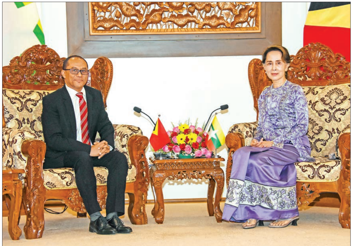
State Counsellor Daw Aung San Suu Kyi meets with Foreign Affairs and Cooperation Minister of Timor-Leste Dionisio da Costa Babo Soares in Nay Pyi Taw yesterday.