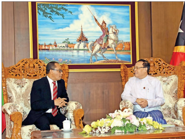
Union Minister U Kyaw Tin meets with Foreign Affairs and Cooperation Minister of Timor-Leste Dionisio da Costa Babo Soares in Nay Pyi Taw.

Present at the meeting were U Kyaw Tin, Union Minister for International Cooperation, Senior Officials from the Ministry of Foreign Affairs, Mr. Joao Freitas de Camara, Ambassador of Timor-Leste to Myanmar and the members of the Timor-Leste del-