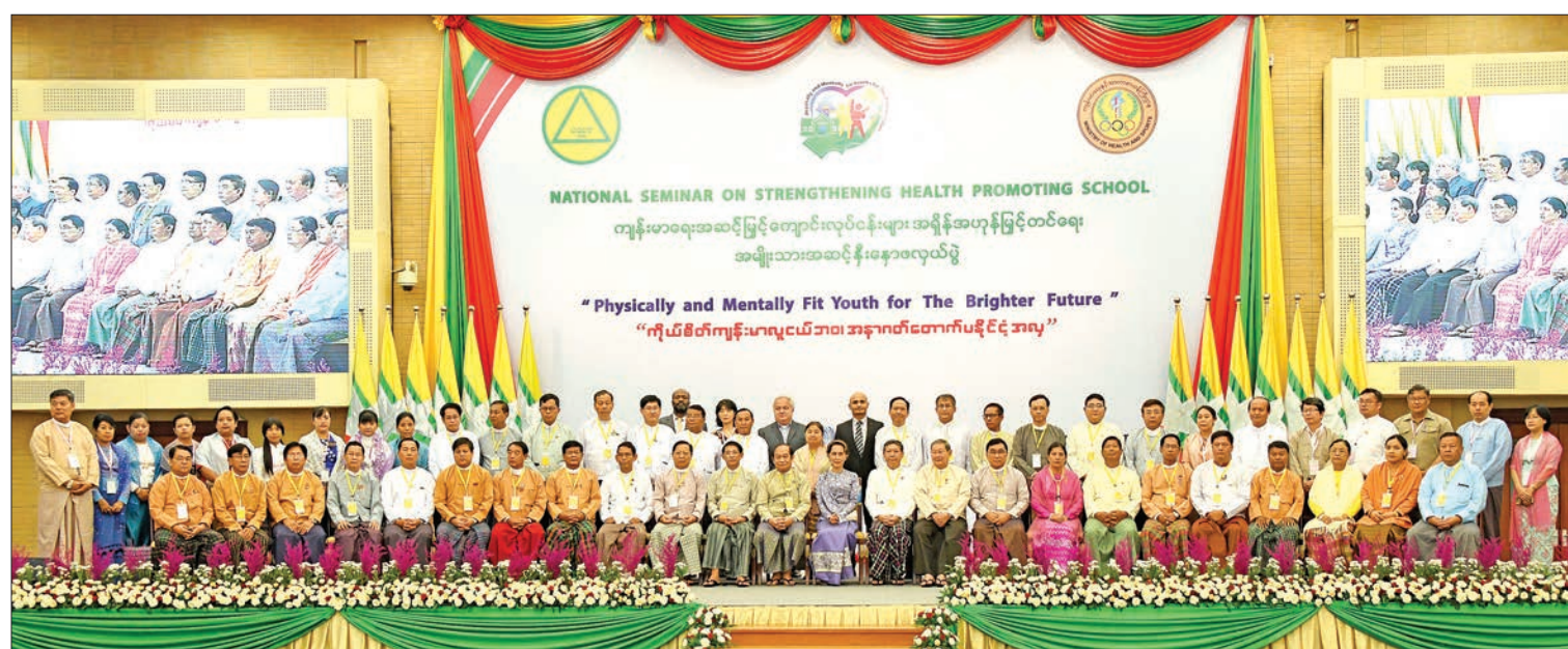
State Counsellor Daw Aung San Suu Kyi poses for the documentary photo together with Union Ministers, diplomats and attendees at the National Seminar on Strengthening Health Promoting School held in Nay Pyi Taw yesterday.

The State Counsellor said the Youth Policy was released in 2017 and drafts for relevant strategies are underway. She said we need to ensure no one gets left behind and strive for the inclusivity of all youths, regardless of whether they are living with disabilities, in remote areas or outside of schools.