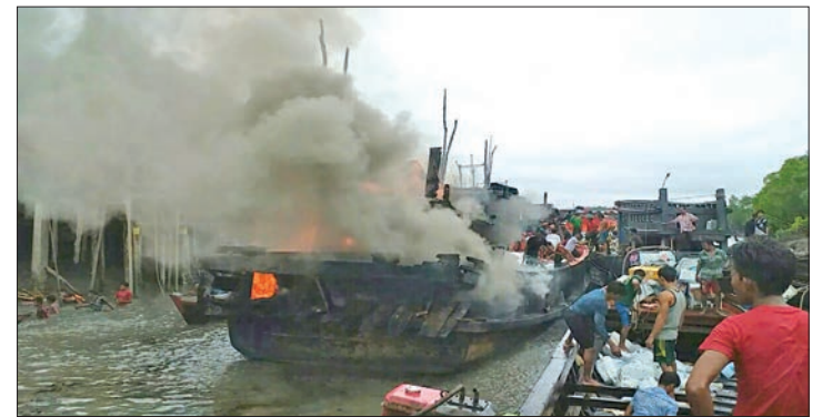
Fire destroys ferry in Kyunsu Township, Myeik on 11 June 2019.

A FIRE broke out on a ferry around 12:45 p.m. on 11 June, while it had halted near the bridge on the Ngamantaung brook in Kyunsu Township, Myeik District, Taninthayi Region for loading goods.