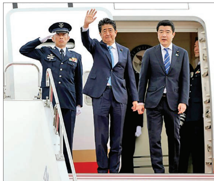
Japanese Prime Minister Shinzo Abe hopes to use Tokyo's longstanding trade ties with Tehran and strategic alliance with Washington to persuade Iranian leaders to calm soaring tensions in the Gulf.

Rouhani on Wednesday, Abe is to meet Iran's supreme leader on Thursday morning.