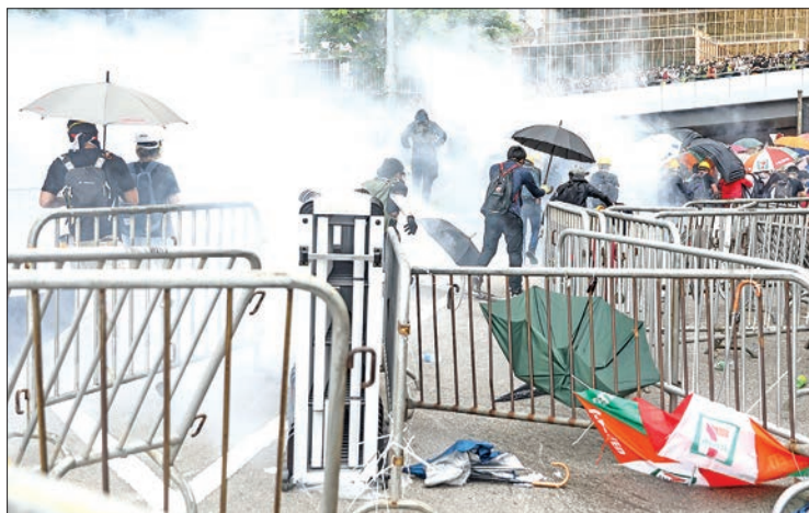
Police used tear gas, pepper spray and batons to break up crowds.

Hong Kong's police chief Stephen Lo defended his officers, saying they had shown restraint until “mobsters” tried to storm parliament. “These violent protesters kept charging at our line of defence, and used very dangerous weapons, including... throwing metal barricades at us and throwing bricks,” he said.