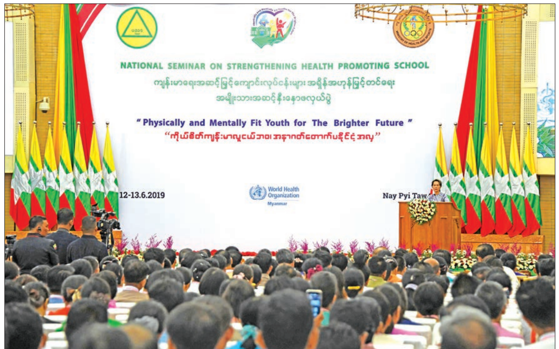
State Counsellor Daw Aung San Suu Kyi delivers the opening speech at the National Seminar on Strengthening Health Promoting School held in Nay Pyi Taw yesterday.

Social studies is an important lesson for students who spend most of their time within school buildings and the subject, having