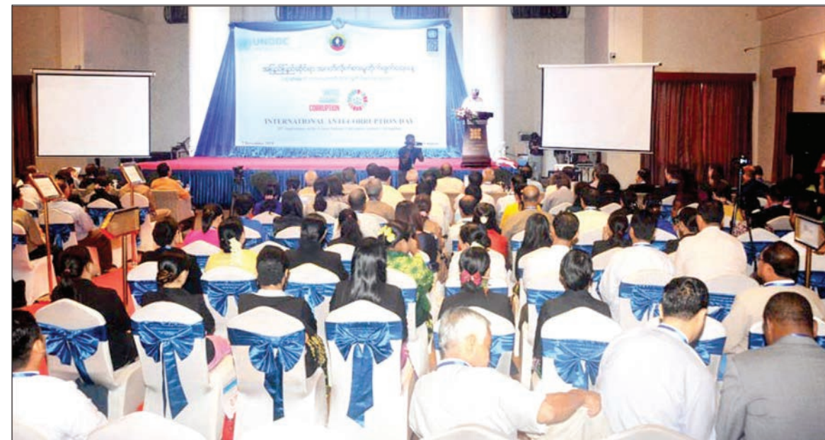
Anti-Corruption Commission chairman U Aung Kyi delivers a speech at an event to mark International Anti-Corruption Day in Yangon on Dec. 9, 2018.

money, 90 percent of respondents said "business as usual".