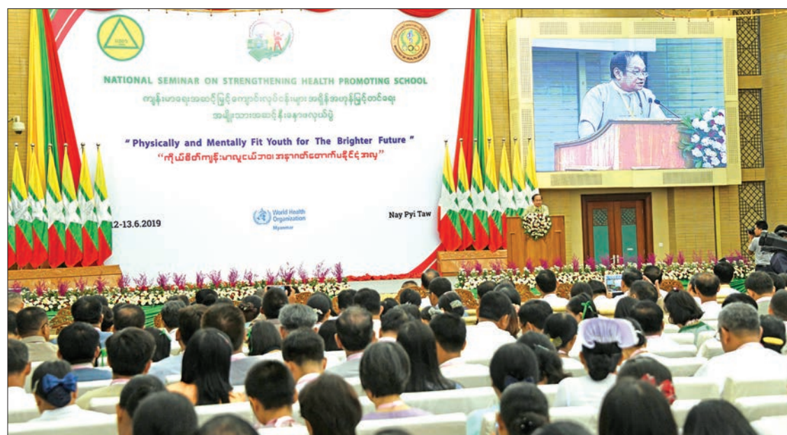
Union Minister Dr. Myint Htwe gives speech at the National Seminar on Strengthening Health Promoting School held in Nay Pyi Taw yesterday.

NATIONAL Seminar on Strengthening Health Promotion School titled “Physically and Mentally Fit Youth for the Brighter Future” was held at the Myanmar International Convention Centre-II in Nay Pyi Taw yesterday.