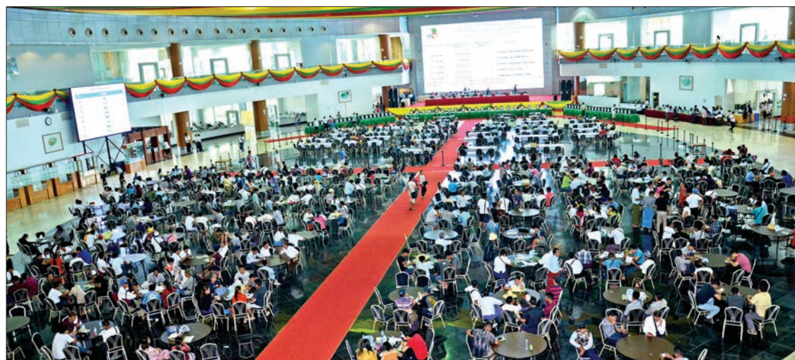
Fourth day of the Gems Emporium, focused on the selling of raw gemstones and jade stones, continued at the Mani Yadana Jade Hall in Nay Pyi Taw yesterday.