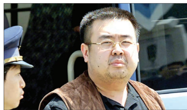
Kim Jong Nam apparently fell from grace after being deported from Japan in 2001 for trying to enter on a forged passport to visit Disneyland.

Malaysian prosecutors eventually dropped the murder charges against them and Indonesian Siti Aisyah was released in March this year while her Vietnamese co-accused Doan Thi Huong was freed in May. South Korea has accused the North of ordering the hit, which Pyongyang denies. —AFP ■