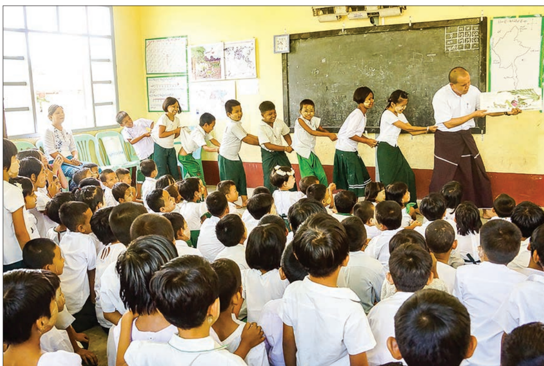
In the left picture, a teacher acts out the story of cooperation between forest friends, borrowed from the mobile library organized by the Information and Public Relations Department and Shanti Volunteer Association, with students while in the right picture, a teacher recites a story from a book also borrowed from the mobile library.

TO DEVELOP the love for literature and books in rural youth and students mobile library activities were carried out at Thittaw Basic Education Primary school in Ottwin Township, Toungoo District, Hinn Gout Pin High School and two schools in Htantabin Township yesterday morning.