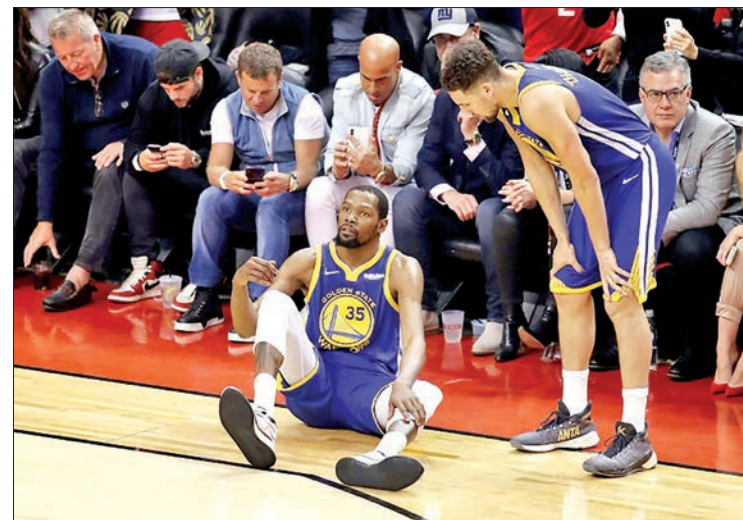
Golden State's Kevin Durant sits on the floor after injuring his right Achilles tendon in the second quarter of the Warriors' NBA Finals triumph Monday over Toronto.

"You think of him every time you dive for a loose ball or go for a rebound, because I know him and I know how bad he wants to be out there. That's why he was out there. It sucks.— AFP ■