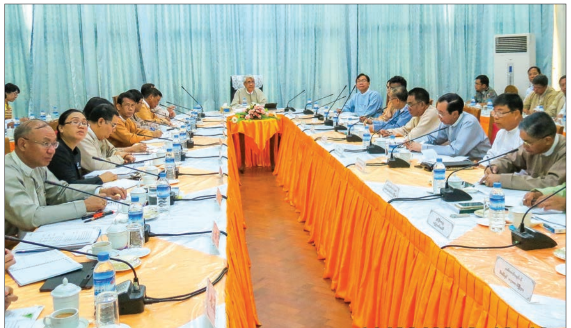
Deputy Minister U Kyaw Myo and officials hold a coordination meeting to implement a Radio Frequency Identification (RFID) system at the Ministry of Transport and Communications yesterday.