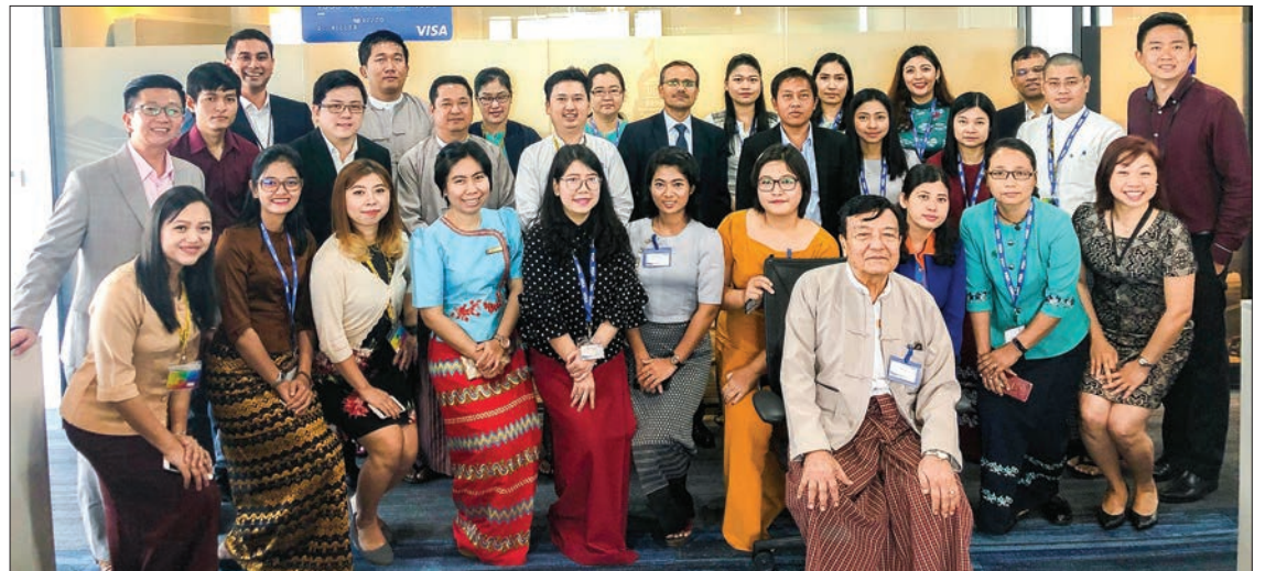
Officials and staff pose for documentary Photo.

The increases correspond to the growing number of merchants that accept digital payments, which has risen by 30 per