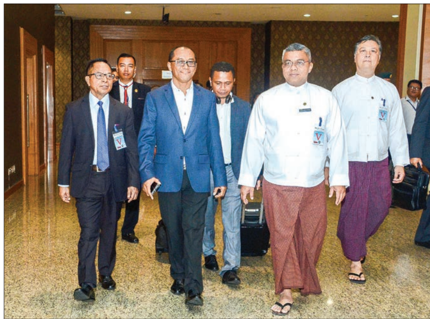
Foreign Affairs and Cooperation Minister of Timor-Leste Dionisio da Costa Babo Soares arrives at Nay Pyi Taw International Airport in Nay Pyi Taw yesterday.

The delegation was welcomed at the Nay Pyi Taw International Airport by officials of the Ministry of Foreign Affairs, Ambassador of Timor-Leste Mr. Joao Freitas de Camara and diplomats from the Embassy of Timor-Leste. —MNA