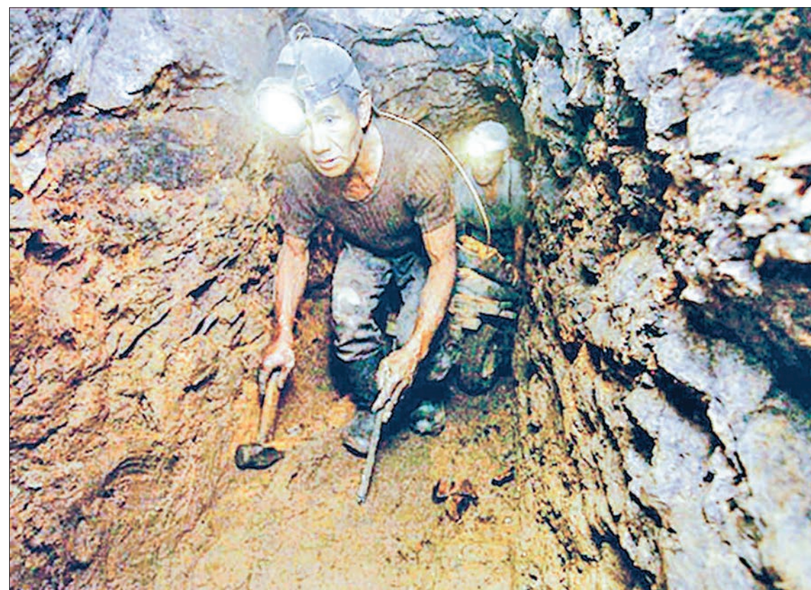
Mining can be costly in terms of lives.

(2) Due to harsh weather and the other three main forces that cause erosion of 84 per cent