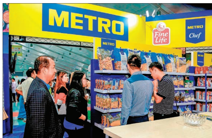
Visitors to METRO booth in FHMM 2019.

METRO "deliver foods directly from farm to fork" and aims to help improve agriculture sector of Myanmar by buying directly from farmers for its B2B customers. Farmers benefit more from the optimized and efficient supply chain while its B2B customers enjoy premium freshness of the products as well. As the ultimate purpose is to be the "Champion for independent Business", METRO Wholesale Myanmar serves independent business people with differentiated and exclusive food assortment, services and solutions. —GLLM