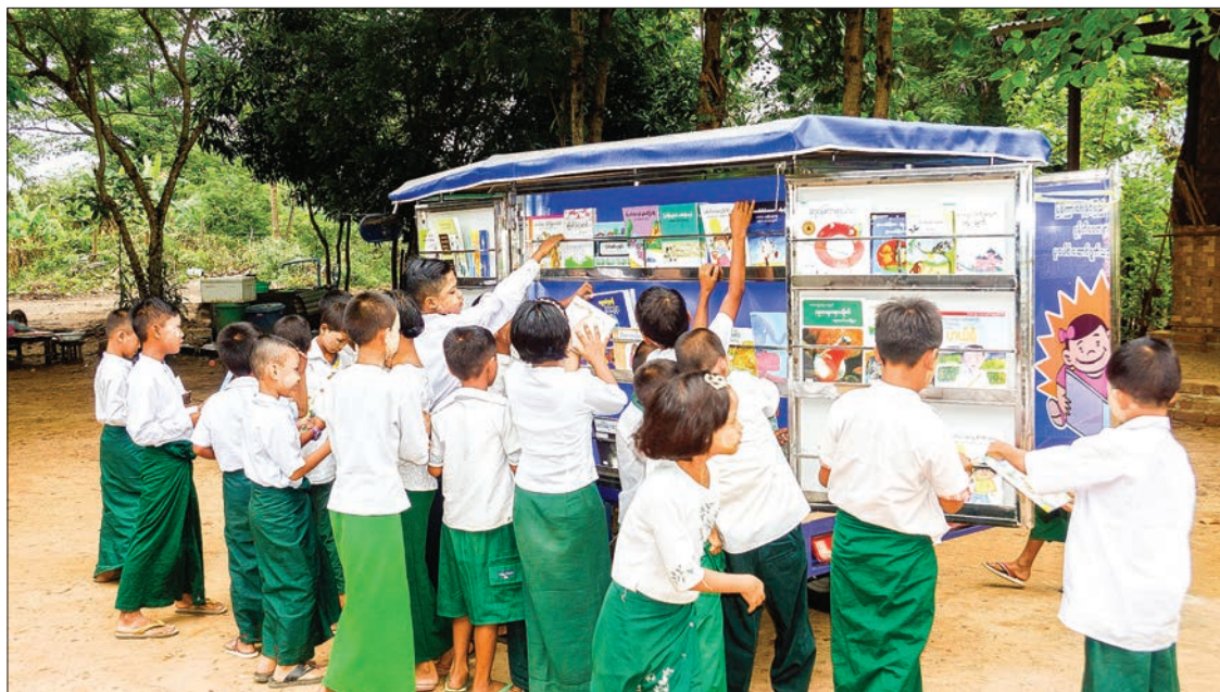
Toungoo students selecting books from a mobile library organized by the Information and Public Relations Department and Shanti Volunteer Association of Japan.