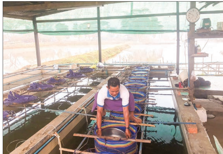
Fisherman breeding fishes at a farm in the Hlawga Hatchery.

The Hlawga Hatchery is producing 19 species of fish, including marketable carp, striped catfish, barb, climbing perch, catla, and mrigal, in order to distribute them to fish farmers. Chitala Chitala does