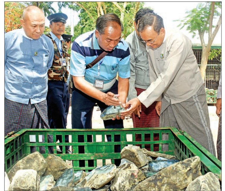
Union Minister U Ohn Win observes the quality of the jade stones at the Myanmar Gems Emporium in Nay Pyi Taw yesterday.

“Today is for jade sale day. Permits are being issued systematically. The gems are sold by open tender. Similar gems are on display in respective designated zones. Serial number, weight and number of stone are labeled on each jade lot. Base on that tender proposals are to be made. The highest bidder, who has paid tender deposit,