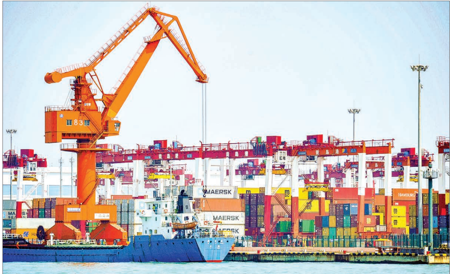
A crane transfers goods at a port in Qingdao, in China's eastern Shandong province on 10 June, 2019.

WTO ensure that trade is as fair as possible by negotiating rules and abiding by them. The WTO's rules — the agreements — are the result of negotiations between the members. The complete set runs to some