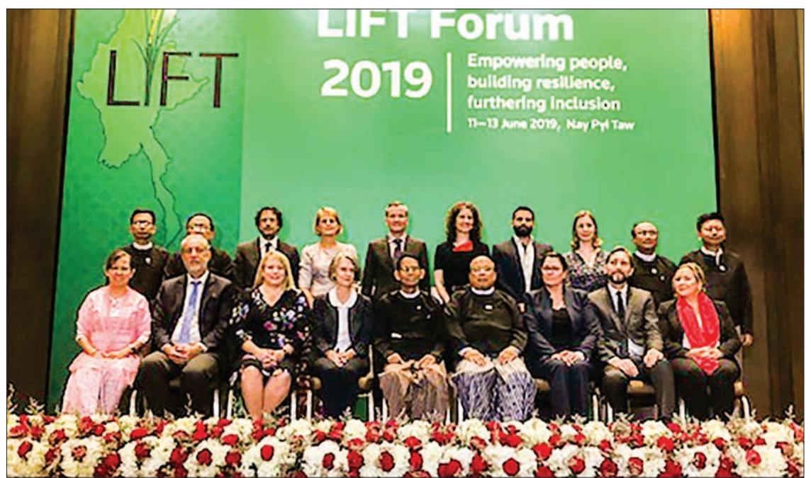
Union Ministers Dr. Aung Thu, U Thaung Tun, Ambassadors from embassies of donor countries and representatives from development partners pose for the documentary photo at the opening ceremony of LIFT Forum 2019 in Nay Pyi Taw on 11 June 2019.

LIFT Fund is a multi-donor trust fund and it was established in Myanmar in 2009. Since 2010, LIFT has been operating in the areas of agriculture, livelihood, micro-finance, nutrition and migration with the total funding of US$ 509 million to improve the lives and prospects of small-holder farmers and landless people in rural Myanmar.— MNA ■