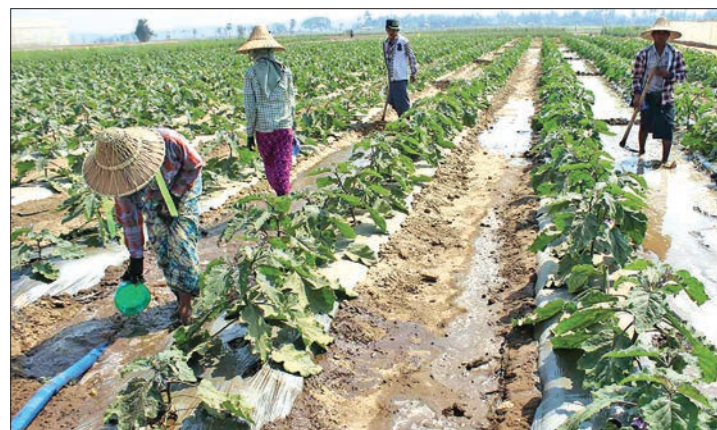
Farmers work in the organic farm in Nay Pyi Taw.

Nevertheless, agricultural exports have not seen a remarkable increase in terms of trade