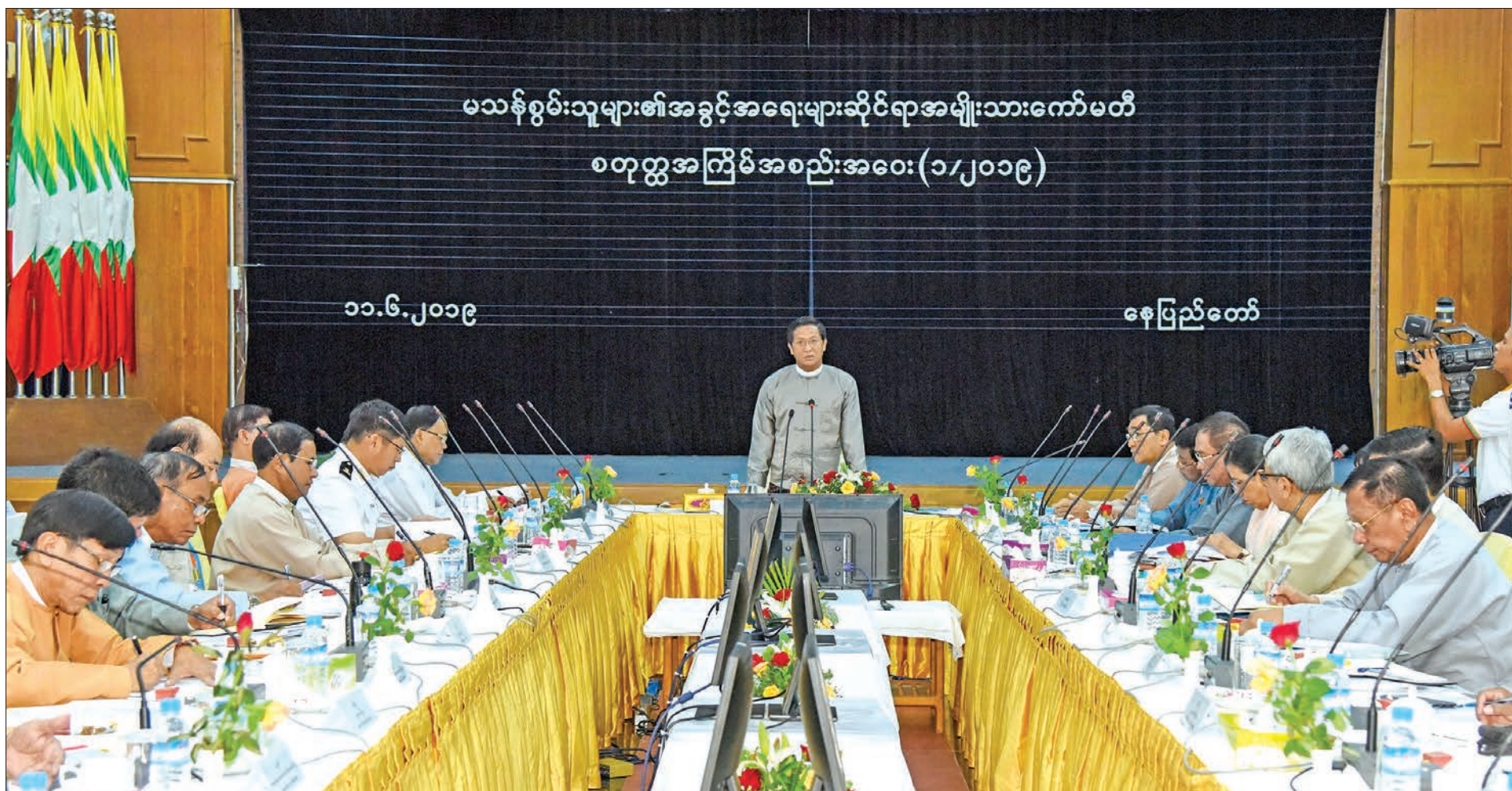
Vice President U Henry Van Thio addresses the fourth National Committee on Rights of Persons with Disabilities (NCRPD) meeting 1/2019 in Nay Pyi Taw yesterday.

VICE President U Henry Van Thio in his capacity as the chairman of the National Committee on Rights of Persons with Disabilities (NCRPD) attended and addressed the fourth NCRPD meeting 1/2019 held at the assembly hall of the Ministry of Social Welfare, Relief and Resettlement, Nay Pyi Taw yesterday morning.