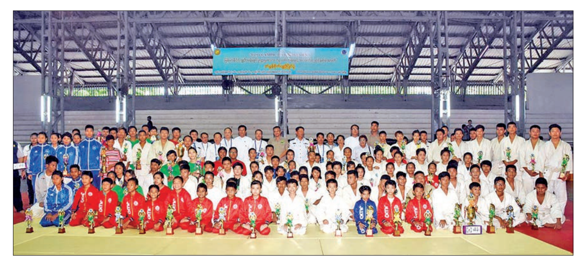
Winners of the Youth Judo tournament pose for a group photo with officials after the awards ceremony of the Myanmar Judo Federation at the Aung San Indoor Stadium in Yangon yesterday.