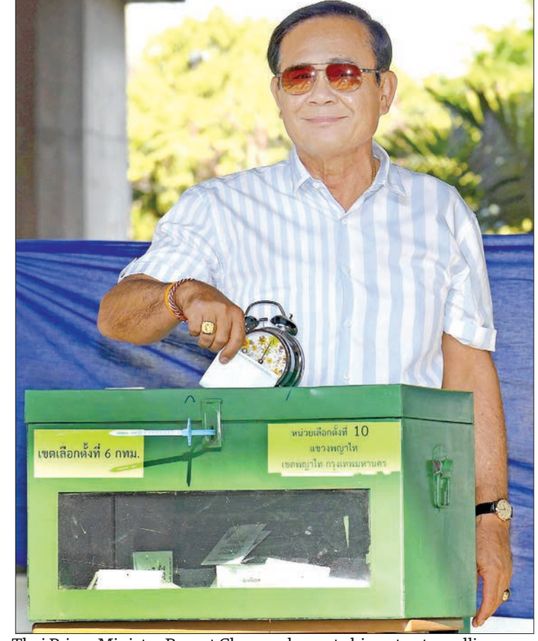
Thai Prime Minister Prayut Chan-o-cha casts his vote at a polling station in Bangkok on March 24, 2019, as Thailand holds its first general election since his coup in 2014.

The populist Pheu Thai Party, which won the most seats in the election, backed Future Forward Party leader Thanathorn Juangroongruangkit in Wednesday's ballot. Prayut defeated him 500-244 in the combined ballot.—Kyodo ■