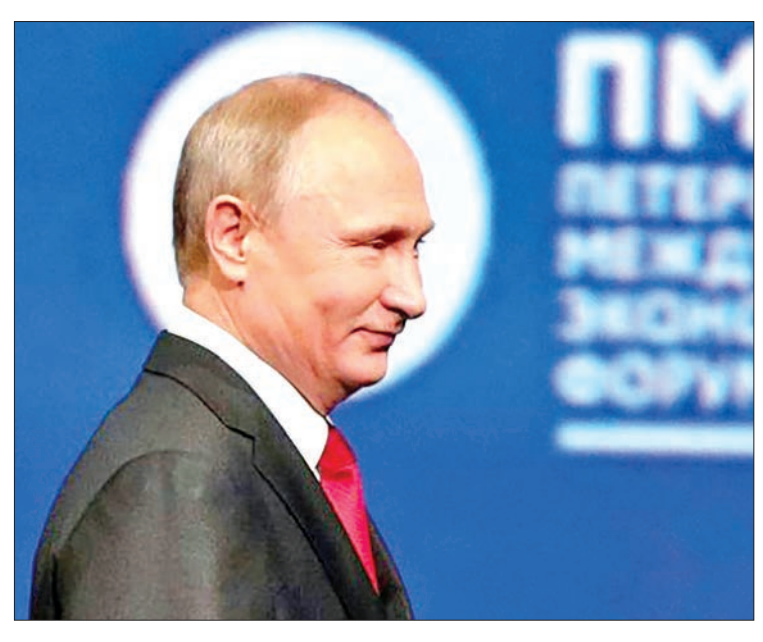
Running until Saturday, this year's forum in Putin's native city is expected to draw some 17,000 participants.