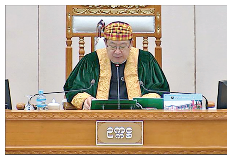
Pyithu Hluttaw Speaker UT Khun Myat.

He continued to say that when he replied the question