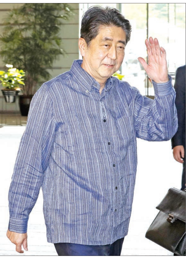
Japanese Prime Minister Shinzo Abe arrives at his office in Tokyo on 4 June, 2019.

"It's extremely important to encourage Iran at a summit level to ease tensions, abide by the nuclear deal, and play a constructive role in ensuring regional stability," Suga said at a press conference. The visit "will further our traditionally friendly relations as this year marks the 90th anniversary of the establishment of diplomatic ties," the top government spokesman added. Abe has laid the groundwork in recent weeks for his visit to Iran, the first by a Japanese leader since