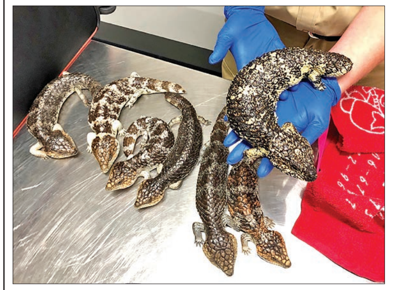
Photo shows several of the seized bobtail lizards which two Japanese men attempted to smuggle out of Australia.

Both men were charged with attempting to export a regulated native specimen, while the 51-year-old was also charged with subjecting the lizards to cruel treatment. The men were denied bail and were due to appear in the Perth Magistrates Court on Thursday.—Kyodo News