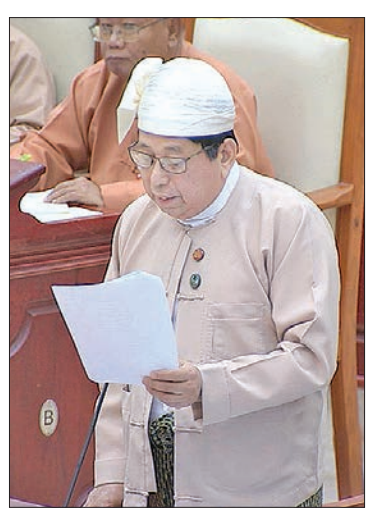
Union Minister Dr. Pe Myint.

The Union Minister said that as soon as he was notified of the announcement from the Tatmadaw True News Information Team saying the interruption of the live broadcast was not the cause of the fibre connection network, he ordered MRTV to