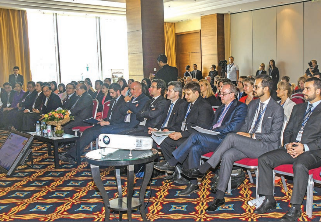
State Counsellor Daw Aung San Suu Kyi speaks at the Hungary-Myanmar Business Forum held at the Marriott Hotel in Budapest yesterday.