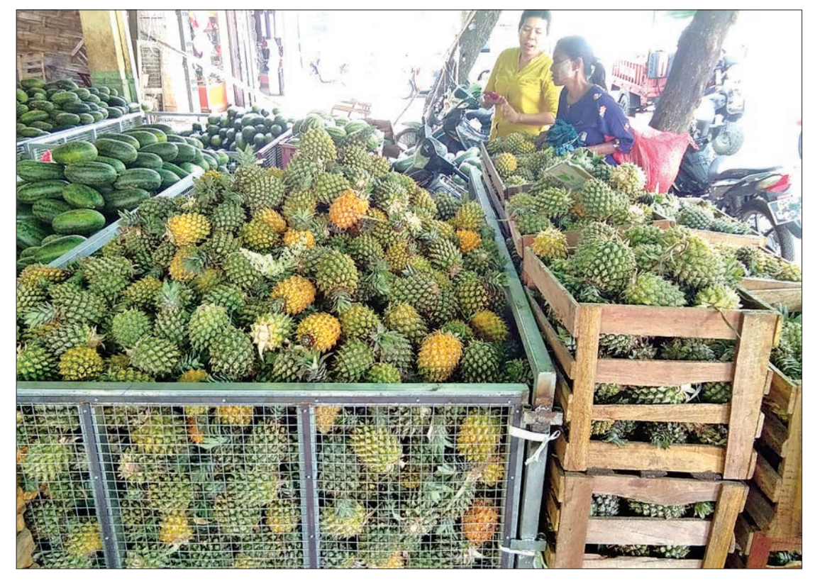
Pineapples on display for sale at the Mandalay market.

"The pineapples are being distributed for both wholesale and retail. They are also being sent to Magway, Chauk, Nay Pyi Taw, and Taungoo, among other places," he added.—Min Htet Aung (Mandalay sub-printing house) \blacksquare (Translated by Ei Myat