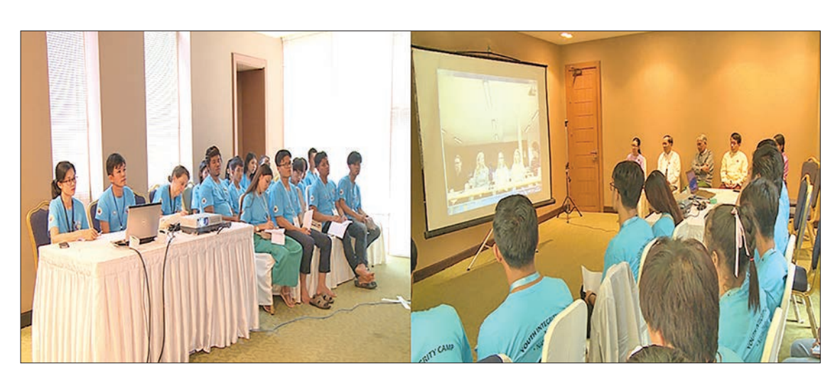
Youth Integrity Camp students and international Slovenian and Papua New Guinean youth discussing anticorruption via video conferencing.

For discussion, fifteen selected youth were divided into two groups. They went into discussion with Papua New Guinean youths in the morning and with Slovenian youth in the afternoon.