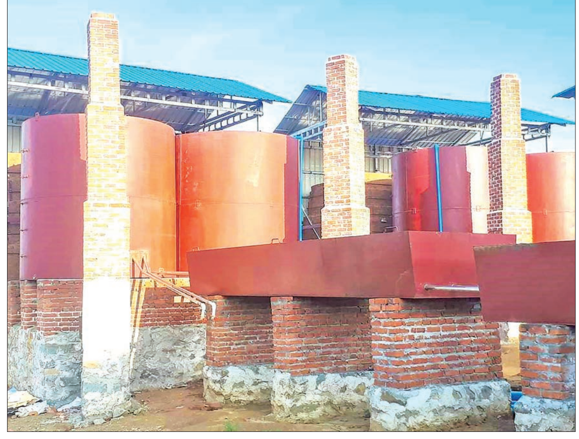
The oil refinery in Kyaukka, Monywa.

When we refined 150 crude oil tanks, we produced 10 wax oil tanks. We didn't have enough space to store the wax oil. And,