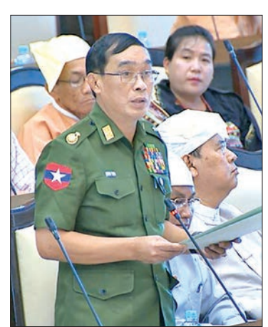
Maj-Gen Than Htut.