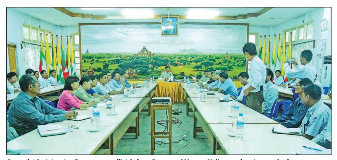
General Administation Department officials from Bagan and NyuangU discuss planning smoke-free zones in the cultural heritage zone during a meeting at the District General Administration Department yesterday.