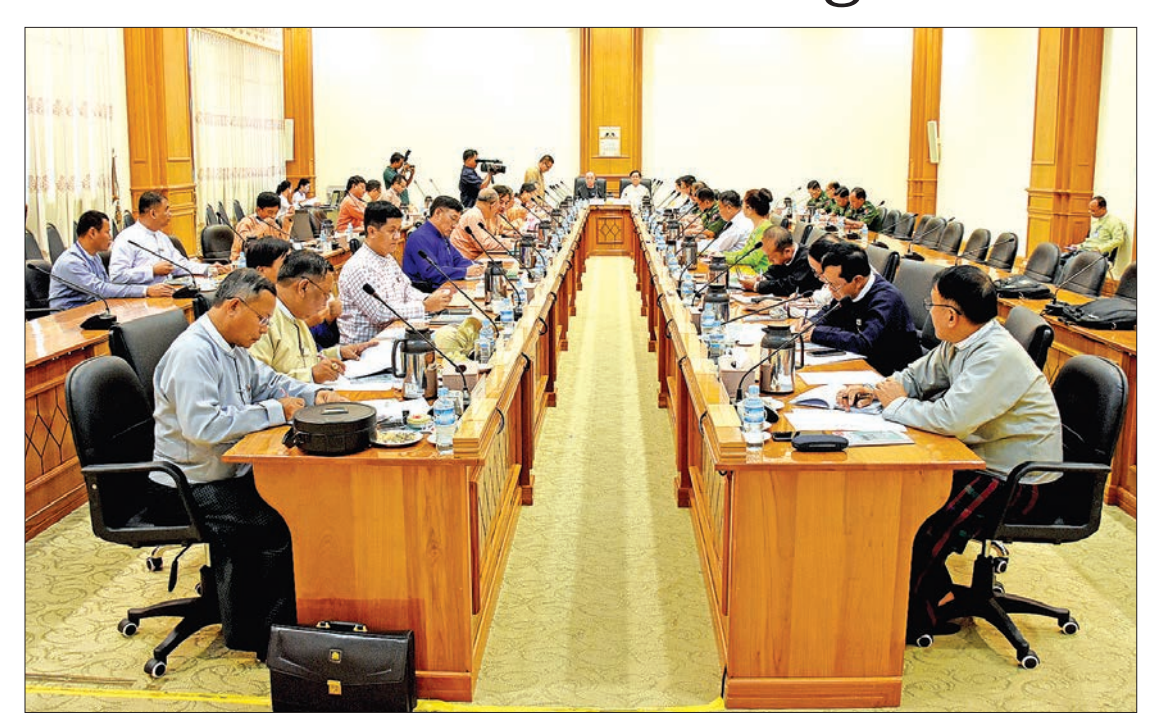
The Joint Committee on Amending the 2008 Constitution holds a meeting in Nay Pyi Taw.

MEETING 19/2019 of the Joint Committee on Amending the 2008 Constitution was held at Pyidaungsu Hluttaw Building D in Nay Pyi Taw yesterday afternoon