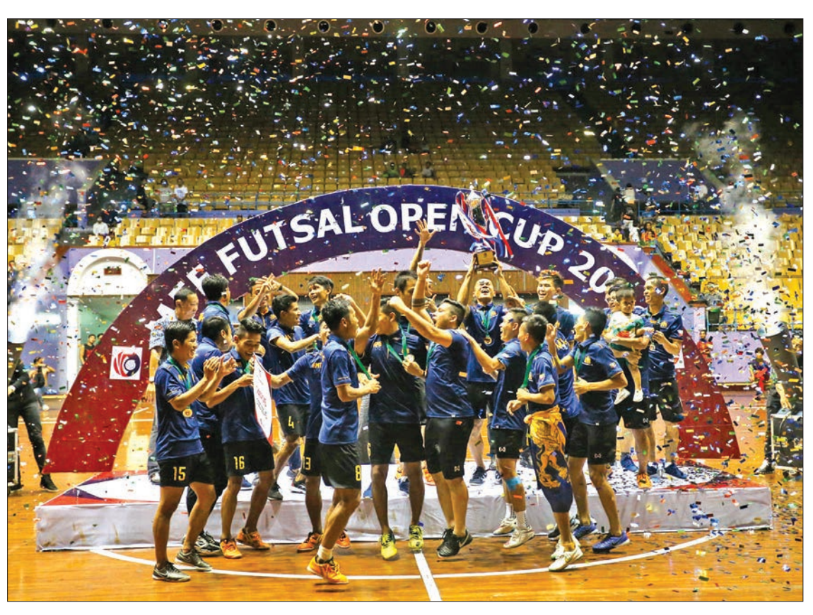
MIC players celebrate their victory at the MFF's Futsal Open Cup 2019 on 5 June at the Thuwunna Indoor Stadium in Yangon.