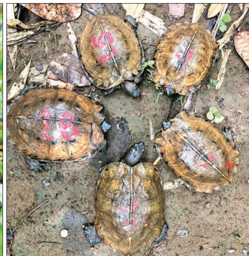
A rare species of Arakan forest turtle, scientific name Heosemys depressa, which lives only in RakhineYoma.

being monitored in the Rakhine Yoma elephant sanctuary in Gwa Township, Rakhine State.