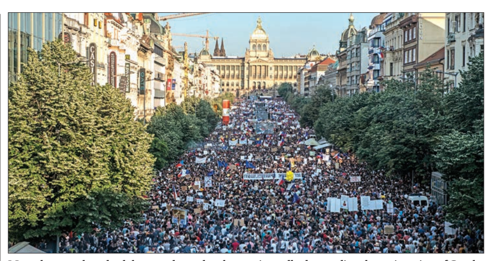
More than one hundred thousand people take part in a rally demanding the resignation of Czech Prime Minister Andrej Babis on 4 June 2019 on the Venceslas Square in Prague.

It urged Chinese tourists to "fully assess the risk" and "improve their awareness of safety and security". Three million Chinese visited the United States last year; down from 3.2 million in 2017, according to the US National Travel and Tourism Office. They represent the fifth-largest group of foreign visitors, spending $36.4 billion last year. This is the second travel advisory for the US issued by China over the past 12 months. The Chinese embassy in Washington last July warned Chinese tourists to be aware of issues including the threat of public shootings and robberies, searches and seizures by customs agents, telecommunications fraud and natural disasters. The latest warnings come a day after the education ministry said Chinese students and academics were facing US visa problems and urged them to assess the "risk" of travelling to the United States. —AFP■