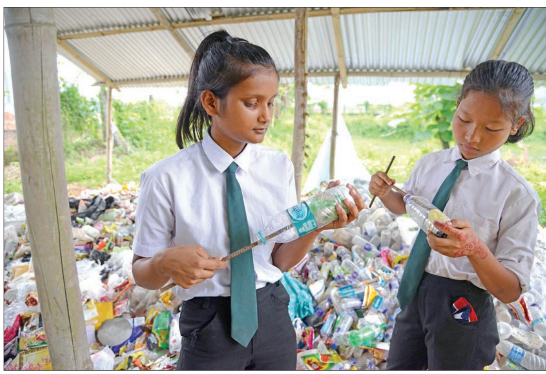
Indian students put plastic bags inside bottles to make eco-bricks, which will be used for construction purposes at the Akshar Forum school in Assam state.

DISPUR (India)—One school in northeast India has taken a novel approach to addressing the scourge of plastic waste by making its collection a condition of free attendance.