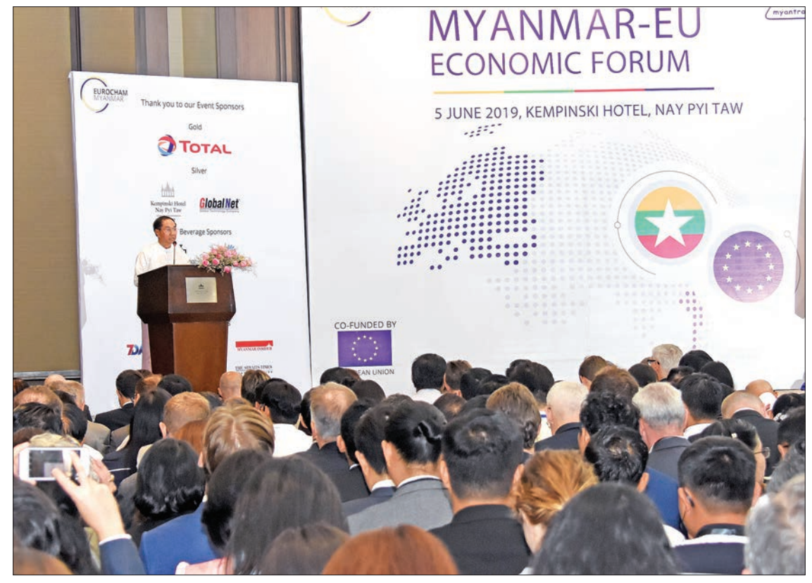
Vice President U Myint Swe addresses the 3<sup>rd</sup> edition of the Myanmar-EU Economic Forum in Nay Pyi Taw.

anmar had enacted The Competition Law in 2015, The New Myanmar Investment Law in 2016, and The New Myanmar Company Act in 2017. He said this had allowed companies to register online and enabled more transparency, lessening of restrictions and guarantees for investors. He added that this also allowed foreign investors to own up to 35 per cent of shares in a domestic company, and put in 100 per cent of investments into a foreign owned wholesale and retail company.