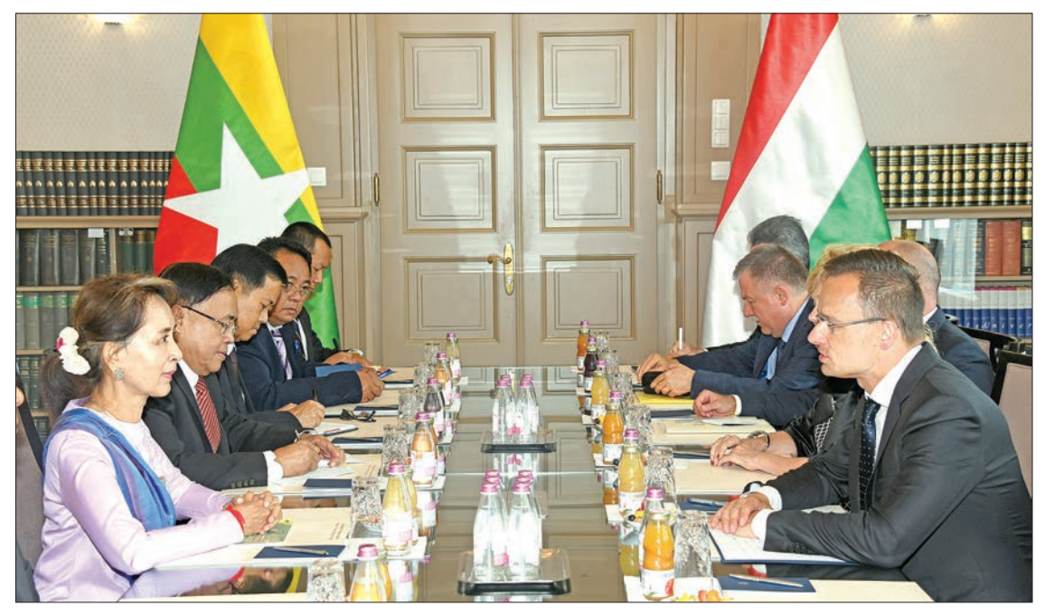
State Counsellor Daw Aung San Suu Kyi holds talks with Hungarian Foreign Affairs and Trade Minister Mr. Peter Szijjarto in Budapest yesterday.

stability and development in Rakhine State and opening of embassies by the two countries in respective capitals.