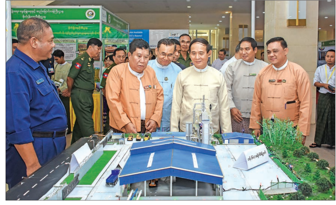
President U Win Myint observes the small-scale model of waste-to-energy plant displayed at the event to mark the World Environment Day 2019 in Nay Pyi Taw yesterday.

The Organization for Economic Cooperation and Development (OECD) had predicted that Outdoor Air Pollution could cause premature deaths which cost from 18 to 25 trillion US dollars worldwide per year by 2060. And, again, a breath of fresh air was necessary for our daily lives. That was why taking fast action on air pollution was discussed at