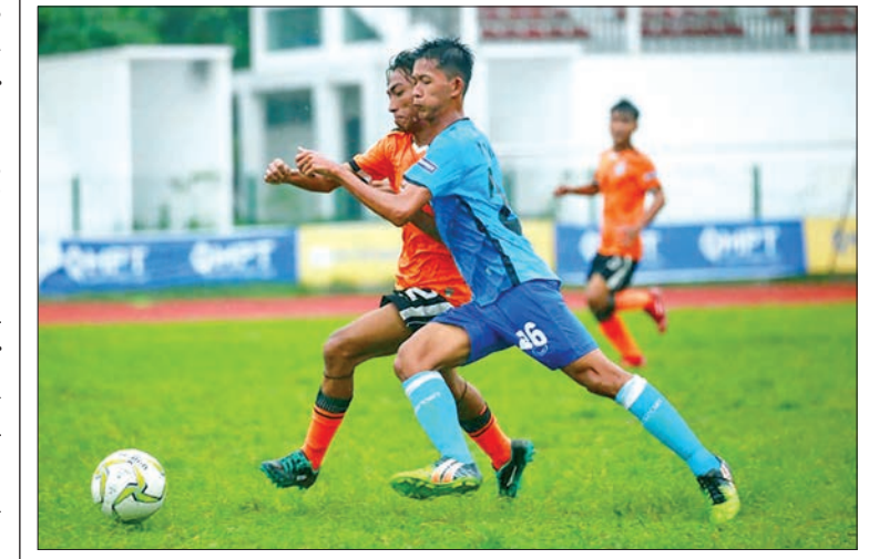
A player from University FC (blue) vies for the ball against Silver Stars FC (orange) during the U-18 MPT Myanmar National League match yesterday.