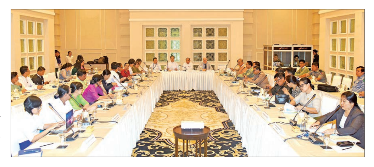
Awareness raising workshop on ICCPR jointly organized by the Ministry of Foreign Affairs and the Centre for Civil and Political Rights based in Geneva held in Nay Pyi Taw.

including the members of Pyithu Hluttaw and Amyotha Hluttaw, officials and scholars from the Union Supreme Court, Union Election Commission, Ministry of Foreign Affairs, Ministry of Home Affairs, Ministry of Defence, Ministry of Border Affairs, Ministry of the Office of the State Counsellor, Ministry of Information, Ministry of the Office of the Union Government, Ministry of Religious Affairs and Culture, Ministry of Labour, Immigration and Population, Ministry of Edu-