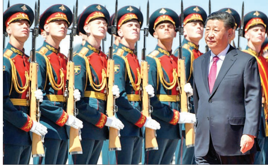
Xi was received with full honours at Moscow's Vnukovo airport.

The trip comes five years after Moscow's annexation of Ukraine's Crimea peninsula led to a serious rift with its Western partners and subsequent turn toward its neighbour to the east. "In recent years, thanks to your direct par-