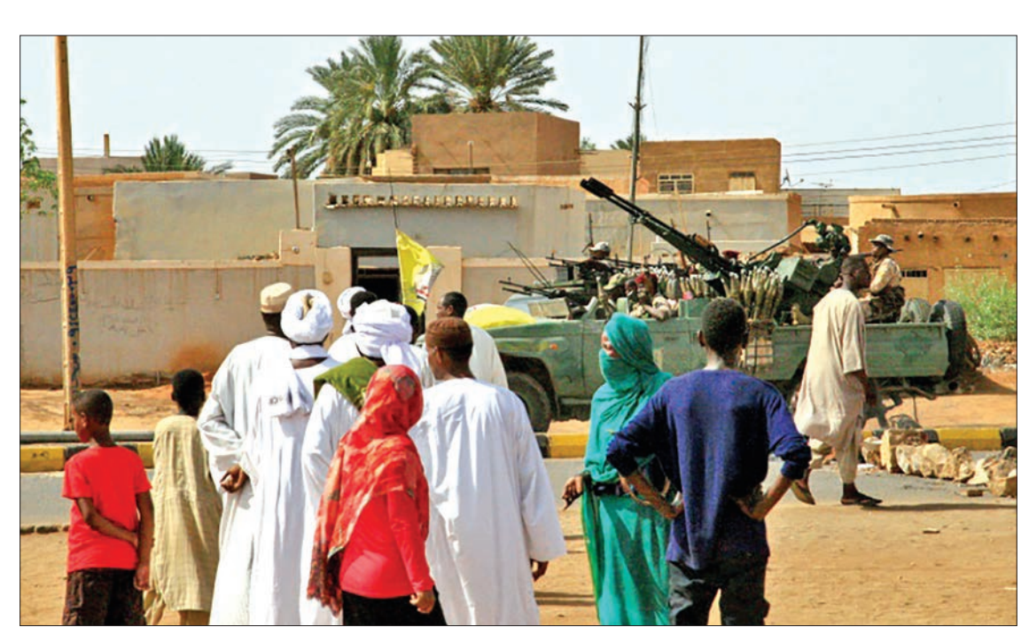
Heavily armed Sudanese security forces were out on patrol as Muslim worshippers attended Eid al-Fitr prayers.

"There's a shortage of medical staff, a shortage of blood, and it's difficult to do surgery because some operations can only be done in certain hospitals," said the doc-