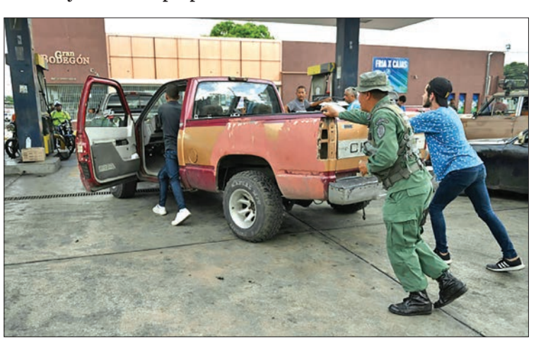
People push a vehicle up to the pump to fill up on gas at a station in Acarigua in Venezuela, which has started rationing fuel.

The head of PDVSA, Manuel Quevedo, said last week that the government would guarantee supplies but the shortages persisted. Maduro, for his part, blamed the shortfall on sabotage carried out against oil tankers, but offered no details.—AFP