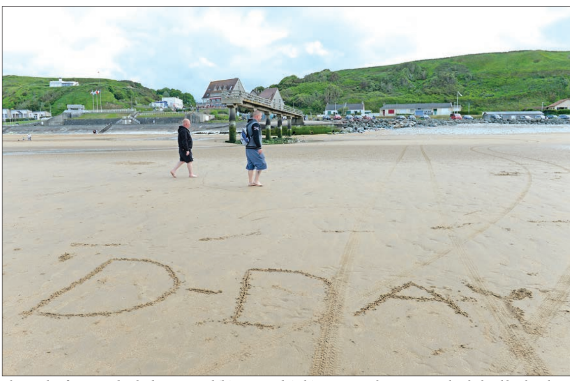
The Battle of Normandy, the largest amphibious assault in history, was a key moment that helped lead to the end of World War II.

In a joint D-Day proclamation, the 16 attending nations af-