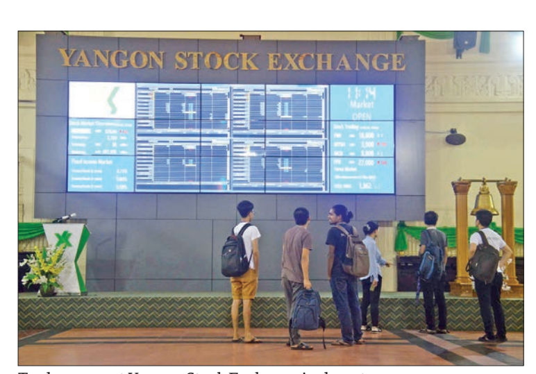
Traders seen at Yangon Stock Exchange in downtown Yangon.

YSX was launched three years ago with a view to enhance private business sector. We will disseminate the rules and regulations of stock exchange at the upcoming Monywa Stock Investment Seminar which will be held