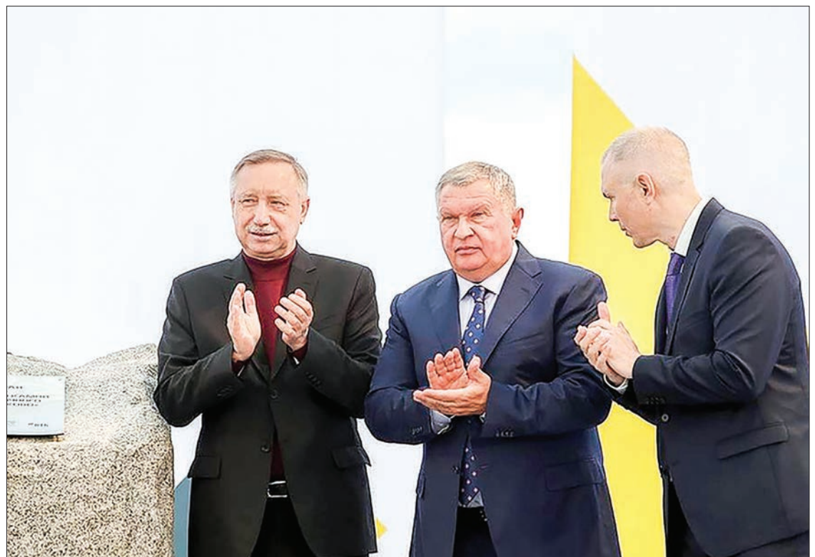
The plan is to construct the facility in two stages in 2020-2021.

Officer Igor Sechin said during the ground-breaking ceremony that investment in the project are estimated at over 3 bln rubles ($45.7 mln). — Tass ■