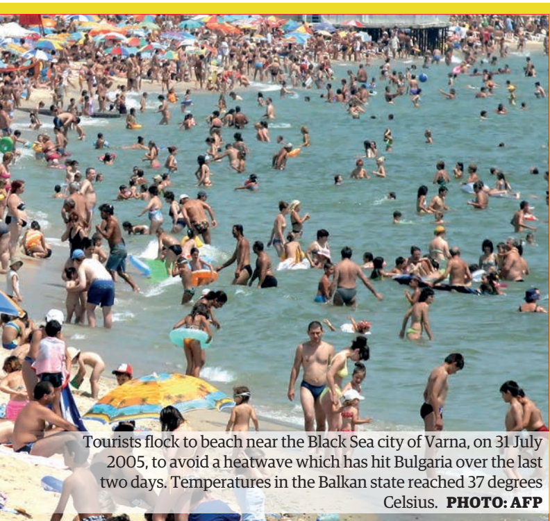
Tourists flock to beach near the Black Sea city of Varna, on 31 July 2005, to avoid a heatwave which has hit Bulgaria over the last two days. Temperatures in the Balkan state reached 37 degrees Celsius.