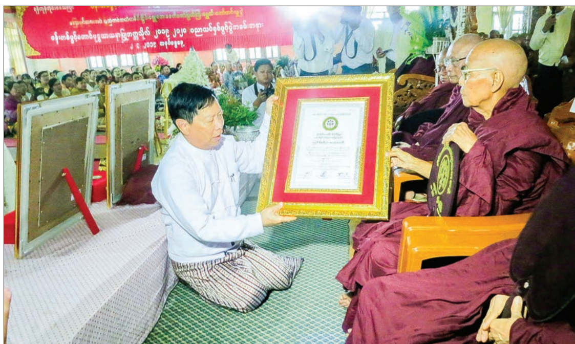
Union Minister Thura U Aung Ko presents the certificate to the Ovadacariya Sayadaw of Pan Tapwint Taung Buddhist Missionary University yesterday.