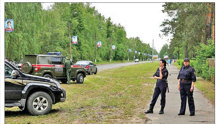
44 of them are the plant's employees and 45 - inhabitants of adjacent territories. PHOTO: TASS

Russia's Investigative Committee said that those were man-made explosions. A criminal case has been opened under Part 1 Section 217 of the Russian Criminal Code (“Violation of industrial safety requirements at production facilities”). — Tass ■