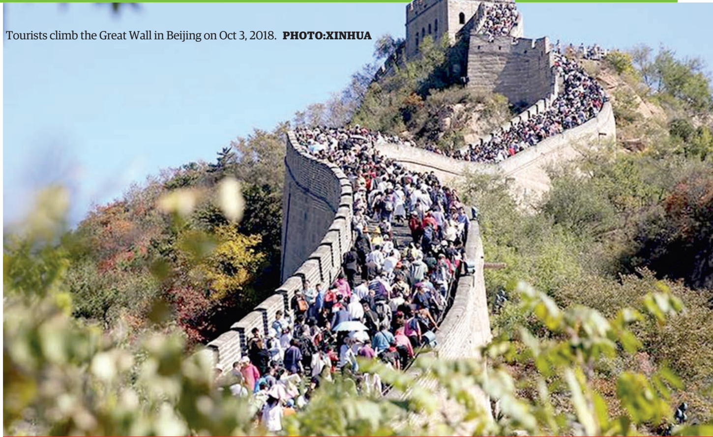
Tourists climb the Great Wall in Beijing on Oct 3, 2018.

Fame is a double edged sword in travel industry. The meaning is that when a destination became popular among travellers there can be benefits such as arrival of more travellers, development of basic infrastructures, increased employment opportunities and improvement in social economic situation of the local people. On the other hand, more travellers mean more degradation of the travel destination resulting in environmental damages, invasion into privacy of the local and tourism phobia brought about by unwelcomed, unappreciated and unvalued increase in numbers of travellers.