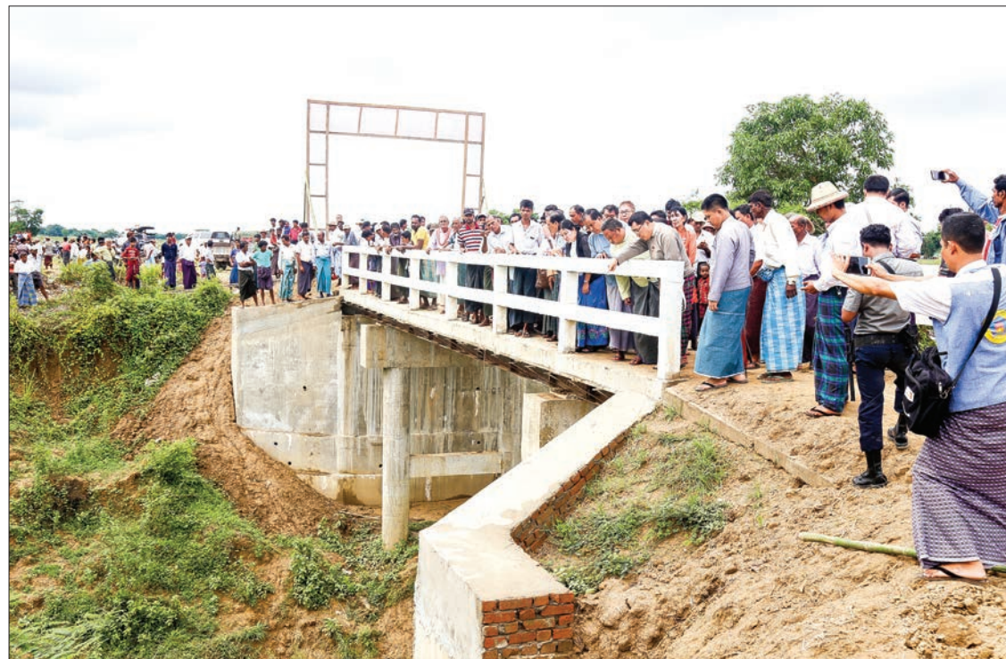
Union Minister Dr. Win Myat Aye and officials observe the condition of Yantola, a bridge for inter-village transport in Kyeyoe village-tract, Kyauktaga Township, Bago Region yesterday.

The Union Minister presented K 3.5 million to dig a pond in Sipin village in Nyaunglebin Township, and to extend a pond at Ngagyaing village.—MNA ■ (Translated by TMT)