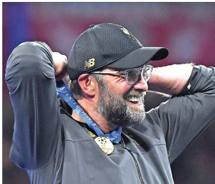
Jurgen Klopp says there is plenty more to come from Liverpool after their Champions League triumph.

MADRID (Spain)—Liverpool's celebrations stretched long into the night after they became six-time European champions with goals from Mohamed Salah and Divock Origi to beat Tottenham—and the party was set to move to England on Sunday where tens of thousands of fans awaited the team's return. The 2-0 win in the sweltering Metropolitano Stadium delivered a first trophy in seven years for Liverpool, and—finally—a first win in seven finals for coach Jurgen Klopp. The final whistle sparked wild scenes among the Liverpool fans in the stadium and back home in northwest England, where the team will have a victory parade on Sunday. "We were all pretty much crying on the pitch, because it was so emotional, it was so big, it means so much to us," Klopp said.