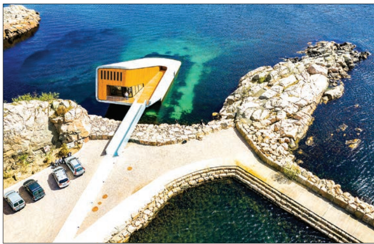
A picture taken on 2 May 2019 shows an aerial view of Under, a restaurant that is semi-submerged beneath the waters of the North Sea in Lindesnes near Kristiansand, some 400 km south west of Oslo.

From the outside, the giant concrete monolith juts out from the craggy shoreline, while its other end tips down into the North Sea. Customers enter the restaurant onshore through a wood-panelled passage and descend down a long, oak staircase into a dimly lit dining room. Here, a gigantic plexiglass underwater window takes centre stage. The 36-square-metre (398-square-foot) window—“like a sunken periscope” in the words of its designers—offers a panoramic view of the ever changing live aquatic show. In Norwegian “Under” means it’s under, like submerged, underwater, and it also means a