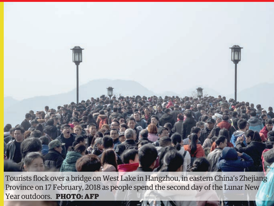
Tourists flock over a bridge on West Lake in Hangzhou, in eastern China's Zhejiang Province on 17 February, 2018 as people spend the second day of the Lunar New Year outdoors.