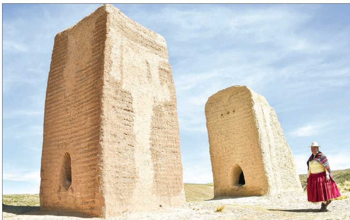
All the small doorways in the chullpas funerary towers face east, a fact that has been responsible for the development of numerous myths and legends.