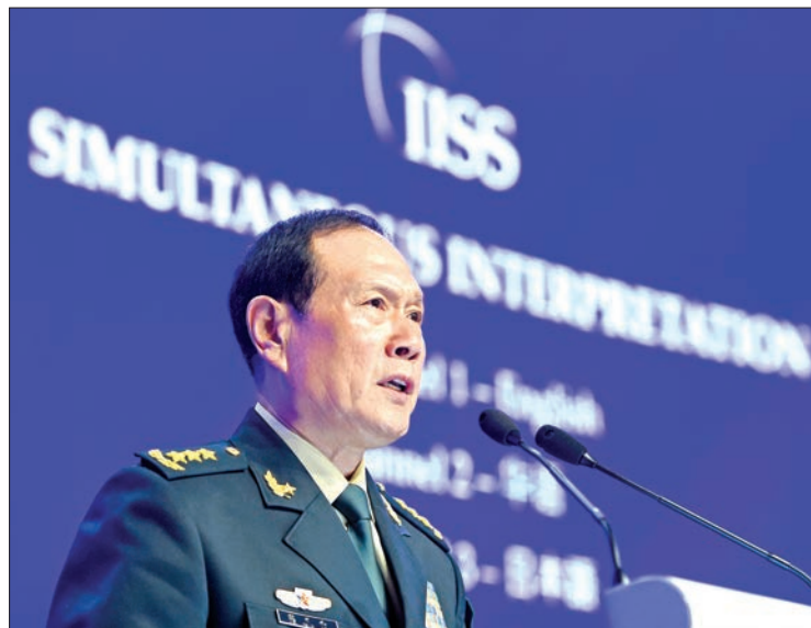
China's Defence Minister Wei Fenghe addresses the IISS Shangri-La Dialogue summit in Singapore on 2 June 2019.

Wei said that he had a candid and practical discussion with US Acting Secretary of Defense