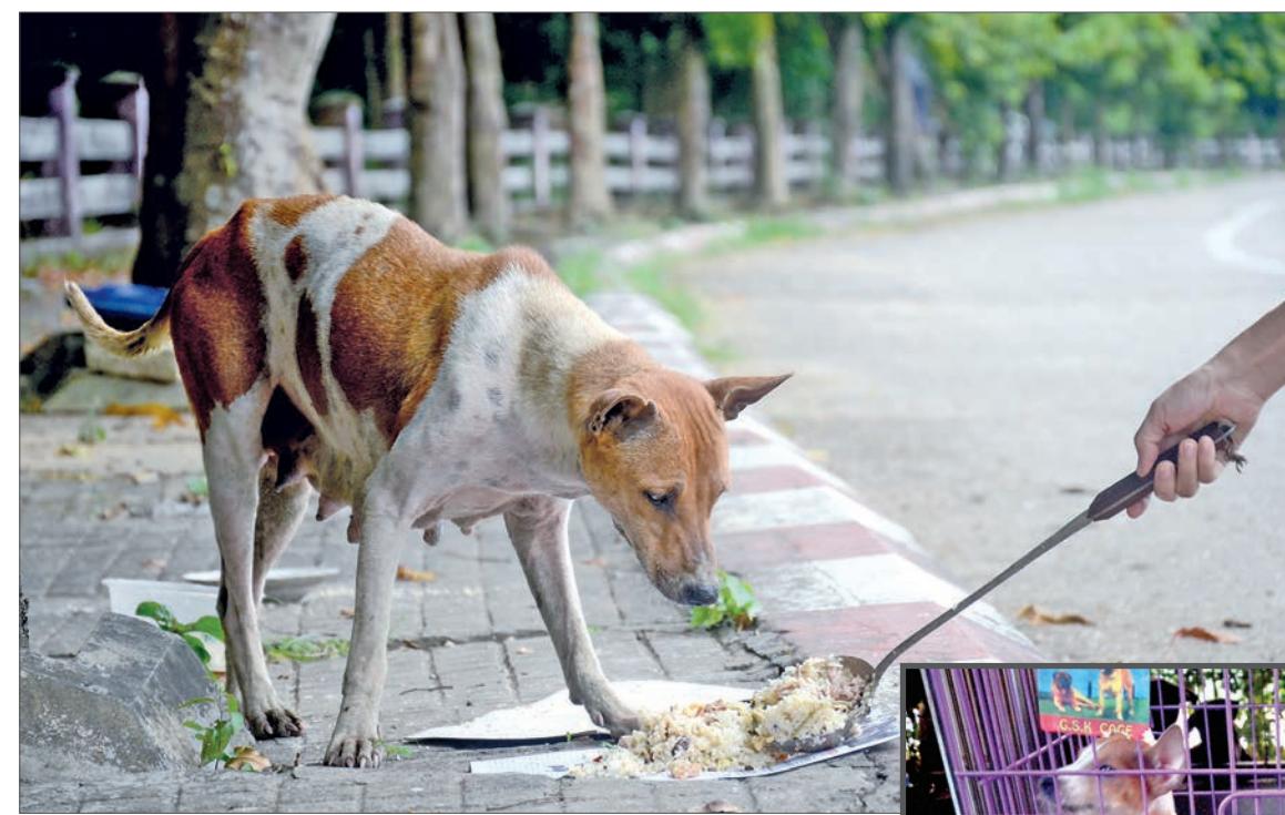
A woman feeding stray dogs by the roadside in a suburban area.

In 2009, total of 27,576 dogs were killed within the city of Lahore; in 2005, this number was 34,942. In 2012, after 900 dogs were killed in the city of Multan, the Animal Safety Organization in Pakistan sent a letter to Chief