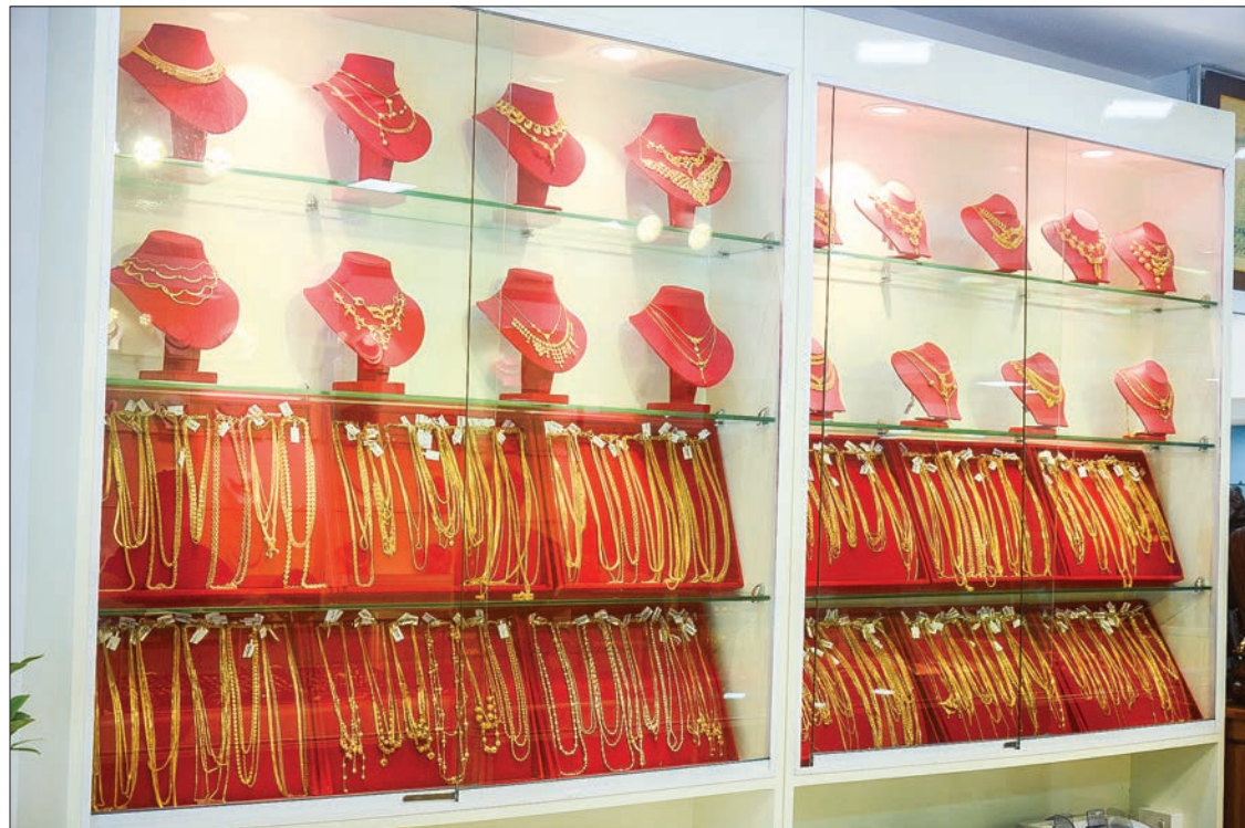
Gold necklaces displaying at a gold and jewellery shop in Yangon.

AS the global gold price surged to US$1,306 per ounce on 31 May, domestic gold price reached a high of K1,056,000 per tical (0.578 ounce) in the afternoon of 1 June, according to local gold market.