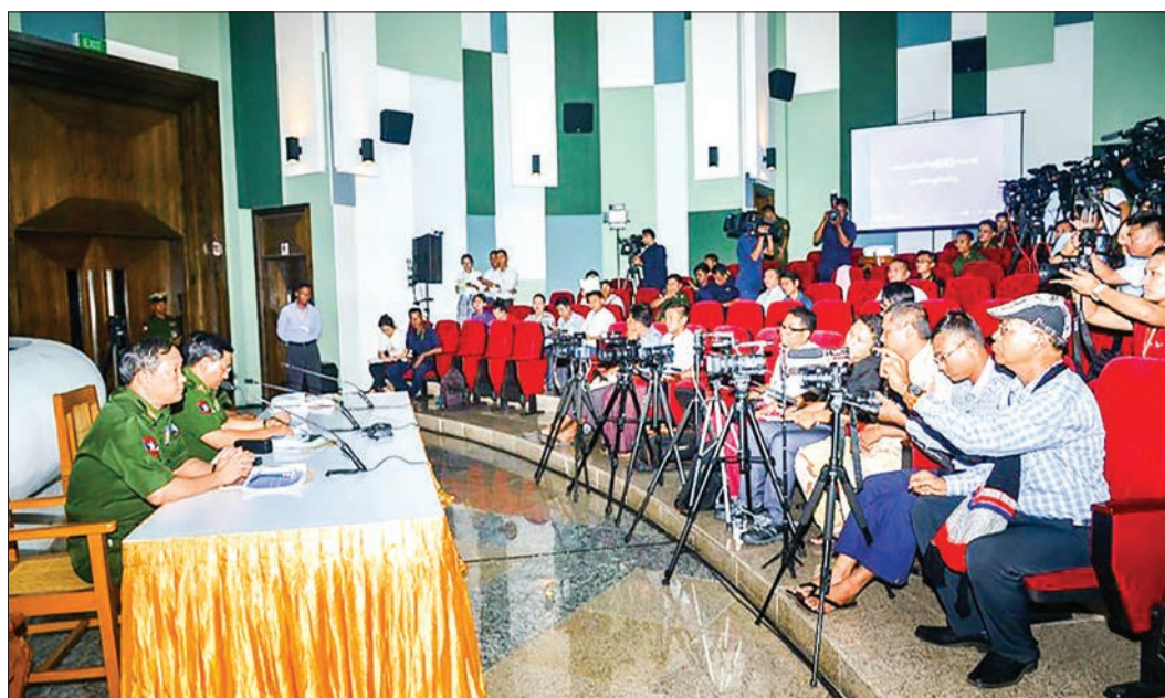
Tatmadaw True News Team replies to queries raised by journalists from news agencies.