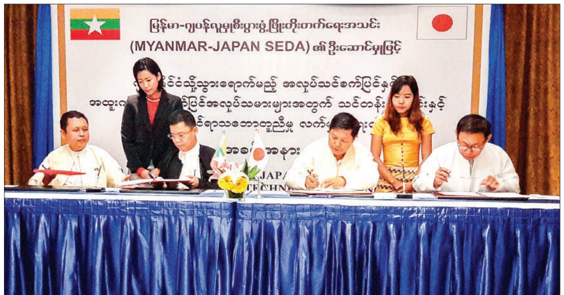
Officials sign the Memorandum of Understanding of Myanmar-Japan SEDA yesterday.

The Japanese government will allow some 500,000 blue collar workers from ASEAN countries to enter Japan, including from Myanmar, in order to work in 14 types of job. Those who wish to work in Japan must be fluent in the Japanese language, and overseas recruitment will cost US$2,800, as per the set rate by