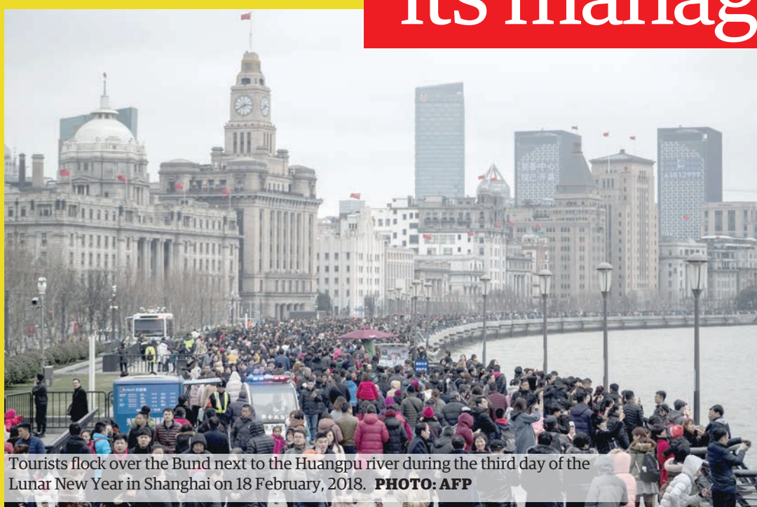
Tourists flock over the Bund next to the Huangpu river during the third day of the Lunar New Year in Shanghai on 18 February, 2018.