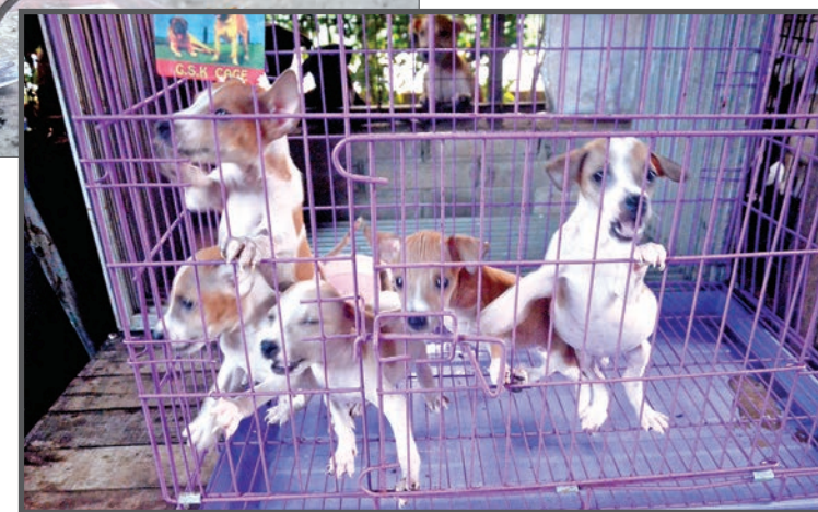
An animal shelter helps with sterilisation of stray dogs.

They have so many animals to feed. Animal feeds accounted for over MMK 7 million and that