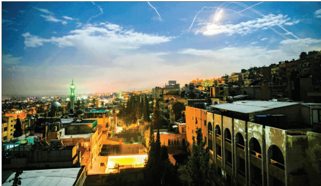
A picture taken early on 21 January 2019 shows Syrian air defence batteries responding to what the Syrian state media said were Israeli missiles targeting Damascus. Israel struck what it said were Iranian targets in Syria today in response to rocket fire it blamed on Iran, sparking concerns of an escalation after a monitor reported 11 fighters killed.

“two Syrian artillery batteries, a number of observation and intelligence posts on the Golan Heights, and an SA-2 aerial defence battery”. Israel has carried out hun-