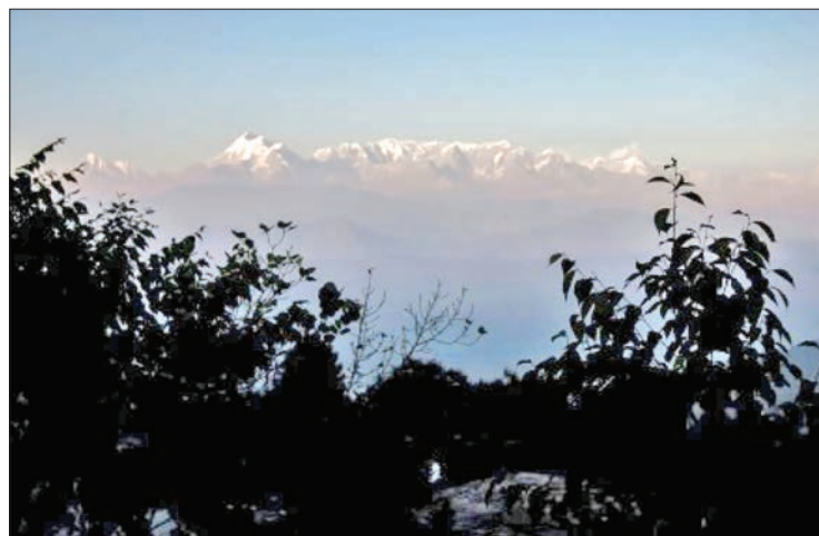
Scores of emergency workers were combing the peaks in two choppers and on foot as rescue operations entered a second day.

Pithoragarh district magistrate Vijay Kumar Jogdande