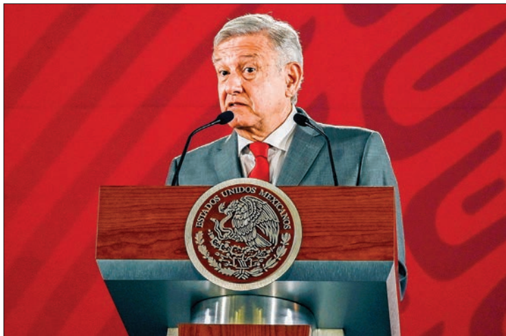
Mexico's president Andres Manuel Lopez Obrador has said he thinks US officials are prepared to negotiate on President Donald Trump's threat to use tariffs as a tool to fight illegal migration across the border.