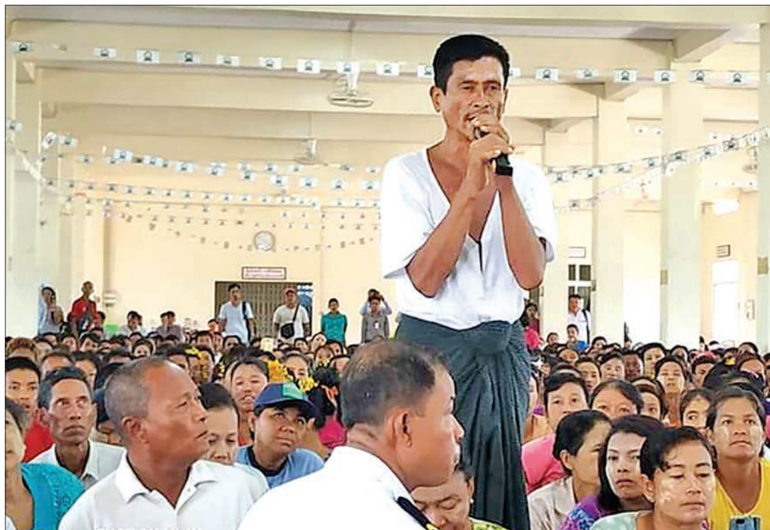
A local man questions about the Yangon Urban Mass Rapid Transit project at the meeting with authorities in Hlinethayar yesterday.