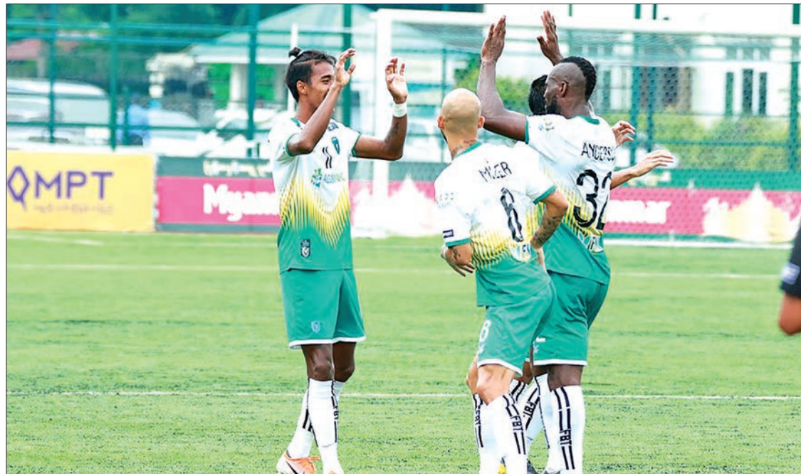
Players from Yangon United celebrate their victory after defeating Sagaing United 3-1 in the 2nd leg of the General Aung San Shield Semifinal at the home stadium of Yangon United yesterday.

YANGON United has secured a spot in the finals of the General Aung San Shield 2019 after defeating Sagaing United 3-1 in the 2nd leg of the General Aung San Shield 2019 at Yangon United Sports Complex yesterday.