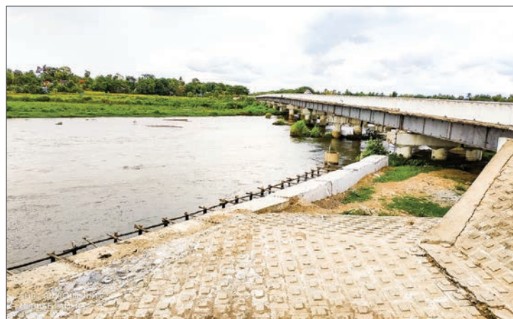
170 ft long Nga Moe Yeik Creek Bridge seen on Ngarzu Taung-Kyar Einn- Kan Ne-Phaung Gyi Road in Hlegu Township, Yangon.

Now that Swar Creek Bridge renovation has completed and people can commute with ease in short time. —MNA (Translated by Alphonsus)