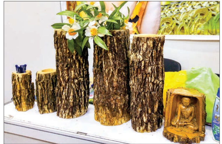
Thanakha is a cosmetic paste made from ground bark.

"We will take samples of cosmetics which do not have any thanakha to the Thanakha Conference. Our plan is to make this kind of unethical activity known to the authorities. They should be aware that such fake cosmetics are being distributed in the market. Our association will put a clearance label on genuine thanakha cosmetics, which have either been imported or produced within the country. Our association will protect consumers. And, we will tell consumers to buy only thanakha cosmetics bearing our clearance labels," he said.