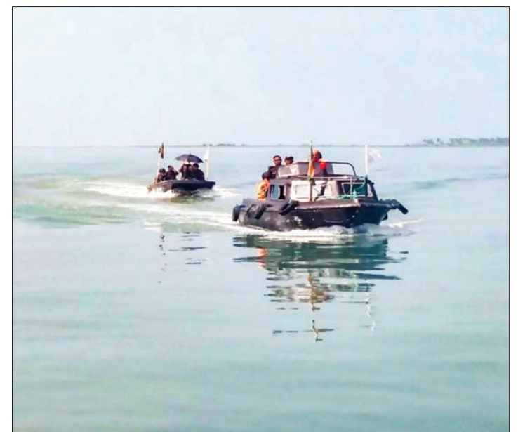
Myanmar Border Police and Border Guards Bangladesh conducting coordinated naval patrols in the Naf River.