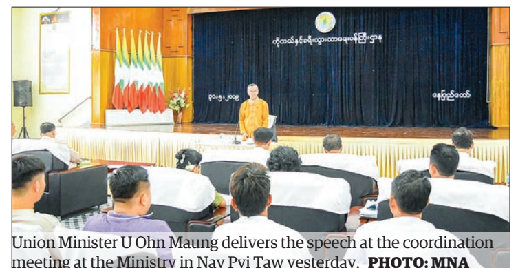
Union Minister U Ohn Maung delivers the speech at the coordination meeting at the Ministry in Nay Pyi Taw yesterday.

Union Minister U Ohn Maung first delivered a speech where he urged the participants to openly communicate their ideas and opinions on forming the necessary policies and strategies to implement sustainable tourism that will benefit the nation and everyone working in the tourism sector. After general discussions, the Union Minister delivered the closing speech where he said the Union Government is reviewing which restrictions to nullify and requested everyone working in this sector to conduct their business systematically and within the rules.—MNA (Translated by Zaw Htet Oo)