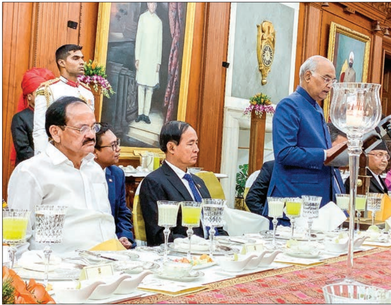
President U Win Myint (Centre) attends the dinner hosted by Indian President Ram Nath Kovind (Right) in New Delhi.