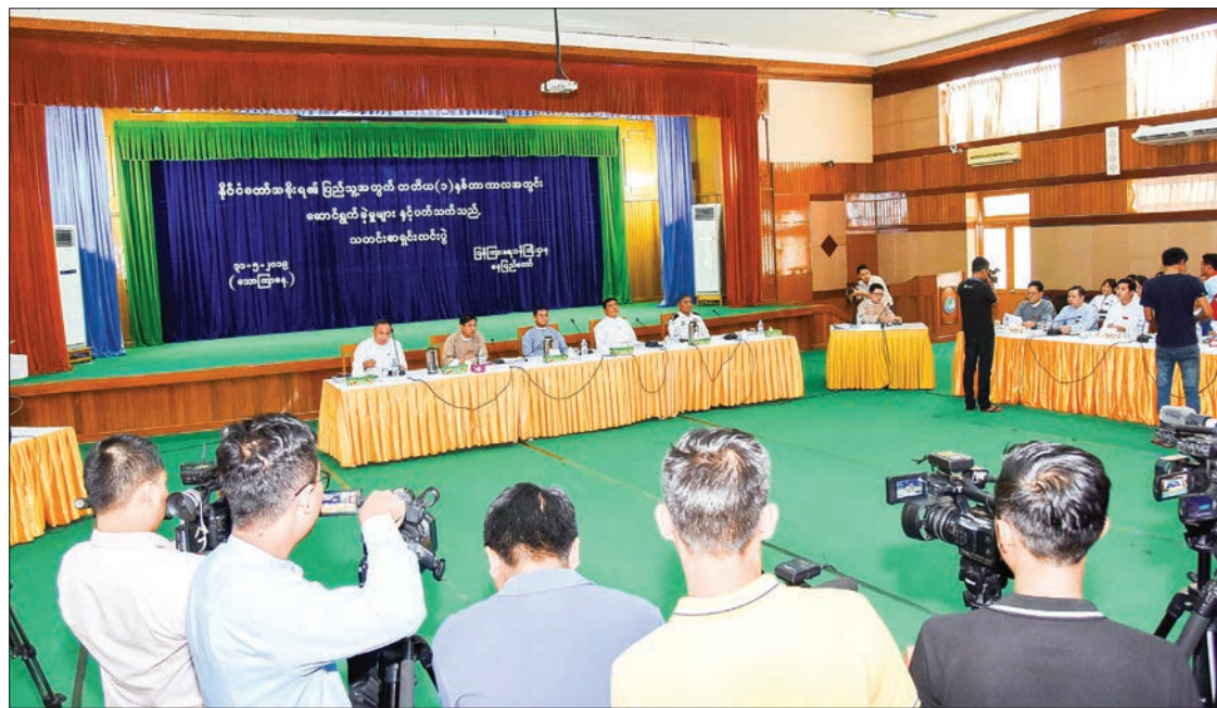
Ministry of the State Counsellor Office, Ministry of Religious Affairs and Culture, Ministry of Labour, Immigration and Population, and the Ministry of Agriculture, Livestock and Irrigation hold press conference on their performance in third one-year period in Nay Pyi Taw yesterday.

The Director-General then answered to questions asking whether the Tatmadaw officers who had charges pressed against them concerning affairs of Inndin village, Rakhine State, were released or not. He also answered to questions asking about the delay in the peace process, the content of the President's speech delivered during his meeting with government staff in Nay Pyi Taw Council, the ongoing arrest for monk U Wirathu, the number of foreign advisors appointed to Union-level organizations and the appointment policy, the entry of terrorists from Malaysia and the Union Government's preparations for protection, the management process for ensuring later issues do not arise from arresting extreme nationalist movements, whether a new minister position will be expanded for governing the subnational general administration departments, the process of relinquishing confiscated lands and swiftly