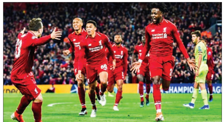
Liverpool's Divock Origi (R) celebrates after scoring against Barcelona.

The stocky Wanyama has only started 13 Premier League games this season but has turned out six times so far in the Champions League and is highly thought of by the Spurs faithful.