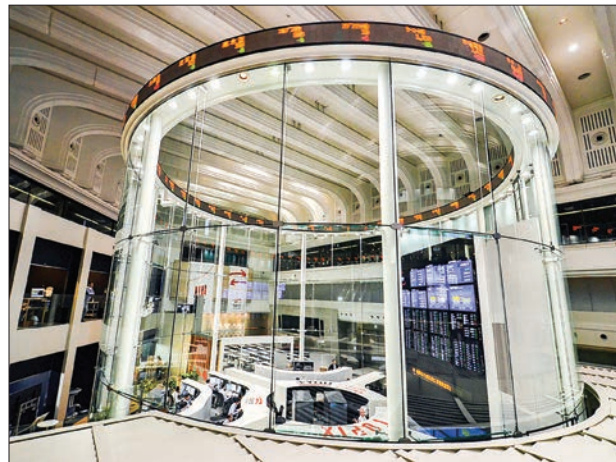
The threat of the fresh tariff hike overwhelmed the positive impact on the Tokyo market of rallies on Wall Street.

TOKYO — Tokyo stocks closed lower Friday, after US President Donald Trump announced a five per cent tariff on all goods from Mexico, prompting the yen to strengthen against the dollar.