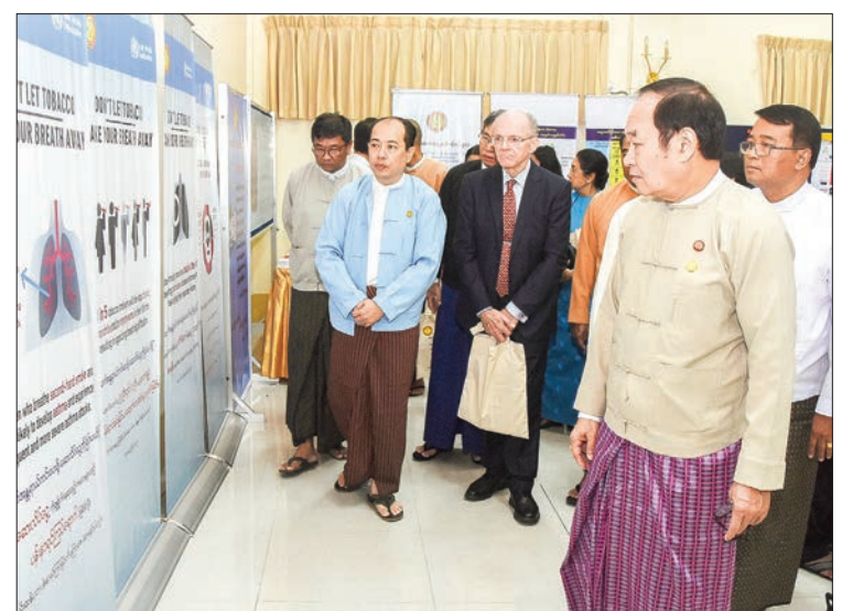
Union Minister Dr. Myint Htwe looks around the ceremony to mark the World No Tobacco Day 2019 at the Ministry of Health and Sports in Nay Pyi Taw yesterday.