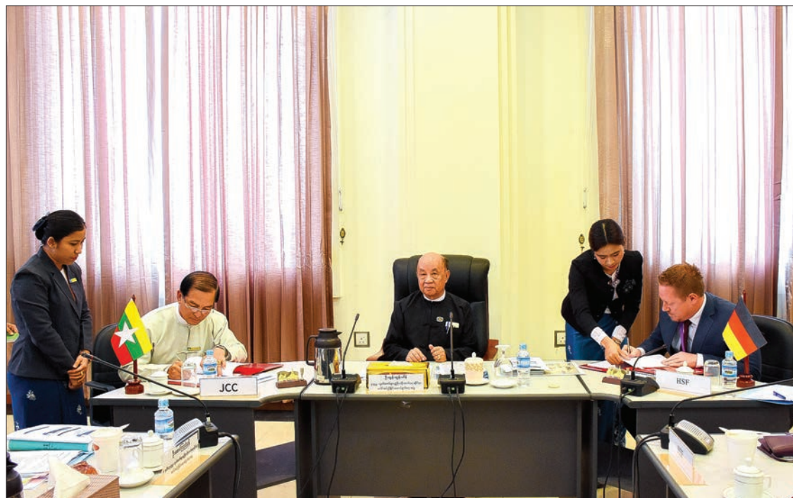
Pyidaungsu Hluttaw Deputy Speaker U Tun Tun Hein attends the signing ceremony on extension of the MoU on cooperation for development of Myanmar Hluttaw in Nay Pyi Taw yesterday.

MYANMAR Hluttaw and Hanns Seidel Foundation-HSF signed a Memorandum of Understanding-MoU on extension of the MoU on cooperation for development of Myanmar Hluttaw at the Hluttaw Affairs Building in Nay Pyi Taw yesterday.