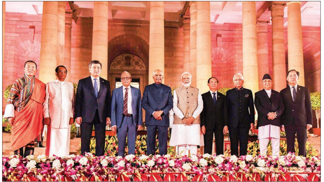
President U Win Myint (Fourth from Right) poses for documentary photo together with Indian Prime Minister Mr. Narendra Modi (Fifth from Right), Indian President Mr. Ram Nath Kovind (Sixth from Right) and leaders from regional countries.

AT THE invitation of His Excellency Shri Narendra Modi, Prime Minister of the Republic of India, U Win Myint, President of the Republic of the Union of Myanmar, paid a visit to India from 30 to 31 May 2019 to attend the Swearing-in Ceremony of the Prime Minister of India for the second term.