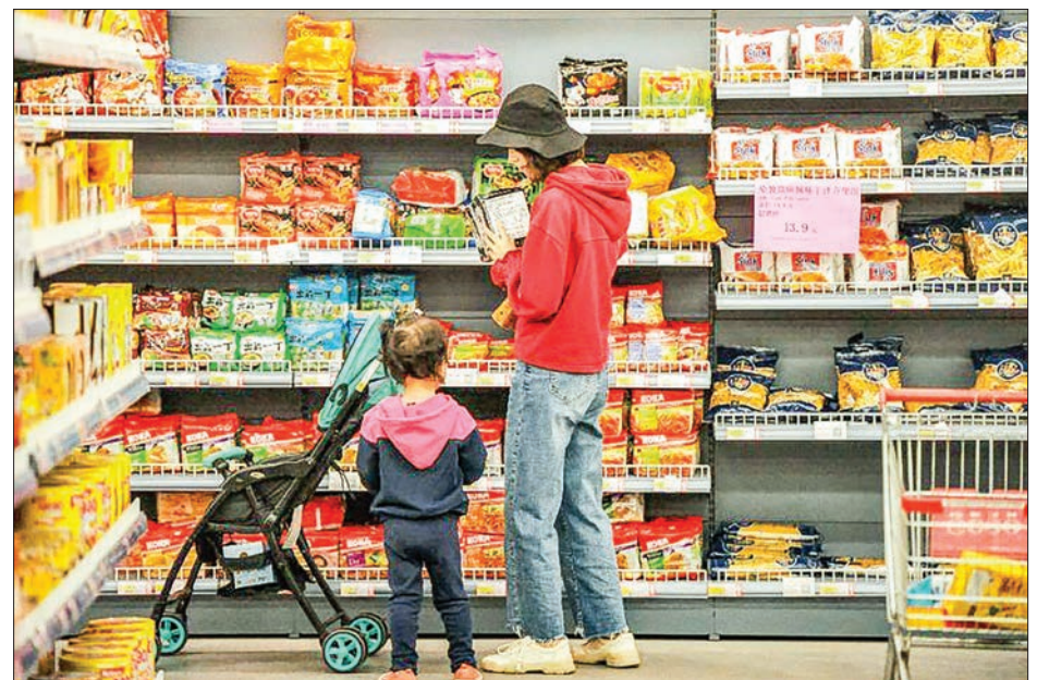
China will increase tariffs on $60 billion in American products on 1 June.

Tariffs are not the only weapons in the trade war.