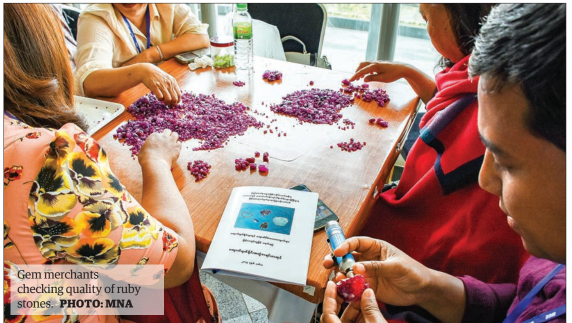
Gem merchants checking quality of ruby stones.