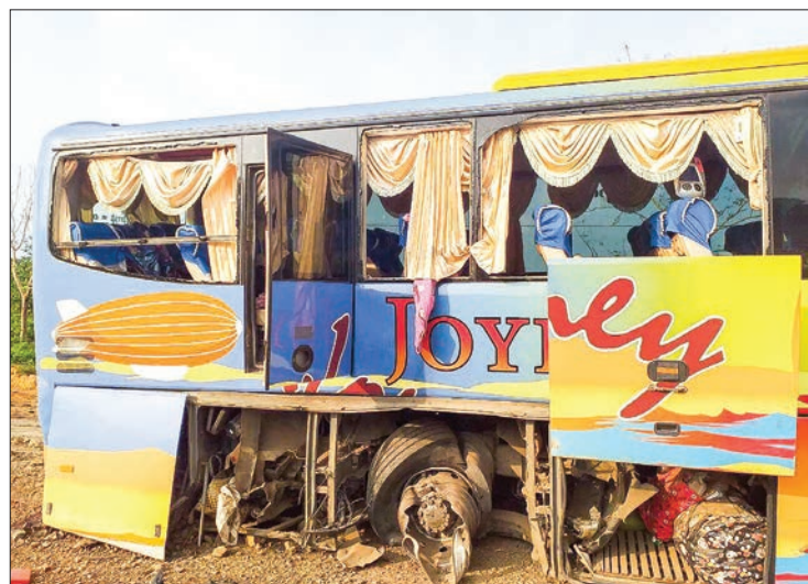
The damages on the passenger bus that hits the landmine planted by AA group on the Yangon-Sittway Road.