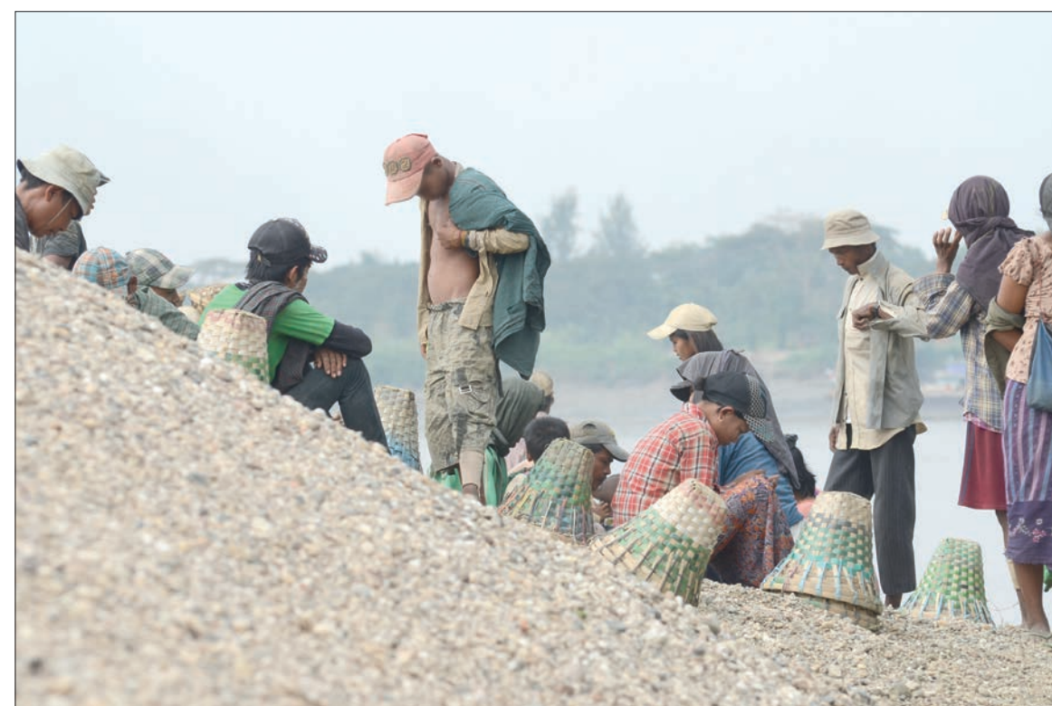
Teens at work in a farm.

The number of children aged between 5 and 17 is 12.4 million; 30% of them are rural child workers and 20% are urban children, outnumbering the latter by the former. Among them, children aged 15 to 17 are the most who