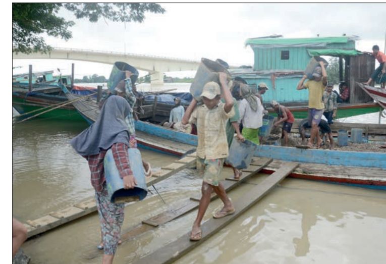
Children work at a pier.

Anti-slavery group (ASI) wants first of all to eradicate the