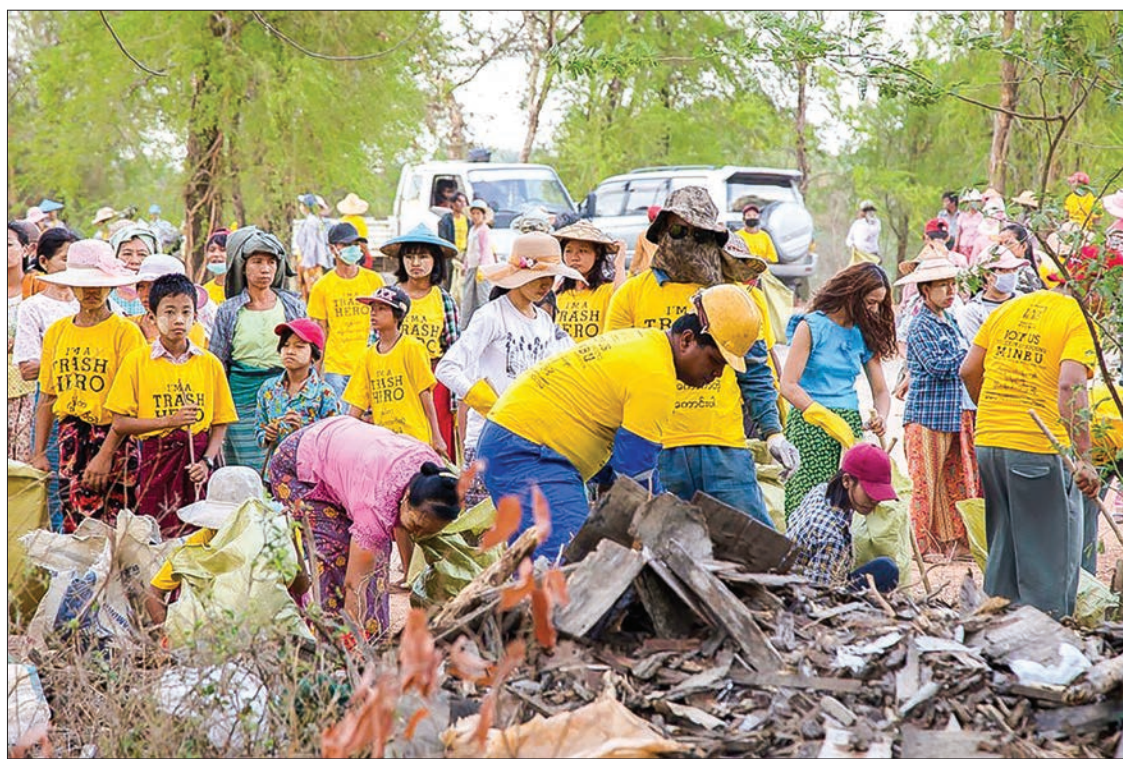
Trash Hero Minbu volunteers and local residents pick up litter in Minbu yesterday.