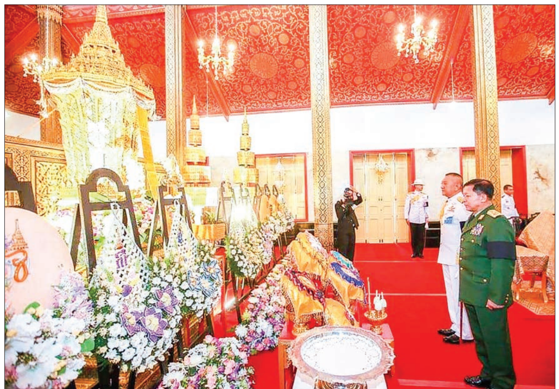
Senior General Min Aung Hlaing pays respects to the picture of the President of the Privy Council of Thailand General Prem Tinsulanonda in Thailand.

Later in the afternoon Tatmadaw Commander-in-Chief