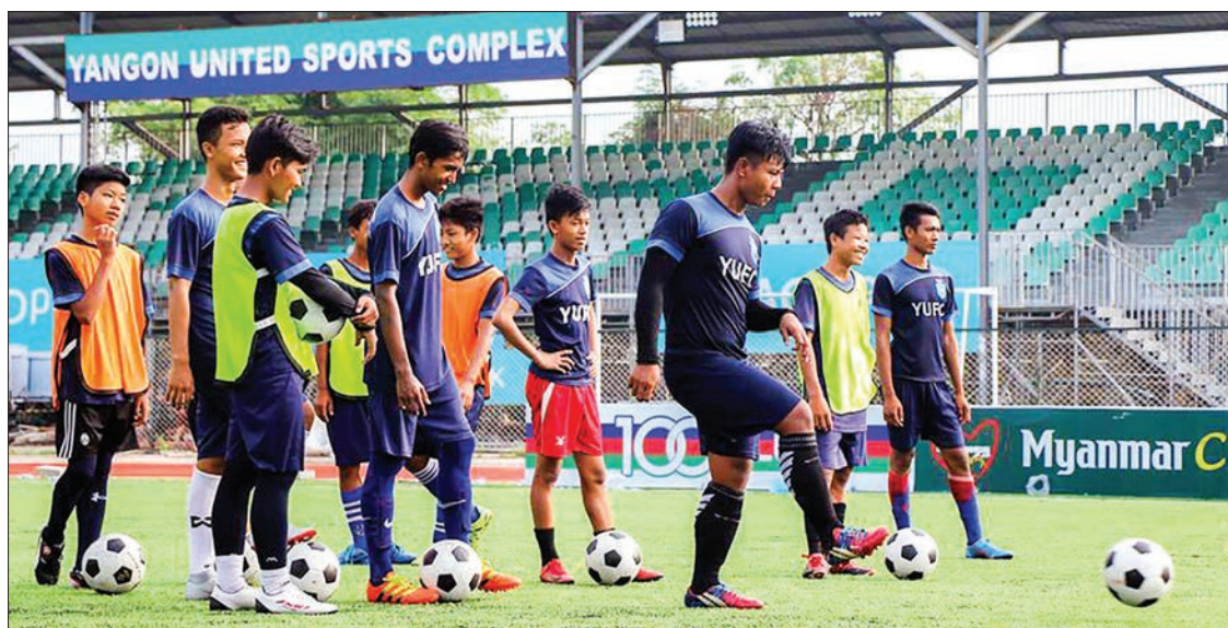
Youths taking part in a training session during the previous special football course at Yangon United's Sports Complex.

Youths can enrol their names for the course at the Yangon United Sports Complex in Hlaing Township during office hours, said officials. For further details, officials can be contacted on: 09 431 88 585 and 09 7777 88 409.—Lynn Thit (Tgi) ■