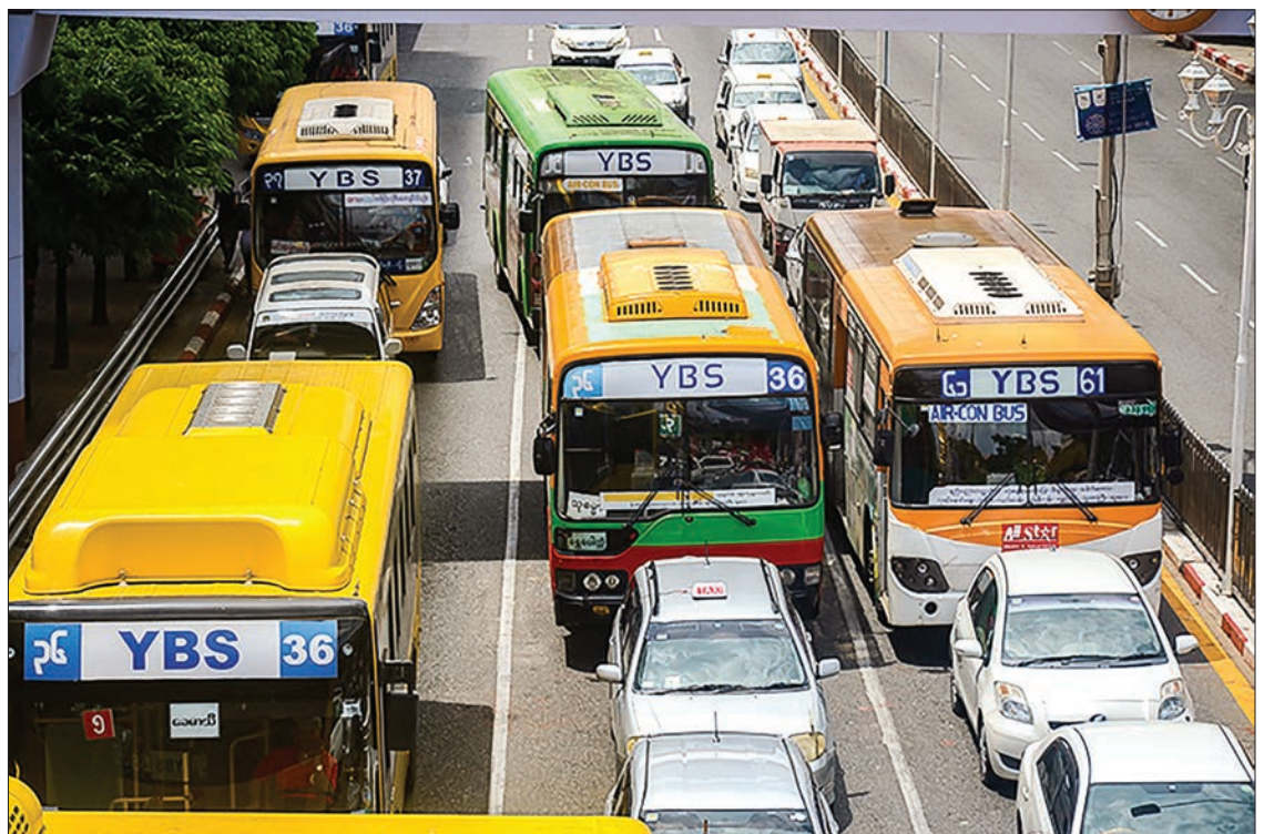
This photo shows YBS buses on a busy road in downtown area of Yangon.

delays in issuing smart cards to bus drivers. We are now scrutinizing the process from the basic level, including a careful examination of driver's licences at the Road Transport Administration Department. This is why some processes are facing a delay. The YRTA is now trying to issue smart cards as quickly as possible in order to maintain all records