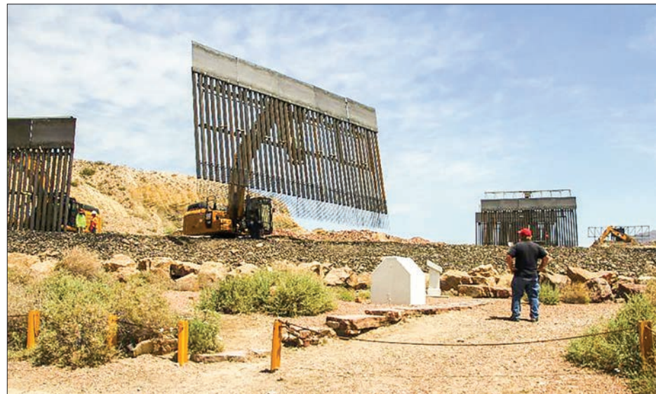
A US Customs and Border Protection photograph of the US-Mexico border.