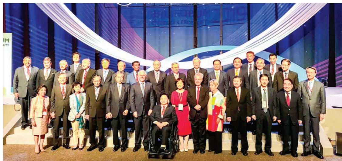
Union Minister for the Office of the State Counsellor's Office U Kyaw Tint Swe poses for the documentary photo with attendees at the 14 th Jeju Forum for Peace & Prosperity 2019 in Jeju.

UNION Minister for the Office of the State Counsellor U Kyaw Tint Swe attended the 14 th Jeju Forum for Peace & Prosperity 2019 organized by the Republic of Korea Ministry of Foreign Affairs and Jeju Free International City Development Center at International Convention Center, Jeju, ROK from 29 to 30 May.