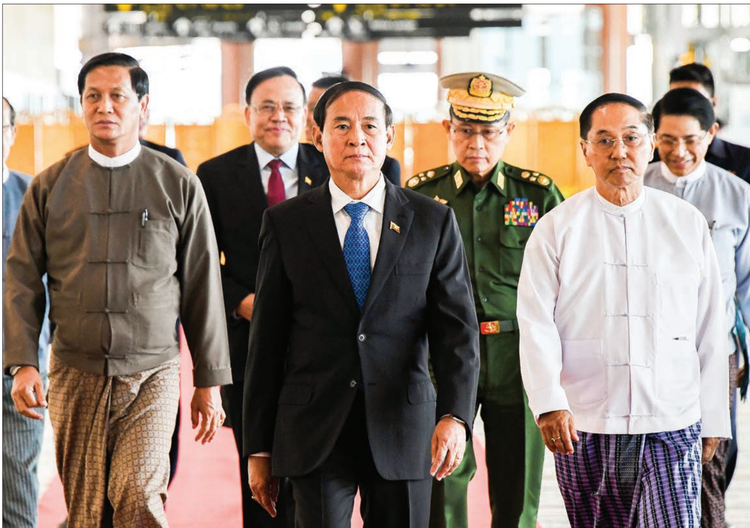
President U Win Myint (Center) being welcomed by Vice Presidents U Myint Swe and U Henry Van Thio (Left), Deputy Commander-in-Chief of Defence Services Vice-Senior General Soe Win and Union Minister U Min Thu at the Nay Pyi Taw International Airport as he arrives back from New Delhi, India yesterday.

P RESIDENT U Win Myint who was in the Republic of India, returned to Nay Pyi Taw yesterday morning by Myanmar National Airlines special flight.