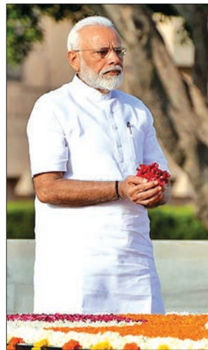
Indian Prime Minister-elect Narendra Modi pays tributes at Rajghat, the memorial to Mahatma Gandhi, before the swearing-in ceremony for his second term as Indian prime minister in New Delhi, India, 30 May, 2019.

NEW DELHI — Indian Prime Minister-elect Narendra Modi will hold bilateral meetings with the visiting six heads of state and government in New Delhi after taking the oath of office and secrecy, said official