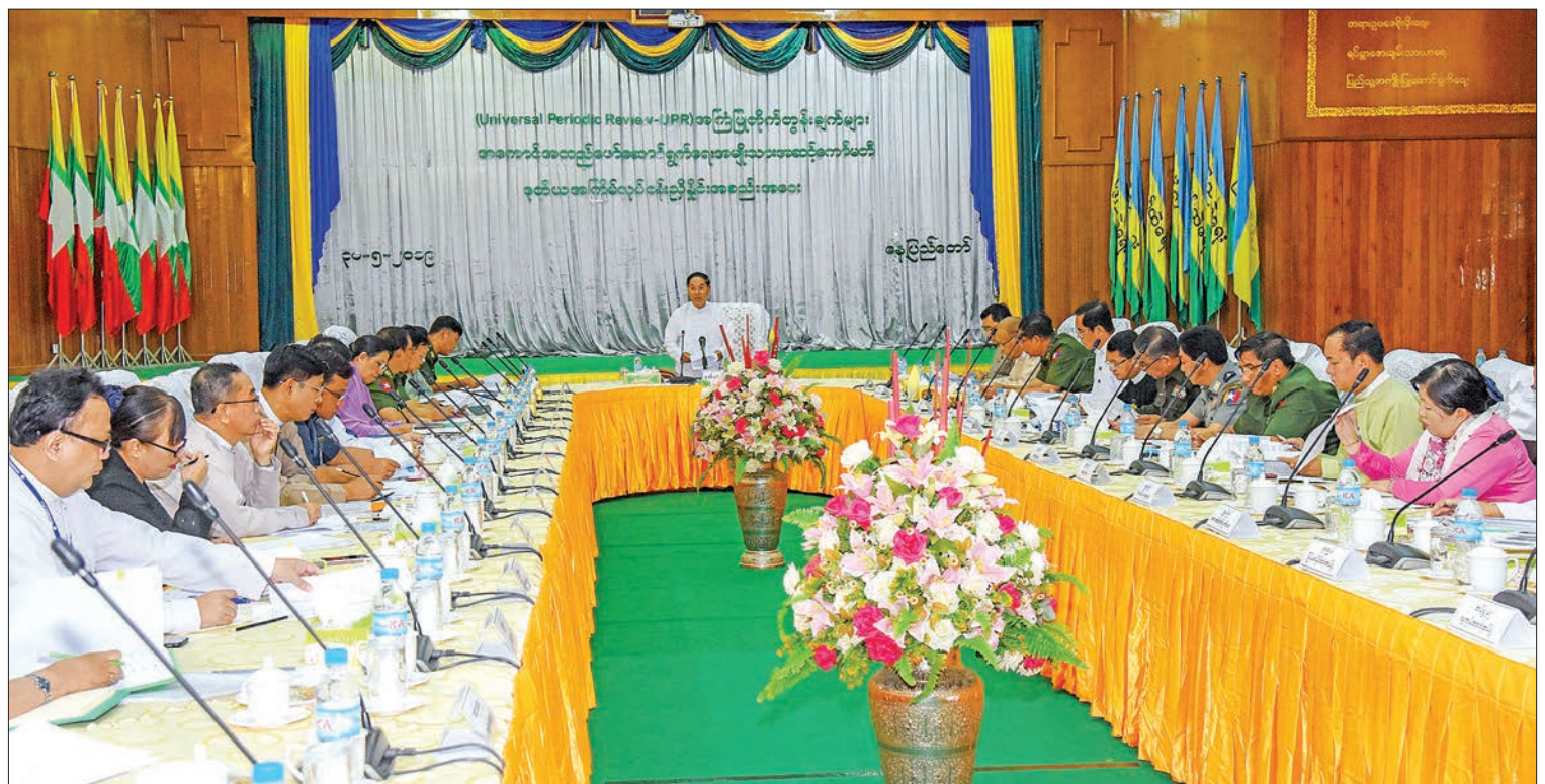
Vice President U Myint Swe delivers the speech at the second coordination meeting of a national-level committee on implementing recommendations of Universal Periodic Review in Nay Pyi Taw yesterday.

In his speech Vice President U Myint Swe said the 25-member Committee was formed with five work functions by the President Office on 19 October 2018 to establish and implement short term plans systematically before submitting a Third Cycle report of UPR in response to suggestions made on the UPR Second Cycle report. The five work functions were being implemented by forming 23-member Report Preparation Work Committee,