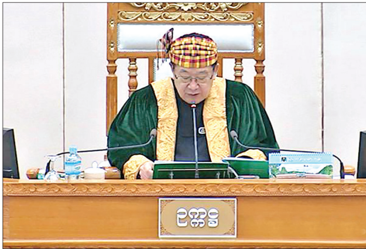
Pyithu Hluttaw Speaker U T Khun Myat.

In fiscal year 2018-2019 a rock-lined embankment 1,000 ft long will be constructed with Kachin State government fund K 270 million. The work was 75 per cent completed and it will be fully completed in the third week of June 2019. Furthermore Kachin State government agreed on K 300 million fund to construct a 1,000 ft. long rock-lined embankment in fiscal year 2019-2020 and the matter was submitted