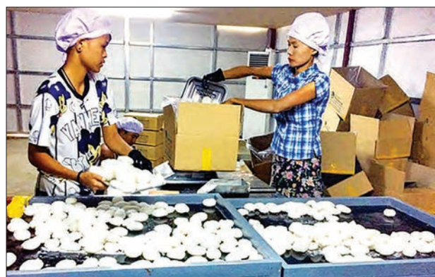
Ice apples being processed at a factory.

“Countries usually buy toddy palm seeds for making apple jelly. At present, Viet Nam is producing canned ice apples, and they are selling well in the market. Our company also plans to produce value-added ice apples,” he added. A single palm tree bears 230 palm seeds. Merchants from abroad purchase only the white seeds, called ice apples, for 20 kyats per piece.—GNLM ■ (Translated by Hay Mar)