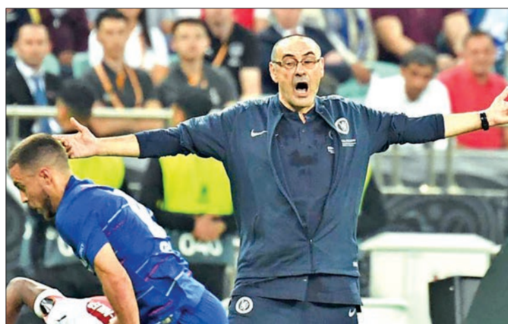
Chelsea's Italian head coach Maurizio Sarri (R) reacts during the UEFA Europa League final football match between Chelsea FC and Arsenal FC at the Baku Olympic Stadium in Baku, Azerbaijan, on 29 May, 2019.

"Of course the trophy is very important because we were in trouble in January and February and then we reacted.