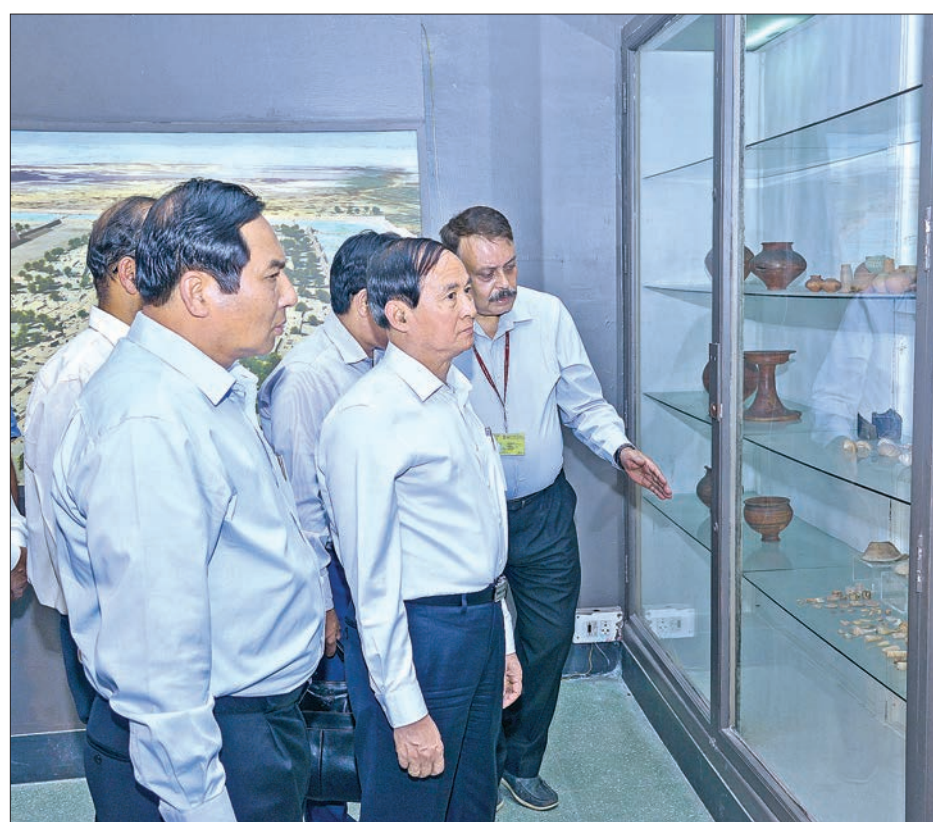
The Myanmar delegation led by President U Win Myint poses for documentary photo during their visit to the India Gate (Left Photo) and the delegation visits the National Museum in New Delhi yesterday before attending the wearing-in ceremony of Prime Minister Narendra Modi.