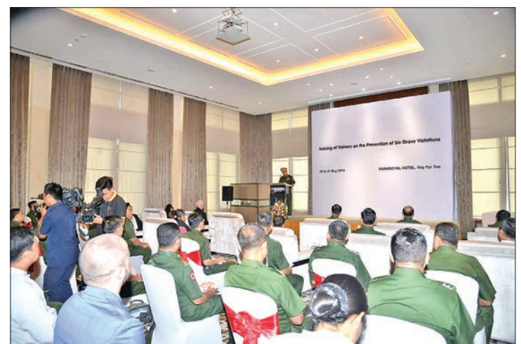
Brig-Gen Aung Kyaw Hein delivers the opening remarks at UN Country Task Force on Monitoring and Reporting.

The three-day training will conclude today and includes Tatmadaw officials from offices under the administration of the Office of the Commander-in-Chief (Army) and regional commands, and military recruiters.—MNA (Translated by Zaw Htet Oo)