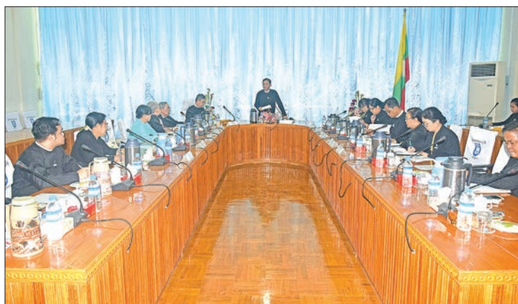
Union Attorney-General U Tun Tun Oo delivers the address at the meeting of the ASEAN Law Association (Myanmar).

UNION Attorney-General U Tun Tun Oo, in his capacity as Chairman of the ASEAN Law Association (Myanmar), attended the association's meeting No. 1/2019 at his office's meeting hall yesterday. Speaking at the meeting, the Union Attorney-General said the ALA was formed during the 'Legal Development in ASEAN Countries Conference' in Jakarta, Indonesia in February 1979 from a proposal to form a lawyers' network for the ASEAN region.