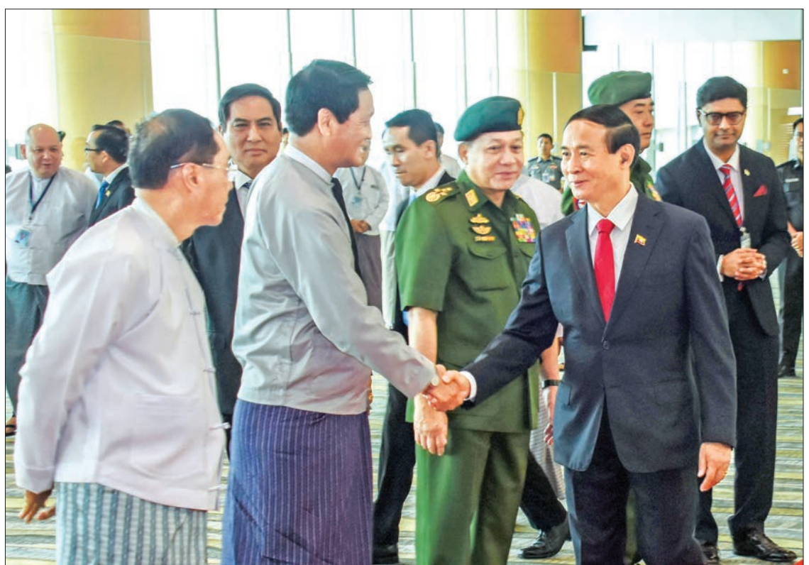
President U Win Myint is seen off by Vice Presidents U Myint Swe and U Henry Van Thio and Commander-in-Chief of Defence Services Senior General Min Aung Hlaing at the Nay Pyi Taw International Airport as he departs for India.