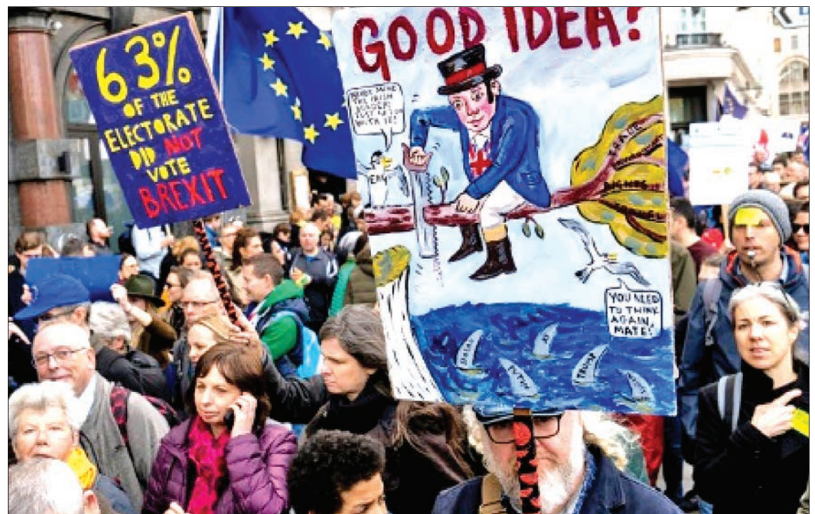
Hundreds of thousands of pro-Europeans thronged London in March, 2019, calling for another referendum on EU membership.

"Our free and straightforward EU Settlement Scheme has already seen 750,000 applications — which is immensely encouraging. I hope this early success continues in the coming months." —AFP ■