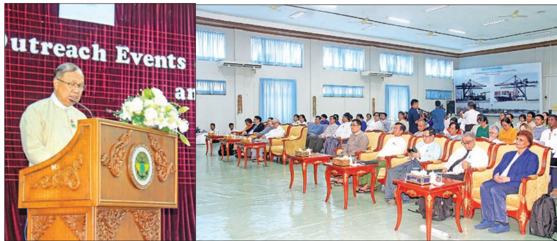
Union Minister U Thant Sin Maung delivers an address at the ceremony to open the "Outreach Events on IPCC Role, Activities and Findings" Seminar in Nay Pyi Taw.

SEMINAR titled "Outreach Events on IPCC Role, Activities and Findings" jointly organized by Intergovernmental panel on Climate Change - IPCC and Department of Meteorology and Hydrology (DMH) was held yesterday at Ministry of Transport and Communications in Nay Pyi Taw.