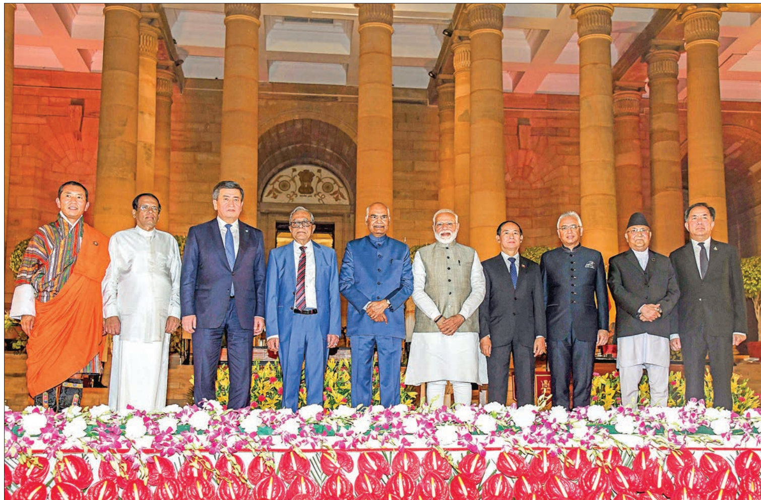
President U Win Myint (Fourth from Right) poses for documentary photo together with Indian Prime Minister Mr. Narendra Modi (fifth from Right), Indian President Mr. Ram Nath Kovind (sixth from Left) and leaders from regional countries.

The list of attending foreign high-ranking dignitaries included Sri Lankan President Mr. Maithripala Sirisena, Kyrgyzstan President Mr. Sooronbay Jeenbekov, Bangladeshi President Mr. Mohammad Abdul Hamid, Nepalese Prime Minister Mr. KP Sharma Oli, Bhutanese Prime Minister Dr. Lotay Tshering, Mauritian Prime Minister Mr. Pravind Kumar Jugnauth, and Thai Minister for Agriculture