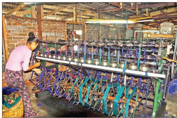
Machinery weaving is one of the popular SMEs in Meiktila.

“The RBF has provided 65 per cent funding to the Kaung Myat lathing and iron melting factory, which belongs to the ener-