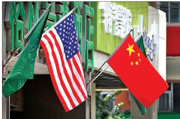
China accuses US of “naked economic terrorism” as Beijing ramps up the rhetoric in their trade war. The world's top two economies are at loggerheads as trade talks have apparently stalled.

lish-language state broadcaster China Global Television Network (CGTN) even held a rare debate on Thursday with a presenter from Fox Business Network to discuss the trade war after jousting on social media.