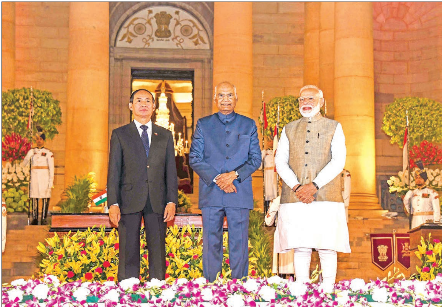
President U Win Myint (Left) poses for photo together with Indian President Ram Nath Kovind (Centre) and Prime Minister Shri Narendra Modi at the swearing-in ceremony of Prime Minister Modi at Presidential House of Rashtrapati Bhavan.