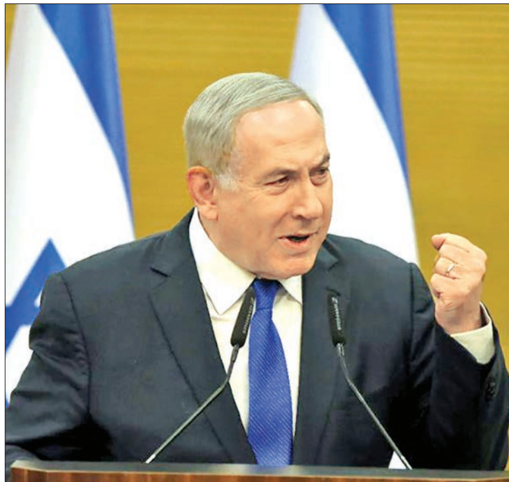
Israeli Prime Minister Benjamin Netanyahu looks set to push for a new general election just months after an April poll, for fear that he might otherwise lose control of coalition talks just as graft charges are set to be pressed against him.

The move prevents Netanyahu's nightmare scenario of Israeli President Reuven Rivlin selecting another person to