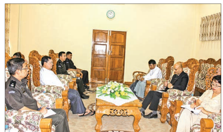
Union Minister U Thein Swe meeting with Resident Representative of UNFPA Mr. Ramanathan Balakrishnan.