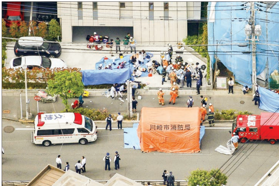
Photo taken from a Kyodo News helicopter shows the area in Kawasaki, near Tokyo, where more than a dozen people, including elementary school pupils, were injured after being stabbed on 28 May 2019.

Knives are among the most commonly used weapons in random attacks in Japan, where tight gun controls are in place. — Kyodo News ■