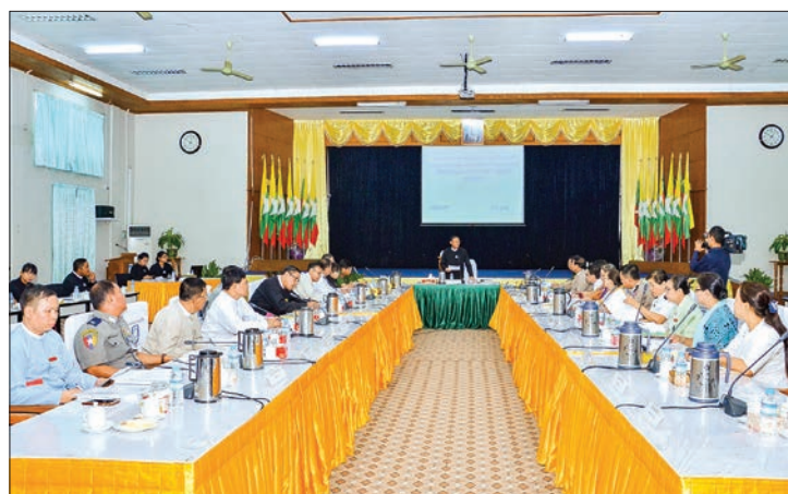
Union Attorney General U Tun Tun Oo delivers the speech at the first meeting of Universal Periodic Review (UPR) Myanmar Report Preparation Work Committee.