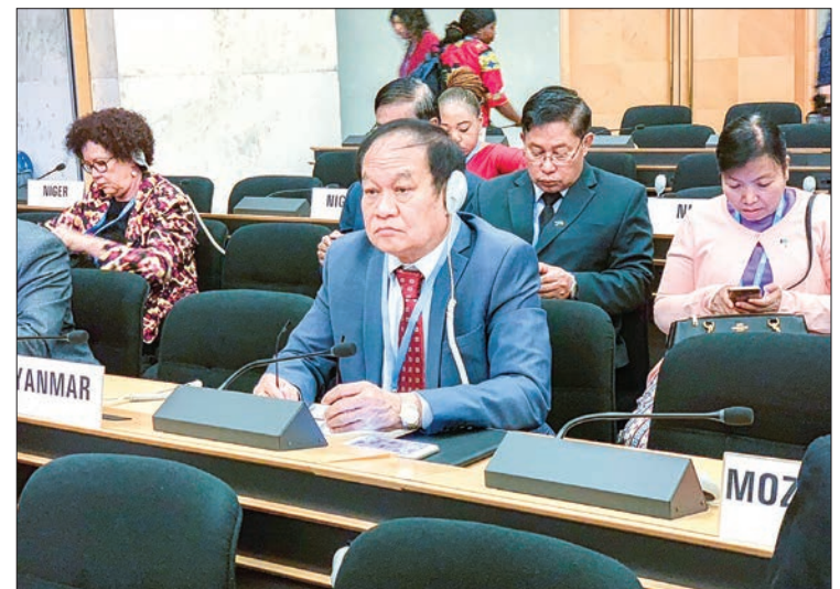
Union Minister Dr. Myint Htwe attends the 72 nd World Health Assembly (WHA72) in Geneva, Switzerland.