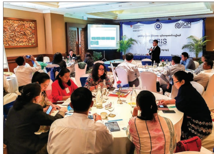
A workshop on International Recruitment Integrity System (IRIS) held at the Sule Shangri-La Hotel in Yangon yesterday.