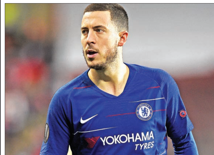
Madrid target: Chelsea's Eden Hazard.

"We met in my office and he told me he had a very good offer from a Chinese team but a rule there means they cannot pay for the transfer," Perez said. —AFP ■