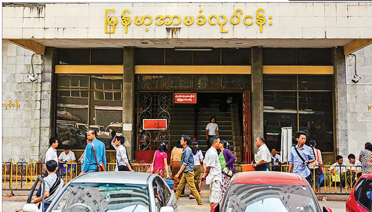
Head Office of Myanmar Insurance.

Majority of the people in Myanmar do not understand the advantage of insurance protection. Most also didn't prepare for the future as well. So they have little awareness of insurance. Unsurprisingly, insurance market in Myanmar was very small. Insurance penetration rate didn't even reach one percent. Following table shows the comparison of insurance penetration rates in Myanmar, Laos, Thailand and Viet Nam.