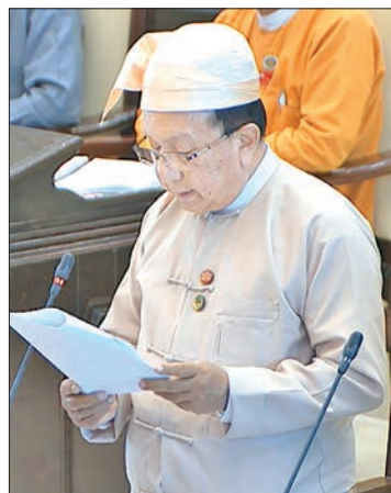
Union Minister for Construction U Han Zaw.