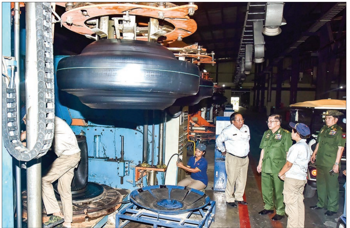
Senior General Min Aung Hlaing inspects the process of tyre production at the Ywama Tyre Factory of the Myanma Economic Corporation in Insein Township, Yangon yesterday.