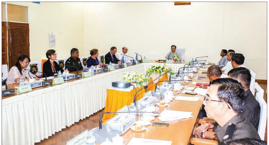
Union Minister U Thein Swe attends the ceremony to sign "Exchange of Letters" to extend a previous Memorandum of Understanding-MoU among Myanmar, UNDP and UNHCR in Nay Pyi Taw yesterday.

The Permanent Secretary of the Ministry of Labour, Immigration, and Population U Aye Lwin,