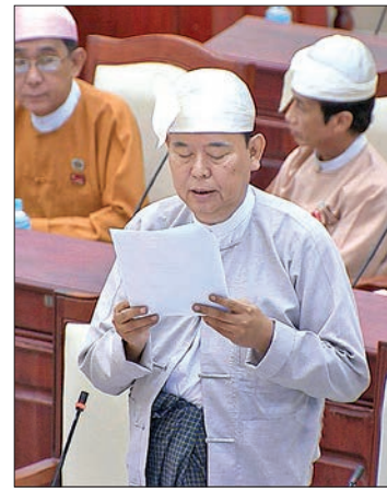
Deputy Minister for Education U Win Maw Tun.