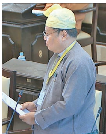
Supreme Court Judge U Myo Tint.