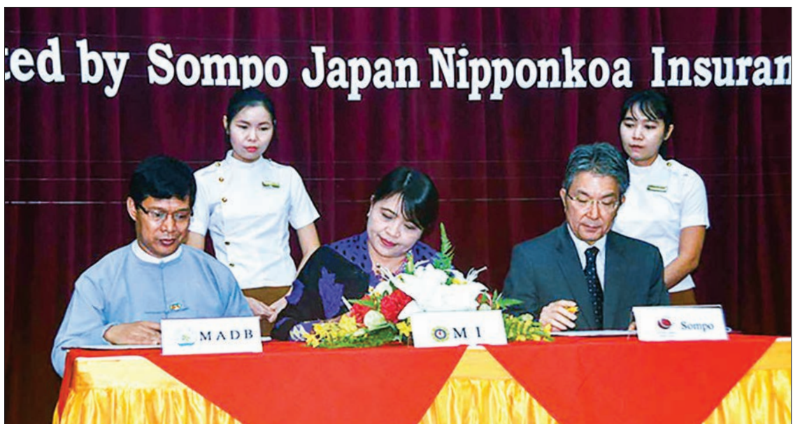
Officials sign the agreement at the ceremony among Myanmar Agriculture Development Bank, Myanmar Insurance and Sampo Japan Nipponkoa Insurance.

Three insurance companies from Japan were allowed to offer six kinds of insurance in Thilawa Special Economic Zone with temporary licences under the Special Economic zone Law in 2015. An Insurance Supervisory Committee was formed to start necessary preparation to let foreign insurance do their services in Myanmar market. Taking in to account the economic development of the State, incomes of the people, insurance market need, capacity of local insurance companies and people's knowledge on insurance industry, a road map was drawn to grant more freedom in the market where foreign insurance companies will be allowed to compete freely with one another and actions plans were adopted.