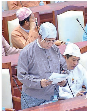
Deputy Minister for Natural Resources and Environmental Conservation Dr. Ye Myint Swe.