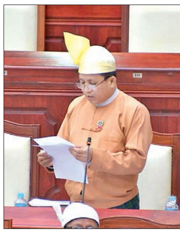
MP U Tun Myint.