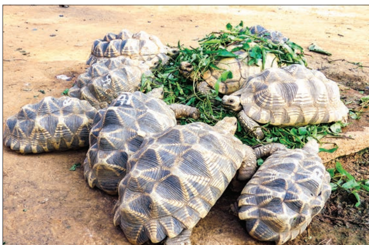
Star tortoises seen at the Shwese-taw Wildlife Sanctuary in Minbu District, Magway Region.

were four years old, and were being trained to be released in the sanctuary. They belonged to a group of 650 tortoises which had been sent to the forest in February. Since then, 63 star tortoises were bred in the sanctuary.