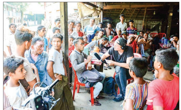
A foreign journalist interviews locals at Thae Chaung IDP camp in Sittway.

A media delegation including local and foreign journalists arrived in Sittway from Yangon yesterday by air. They then went to Thae Chaung IDP camp in Sittway Township, and reported the ground situation. The media delegation comprised of journalists from Asahi Shinbum, MIR, New York Times, De-Correspondent, MRTV, MITV and MNA. This is thirty-first visit of local and foreign media delegation to Rakhine State. — MNA ■ (Translated by Kyaw Zin Tun)