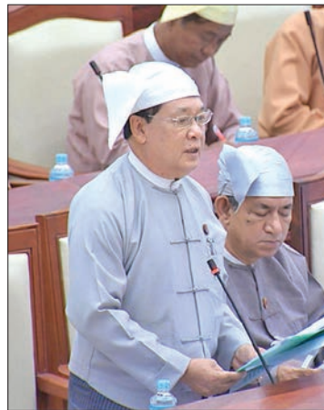
Union Minister for Labour, Immigration and Population U Thein Swe.

Deputy Minister for Education U Win Maw Tun also discussed in support of approving the motion.