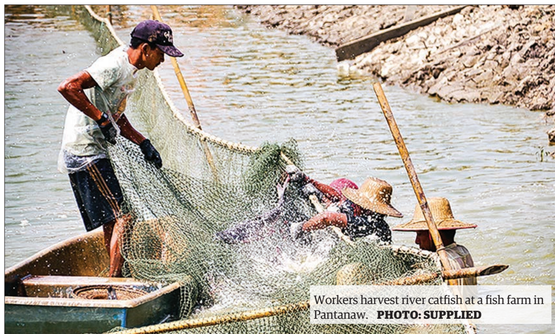
Workers harvest river catfish at a fish farm in Pantanaw.