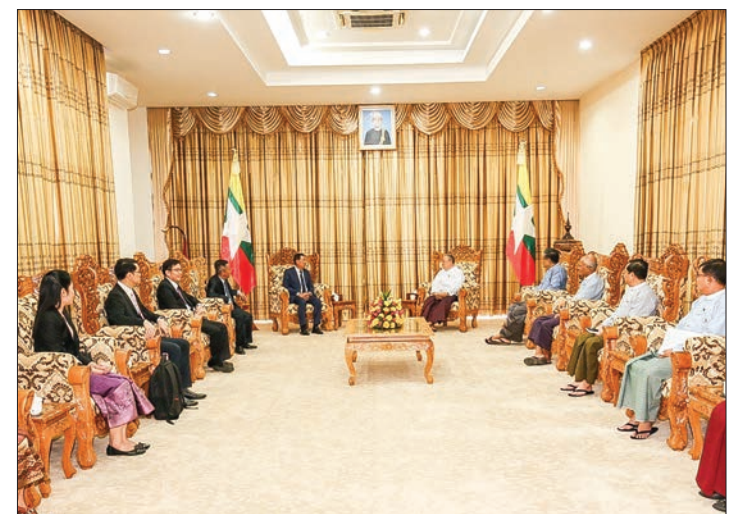
CBM Governor U Kyaw Kyaw Maung meets with Governor of the Bank of the Lao P.D.R, Mr. Sonexay SITPHAXAY in Nay Pyi Taw yesterday.

During the meeting, the Central Bank of Myanmar and the Bank of the Lao P.D.R discussed and exchanged views on matters relating to banking and other financial sector development such as monetary policy implementation and FX issues, banking supervision, cross-border workers' remittance, and bilateral swap arrangement. The bilateral meeting successfully completed at 12:50p.m.—MNA