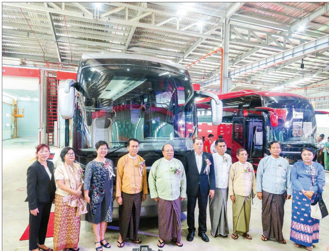
Union Minister U Thaung Tun, Yangon Region Chief Minister U Phyo Min Thein and attendees pose for a photograph at the opening ceremony of the SC Auto (Myanmar) Factory in Yangon yesterday.

U THAUNG TUN, Union Minister of the Ministry of Investment and Foreign Economic Relations and Chairman of the Myanmar Investment Commission (MIC), attended the opening ceremony of the SC Auto (Myanmar) Factory in the Yangon Industrial Zone of Mingalardon Township this morning.