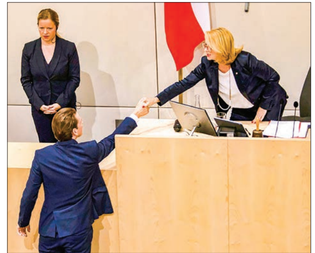
Austrian Chancellor Sebastian Kurz has lost a no-confidence vote in parliament.

But that did not stop opposition parties tabling the no-confidence motion and insisting that the