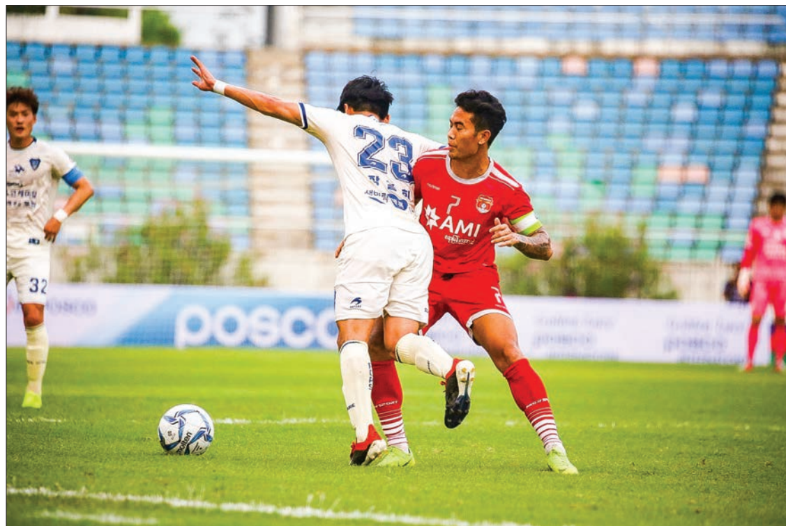
A player from Ayeyawady United F.C. (red) vies for the ball with a player from Pohang Steelers during a friendly match at the Thuwunna Stadium in Yangon yesterday.