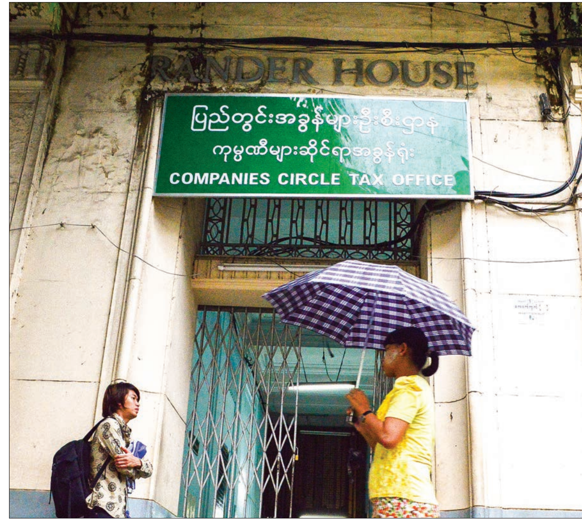
Under the Myanmar Income Tax Law, resident nationals and resident foreigners are taxed all income derived from sources within and outside Myanmar.

With the grace of nature, Myanmar has the favorable condition