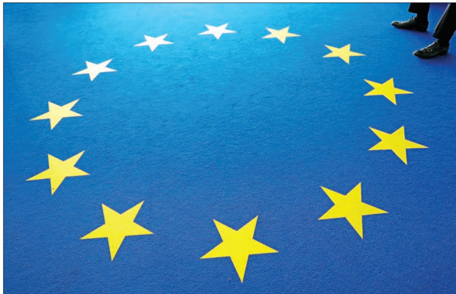
Under EU treaty law, the European Council of 28 national leaders nominates a commission president, then the new 751-member parliament ratifies their choice.

BRUSSELS (Belgium) — European leaders descended on Brussels on Tuesday to begin the hunt for a new generation of top EU officials in the wake of elections that shook up traditional alliances.