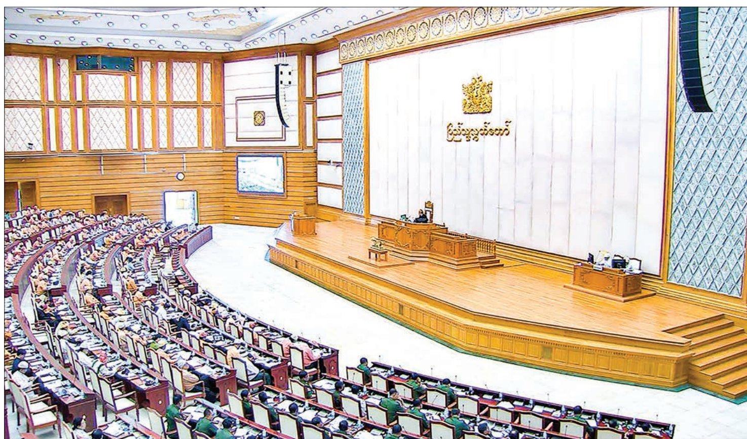
12 th -day meeting of the Second Pyithu Hluttaw's twelfth regular session is being convened in Nay Pyi Taw yesterday.

AT THE 12 th day meeting of the Second Pyithu Hluttaw's 12 th regular session held at Pyithu Hluttaw meeting hall yesterday morning, questions raised by 13 Hluttaw representatives were answered by union level officials and a motion discussed and approved.