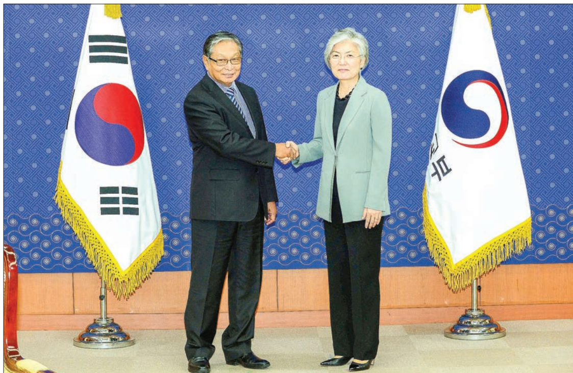
Union Minister U Kyaw Tint Swe shakes hands with Republic of Korea (ROK) Foreign Minister Mrs. Kang Kyung-Wha on 27 May.