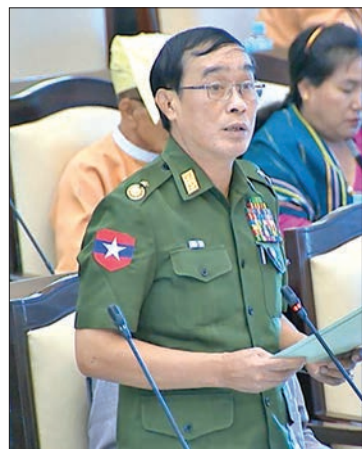
Deputy Minister for Border Affairs Maj-Gen Than Htut.