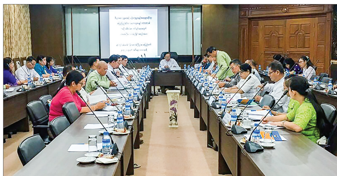
Union Minister U Kyaw Tin attends the first coordination meeting for the preparation of Initial Report for the International Covenant on Economic, Social and Cultural Rights.

After that, the participants joined in the discussion on the preparation of the Initial Report.—MNA