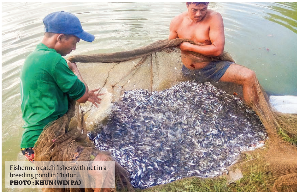
Fishermen catch fishes with net in a breeding pond in Thaton.