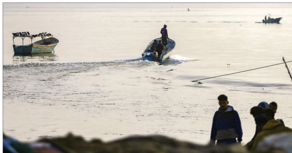
A bigger fishing zone is important to Gaza fishermen as it brings more valuable, deeper water species within reach.

Four Israeli civilians and 25 Palestinians, including at least nine militants, were killed in an escalation earlier this month. —AFP ■