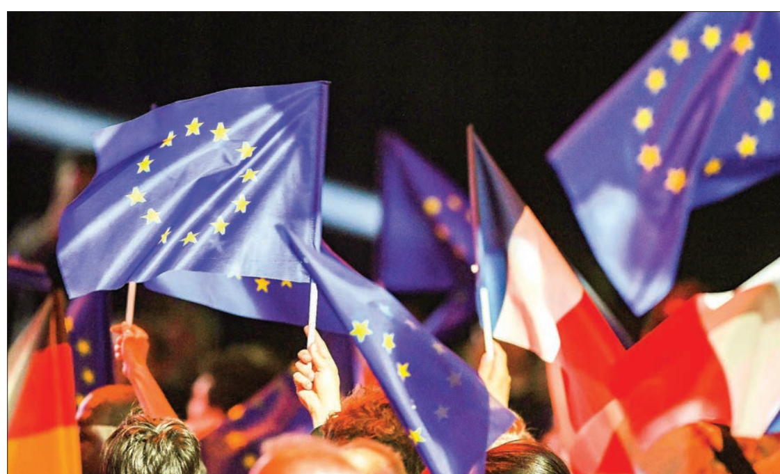
France is among the 21 countries voting Sunday in the European elections as nationalist right and pro-EU forces battle to chart a course for the bloc.

The far-right parties of Italian deputy PM Matteo Sal-