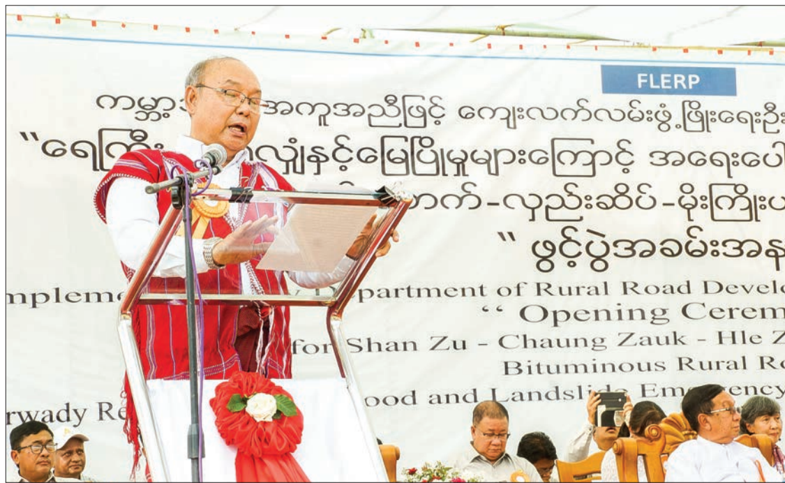
Amyotha Hluttaw Speaker Mahn Win Khaing Than delivers the speech at the opening ceremony of inter-village tar road in Kyonpyaw Township, Ayeyawady Region yesterday.