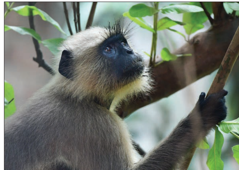
India is home to large family of monkeys species. An endangered langur monkey sitting on tree top.

sharing international borders will also help in reduction and prevention of border area crimes (such as abduction, kidnapping, rapes, molestation, extortion and smuggling) successfully.