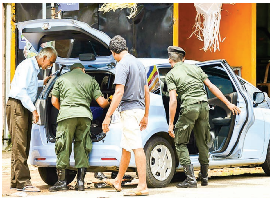
Some 3,000 military personnel were deployed in and around the capital as well as other key towns for cordon-and-search activities.

A few were also detained along with video and other propaganda material of the local jihadi group, the National Thowheeth Jama'ath (NTJ) which has