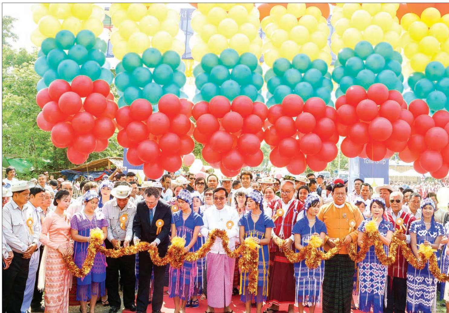
Amyotha Hluttaw Speaker Mahn Win Khaing Than, Union Minister U Han Zaw and officials open the new inter-village tar road in Kyonbyaw Township, Ayeyawady Region yesterday.

AN INTER-VILLAGE tar road was opened in Kyonbyaw Township, Ayeyawady Region, yesterday, as part of the rural roads, bridges, rural economic and transport development project.