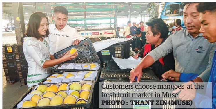
Customers choose mangoes at the fresh fruit market in Muse.

MYANMAR exported 4,970 tons of mangoes to China through Muse 105 th mile border trade zone in the second week of this month,