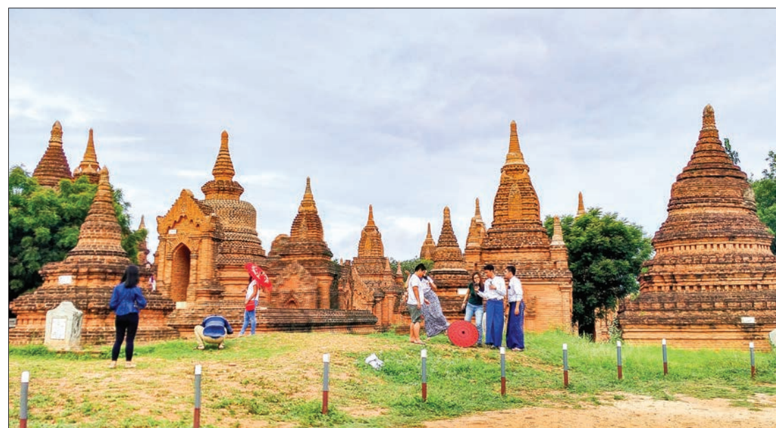
Holiday-makers visit the pagodas in Bagan, which is submitted for inclusion in the UNESCO's World Heritage List.

but have been dismissed for not meeting certain standards or requirements. But now, the Department of Archaeology and Na-