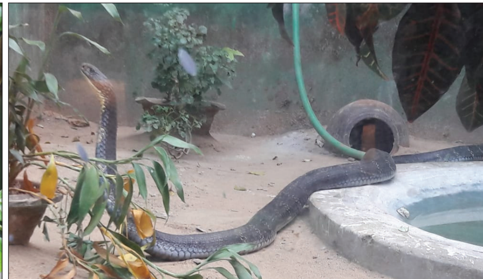
South Asia's snakes exhibit a remarkable diversity of colour, patterning, shape and size.

locations will bring in employment and economic prosperity for the local communities.