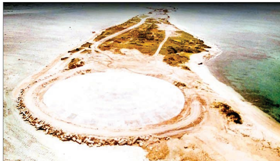
The huge dome built over top of a crater left by one of the nuclear tests over Runit Island in Enewetak in the Marshall Islands.

MAJURO (Marshall Islands)—As nuclear explosions go, the US “Cactus” bomb test in May 1958 was relatively small—but it has left a lasting legacy for the Marshall Islands in a dome-shaped radioactive dump.