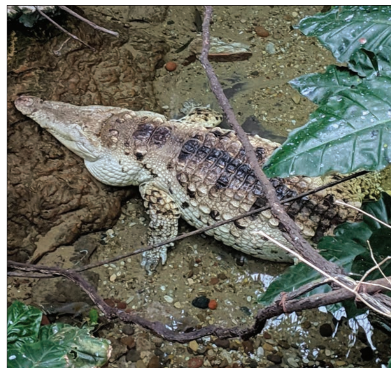
Crocodiles and alligators are some of the biggest reptiles on Earth.

development; while the other could be used for the conservation of forest, wildlife and biodiversity. This could be a win-win situation for all as this will make the ecology and economy to be integrated together if planned judiciously and executed carefully with environmental assessment of the local ecosystems regularly and diligently.