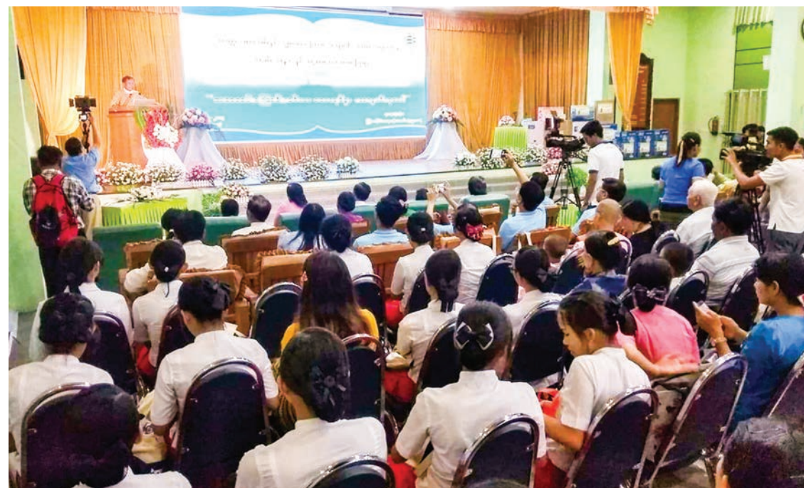
World Digestive Health Day 2019 event being convened in Mandalay yesterday.