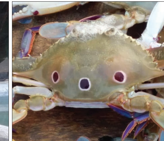
A tiny freshwater crab Amarinus lacustris with three eyes.

living in remote forested areas of the BIMSTEC member nations. This could a new initiative in integrating ecology and economy together.