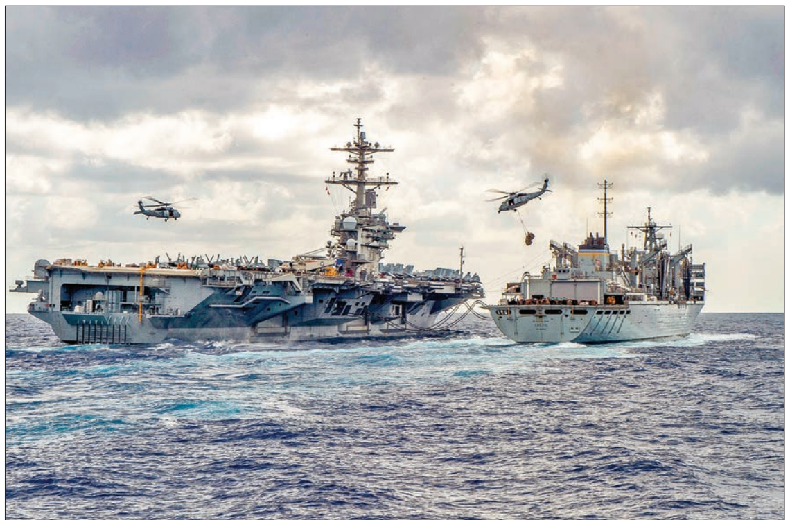
Washington has deployed an aircraft carrier group and B-52 bombers to the Gulf against what it claims is an imminent threat from Tehran Navy Office of Information. PHOTO: AFP

Washington says the latest reinforcements are in response to a "campaign" of recent attacks including a rocket launched into the Green Zone in Baghdad, explosive devices that damaged four tankers near the entrance to the Gulf, and drone strikes by Yemeni rebels on a key Saudi oil pipeline. Iran has denied any involvement. On May 15, the United States ordered the