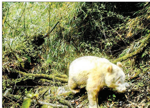
The albino panda was photographed while trekking through the forest in southwestern Sichuan province.

The number living in the wild has dwindled to fewer than 2,000, according to the World Wildlife Fund.