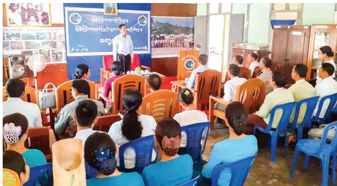
Deputy Minister U Aung Hla Tun meets with employees of the Information and Public Relations Department in Pasawng Township yesterday.

and other departments for the benefits of their region, to be cautious about security and to put works of the staff on record systematically and truthfully.—MNA ■ (Translated by Alphonsus)