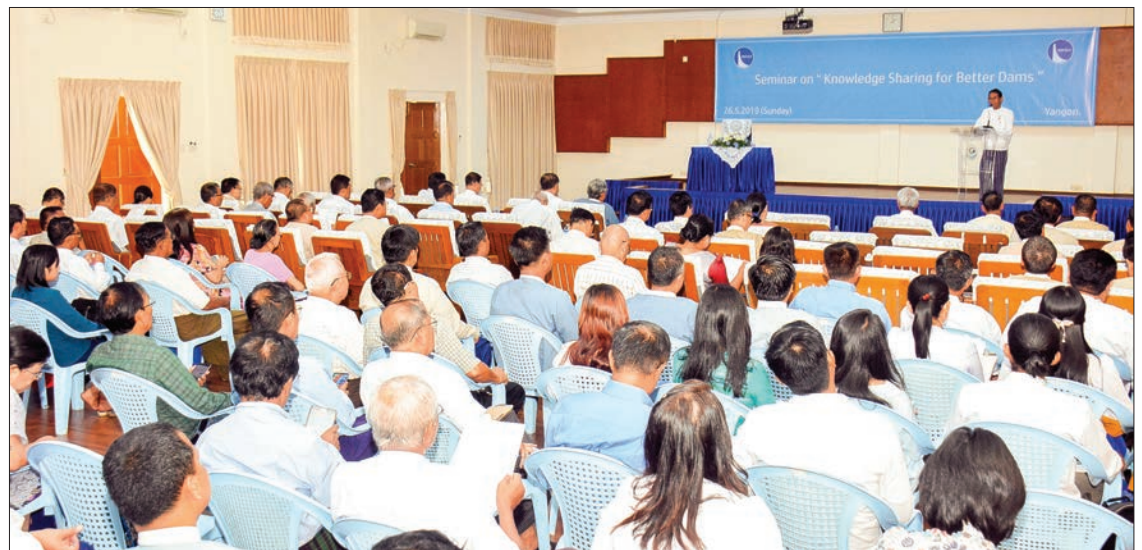
Union Minister Dr. Aung Thu delivers the speech at Seminar on Knowledge Sharing for Better Dams in Yangon yesterday.

Also present were patrons and members of the MNCLD, officials of the Department of Irrigation and Water Utilization