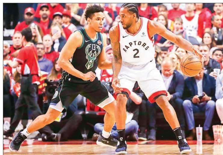
Toronto's Kawhi Leonard, right, dribbles into Milwaukee's Malcolm Brogdon in the Raptors' series-clinching victory Saturday which puts them in their first NBA final.

at a time," Leonard said. "We kept fighting all game. The calls were not going our way, but we kept striving and striving." The victo-