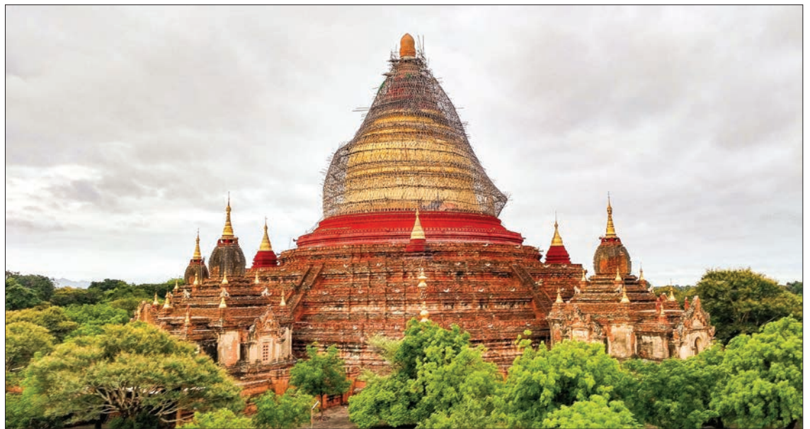
Dhamma Ya Zi Ka Pagoda in Bagan.

Authorities have been applying for Bagan's inclusion on the World Heritage List since 1996