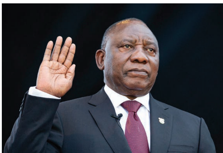
Cyril Ramaphosa raises his right hand as he takes the oath of office at his inauguration as South African President, at Loftus Versfeld stadium in Pretoria, on 25 May 2019.

Ramaphosa faces a herculean task to tackle the country's many problems — from a sickly economy, in which more than a quarter of the workforce is jobless, to land ownership that