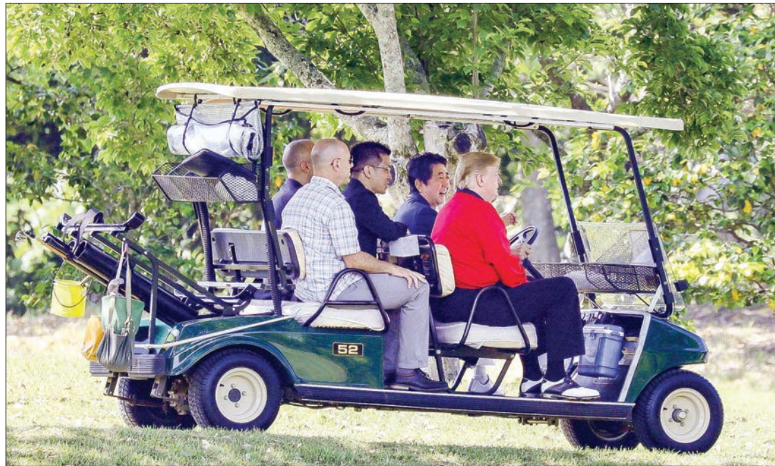
Japanese Prime Minister Shinzo Abe (Front l) and U.S. President Donald Trump (Front r) head for the course in a buggy to play golf together near Tokyo.

“Great progress being made in our Trade Negotiations with Japan. Agriculture and beef heavily in play,” Trump wrote, a sign that he will not prod Abe for a swift conclusion of the ongoing bilateral trade talks when they