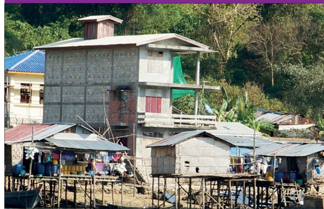
မြောက်ပိုင်း ပြည်ထောင်စုရှိ မြေပုံအရပ်များတွင် တွေ့ရှိရသော မြေပုံအရပ်များ