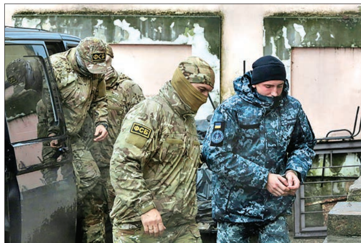
A Russian FSB security service officer escorts a detained Ukrainian sailor in Crimea in November — a total of 24 sailors are still being held by Russia along with three naval vessels from Ukraine.

The new Ukrainian leader has urged Washington to impose more sanctions against Russia — prompting a swift warning from the Kremlin that such action would not help end the war in the east. — AFP ■