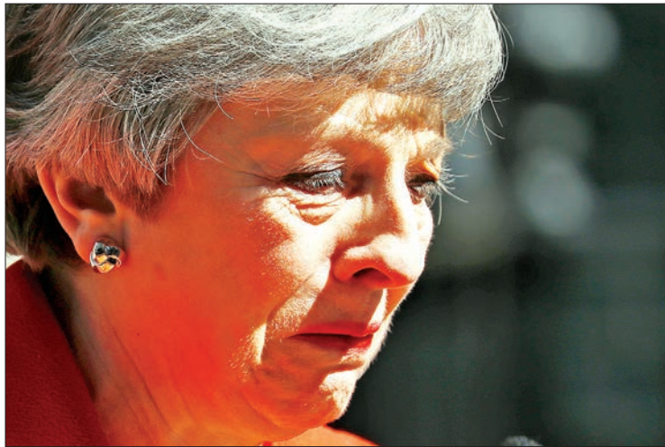
The pound’s fate now hinges on who comes next.

share markets rebounded after the previous day’s sharp-selloff sparked by the China-US trade war and global economic worries. US stocks also nudged higher, although the gains were not enough to offset losses earlier in the week. The Dow retreated for the fifth straight week, its longest losing streak since 2011. After a strong run for the stocks in the first four months of the year, fresh trade war anxiety has roiled markets throughout May as the United States and China have announced new tariff measures amid sharpening rhetoric.