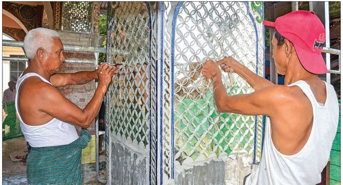
Glass mosaic artists create art work at the Pagoda on Mandalay Hill.

In 1991, there were over 400 glass mosaic artists in Mandalay region. Currently, there are