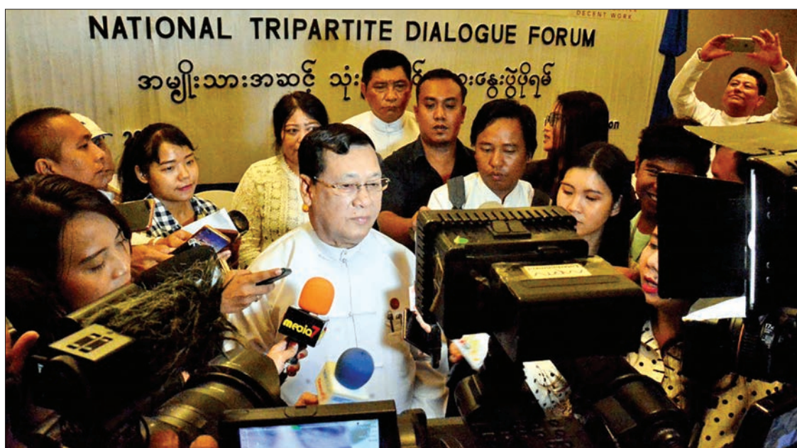
Union Minister U Thein Swe meets with journalists at National Tripartite Dialogue Forum in Yangon. yesterday.

Myanmar is a signatory to the Forced Labour Convention 29 of the ILO.—Ye Khaung Nyunt ■ (Translated by Kyaw Zin Lin)