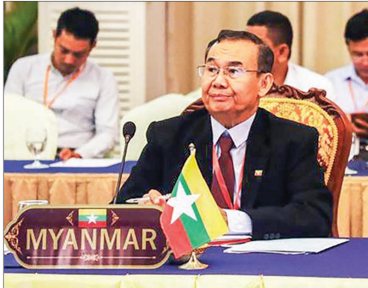
Union Minister U Ohn Win attends Fourteenth Meeting of the Technical Working Group on Transboundary Haze Pollution in Siem Reap, Cambodia.

UNION Minister for Natural Resources and Environmental Conservation U Ohn Win arrived back in Myanmar yesterday afternoon