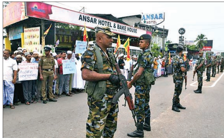
Security forces have arrested scores of suspects in connection with the bombings and over what appeared to be organised violence against the island's Muslim minority.

Sirisena said the move was to maintain "public security", with the country still on edge after the attacks on three hotels and three churches that were blamed on a local jihadi