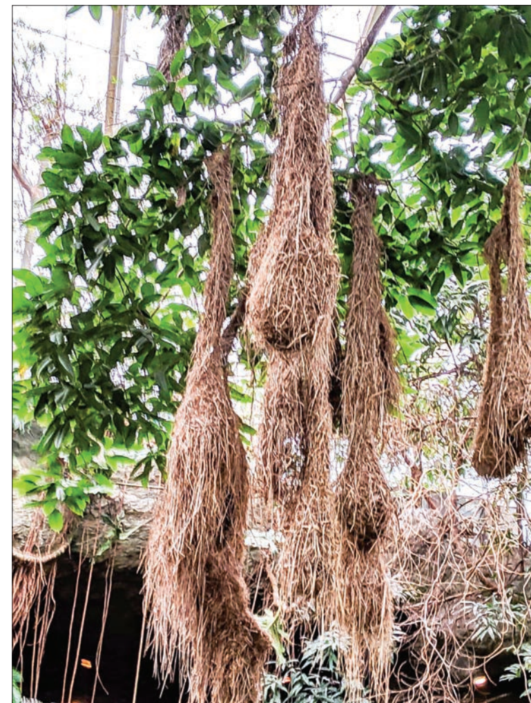
Bird nests that hang from small branches.