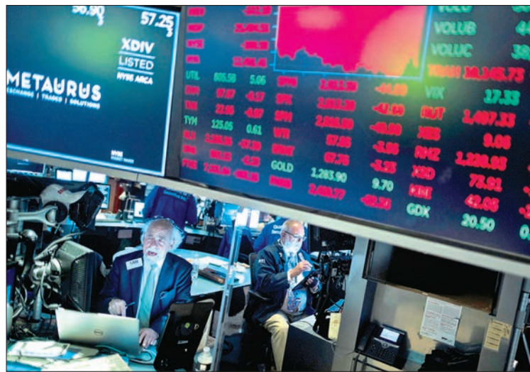
Traders work ahead of the closing bell at the New York Stock Exchange (NYSE) on Wall Street in New York City on 23 May 2019.

In 2018, Mexico’s GDP grew by 2 per cent. The country’s economy, the second largest in Latin America after Brazil, depends heavily on the economic cycles of the United States, its main business partner. — Xinhua ■