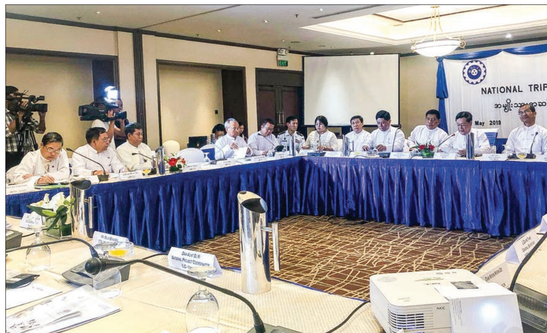
Ministry of Labour, Immigration and Population hosts the 13 th National Tripartite Dialogue Forum in Yangon yesterday.

and employee organizations supports mutual respect, understanding, trust and worksite/workplace peace and tranquility and protects the benefits of both the employers and employees.