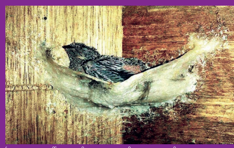
မြောက်ပိုင်း ပြည်ထောင်စုရှိ မြေပုံအရပ်များတွင် တွေ့ရှိရသော မြေပုံအရပ်များ