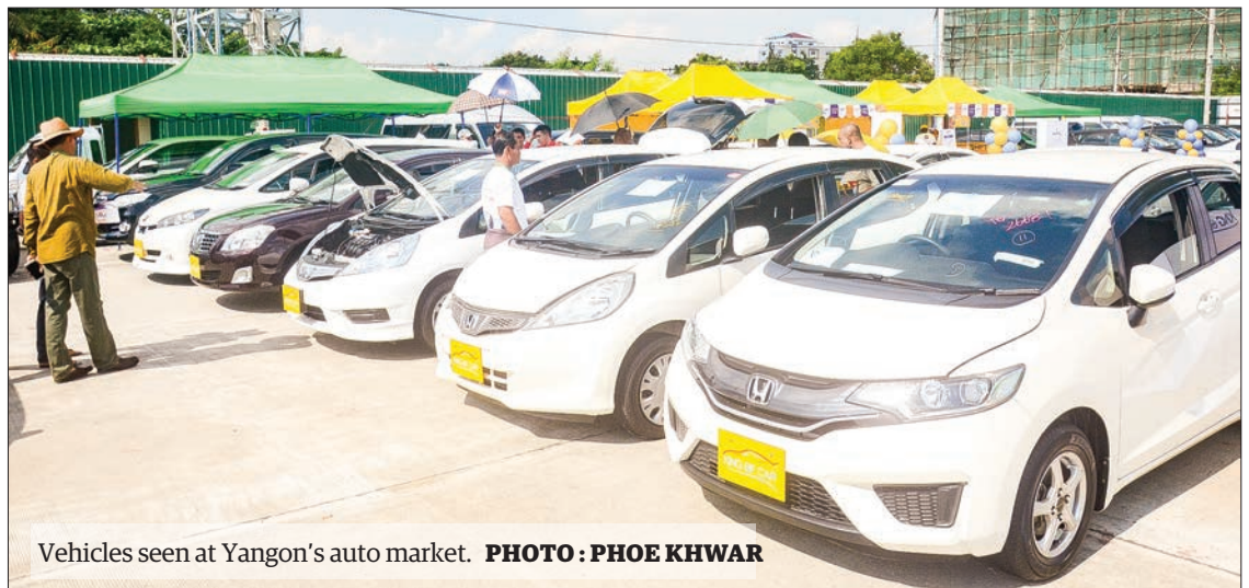
Vehicles seen at Yangon's auto market.