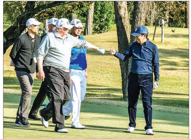
The relationship between Donald Trump and Shinzo Abe has been hailed as 'unprecedented' by Japanese and US officials.

He added: "We hope to have several further announcements soon and some very big ones