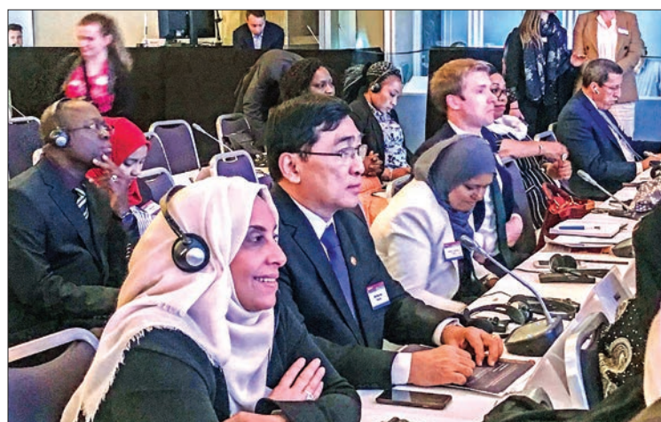
Union Minister Dr. Win Myat Aye attends the international conference on Ending Sexual Violence in Humanitarian Crises in Oslo, Norway.

UNION Minister for Social Welfare, Relief and Resettlement Dr. Win Myat Aye attended