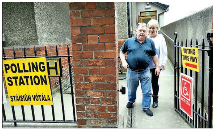
After Ireland voting continues for a third day in EU-wide elections across the continent with populists hoping for an upset victory.

Polling has shown for months that populists and the anti-immigration far right could make big gains in the vote, which will also help determine who replaces Jean-Claude Juncker as head of the European Commission as well as other top jobs. An exit poll after voting in the Netherlands on Thursday however showed a surprise victory for pro-EU socialists, giving hope to establishment forces elsewhere in the