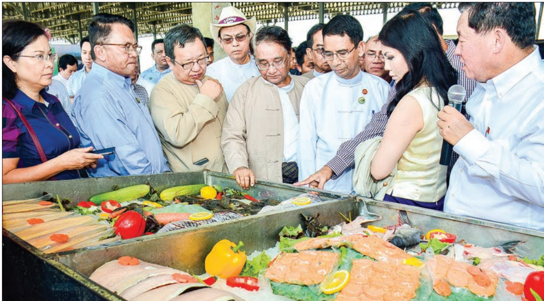
Union Minister Dr. Aung Thu visits the cold storage and fish cracker factory in Pantanaw Township yesterday.

A ceremony to lay foundation for a modern cold storage and fish cracker factory in the Food Industry Complex project at Ayeyawday Region, Pantanaw Township was held in the project compound yesterday morning. The Food Industry Complex project was implemented by Global Earth Agro & Aqua Industry Public Company Limited.