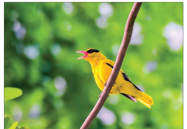
Black naped oriole.