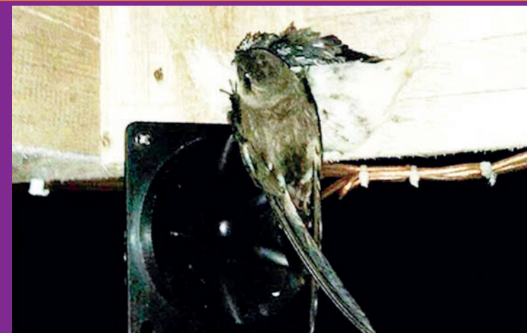
မြောက်ပိုင်း ပြည်ထောင်စုရှိ မြေပုံအရပ်များတွင် တွေ့ရှိရသော မြေပုံအရပ်များ