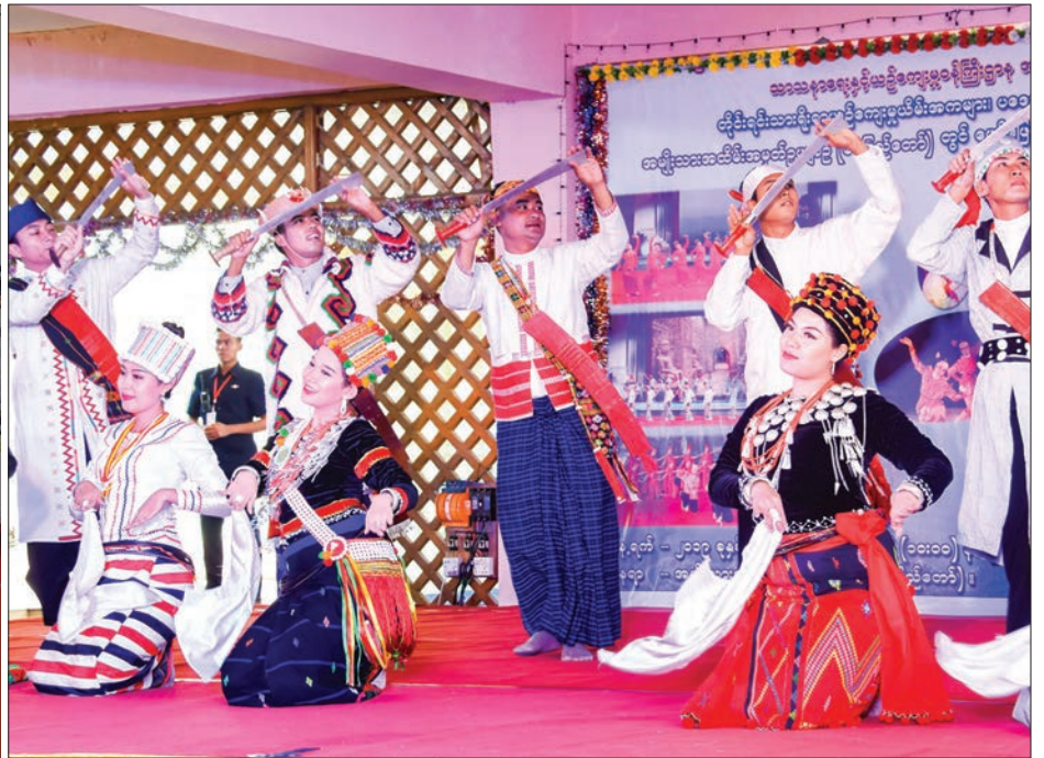
Vice President U Henry Van Thio, Union Ministers, Deputy Ministers and officials enjoy the traditional ethnic performance at the National Landmark Garden in Nay Pyi Taw yesterday.