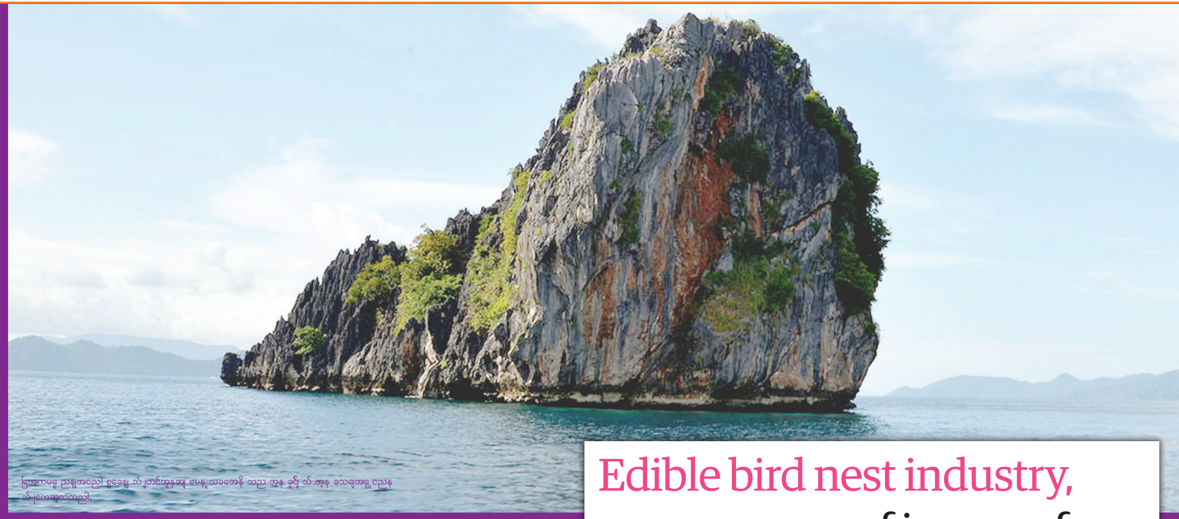
မြောက်ပိုင်း ပြည်ထောင်စုရှိ မြေပုံအရပ်များတွင် တွေ့ရှိရသော မြေပုံအရပ်များ