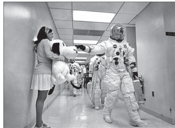
The Apollo 10 mission became synonymous with Snoopy and Charlie Brown in the minds of the public, because the three-man crew named their lunar module and command module after the iconic cartoon characters.

Stafford said it was a decision that probably saved their lives as the cabin had been soaking in pure oxygen for hours.— AFP ■