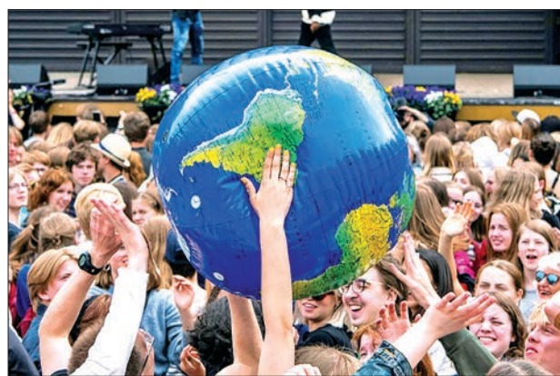
Tens of thousands of young climate activists rallied across Europe demanding urgent action against global warming.

BERLIN (Germany) — Hundreds of thousands of young climate activists rallied across Europe Friday ahead of EU Parliament elections as part of protests worldwide demanding action against global warming.