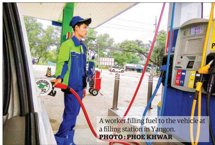
A worker filling fuel to the vehicle at a filling station in Yangon.

the country bought 27,070 tons of petrol and 59,240 tons of diesel from its international trade partners by sea. Normally, fuels are imported mostly from Singapore and Thailand. Myanmar also imports fuels not only from sea routes but also from border trade stations. During the week, the country imported 1,100 tons of petrol with an estimated value of about $605,700 and 856.75 tons of diesel amounted to over $529,000 via Tachilek, a border between Myanmar and Thailand.—Khin Khant ■ (Translated by Khaing Thanda Lwin)