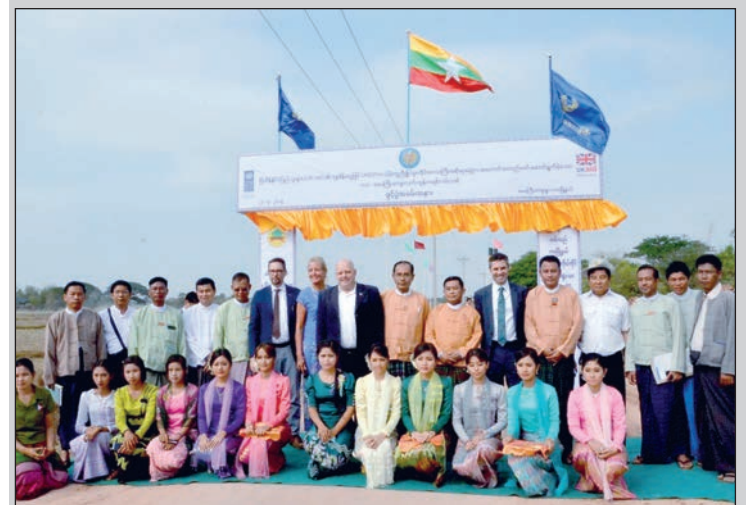
Officials pose for documentary photo.

The 7.6-furlong road will benefit more than 20,000 people from 12 villages with improved access to health, education and livelihoods because of the connection to the Yangon-Bago main road. Additionally, more than 250 female garment factory workers commute daily to the factories in Bago using this road.