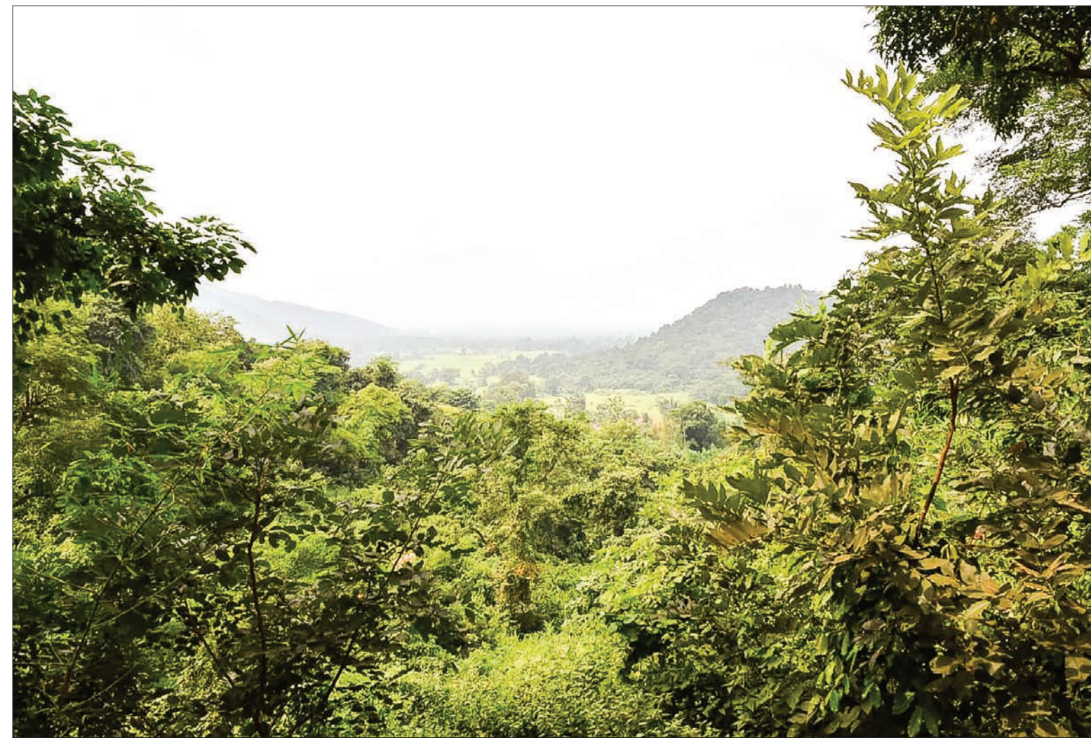
Promoting mountain economy contributes to development. 3

Different BIMSTEC centres have now been established to emphasize the growth and development of these priority sectors to achieve the main objectives of BIMSTEC initiatives in a timely fashion. Among other important