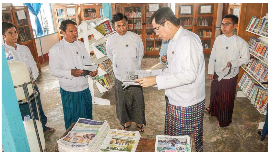
Deputy Minister U Aung Hla Tun inspects the Community Center in Loikaw, Kayah State yesterday.

Furthermore, the Deputy Minister remarked on working toward achieving success in Community Centre works; mak-