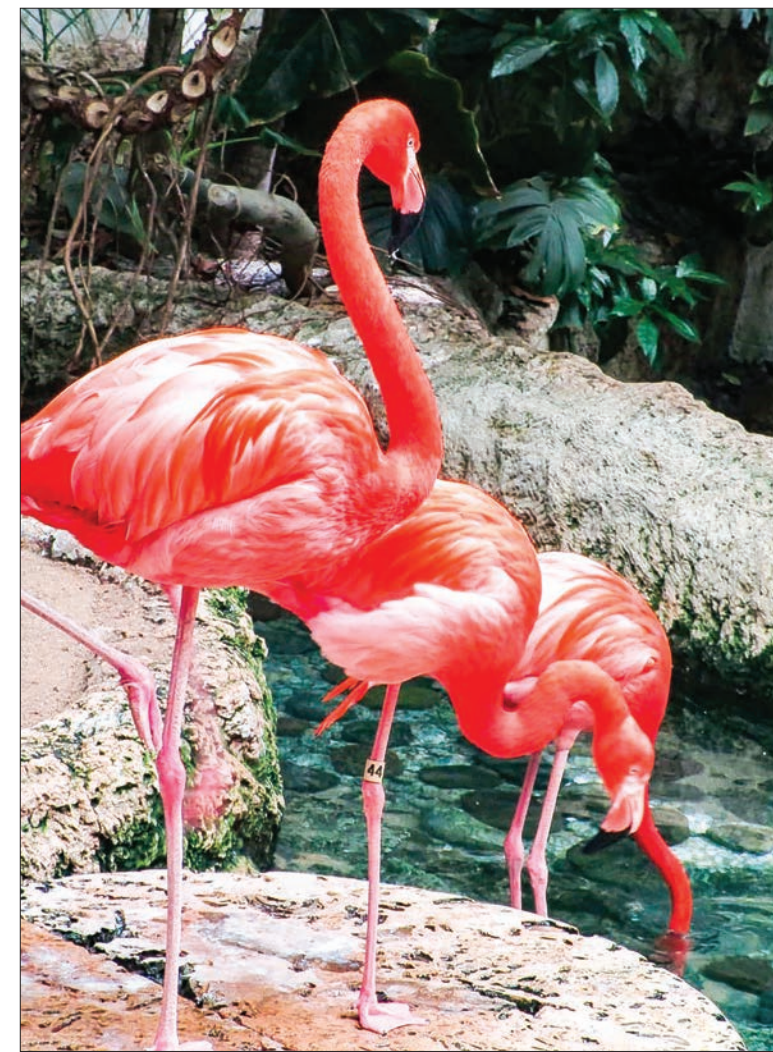
National action plans are underway for conservation of migratory bird

Both South Asia and South-east Asia regions are rich in having unique habitats, numerous forests majestic wildlife and rich biodiversity. The rich belts of tropical and subtropical forests, deciduous forest forests, evergreen forests, mountain cloud forests, Himalayan bamboo forests to vast stretches of massive valleys, numerous freshwater, brackish water and marine habitats as well as abundant rainfall have made this region home for diverse species of flora and fauna; many of which are endemic meaning that they are not found anywhere else in the world. Hence, there is no doubt that this one of the most spectacular biodiversity region of the world and home to numerous vertebrates (fishes, reptiles, amphibians, birds and mammals) and invertebrates (porifera, ctenophora, coelenterates, platyhelminths, nemathelminths, annelids, arthropods, molluscs and echinoderms); both terrestrial and aquatic in their habit. This region also represents wide diversity of different algae and sea weeds, fungi, myxomycetes, lichens, bryophytes (such as hepatics, hornworts, mosses), pteridophytes (lycopodium, selaginella, psilotum, horsetails, eusporangiate and leptosporangiate ferns), gymnosperms (open seeded flowering plants) and angiosperms (close seeded flowering plants).