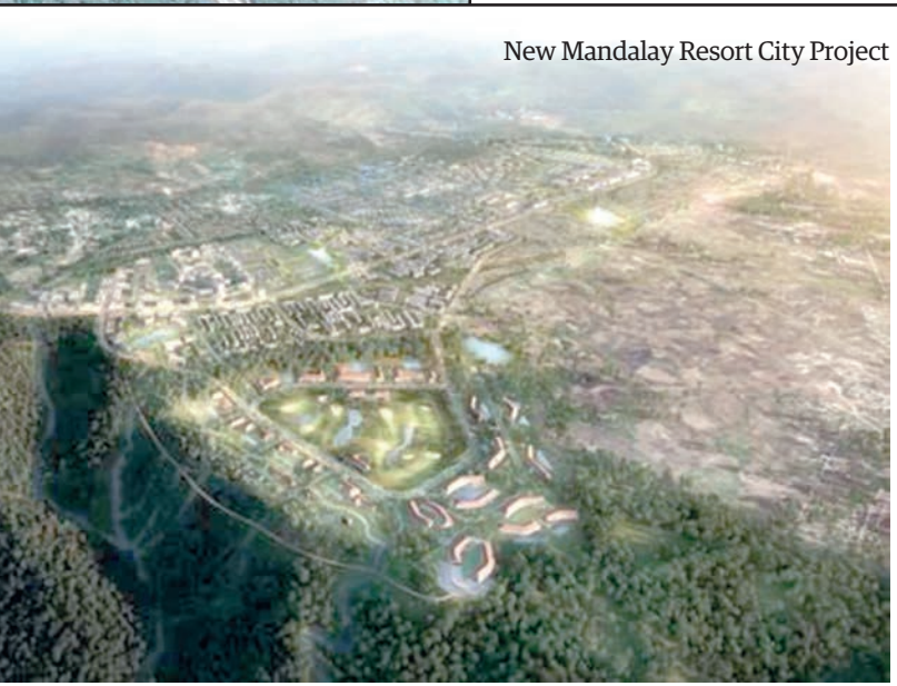
New Mandalay Resort City Project