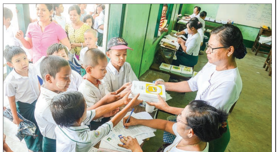
A teacher presents text books to students on School Enrolment Day in Thaketa Township yesterday.