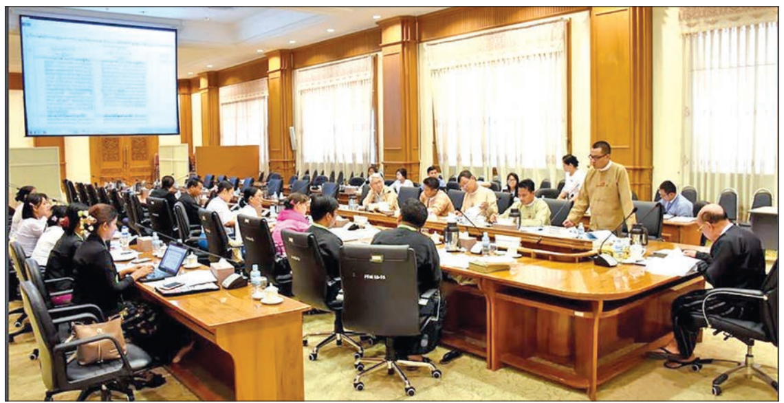
Pyidaungsu Hluttaw Joint Bill Committee discusses four bills during their meeting at the meeting hall of Pyidaungsu Hluttaw in Nay Pyi Taw yesterday.