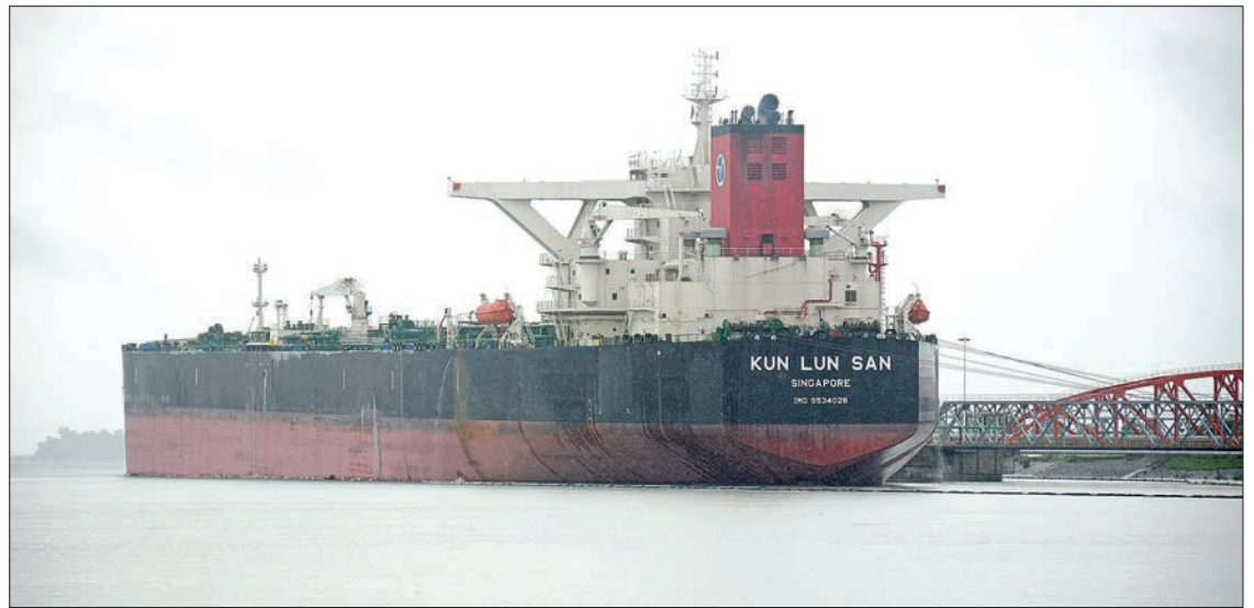
A cargo ship docks at a jetty in Kyaukpyu township, Rakhine state.

investors to invest in building fundamental infrastructure, such as electricity, telecommu-