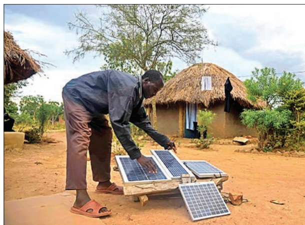
About 89 per cent of the world had access to electricity as of 2017, up from 83 per cent in 2010, according to a report produced by the World Bank and other international bodies.

The goals call for delivering universal access