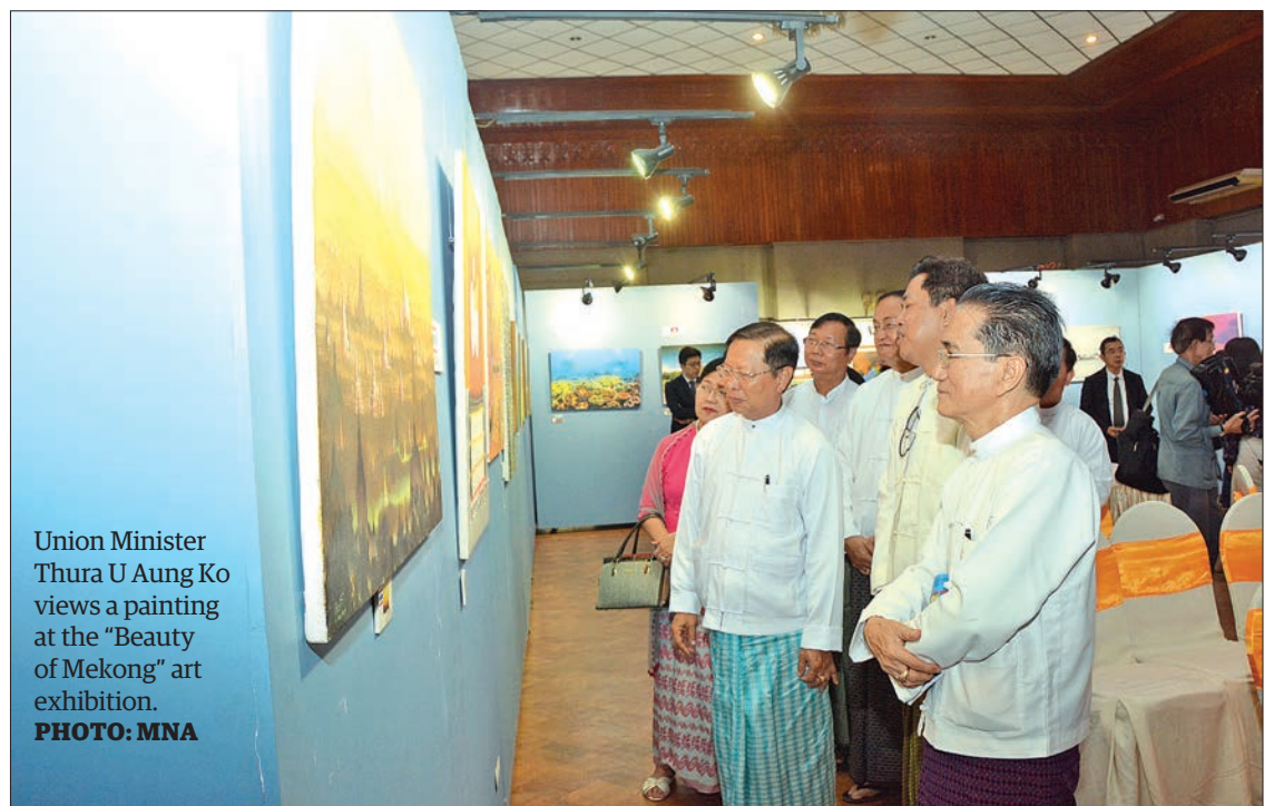
Union Minister Thura U Aung Ko views a painting at the “Beauty of Mekong” art exhibition.

Then, Artist U Hla Tin Tun delivered a speech on behalf of Myanmar artists and a Japanese artist from Tokyo University of Art, of Japanese artists. After the