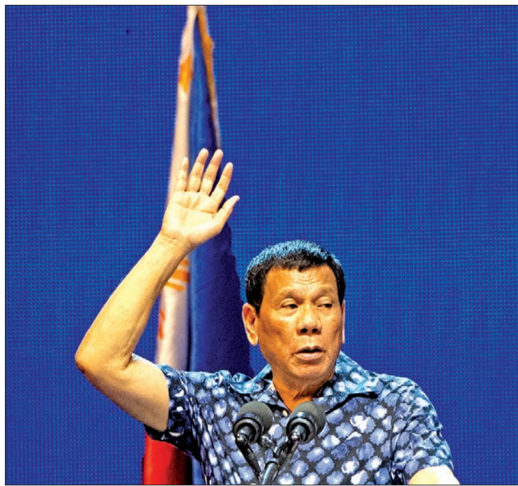
Philippine President Rodrigo Duterte's allies have stormed to a landslide victory in midterm polls.

Duterte allies kept control of the lower House of Repre-