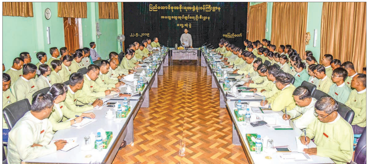
Union Minister for the Office of the Union Government U Min Thu addresses the meeting with staff of the Union Territory, Nay Pyi Taw General Administration Department at the GAD's office in Nay Pyi Taw.

The Union Minister said the Union Government approved the reformed organizational structure of MoOUG during their Meeting No. 9/2019 on 9 May 2019. He said the ministry is also carrying on its Corruption Prevention Unit (CPU) project.