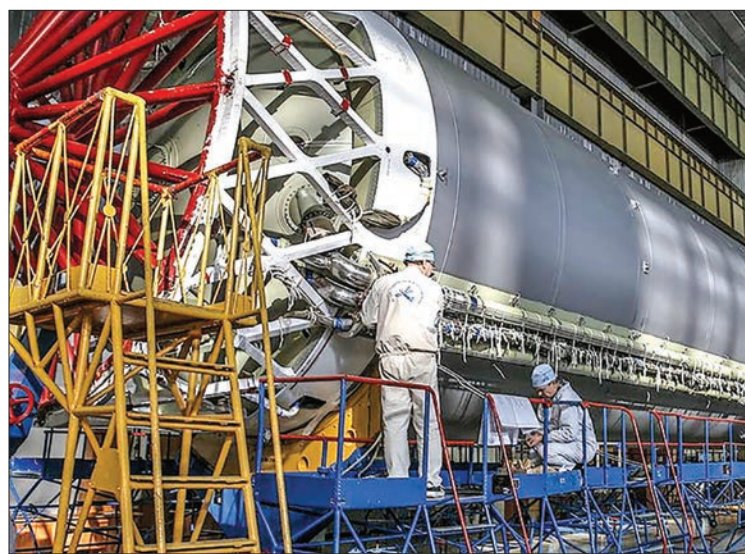
The relevant decree was signed by the head of Roscosmos.

MOSCOW — Multipurpose laboratory module Nauka will be launched to the International Space Station (ISS) in the autumn of 2020 at the earliest, a source in the space rocket industry told TASS.