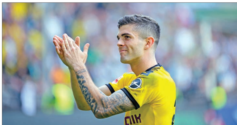
Christian Pulisic hopes to match Eden Hazard's achievements at Chelsea.

Pulisic, who scored four times in 20 league appearances last season for