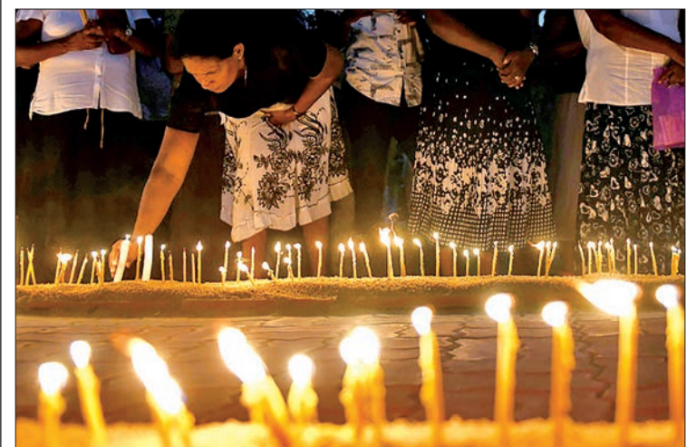
Sri Lanka struggled to contain the spread of fake news and disinformation in the wake of the Easter attacks.