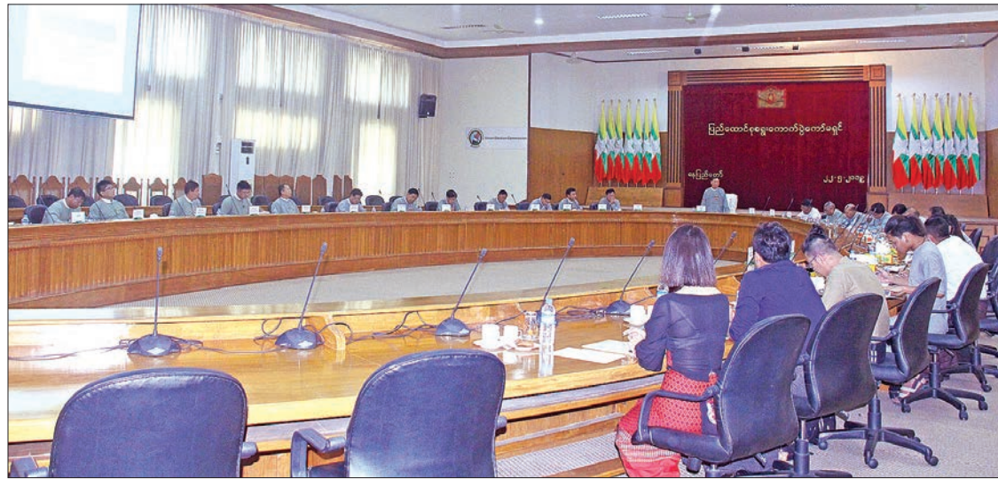
UEC Chairman U Hla Thein holds talks with Vision 2020 civil society organizations.

THE Chairman of the Union Election Commission received civil society organizations included in Vision 2020, at the Union Election Commission office, yesterday at 10 a.m.