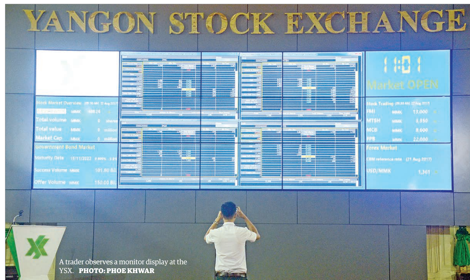
A trader observes a monitor display at the YSX.

The medium-term macroeconomic outlook remains favorable. Myanmar's economy is expected to gain steam over the medium term albeit at a somewhat slower