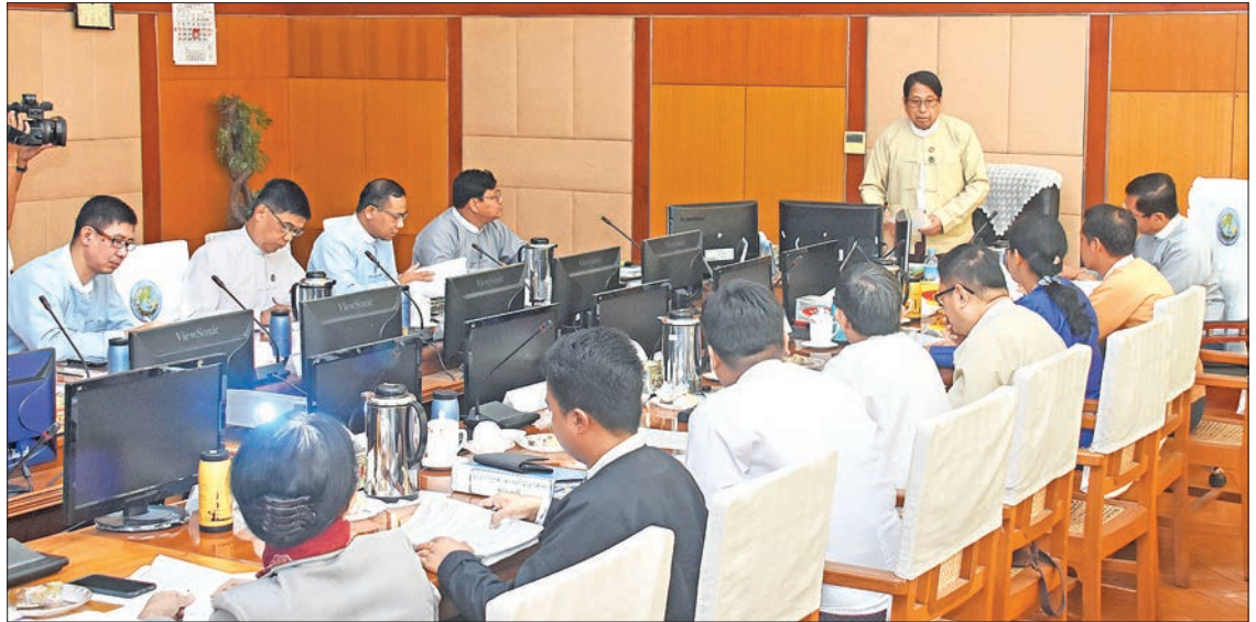
Union Minister Dr. Pe Myint addresses the third coordination meeting for drafting TV & Broadcasting bylaw.