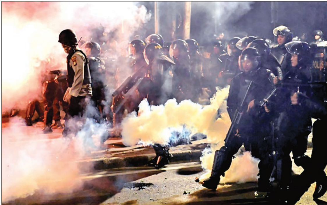
Police in Jakarta clashed with some anti-Widodo protesters who had refused to leave after the end of an otherwise peaceful demonstration.

JAKARTA (Indonesia)—At least six people were killed as Indonesia's capital erupted in violence on Wednesday when police in riot gear clashed with protesters opposed to President Joko Widodo's re-election. Dozens were arrested and parts of Jakarta were littered with debris and burned-out cars, as the violence triggered security advisories from the US and Australian embassies.