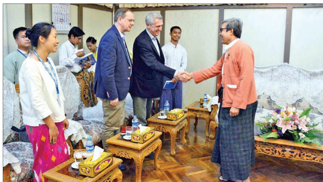
Rakhine State Chief Minister U Nyi Pu shakes hands with UNHCR Chief Mr. Filippo Grandi.