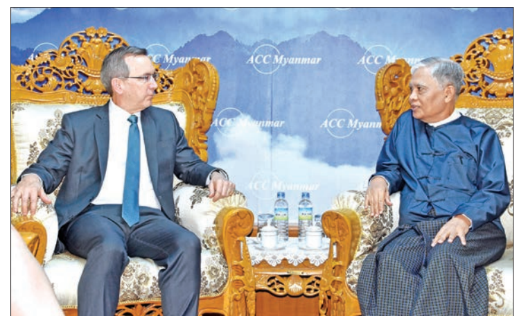
Anti-Corruption Commission Chairman U Aung Kyi meets US Ambassador in Nay Pyi Taw. PHOTO: MNA

Anti-Corruption Commission, prevention and investigation processes and developmental stages and effective investigation processes of international organizations were cordially discussed.—MNA (Translated by Kyaw Zin Lin)