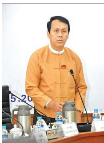
Yangon Region Chief Minister U Phyo Min Thein.