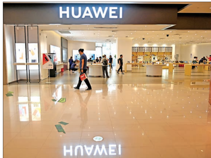
People browse for items in a Huawei store in a shopping mall in Shanghai on 22 May 2019.

Japanese industry sources said it temporarily cut off exports in 2010 as a territorial row flared between the Asian rivals, charges that Beijing denied. In 2014, the World Trade Organization ruled the country had violated global trade rules by restricting exports of the minerals. —AFP ■