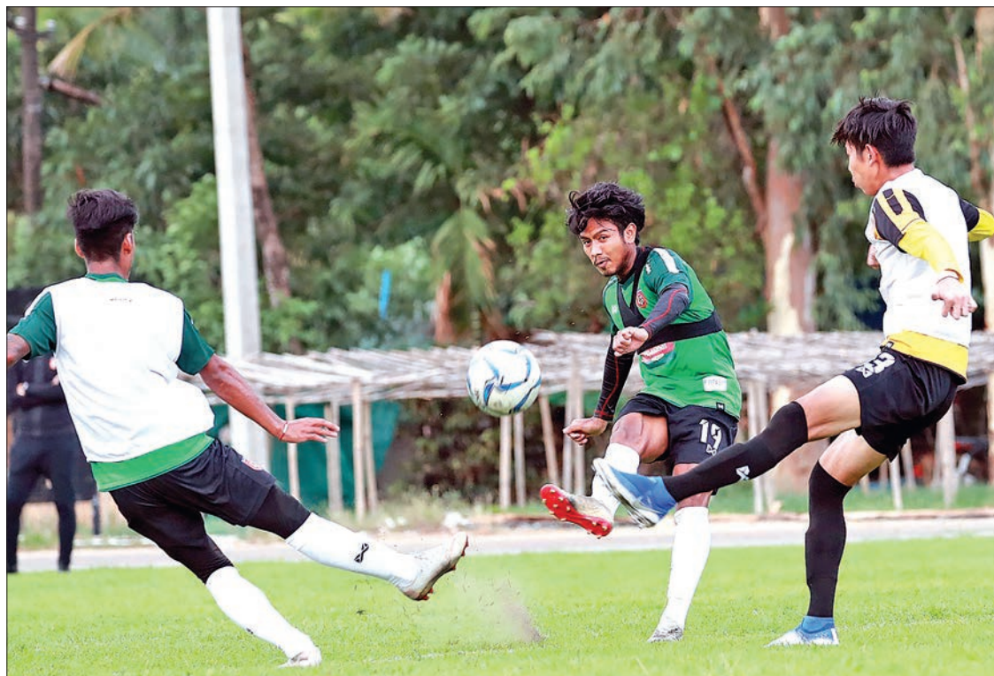
The Myanmar U-23 national footballers undergoing training in Yangon yesterday for the friendly match against Viet Nam in Hanoi on 7 June.