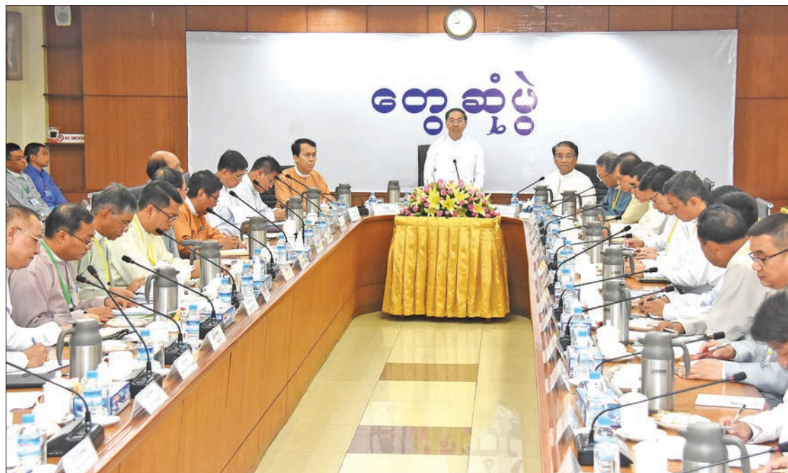
Vice President U Myint Swe delivers the speech at the 27 th regular meeting between government and business persons in Yangon yesterday.

The Private Sector Development Committee held its 9 th work coordination meeting in Nay Pyi Taw, and at the meeting, Union ministers, officials of the five work committees, officials