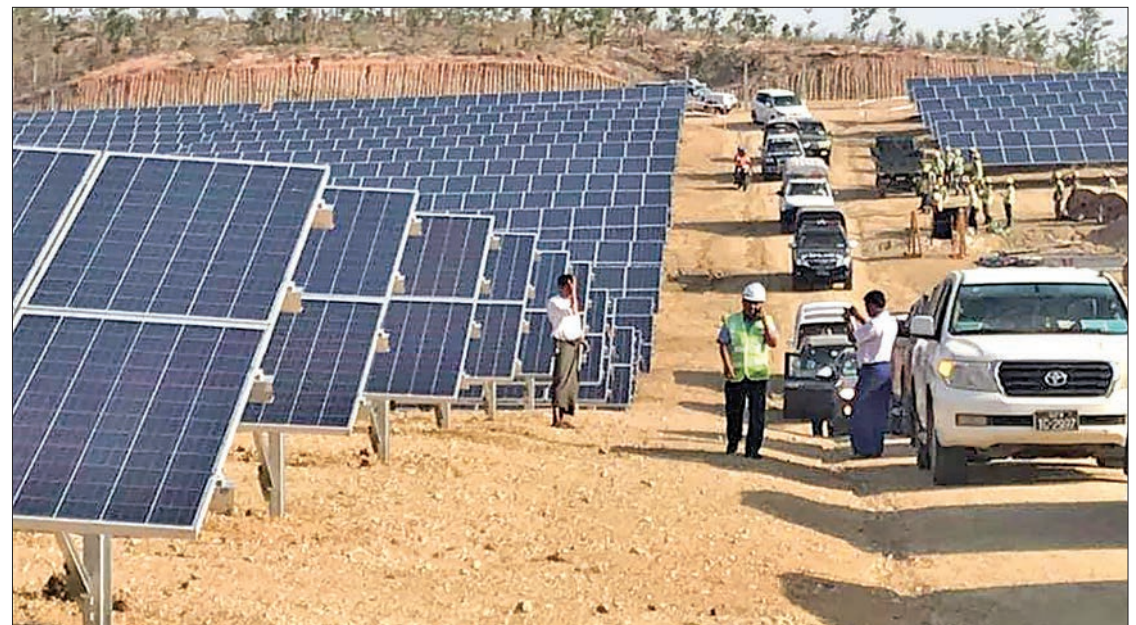
Officials inspect a solar power farm at the Minbu Solar Plant in Minbu, Magway Region.