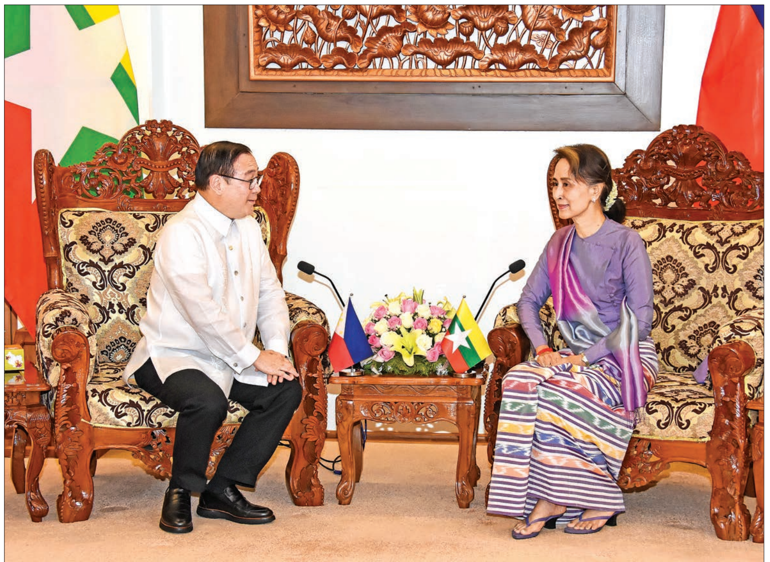
State Counsellor Daw Aung San Suu Kyi meets with Secretary of Foreign Affairs of the Republic of the Philippines, Mr. Teodoro L. Locsin, Jr., at the Ministry of Foreign Affairs in Nay Pyi Taw yesterday.