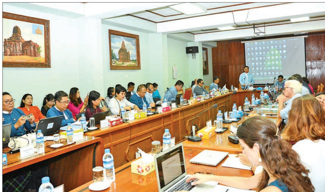
Deputy Minister U Kyi Min addresses the coordination meeting on the timely completion of the Nomination Dossier and Management Plan for MraukU yesterday in Nay Pyi Taw.