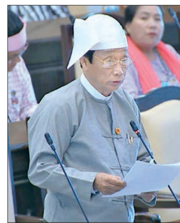
Deputy Minister U Hla Kyaw.