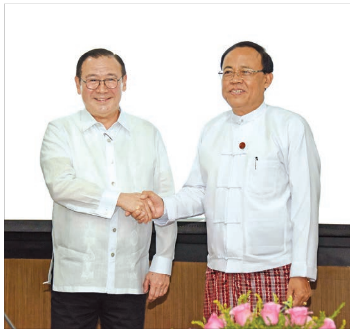
Union Minister U Kyaw Tin shakes hands with Filipino Foreign Secretary Mr. Teodoro L. Locsin Jr.

During the Meeting, the two Ministers discussed on a wide range of issues relating to promoting bilateral relations and cooperation; enhancing cooperation in trade and investment sectors; operating direct air linkage between the two countries; signing the MoU on Cooperation in Combating Illicit Trafficking and Abuse of Narcotic Drugs and Controlled Precursors Chemicals between the two countries; promoting people-to-people contacts; enhancing cooperation in culture, education, defense, agriculture, fishery and environment, tourism sectors between the two countries; and expanding the multi-faceted cooperation and extending mutual support in both regional and international fora. The two Ministers