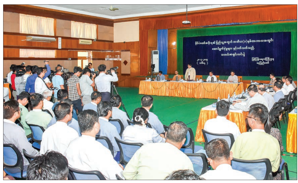
Union Minister Dr. Pe Myint addresses the press conference on the third-year performances of Union-level entities in Nay Pyi Taw.

The Union Minister said MoI has been organizing public talks between government leaders and the general public. He said a Hluttaw representative whose constituency covers the public talk's location, a relevant government official or someone