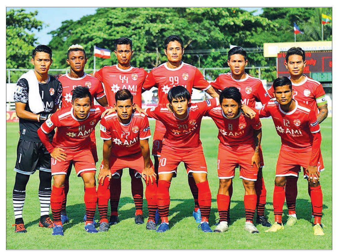
The Ayeyawady United F.C. pose for a group photo.

On 30 May, the South Korean football club, Pohang Steelers, will play against the