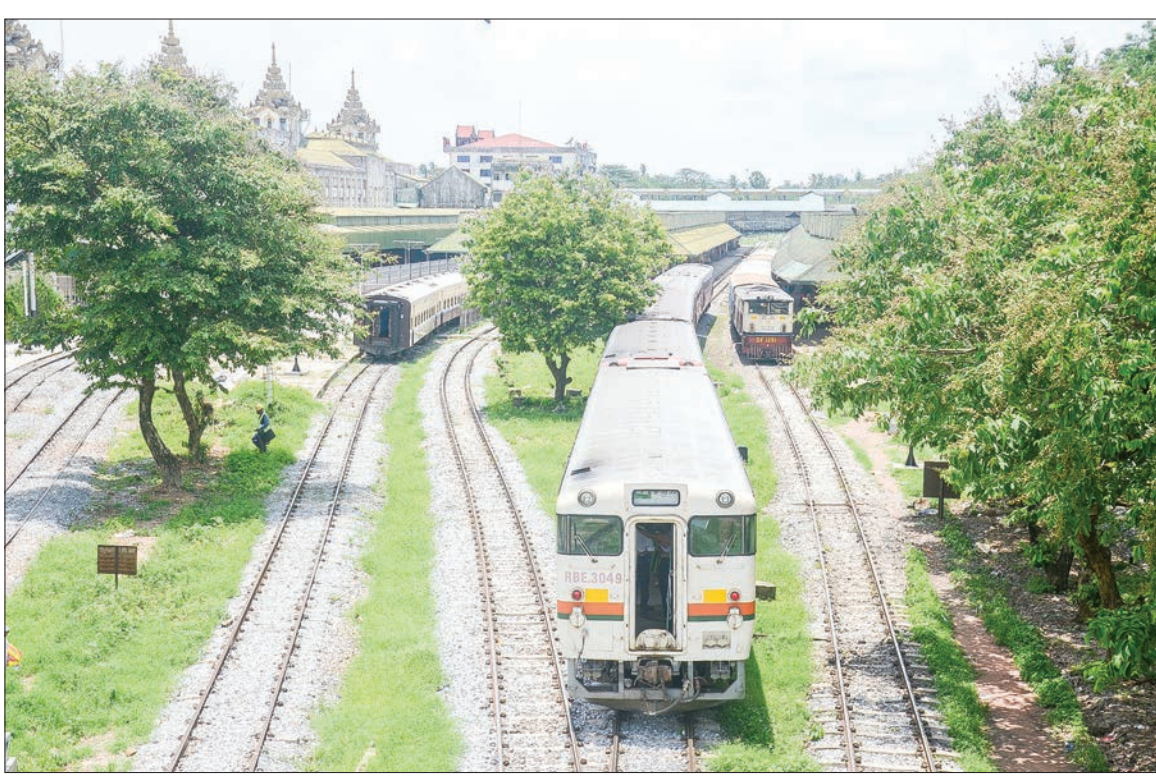
Yangon's downtown Train Station.

The Global New Light of Myanmar is accepting submissions of poetry, opinion, articles, essays and short stories from young people for its weekly Sunday Next Generation Platform. Interested candidates can send their work to the Global New Light of Myanmar at No. 150, Nga Htat Kvee Pagoda Road, Bahan Township, Yangon, in person, or by email to ce@globalnewlightofmyanmar.com with the following information: (1) Sector you wish to be included in (poetry, opinion, etc.), (2) Own name and (if different) your penname, (3) Your level of education, (4) Name of your School/College/ University, (5) A written note of declaration that the submitted piece is your original work and has not been submitted to any other news or magazine publishing houses, (6) A color photo of the submitter, (7) Copy of your NRC card, (8) Contact information (email address, mobile number, etc.).— Editorial Department, The Global New Light of Myanmar