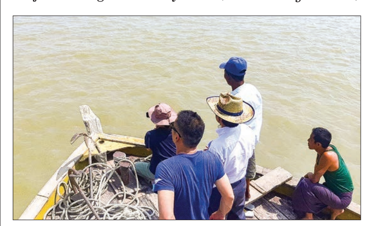
NHK documentary film team films fishing with the help of Ayeyawady Dolphins in the Ayeyawady River in Sagaing Region Mingun area yesterday.