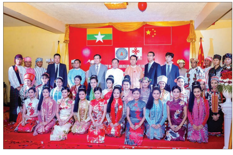
Union Minister Thura U Aung Ko, Yangon Region Chief Minister U Phyo Min Thein, Chinese Ambassador Mr. Hong Liang and attendees pose for a photo at the ceremony to renovate and upgrade the Yangon's National Theatre.

Under the bilateral negotiations, the agreement on renovating and upgrading the National Theatre of Yangon was signed by Permanent Secretary of Ministry of Religious Affairs and Culture of Myanmar and Commercial Attaché of event, Union Minister