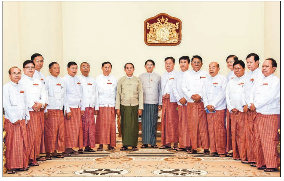
President U Win Myint poses for a photo together with Union Election Commission Chairman U Hla Thein and UEC members yesterday.

RESIDENT U Win Myint met with Union Election Commission (UEC) Chairman U Hla Thein and UEC members at the Presidential Palace yesterday morning for a free and fair 2020 General Elections (2020 GE). First UEC Chairman U Hla Thein explained about preparation of voters lists; courses conducted for all levels of election sub-commissions; and work processes for pre-election, election and post-election periods.