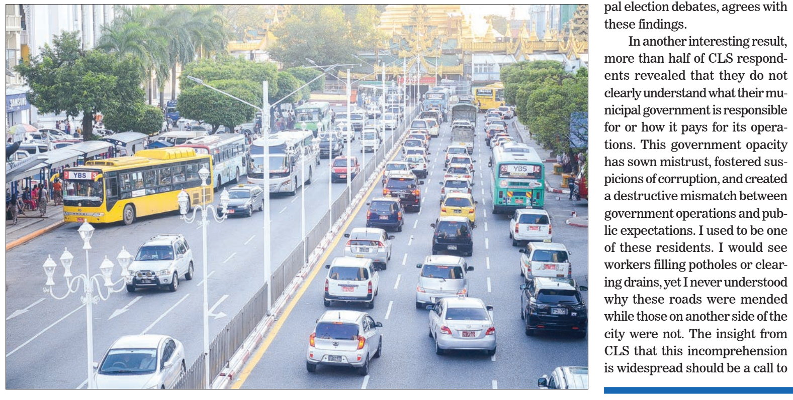
Traffic moves along the Sule Pagoda Road in downtown Yangon.

al isolation and government secrecy that left a lasting deficit in public trust and participation, the local governments of Myanmar's major cities have begun to recognize that effective governance is built on communication between a city's leaders and its citizens. Quite simply, governments cannot serve the governed if they don't know what's going on. Elected officials, who must provide effective public services with limited resources, are awakening to the information value of public participation. The Development Affairs Organization of Taunggyi, a city in Southern Shan State, and the mayor of Mandalay City, for example, have been actively corresponding with city residents on Facebook. In Yangon's recent election debates, one candidate proclaimed that citizens would