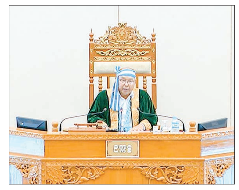
Amyotha Hluttaw Speaker Mahn Win Khaing Than.

At the meeting Naw Hla Hla Soe of Yangon Region constituency 10 raised a question on plan to raise Gender Sensitivity Awareness in Myanmar Police Force personnel. Deputy Minister for Home Affairs Maj-Gen Aung Thu replied that Gender