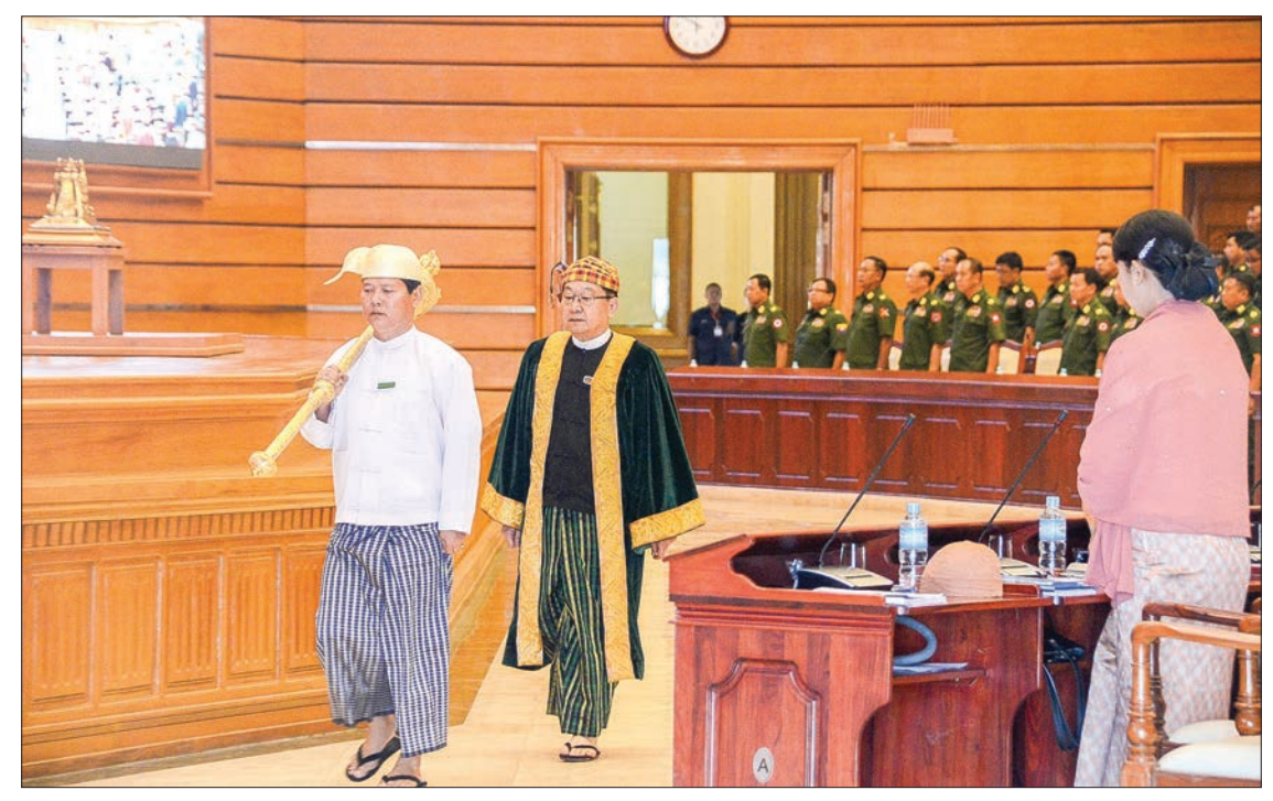
Pyithu Hluttaw Speaker U T Khun Myat enters the Chamber at the 8<sup>th</sup> day of the second Pyithu Hluttaw's 12<sup>th</sup> regular meeting in Nay Pyi Taw yesterday.

Deputy Minister U Hla Kyaw also answered to questions raised by U Kyaw Gyi @ U Ohn Khin of Minhla constituency on pumping water from pumping project and U Lwin Ko