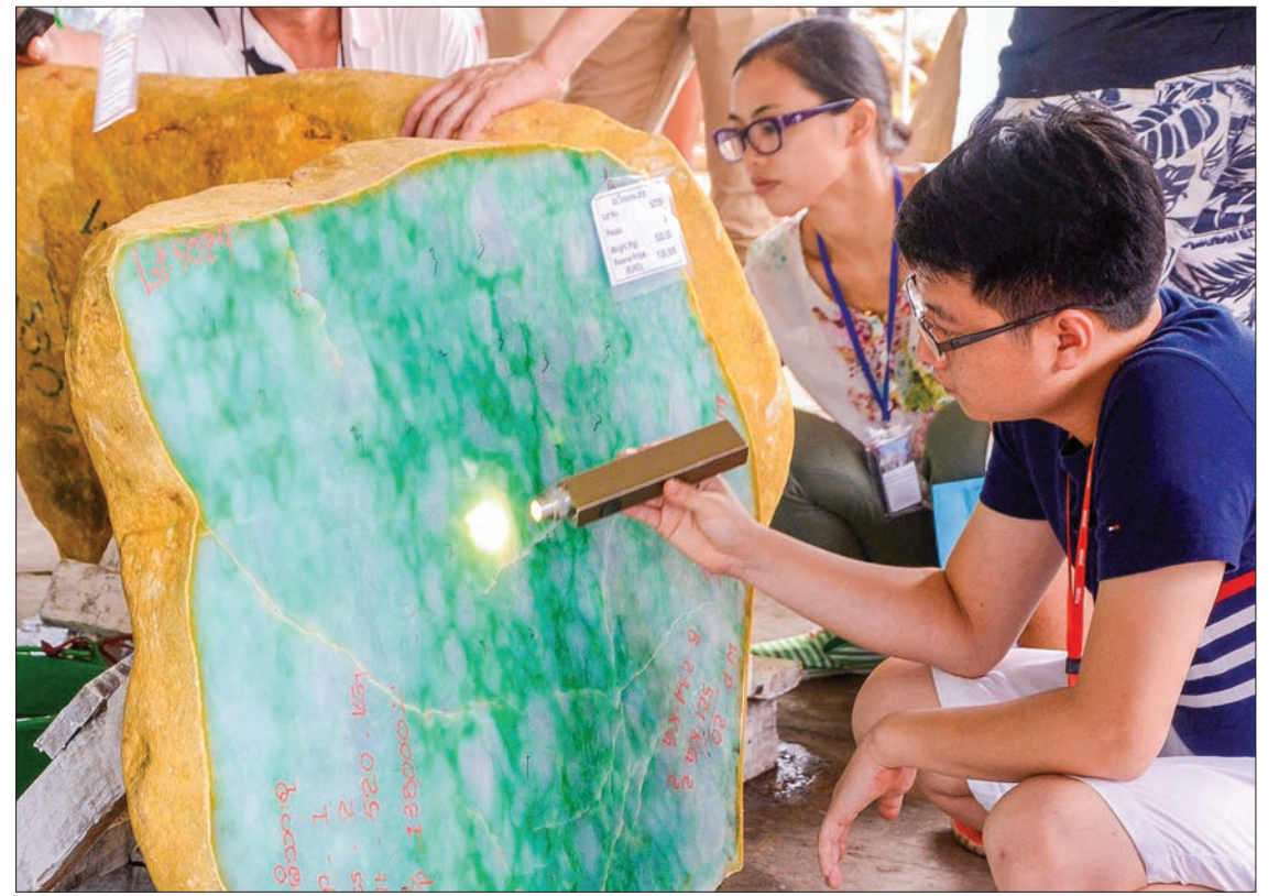
Merchants appraise jade stones at Myanmar Gems Emporium in the Mani Yadana Jade Hall in Nay Pyi