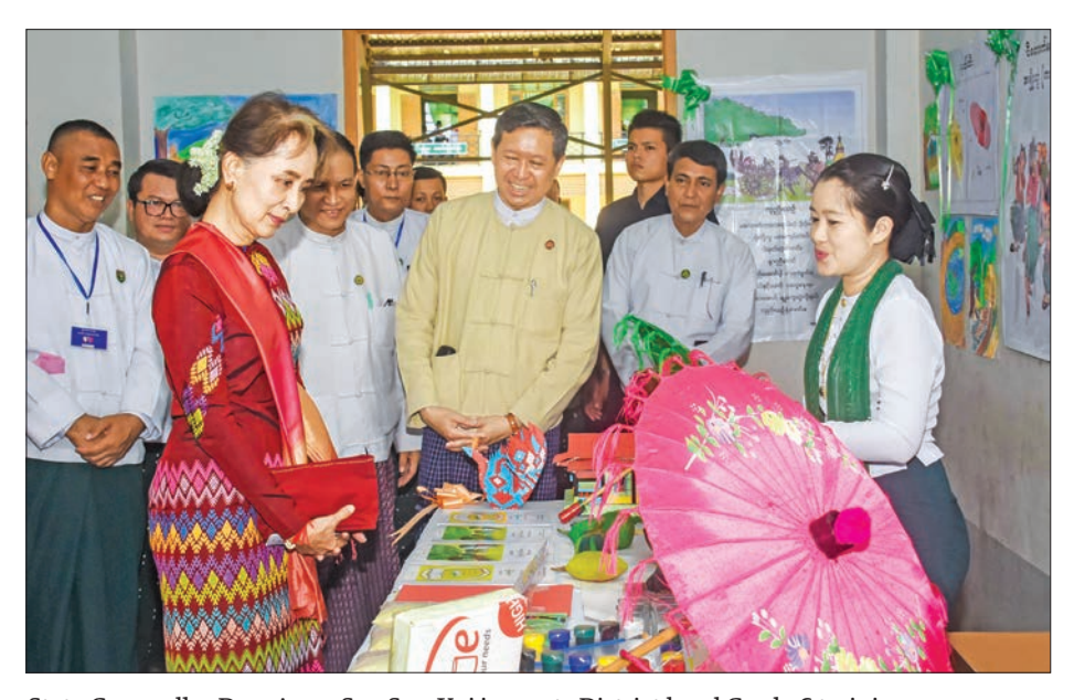
State Counsellor Daw Aung San Suu Kyi inspects District level Grade 6 training course on new curriculum in Nay Pyi Taw Council yesterday.

TATE Counsellor Daw Aung San Suu Kyi went to Nay Pyi Taw Council Pyinmana Town No. 2 Basic Education High School yesterday morning to observe the Nay Pyi Taw Dekkhinathiri District Basic Education Middle School Grade 6 level discussion/training course on new curriculum attended by teachers.