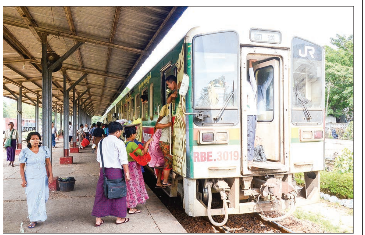
Dailly commuters ride the loop through the city, its surburban areas and its satellite towns.