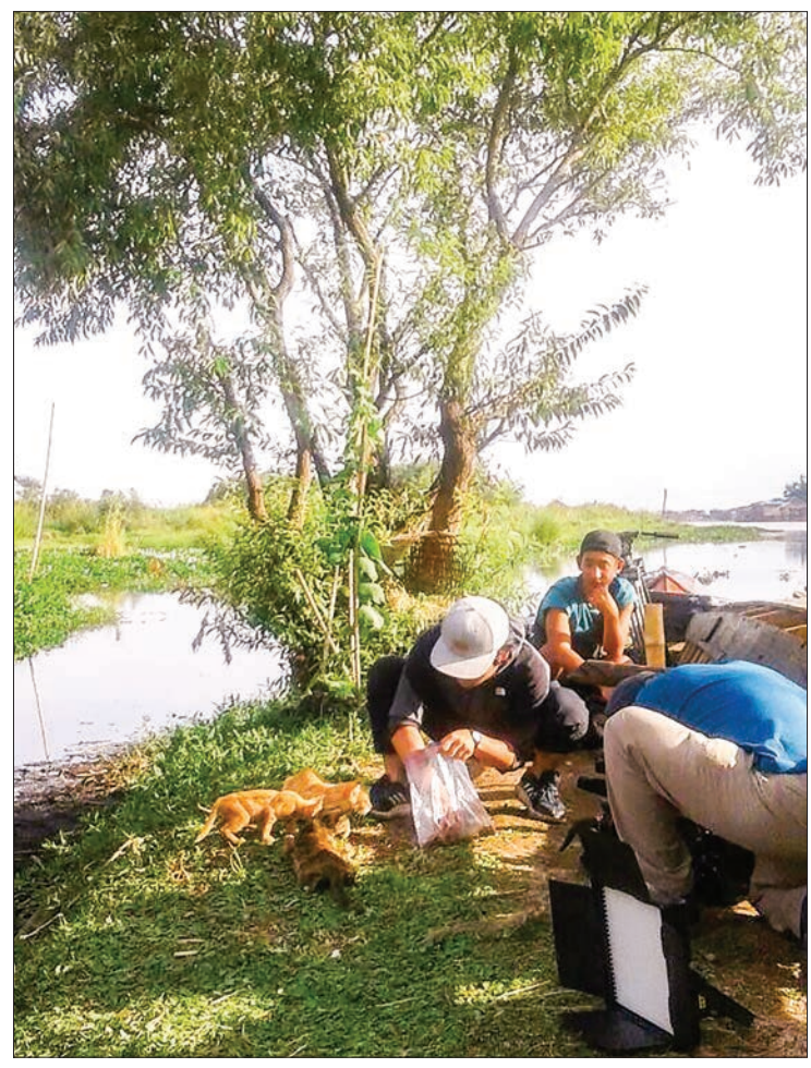
Japanese documentary crew films feeding cats in Pout Parr Village, Nyaung Shwe Township yesterday.

A Japanese team made a documentary film under the title of "Happy Lives Of Cats" in Pout Parr Village, Nyaung Shwe Township.