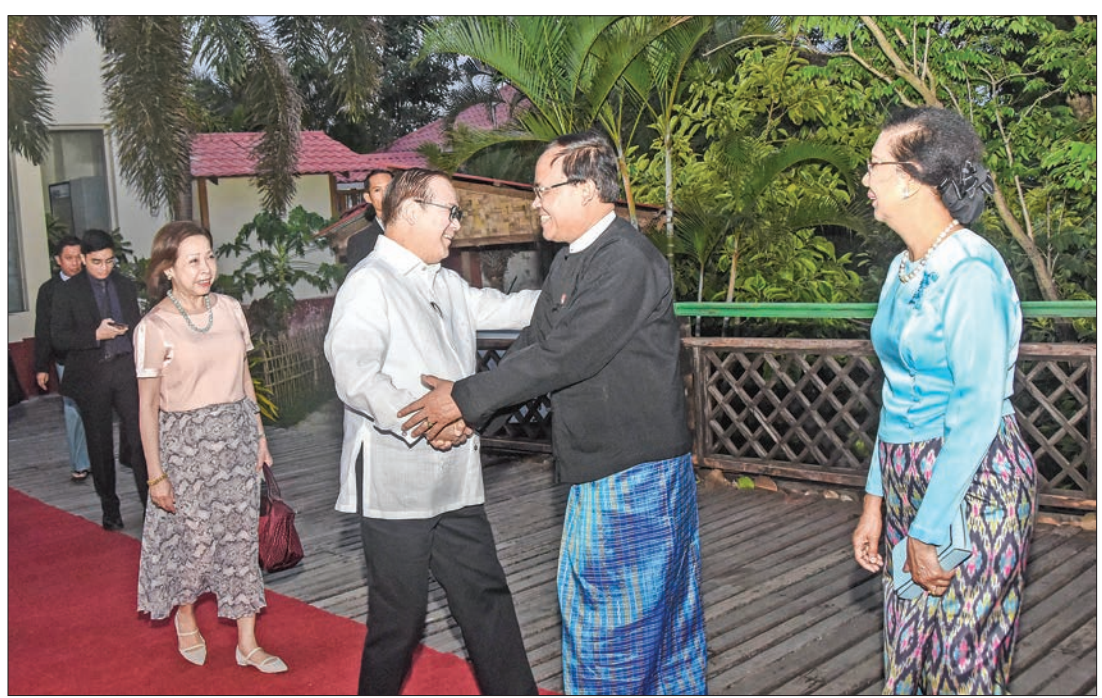
Union Minister for International Cooperation U Kyaw Tin welcomes Philippines Secretary of Foreign Affairs Teodoro Locsin Jr. and wife at the dinner reception in Nay Pyi Taw.

THE delegation led by Philippines Secretary of Foreign Affairs Teodoro Locsin Jr. and wife arrived on official goodwill visit to attend the third meeting of the Myanmar-Philippines Joint Commission on Cooperation in Nay Pyi Taw.