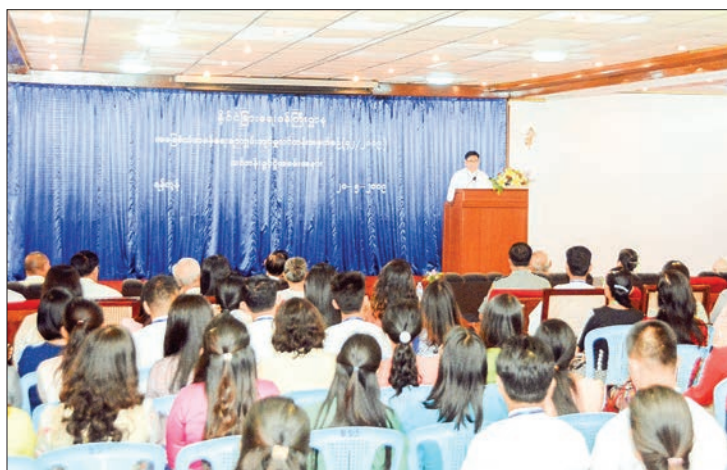
Permanent Secretary U Myint Thu delivers a speech at the inauguration ceremony of the Certificate Course in Basic Diplomatic Skills (42/2019) in Yangon.

The inauguration ceremony of the Certificate Course in Basic Diplomatic Skills (42/2019) conducted by the Ministry of Foreign Affairs, was held at Wunzinmyintzar Hall of the