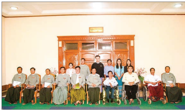
Union Election Commission Chairman U Hla Thein and Shwe Min Thar Foundation delegation pose for a documentary photo.