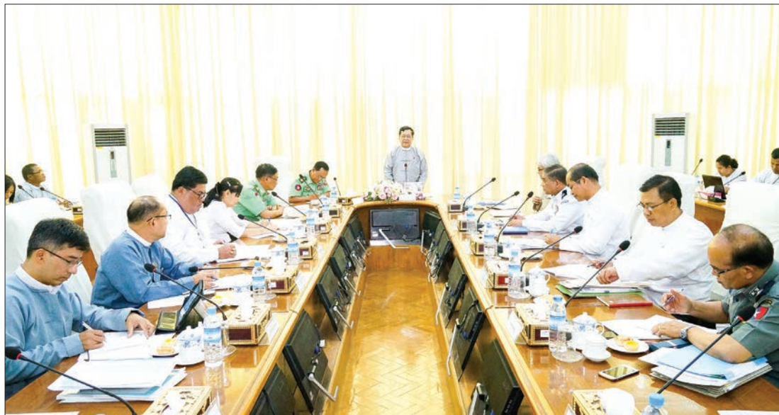
Union Minister U Thein Swe addresses the coordination meeting for Overseas Works Management Committee of Ministry of Labour, Immigration and Population yesterday.

OVERSEA Works Management Committee of Ministry of Labour, Immigration and Population held coordination meeting 1/2019 at the meeting hall of the ministry yesterday morning.