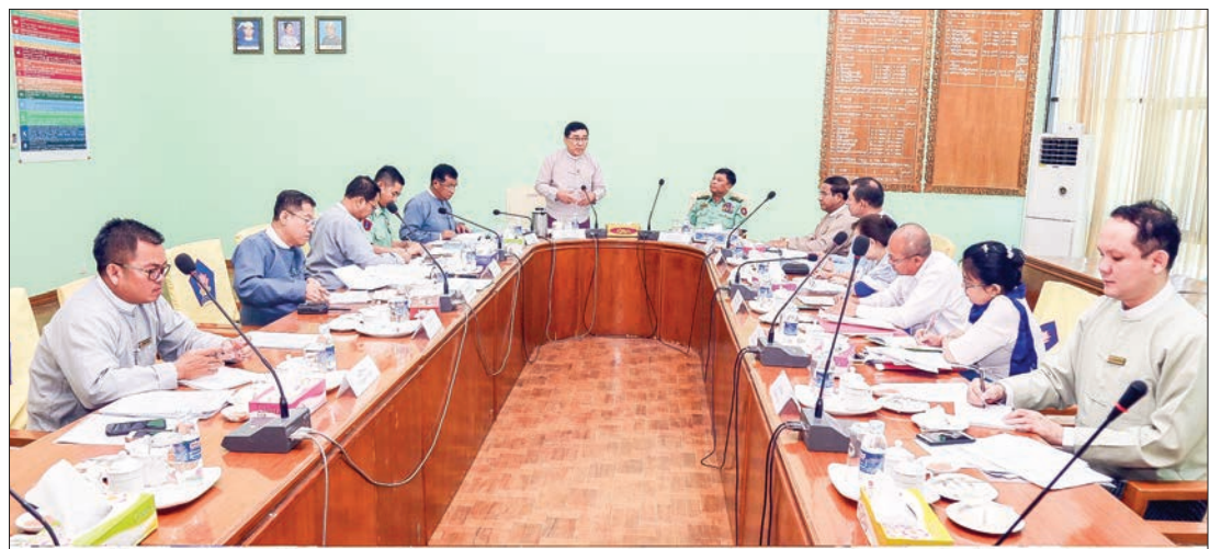
Union Minister Dr. Win Myat Aye addresses the coordination meeting for rehabilitating migrant workers in Phakant region.