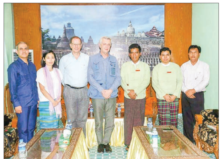
United Nations High Commissioner for Refugees Mr. Filippo Grandi and District Administrator pose for a photo in Maungtaw.