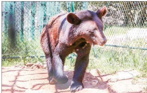
One of four bears living in Jordan's Al Ma'waFor Nature and Wildlife sanctuary which cares for animals rescued from war zones.

Most were rescued from Syria, where the conflict has raged since 2011, as well as the conflict-riddled Gaza Strip where Israel has fought three wars since 2008 with the territory's Islamist rulers, Hamas. —AFP ■