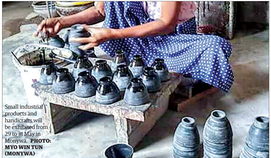
Small industrial products and handicrafts will be exhibited from 29 to 31 May in Monywa.

"Local farmers who are cultivating only crops and Thanakha should not just be engaged in cultivation. They must also gain the technical know-how