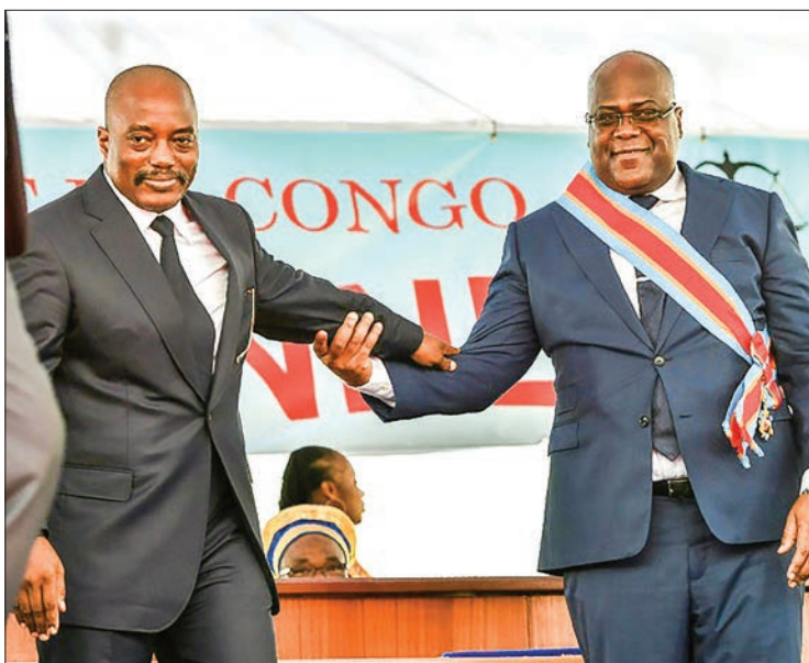
Inauguration day: Outgoing president Joseph Kabila and successor Felix Tshisekedi mark DR Congo's first-ever peaceful transition of power. Kabila still overshadows the national political scene, wielding clout acquired during 18 years in office.

overshadowed by Kabila, who amassed extensive clout after 18 years in power. His political allies retain the upper hand in parliament, provincial assemblies and governorships across the unstable country. His men also play a major role in security services.