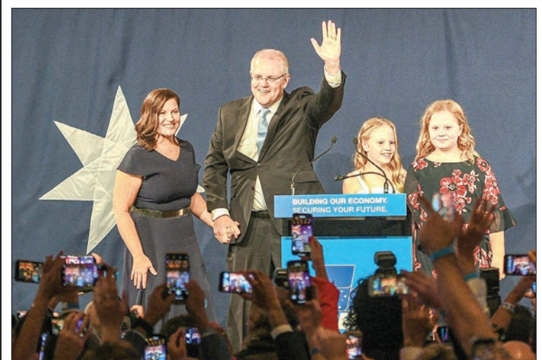
Australia's newly elected Prime Minister Scott Morrison (c) arrives to deliver a victory speech with his family after winning the Australia's general election in Sydney on 18 May, 2019. Australia's ruling conservative coalition appeared to secure a shock election win on 18 May, with the party predicted to have defied expectations and retained power.

His stunning win has prompted soul searching within Labor, which was leading all the opinion polls in the two years prior to Saturday.—AFP ■