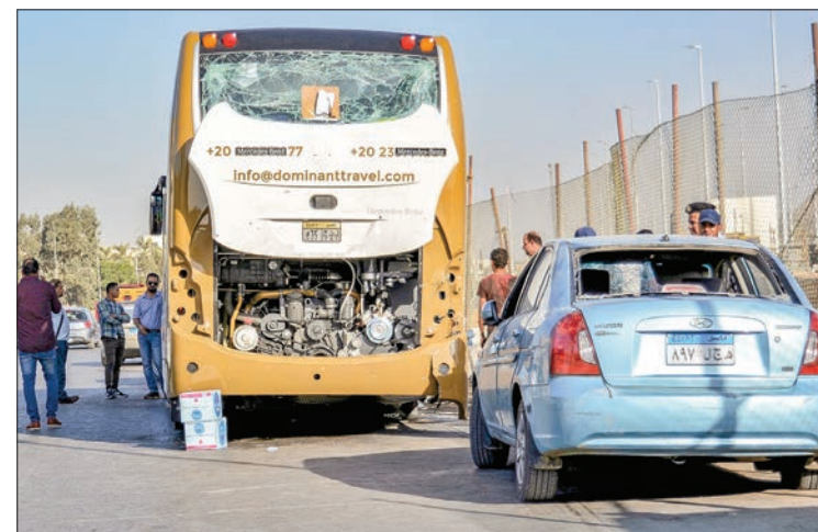
A picture taken on 19 May, 2019, shows vehicles damaged during a bomb blast near Egypt’s famed Giza pyramids. A bomb blast hit a tourist bus wounding at least 17 people, including South Africans, in the latest blow to the country’s tourism industry. The roadside bomb went off as the bus was being driven in Giza, also causing injuries to Egyptians in a nearby car, medical and security sources said.

Since first being elected in 2014, Sisi has presented himself as a bulwark against terrorism, promising stability and increased security.—AFP ■