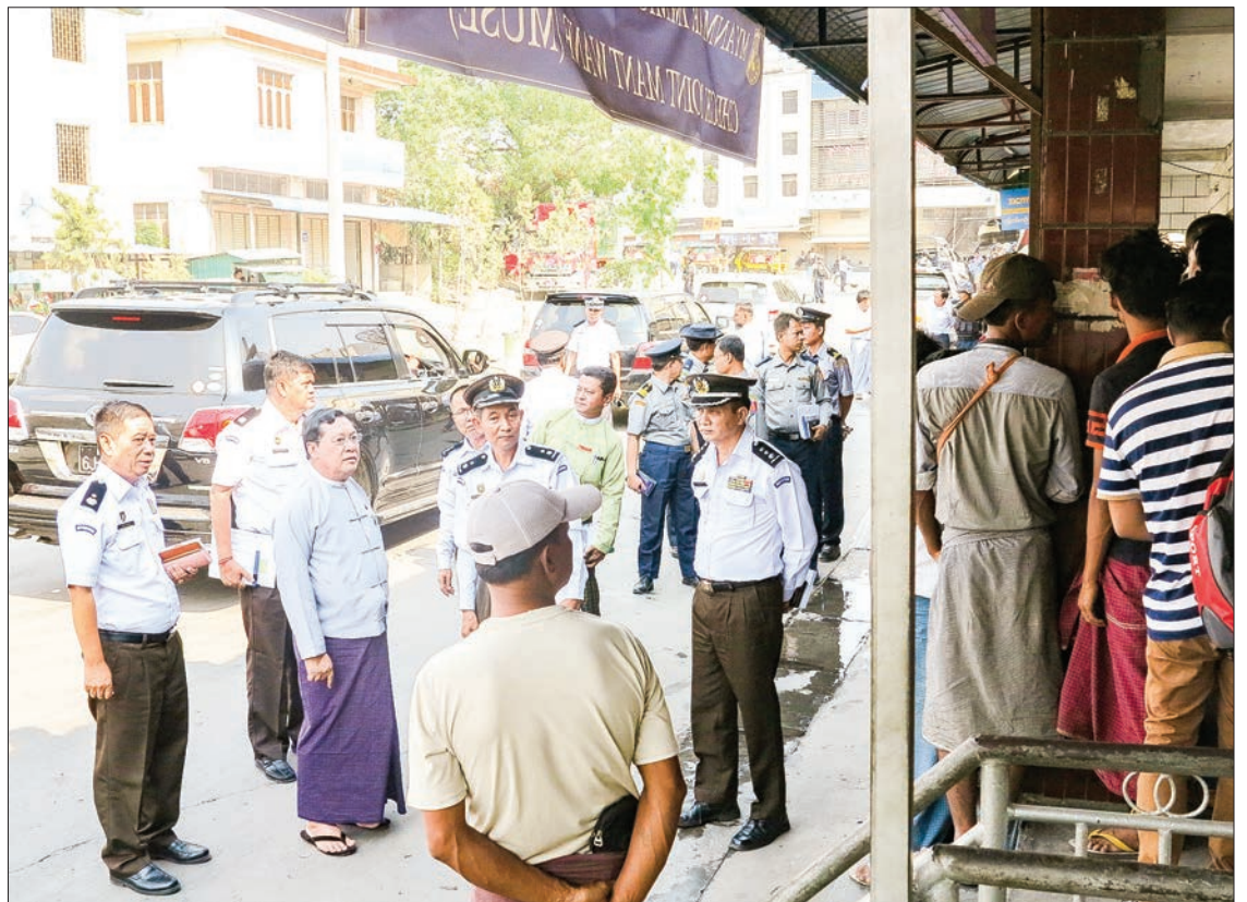
Union Minister U Thein Swe inspects border immigration outposts in Namhkam Township and Muse Township in Northern Shan State on 18 May.

Later in the afternoon, the Union Minister travelled to