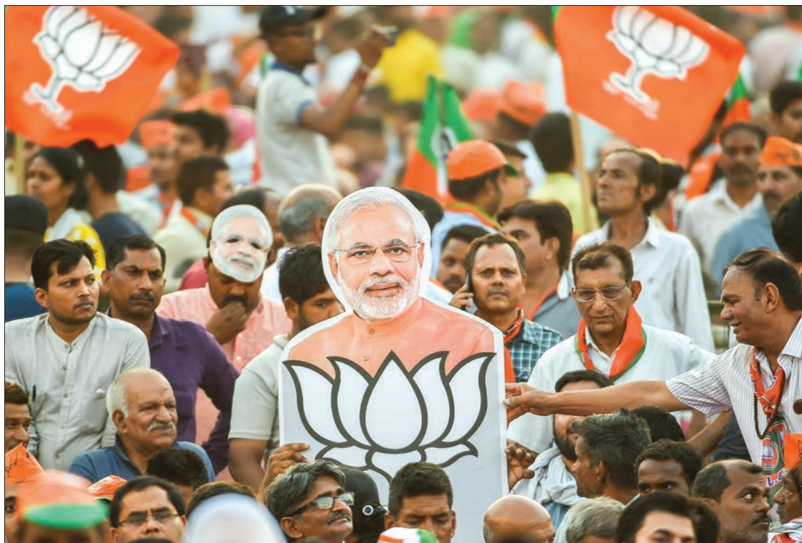
Bharatiya Janata Party (BJP) supporters attend a rally as Indian Prime Minister Narendra Modi (not pictured) delivers a speech during a rally ahead of Phase VI of India's general election in New Delhi on 8 May 2019.