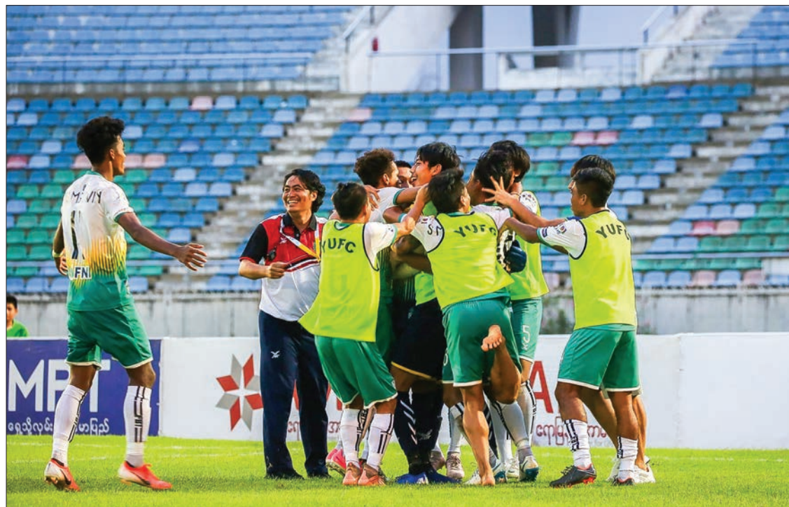
The Yangon United F.C. celebrating their win against Southern Myanmar F.C. yesterday.