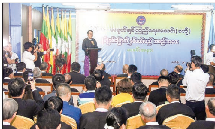
Yangon Region Chief Minister U Phyo Min Thein addresses the 6 th annual meeting of Myanmar-China Friendship Association.

Since its inception, the association has continually strived for social work and regional development and supported developing the human resource, cultural exchange, education, healthcare, businesses and provided help in times of natural disasters. —MNA (Translated by Zaw Htet Oo) ■