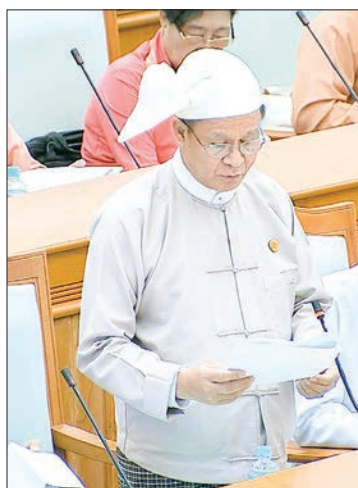
Deputy Minister U Aung Htoo.