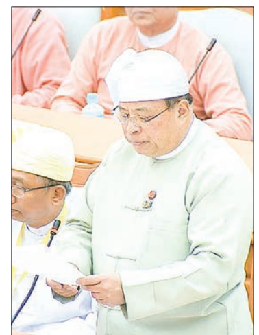
Union Minister U Thaug Tun.