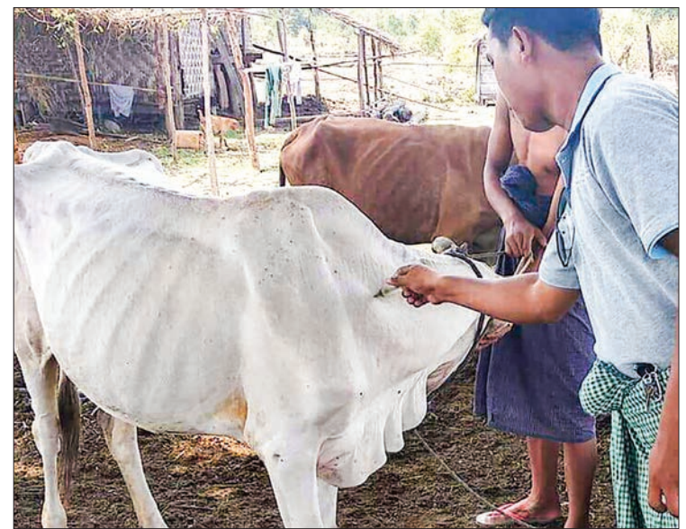
A Veterinarian vaccinates the cattle to prevent an outbreak of anthrax.

"It is too hot at the livestock breeding farms. A fire just broke out in a Monywa poultry farm. We are also raising awareness among local farmers so that they inform us of fire outbreaks as soon as possible," she added.