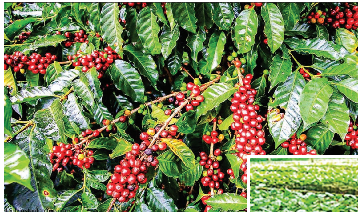
Coffee Plants are seen at Coffee Farm in Ywangan.

Coffee growing has gained extra public interest after the first Coffee Forum was held in