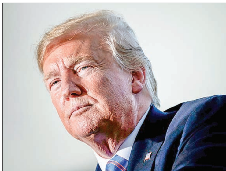
On tensions with Iran, President Donald Trump said recently that he has had to 'temper' his hawkish national security adviser John Bolton.

According to US media reports, Trump's long-hawkish national security advisor John Bolton is pushing a hard line on Iran, but others in the administration are resisting. Trump himself said recently that he has to "temper"