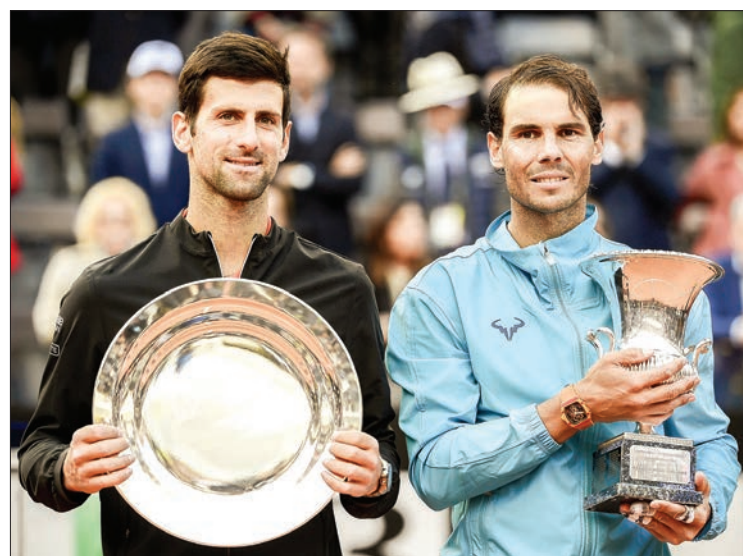
Rafael Nadal (R) of Spain poses with Novak Djokovic of Serbia after winning the ATP Masters tournament final tennis match at the Foro Italico in Rome on May 19, 2019.

"I'm going to repeat my normal routines. For sure I can't wait to be there and have the feeling, see the stadium, watch all the new great things