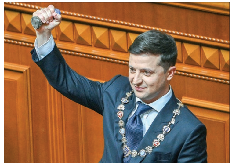
Zelensky used his inaugural speech to announce that he is dissolving parliament.

Zelensky called for the sacking of the head of the state security service, prosecutor-general and defence minister — which has to be approved by parliament.