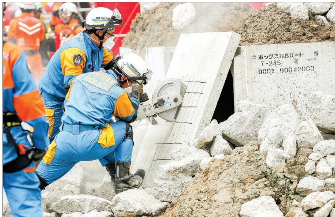
Police officers conduct an annual disaster drill in Kawasaki near Tokyo based on the scenario of a massive earthquake originating in the Nankai Trough in the Pacific rocking wide areas in central and western Japan.

The Nankai Trough extends from off the coast of central Japan to the southwest. The quake could produce massive tsunami waves, resulting in over 300,000 deaths and economic damage totaling 220 trillion yen ($2 trillion), according to a government estimate.—Kyodo News ■