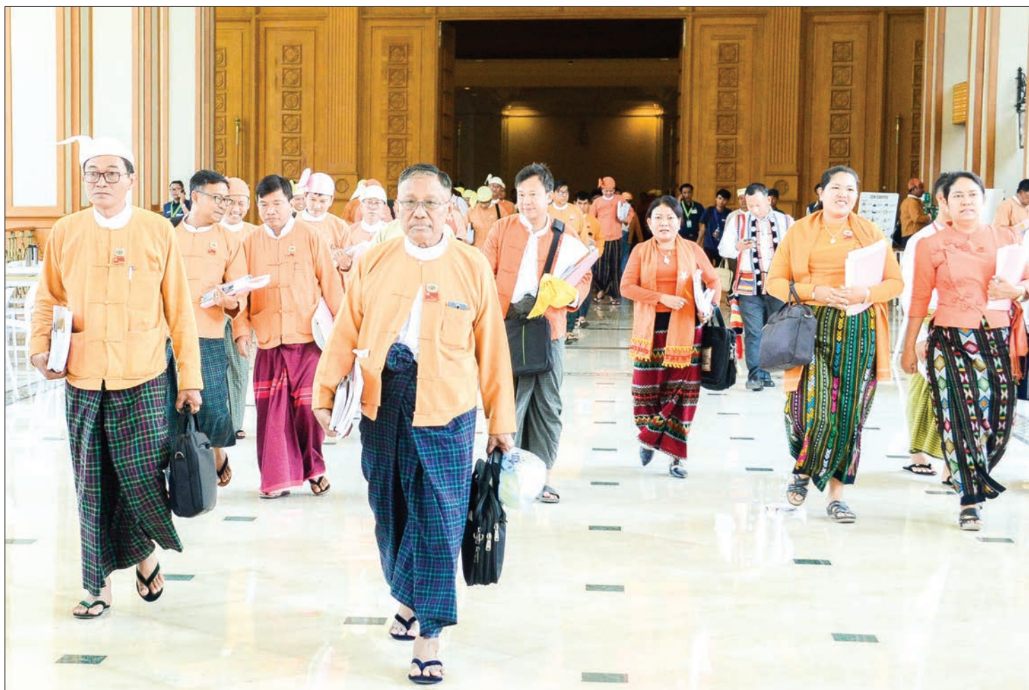
Hluttaw representatives seen at Pyidaungsu Hluttaw yesterday.

T HE ninth-day meeting of the Second Pyidaungsu Hluttaw's 12 th regular session was held at the Pyidaungsu Hluttaw meeting hall yesterday morning.