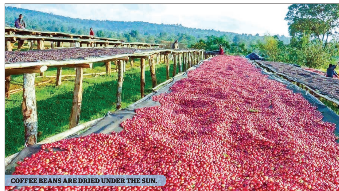
COFFEE BEANS ARE DRIED UNDER THE SUN.

country, its people are relying only on Pyawbwe brand instant coffee. So the country should extend cultivation of Robusta coffee as it is exportable, and may have higher local demand."