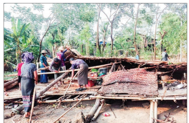
Houses are destroyed due to strong winds in Pyuntaza, Nyaunglebin Township, Bago Region.