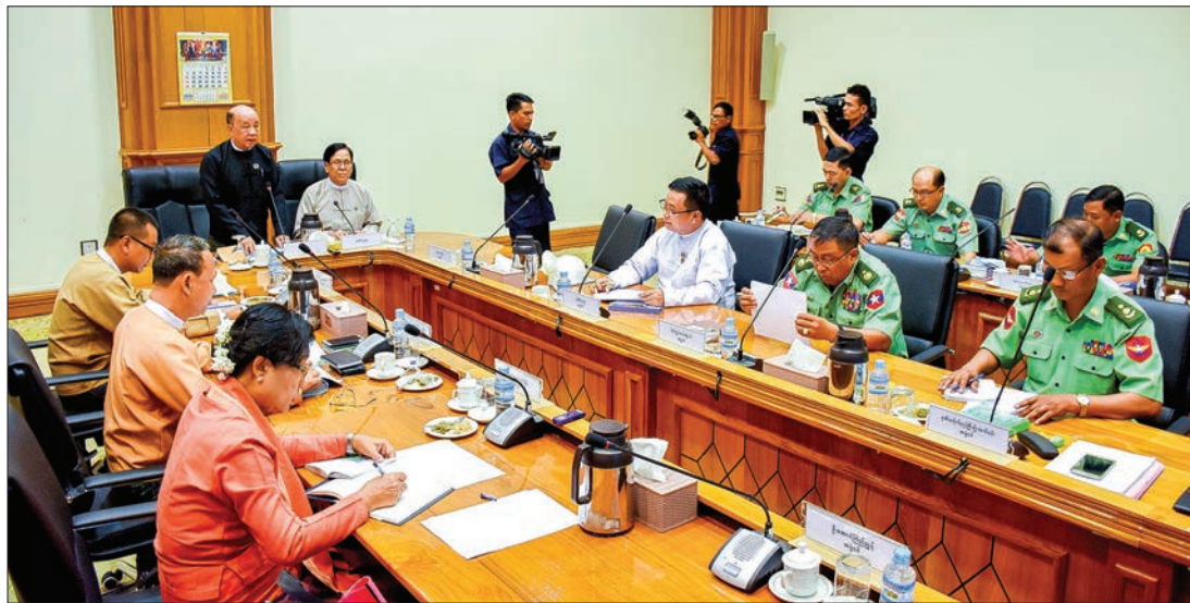
Deputy Speaker U Tun Tun Hein delivers the speech at the meeting 15/2019 of the Joint Committee on amending the 2008 Constitution in Nay Pyi Taw yesterday.

MEETING 15/2019 of the Joint Committee on amending the 2008 Constitution was held at Pyidaungsu Hluttaw Building D in Nay Pyi Taw yesterday afternoon.