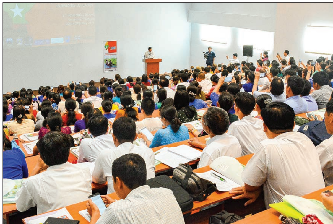
Union Minister Dr. Myo Thein Gyi delivers the opening speech at the ceremony for the opening of the 3 rd Residential School by TIDE at Yangon University in Yangon.

World Metrology Day celebrates the anniversary of the signing of the Metre Convention in 1875. Representatives from 17 nations discussed on a common system of measurements which led way to the eventual establishment of the International System of Units. —MNA (Translated by Zaw Htet Oo)