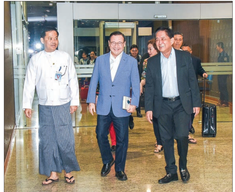
Philippines' Secretary of Foreign Affairs Mr. Teodoro L. Locsin Jr. welcomed by officials at the Nay Pyi Taw International Airport.