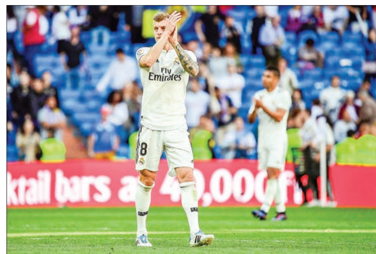
In this file photo taken on 05 May, 2019 Real Madrid's German midfielder Toni Kroos acknowledges spectators at the end of the Spanish league football match between Real Madrid CF and Villarreal CF at the Santiago Bernabeu stadium in Madrid. Germany international Toni Kroos has extended his contract with Real Madrid until 2023 ahead of an expected summer overhaul at the club, the Spanish giants said on 20 May, 2019.

Coach Zinedine Zidane has promised changes to the squad ahead of next season, with Gareth Bale, goalkeeper Keylor Navas, Nacho, Sergio Reguilon, Isco and Marcos Llorente all tipped to leave the club.—AFP ■