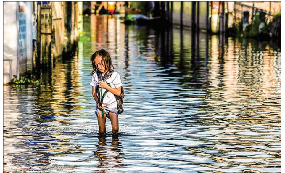
Areas north of Manila like the provinces of Pampanga and Bulacan have sunk four-six centimetres (1.5-2.4 inches) a year since 2003, according to satellite monitoring.

These days just the flooded chapel, a cluster of shacks on bamboo stilts where San Jose lives with her family, and a few homes on a bump of land remain.