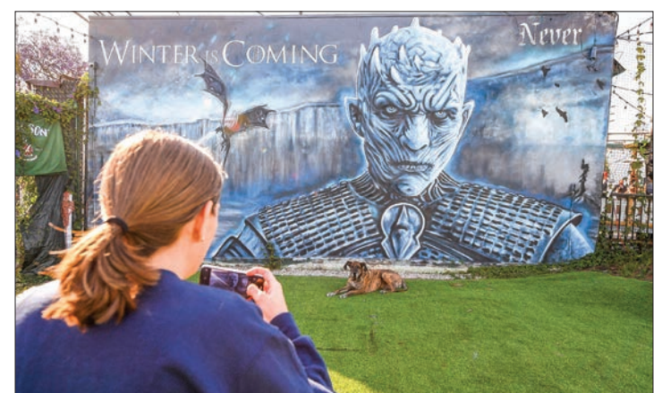
"Game of Thrones", the blood-spattered tale of noble families vying for the Iron Throne wrapped with the 73rd and final episode.