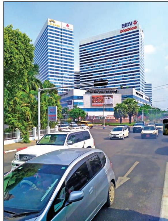
Melia Hotel in Yangon.

Altogether 21 countries will participate in the Food and Hotel expo, which will be held in Myanmar soon. The expo will help educate entrepreneurs from the hotel industry on food