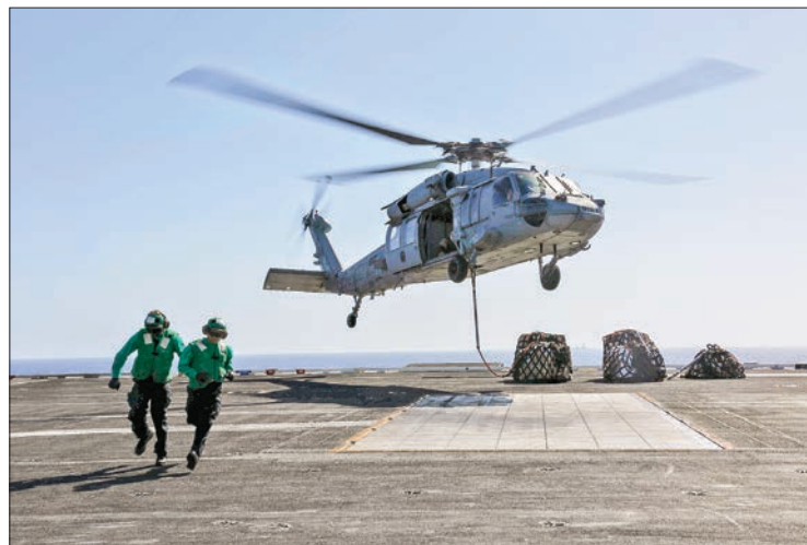
A US Navy MH-60S Sea Hawk helicopter hovers over the flight deck of the aircraft carrier USS Abraham Lincoln, which is among forces the Pentagon has dispatched to reinforce Gulf-region security after alleged threats from Iran.

Two major pro-Iran armed groups in Iraq rejected allega-