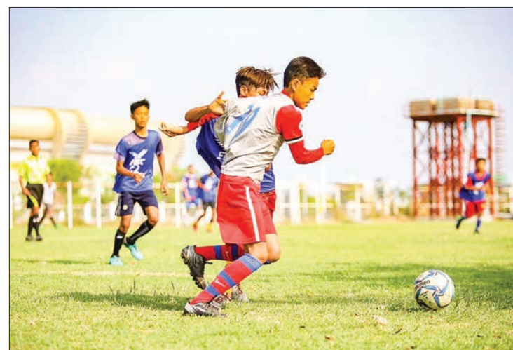
Youths participate in a game in the final round of selections at the Football Academy in Mandalay yesterday.