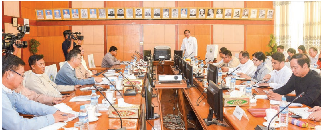
Deputy Minister U Aung Hla Tun delivers the speech at the Broadcasting Governing Body (BGB) coordination meeting in Nay Pyi Taw yesterday.

BROADCASTING Governing Body (BGB) coordination meeting 3/2019 was held at Ministry of Information in Nay Pyi Taw yesterday.