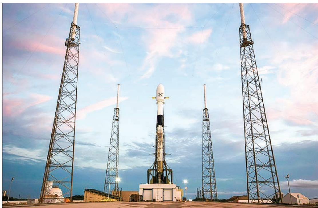
A SpaceX Falcon 9 rocket is set to take off from Cape Canaveral in Florida at 10:30 pm (0230 GMT Friday)

early forerunner, along with rival OneWeb, a startup, but well ahead of Amazon’s Project Kuiper, the brainchild of Musk’s space rival Jeff Bezos.