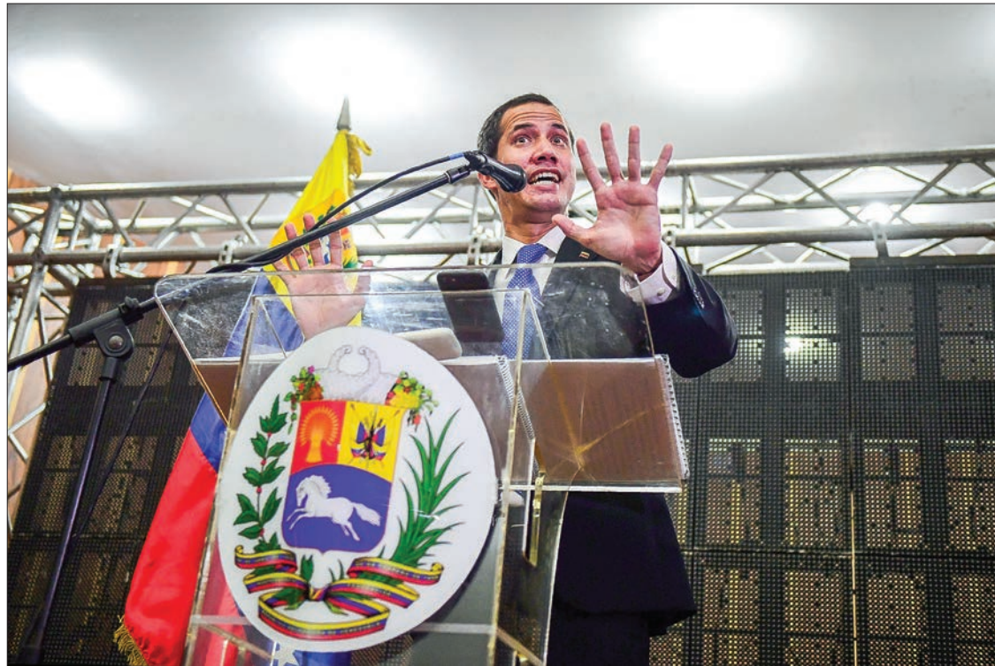
Venezuelan opposition leader Juan Guaidó denied talks were underway in Norway with President Nicolas Maduro's government.

OSLO (Norway) — Norway confirmed Friday it was trying to mediate a solution to Venezuela's political crisis, after opposition leader Juan Guaidó said he sent delegates to Oslo but denied talks were underway with President Nicolas Maduro's government.