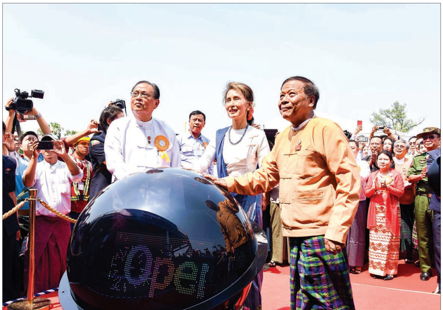
State Counsellor Daw Aung San Suu Kyi (Centre), Union Minister U Win Khaing (Left) and Mandalay Region Chief Minister Dr. Zaw Myint Maung (Right) inaugurate the 145 MW gas power plant in Bellin, Kyaukse Township, Mandalay Region yesterday.

Under the incumbent government, power plants were launched in Mandalay Region, including a 225 MW power plant