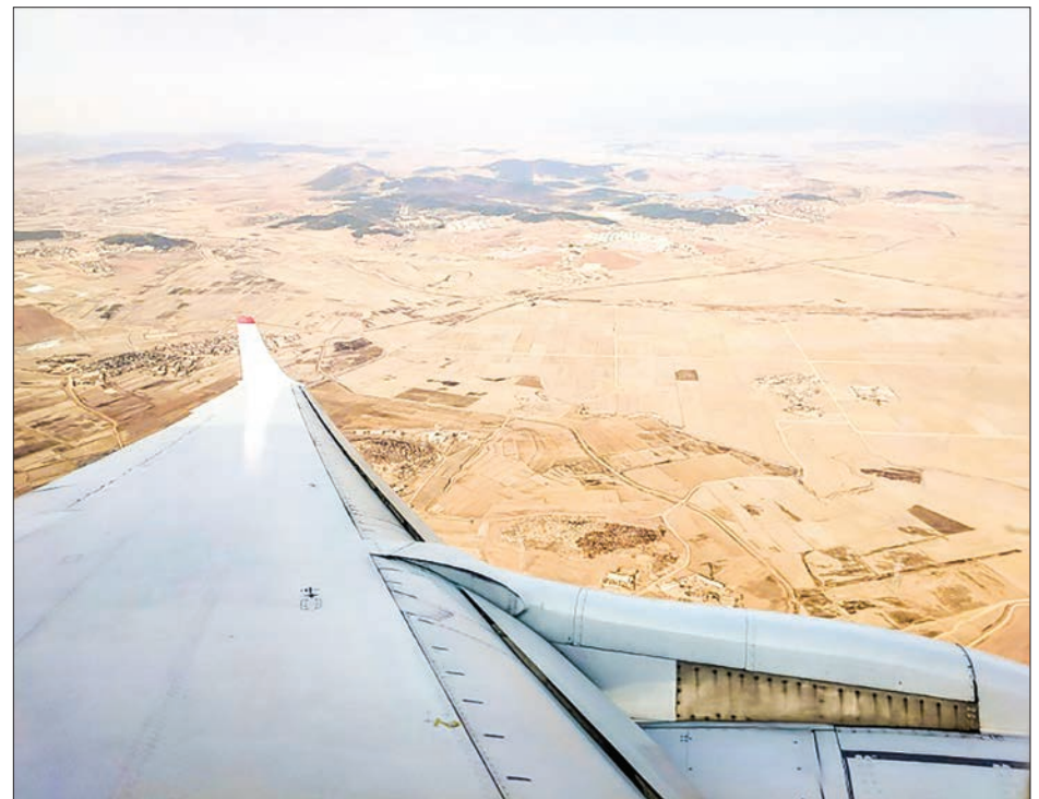
As seen from an airplane, much of North Korea’s countryside is dry and parched as the country suffers from what state media says is the worst drought in a century.

And according to China’s National Meteorological Centre, rainfall in northeast China — which includes the provinces of