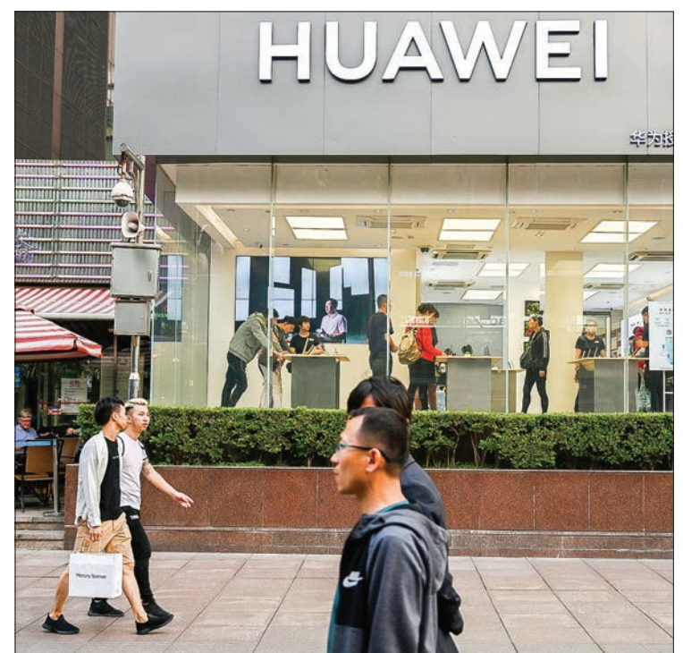
Tensions have further escalated between Beijing and Washington over the effective barring of Huawei from the US market.

"First, it is not the best way to defend your national security — we don't need it. Second, it is not the best way to develop your own ecosystem and have a world of cooperation and decrease tensions," he said. — AFP ■