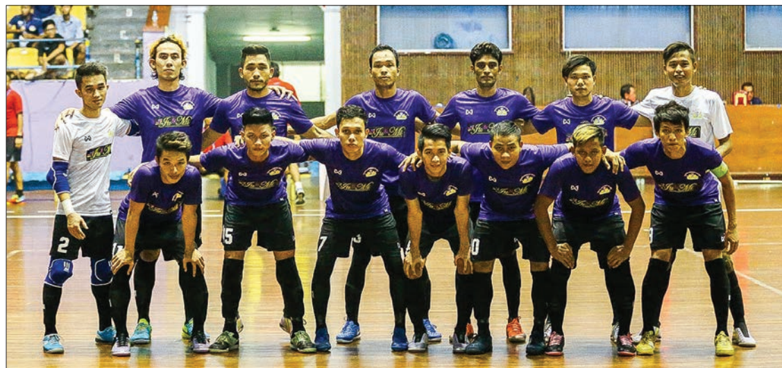
Players from the Victoria University College (VUC) Futsal Club pose for a group photo at the MFF Futsal Open Cup 2019 in Yangon.

MYANMAR'S Victoria University College (VUC) F.C. will compete in the Asian Futsal Club Championship 2019 in Thailand, according to a statement released yesterday by the Myanmar Football Federation. The VUC F.C. finished second in the MFF Myanmar Futsal League 2018, and now, they will participate in the Asian Futsal Club Championship 2019, which will be held at the Futsal Arena Indoor Stadium in Bangkok