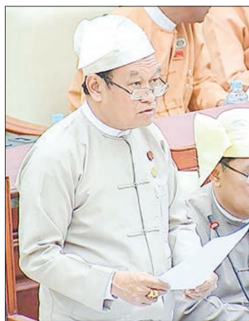
Union Minister Dr. Myint Htwe.

On the matter of upgrading Kaung Bo health clinic in Kaung Bo Village, Yaksawk Township to a station hospital raised by U Khin Maung Myint of Yaksawk constituency, Union Minister Dr. Myint Htwe replied that the health centre met all five norms required for upgrading to a station hospital while 5.5 acres of land had been donated for it. Therefore the health centre will be upgraded and while the pro-