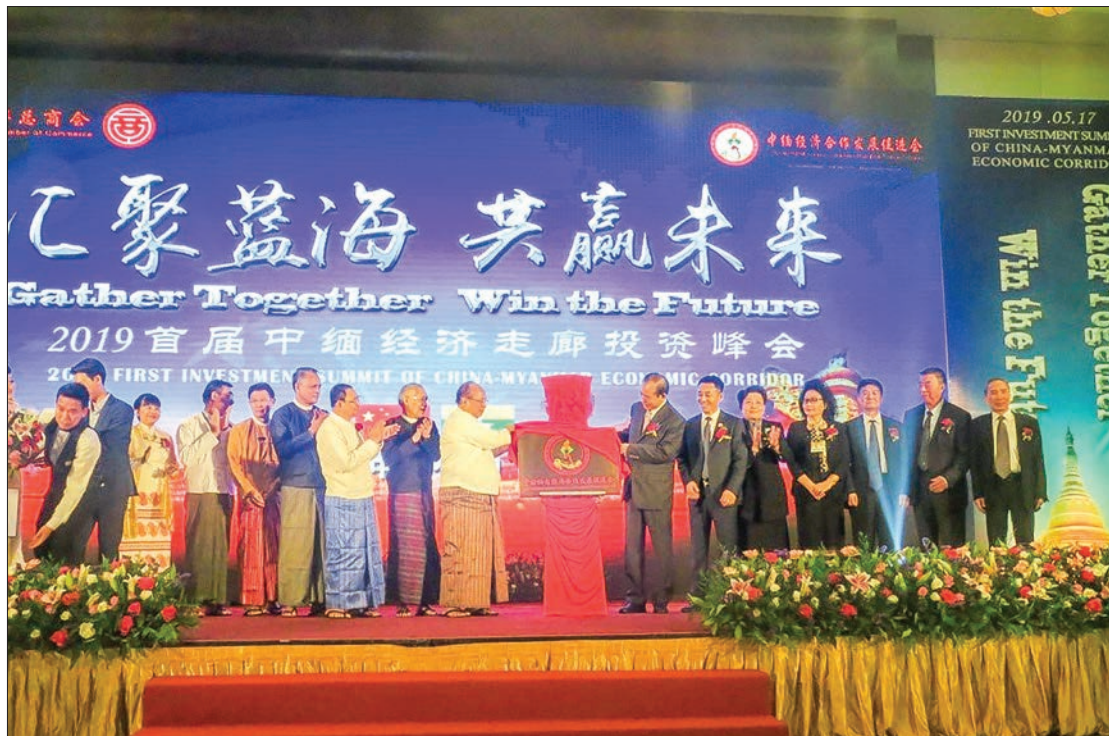
Union Minister U Thaug Tun and PRC Former Ambassador Mr. Guan Mu open the inauguration ceremony of the China-Myanmar Economic Cooperation and Development Promotion Association and 2019 China – Myanmar Economic Corridor First Investment Summit in Yangon.

THE inauguration ceremony of the China – Myanmar Economic Cooperation and Development Promotion Association and 2019 China – Myanmar Economic Corridor First Investment Summit was held at the Sedona Hotel in Yangon today.