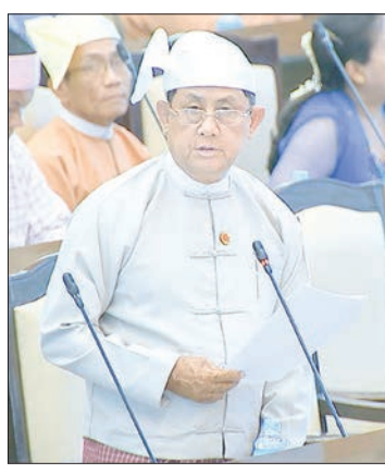
Deputy Minister U Maung Maung Win.

of Chin State constituency 1, U Tun Tun Oo of Mandalay Region constituency 2, U Whey Tin of Chin State constituency 11 and U Soe Thein of Kayah State constituency 9 on using President's emergency fund for preventing erosion of river banks caused by river flows during rainy season, educating the people about records kept by Irrigation and Water Utilisation Management Department in National Archive, opening of a township Internal Revenue Department office and resource sharing plan for locals of income obtained from Baluch-