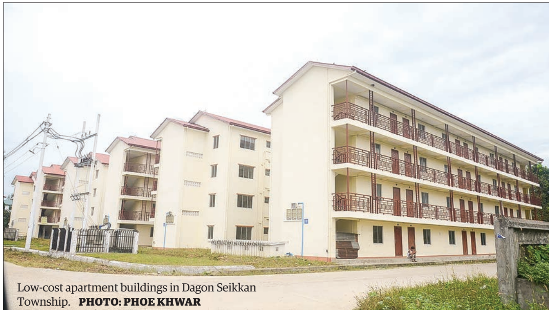
Low-cost apartment buildings in Dagon Seikkan Township.

THE low-cost and affordable housing estates in Dagon Seikkan and Hlinethaya townships will be sold to people in the low-income group under a long-term instalment plan, said an official from the Urban and Housing Development Department under the Ministry of Construction.