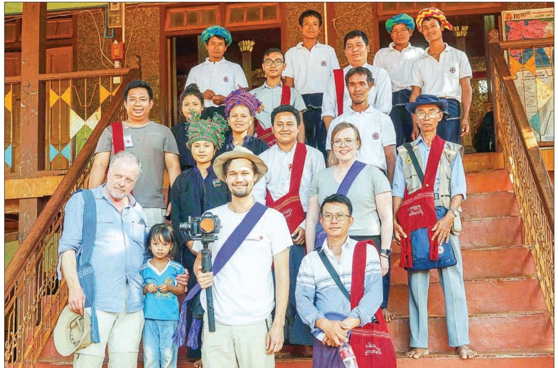
Finland Red Cross Society team pose for a photo with villagers in Loikaw Township yesterday.

THE Finland Red Cross Society team continued filming documentary of activities of villagers in Loikaw Township under the Disaster Resilience Project yesterday.