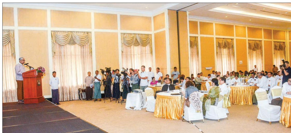
Anti-Corruption Commission Chairman U Aung Kyi delivers the speech at the workshop on drafting a whistle-blower protection law.

Strategic Plan for Anti-Corruption (2018-2021) includes plans to establish legal protection mechanisms for whistle-blowers and the deadline is slated as 2019-2020.