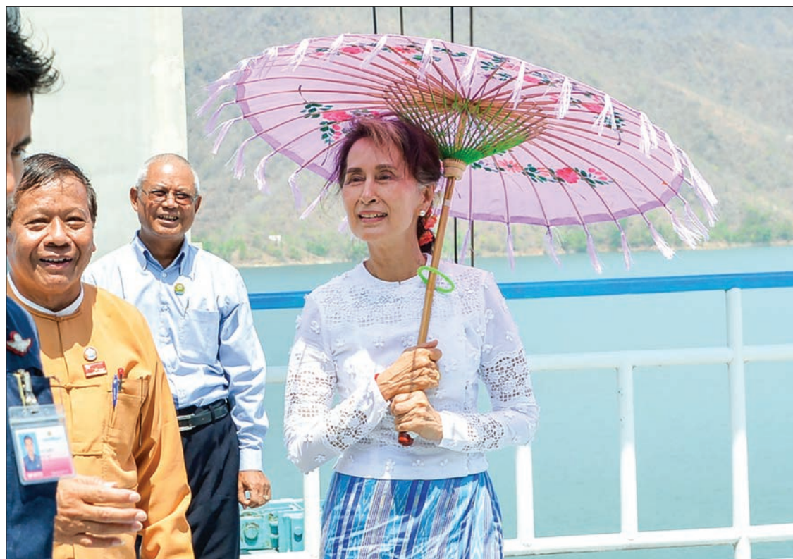
State Counsellor Daw Aung San Suu Kyi visits the Myogyi Dam in Kyaukse, Mandalay Region, yesterday.