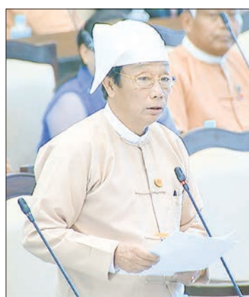
Deputy Minister U Hla Kyaw.

In the question and answer session, a question raised by Daw Ma Ma Lay of Shan State constituency 8 on a plan to connect