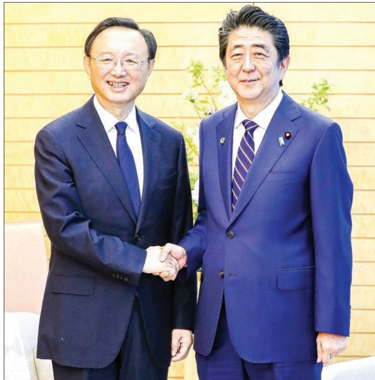
Japanese Prime Minister Shinzo Abe (R) shakes hands with China's top diplomat Yang Jiechi at his office in Tokyo on 17 May 2019.

"I'm confident that our ties are not only back on a normal track but will continue to develop in a healthy and stable manner," he said. Japan and China have for years been mired in a territorial row in the East China Sea. But their ties have been improving recently with mutual visits by senior government officials and business leaders. Abe and Yang agreed to step up preparations for what will be Xi's first visit as president to Japan on the occasion of the G-20 summit in Osaka on 28 and 29 June, the Japanese Foreign Ministry said. During a separate meeting earlier in the day, Foreign Minister Taro Kono expressed hope of demonstrat-