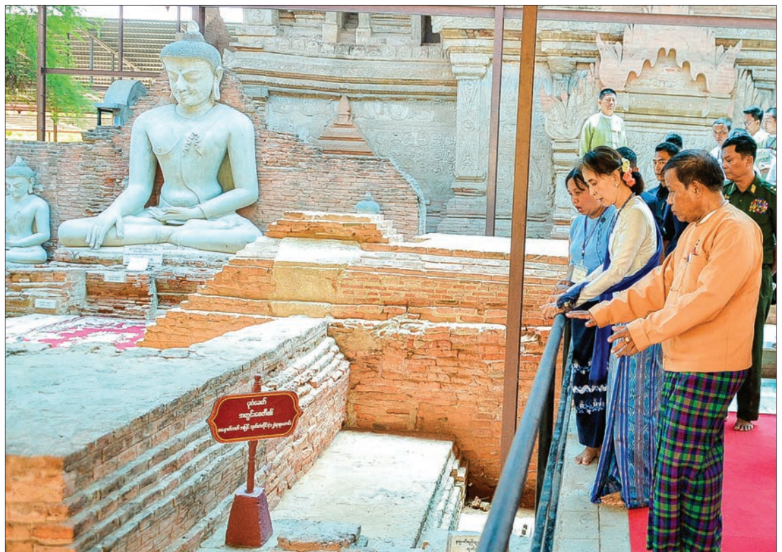
State Counsellor Daw Aung San Suu Kyi visits Tamoteshipin Shwegu Pagoda built by King Anawrahta near Kyaukse.

We conducted a review whenever a new power station was opened or a power supply work was successfully implemented. What was the benefit to the country from having one more power station? What were the economic, social and political benefits? We have to think in this manner. As mentioned earlier, politics means a process based on union spirit. If we can work in unity on politics based on union spirit this country can overcome whatever difficulties or challenges it faces and it would develop quickly. The main belief was that a sustainable de-