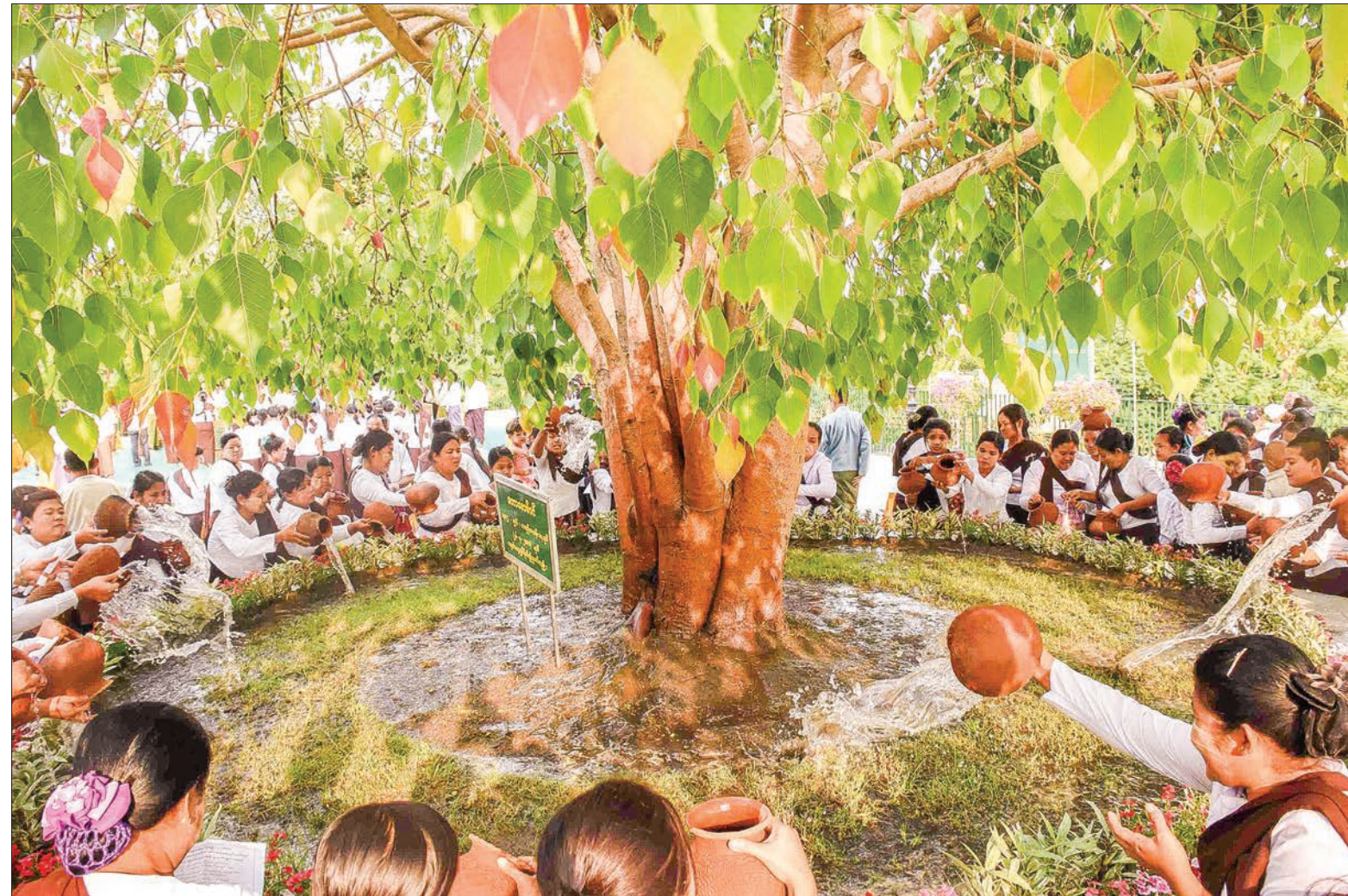
Buddhist devotees water the Bo Tree at Uppatasanti Pagoda in Nay Pyi Taw to mark Buddha Day which falls on the Full Moon Day of Kasone.

Full moon Kasone is Buddha's Day for all Buddhists across the world. Abroad this Day is celebrated as Vesak Day or Buddha's Day it. Four major