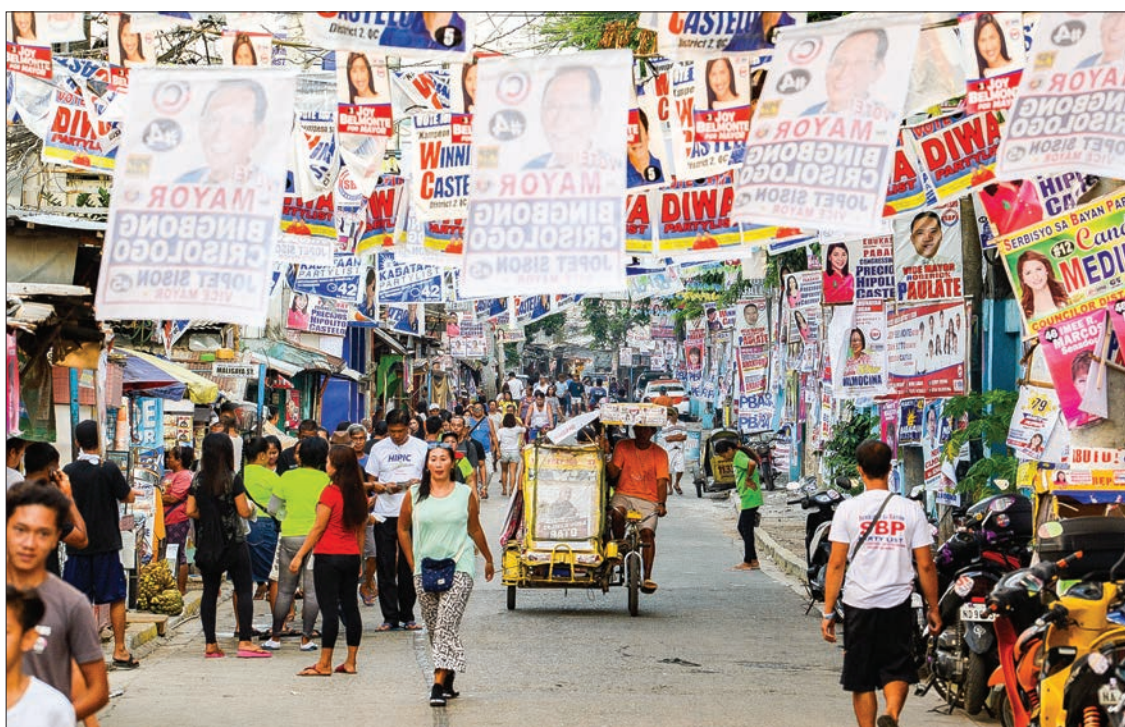
More than 18,000 positions are at stake, including half of the seats in the upper house Senate, which has served as a bulwark against some of President Rodrigo Duterte’s most controversial policies.

Saudi Arabia, the Islamic republic’s regional arch-rival, condemned “the acts of sabotage which targeted commercial and civilian vessels near the territorial waters of the United Arab Emirates,” a foreign ministry source said.—AFP ■