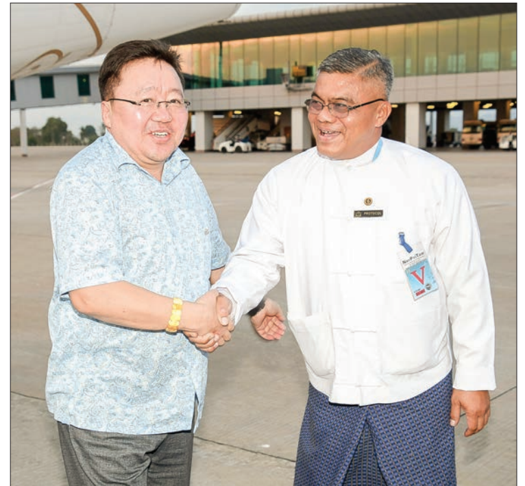
Former Mongolian President Mr. Elbegdorj arrives in Nay Pyi Taw International Airport yesterday.