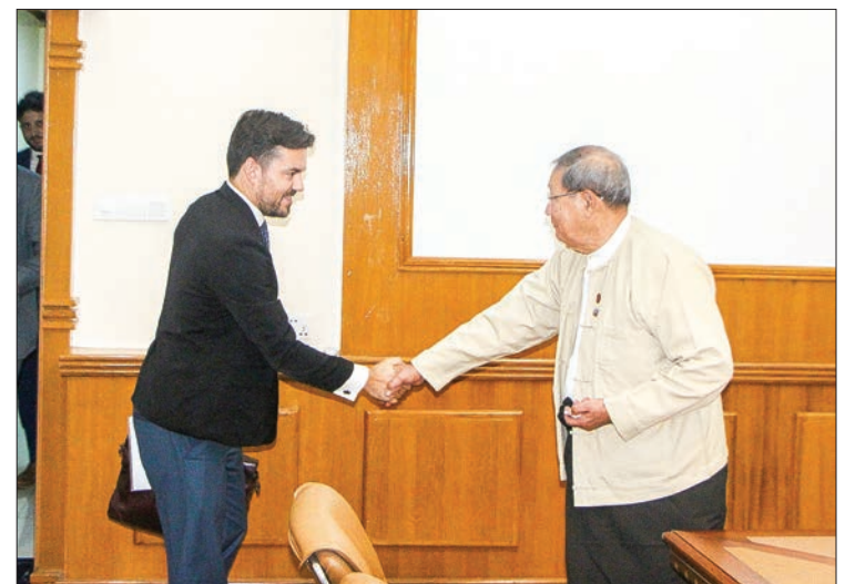
Union Minister U Soe Win welcomes Executive Director of Europe Commerce Chamber Mr. Filip Lauwerysen in Nay Pyi Taw.

in Nay Pyi Taw yesterday. They discussed the Everything But Arms (EBA) Agreement and developing the textile industry in Myanmar. —MNA (Translated by Zaw Htet Oo)