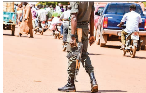
Despite patrols by the security forces in the east and north of the country, the jihadist attacks have continued.

“People are holed up in their homes. Nothing is going on. The shops and stores are closed. It's practically a ghost town,” he added. Security reinforcements