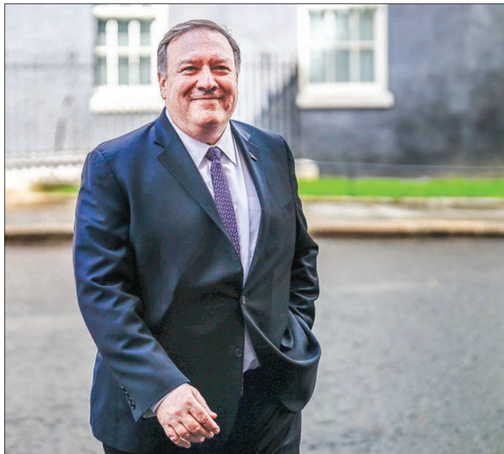
US Secretary of State Mike Pompeo will head to the Russian Black Sea resort of Sochi to meet President Vladimir Putin.

“That is why we will continue to support the implementation of this agreement.”