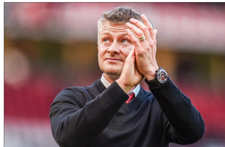
Manchester United boss Ole Gunnar Solskjaer has a huge job on his hands to revive the fortunes of the club.

The wisdom of giving the relatively inexperienced Norwegian a three-year contract just over six weeks ago, a move that was followed by a dramatic decline in form, has been widely questioned by pundits.—AFP ■