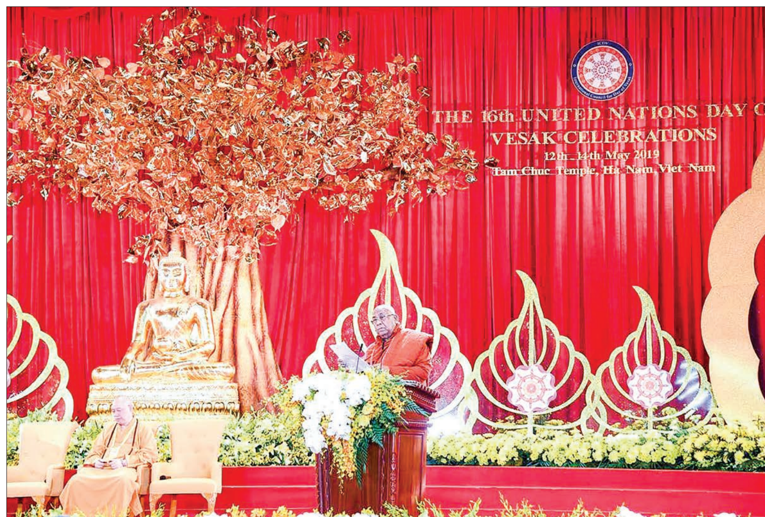
Sitagu Sayadaw Dr. Ashin Nyanissara delivers the address at the 16 th United Nations Day of Vesak Celebrations 2019.

It was the Buddha who renounced all worldly pleasures