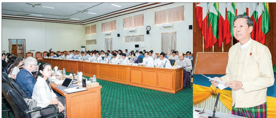
Union Minister Dr. Myo Thein Gyi addresses the 11 th education and TVET sector coordination group meeting in Nay Pyi Taw.

11 th Education and TVET Sector Coordination Group Meeting was held at Office No. 13 meeting hall, Ministry of Education, Nay Pyi Taw yesterday morning.