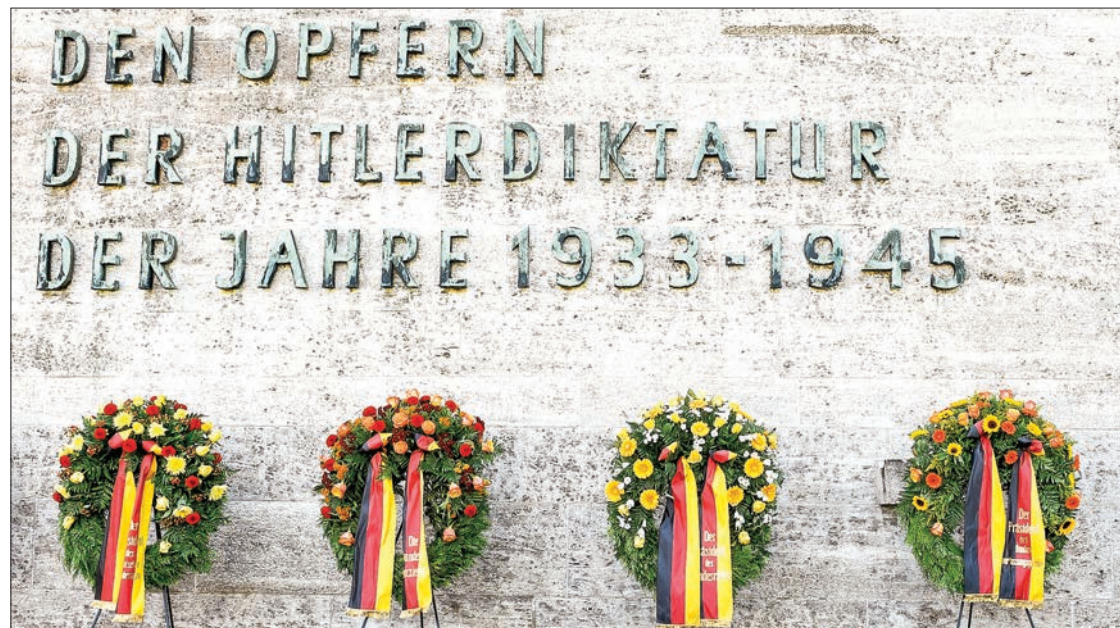
The Plötzensee memorial site in Berlin commemorates executed resistance fighters against Nazi rule in Germany.

Those pixels can be seen in bright sunlight and do not need constant power to keep their set color, so they have a good energy performance that make large areas feasible and sustainable. —Xinhua ■