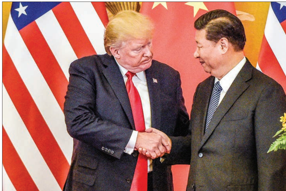
The Chinese countermeasures are the latest salvo in a bruising trade war between Washington and Beijing that has spooked global markets.

China's rates will target a number of American imports with tariffs rising up to as high as 25 per cent, according to a statement by the Tariff Policy Commission of the State Council — China's cabinet.