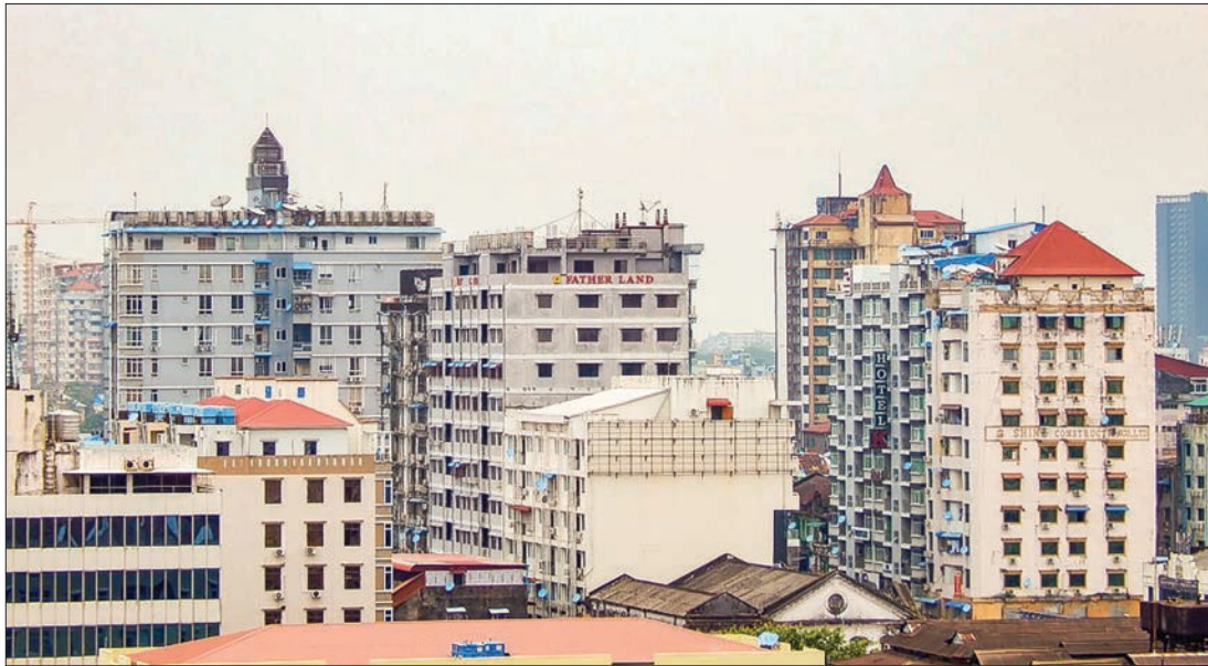
Price of condominium units is not likely to decrease in Yangon.

THE condominium market has picked up in Yangon Region, according to real estate entrepreneurs. The price of high-rise condominium units is not likely to decline as construction costs have increased, they said.