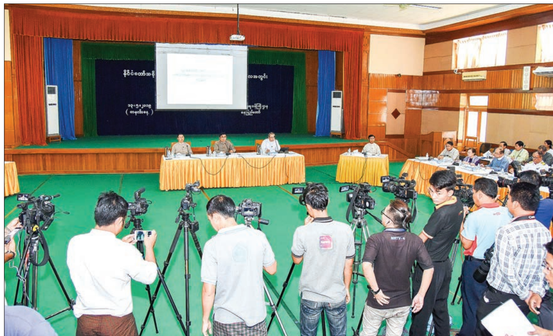
Ministries hold press conference on performances in third one-year period in Nay Pyi Taw yesterday.