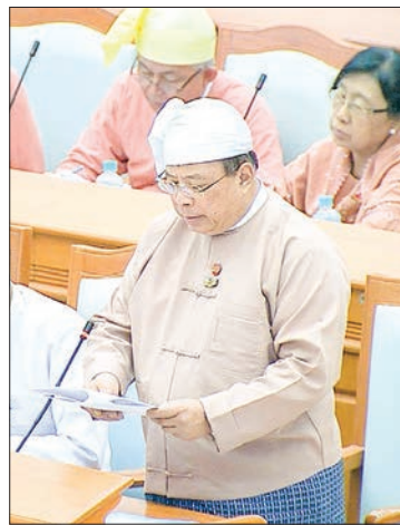
Union Minister for Investment and Foreign Economic Relations U Thaung Tun.

Next Anti-Corruption Commission Annual Report was