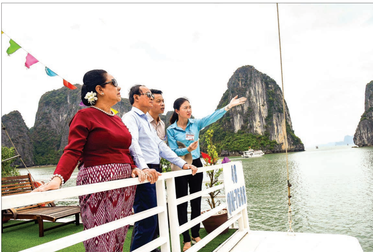
President U Win Myint and First Lady Daw Cho Cho viewing Ha Long Bay and the islands from a cruise ship in Viet Nam yesterday.

A DELEGATION led by President U Win Myint and First Lady Daw Cho Cho who were in Viet Nam, Hanoi visited the UNESCO World Heritage site Ha Long Bay in Quang Ninh Province yesterday morning.