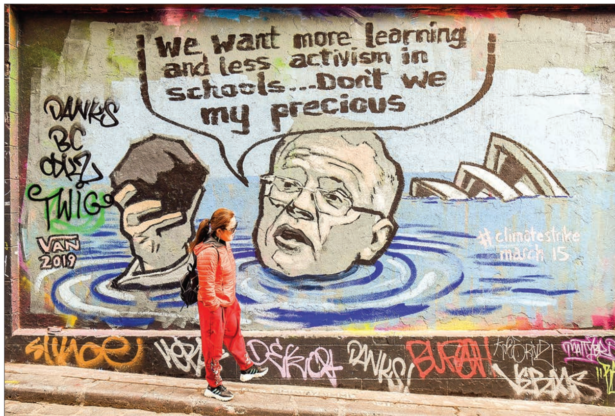
Mural in Melbourne shows Australian Prime Minister Scott Morrison holding a lump of coal as it advertises a rally by students around the world to protest climate change.

SYDNEY (Australia) — Indigenous residents of low-lying islands off northern Australia will submit a landmark complaint with the United Nations on Monday accusing the government of violating their human rights by failing to tackle climate change.