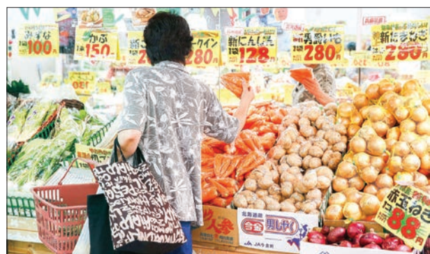
A shopper selects vegetables at a supermarket in Tokyo.

Analysts said the panel may not judge the "worsening" situation as a recessionary phase, if an economic slowdown proves to be short-lived. — Kyodo News ■