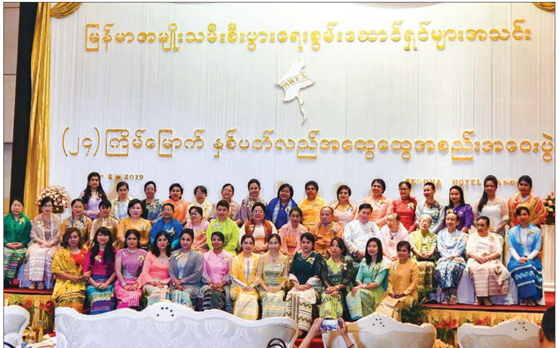
Myanmar Women Entrepreneurs' Association holds its 24 th annual general meeting at Sedona Hotel in Yangon.

The Myanmar Women Entrepreneurs' Association