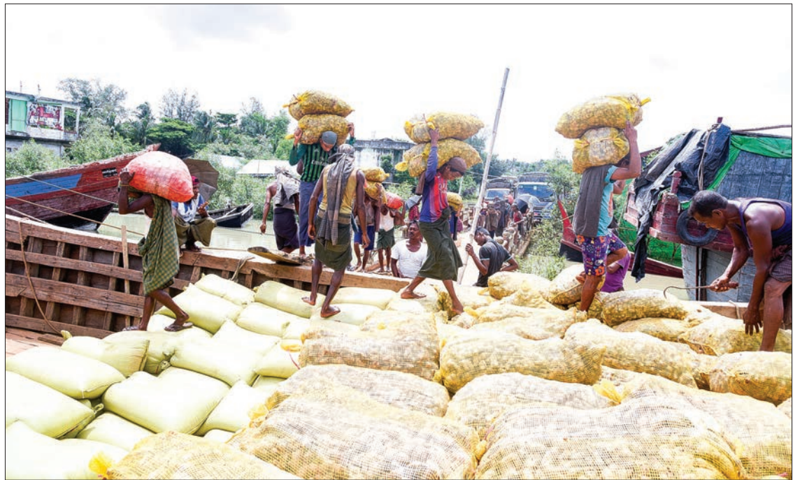
Workers loading bags of ginger onto ship at Maungtaw border trade camp.

According to the ministry's annual statistical data, the total