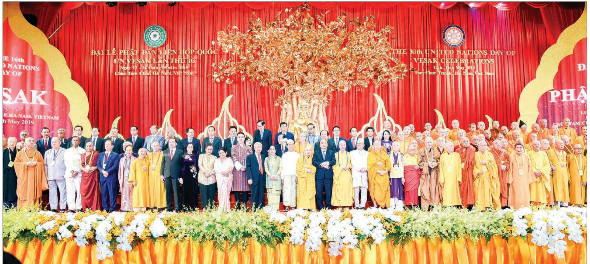
President U Win Myint and First Lady, heads of state, Members of the Sangha and religious leaders pose for documentary photo after the opening ceremony of 16 th United Nations Day of Vesak Celebration at Tam Chuc International Buddhist Convention Center in Ha Nam Province yesterday.

(Excerpt from the speech by State Counsellor Daw Aung San Suu Kyi on the 2 nd Anniversary of NLD Government on 1 st April 2018)