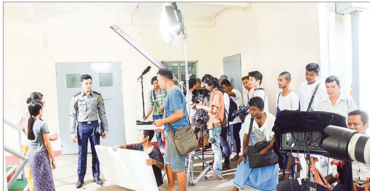
Local director shoots A-pay A-yu (give-and-take) film at the studios of the Film Development Centre of the Ministry of Information in Bahan, Yangon, yesterday.