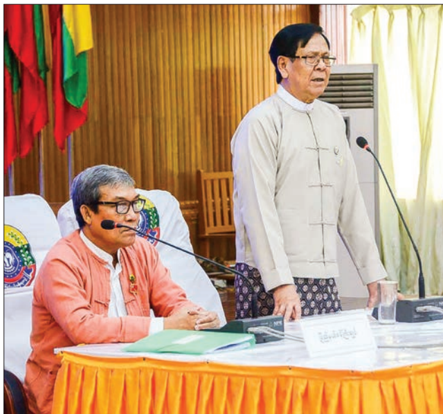
Amyotha Hluttaw Deputy Speaker U Aye Tha Aung (Right) delivers the speech at the committee meeting for providing aid to Internally Displaced Persons (IDPs) in Rakhine State yesterday.

He continued, noting that suggestions and data collected at the meeting from monks, government officials, the state Hluttaw speaker, Hluttaw representatives, political parties and local residents proved to provide sound solutions to resolve the conflict, as the commission submitted them to the Union Government as an i