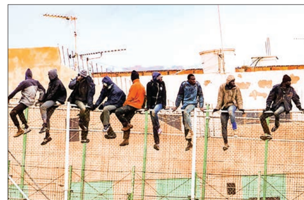
Immigrants scaling the fence on 19 February 2015.

MADRID (Spain) — Fifty-two African migrants forced their way into Spain's North African enclave of Melilla from Morocco Sunday by climbing over a towering border fence, Spanish authorities said.