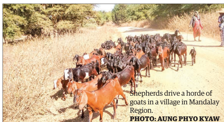
Shepherds drive a horde of goats in a village in Mandalay Region.

THE price of goats is on a downward trend as demand from China has fallen, according to goat farmers in Mandalay.