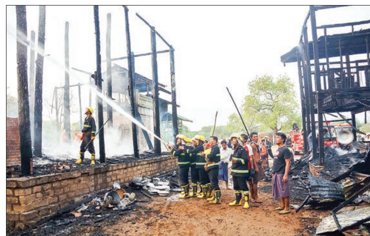
Fire fighters suppress fire at the site in Myingyan Township yesterday.

A fire destroyed four religious buildings at a village monastery in Myingyan Township, Mandalay Region, early on Sunday morning, but there were no casualties, according to the District Fire Services Department.