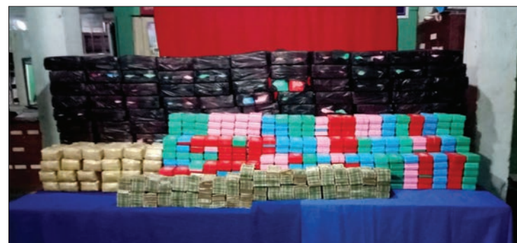
Illegal drugs seized in Mabain Township.

A combined team comprising police members of Mongchaung police post in Phaungpyin Township seized 190 grams of heroin from two persons on a motorcy-