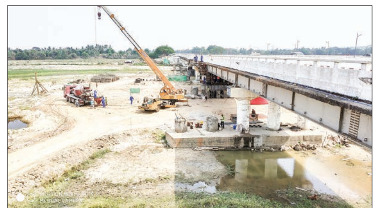
The Swa Chaung Bridge in Swa, Yadashe Township.

Construction Group 3 of the Ministry of Construction, reported on to the Union minister on work progress of the upgrading of the bridge. The disaster damaged the one lane of the two-way bridge. The remaining lane of the bridge is being used by traffic.—MNA(Translated by Kyaw Zin Lin)