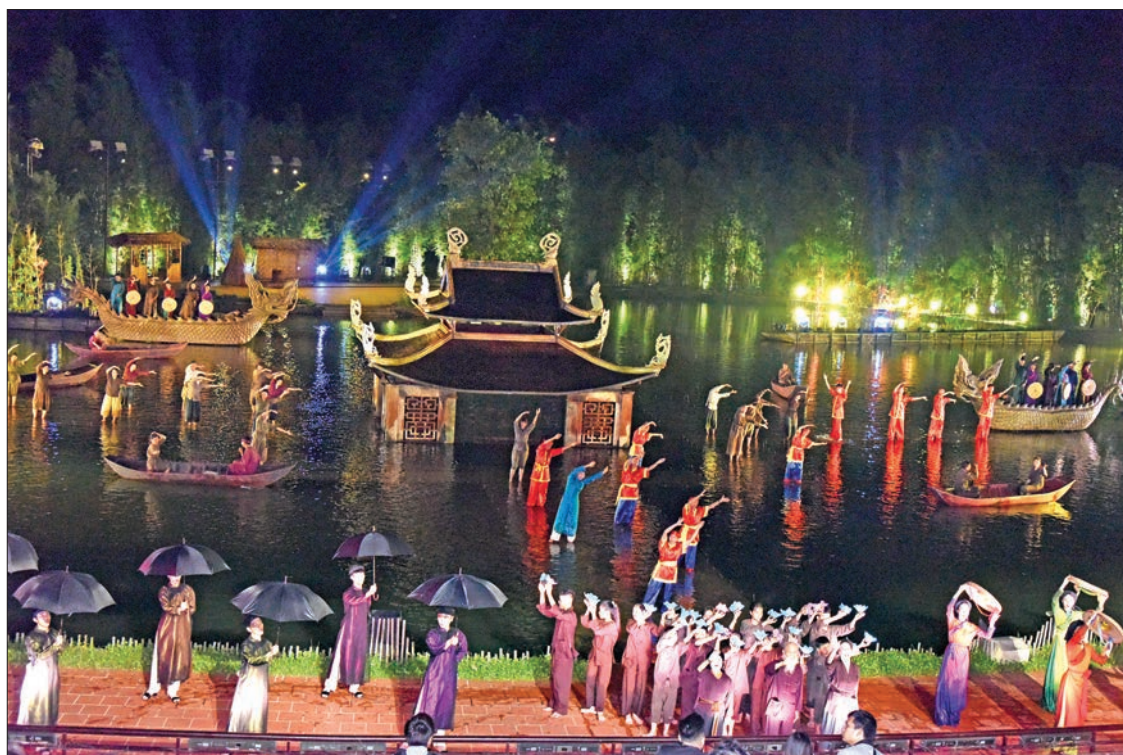
Viet Nam's cultural dance troupe performs at Viet Nam's Cultural Show yesterday.

Religion plays a vital role in maintaining peace and stability of the world. The great religious teachers taught us the moral principles and values such as self respect, respect to others, reduction and ultimate eradication of greed and hatred. If we follow the teachings of our respective religion, we would be able to build a harmonious societies, ultimately peaceful and prosperous world. The universal spirit of loving-kindness, boundless compassion and great tolerance is a common platform for attaining the common goals of peace and prosperity for the entire world.