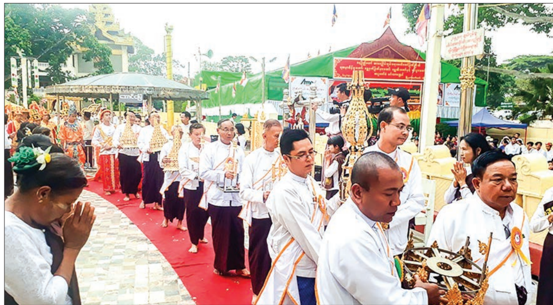
Officials carry religious objects of Nay Pyi Taw's Eternal Peace Pagoda for displaying at Myonam Pagoda in Loikaw yesterday.

RELIGIOUS objects to be fixed atop the Nay Pyi Taw's Eternal Peace Pagoda and two Buddha Images carved from marble stones to be housed at the pagoda were displayed in Loikaw yesterday for public obeisance.