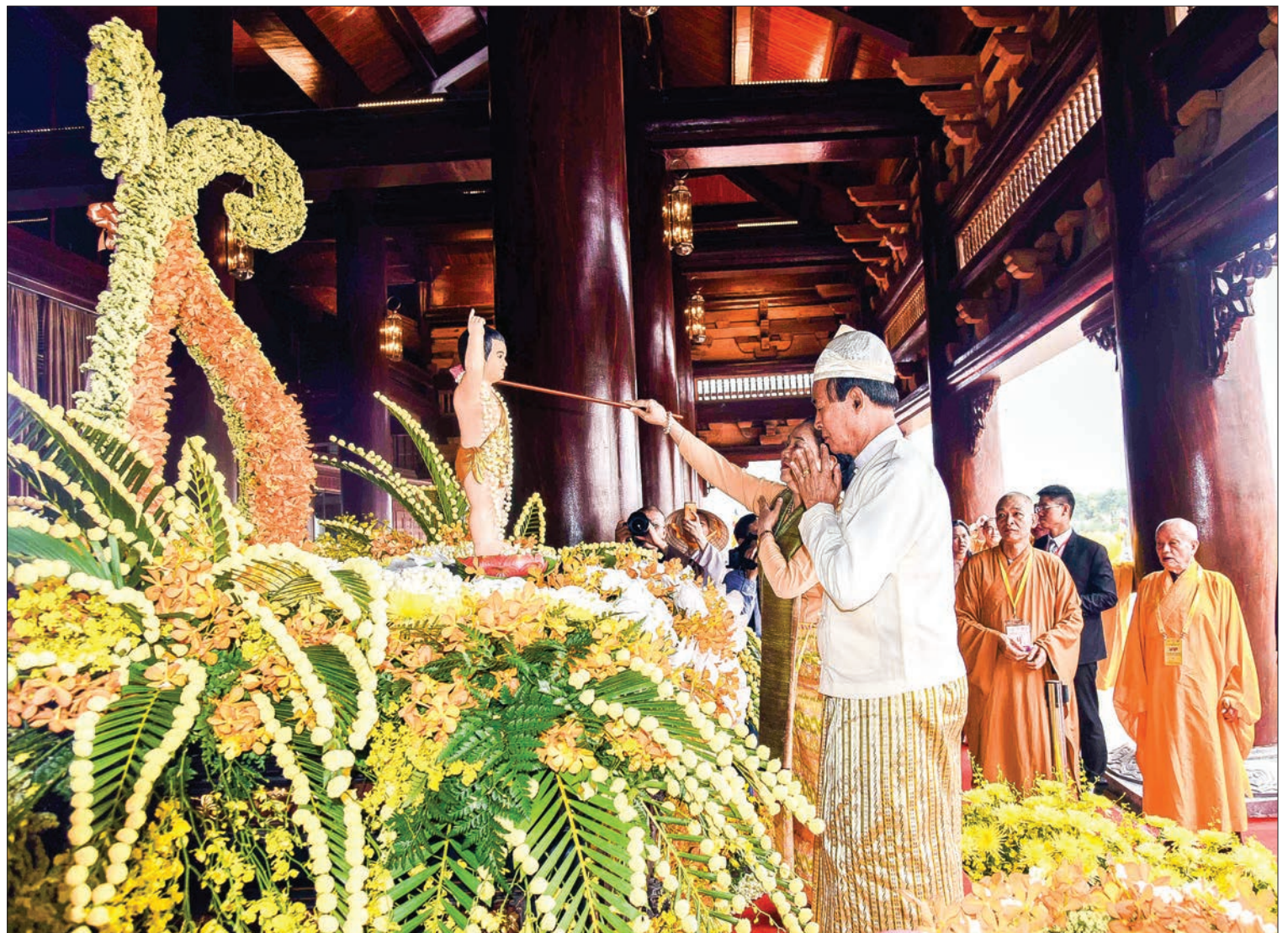
President U Win Myint and First Lady pour water over the Young Buddha Statue before attending the UN Vesak Day celebration in Ha Nam, Viet Nam yesterday.

In his address, President U Win Myint said It is my honour and privilege to participate in this auspicious the United Nations Vesak Day celebration today. I wish to express my appreciation to the Government of the Socialist Republic of Viet