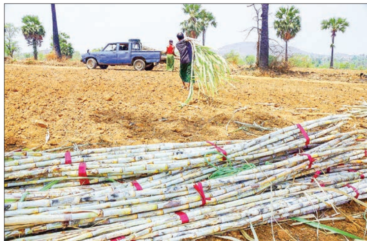
Farmers loading truck with cut sugarcane.

SUGARCANE plantations in Tae Hla Village of Than Bo village-tract, Meiktila Township, have been successful and are sold in the regional market daily, according to local cultivators.