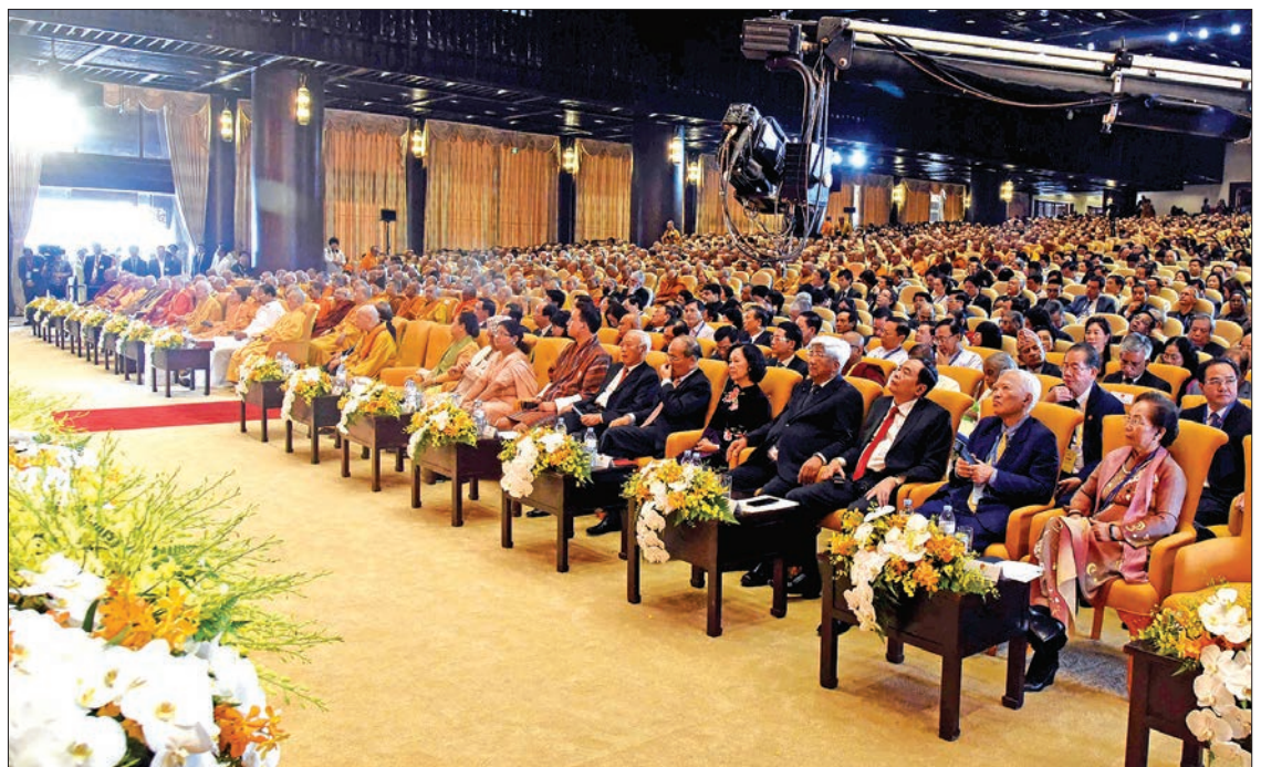
President U Win Myint delivers the speech at 16 th United Nations Day of Vesak Celebration at Tam Chuc International Buddhist Convention Center in Ha Nam Province yesterday.