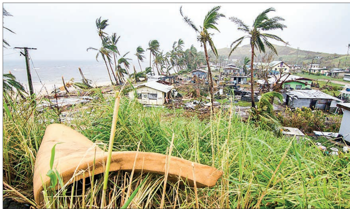
The Pacific island of Fiji is already feeling the impact of climate change through wild storms such as Cyclone Winston, which killed 44 people in 2016 and wiped out a third of the economy.