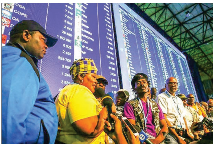
The African National Congress (ANC) will be mathematically assured more than 50 per cent of votes cast in the final official tally.

The party has been battling corruption scandals, sluggish economic growth, record unemployment and poverty — issues its leader Cyril Ramaphosa, a veteran of the anti-apartheid