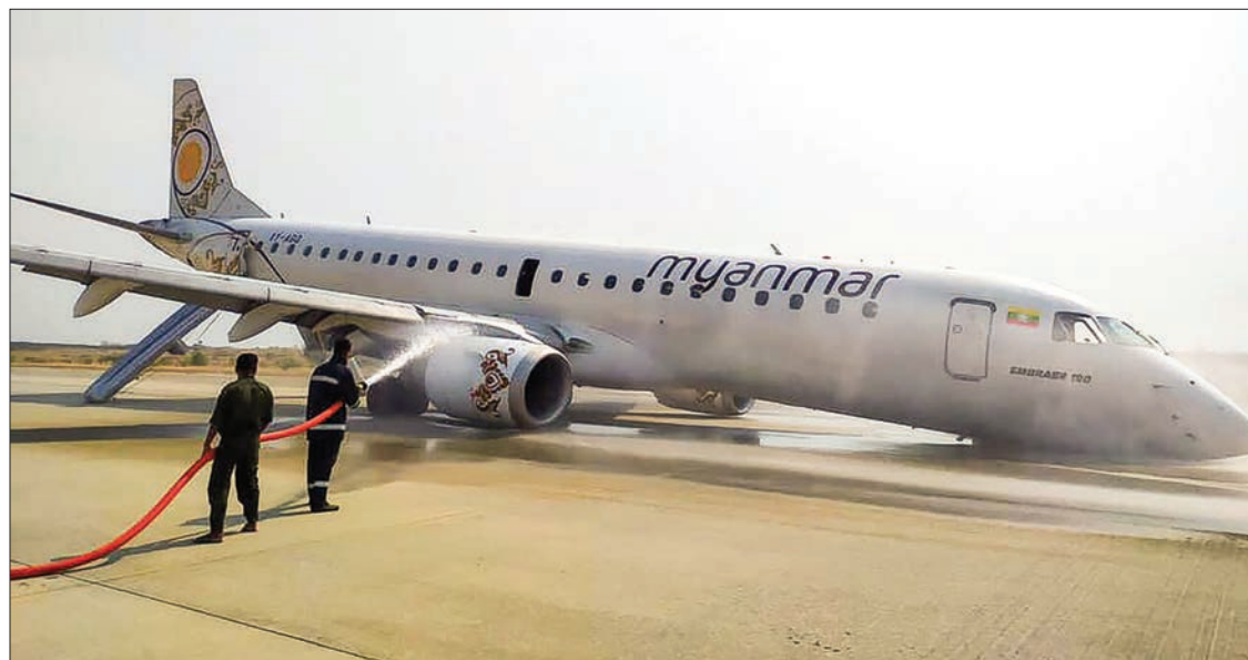
The 82 passengers and seven crew members on board Myanmar National Airline plane lands safely in Mandalay yesterday.