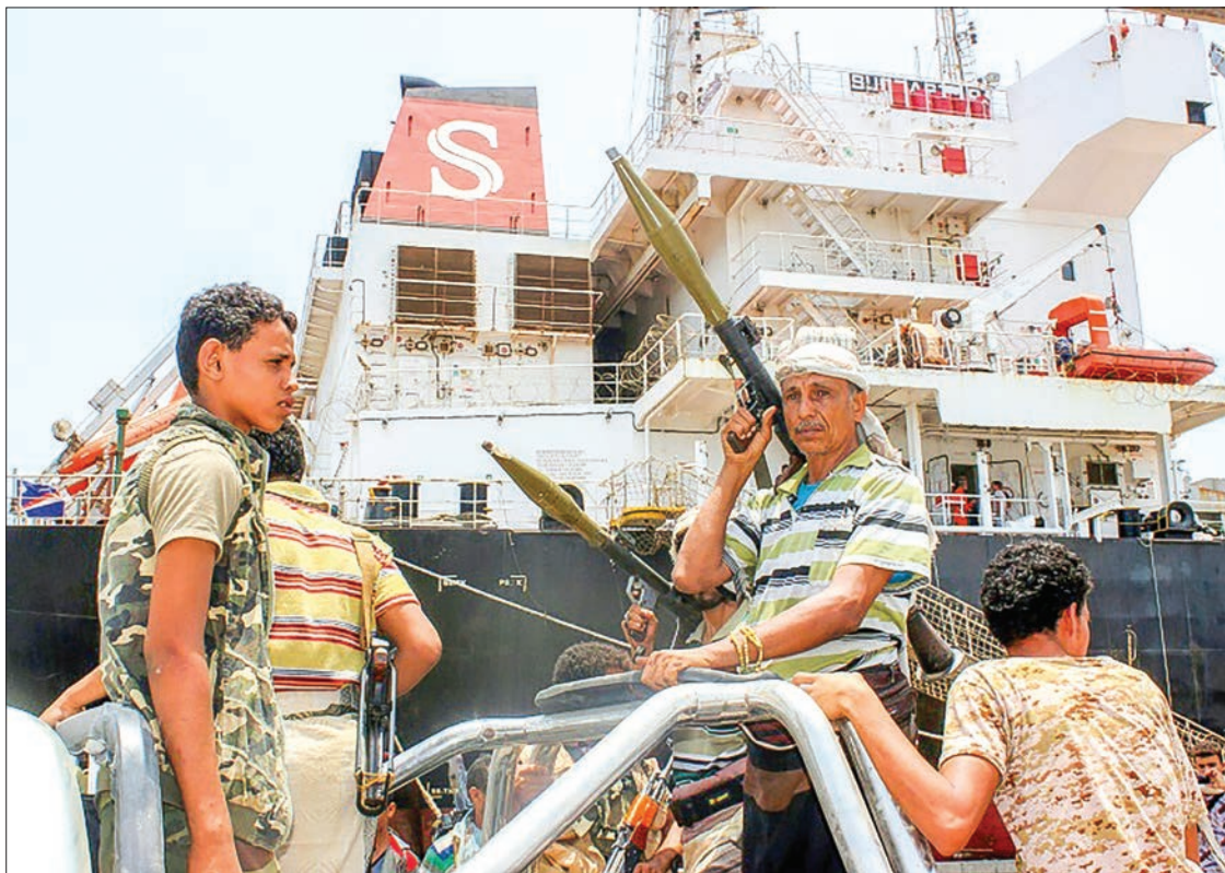
Yemen's Red Sea ports serve as an aid lifeline for millions in the impoverished country.

But government officials cast doubts over the handover process, saying it was unclear who was taking control of the ports, and experts said it was too soon to say if the move represented genuine progress. "The (Sweden) agreement is very difficult to execute because the lines are blurry and each side interprets it the way it wants to," said Yemen expert Farea al-Muslimi, a visiting fellow at the Lon-