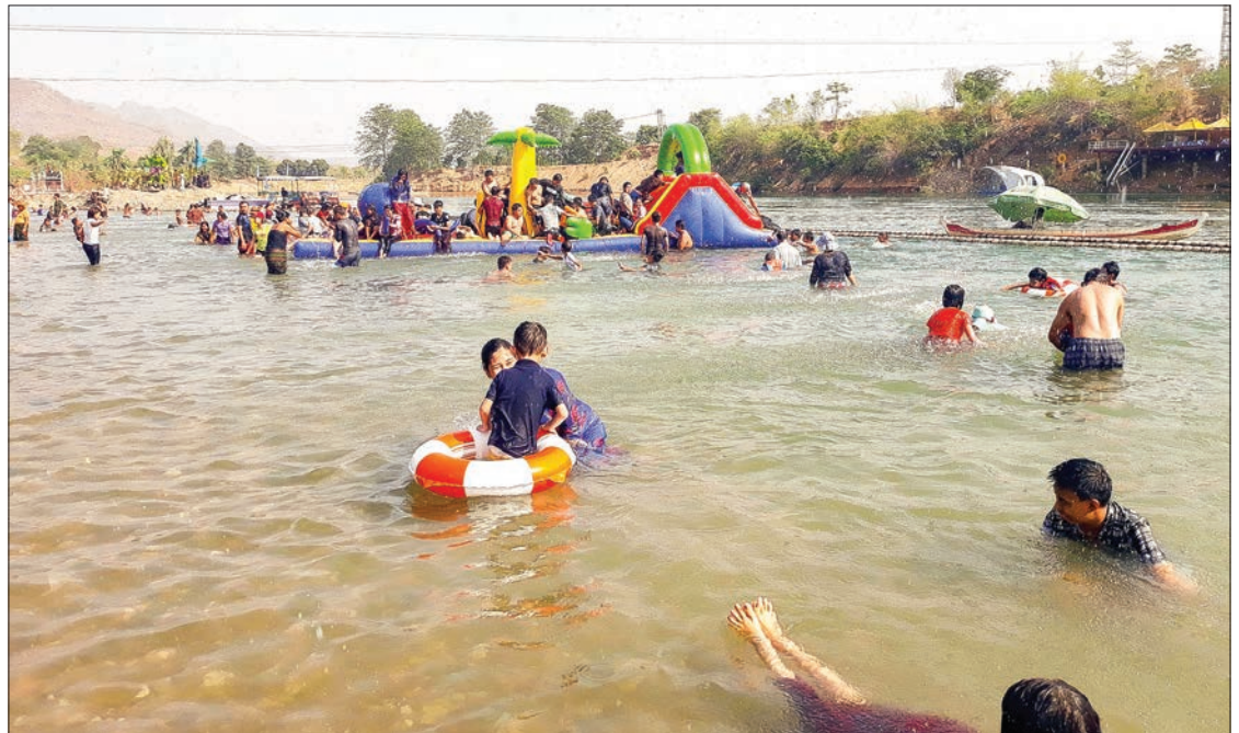
Holiday makers enjoy their vacation at 7 th -Mile Beach near Mandalay

Regarding the facilities, U Tun Myint, in-charge of the beach, said, "Located between Mandalay and PyinOoLwin, Seventh-Mile Beach is only a one-hour drive from Mandalay and one-and-a-half-hour drive from PyinOoLwin. It is open between 8 a.m. and 6 p.m. on a daily basis. Regularly, the beach is crowded with 500-800 visitors per day. The number of visitors significantly increases to 1,000-1,500 on weekends and public holidays. The majority of visitors are young people. The beach currently charges K2,000 per visitor."