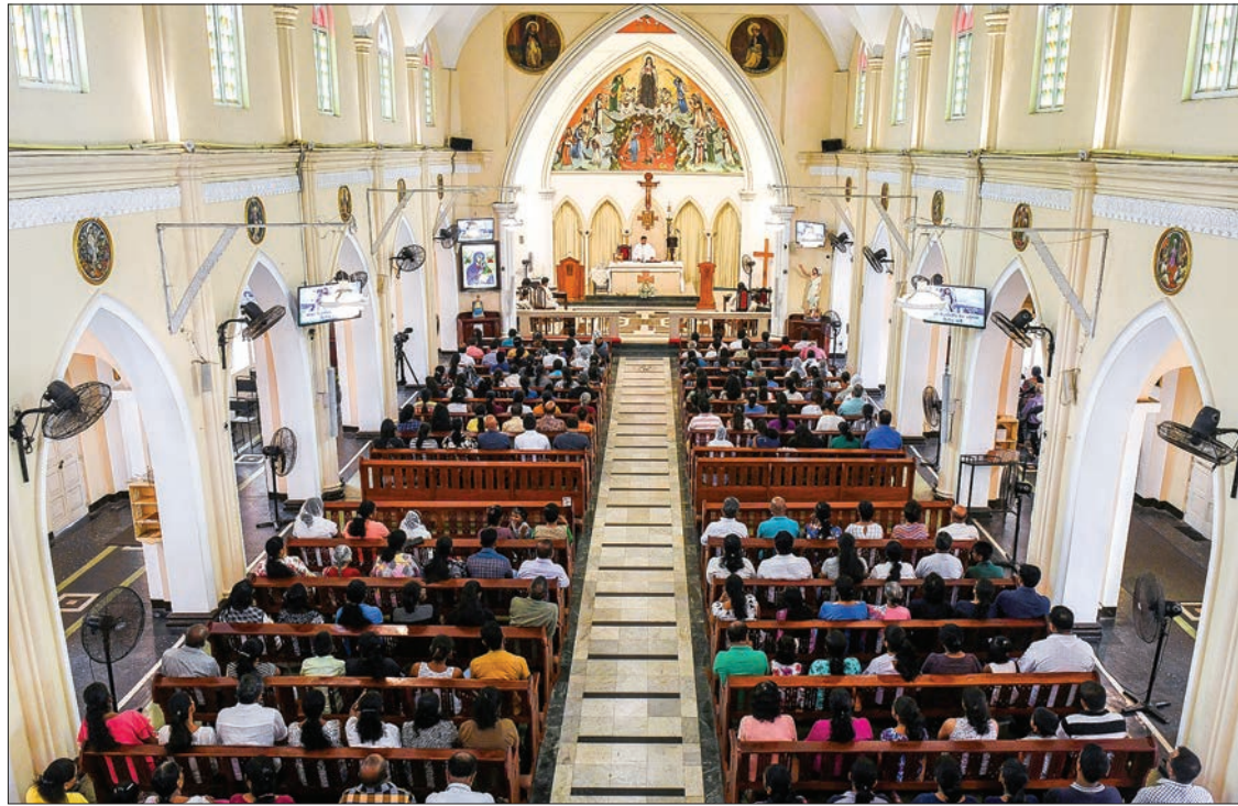
Sri Lankan Catholics attend mass at St. Theresa's in Colombo as Catholic churches held services again.