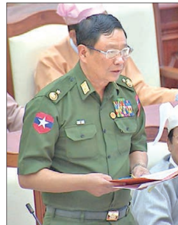
Deputy Minister Maj-Gen Aung Thu.

Following this, Union Minister U Thein Swe and Deputy Minister for Home Affairs Maj-Gen Aung Thu answered the queries raised by Daw Phyu Phyu Thin of Mingala Taungnyunt constituency, U Toe Win of Tamway constituency, U Kan Myint of Thayet constituency