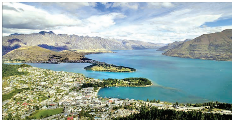
The bill does not explicitly say how the economy will become carbon neutral by 2050, sparking criticism from environmental campaigners.

WELLINGTON (New Zealand) — New Zealand introduced legislation Wednesday to make the South Pacific nation carbon neutral by 2050, although greenhouse gas emissions from the economically vital agricultural sector will not have to meet the commitment.