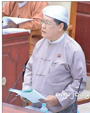
Union Minister U Thein Swe.

In the asterisk-marked question session, Mongpan constituency U Sai Kyaw Moe raised the first question and asked if there was a plan for the civil servants from the Ministry of Labour, Immigration and Population to construct a two-storey RC housing unit containing four compartments and which would be built in the plot of lands owned by the Ministry.