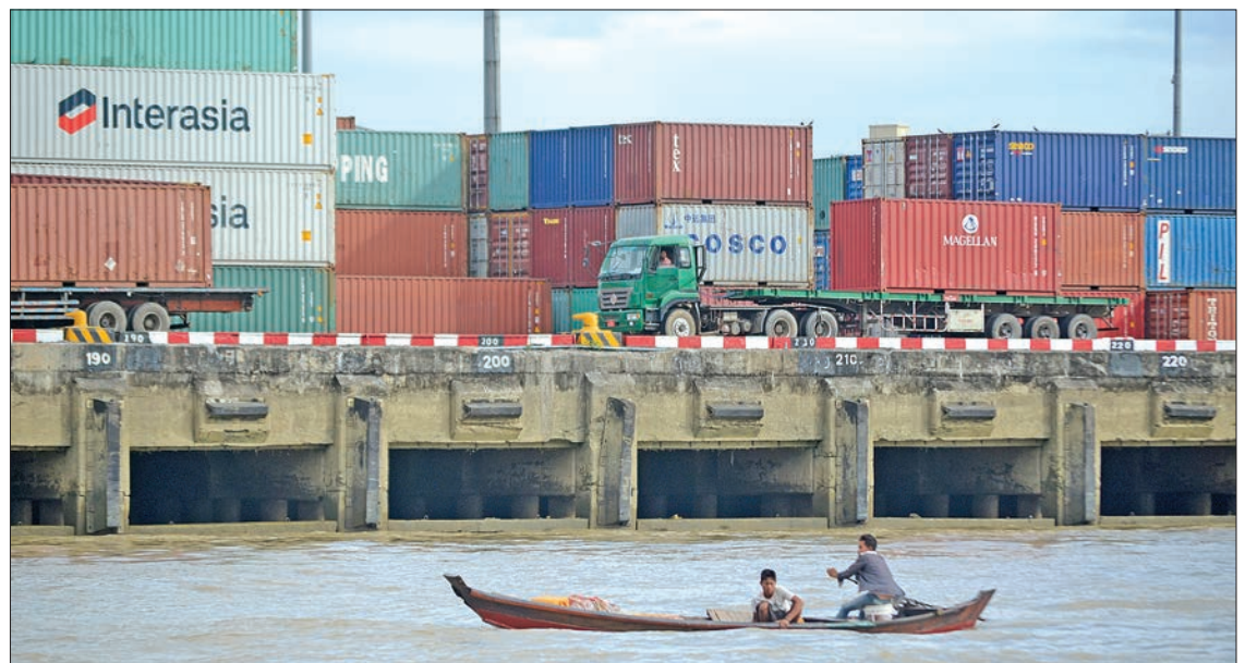
A container yard in Yangon.

pegged at $1.3 billion in the last mini-budget period, $3.9 billion in the 2017-2018FY, $5.3 billion in