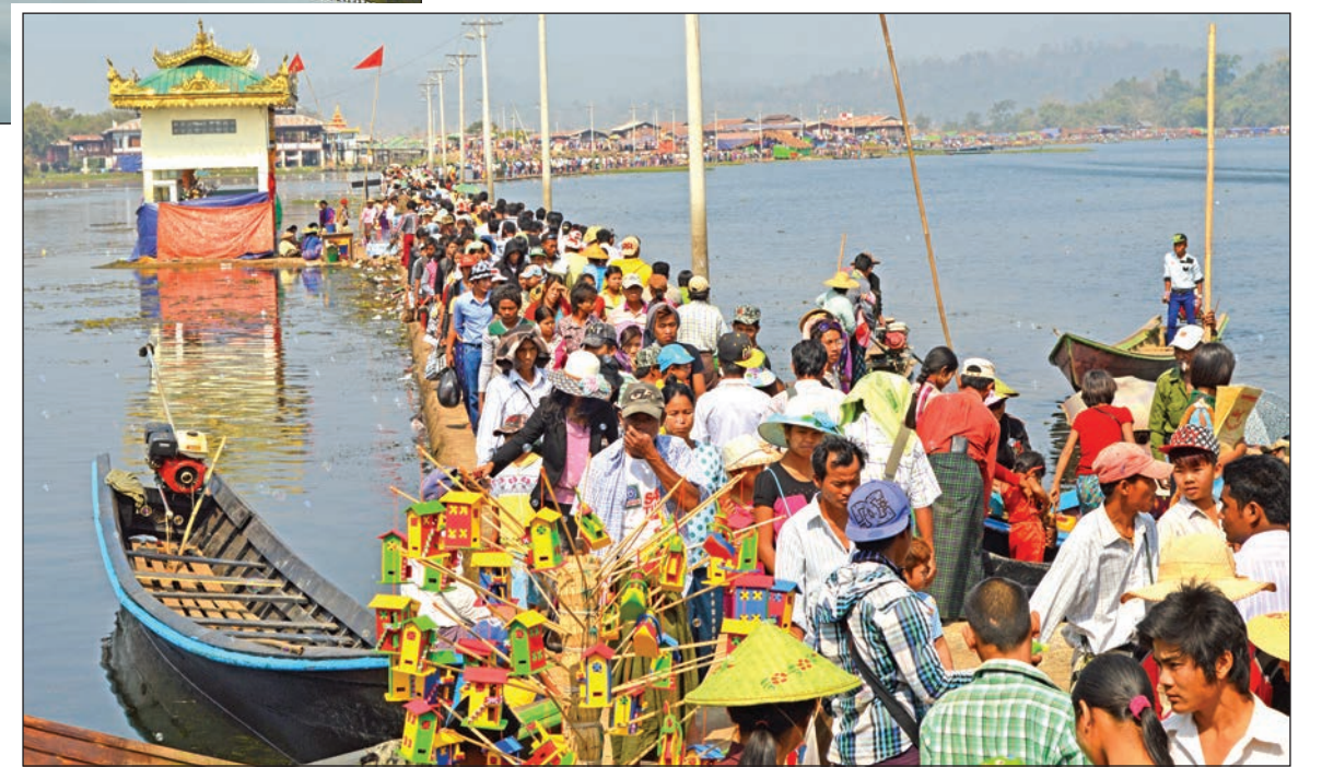
Festivalgoers seen at Shwe Mitsu Pagoda located on an island in the lake.

The economy of Kachin State is predominantly agricultural. The main products include rice,