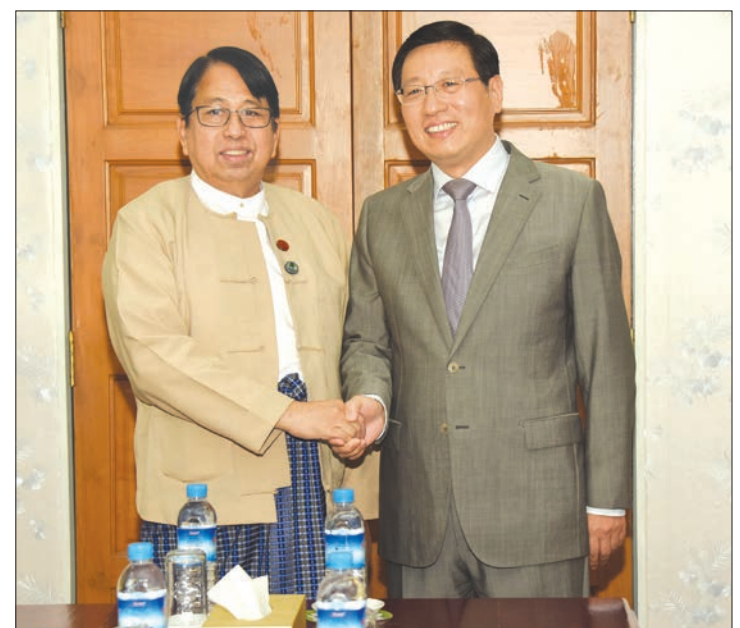
Union Minister Dr. Pe Myint shakes hands with outgoing Chinese Ambassador Mr. Hong Liang in Nay Pyi Taw.