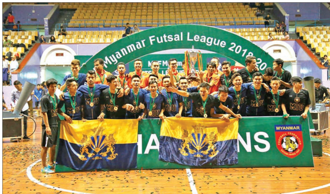
The champions of the Myanmar Futsal League 2018, MIU F.C.

The host team, Thailand's PTT Chonburi Bluewave, will be playing against Viet Nam club