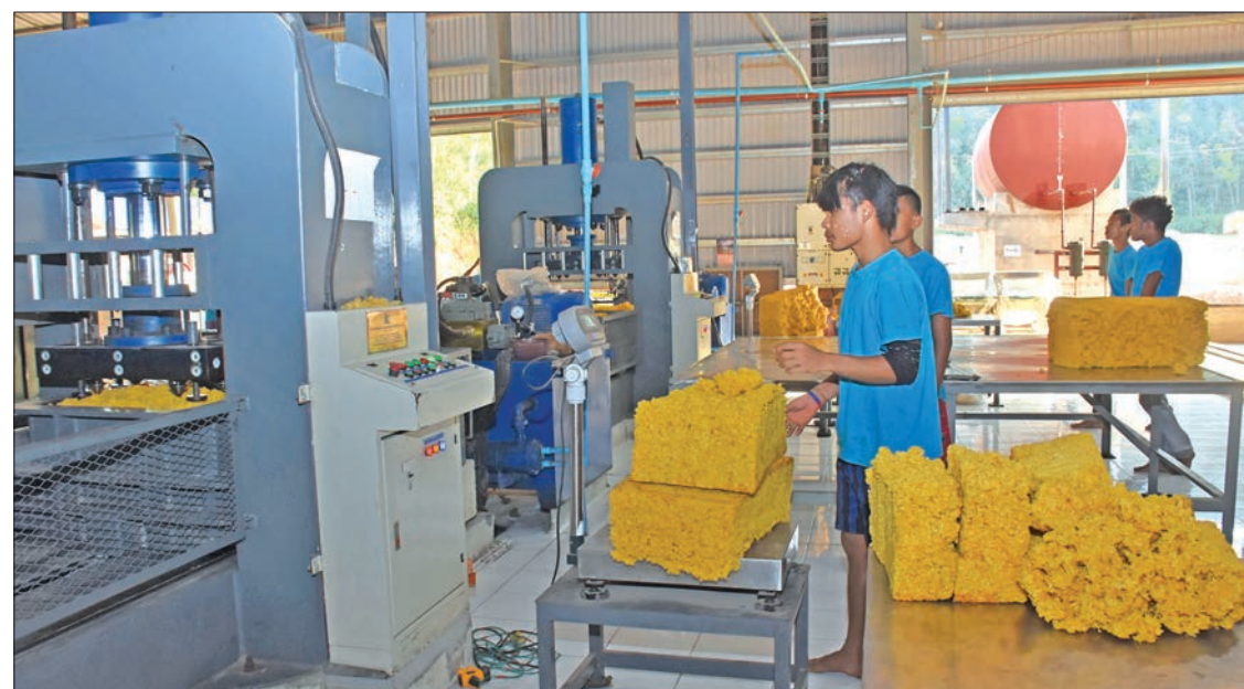
A worker control the machine at a rubber factory in Kawthoung.

businessmen took out JICA two-step loans of K4.8 million through the SMIDB. In the 2016-2017 FY, JICA offered K36.7 billion in loans to 175 entrepreneurs, and K16 billion in the 2017-2018 FY. JICA's two-step loans are offered at an interest rate of 0.01 per cent to the government, which provides the loans at an interest of 4 per cent to private banks, which, in turn, offer the loans at an interest of 8.5 per cent to SMEs. Some businessmen have complained of financial institutions following a tight verification process. There are over 67,000 registered SMEs in Myanmar, yet there are many unregistered businesses, according to the SME Development Department. The SMEs constitute 90 per cent of Myanmar's businesses. Most of them are facing barriers and challenges in terms of capital, technology, and market access.—GNLM ■ (Translated by Ei Myat Mon)