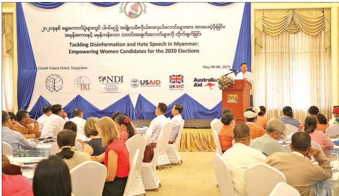
Union Election Commission Chairman U Hla Thein addresses the workshop on empowering women candidates for the 2020 elections in Nay Pyi Taw.

6,038 election candidates from 91 political parties in the 2015 General Election. Out of 793 women election candidates, there were some 151 women candidates who won the election. When it came