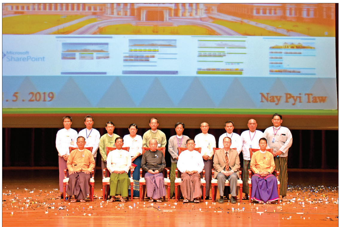
Pyithu Hluttaw Deputy Speaker U Tun Tun Hein poses for a documentary photo with officials at the launch of the Hluttaw Intranet System in Nay Pyi Taw.