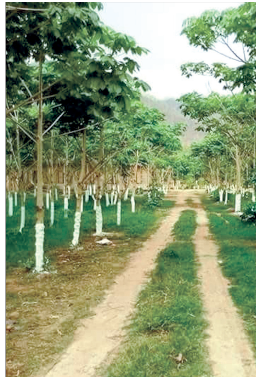
A Sterculia versicolor plantation thriving in farm in Minbu.

US$3,500 per ton to China through border trade route in 2017-2018 fiscal year, said Deputy Minister for Commerce U Aung Htoo.