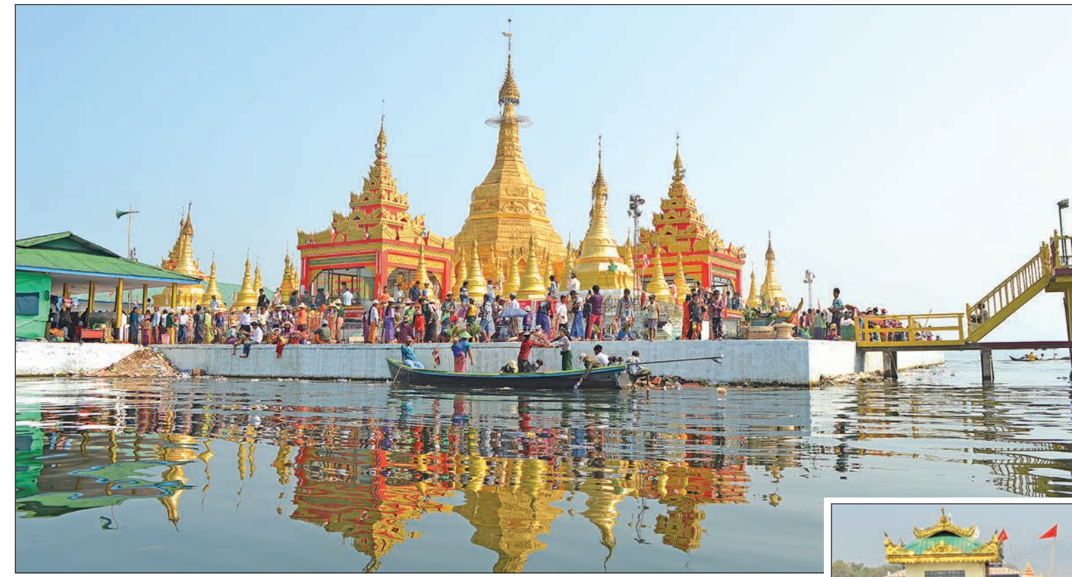
Indawgyi Pagoda at Indawgyi Lake, one of the largest inland lakes in Southeast Asia.

Traditional Kachin society was based on shifting hill agriculture. According to "The Political Systems of Highland Burma: A Study of Kachin Social Structure" , written by E. R. Leach, Kachin was not a linguistic category. Political authority was based on chieftains who depended on support from immediate kinsmen. Considerable attention has been given by anthropologists of the Kachin custom of maternal cousin marriage, wherein it is permissible for a man to marry his mother's brother's daughter, but not with the father's sister's daughter. In pre-colonial times, the Kachin were animist. The vast mountainous hinterlands are predominantly Kachin, whereas the more densely populated railway