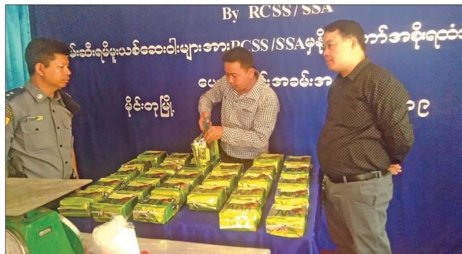
An RCSS/SSA member cuts open a confiscated packet containing illegal drugs in front of a police officer in Maing Tine.