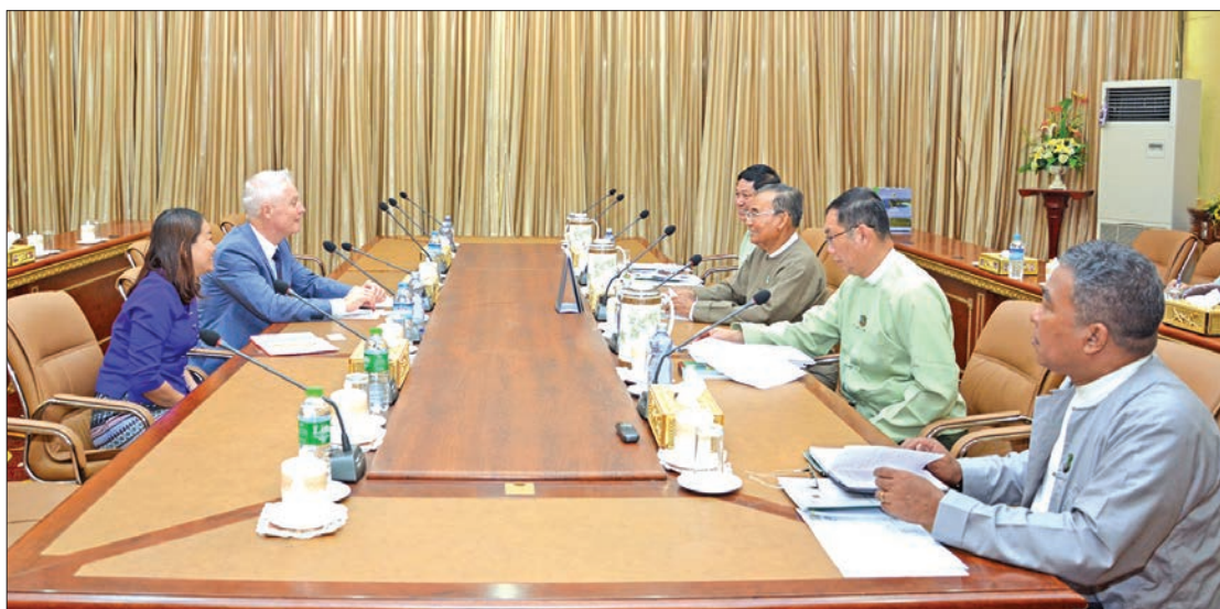
Union Minister U Ohn Win holds a meeting with Swiss Ambassador Mr. Tim Enderlin in Nay Pyi Taw.