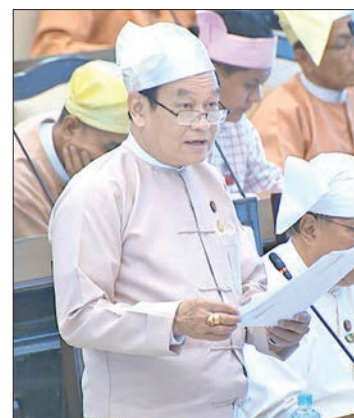
Union Minister Dr. Myint Htwe.

The MP said in the case of oil spills international protocol dictates that the vessel owner and their insurance company follow the laws of the country where the incident occurred when paying compensation. But since Myanmar does not have any laws related to oil spills, it will be impossible to press charges nor receive and com-