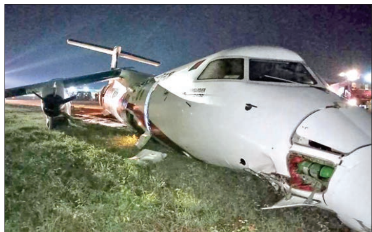
The Biman plane lying on the grass near the runway of Yangon International Airport.