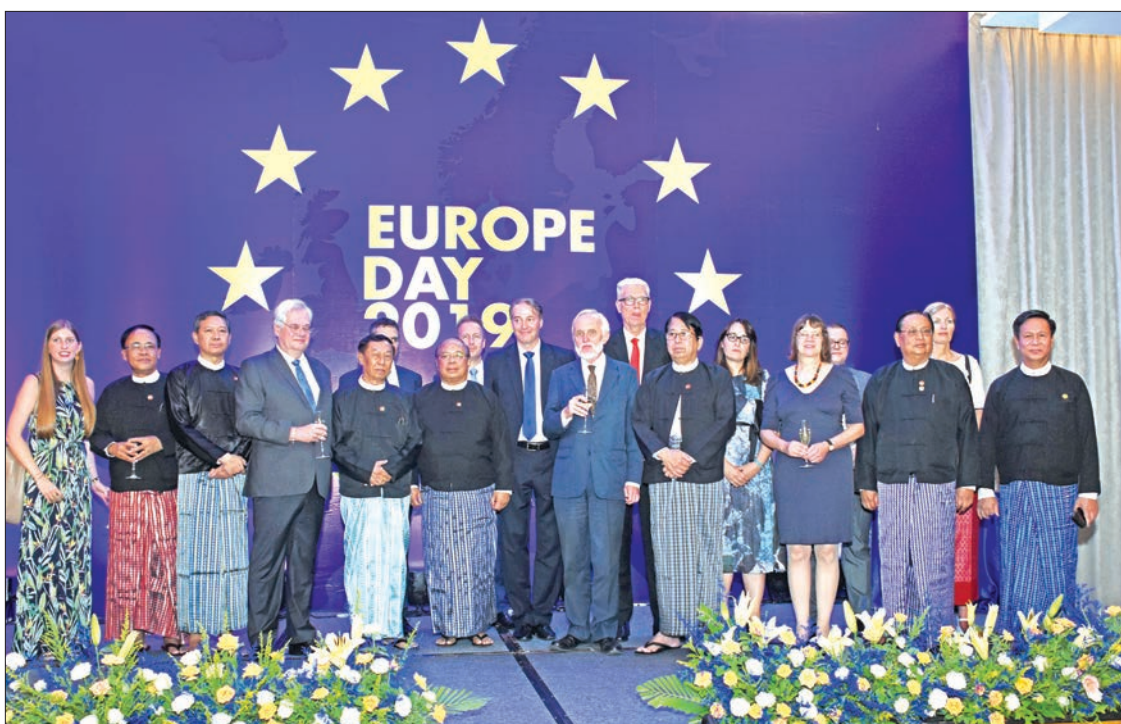
UEC Chairman, Union Ministers, government officials, Hluttaw representatives and Ambassadors pose for a commemorative photo at the Europe Day 2019 reception in Nay Pyi Taw.

A reception to observe the Europe Day was held at the M Gallery Hotel in Nay Pyi Taw yesterday.