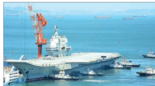
China's first domestically manufactured aircraft carrier, known as "Type 001A," returns to port in Dalian after its first sea trial in 2018.

"While details regarding the Type 002 are limit-