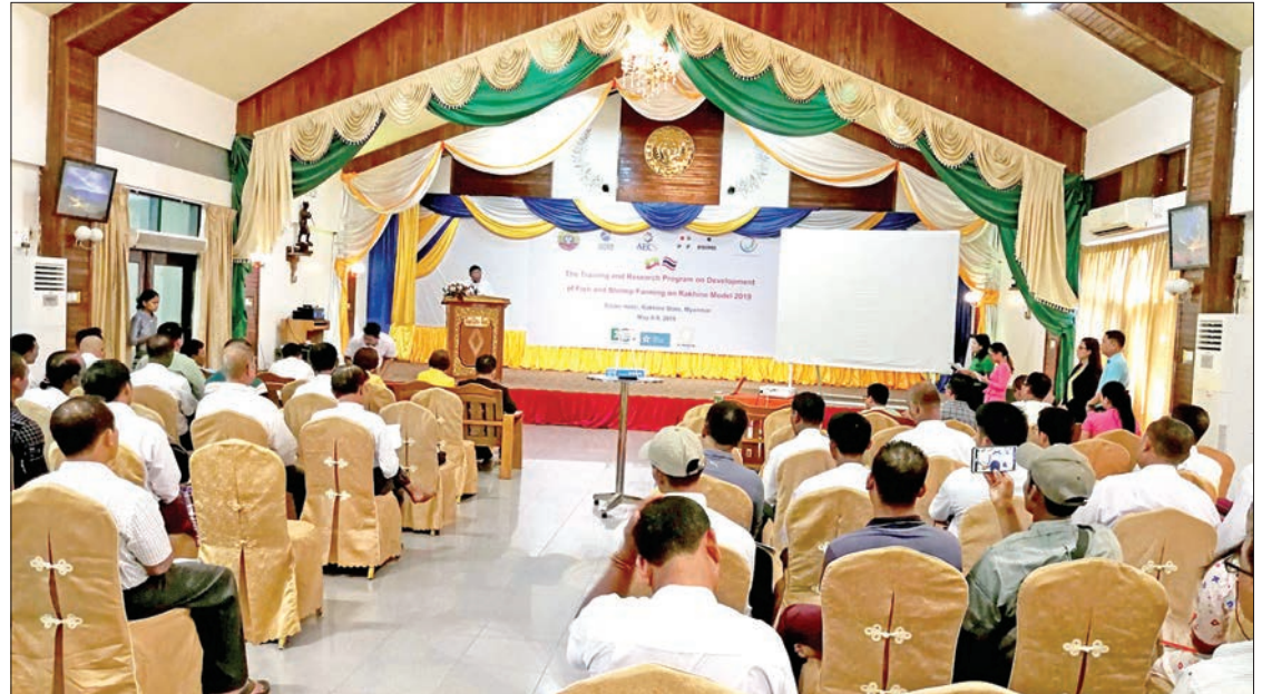
The opening ceremony of training and research program on development of fish and shrimp farming on Rakhine Model 2019 held in Sittway, Rakhine yesterday.

At present, farmers need to shift from the traditional saltwa-