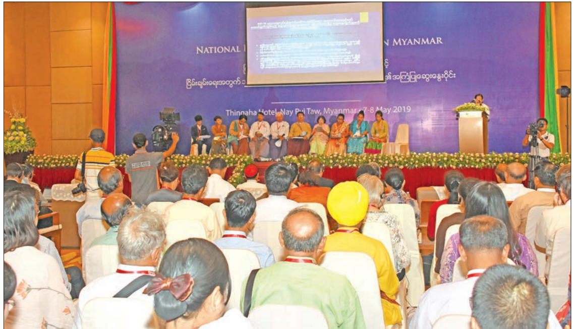
The 2 nd Advisory Forum on National Reconciliation and Peace in Myanmar held its second day in Nay Pyi Taw.