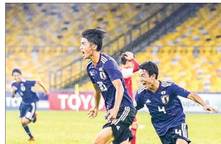
Japan squad for the 2019 FIFA U-20 World Cup prepares to compete in the competition which is set to start in Poland later this month.

Saudi Arabia, Korea Republic and Qatar complete the quartet of teams flying the flag for Asia in Poland. — AFC ■