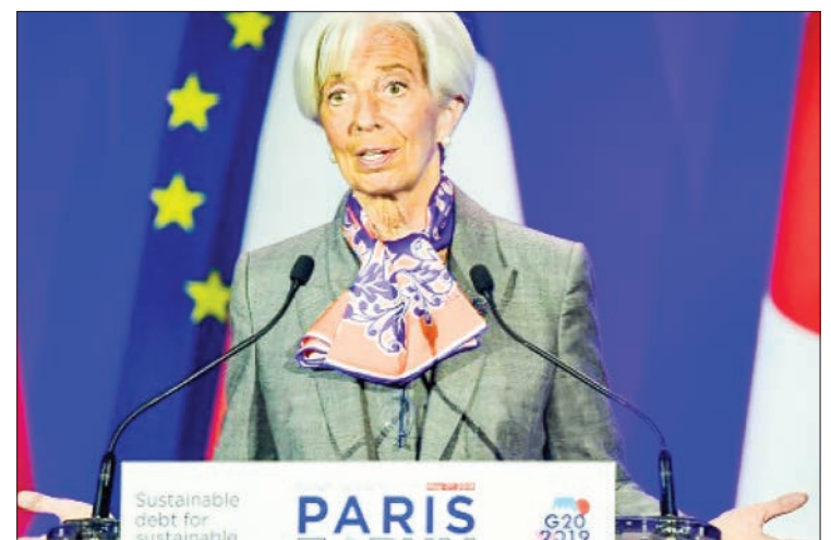
An escalation to the trade war between China and the United States is the top threat to global growth, IMF Managing Director Christine Lagarde warned.