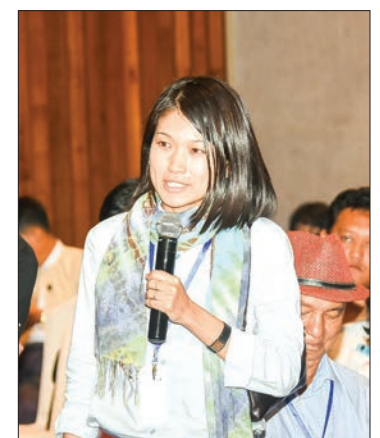
Local and foreign journalists raise questions on implementation of recommendations on Rakhine State at the press conference.