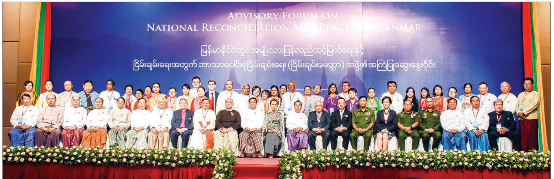
NRPC Chairman State Counsellor Daw Aung San Suu Kyi poses for the documentary photo with the attendees at the second Advisory Forum on National Reconciliation and Peace in Myanmar held in Nay Pyi Taw yesterday.