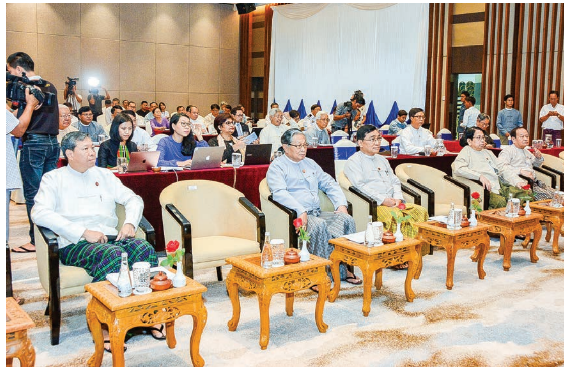
Union Ministers U Kyaw Tint Swe, Dr. Pe Myint, Dr. Myint Htwe, Dr. Win Myat Aye and Dr. Myo Thein Gyi attend the second day of Workshop on Review of the Implementation of the Recommendations on Rakhine State.

Union Ministers for Health and Sports Dr. Myint Htwe, Union Minister for Investment and