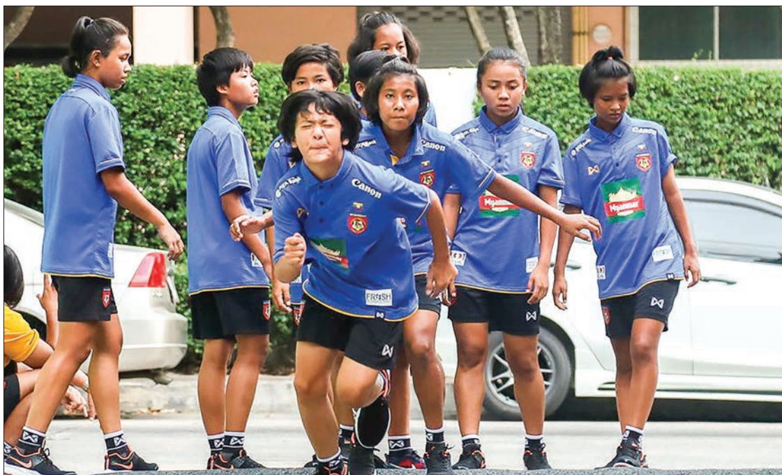
Myanmar's U-15 Girls National Team takes some light exercise drill near the Chon Inter Chonburi Hotel where they are staying.

23 outstanding players have been selected for the squad recently. —Aung Htein ■