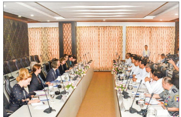
Representatives from Myanmar and Australia attend the Third Myanmar-Australia Foreign Ministry Consultations in Nay Pyi Taw on 7 May 2019.