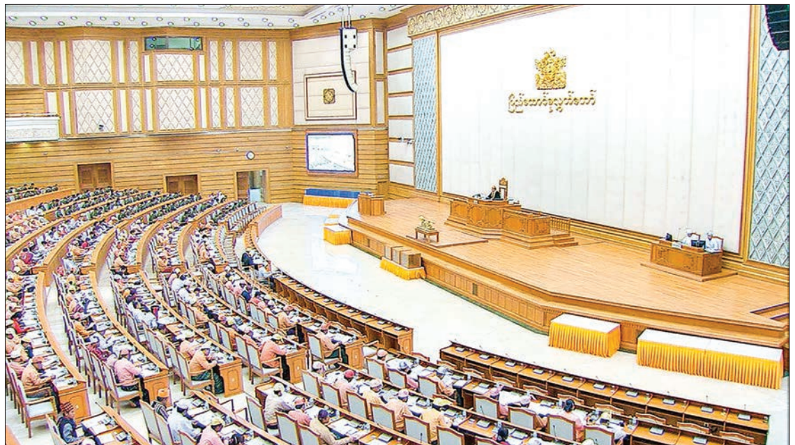
Pyidaungsu Hluttaw is being convened in Nay Pyi Taw.