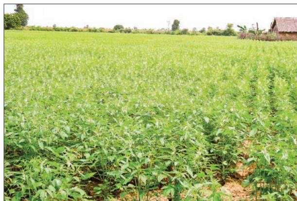
Sesame plantation in Magway.

SESAME will be cultivated on more than 13,500 acres of land in Magway Township, using Good Agriculture Practices, in the coming season, according to Magway Township's Agriculture Department.