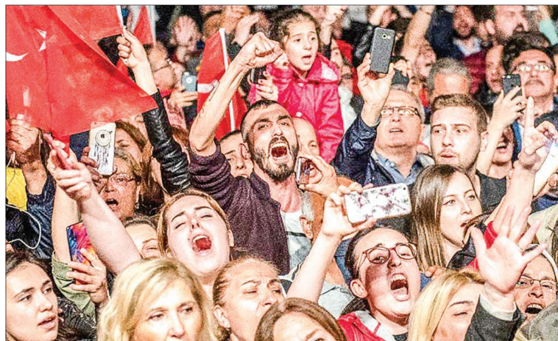
The decision to re-run the Istanbul sparked protests by supporters of opposition candidate Ekrem Imamoglu.

The loss of the mayorship in Istanbul, and a more resounding defeat in the capital Ankara, was a rare setback for Erdogan and his party, reflecting widespread concerns over the deteriorating economy.—AFP ■