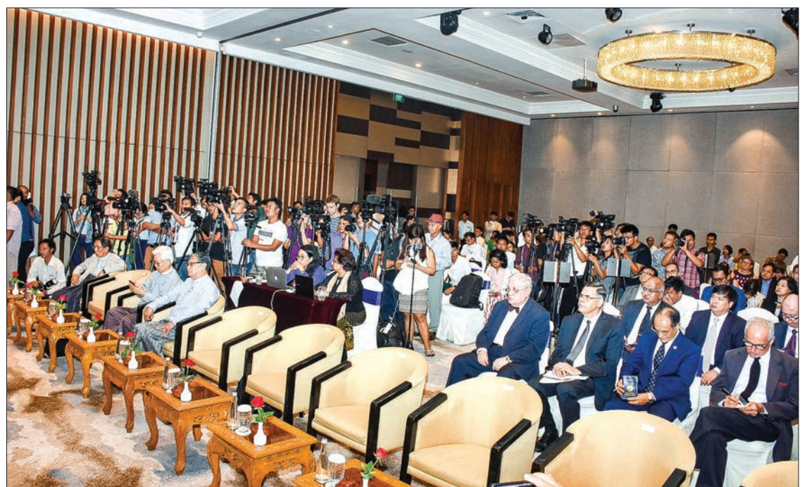
Union Ministers, representatives of UN and diplomats are seen at the press conference.