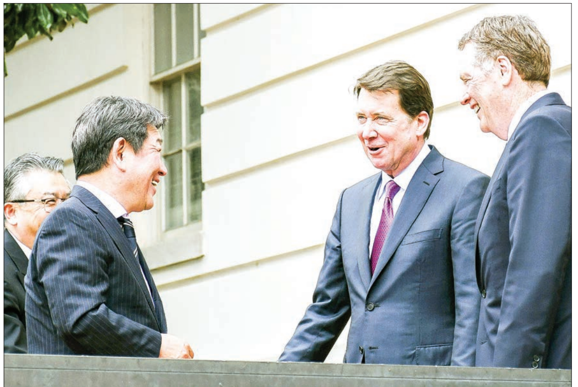
US Trade Representative Robert Lighthizer (far right) welcomes Japanese economic revitalization minister Toshimitsu Motegi (front left) in Washington on 25 April, 2019, ahead of their trade talks.

While Japan remains wary of granting the United States greater access to its agriculture market without securing lower tariffs for one of its main exports, automobiles, Trump has expressed hope that a deal on farm products will be reached before he visits 25-28 May to meet with new Emperor Naruhito.—Kyodo News