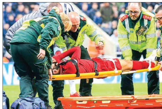
Mohamed Salah was concussed during Liverpool's 3-2 win at Newcastle on Saturday.

LONDON— Liverpool must turn to unlikely heroes to overturn a 3-0 Champions League semi-final, first leg deficit against Barcelona on Tuesday, according to defender Trent Alexander-Arnold after Mohamed Salah was ruled out with concussion.