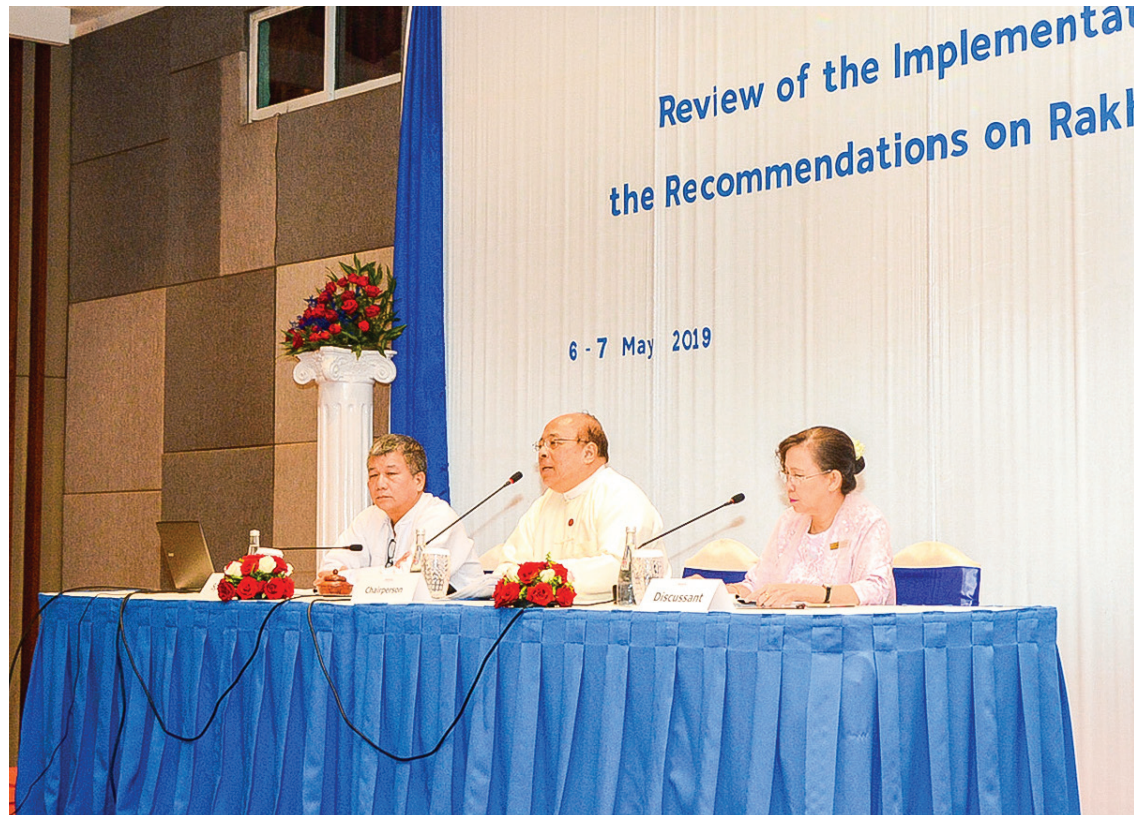
Union Minister U Thaug Tun (Centre) acts as the chairman of the workshop while Dr. Kyaw Yin Hlaing as the speaker and Dr. San San Aye as the discussant.

It was attended by U Kyaw Tint Swe, Union Minister for the Office of the State Counsellor; Union Minister for Information Dr. Pe Myint, Union Minister for Education Dr. Myo Thein Gyi,