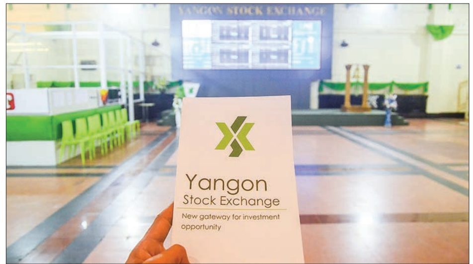
Stock Exchange electronic board with indexes showing stock information at YSX.

At present, shares of five listed companies — First Myanmar Investment (FMI), Myanmar Thilawasez Holdings (MTSH), Myanmar Citizens Bank (MCB), First Private Bank (FPB), and TMH Telecom Public Co. Ltd. — are being