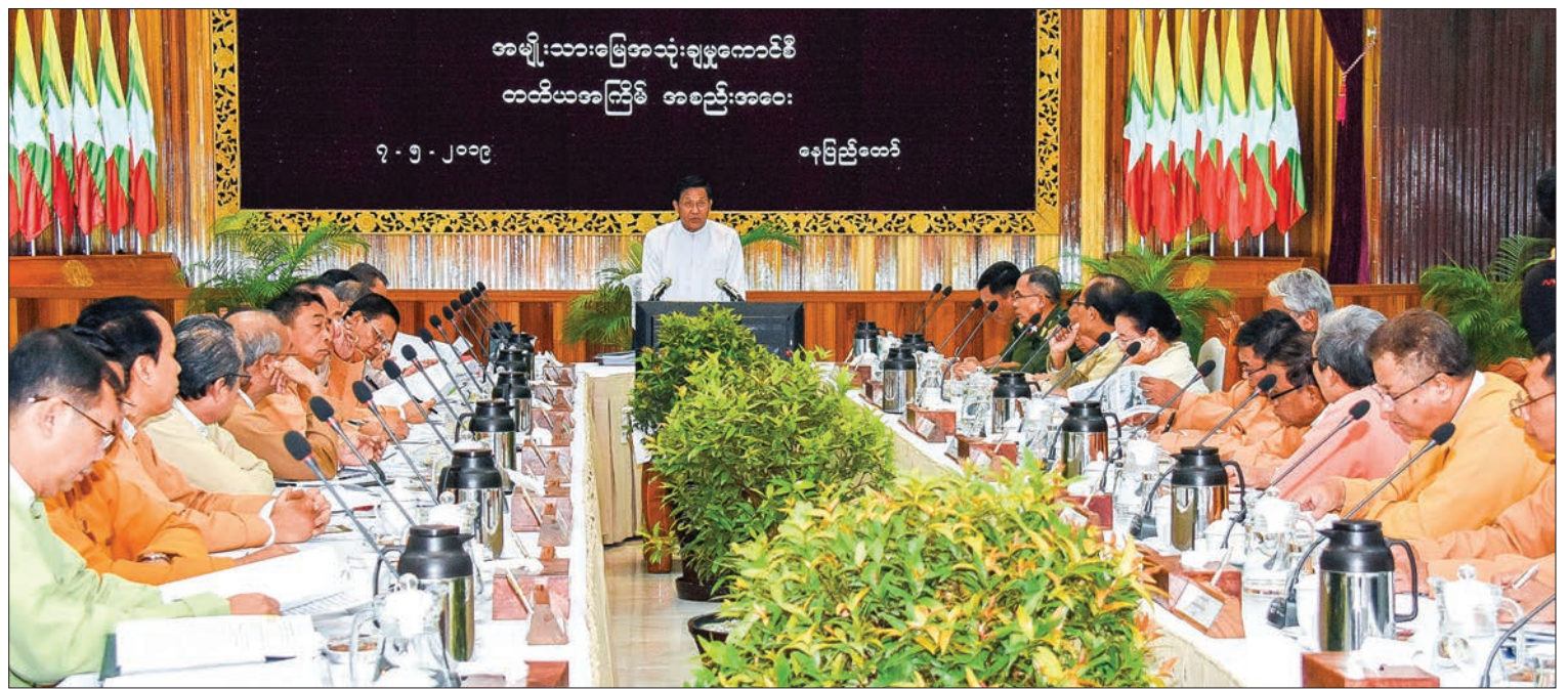
Vice President U Henry Van Thio addresses the 3 rd meeting of National Land Use Council (NLUC) in Nay Pyi Taw yesterday.

The Vice President urged the earliest implementation of the seven decisions made at the second work coordination meeting and commented on the next level works to be conducted. A motion urging the government to review the National Land Use Policy to establish National Land Law, draw up national land use strategy, mid and long term project goals and work processes, draw up and implement policy