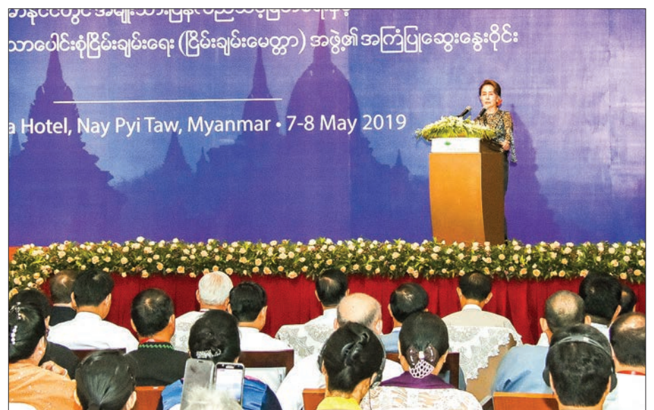
State Counsellor Daw Aung San Suu Kyi delivers the opening address at the second Advisory Forum on National Reconciliation and Peace Centre in Myanmar yesterday.

N ATIONAL Reconciliation and Peace Center (NRPC) Chairperson State Counsellor Daw Aung San Suu Kyi delivered an opening speech at the second Advisory Forum on National Reconciliation and Peace in Myanmar organized by Religions for Peace held at Thingaha Hotel Nay Pyi Taw yesterday morning.