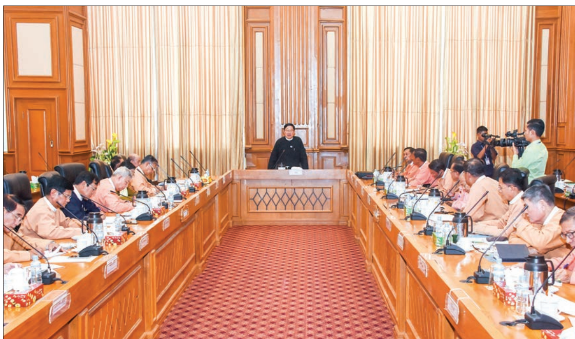
Pyithu Hluttaw Speaker U T Khun Myat addresses the coordination meeting in Nay Pyi Taw yesterday.

PYITHU Hluttaw Speaker and committee chairpersons held a coordination meeting 1/2019 at Zabuthiri Hall meeting room in Hluttaw Building, Nay Pyi Taw yesterday afternoon.