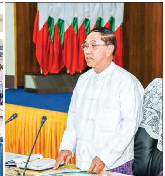
Vice President U Myint Swe delivers the speech at the MSMEDWC meeting 1/2019 at the Ministry of Industry in Nay Pyi Taw.

that under the leadership of MSMEDWC, MSMEs product exhibition and competitions have been held in states and regions starting from 2018 February and have been held in Mandalay, Magway, Patheingyi, Taunggyi, Monywa, Bago, Yangon, Mawlamyine and Myeik while a union level MSMEs products exhibition and competition was successfully held in Nay Pyi Taw from 22 to 24 March.