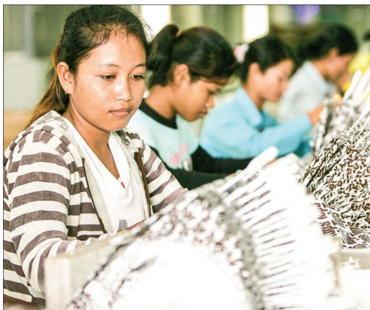
Workers at a Japanese firm's plant in Cambodia.

Among the issues previously raised by the companies — in a 1 November letter to Commerce Minister Pan Sorasak that went unanswered — are the freedom of workers to represent and speak for themselves without fear of retaliation of retribution and ongoing criminal charges against labor leaders, they said.—Kyodo News ■