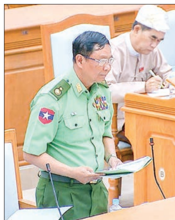
Deputy Minister for Home Affairs Maj-Gen Aung Thu.