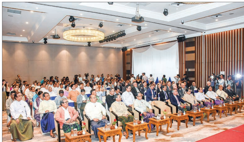
Union Minister Dr. Win Myat Aye delivers the opening address at the workshop on Review of the Implementation of the Recommendations on Rakhine State in Yangon yesterday.

"In light of both the historical context as well as the current situation in Rakhine State,