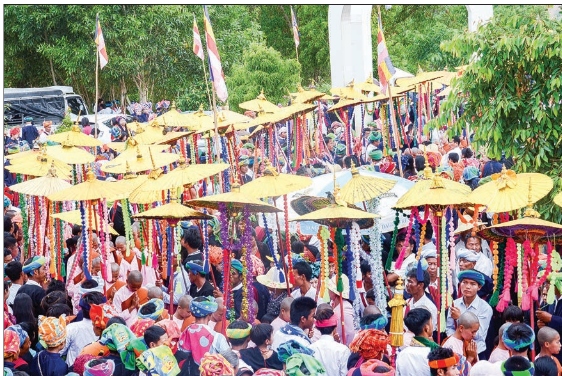
The annual religious ceremony in Hopong.