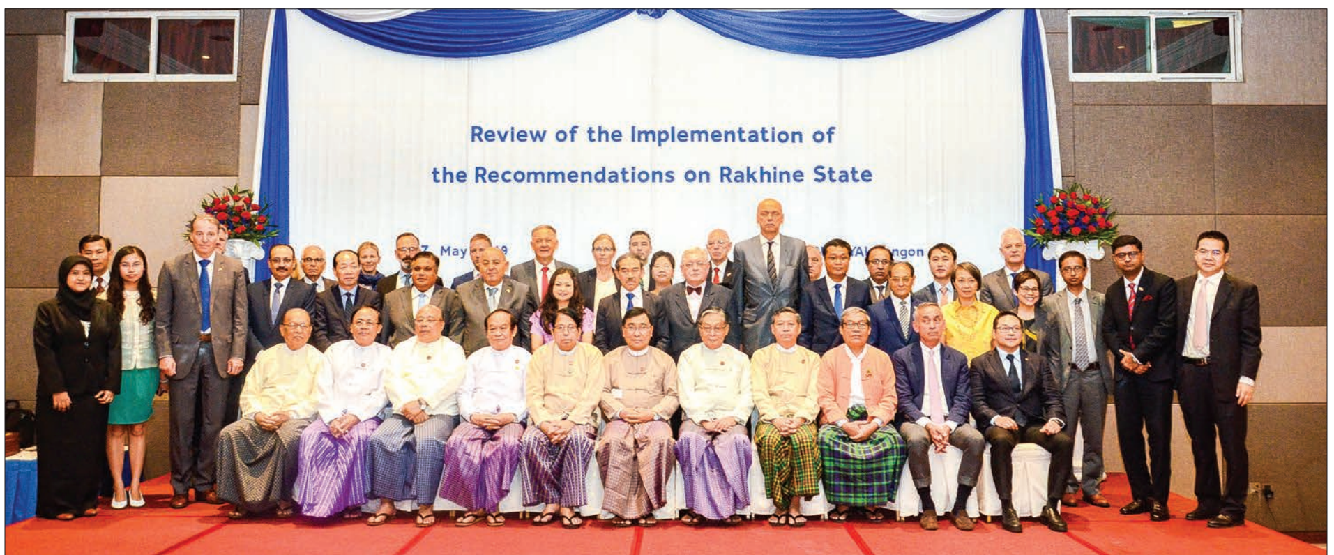
Union Ministers U Kyaw Tint Swe, Dr. Pe Myint, Dr. Myo Thein Gyi, Dr. Myint Htwe, U Thaug Tun, Dr. Win Myat Aye, U Kyaw Tin and attendees pose for the documentary photo at the workshop on Review of the Implementation of the Recommendations on Rakhine State in Yangon yesterday.