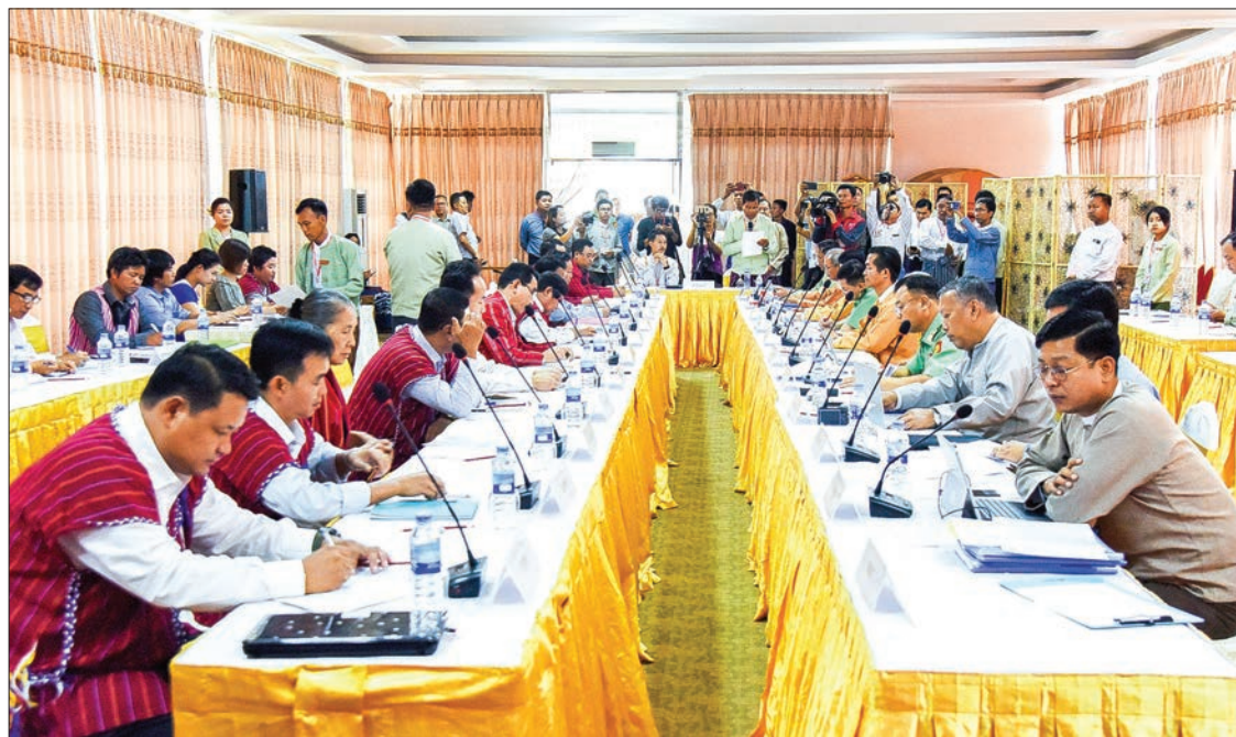
The meeting between the National Reconciliation and Peace Center (NRPC) and Karenni National Progressive Party (KNPP) takes place in Loikaw, Kayah State yesterday.

The aims of these were to open a path for KNPP to sign the NCA by resolving difficulties within the region through monthly discussion and negotiation. The aim was also to build trust through meetings. In the forthcoming meetings KNPP can discuss difficulties faced on the ground and the State government and regional commands will resolve matters without overstepping their authorities. The Peace Commission was