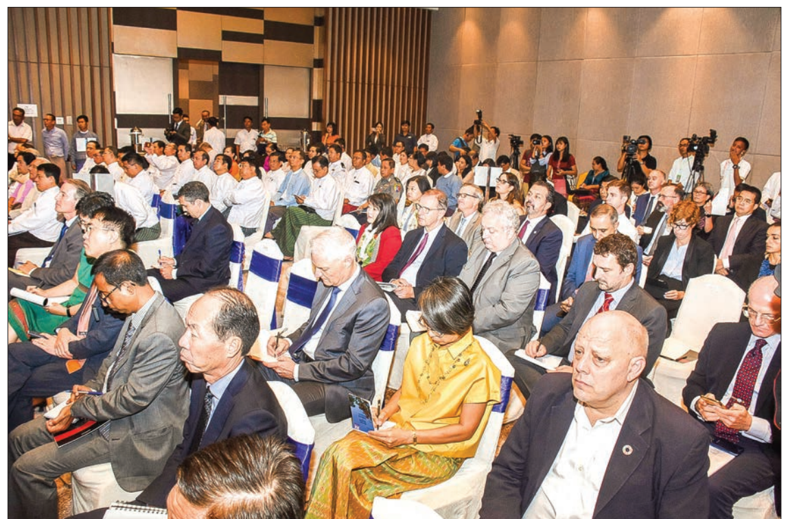
Diplomats attend the workshop on Review of the Implementation of the Recommendations on Rakhine State in Yangon yesterday.