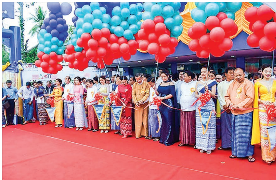
Myanmar Tourism Bank is opened yesterday to promote the tourism sector and provide financial services to tourism businesses.