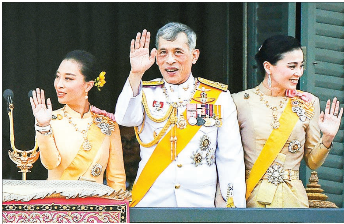
Thailand's King MahaVajiralongkorn said he was 'truly happy' with the country's display of unity after his coronation.

king in the Chakri dynasty and ascended the throne in late 2016 after the death of his beloved father BhumibolAdulyadej.