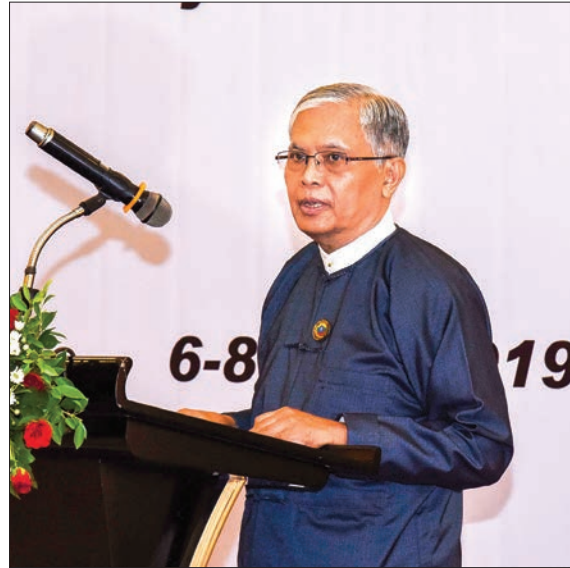
Anti-Corruption Commission Chairman U Aung Kyi addresses the the Meeting on Myanmar's Country Review Report for UNCAC Implementation Review Cycle 2 in Nay Pyi Taw yesterday.

THE Anti-Corruption Commission and United Nations Office on Drugs and Crime (UNODC) in Myanmar held the Meeting on Myanmar's Country Review Report for UNCAC Implementation Review Cycle 2 at Grand Amara Hotel in Nay Pyi Taw yesterday.