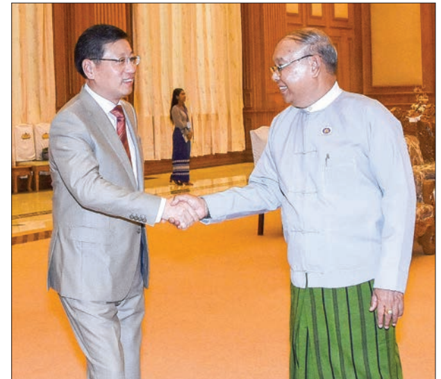
Amyotha Hluttaw Speaker Mahn Win Khaing Than shakes hands with Chinese Ambassador Mr. Hong Liang.