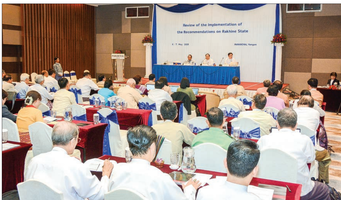
Union Minister U Kyaw Tin (Centre) acts as the chairperson while Dr. Aung Tun Thet (Left) as the speaker and Deputy Minister U Aung Htoo (Right) as the discussant at the workshop on review of the implementation of recommendations on Rakhine State at the Park Royal Hotel in Yangon.