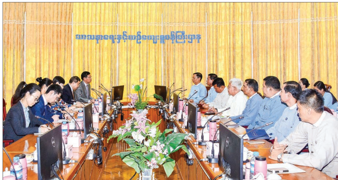
Union Minister Thura U Aung Ko holds talks with Chinese Ambassador Mr. Hong Liang at the Ministry of Religious Affairs and Culture in Nay Pyi Taw yesterday.

UNION MINISTER for Religious Affairs and Culture Thura U Aung Ko received outgoing People's Republic of China (PRC) Ambassador to Myanmar Mr. Hong Liang and party at the ministry's guest hall in Nay Pyi Taw yesterday morning.