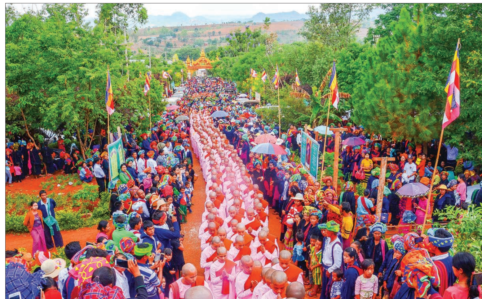
Buddhist nuns line up as they receive donation from the local people in Hopong.

The UNESCO has measured tangible assets in accordance with OUV criteria and stone inscriptions, hand-written manuscripts, invaluable books and newspapers, photographs and paintings are being recorded as