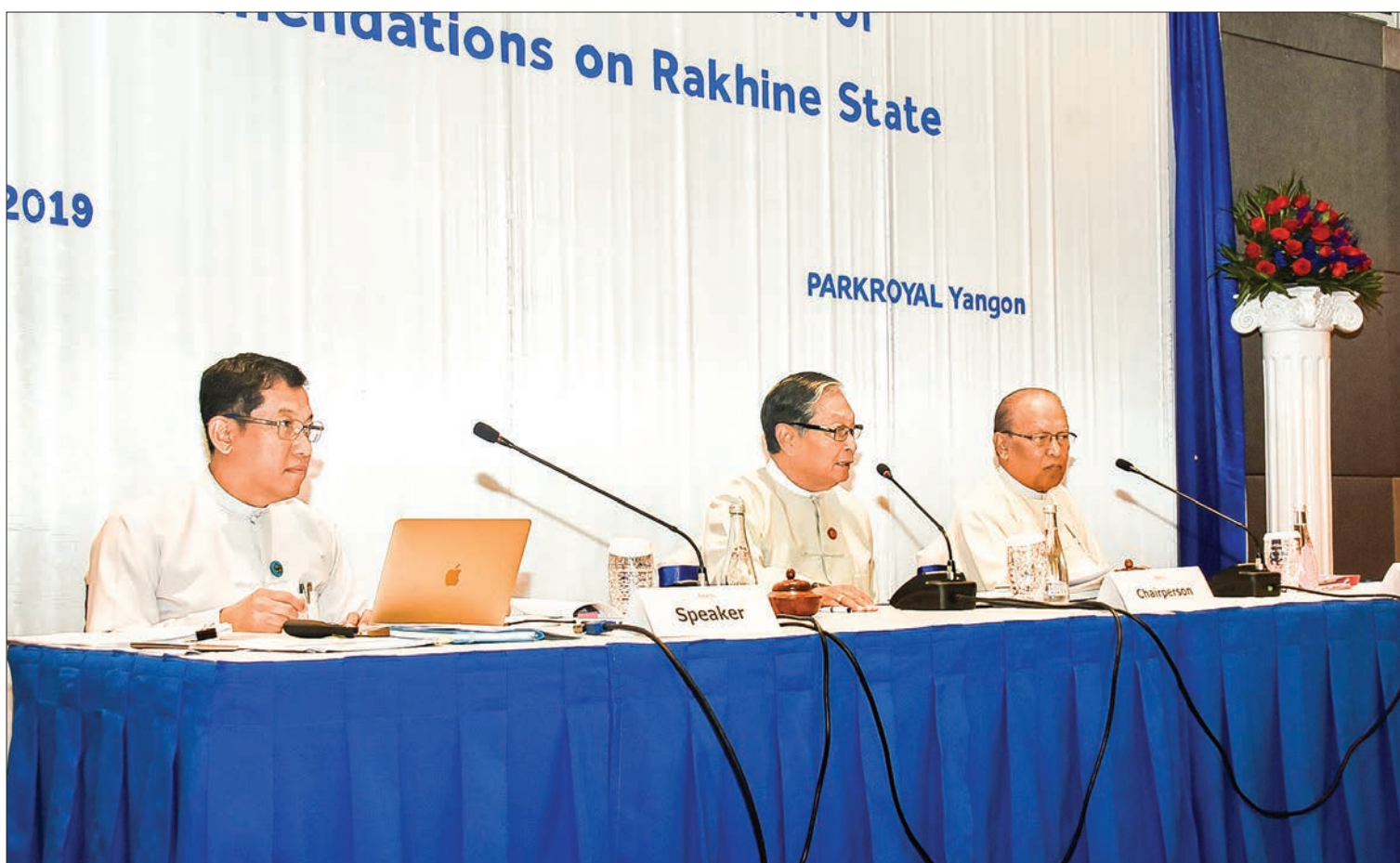
Union Minister for the Office of the State Counsellor U Kyaw Tint Swe (Centre), Chairperson, U Win Mra, Discussant, and Dr. Ko Ko Naing, Speaker, are seen at the Workshop on Review of the Implementation on Recommendations on Rakhine State at the Park Royal Hotel in Yangon.

W ORKSHOP on Review of the Implementation of the Recommendations on Rakhine State was held in Yangon yesterday as part of efforts for peace and stability and