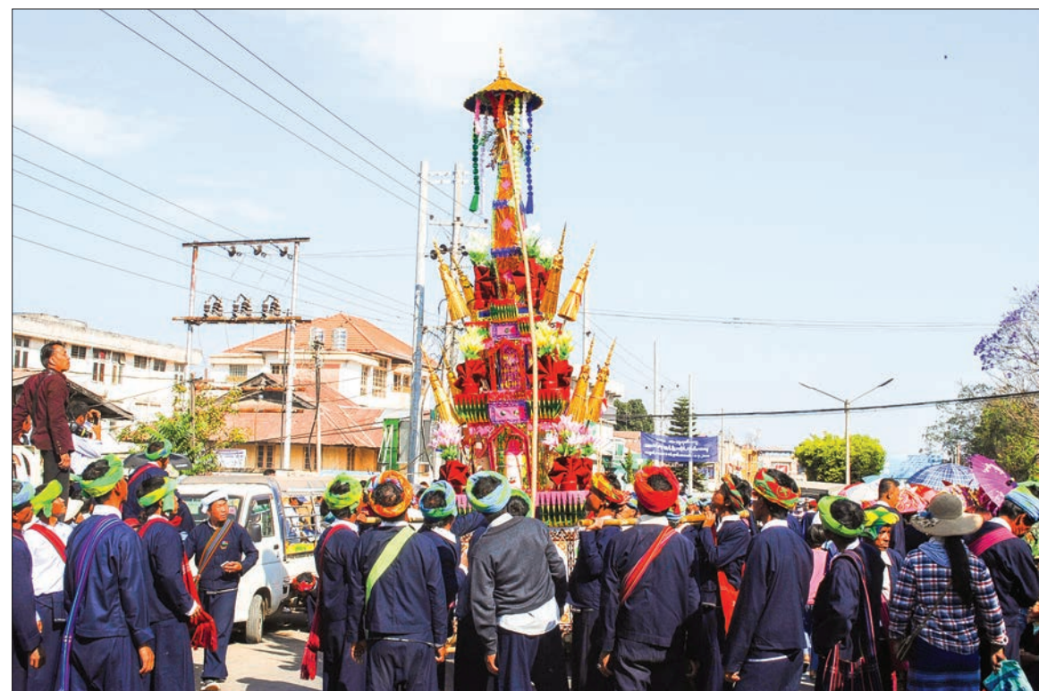
Pa-O ethnic people celebrate annual religious ceremony in Hopong in 2018.

The UNESCO established its Lists of Intangible Cultural Heritage in 2008 and 429 items have been acknowledged on the Lists up to 2017 including 25 from the Southeast Asian countries. The upgrading in Myanmar of Intangible Cultural Heritage has been carried out by Organizing Committees at the National, Regional and State levels; the Chairman of the National Committee is the Union Minister for the Religion Affairs and Culture. The respective Committees concerned collected as many as 1800 items of Intangible Cultural Heritage: 78 items of Oral traditions; 461 items for Performing Arts; 561 festivals for Social Practices and Rituals; 104 for Knowledge for the Nature and Universe; 596 items for Traditional Craftsmanship including 393 items from the