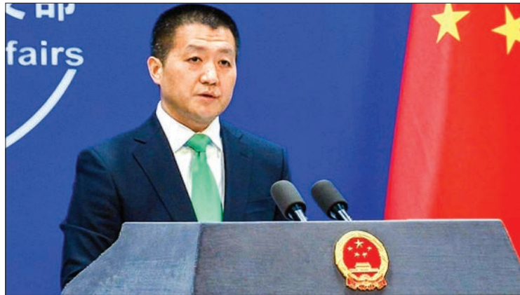
China warns to take firm action against any country that violated its territorial sovereignty after Washington sent a warship into disputed South China Sea waters.

“The relevant actions of the US warships violated China's sovereignty and undermined peace, security and good order in the relevant sea areas,” ministry