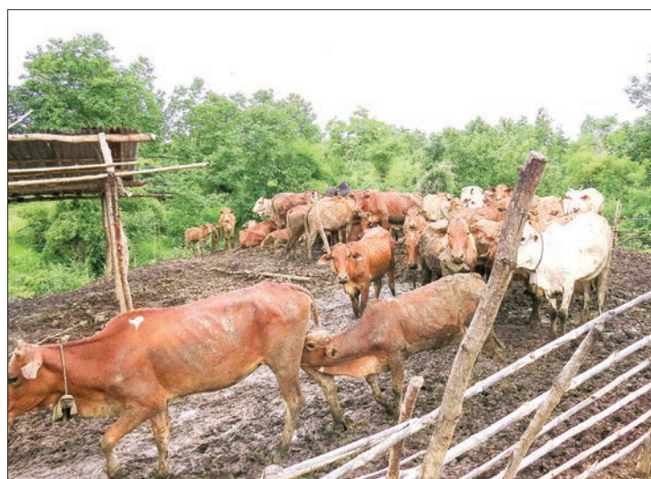
Cattles in the farm in Magway.

Myanmar exported 48,880 head of cattle last year, when the government granted permission for sale of cattle to other countries. In the 2018-2019 fiscal year, more than 300 companies have applied for permits to export 67,275 head of cattle to China. However, the companies have exported only 18,900 head of cattle so far because the Chinese traders have slashed the offering prices.