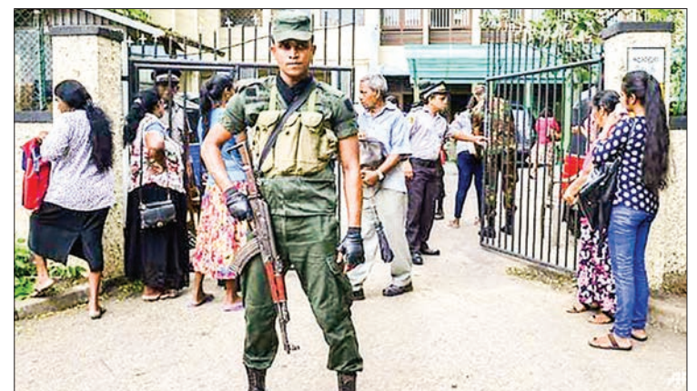
Extra troops and police have been deployed to Negombo and a curfew is in effect.

The militant group has not made comments on the report yet.—Xinhua ■