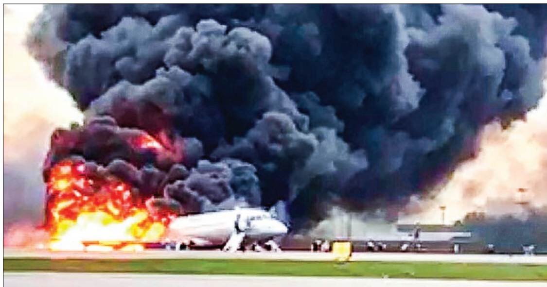
Flames and thick smoke were pouring from the aircraft as it landed.