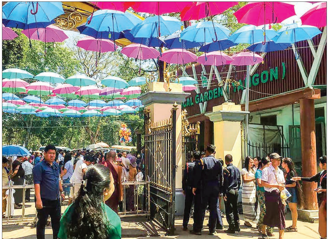
Visitors seen at Yangon Zoological Garden.

"The festival will feature shops selling products for children, school uniforms, stationery, and utensils, mon-