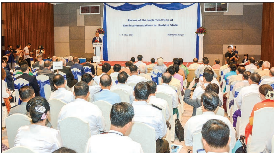
Rt. Hon. Lord Darzi of Denham from OMKBE, Former member of the Advisory Board for the Committee for the Implementation of the Recommendations on Rakhine State delivers the speech at the workshop in Yangon yesterday.