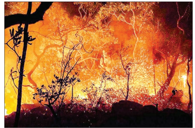
The accelerating pace at which unique life-forms are disappearing could tip Earth into the first mass extinction since non-avian dinosaurs died out 66 million years ago.

“We will agree on the best ways to enhance the place of biodiversity on