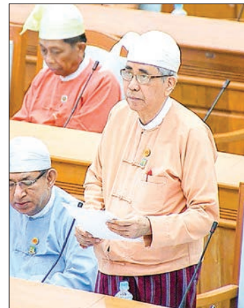
Deputy Minister for Transport and Communications U Kyaw Myo.