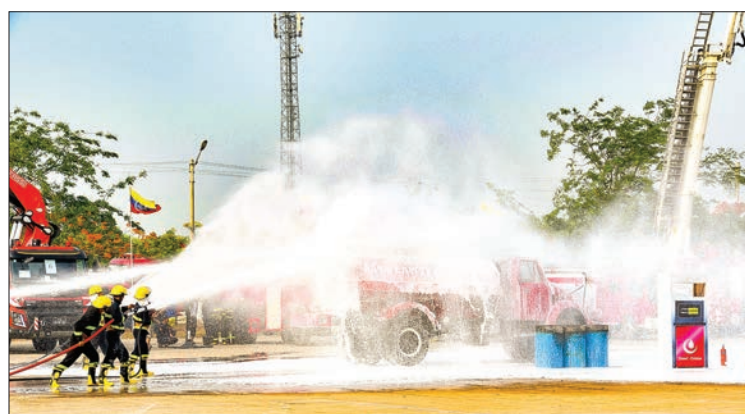
The 73 rd National Fire Service Day ceremony being convened in Nay Pyi Taw yesterday.

THE Nay Pyi Taw Council Fire Brigade celebrated the 73 rd National Fire Service Day at the premises of Uppatasanti Pagoda in Nay Pyi Taw yesterday.