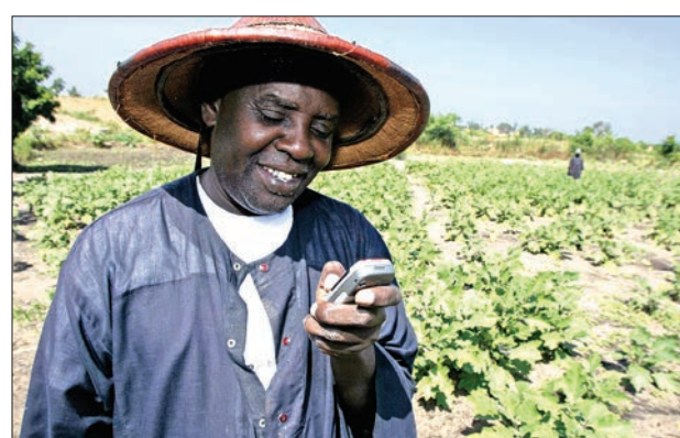
Reaping the benefits of smart tech.

A project called Pix Fruit, meanwhile, aims to help farmers who have until now estimated their mango crop by counting the fruit on a bunch of trees and then extrapolating for the whole plantation. This rough-and-ready method has considerable room for error.—AFP ■