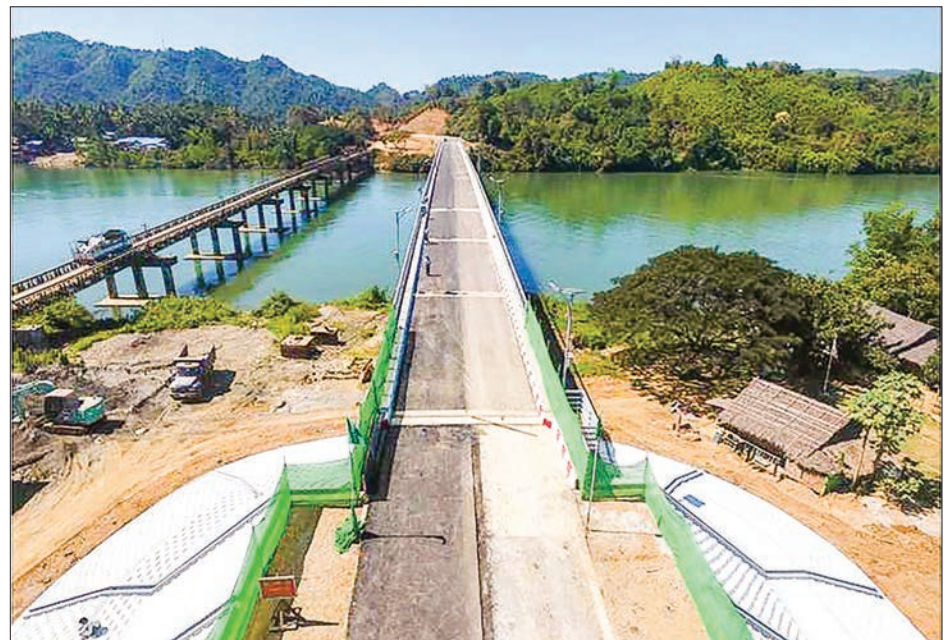
The 960 feet-long Darlet Chaung Bridge seen on Minbu-Ann-Sittway Road.