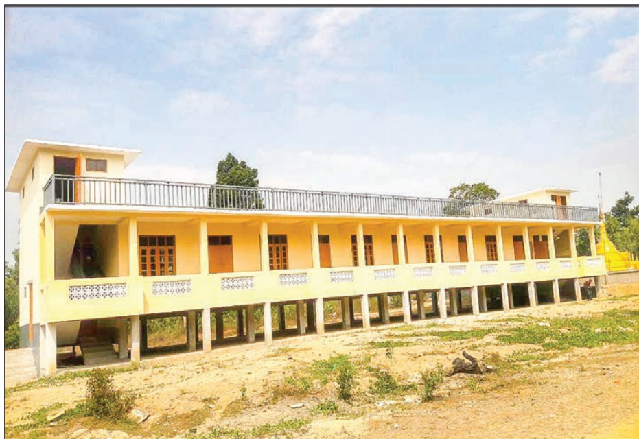
Cyclone shelters are built in areas prone to storm surge including Aung La Pyin Village, Yanbye Township.