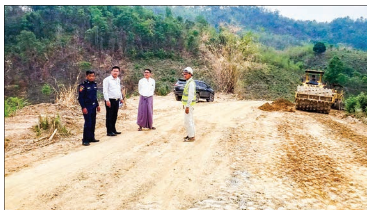
Officials inspect the technical condition of Monghsat-Tachilek Road.

The 60.4 miles long Monghsat-Tachilek road was upgraded from an earthen road into an