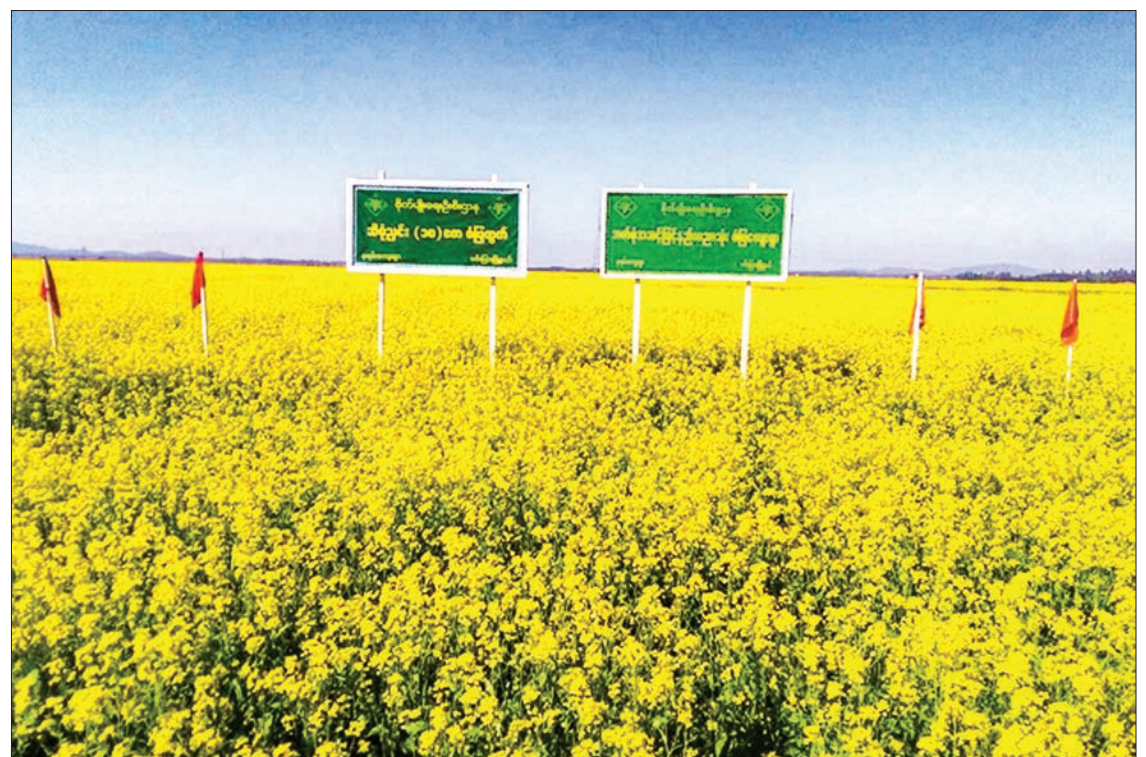
The colorful plantation seen in Minbya Township, Rakhine State.