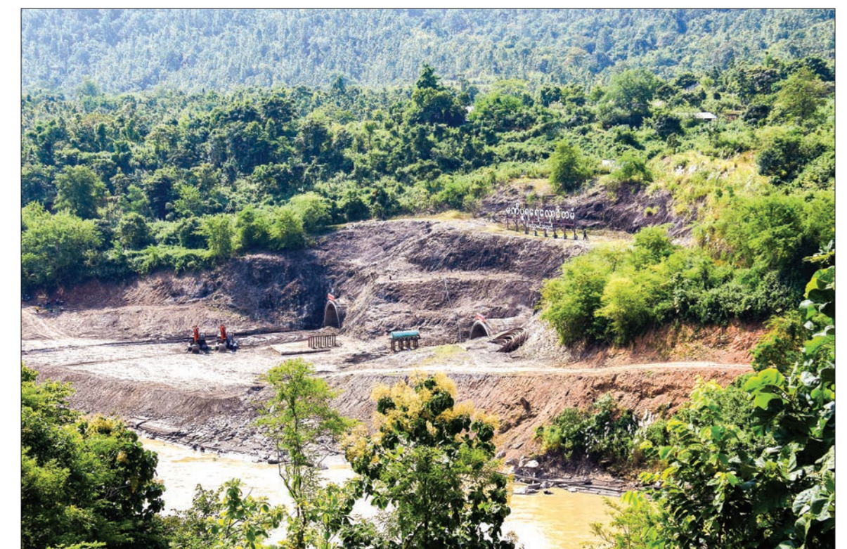
Manipur multi-purpose dam is situated on Manipur River in Falam Township, Chin State. The dam is the biggest tributary of Myitha River. By implementing the project about 80,000 acres of farmlands can be provided with irrigation.