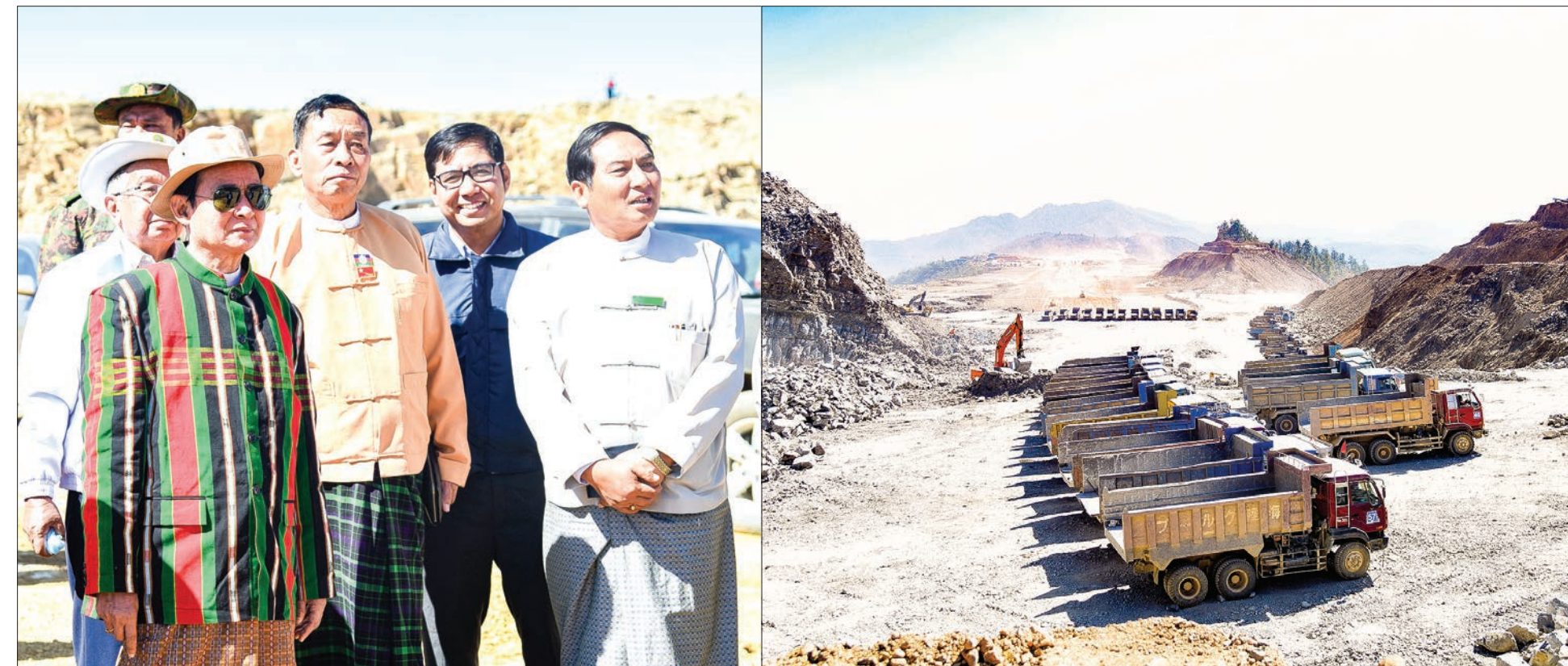
President U Win Myint (Left) inspects the construction of Surbung Airport project in Falam, Chin State on 21 February 2019.

Other objectives include generating more electricity, more urban municipal development, developing the human resource, education, healthcare and other services. Reducing unemployment and poverty rates