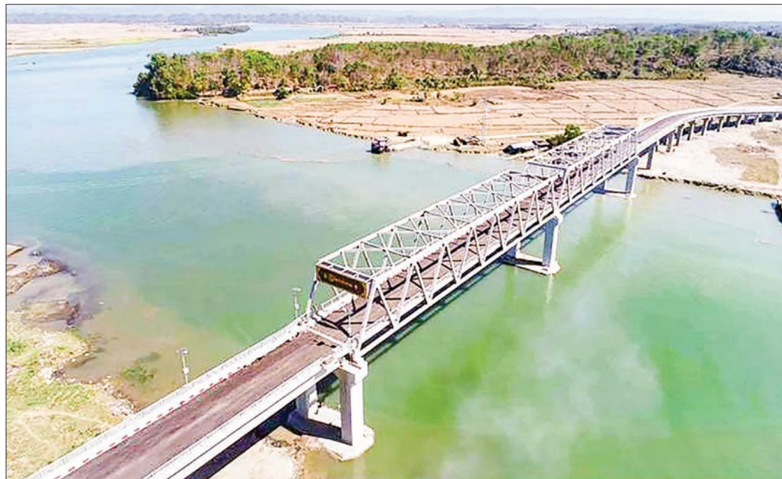
Sat Yoe Kya Bridge, 1642 feet long, seen in Sittway Township.

S TARTING from the inception of the incumbent government, the Rakhine administration has made the development, rule of law and peace the main priorities. U Nyi Pu, State Chief Minister comments: “The State Government is focusing on peace and development of the state. Safety of the people is our top priority. We’re working as much as possible and collaborating with the Tatmadaw, Myanmar Police Force as well as relevant district administrators and locals to make the area as peaceful and stable for residents as possible.”