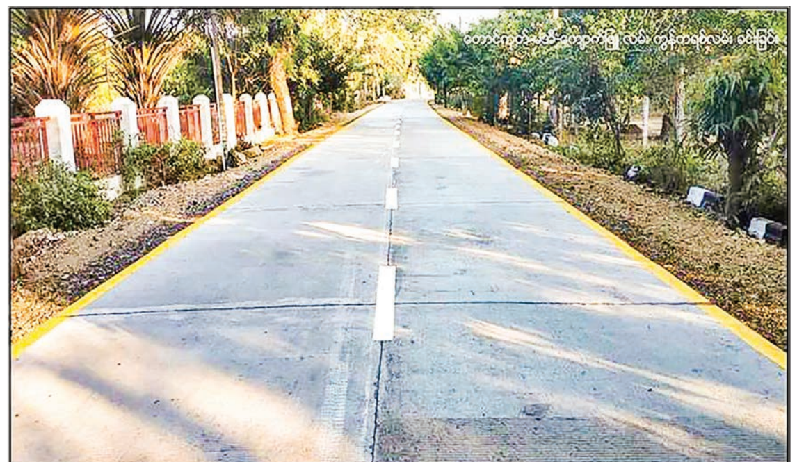
Newly built Taungup-Maei-Kyaukphyu concrete road.