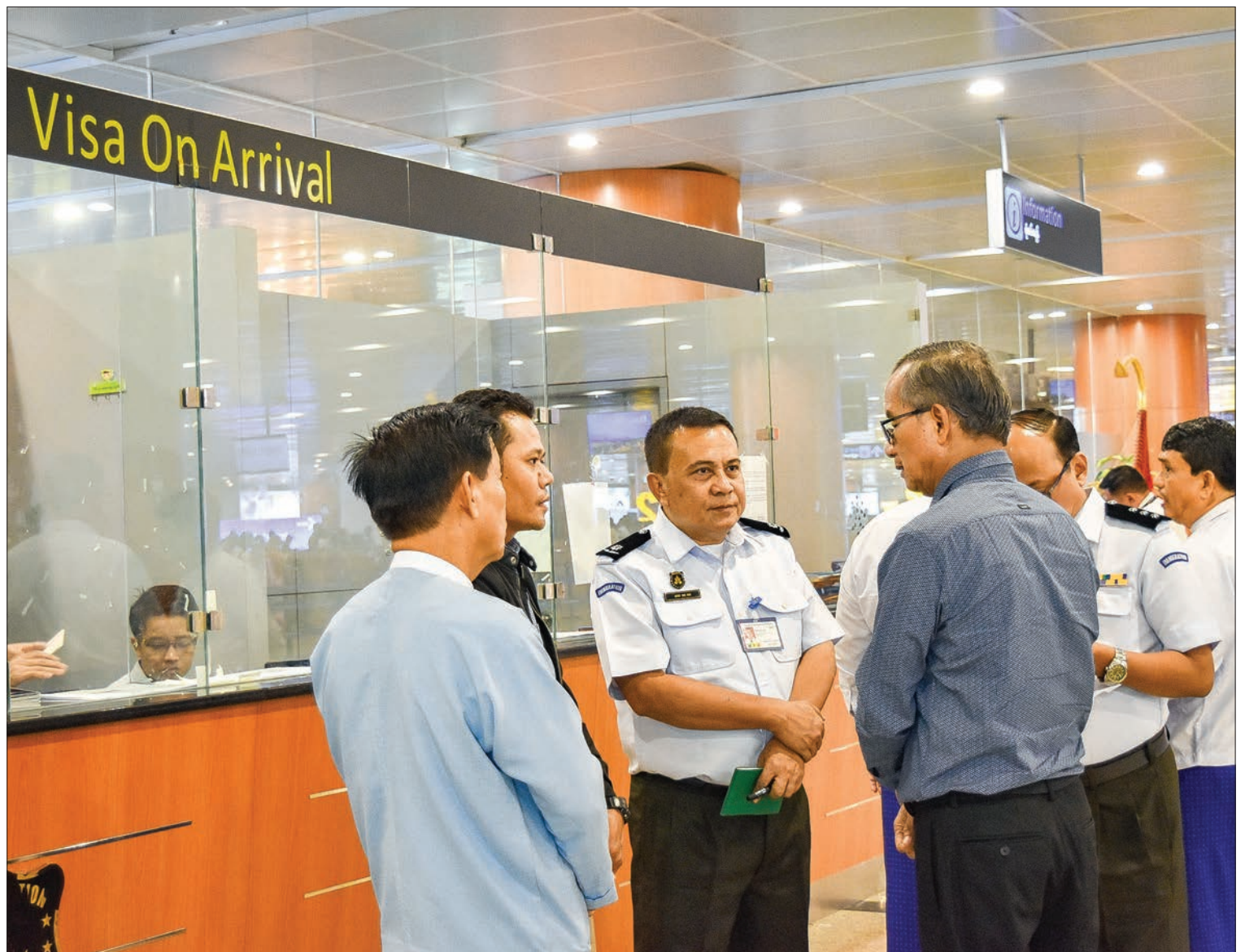
Union Minister U Ohn Maung meets with officials of the Immigration Department at the Yangon International Airport yesterday.

From there, the Union Minister headed to the Myanmar Institute of Tourism and Hospitality on Bo Soon Pat Road in Pabedan Township. He observed the classes on hospitality in session, practical and theoretical classes, and the ongoing renovation work at the building. The institute was jointly opened by the Ministry of Hotels and Tourism and Luxembourg Development.