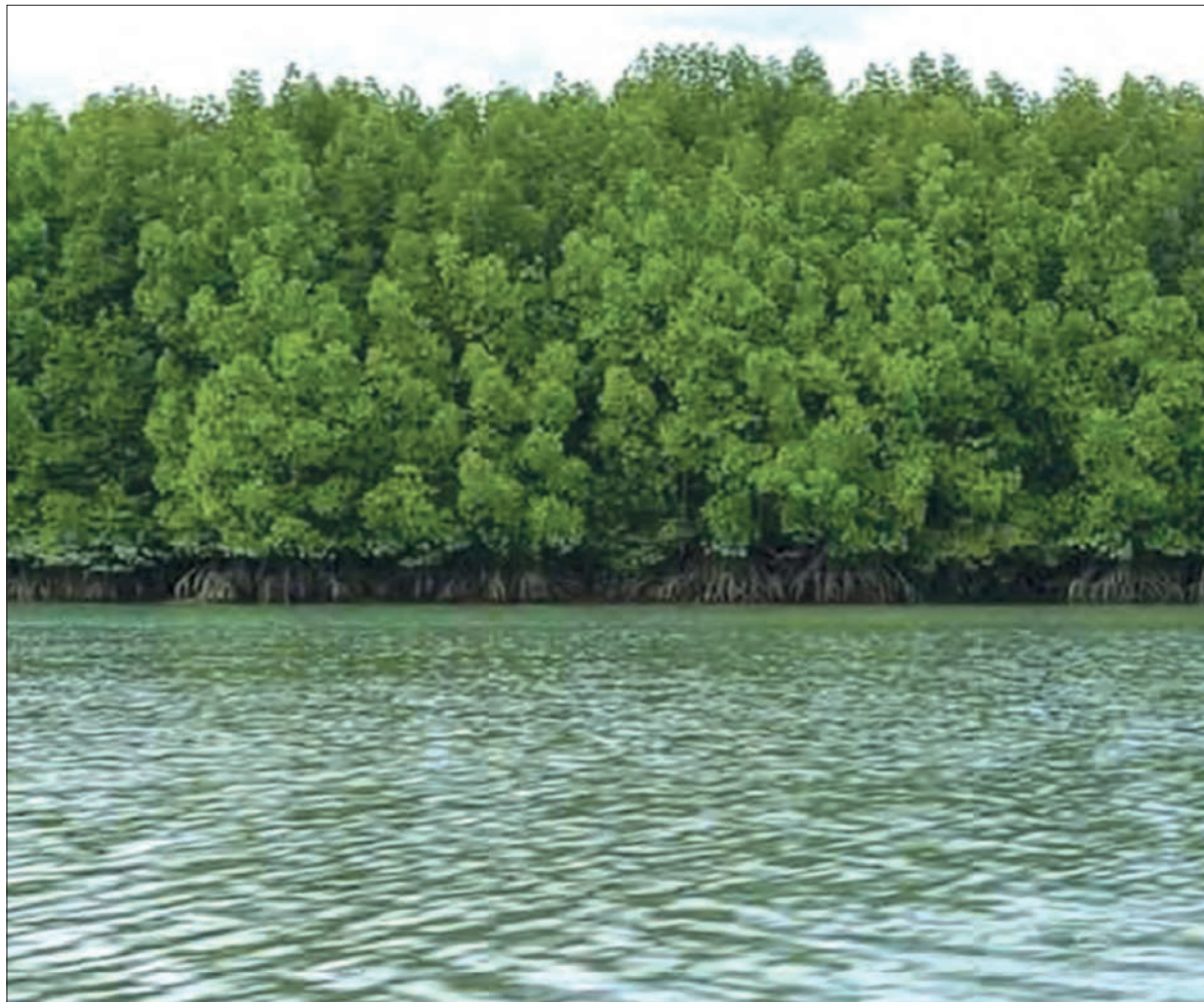
Various species of mangrove plants thriving in Meinmahla Island wildlife sanctuary.

The wildlife sanctuary prevents inflow of seawater which may cause damage to farmlands of Ayeyawady Region where paddy cultivation and production is the main business in the region and causing of landslides, controls silting process, gives shelters as habitat for aqua creatures which are the second important