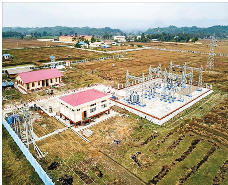
Buthidaung-Maungtaw 66 KV sub-station and Maungtaw 66/11 KV (5) MVA sub-station.