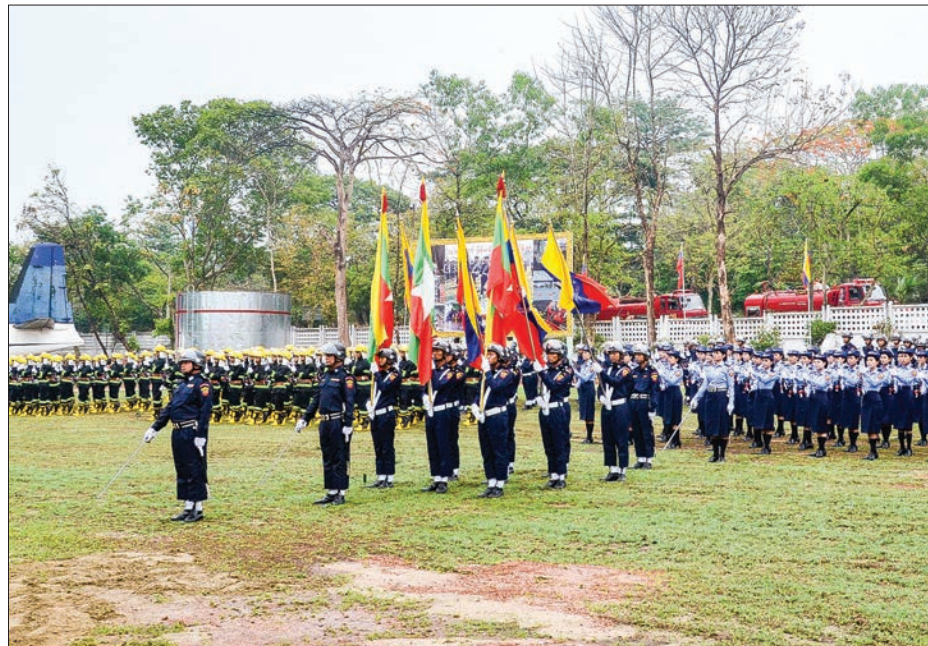
Union Minister Lt-Gen Kyaw Swe gives salute to the fire brigade yesterday at the 73 rd anniversary of the Fire Brigade Day.

MYANMAR Fire Services Department must enhance its prowess to stand shoulder to shoulder with its international counterparts, said Union Minister for Home Affairs Lt-Gen Kyaw Swe at its 73 rd anniversary yesterday.