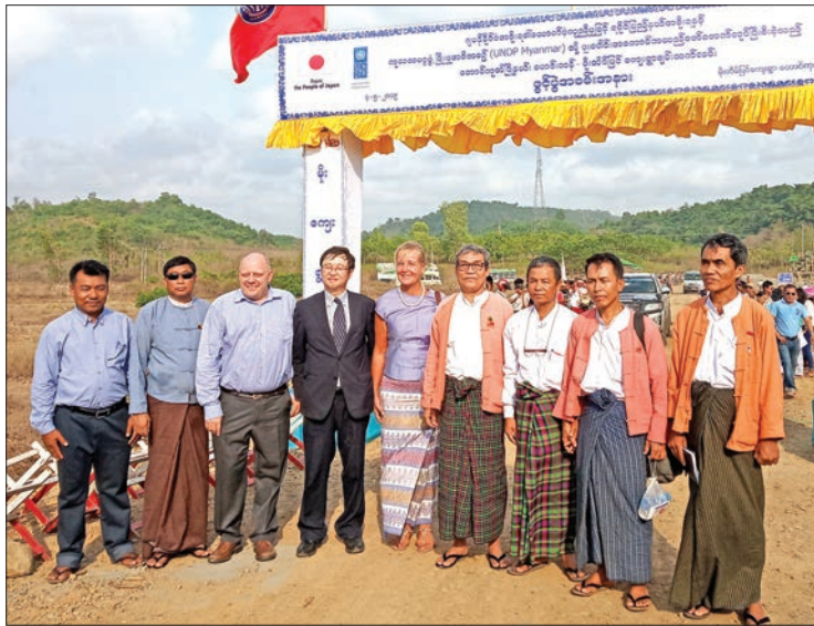
Rakhine State Chief Minister U Nyi Pu poses for a group photo together with officials from UNDP Myanmar.

The 3.5-mile long and 20 feet wide earth road was jointly built by Rakhine State Government