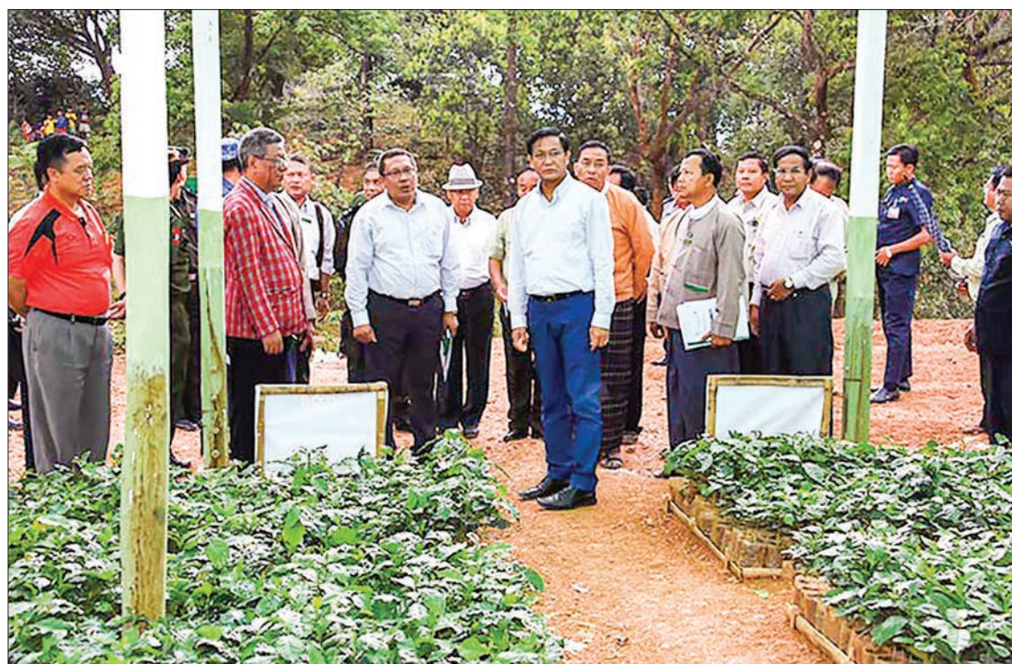
Vice President U Henry Ven Thio inspects systematic plantation in Chin State.