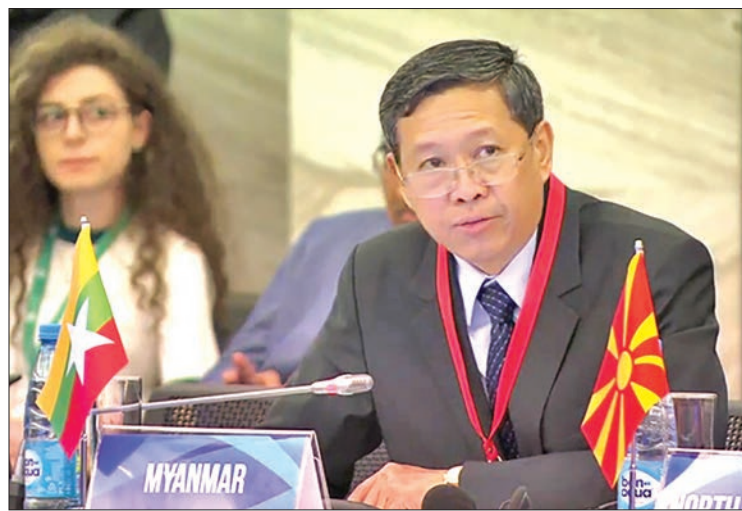
Union Minister Dr. Myo Thein Gyi participates in the 5 th World Forum on Intercultural Dialogue in Baku, Azerbaijan.

A Myanmar delegation led by Union Minister for Education Dr Myo Thein Gyi took part in the 5th World Forum on Inter-