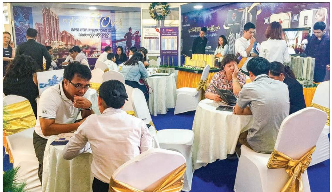
The 11th largest property expo in Yangon being convened.

Golden City is the main sponsor of the expo. More than 10,000 apartment and condominiums from Mandalay, Yangon, Taunggyi, and Patheingyi will be showcased at the expo. While the apartments have been priced