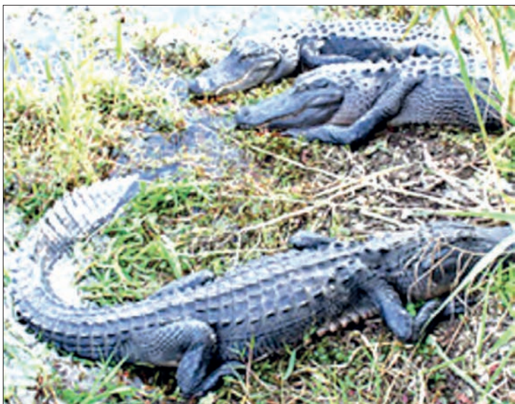
Various sizes of crocodiles seen on Meinmahla Island.

Meinmahla Island wildlife sanctuary established in 1994 is located on 52.78 square miles (33,336 acres) of land in Bogale Township of Pyapon District in Ayeyawady Region. It is com-