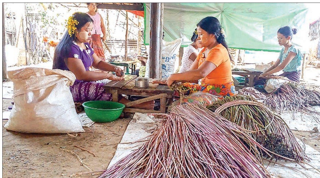
Workers make fiber from lotus stems.

Earlier, the market saw only the sale of lotus blossoms and seeds. The lotus fibre production business has boomed in the last seven years after lotus fibre