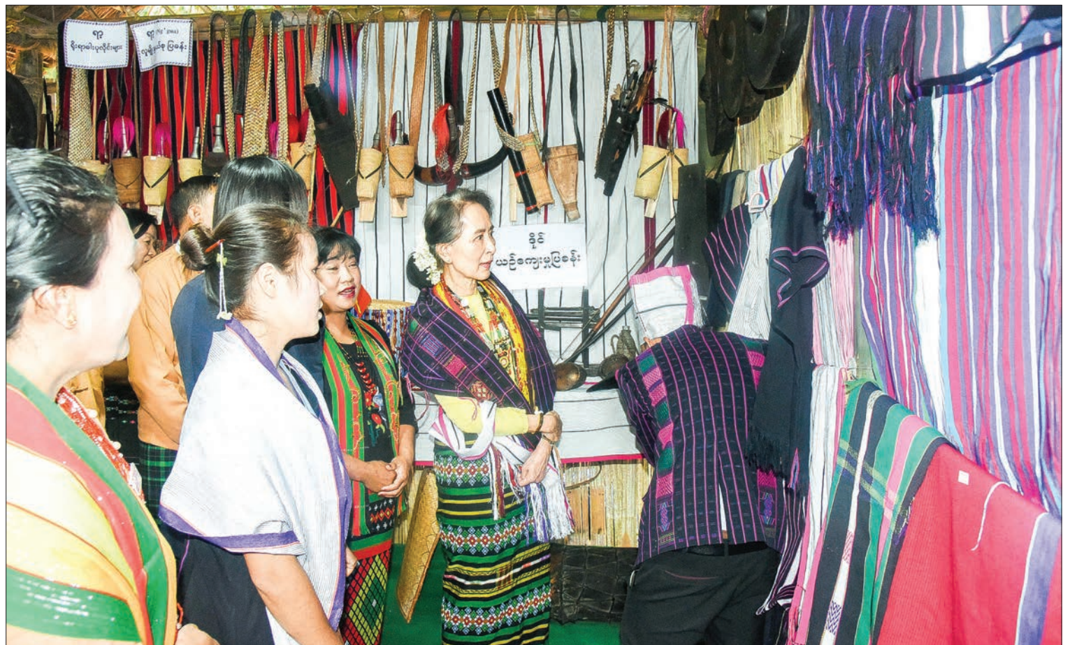
State Counsellor Daw Aung San Suu Kyi observes an exhibition showcasing Chin traditional artifacts and costumes in Kanpetlet, Chin State on 27 October 2018 .

To transition to a mechanized agricultural system and upgrade farmlands, Chin State provided K279.600 million to 511 members of 14 co-operatives in