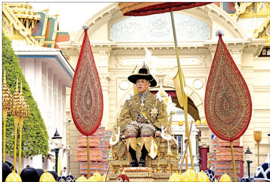
The Thai king's coronation started on Saturday, and is the first in 69 years.

For many Thais, the procession is a chance to see the king in a country where the wealthy monarchy is the focus of reverence and veneration. Criticism of the royal family