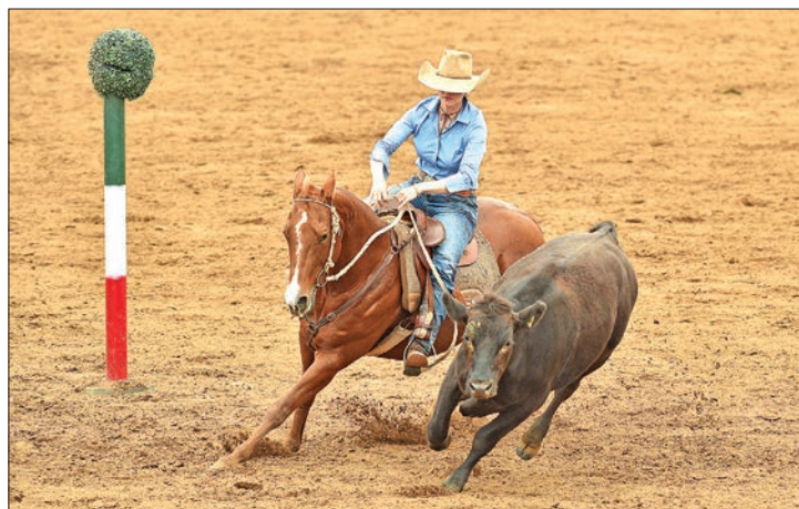
Campdrafting involves a cowboy or cowgirl riding their horse while guiding a bullock around a course.

dise Lagoons extravaganza one of the biggest on the calendar with up to 12,000 competitors and spectators. —AFP ■