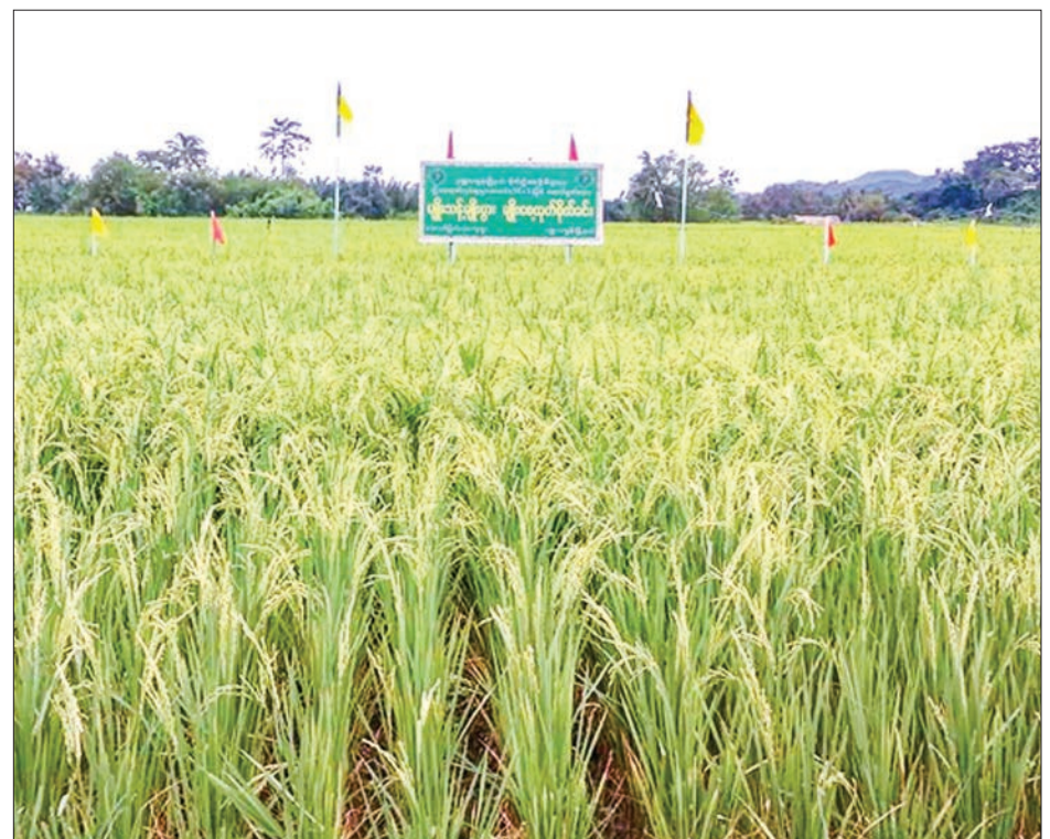
The rain paddy field turning a feathery yellow in Ponnagyun Township, Rakhine State.