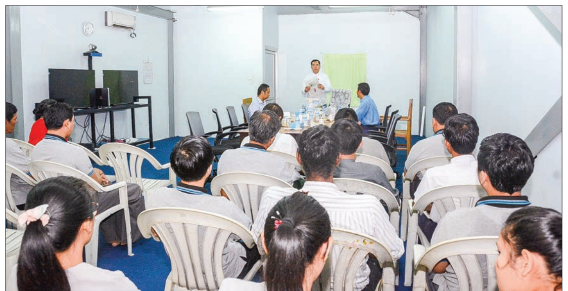
Deputy Minister U Aung Hla Tun meeting with editorial team of the Global New Light of Myanmar yesterday.