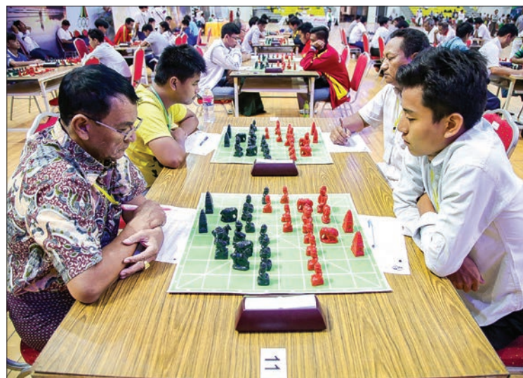
Players at the Myanmar traditional Chess freelance event at the Wunna Theikdhi Indoor Stadium in Nay Pyi Taw.

THE State and Region Chess Championship being held at the Wunna Theikdhi Indoor Stadium in Nay Pyi Taw entered its fourth day yesterday. The championship began on 30 April and ends on 7 May.