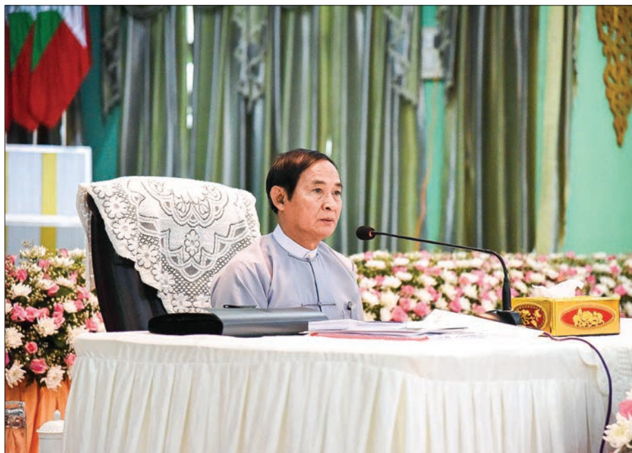
President U Win Myint delivers the speech at the meeting with administrative, legislative and judiciary sectors officials in Dawei, Taninthayi Region yesterday.

P RESIDENT U Win Myint accompanied by Union Ministers Lt-Gen Kyaw Swe, Lt-Gen Ye Aung, Dr. Myint Htwe, U Han Zaw and U Ohn Maung, Chief of Myanmar Police Force Police Lt-Gen Aung Win Oo and officials left Nay Pyi Taw by Tatmadaw special flight and arrived in Taninthayi Region, Dawei