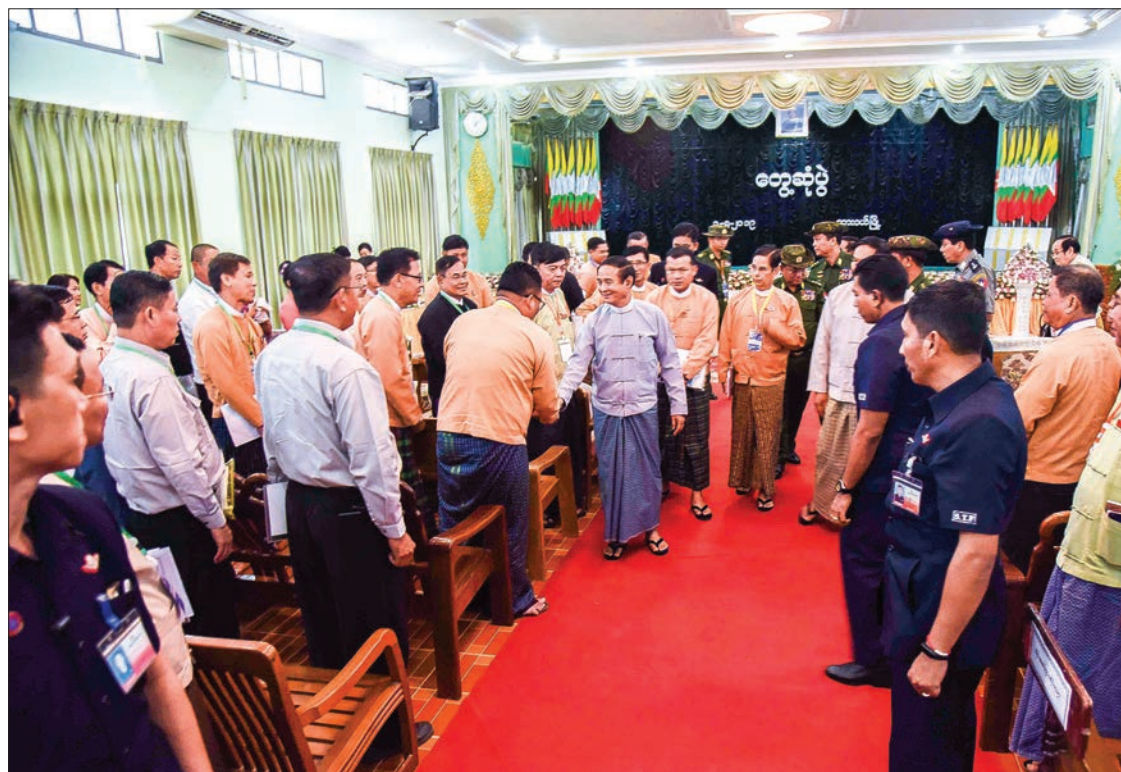
President U Win Myint greets representatives from administrative, legislative and judiciary sectors officials in Dawei, Taninthayi Region yesterday.

In today's age of globalization, the country would not develop, be stable and prosper-