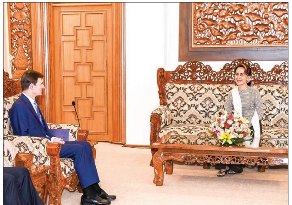
State Counsellor Daw Aung San Suu Kyi meets with Under Secretary of State for Political Affairs of the United States of America Mr. David Hale in Nay Pyi Taw.

D AW Aung San Suu Kyi, State Counsellor of the Republic of the Union of Myanmar, received Mr. David Hale, Under Secretary of State for Political Affairs of the United States of America, at the Ministry of Foreign Affairs in Nay Pyi Taw at 10:00 am.