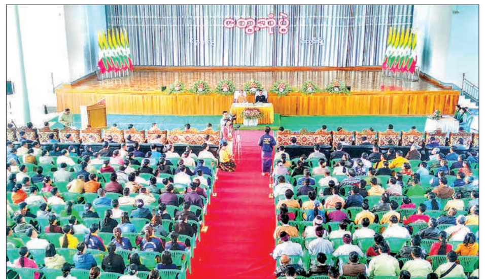
Kachin State Chief Minister Dr. Khet Aung discusses regional development during the meeting with local residents in Mohnyin on 6 March 2019.