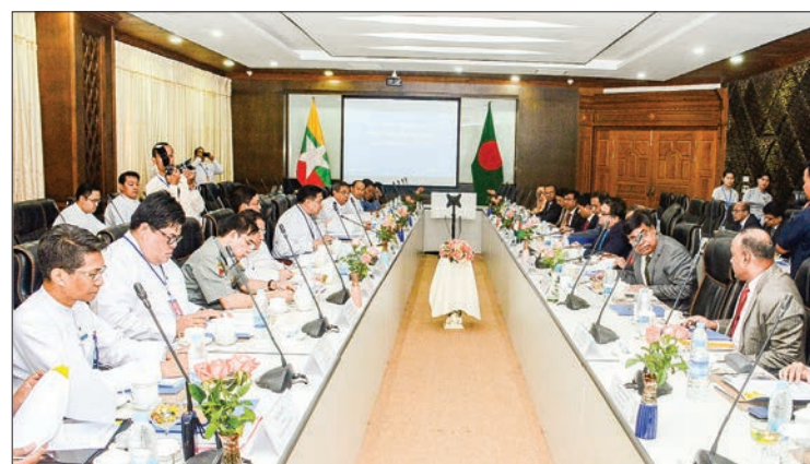
The fourth meeting of the Myanmar-Bangladesh Joint Working Group in progress in Nay Pyi Taw on 3 May.

Fifth Meeting of the Joint Working Groups will be communicated through the diplomatic channel, it is learnt.—MNA