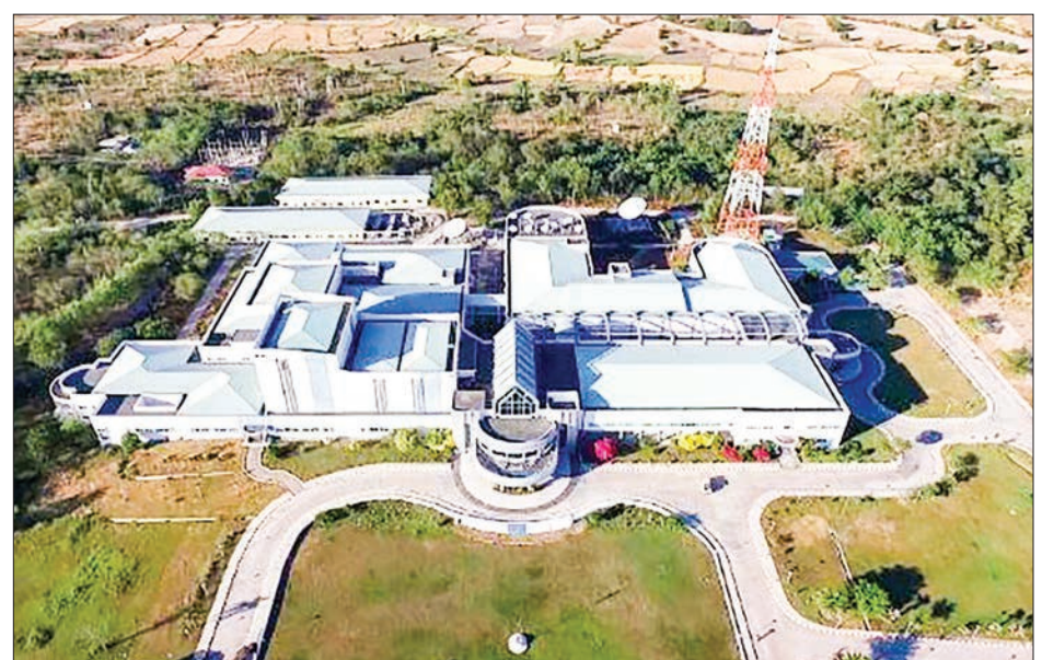
The aerial view of Myanmar Radio and Television (MRTV) building in Nay Pyi Taw.