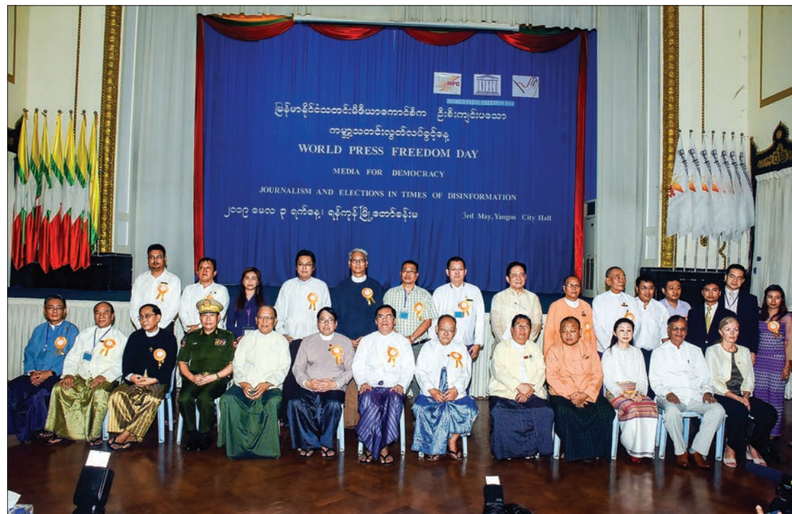
Union Minister Dr. Pe Myint and attendees pose for the documentary photo at the ceremony to mark World Press Freedom Day in Yangon yesterday.

There had been discussions within the news media circle on how to prevent and obstruct this. There are ways and means and some were seen to doing it. As mentioned earlier when a stage