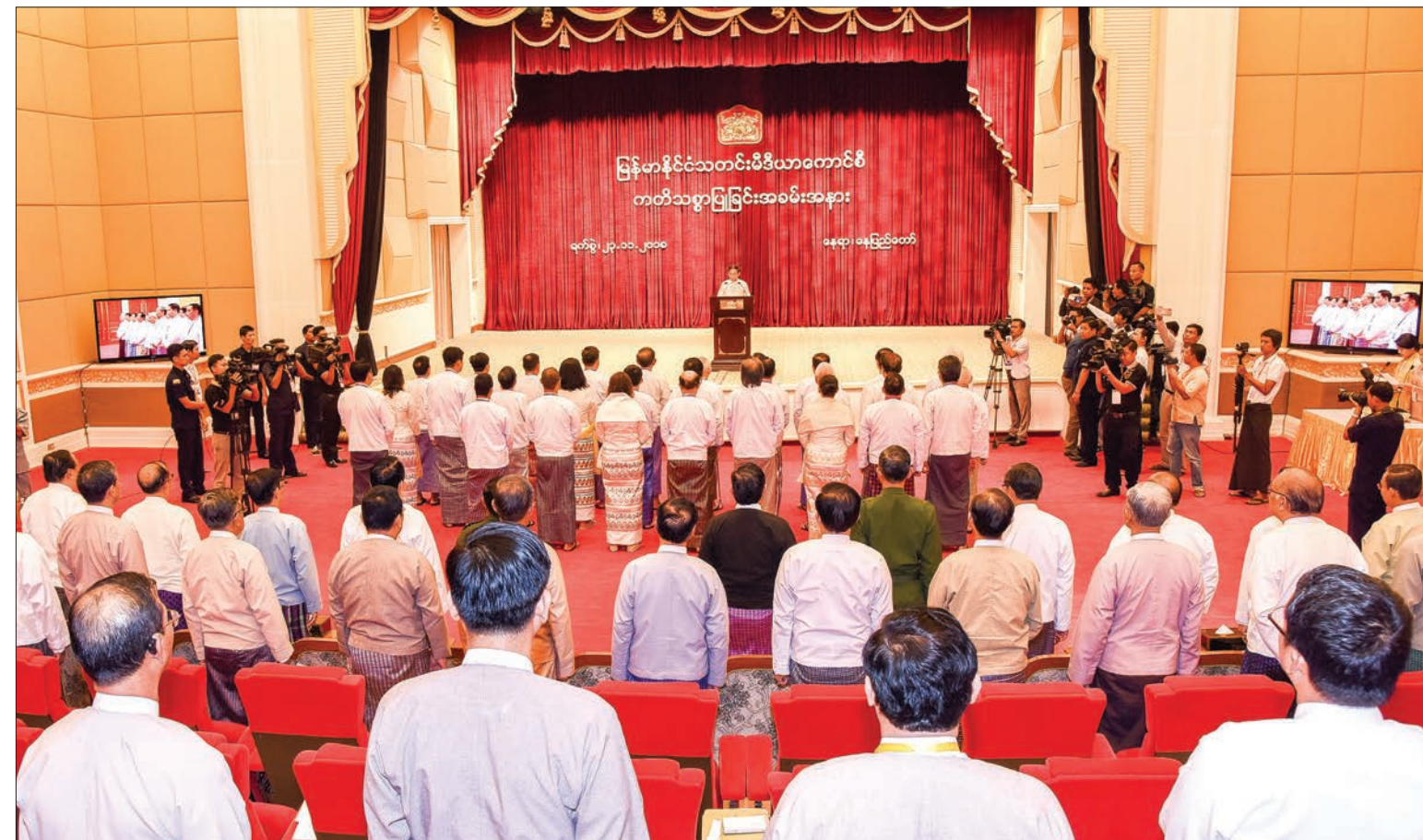
President U Win Myint delivers the speech at the swearing-in ceremony of Myanmar Press Council in Nay Pyi Taw on 23 November 2018.

MRTV has Studio 1 on Yangon's Pyay Road which used to be the main center for all its work. It has fell into disuse for quite