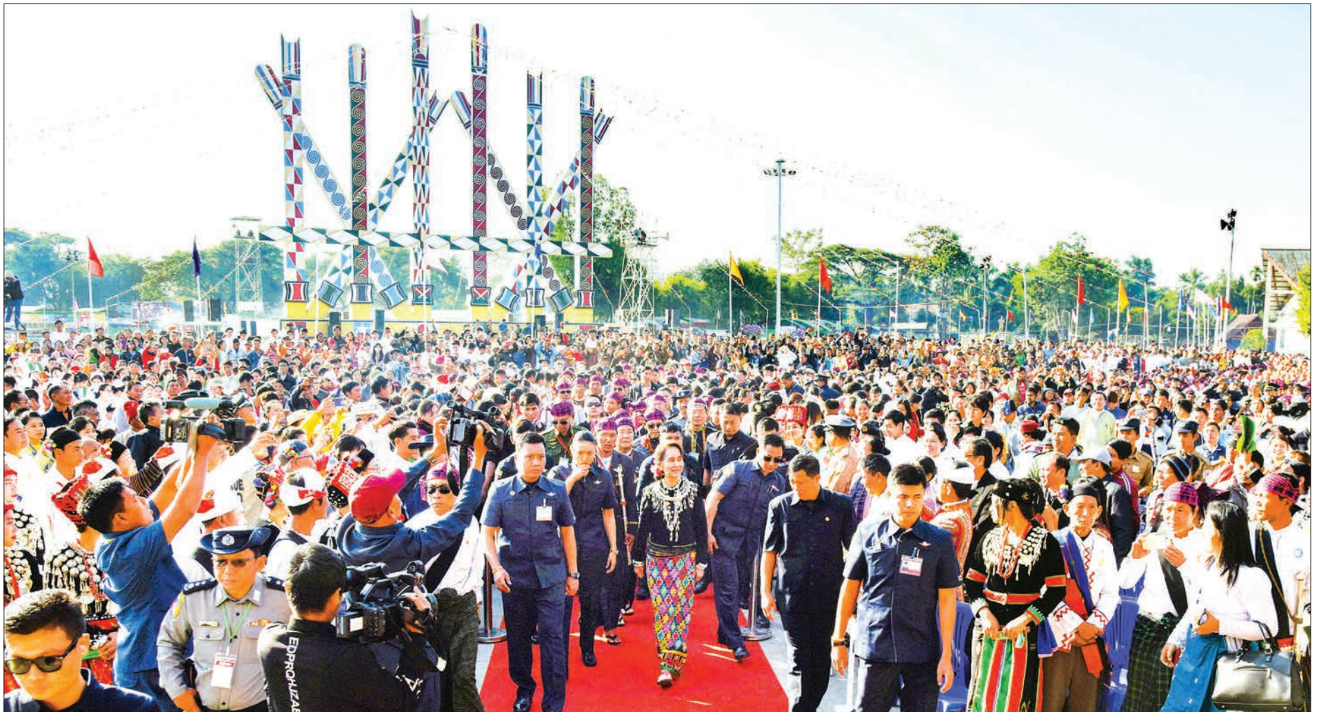
State Counsellor Daw Aung San Suu Kyi, Chairperson of the Central Committee for Development of Border Areas and National Races, attends the 71 st Kachin State Day ceremony held at Myitkyina Sitapu Ward Manaw grounds in Myitkyina, Kachin State on 10 January 2019.