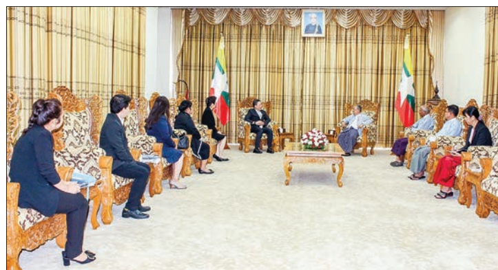
CBM Governor U Kyaw Kyaw Maung meets with Krungthai Bank's CEO Mr. Payong Srivanich yesterday.

During the meeting, they discussed current cooperation processes of commerce and trade between Myanmar and Thailand and potential cooperating processes of Krungthai Bank with the Central Bank of Myanmar.—MNA ■ (Translated by Kyaw Zin Lin)