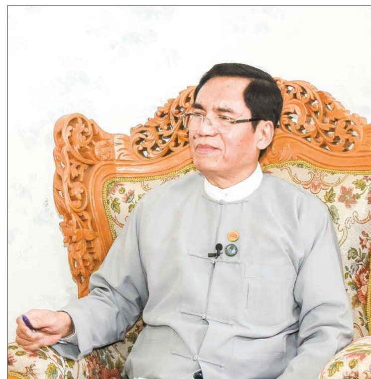
Deputy Minister for Information U Aung Hla Tun.