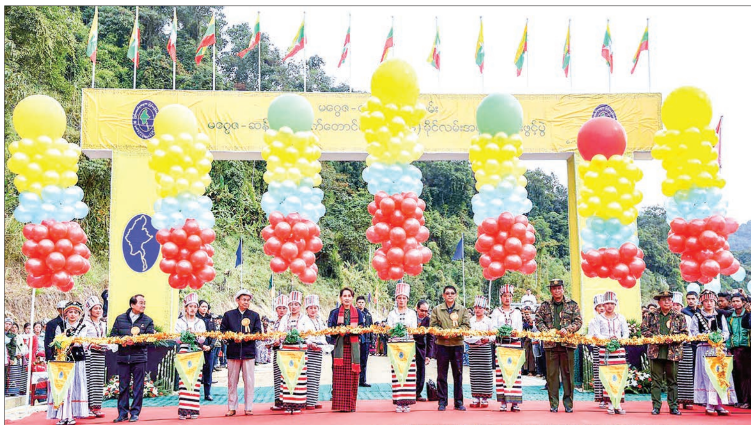
State Counsellor Daw Aung San Suu Kyi, Union ministers and Chief Minister Dr. Khet Aung cut ceremonial ribbon to open the Maggayza-Mt. Sanlutchat (33 miles 6 furlong) road section in Kachin State.

Furthermore, 288 towers were erected with 513 mobile stations set up for better communication in the area.