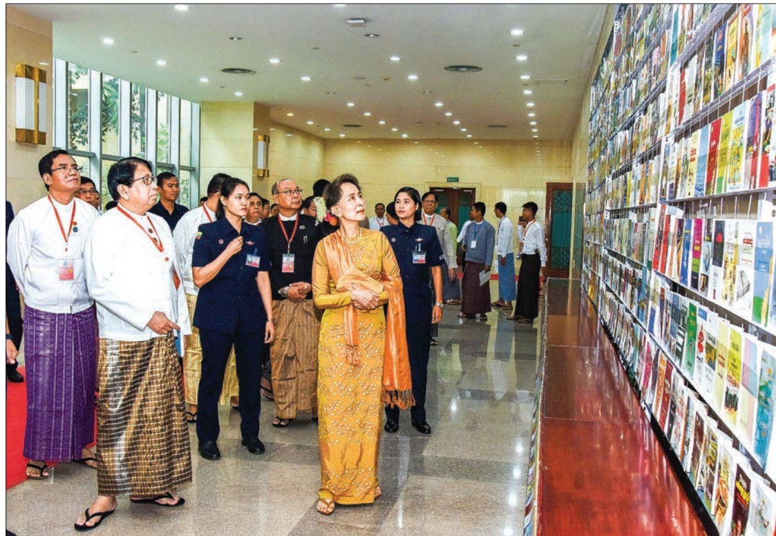
State Counsellor Daw Aung San Suu Kyi observes the books displayed at "All Who Can Read Should Read" campaign in Nay Pyi Taw.

A: This is a project we are undertaking with assistance from external experts. There are countless pieces of Burmese lit-