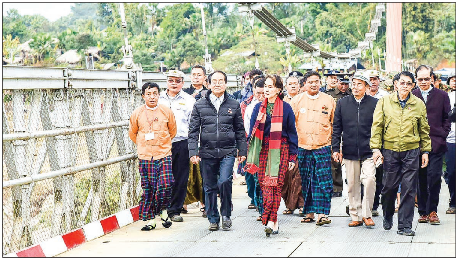
State Counsellor Daw Aung San Suu Kyi inspects Malikha Suspension Bridge (Machanbaw) in Kachin State.

The State Chief Minister Dr. Khet Aung comments, “Our priority is to eradicate drugs from the state. Last year, we had 2337 cases with 4225 arrests and 5.2 million grams of drugs, 2.9 million tablets, 245 liters of cocaine liquid and 1147 vehicles and cycles seizures. These add up to around K161 billion. The anti-drug task force also destroyed 161 acres of poppy farms as well.”