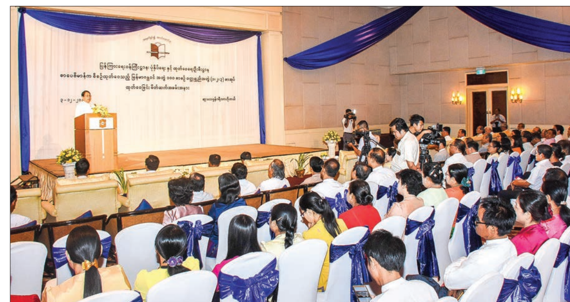
Union Minister Dr. Pe Myint delivers a speech at the ceremony to launch the 100 Myanmar Classis Book series at the Sule Shangri-la Hotel in Yangon.

We have improved on a lot of direct broadcasting programs last year. We've been broadcasting events and incidents the public are interested in, such as the State Counsellor's roundtable discussions with youths. We've also recently incorporated three Digital Satellite News Gathering