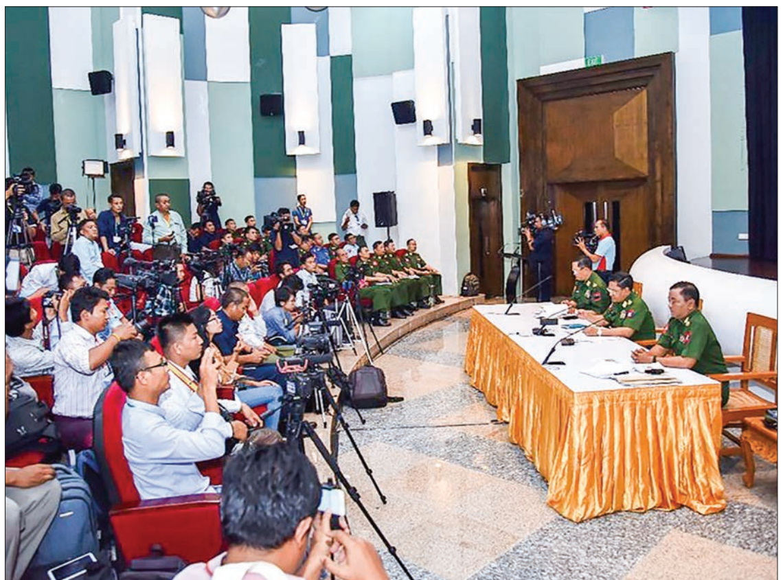
The Tatmadaw holds press conference in Nay Pyi Taw.