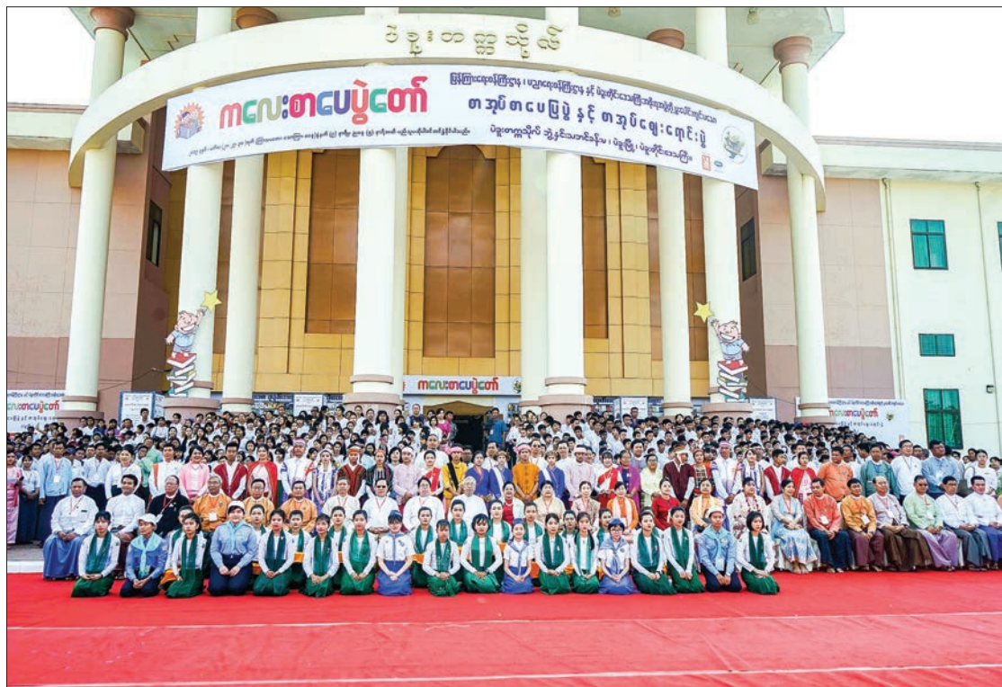
Former President U Htin Kyaw, wife Daw Su Su Lwin, Union Ministers, Bago Region Chief Minister, officials and students pose for a commemorative group photo at the opening ceremony of Children's Literary Festival (Bago) in front of the convocation hall of the Bago University, Bago.

ing the media sector were conducted in the government's third year in office?