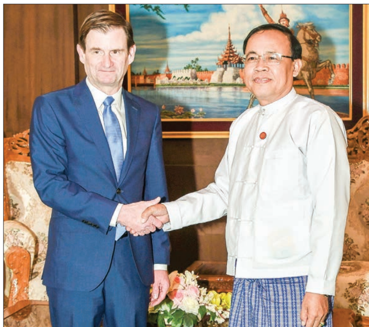
Union Minister U Kyaw Tin shakes hands with US Under Secy of State Mr. David Hale in Nay Pyi Taw yesterday.

U Kyaw Tin, Union Minister for International Cooperation of the Republic of the Union of Myanmar, received Mr. David Hale, Under Secretary of State for Political Affairs of the United States of America, at the Ministry of Foreign Affairs in Nay Pyi Taw at 4:30 pm.