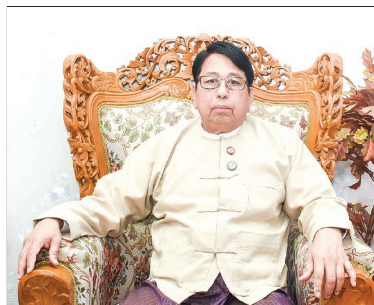
Union Minister for Information Dr. Pe Myint.

tion basically serves as a medium between the government and the people. There are four major departments under MoI that perform the many functions of the ministry. They are Myanmar Radio and Television (MRTV), the Information and Public Relations Department (IPRD), the Printing and Publishing Department (PPD), and the News and Periodicals Enterprise (NPE).