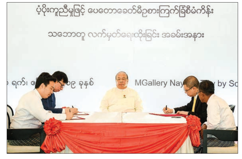
A signing ceremony agreement for The Pay Taw Village Layer Farm Project by Pay Taw Village Development Fund Association, Ayeyarwady Bank and Myanmar CP. Livestock Co., Ltd. in Nay Pyi Taw.