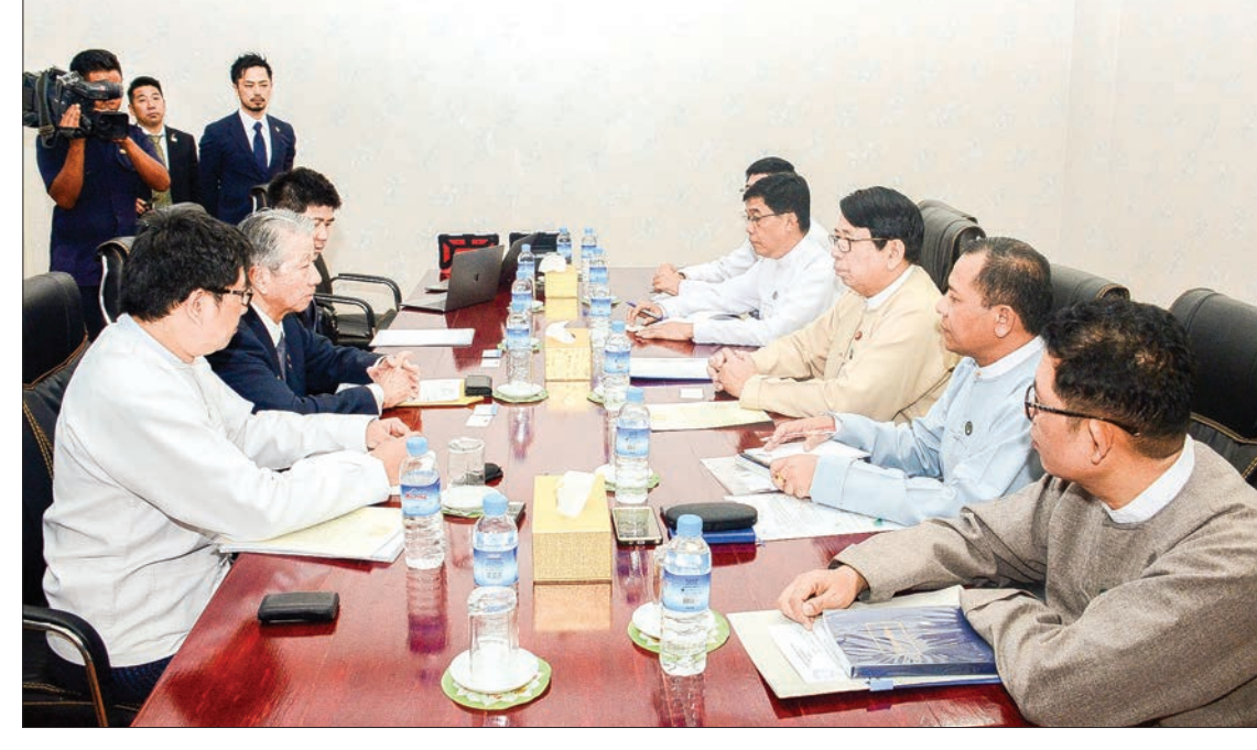
Union Minister Dr. Pe Myint holds talks with Honourary Consul of Myanmar from Nagoya Mr. Toshio Nishimura yesterday.

Participants at the workshop also agreed to cooperate in releasing news in a timely manner, promote Media and Information Literacy, put up information and press releases on the ministries' websites and online pages in a timely manner, provide easy access to information at the Hluttaws, form a work committee to implement the results of the meeting of the four pillars, work with the authorities to expose those who disseminate fake news, control misuse of social media, promote cooperation between the Myanmar Press Council, the ministries concerned, and the Hluttaw to enact laws which can help develop the news media, and provide equal opportunities to media, including ethnic media, in terms of access to information from the regional and state government departments. - MNA ■ (Translated by AMS)