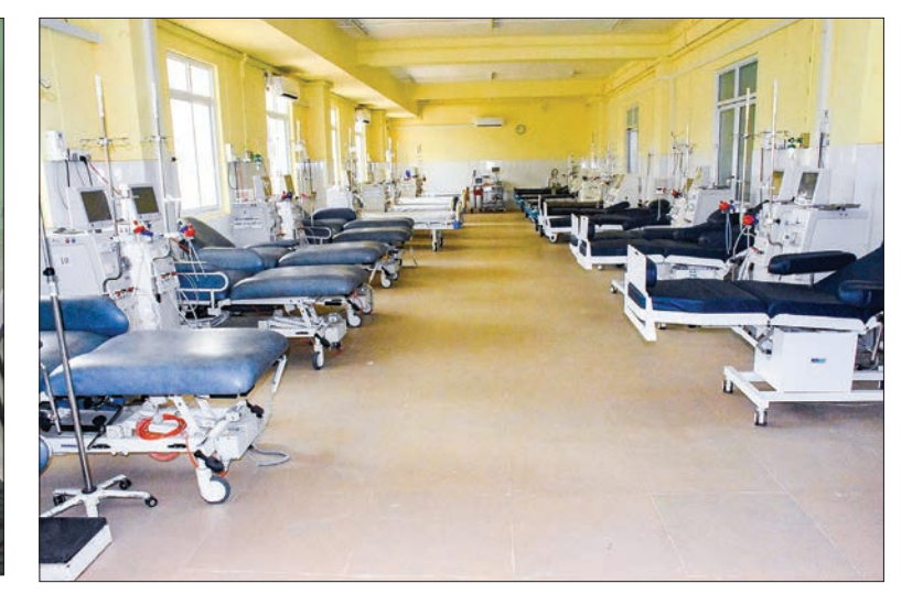
Kidney Treatment Ward in Thingangyun Sanpya Hospital.