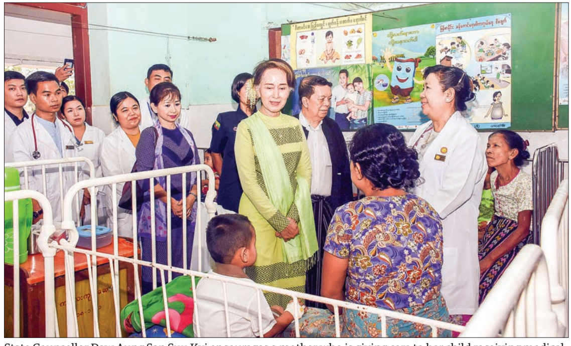
State Counsellor Daw Aung San Suu Kyi encourages a mother who is giving care to her child receiving medical care at Dawei Hospital, Dawei.

The region's government returns land to local residents from companies unable to utilize them, developing regional tourism, exporting fishery products abroad, ensuring full security