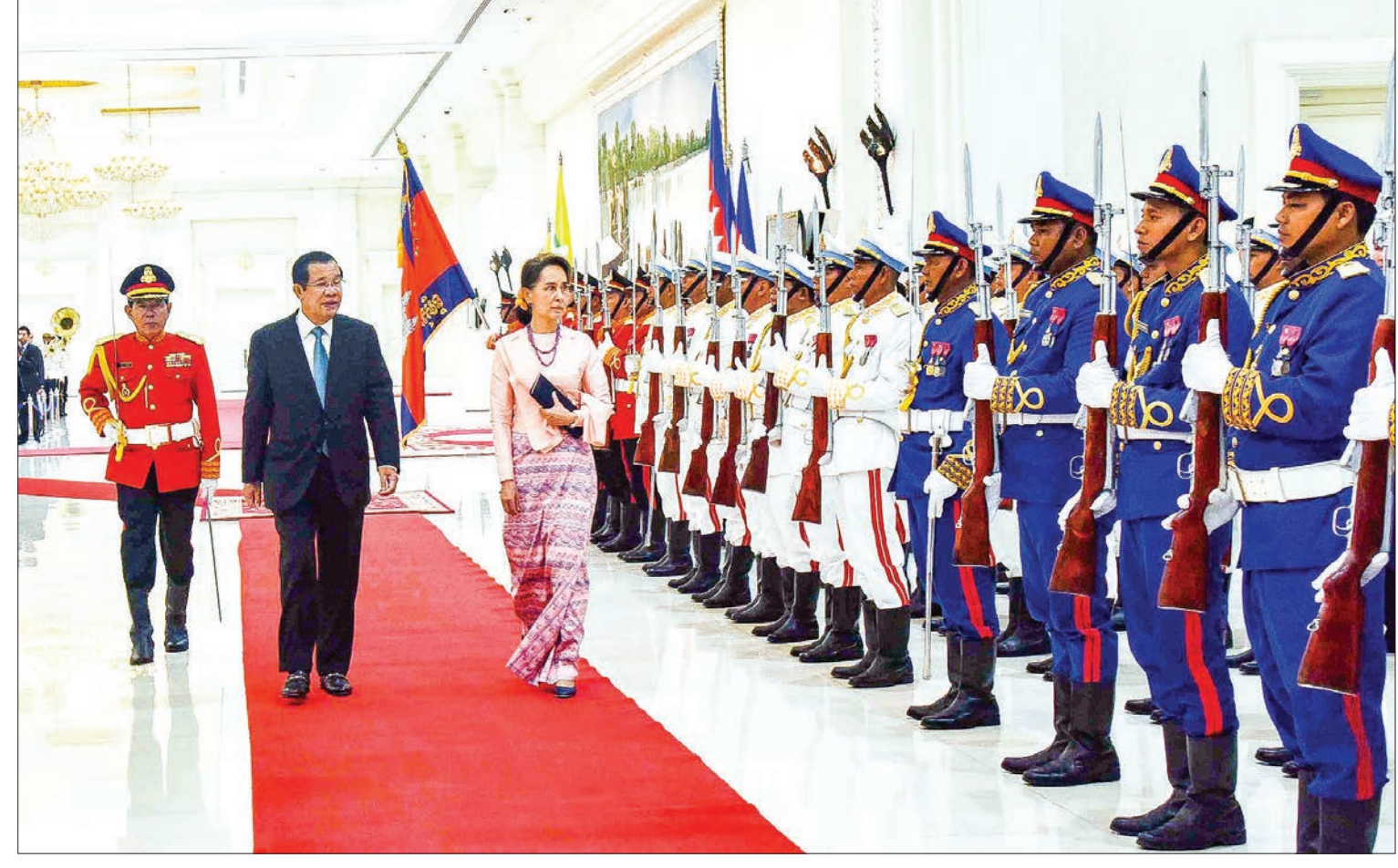
State Counsellor Daw Aung San Suu Kyi, accompanied by Cambodia Prime Minister Samdech Akka Moha Sena Padei Techo Hun Sen, inspects the Guard of Honor in Phnom Penh, Cambodia yesterday.

At the welcoming ceremony the national anthems of Myanmar and Cambodia were played, State Counsellor Daw Aung San Suu Kyi and Cambodia Prime Minister received the salute of the Guard of Honor and then inspected the Guard of Honor.