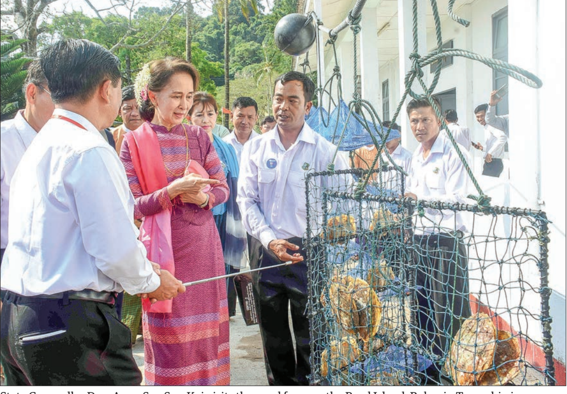
State Counsellor Daw Aung San Suu Kyi visits the pearl farm on the Pearl Island, Bokpyin Township in Taninthayi Region.