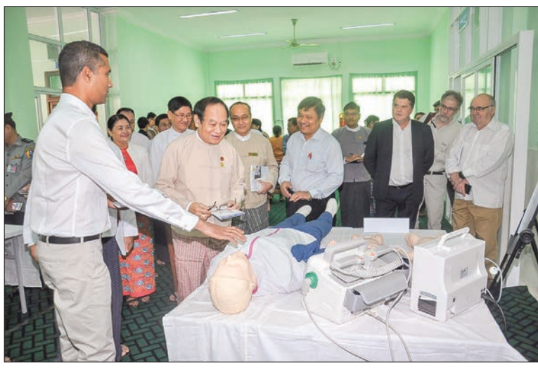
Union Minister Dr. Myint Htwe visits Emergency Life Support Training Center which was opened on 17 January 2019 in Nay Pyi Taw.