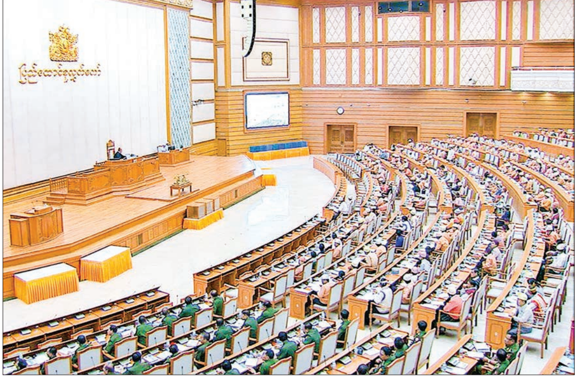
Pyidaungsu Hluttaw is being convinced in Nay Pyi Taw yesterday.

After the discussion Pyidaungsu Hluttaw Speaker announced that response by union level organizations to the discussions and decision on the