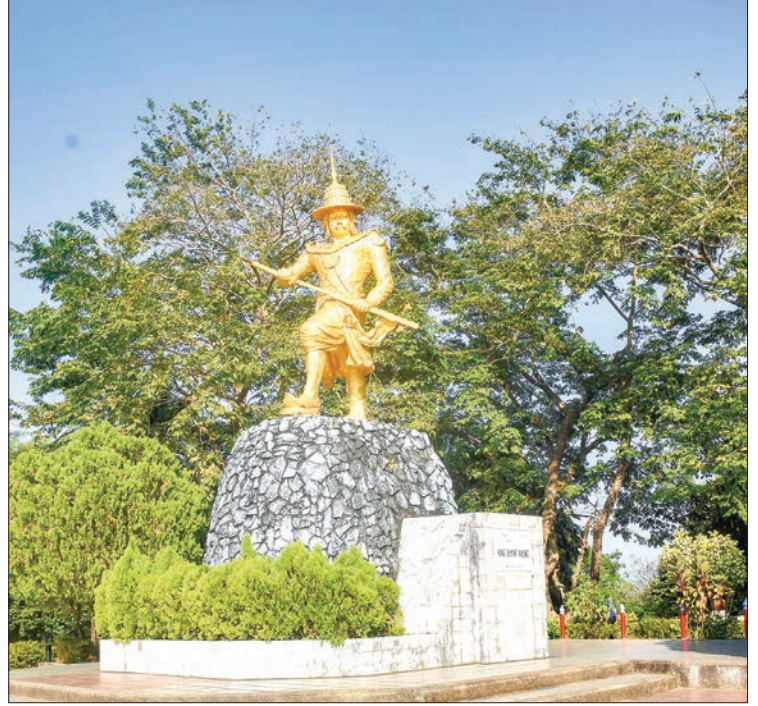
Statue of King Bayint Naung on the Bayint Naung hill in Kawthoung.

Plans are underway to establish a training school for youths from the border areas and the school is under con-