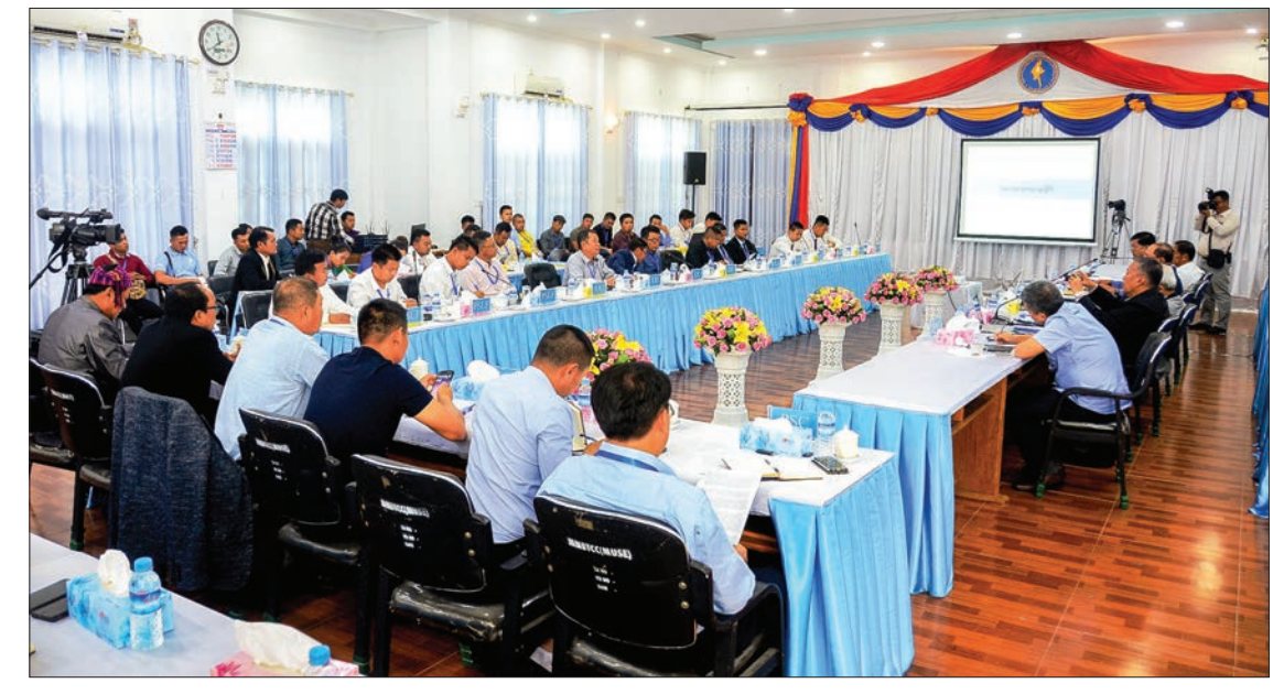
A meeting between the National Reconciliation and Peace Center (NRPC) and KIO, MNTJP, PSLF and ULA takes place in Muse yesterday.

Peace Centre (NRPC) repre- and impossibility of establishing sentative group held a meeting with KIO (Kachin Independence Organisation), MNTJP (Myanmar National Truth and Justice Party), PSLF (Palaung State Liberation Front) and ULA (United League of Arakan) at Muse Town Muse-Namkham Border Trader Association yesterday morning.