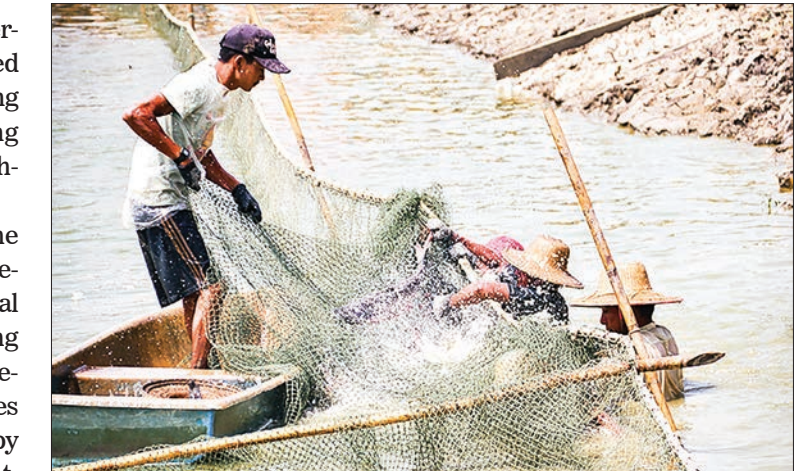
Workers harvest fish at a farm in Ayeyawady Delta.

"We have instructed the regional and state fisheries departments to be strict with local and overseas offshore fishing boats and entrepreneurs, in respect to observance of the rules and regulations prescribed by the Fisheries Department. Additionally, we have ordered them not to issue fish and prawn catching licenses during the hatching season. Entrepreneurs have requested that we reduce the no-fishing period.