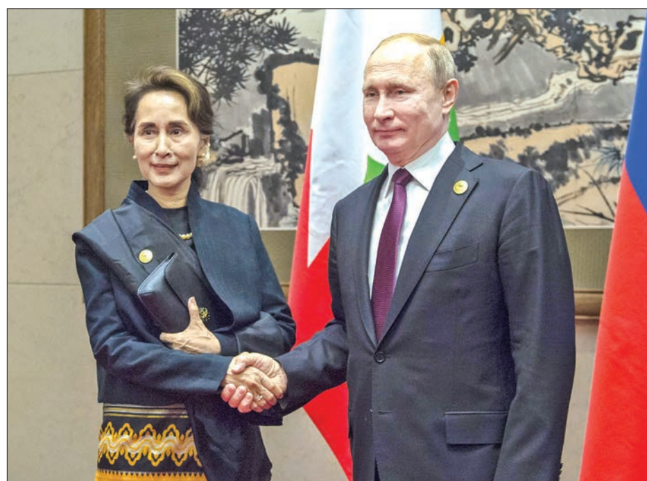
State Counsellor Daw Aung San Suu Kyi shakes hands with China's President Mr. Xi Jinping, left photo, and with Russia's President Mr. Vladimir Putin, right photo.

S TATE Counsellor Daw Aung San Suu Kyi paid a working visit to China from 24 th to 29 th April 2019 to attend the 2 nd Belt and Road Forum for International Cooperation at the invitation of President Xi Jinping of the People's Republic of China.