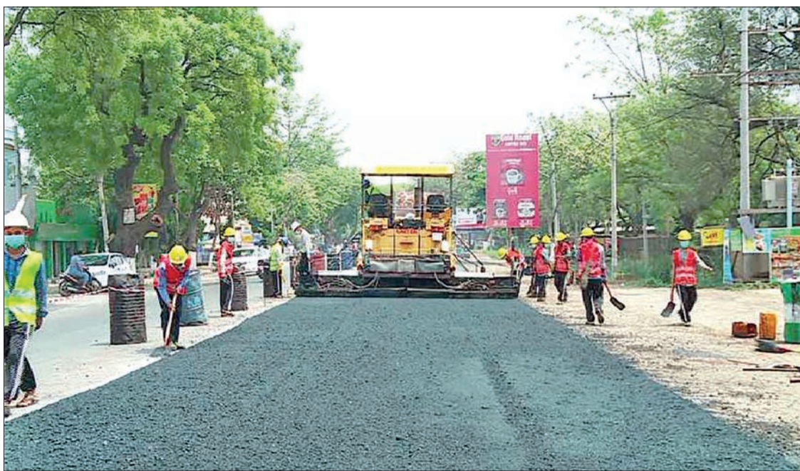
Workers upgrade Kyaukkar road in Monywa, Sagaing Region.