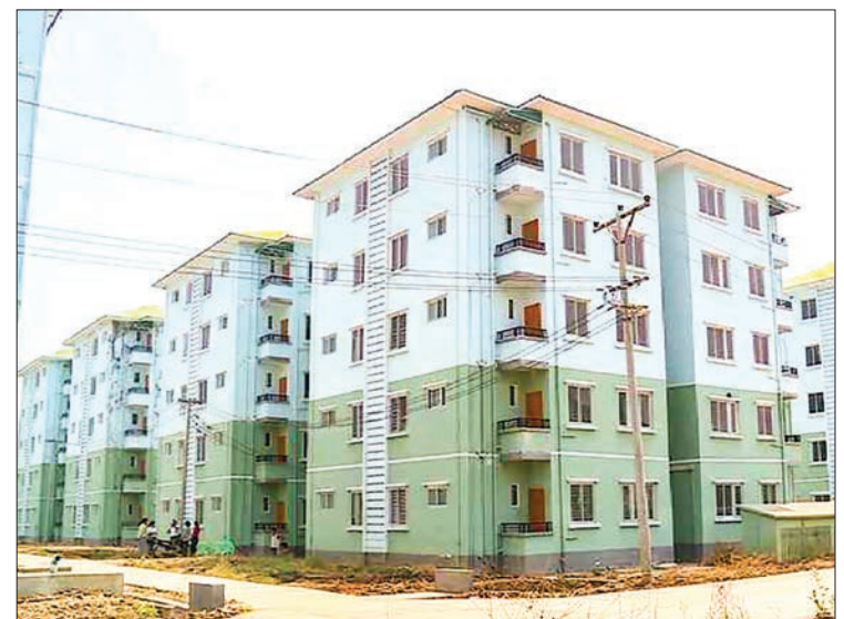
Photo shows the completion of construction of the affordable apartments in Nandawun Ward, Monywa, Sagaing Region.