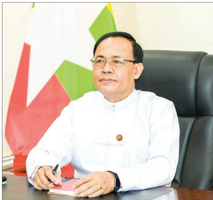
Union Minister U Kyaw Tin.

Union Minister: The benefits that have been gained from the exchange of such visits are namely: the consolidation of friendship between the leaders of the two countries, and the promotion and elevation of cooperation between the two countries. We also derived many other benefits for the country. At the ASEAN summit, we were able to arrange separate meetings for the State Counsellor to meet the leaders from countries such as China, United States and New Zealand. We were able to establish a new historic milestone for bilateral relations with Nepal by arranging the friendly visit of our President to Nepal in August 2018. This was the first time a civilian leader has made