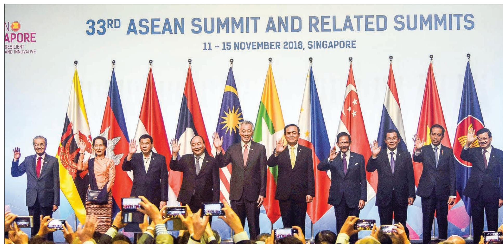
State Counsellor Daw Aung San Suu Kyi poses for a photo together with other ASEAN leaders at the 33 rd ASEAN Summit and related summits in Singapore, Nov. 2018

Union Minister: Our ministries have been practicing an "active and independent foreign policy" based the aspirations of the State and the "Five Principles of Peaceful Coexistence". Just as we have been practicing right after independence, we have been making concerted efforts to establish friendly relations with all countries of the world. We have been making efforts to consolidate our traditional friendly relations with our neighboring countries. At the same time we have worked to further enhance our friendly relations with countries in the region and countries far from us. We are also actively participating in the activities of regional organizations including ASEAN. We are working hard for