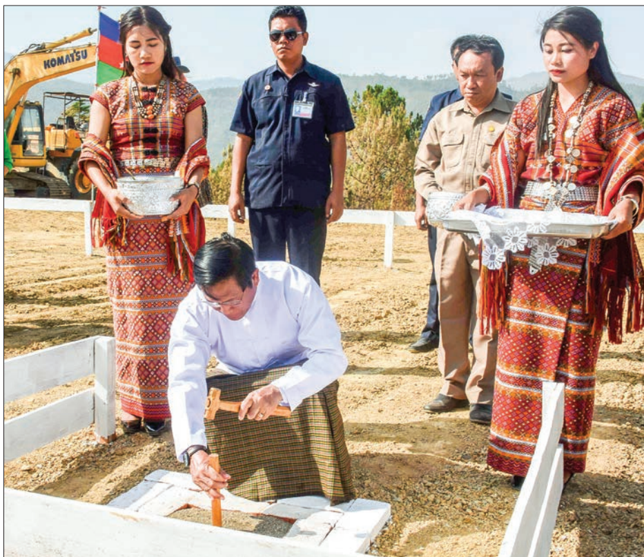
Vice President U Henry Van Thio drives a stake at the construction location for the administration office of the Sports and Physical Education Institute (Haka).