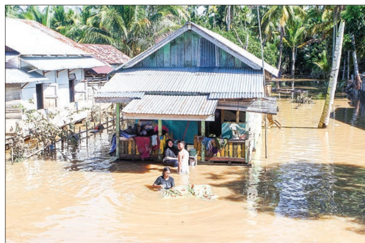
Residents try to dry out their belongings as their home sits surrounded by floodwaters in Bengkulu on the Indonesian island of Sumatra on 29 April 2019. Floods sparked by torrential rains have killed nearly 40 in Indonesia with a dozen more still missing, officials said on 29 April, marking the latest calamity for a disaster-prone nation.

Landslides and floods are common during the monsoon season between October and April, when rains lash the vast Southeast Asian archipelago.