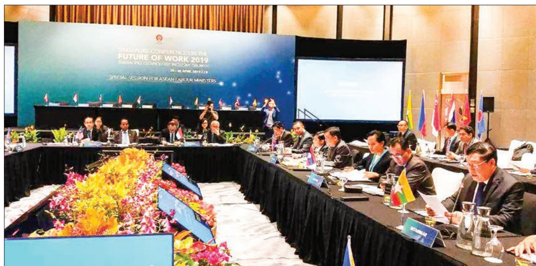
Union Minister U Thein Swe delivers the speech at the conference on the Future of Work 2019 held in Singapore.

UNION Minister for Labour, Immigration and Population U Thein Swe attended a conference titled "Future of Work 2019 Embracing Technology; Inclusive Growth" held in Singapore yesterday morning.