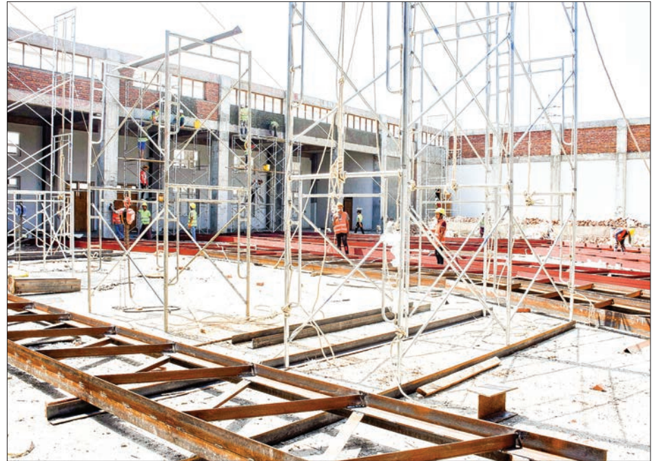
Vice President U Henry Van Thio inspects the construction site of a cyclone shelter in Haka, Chin State yesterday.

ON HIS trip to inspect regional development in Chin State, Vice President U Henry Van Thio met with Chin State Chief Minister Salai Lian Lwal, State Hluttaw Speaker U Zoe Bwe, Deputy Ministers Maj-Gen Than Htut and U Hla Maw Oo, state ministers, officials and local residents at the guesthouse of the Road Department in Thantlang.