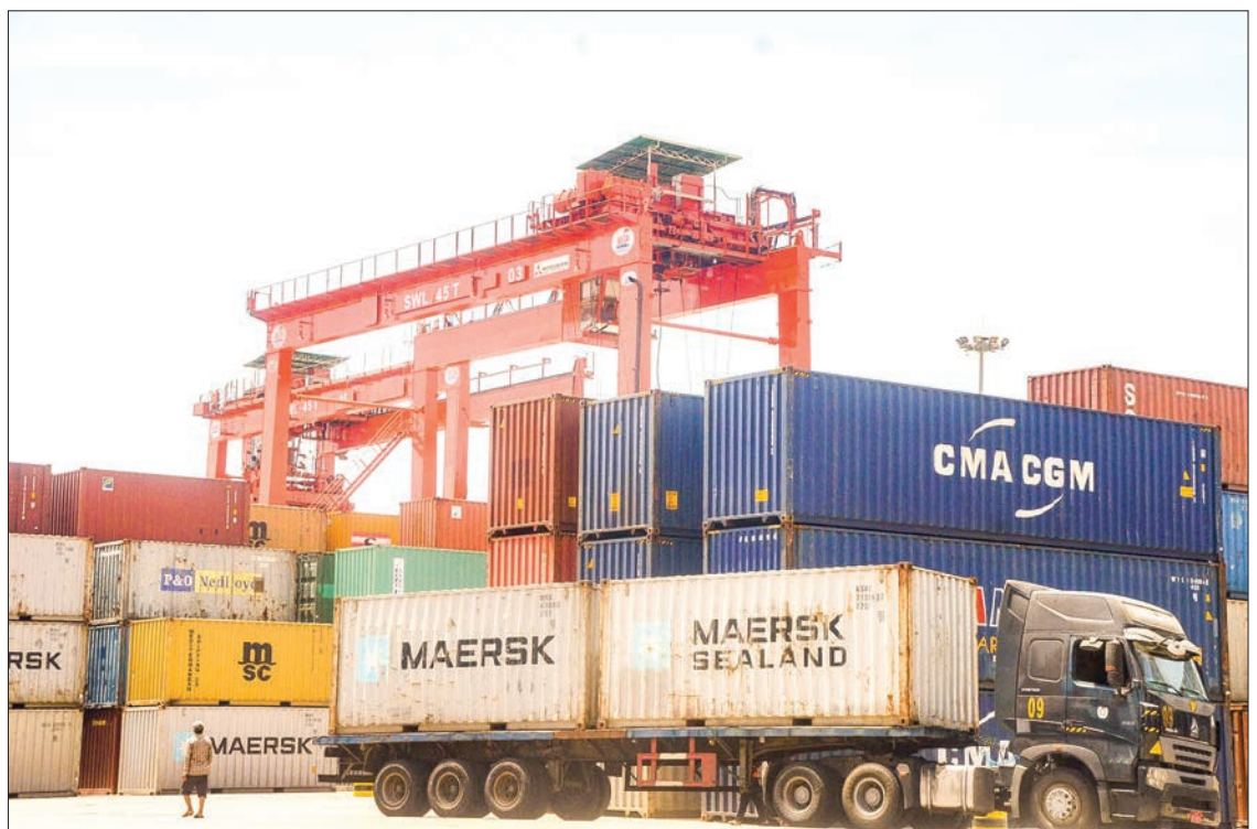
Containers are seen at Asia World Port Terminal in Yangon.

According to the Myanmar Investment Law, the Regions and