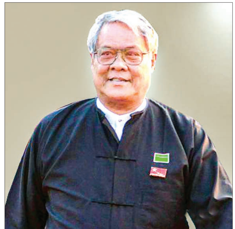
Chief Minister of Sagaing Region, Dr. Myint Naing.

We maintain our dams, lakes and reservoirs every year and repair them if necessary. There are 43 state-owned and 290 rural ones that provide irrigation to 730,000 acres of monsoon crops and summer crops and 890,000