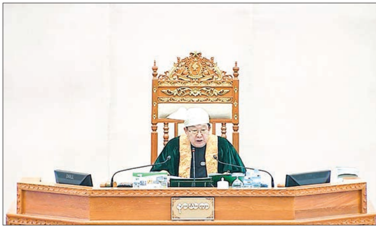
Pyidaungsu Hluttaw Speaker U T Khun Myat.

This 12 th regular session will see much more works than the