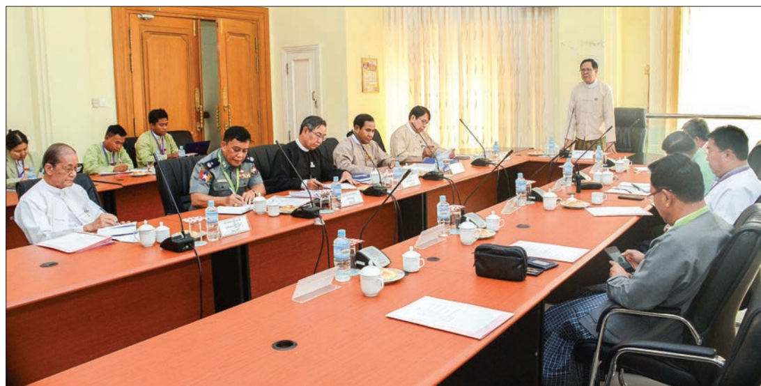
Chairman U Aye Tha Aung delivers the speech at the second coordination meeting of the Committee for Supporting Peace and Stability in Rakhine State Peace in Nay Pyi Taw.

THE Committee for Supporting Peace and Stability in Rakhine State Peace held its second coordination meeting at the Hluttaw Building in Nay Pyi Taw yesterday.