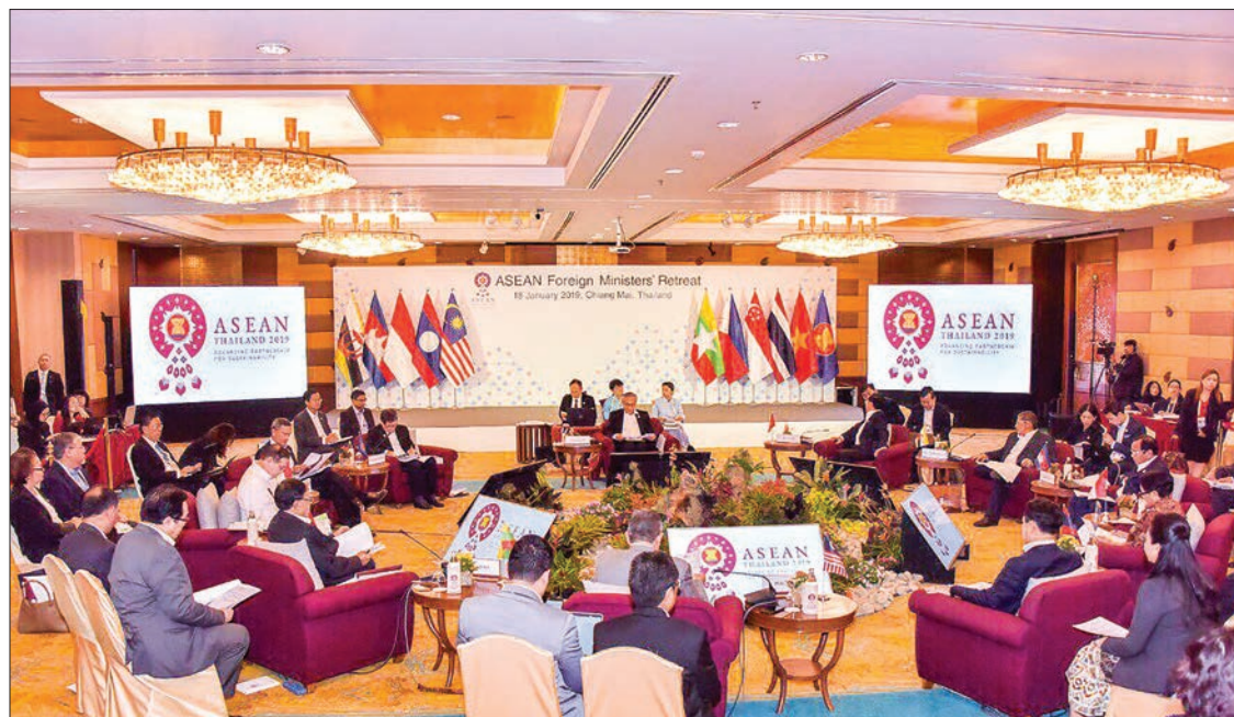
Union Minister for International Cooperation U Kyaw Tin attends the ASEAN Foreign Ministers' Retreat in Chiang Mai, Thailand, Jan. 18, 2019.