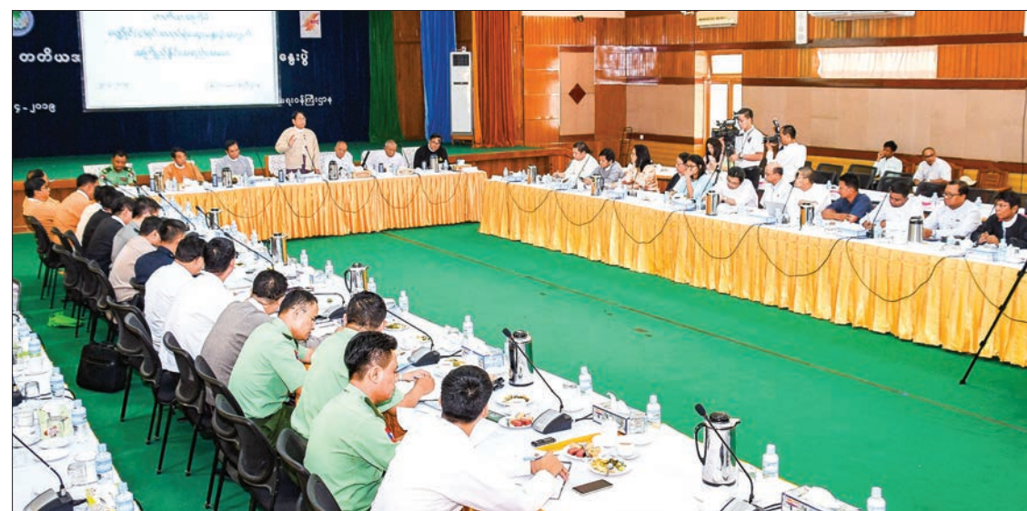
Union Minister for Information, Dr. Pe Myint, addresses the coordination meeting on media development held at the MoI building in Nay Pyi Taw.