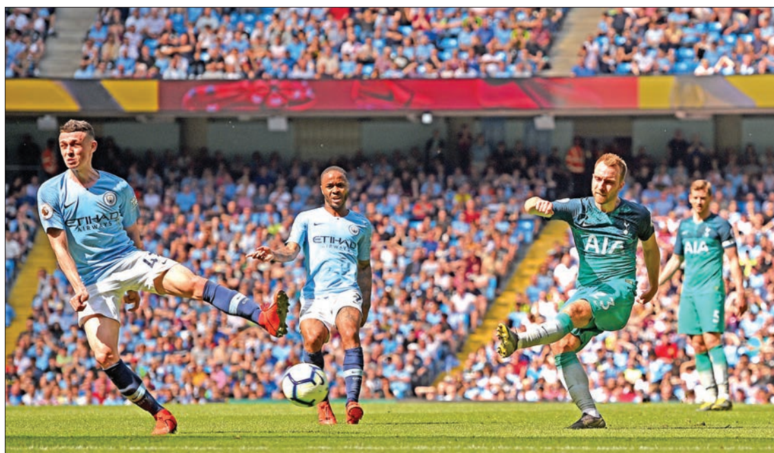
Tottenham Hotspur's Danish midfielder Christian Eriksen (R) takes a shot during the English Premier League football match between Manchester City and Tottenham Hotspur at the Etihad Stadium in Manchester, north west England, on 20 April, 2019.

"We have to behave like a big club for sure. We need to be a re-