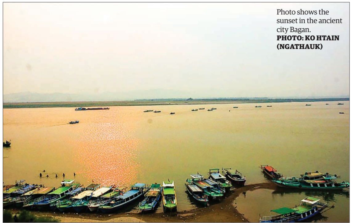
Photo shows the sunset in the ancient city Bagan.

International travelers enjoy the sunset, and they also take pictures of sunset by riding sunset boat cruises on Ayeyarwaddy River. Many visitors thronged to