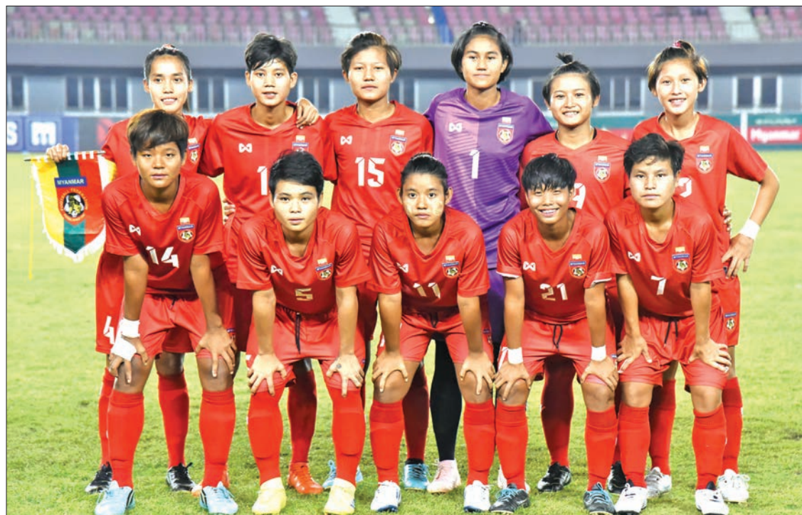
Myanmar U-19 Women's team.