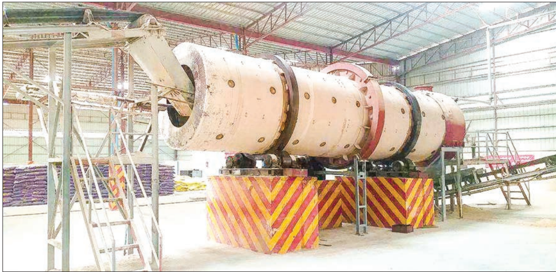
Asphalt mixing plant in Sagaing Region.