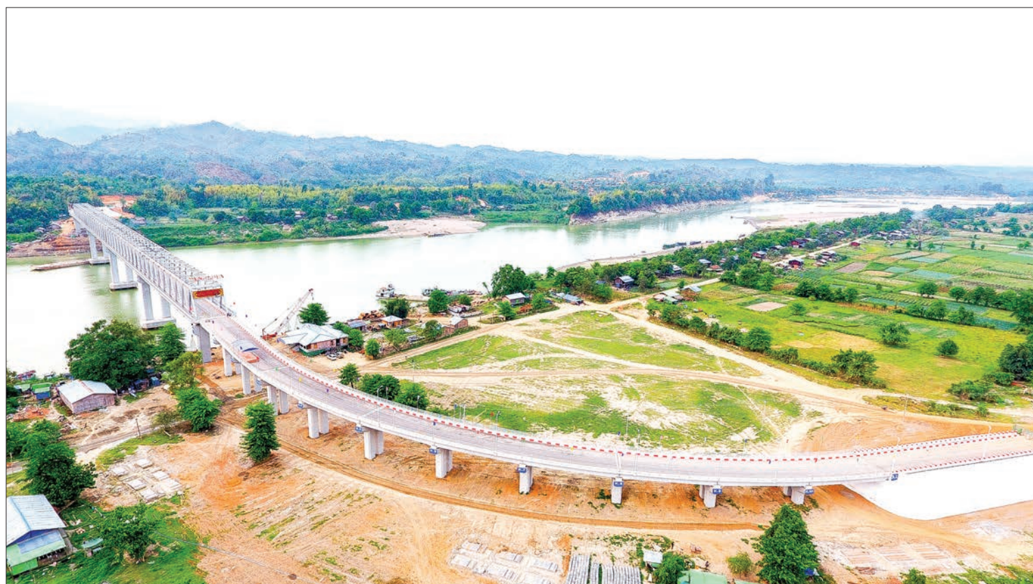
An aerial view of the bridge across the Chindwin River in Khamti.

A: We've converted Tamu, Mingin, Kalewa townships and 1,392 villages from the transmission line system to a converting distribution system in three years.