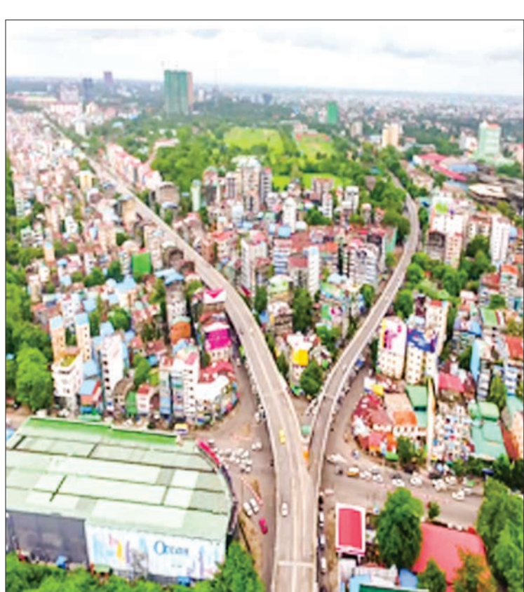
Bird's eye view of the construction of Hledan flyover in Yangon.

a little help from technology, improvements are being made so not all the responsibility falls on the police. For example, there are traffic control centers which allows the police to monitor CCTVs from their common center. There are efforts to upgrade Yangon to become a Smart City. For example, in Dagon Lay Township, we are trying to lay out new concrete roads as much as the budget allows. There are also plans to build more roads and bridges if our new budget gets approved. The main objectives of these initiatives are to preserve our history in older buildings, keeping Yangon green while trying to elevate Yangon as an economic hub. For instance, the secretariat is currently under renovation. With the help of the Yangon City Heritage Trust, there has been around 28 buildings that got preserved and are branded a historical building that can't be demolished or modified without approval.