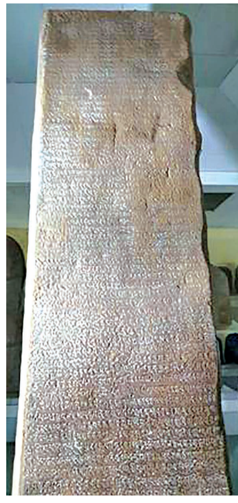
Anandachandra Stone Inscription.

Meanwhile, post-graduate diploma courses in library man-