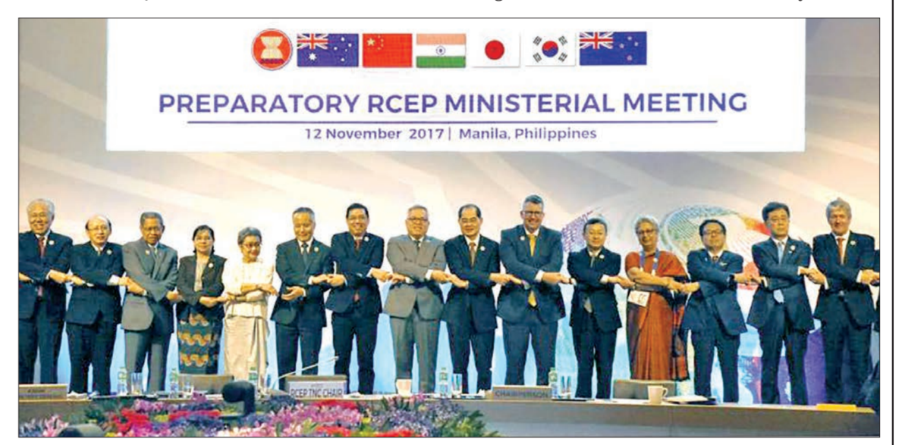
Ministers in charge of the China-led Regional Comprehensive Economic Partnership trade framework attend a preparatory meeting in November, 2017 in Manila.

The China-Europe rail service is considered a significant part of the Belt and Road Initiative, and is expected to boost trade between China and Europe, China's largest trading partner. —Xinhua