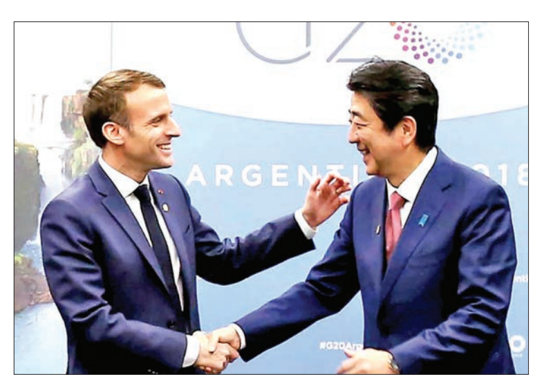
French President Emmanuel Macron (L) and Japanese Prime Minister Shinzo Abe shake hands on the sidelines of the G20 Leaders' Summit in Buenos Aires, Argentina, on 30 November, 2018.

"I hope that the G-20 will send out a strong message that we will be united" to promote free trade and tackle global issues such as climate change.