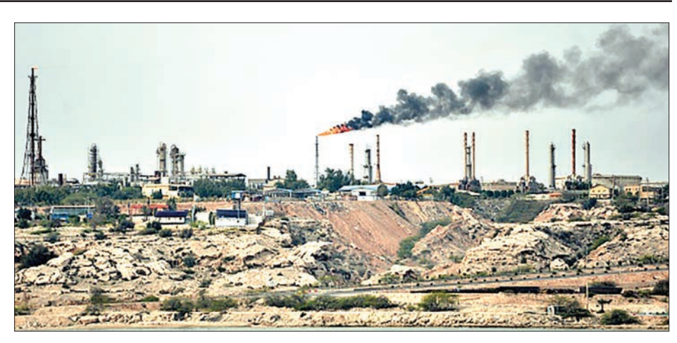
An oil facility in the Khark Island in Iran. PHOTO AFP

States announced the end of sanctions waivers for importers of Iranian oil on 2 May as part of its strategy to pressure Tehran to end its nuclear programs and what it has been describing as Iran's "malign behavior."—AFP