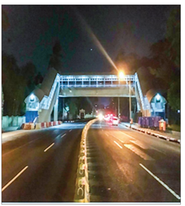
Photo shows the under-construction flyover at Myaynigone in Yangon.