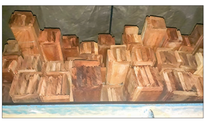
Illegal lumber seized being seen in Myawady, Kayin State.