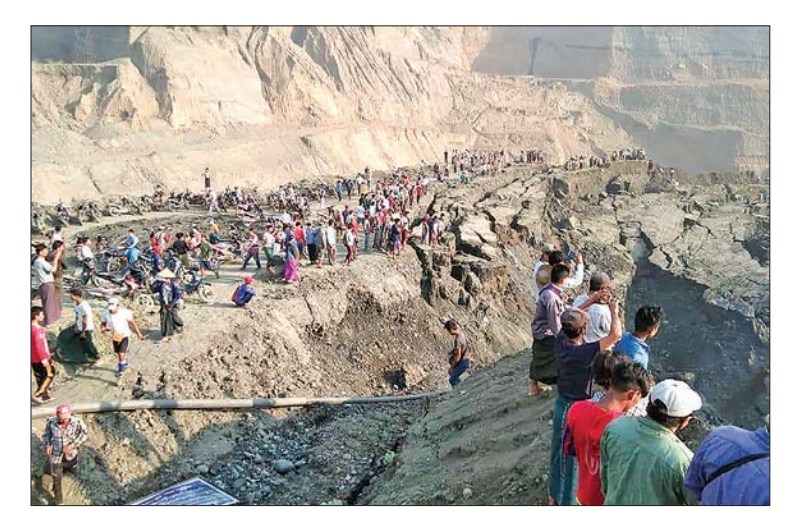
Rescue workers search for the bodies of miners killed in a landslide in Phakant, Kachin State.