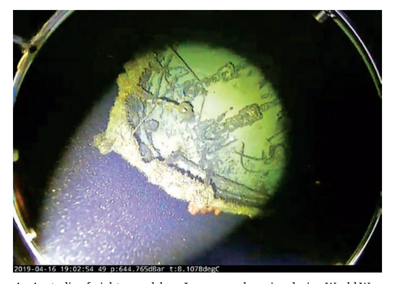
An Australian freighter sunk by a Japanese submarine during World War II was located by Australian researchers after being lost for 77 years, the Commonwealth Scientific and Industrial Research Organization said Tuesday.

searchers after being lost for 77 years, the Commonwealth Scientific and Industrial Research Organization said Tuesday. The