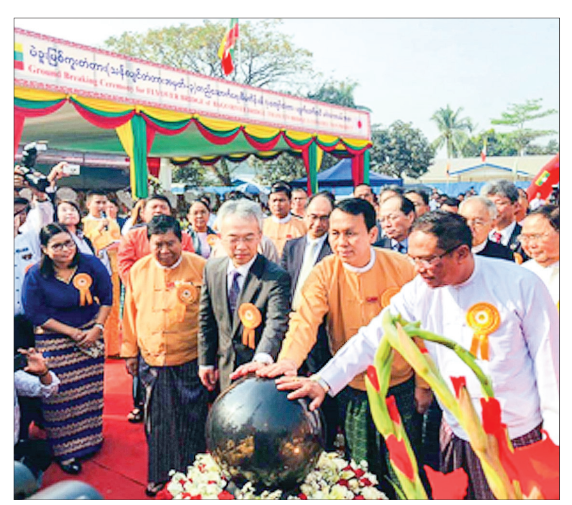
Yangon Region Chief Minister U Phyo Min Thein and officials open the stake driving ceremony of No.3 Thanlyin Bridge (Bago river-crossing bridge) in Yangon.

We are aiming for trash-free public places. Right now, we are clearing up the mountains of trash that has accumulated over the past decade.