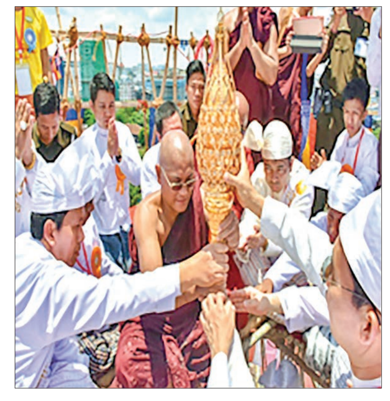
The ceremony to fix diamond orb atop the Kyaik-de-att Pagoda held in Botahtaung.

Access to clean and safe water is important for our residents. The main concern is distribution which Yangon City Development Committee in charge of. We are currently using groundwater to supply the city as well as the water pumped from the streams and rivers. The reliant on groundwater is risky as if we are not careful, seawater can get into the ground water A: sources or we simply run out of ground water. So the