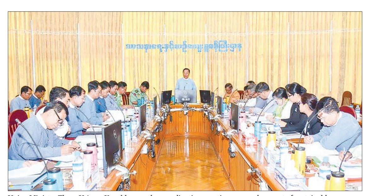
Union Minister Thura U Aung Ko addresses the coordination meeting on envelopment of sustainable economic benefit over entire Bagan region in Nay Pyi Taw yesterday.

At the meeting, Union Minister Thura U Aung Ko said discussion and decision on whether Bagan cultural heritage zone would be included in the World Heritage list will be made at the 43rd session of the World Heritage Committee held in Baku, Azerbaijan from 30 June to 10 July 2019. Meeting attending departmental officials need to discuss and suggest on envelopment of sustainable economic benefit over entire Bagan zone and preventing effect on the historical heritage, according to the framework submitted to UNESCO, matters beneficial to