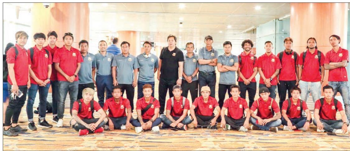
Football players of Shan United FC, together with the team's managers and coaches pose for a group photo at the Yangon International Airport before leaving for Viet Nam.

SHAN United FC left for Viet Nam yesterday to play their fourth match in the group stage of 2019 AFC Cup on 16 April in Viet Nam.