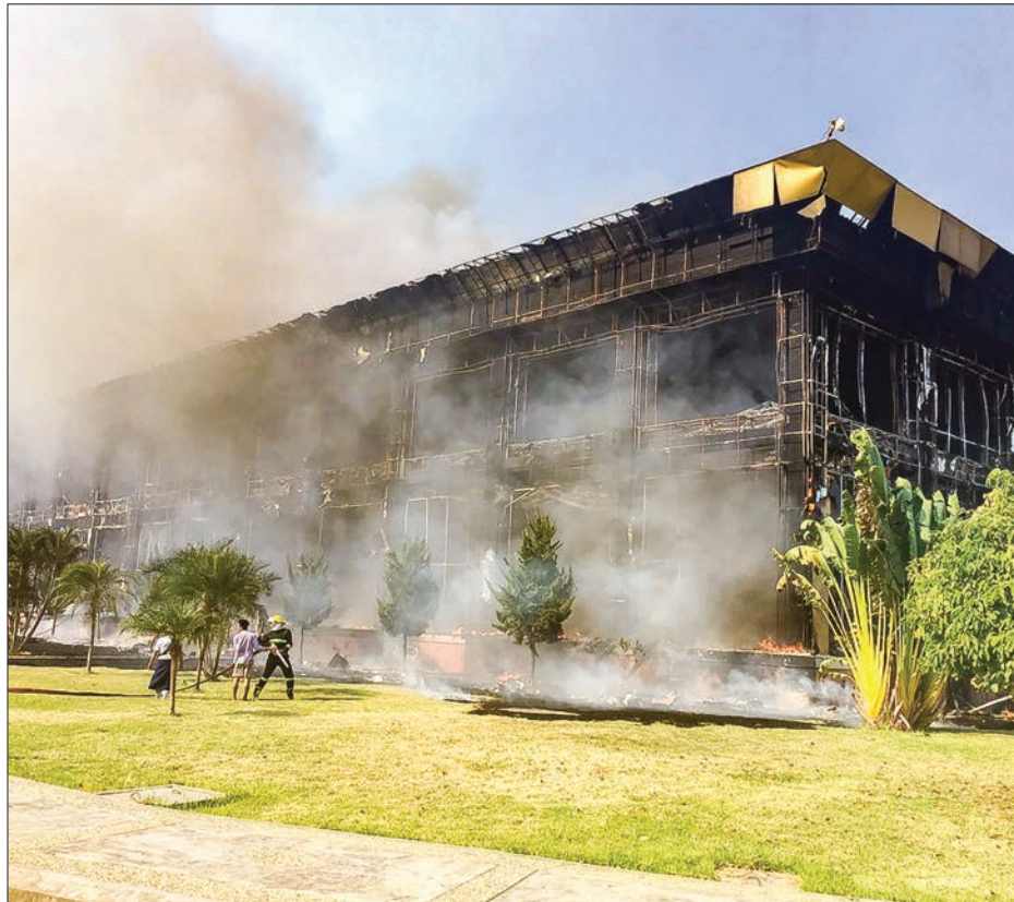
The shopping mall fire in Nay Pyi Taw yesterday leaves two injuries.