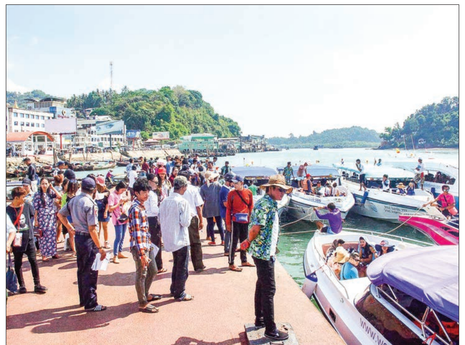
Holiday makers gather in Kawthoung to go to islands for recreation during Thingyan holidays.