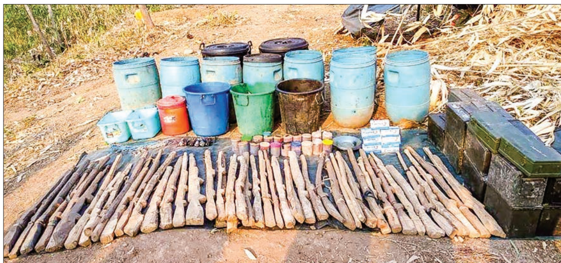
The photo shows the munitions belonging to AA group seized by Tatmadaw columns.

TATMADAW columns captured training grounds and camps of the AA group and also seized munitions belonging to the group last week, according to a statement from the military.