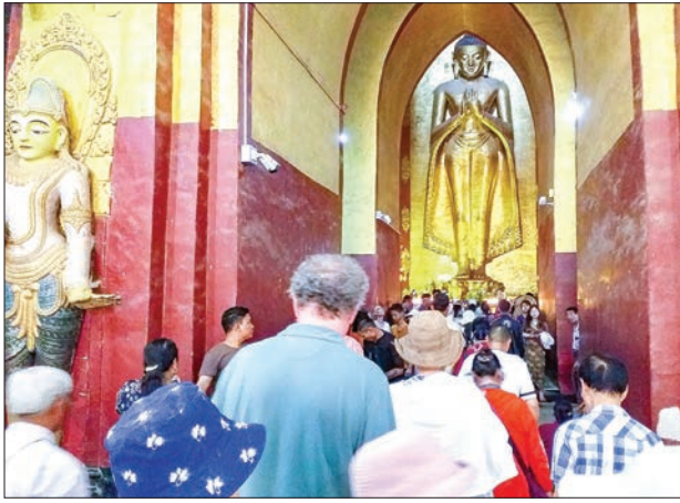
Local and foreign visitors throng into the Ananda pagoda in Bagan on second day of Thingyan Festival yesterday.