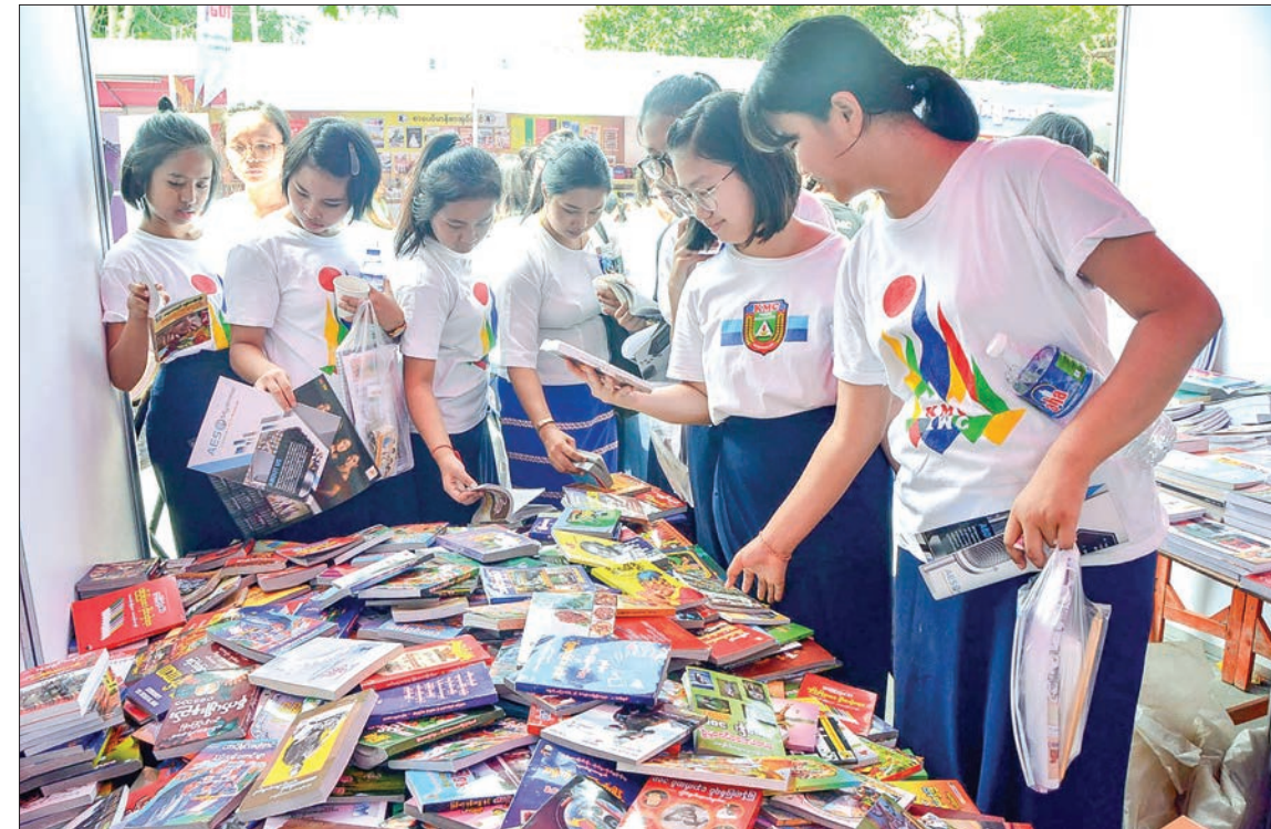
School children choose books at the the All Round Development of Youth Festival in Mandalay on 14 August, 2018.

Book Clubs were formed in 127 IPRD district and township offices with books and literary enthusiasts and were conducting reading circles, literary discussions and book reviews all over the country. 323 such events were held up to 2018.