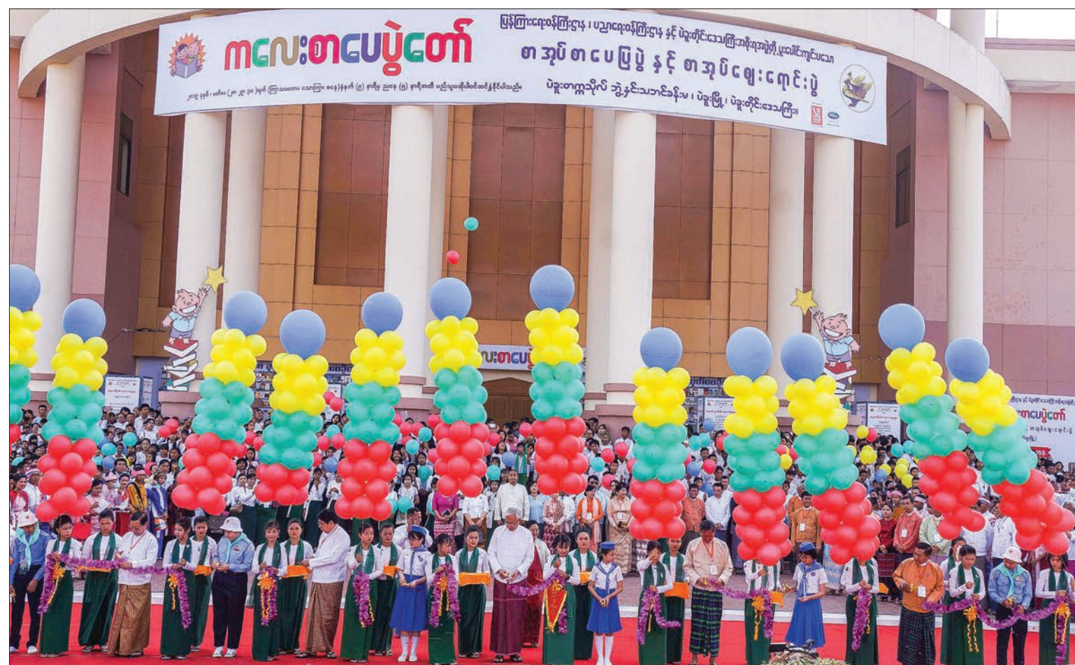
Former President U Htin Kyaw, Union Minister for Information Dr. Pe Myint and dignitaries formally open the Children's Literary Festival in Bago on 28 March, 2019.

As success and challenges comes together, the spirit of "IPRD for the people" together with relentless efforts, mindset and goodwill overcome the challenges and achieved good results. The people can see the efforts of IPRD in the three year period of the second five year term of a democratic government and its works and progress will be shown.