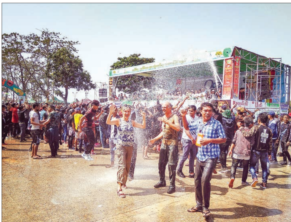
Foreigners happily participate in the Thingyan festival in Patheingyi Town.