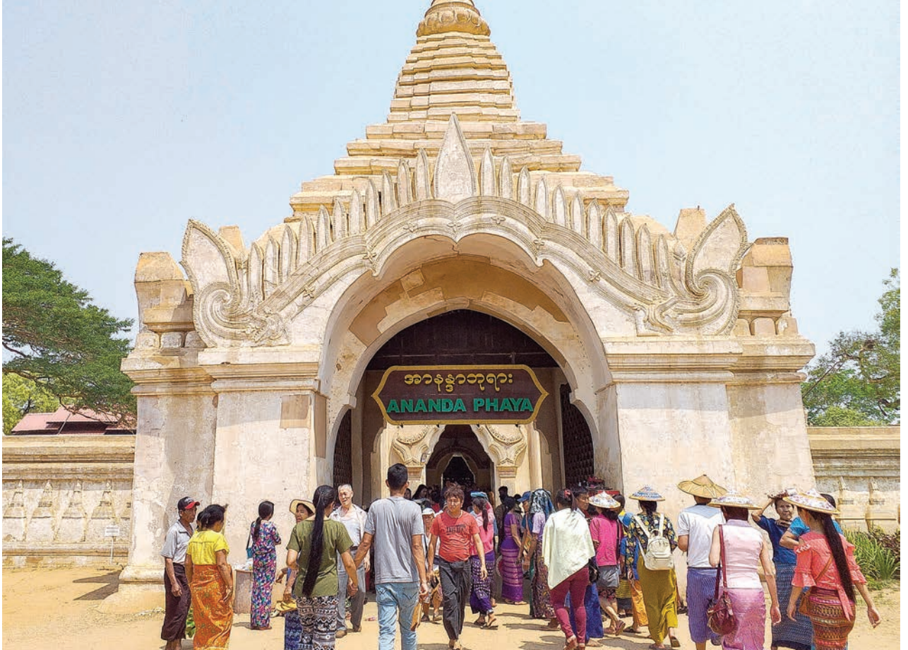
People flock to pagodas in Bagan for Thingyan holidays which started on 13 April and end on 16 April.