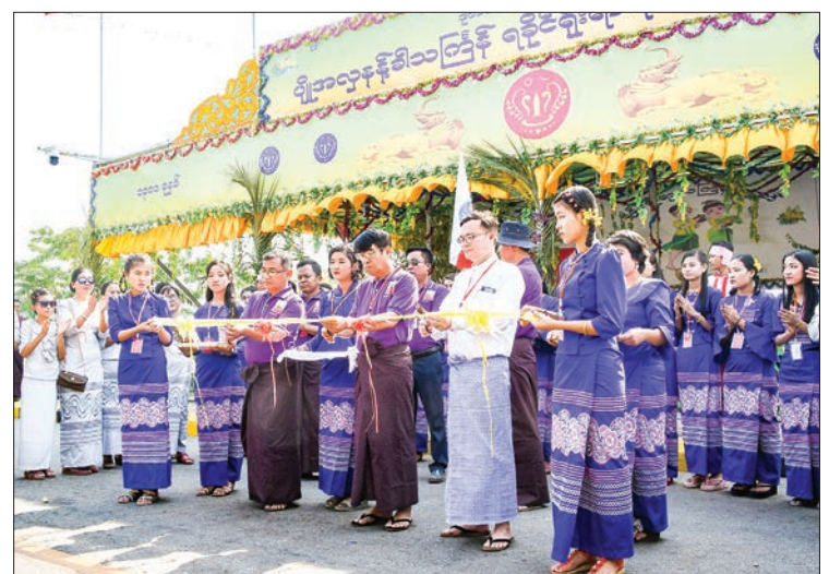
Officials open the traditional Rakhine pandal in Nay Pyi Taw.