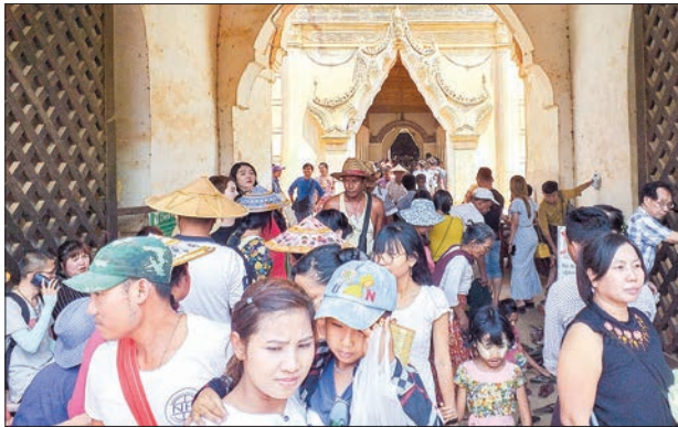
Ananna Temple in Bagan is crowded with people in the second day of Thingyan.