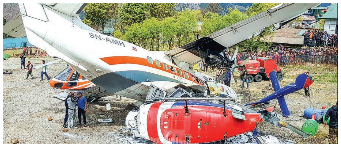
A Summit Air Let L-410 Turbolet aircraft (l) bound for Kathmandu is seen after it hit two helicopters during take off at Lukla airport, the main gateway to the Everest region. A small plane veered off the runway and hit two helicopters while taking off near Mount Everest on 14 April, killing three people and injuring three, officials said.

KATHMANDU (Nepal)—A small plane veered off the runway and hit two helicopters while taking off near Mount Everest on Sunday, killing three people and injuring three, officials said.