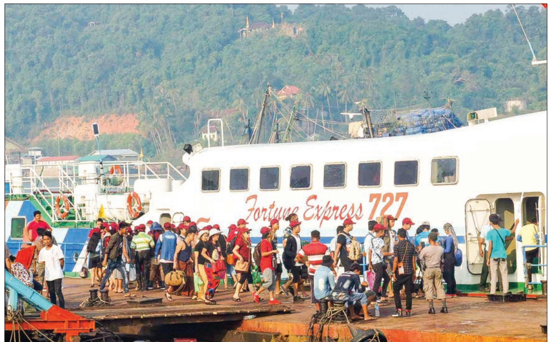
Travellers visiting the popular islands in Myeik.

Speedboats and air-conditioned boats are also available during the Thingyan Eve, they said. Many devotees from near and far are visiting the town and taking the small boats to Pahtet Island to pay homage to the Reclining Buddha image. Travel