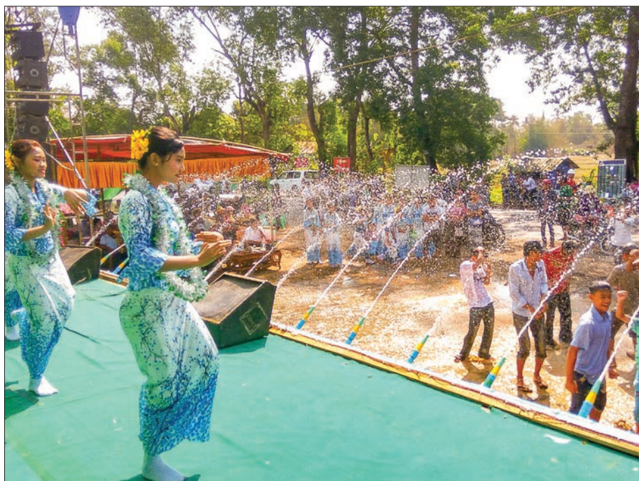
A dance troupe performs Thingyan Dance on the second day of Thingyan Festival Kangyidaung in Ayeyawady Region yesterday.