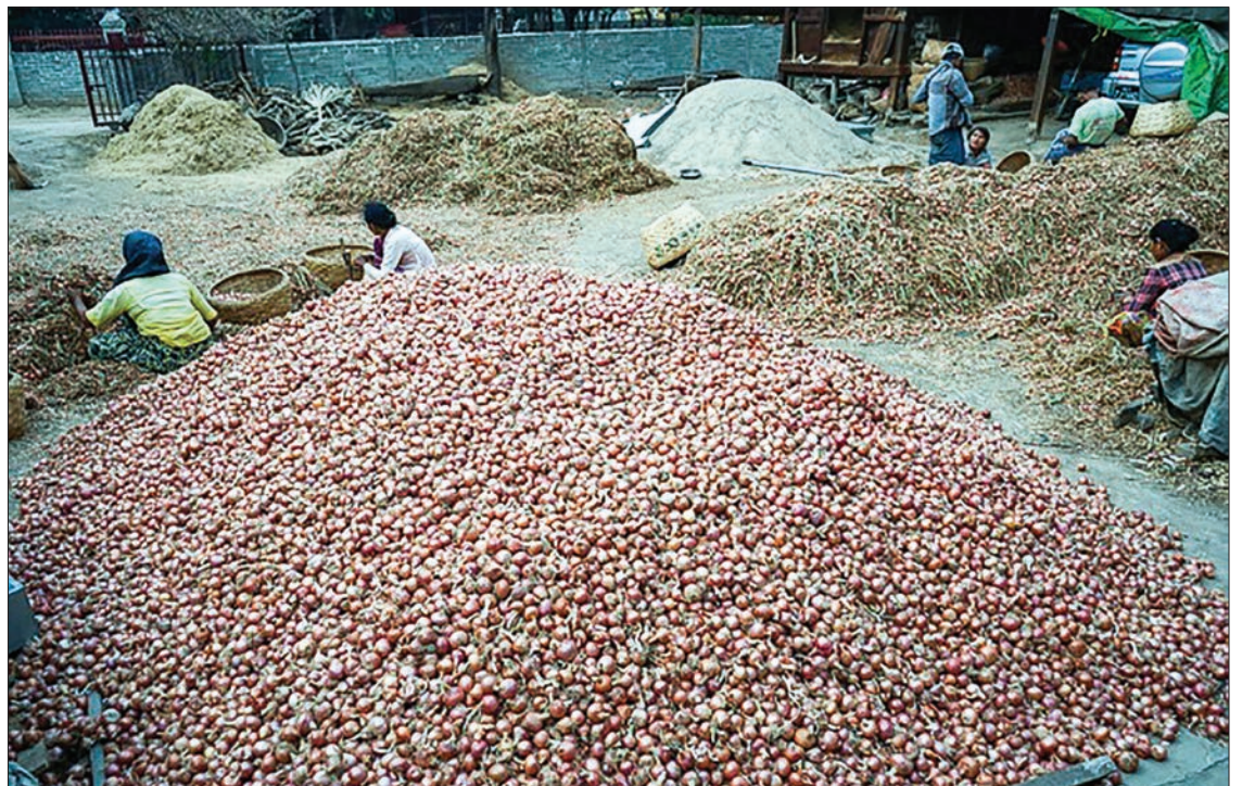
Onion growers prepare their produce to sell in local markets.

Growers in Kyaukse Township cultivate not only onions, but also other seasonal crops, such as chilli, banana, sesame, and turmeric, on a commercial scale. Onion is one of Myanmar's export items, and the