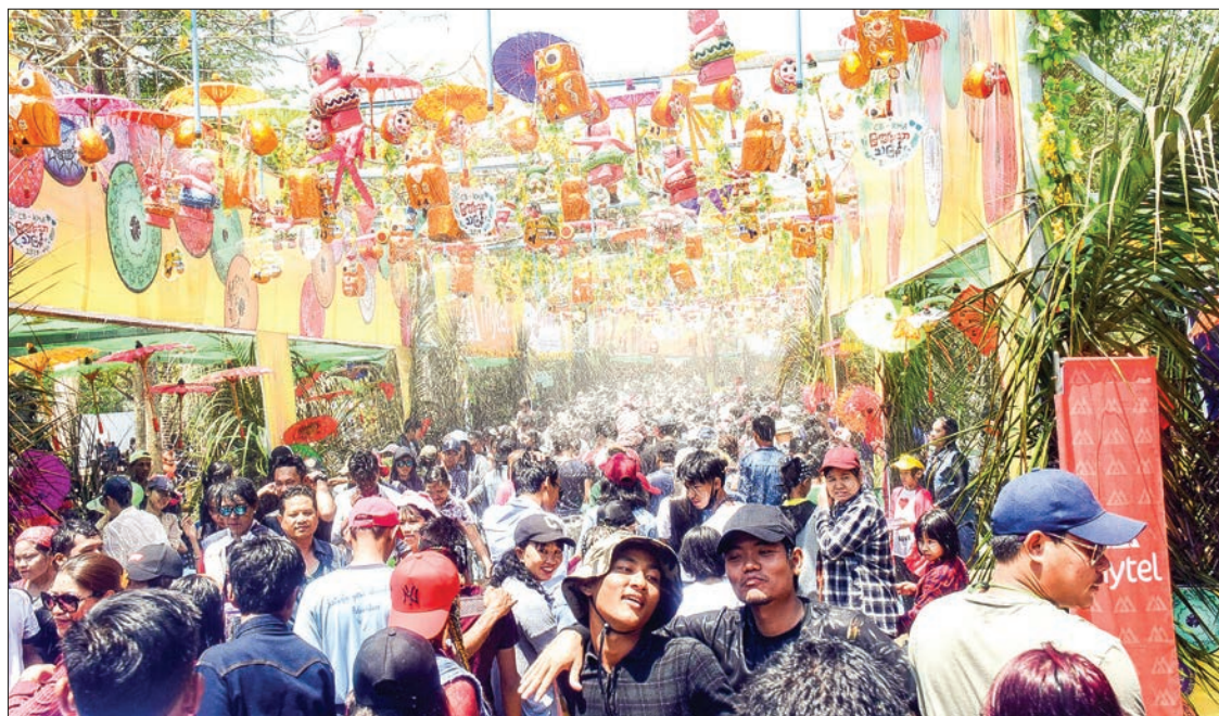
Revellers take part in foam party in the Maha Bandoola Park Road in Yangon.