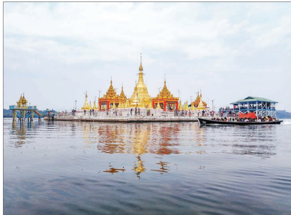
A group of pilgrims arrive Indawgyi yesterday to visit the Shwemyinzu Pagoda built in middle of the Indawgyi Lake in Moehnyin Township.

THE Shwemyinzu Pagoda, located in the middle of the lake in Indawgyi, Moehnyin Township, was crowded with visitors from across the country on the first and second days of the Thingyan Festival.