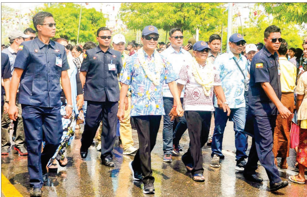
Vice President U Henry Van Thio takes part in Mandalay Thingyan Festival.