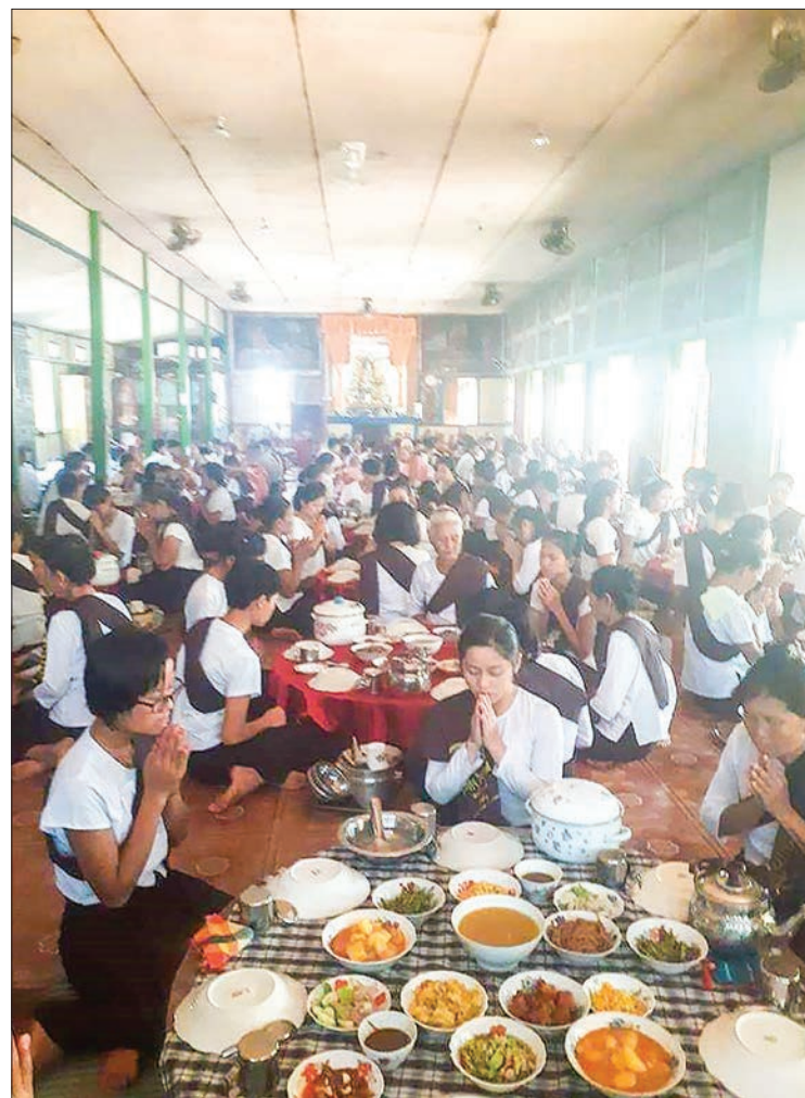
Women pray for donors before enjoying the charity food at the Arlawka Yama meditation centre in Kamamaung Township, Kayin State.