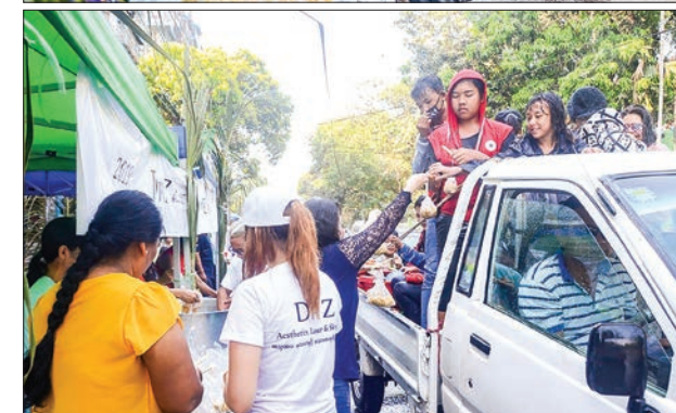
Donors distribute charity food to the revellers on a vehicle in Yangon yesterday.

ship. While there weren't any large pandals, the small family set-ups were everywhere and revellers