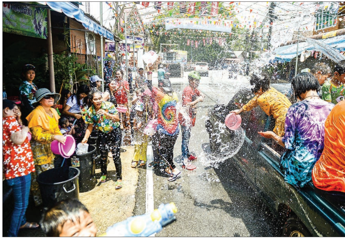
Water fights break out during the new year festival that bring entire streets to a standstill.

In the Bangkok tourist hotspot Khao San road, two young men dressed in school uniforms get doused by passersby wield-