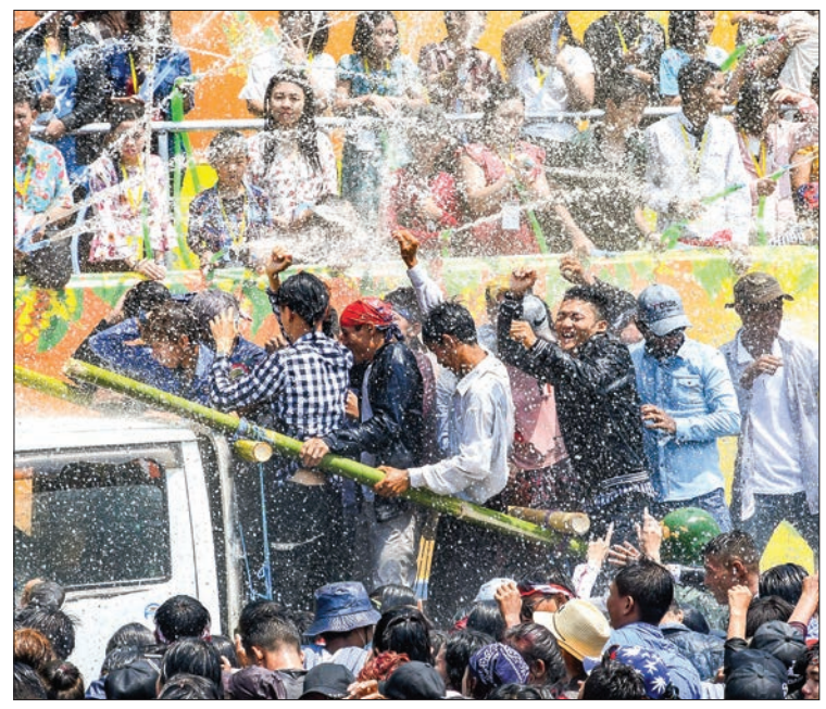
Revellers on a vehicle are sprayed with water during celebrations for the Thingyan festival in Nay Pyi Taw yesterday

AS THE year 1380 of the Myanmar Era crosses over to 1381, the second day of the traditional Thingyan Festival (called a-kyā nei) was celebrated all over the country yesterday.