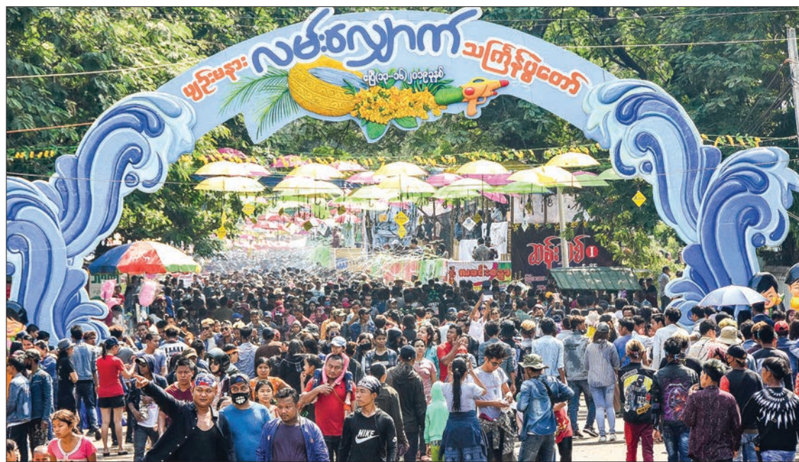
Revellers participate in the splash walk Thingyan in Pinyinmana.