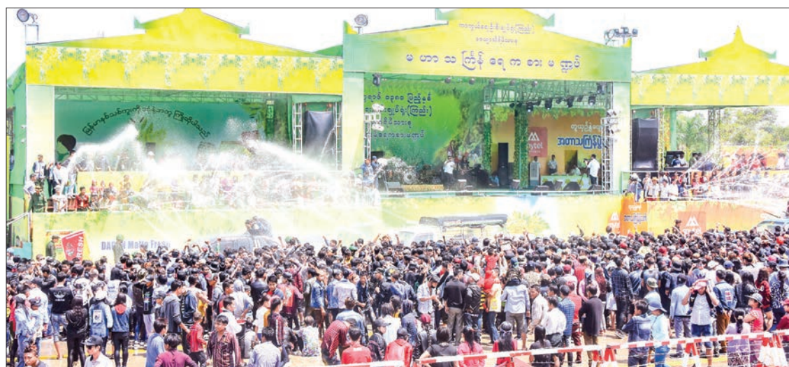
Thingyan lovers enjoy splashing water in front of the Commander-in-Chief (Army) pandal in Nay Pyi Taw.