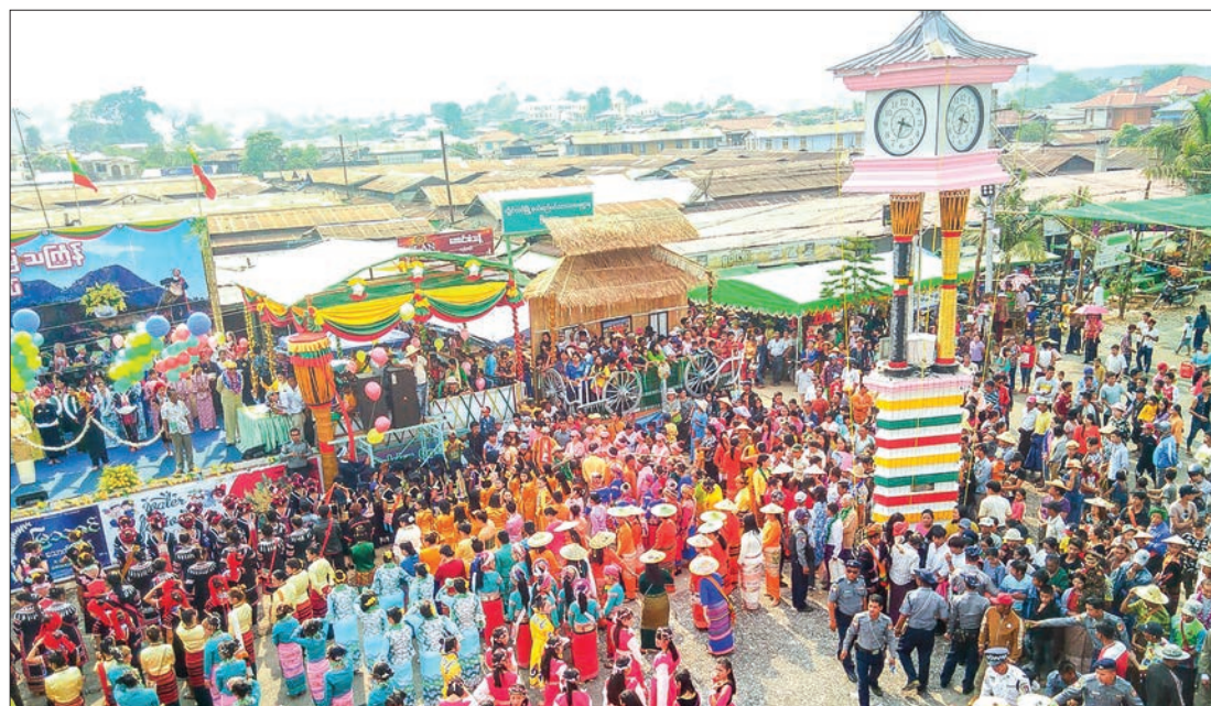
People celebrate on the opening of the Clock Tower in Loilem.

"Loilem is small, but it is a cool and lovely town with natural beauty. The new Clock Tower is believed to be a symbol of the town and a part of the tourist sites in the town," said one of the residents. Located in the south of the larger Shan State, Loilem District is situated over 4,000 feet above the sea level. According to the 2014 nationwide census, the district has a population of 565,000.—Loilem Moe / (Translated by Khaing Thanda Lwin)