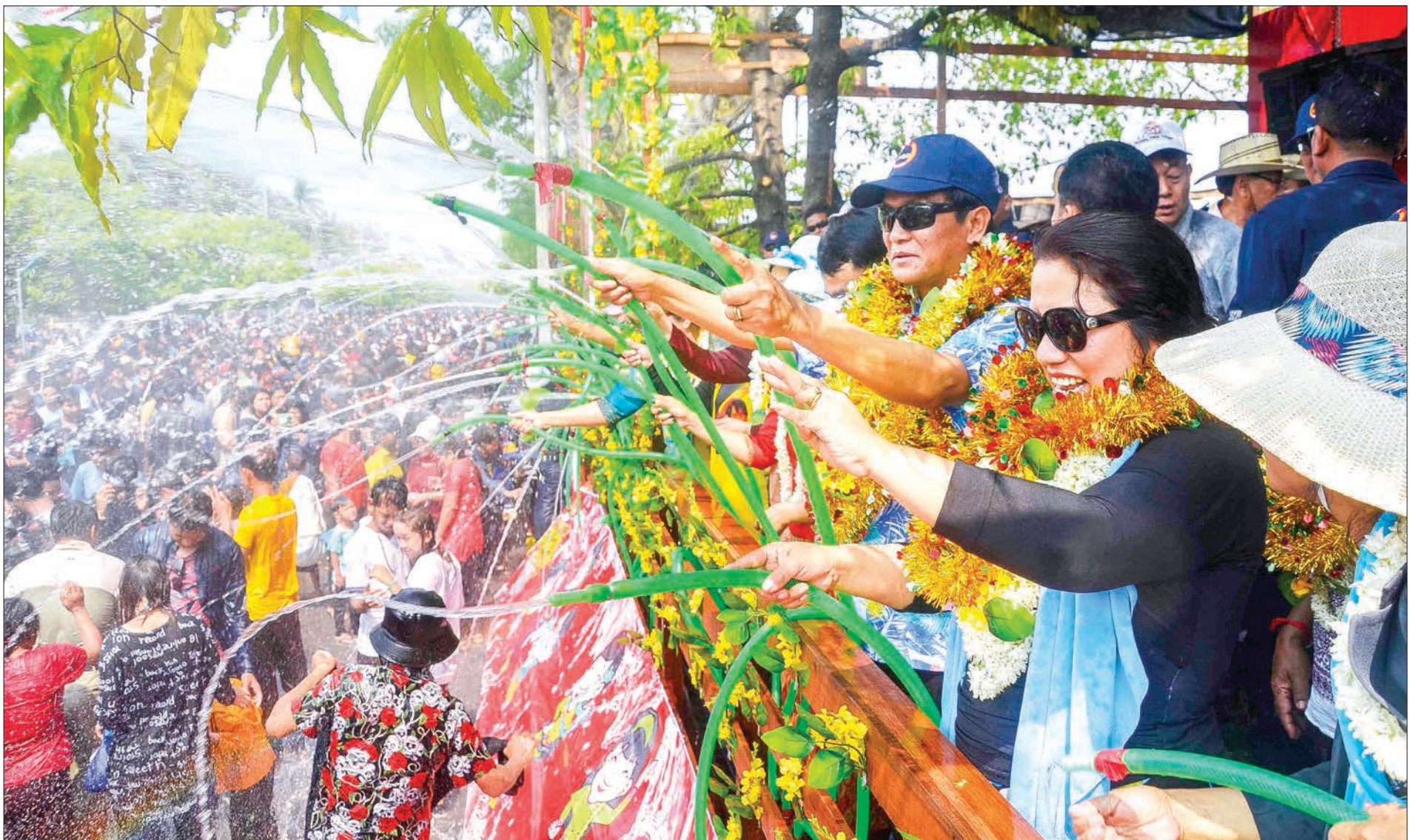
Vice President U Henry Van Thio and wife Dr. Shwe Hlwan splashing water on revellers in Mandalay yesterday.

Vice President U Henry Van Thio and his wife, Dr. Shwe Hlwan, participated in the Myanmar traditional Thingyan Festival yesterday.