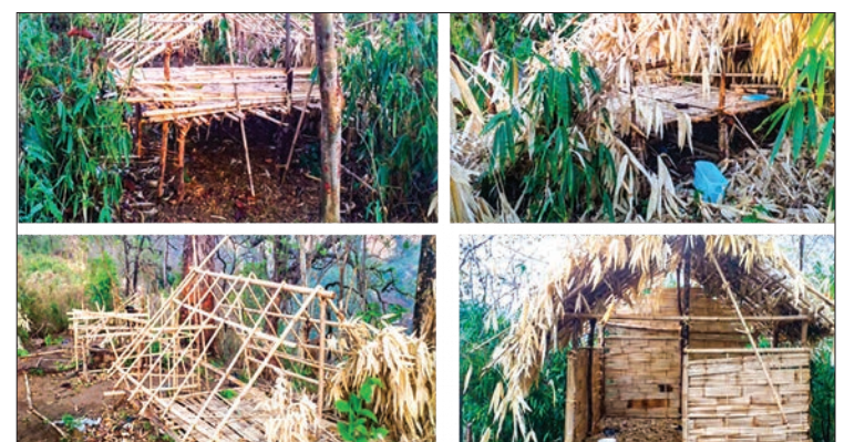
The munitions including IEDs and the temporary training camps of AA group in MraukU Township, Rakhine State.