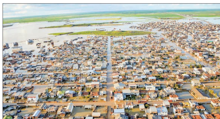
The floods have caused immense damage with homes, roads, infrastructure and agriculture all hit.

“More than 14,000 kilometres (8,700 miles) of roads have been damaged,” transport minister Mohammad Eslami told parliament, according to the official IRNA news agency. He added that “725 bridges have been totally destroyed.” The head of Iran’s meteorology service told the same parliamentary session that the floods do not necessarily mean that a decades-long drought has ended. —AFP ■