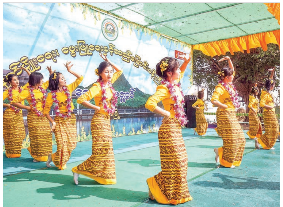
Dancers performing at the pandal of Ministry of Agriculture, Livestock and Irrigation in Hpa-an Town yesterday.