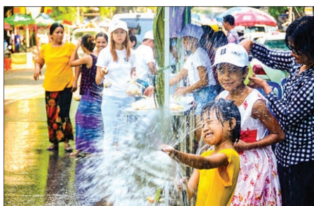
Children are splashing water at a pandal in Kyuntaw Street in Sanchaung Township.

THE central pandal in front of Yangon City Hall yesterday was packed with revellers playing with water and looking on as their favourite artistes performed and signing competitions were held. They also strolled through the splashwalk in Maha Bandoon Park nearby. Pandals lined up on Pyay Road were packed with people on cars or walking on foot getting drenched and dancing to the music. Yangonites also strolled through the splashwalks on Inya Lake, Inya Road, and Mya Kyun Thar.