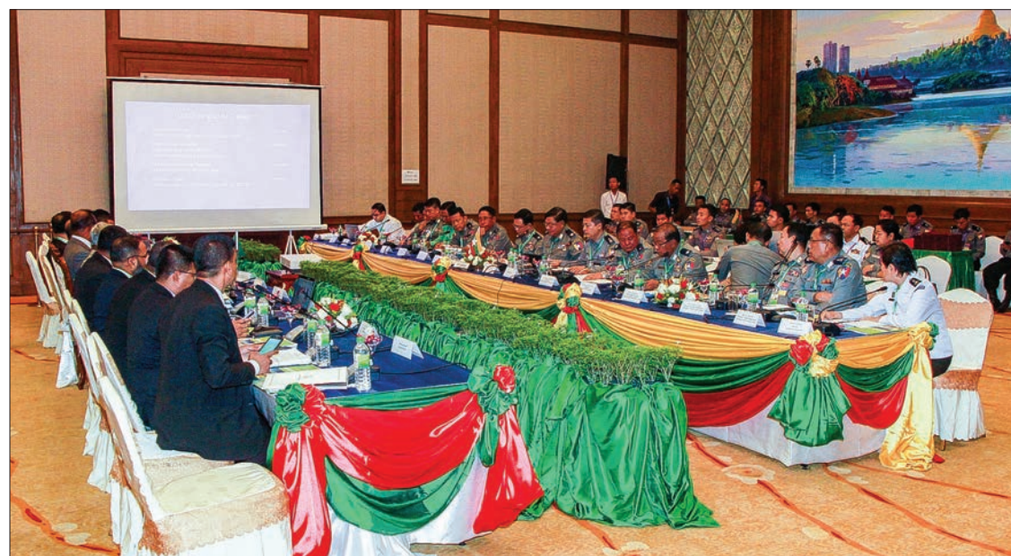
The six meeting of senior officials between two border forces of Myanmar and Bangladesh held in Nay Pyi Taw yesterday.