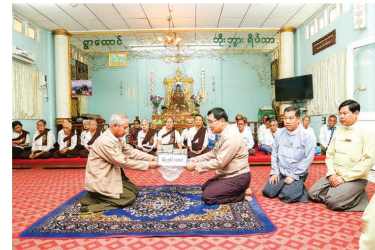
Union Minister for Social Welfare, Relief and Resettlement Dr. Win Myat Aye provides cash assistance to elderlies.

Cash assistance are also provided to (622) pregnant