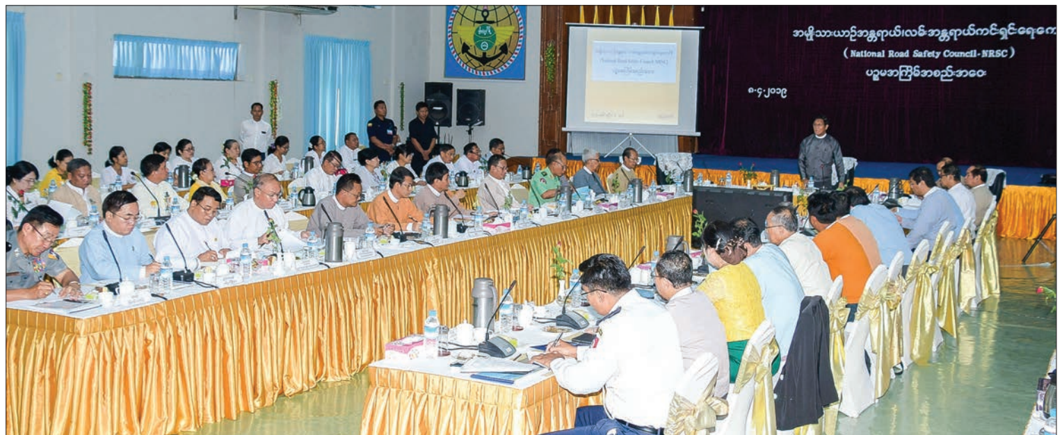
Vice President U Henry Van Thio addresses the fifth meeting of the National Road Safety Council in Nay Pyi Taw.

The Vice President said motorcycle accidents encompass 49 per cent of all traffic accidents in 2018 with 2,376 deaths and 12,985 casualties. He said the NRSC's fourth meeting discussed how to reduce the high death rate from motorcycle accidents, which