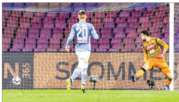
Napoli's Greek goalkeeper Orestis Karnezis (R) fails to stop an equalizer during the Italian Serie A football match Napoli vs Genoa on 7 April, 2019 at the San Paolo stadium in Naples.

MILAN, (Italy)—Napoli drew 1-1 with ten-man Genoa on Sunday to ensure that Juventus will have to wait another week to seal an eighth consecutive Serie A title.