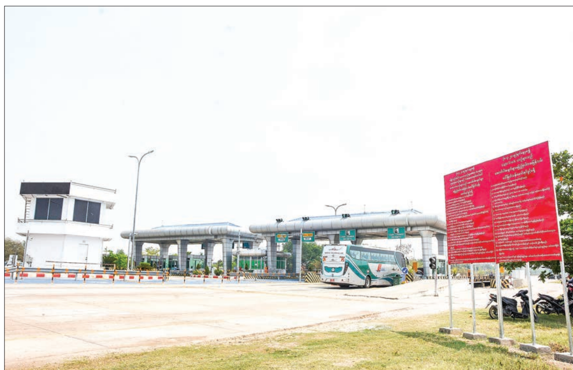
An express bus passes toll gate at the 115-mile Terminal, on Yangon-Mandalay express way.