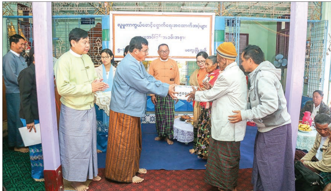
Deputy Minister U Soe Aung provides cash assistance to aged persons in Magway on 7 January 2019.

The disaster management committees were also formed at regions, states, self-administered regions and zones, districts, townships, wards and villages, and that the rehabilitation tasks were carried out in momentum in 2018.