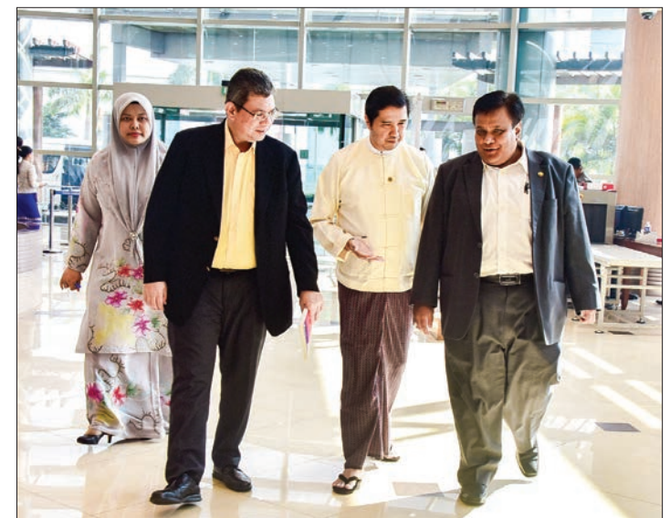
Malaysia Minister for Foreign Affairs Dato' Saifuddin Abdullah seen off at Yangon International Airport by officials yesterday.

A delegation led by Malaysia Minister for Foreign Affairs Dato' Saifuddin Abdullah, departed from Yangon yesterday afternoon.