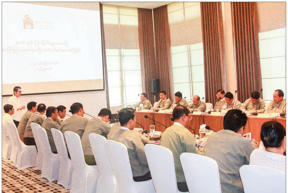
UEC Chairman U Hla Thein attends the meeting for the final report of the 2018 byelections in Nay Pyi Taw yesterday.