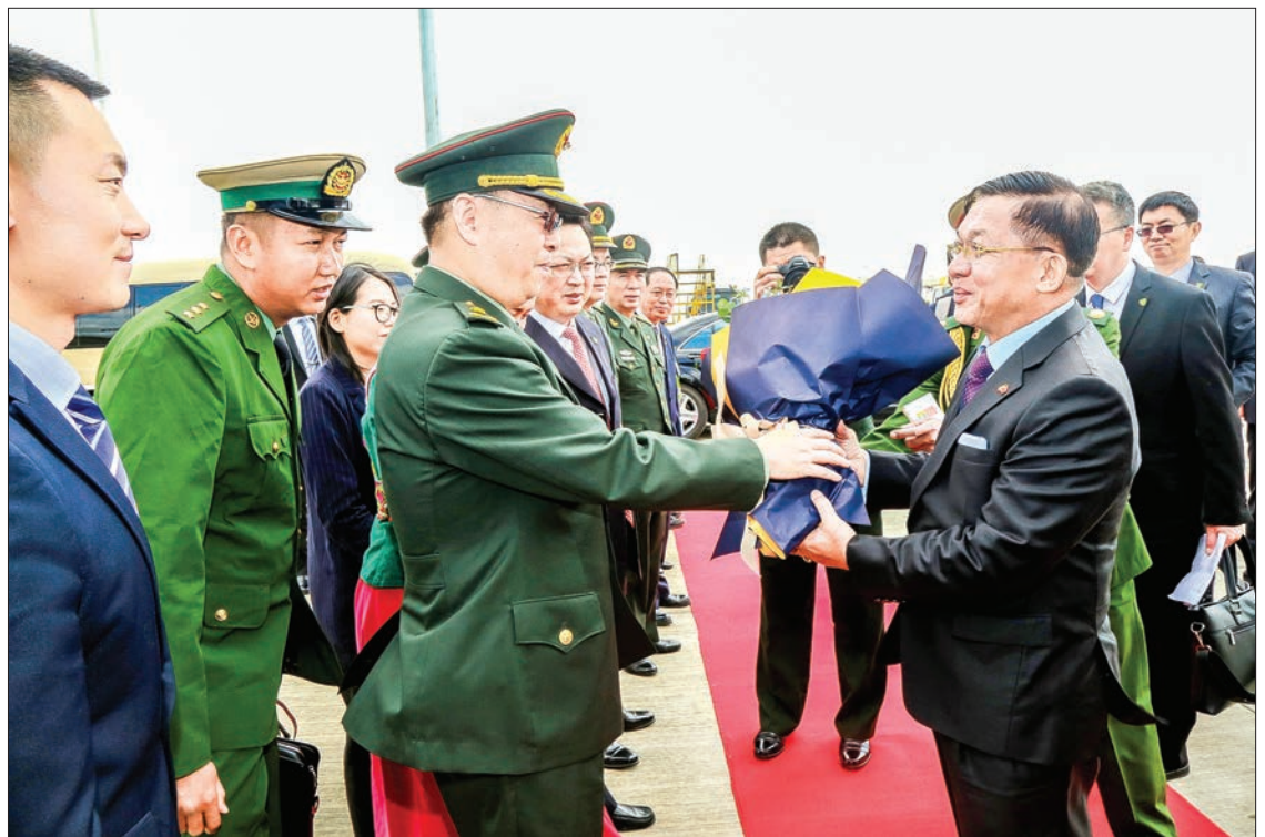
Senior General Min Aung Hlaing being welcomed at Kunming Changshui International Airport, China yesterday.

Senior General Min Aung Hlaing then met with families of the embassy and military attachés office and officers attending training courses. He then presented foodstuff and gifts to the ambassador, military attaché, families of the embassy and military attaché's office and officers attending