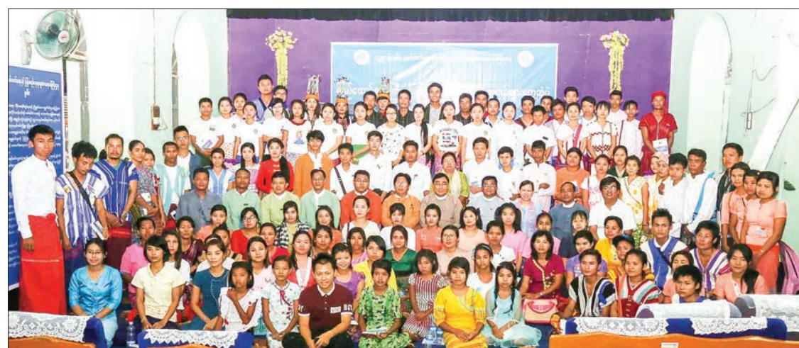
Union Minister Dr. Win Myat Aye poses for the documentary photo together with attendees during the meeting with Mon State youth affairs committee members and youth members of political parties in Mawlamyine, Mon State.

At the event the Union Minister said social protection works were conducted for the existence of every individual person and for their development. Policies and laws for early childhood to elderlies were being implemented by the government. Myanmar was among over 30 countries of the world that didn't have youth policy. Now, youth representatives elected by youths listened to the youths' voices, innovative thoughts and ideas and lessons learnt from mistakes made by elders in Nay Pyi Taw Council as well as states and regions