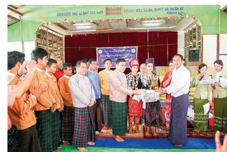
Union Minister Dr. Win Myat Aye provides humanitarian assistance to residents at IDP camps in Mogaung.

mothers with MMK (21.545) millions; to (1,201) children under (5) years with MMK 46.990 millions; to (43,128) people with disabilities with MMK 1,291.385 millions; to (5,785)