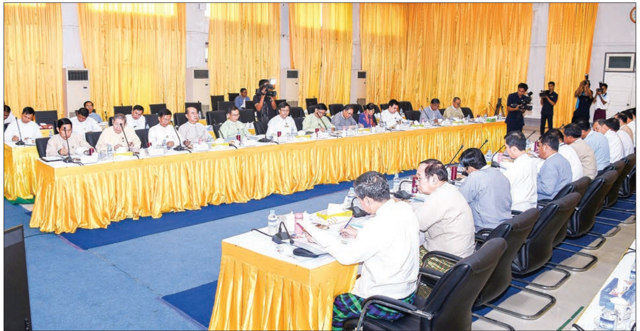
Vice President U Myint Swe addresses the meeting of National Council for Science, Technology and Innovation at the Ministry of Education in Nay Pyi Taw yesterday.

C HAIRMAN of National Council for Science, Technology and Innovation Vice President U Myint Swe attended the first meeting of the National Council for Science, Technology and Innovation for this year at the Ministry of Education in Nay Pyi Taw yesterday afternoon.