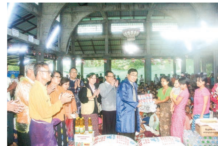
Union Minister Dr. Win Myat Aye donates cash to flood-affected people in Shwekyin on 27 July 2018.