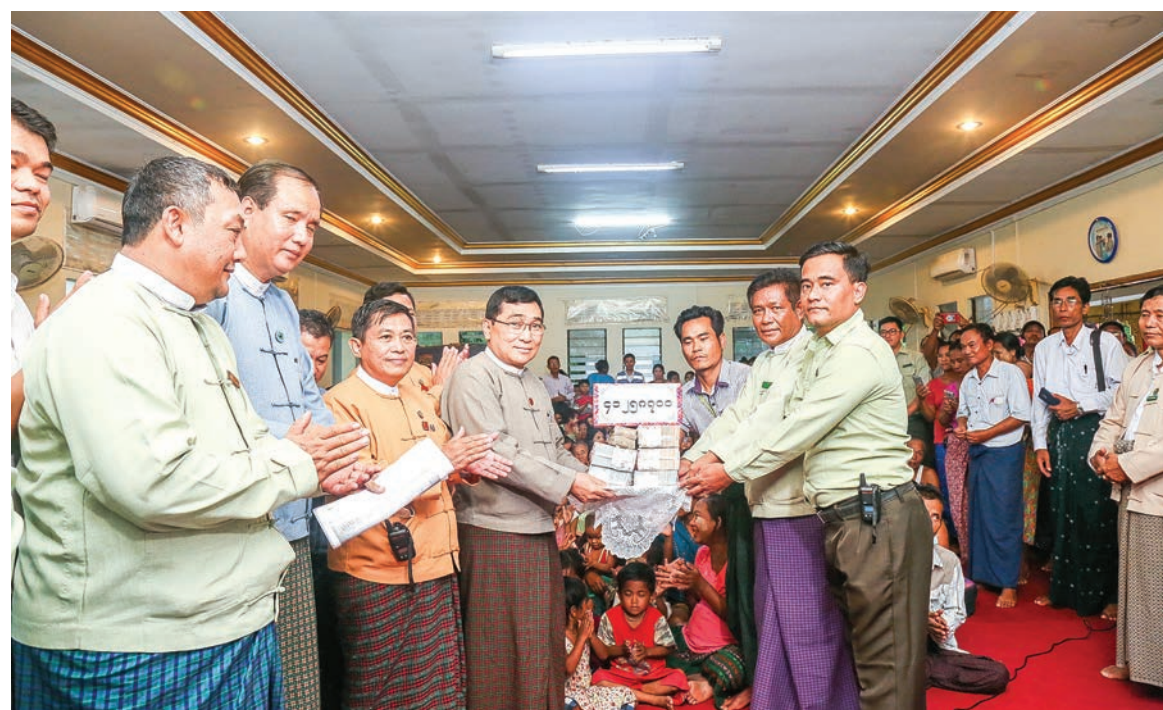
Union Minister Dr. Win Myat Aye accepts cash donation for flood victims in Toungoo on 30 August 2018.

As the fine and fast arrangement are being made in the distribution of the aids and cash to the people, there comes the voices and echoes of good feedback from the people. In drawing up the relevant work preparation including the strategic plan, a research center was established, and subse-