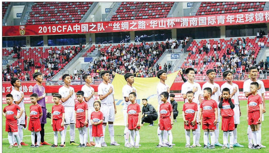
The Myanmar U-15 team and the China U-16 team ahead of their opening match for the Hua Shan Cup Championship in Weinan, China, on 6 April.

THE Myanmar U-15 national football team are giving their best at the Hua Shan Cup Invitational U-16 Championship in Weinan, China, in preparation for the AFF U-15 Championship and the AFC U-16 Qualifiers.