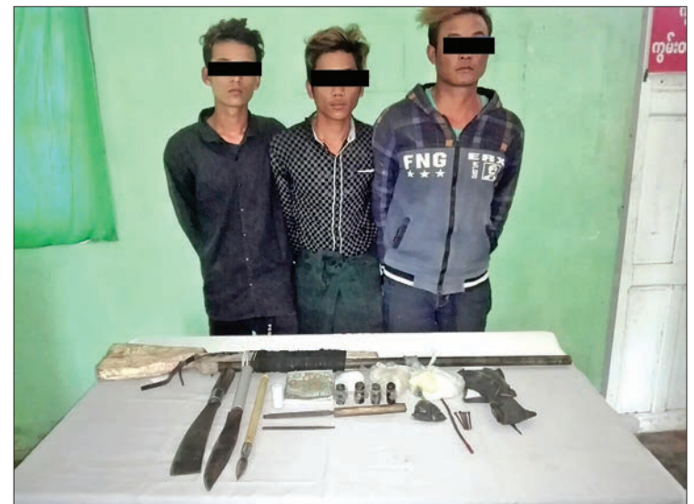
Three elephant poachers are seen together with related materials and weapons.