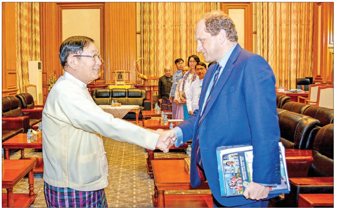
Pyithu Hluttaw Speaker U T Khun Myat shakes hands with Mr. Alexander Graf Lambsdorff, Head of EU Electoral Follow-up Mission in Nay Pyi Taw yesterday.