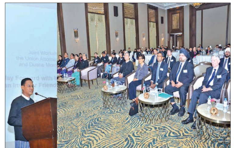
Union Attorney-General U Tun Tun Oo delivers the speech at the Joint Workshop on Investment and Business Laws.

He said The Arbitration Law was also enacted to help settle disagreements concern-