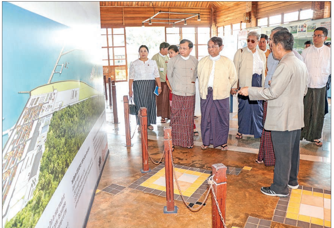
An official reports on Dawei SEZ to Union Ministers U Kyaw Tint Swe and Dr. Than Myint at the Dawei Special Economic Zone in Dawei, Taninthayi Region on 1 April 2019.

Afterwards, Union Minister Dr. Than Myint pledged to grant loans to small and medium industries and urged them to produce and export value added products. Union Minister Dr. Than Myint called for creating job opportunities for local people while developing the economy. The meeting came to an end with discussion between the Union Ministers and the attendees.—MNA (Translated by GNLM)