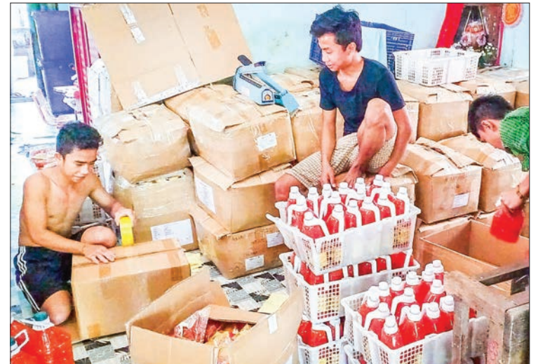
Employees pack sauce bottles at a SME in Hlinethaya Township, Yangon.

Semi-state bodies or authorities will be needed to implement Government initiatives based on an SME development strategy. SME bodies should develop more capacities to be able to work freely without excess interference of government. A broad range of stakeholders should be invited for SME development. While the assistance of government departments is fundamental sup-