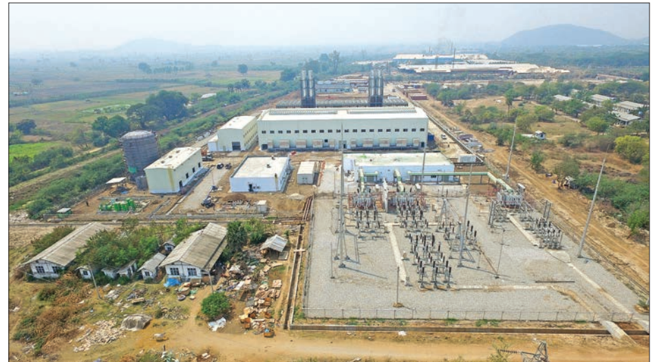
Kyaukse Thermal Power Plant.

The Deputy Minister shares the good news: "Two of the Shwe Yi Htun drill wells out of five -located in A6 off the southwest coast of Taninthayi are showing good prospects regarding natural gas potential and looks economically feasible." MOEE is hoping oil and natural gas may be the solution to energy problems. There are also an 18 plots on-shore and additional 15 potential plots on-shore that can be further explored. Myanma Oil and Gas Enterprise (MOGE), in accordance with its transparency initiative, have called public tenders for a joint venture so they can attract international energy players.