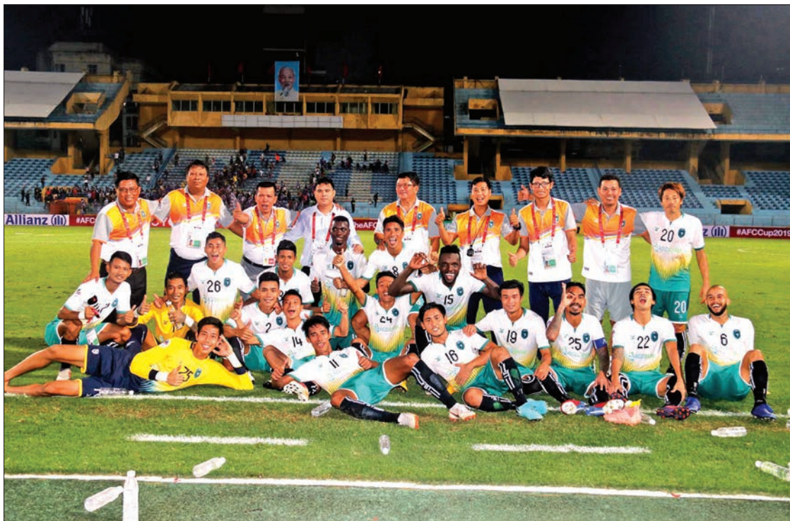
Yangon United F.C. celebrate their victory after beating Viet Nam's Hanoi F.C. 1-0 in a group match for the AFC Cup 2019 at the Hang Day stadium in Hanoi, Viet Nam.

During the second half, Hanoi F.C. tried to create more