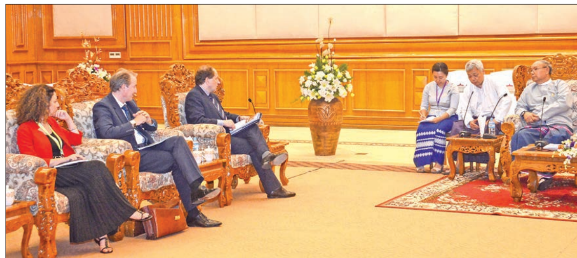
Amyotha Hluttaw Speaker Mahn Win Khaing Than meets with Mr. Alexander Graf Lambsdorff, Head of EU Electoral Follow-up Mission in Nay Pyi Taw yesterday.