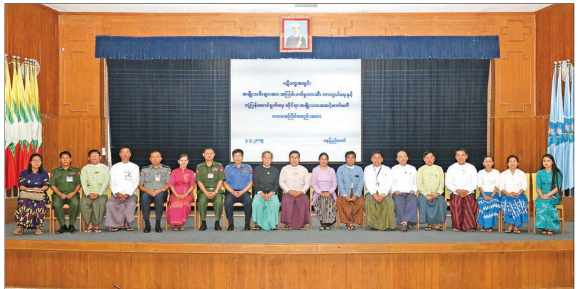
Union Minister Dr. Win Myat Aye and attendees pose for the documentary photo in Nay Pyi Taw.

Next, committee members Deputy Ministers U Soe Aung,