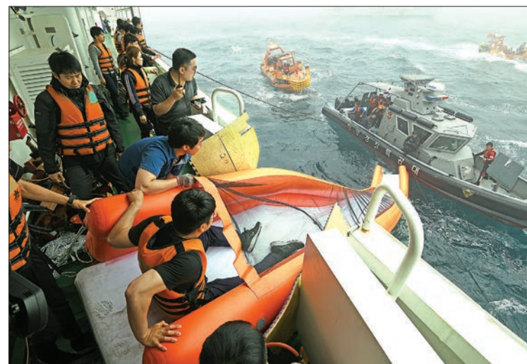
South Korea Coast Guard members rescue passengers during a joint maritime anti-terror drill of North Pacific Coast Guards off the southeastern port city of Busan on 7 June 2018.

The US has since imposed sanctions on two Chinese shipping companies for doing business with North Korea, urging the maritime industry to do more to end Pyongyang's "illicit shipping practices". A UN report issued last month highlighted the North's sanctions-evading tactics at sea and recommended member countries keep a closer watch over vessels in their own waters.—AFP ■