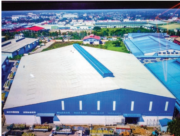
A bird's-eye view of PEB Steel Myanmar's steel plant.

PEB steel manufacturing firm based in Europe has been operating its businesses for 25 years. It opened the first office of country representative in Yangon in 1998. During the period of more than 20 years, the firm has produced high quality products for 160 projects. Currently, the firm established a heavy plant in Thilawa Special Economic