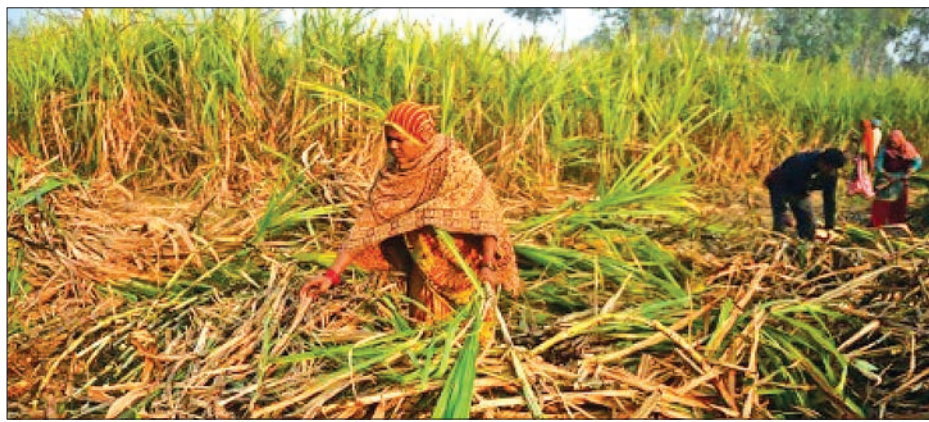
Debts and drought have driven thousands of farmers to suicide in recent years.

"Last year's payments are still due. I have lost interest in farming but there is nothing else to do," he told AFP in the village of Painga. Sugarcane used