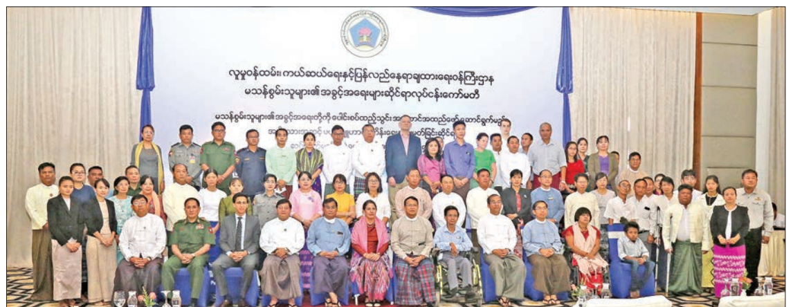
Participants pose for the documentary photo at the workshop to draft national strategy for persons with disabilities at the Ministry of Social Welfare, Relief, and Resettlement.

He also called for linking the draft strategy with the Sustainable Goals-2030, the national-level strategy for social welfare, and rules and by-laws of the related ministries.