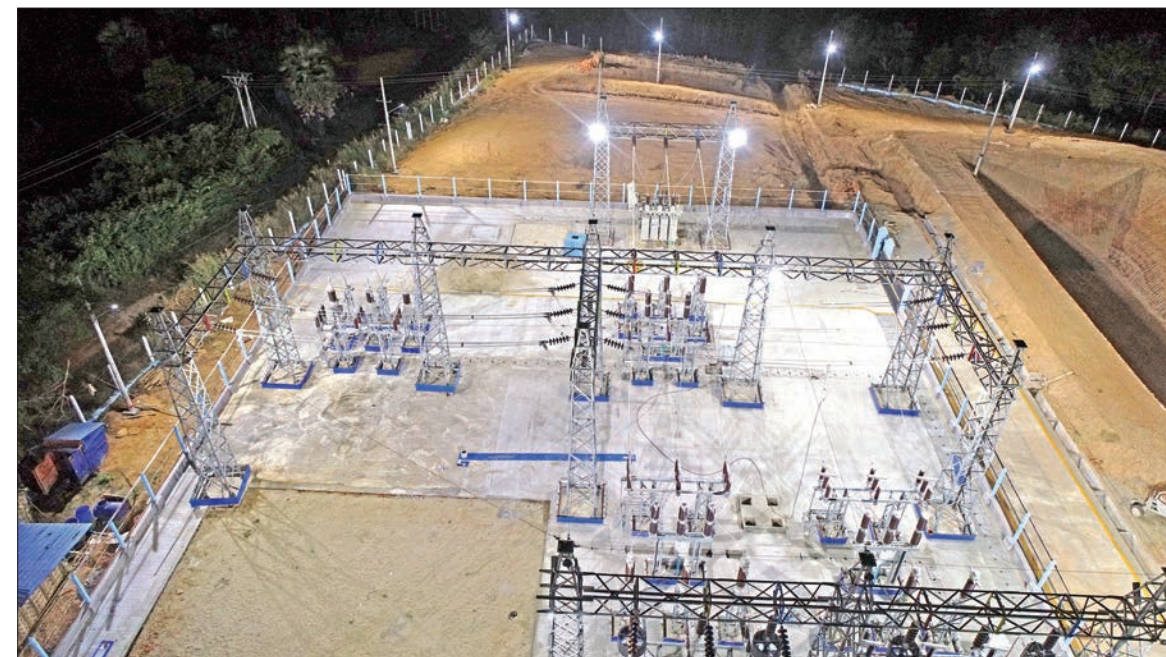
66kV Pathein-Ngwehsaung Transmission Line & Substation