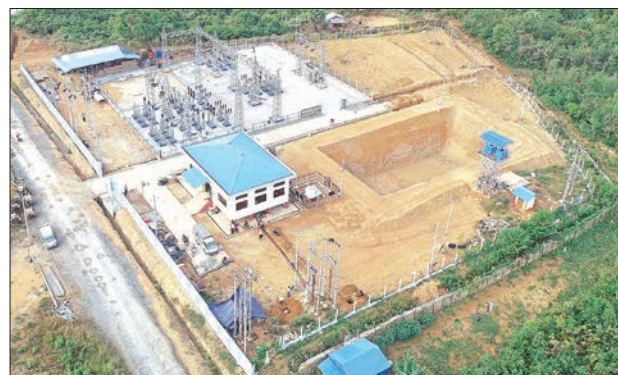
66kV Pathein-Ngwe Saung Transmission Line & Substation