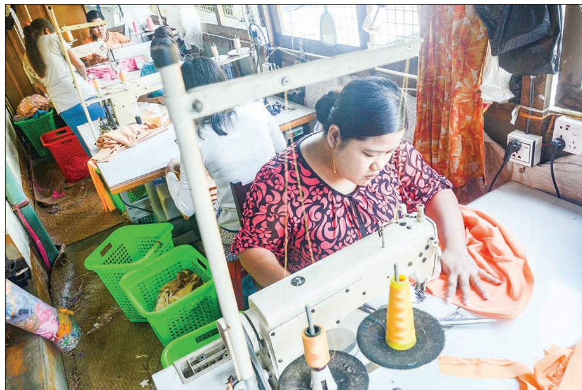
Women making clothes at a cottage industry in South Dagon Township, Yangon.

port to SMEs, a cooperative society of private business community, educational and technological institution play pivotal role.