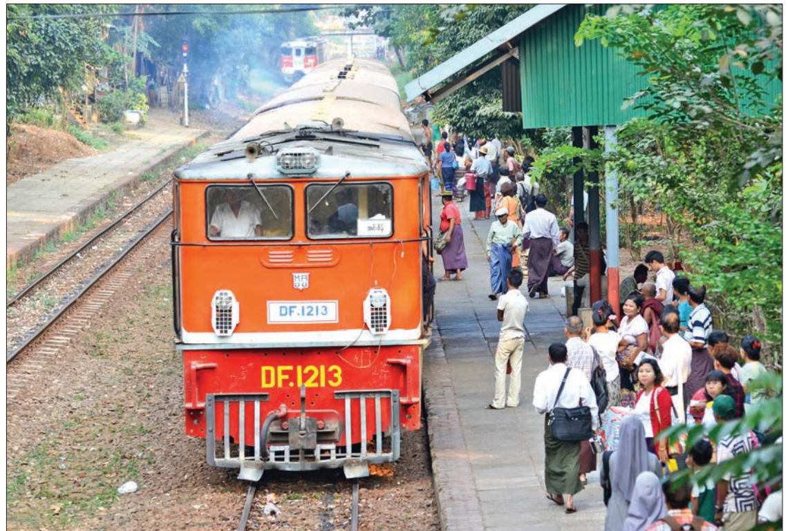
Passengers waiting to take a local train on a circular train at Yangon Central Railway Station.

Officials from MR have arranged for tickets to be sold