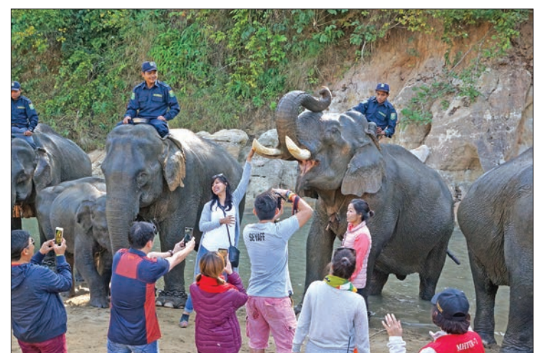
Tourists are observing elephants at Pyar Swe elephant camp.

Currently, the camp is building temporary shelters