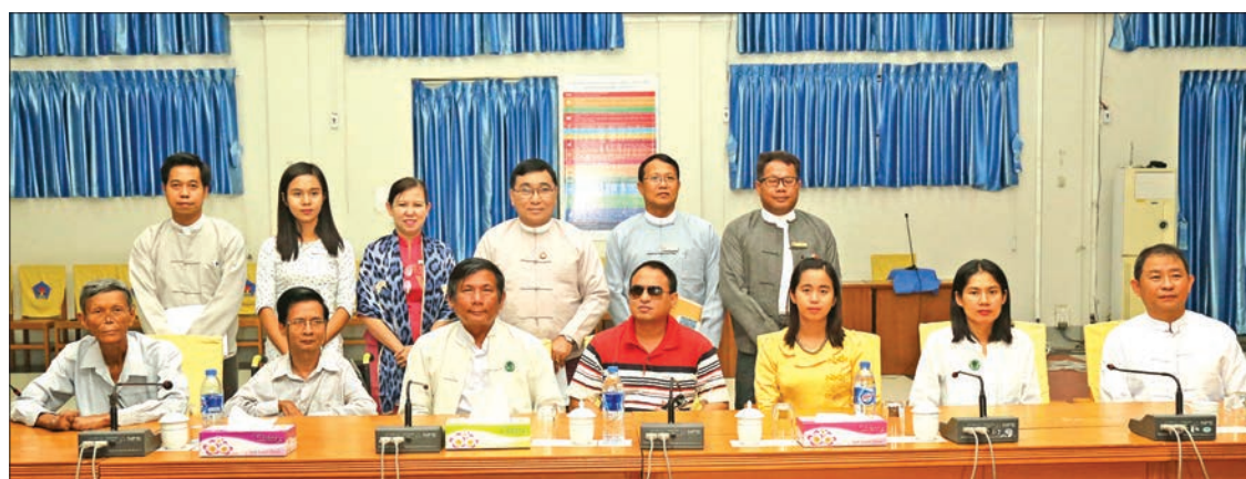
Union Minister Dr. Win Myat Aye poses for a photo together with the delegation from the Myanmar Federation of People with Disabilities.

THE Union Minister for Social Welfare, Relief and Resettlement, Dr. Win Myat Aye, separately re-