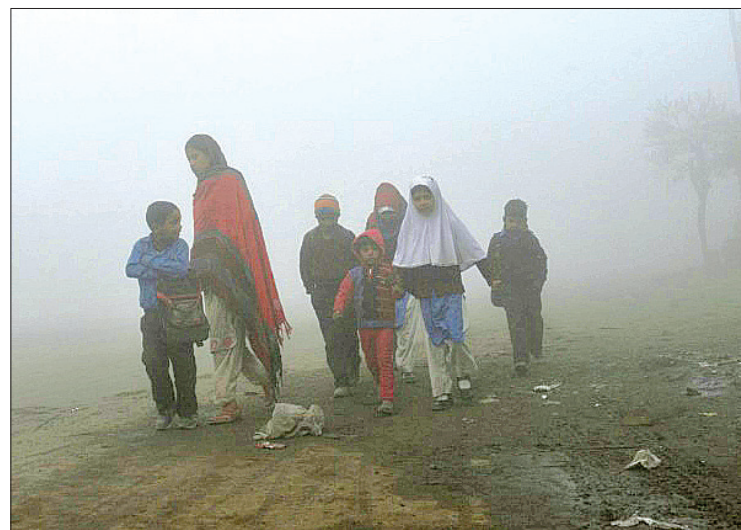
In South Asia air pollution is set to shorten children's lives by 30 months and in East Asia by 23 months.

It found that children are often more vulnerable to the impact of air pollution since they breathe more rapidly than adults, and thus absorb more pollutants at a time when their brains and bodies are still developing.—AFP ■