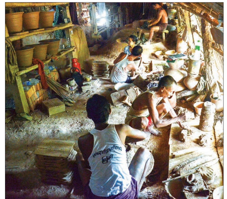
Workers making pots in Twantay.