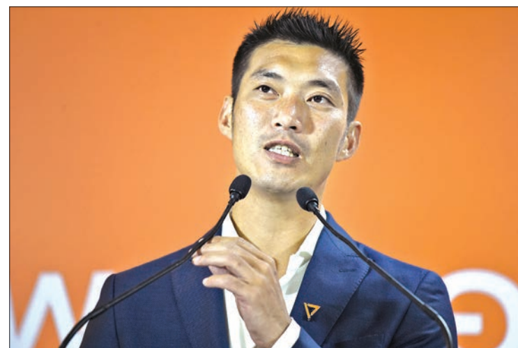
Billionaire Thanathorn Juangroongruangkit heads up the youth-oriented Future Forward Party, which came out of nowhere to amass more than six million votes in the 24 March vote.