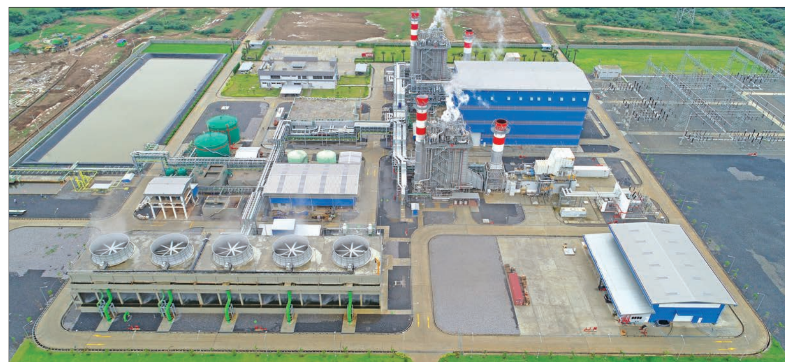
225MW Mingyan power plant

Currently, only 44 percent of the whole of Myanmar have access to a power grid. MOEE aims to increase this number to 55 percent in 2020-2021, up to 75 percent for 2025-2026 and 100 percent by the year 2030-2031. "We were able to