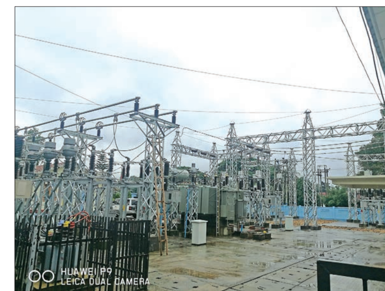
66 kV Mawlamyine-Thanyuayay Substation

Myanmar relies heavily on hydropower sources. The Ministry is currently working towards to diversify with other natural resources Myanmar is abundant in.