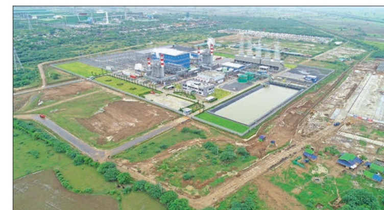
225MW Mingyan power plant

This is a term widely popular amongst the citizens as a majority of them has experienced temporary blackouts due to systems not being upgraded on time. There were 17 reported breakdowns during 2016-17 which were more