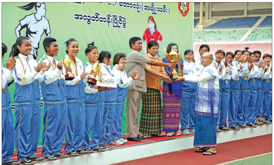
Amyotha Hluttaw Speaker Mhan Win Khaing Than presents trophy to the winners of the 2019 U-25 women's football tourney in Nay Pyi Taw yesterday.