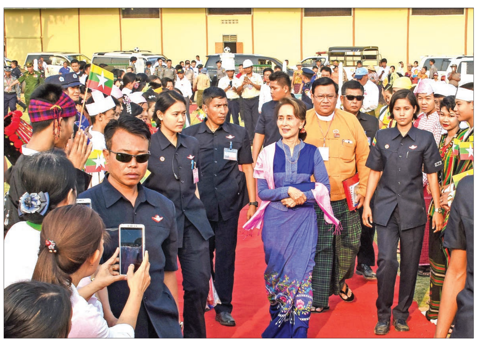
State Counsellor Daw Aung San Suu Kyi is welcomed by local residents in Nyaungdon, Ayeyawady Region yesterday.