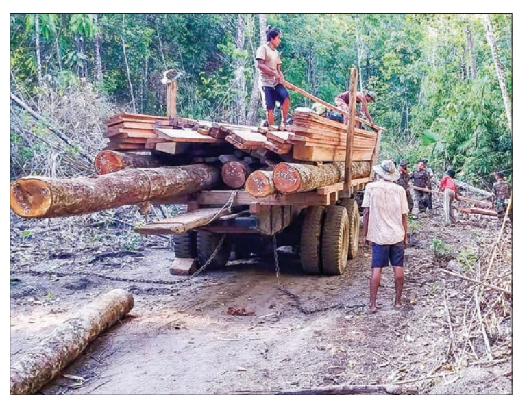
A truck loaded with illegal timber seized by a combine team.

A combine team comprising staff from forest departmentand enforcement officers seized 109 illegal timber logs weighing 6.7692 tons from a sixwheel vehicle and a hino vehicle at the corner of Shwe Gu pagoda road and Bogyoke road, Madaya Township, Mandalay Region from 29 to 31 March.