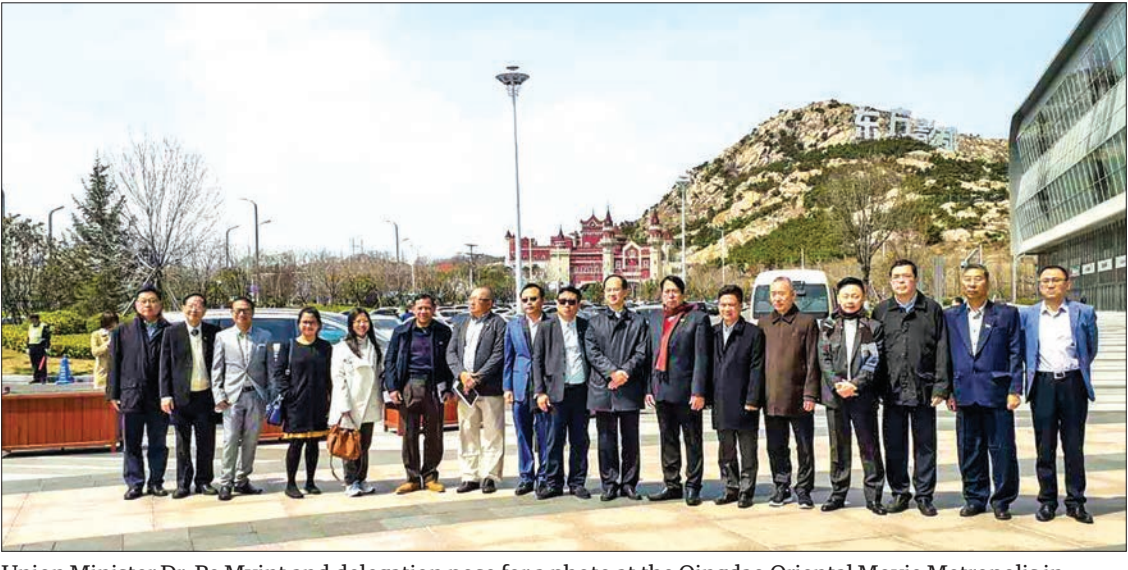
Union Minister Dr. Pe Myint and delegation pose for a photo at the Qingdao Oriental Movie Metropolis in Shangdong Province, China.

The Qingdao Oriental Movie Metropolis is established on 410 acres of land and 30 modern