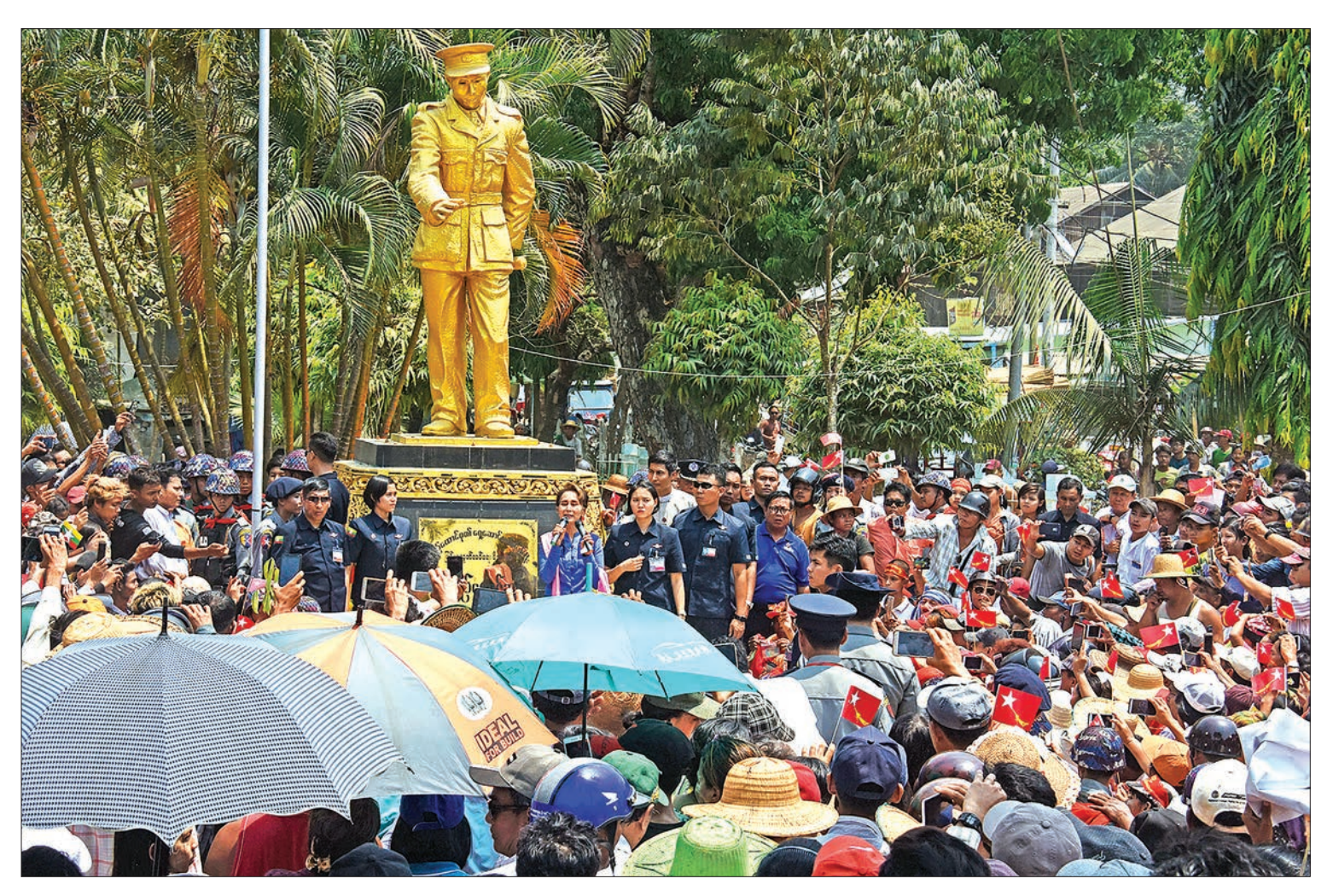
State Counsellor Daw Aung San Suu Kyi addresses local populace in front of Bogyoke Aung San Statue in Pantanaw, Ayeyawady Region.