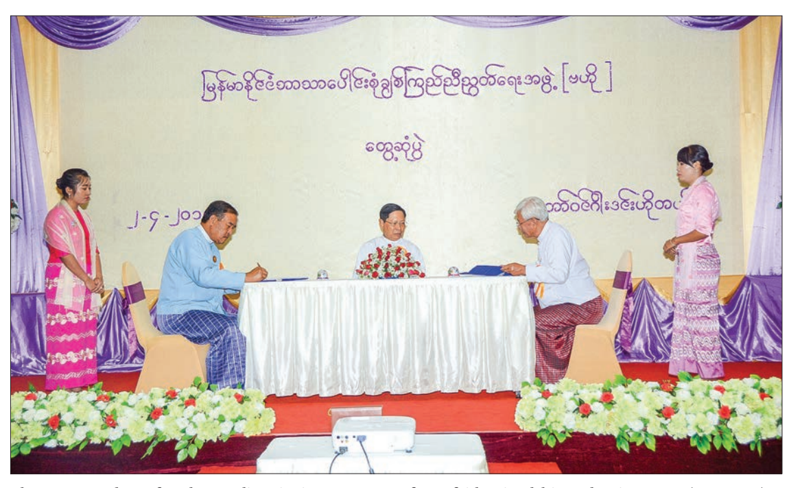
The Memorandum of Understanding signing ceremony of Interfaith Friendship and Unity Group (Myanmar) and Religions for Peace-Myanmar being conducted in Yangon.

The meeting was attended by officials from the Ministry of Investment and Foreign Economic Relations. —MNA ■