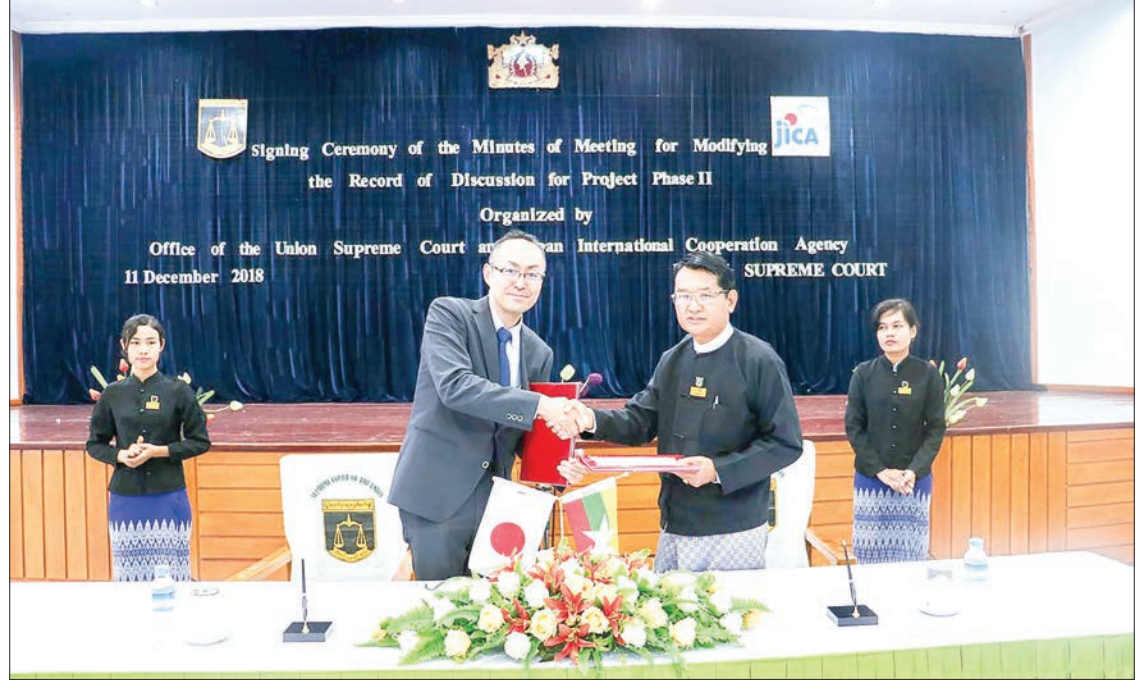
Representatives from Union Supreme Court and JICA Judicial and Legal Project exchange notes of the MoU on 11 December 2018.

When the public pay more attention on some cases, the courts took special care for accurate information and release of news. It arranges meetings and interviews for the interest of the public. In 2019, plans are being made to release news in time over the cases that are in-