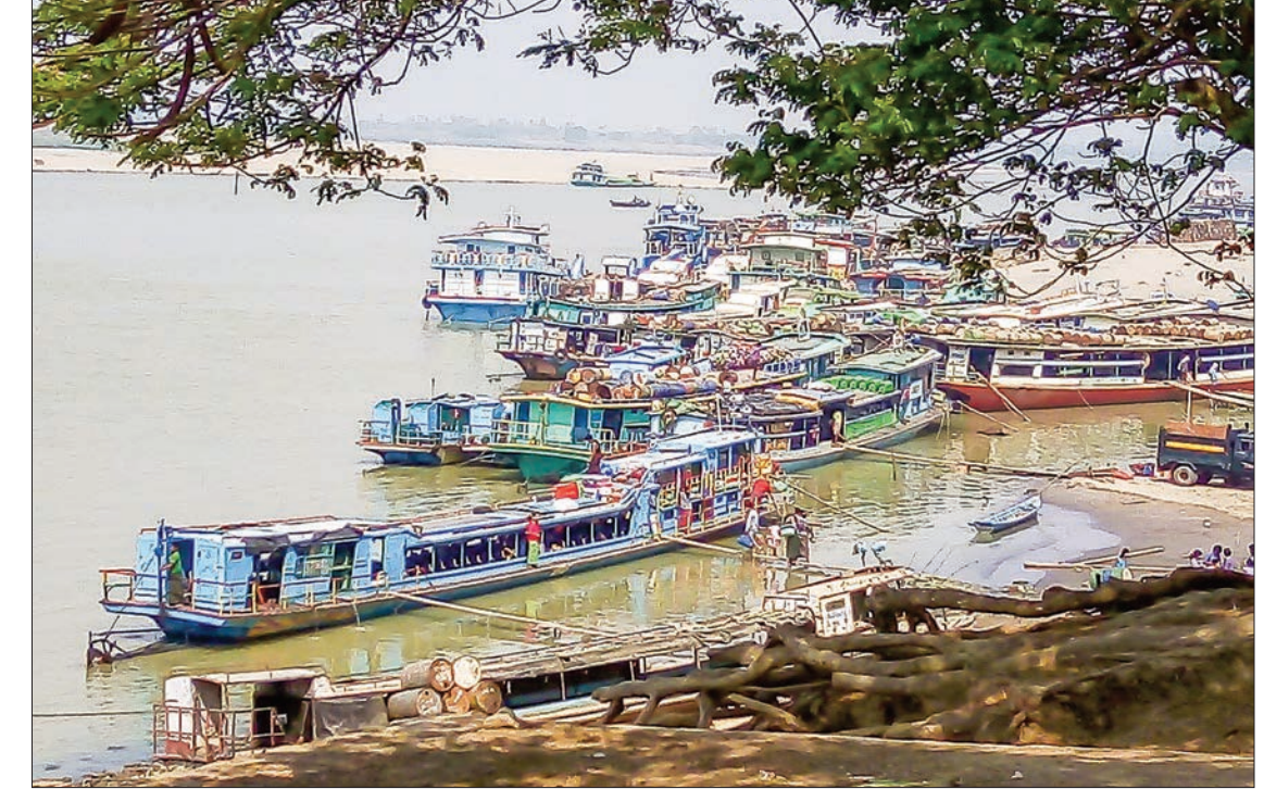
Ferries mooring on the Chindwin River in Sagaing Region.

"At present, the number of passengers is increasing as the Thingyan festival is approaching, and the regional marine administration groups are performing their duties. They have