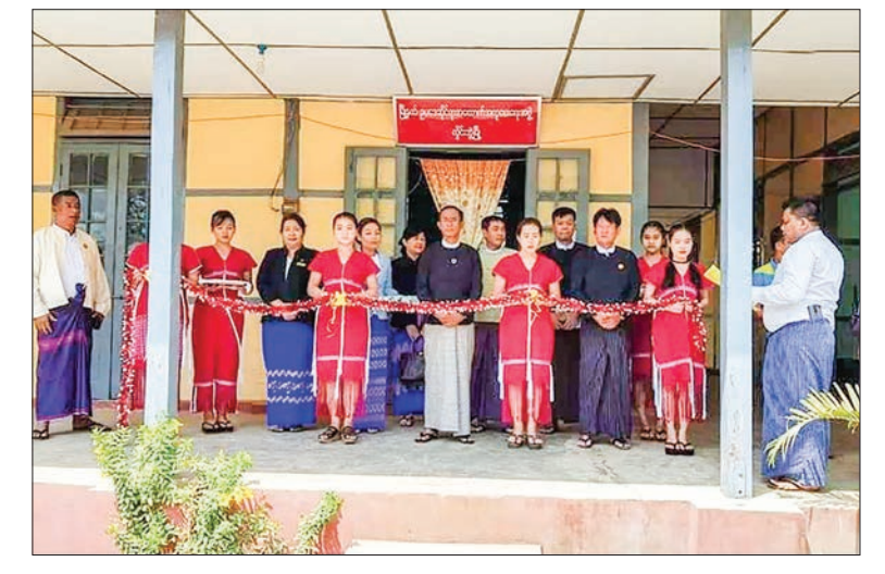
Photo shows the opening ceremony of the Office of Township Legal Support Team in Hlinebwe.