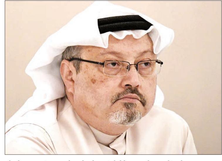
The houses given to the Khashoggi children are located in the port city of Jeddah and are worth up to $4 million, the newspaper reported.

dren, plans to continue living in the kingdom, while the others, who live in the United States, are expected to sell the homes, the paper said. In addition to the properties, the children are receiving $10,000 or more per month and may also receive larger payments that could amount to tens of millions of dollars each, according to the report. Saudi Arabia's pow-