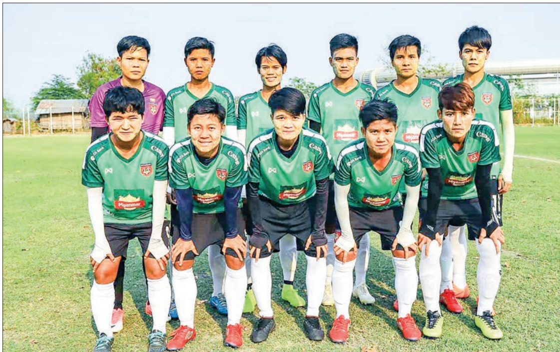
Myanmar national women football team players pose for a group photo during their training session in Mandalay.

Myanmar will play against Nepal on 3 April, Indonesia on 6 April, and India on 9 April. All the matches are scheduled to take place at the Mandalay Thiri Stadium in Mandalay.—Lynn Thit (Tgi) ■