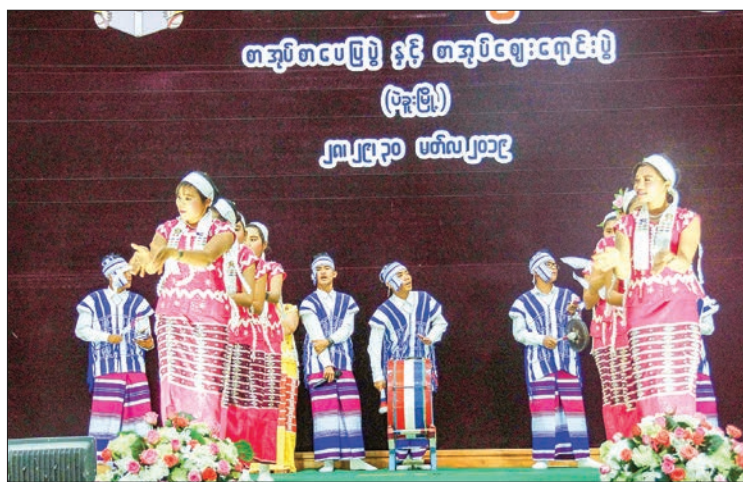
Students entertain the visitors with Kayin traditional dances at the Children's Literary Festival in Bago yesterday.