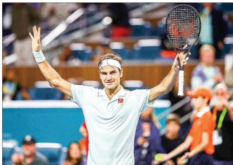
Swiss great Roger Federer celebrates a semi-final win over South African Kevin Anderson in the ATP and WTA Miami Open.

MIAMI — Roger Federer will make Denis Shapovalov's dream come true on Friday after the Swiss booked a Miami Open semi-final against the Canadian starlet with a ruthless 6-0 6-4 destruction of Kevin Anderson.