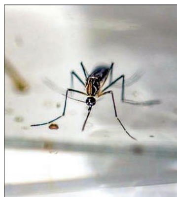
Aedes aegypti mosquitoes, known for spreading deadly illnesses like Zika, dengue and yellow fever.