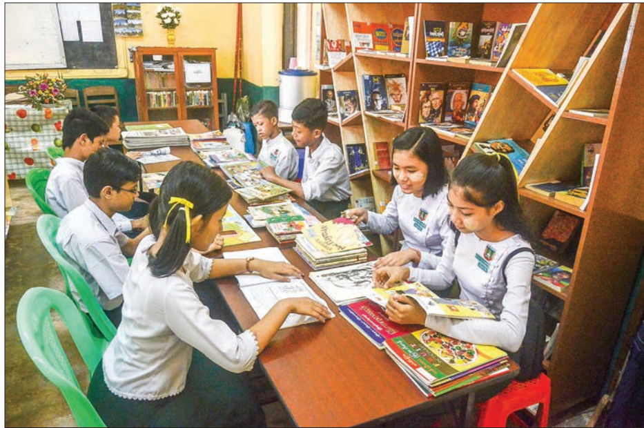
High school students doing schoolwork with their classmates in the library. PHOTO: