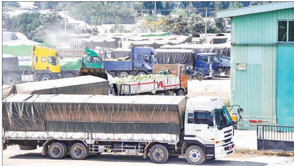
Trucks loaded with Watermelon are seen at the China-Myanmar border.

EXPORTS of watermelons and muskmelons to China through the Muse border gate have risen significantly, with around 700 fruit trucks entering the Muse market every day.