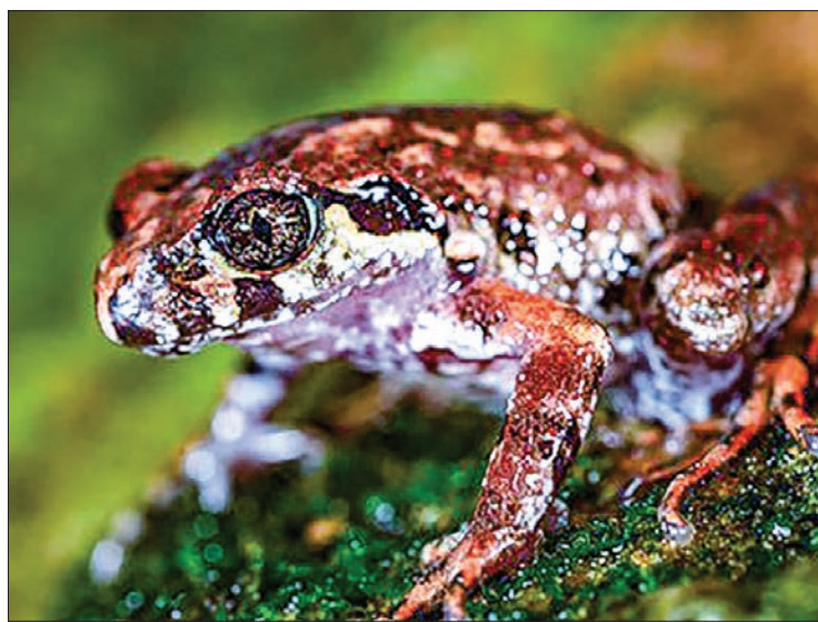
A deadly skin disease is responsible for the extinctions of 90 amphibian species over the last 50 years, researchers from Australian National University (ANU) have found.

“On one hand, it’s lucky that some species are resistant to chytrid fungus. But on the other hand, it means that these species carry the fungus and act as a reservoir for it so there’s a constant source of the fungus in the environment.”—Xinhua ■