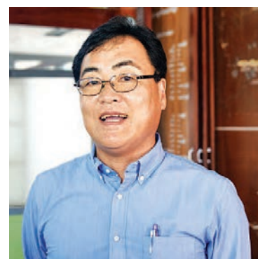
Dr Moto Yashika (Japanese Dam Expert)

A: In October 2018, three moderate earthquakes jolted near the dam and also in January 2019, another quake jolted again. The cracks were found on January 8. According to the study made by Myanmar and Japanese experts, the cracks were the consequence of the earthquake. After the incidents, the dam is under watchful eye of the department. Geological testing has been made