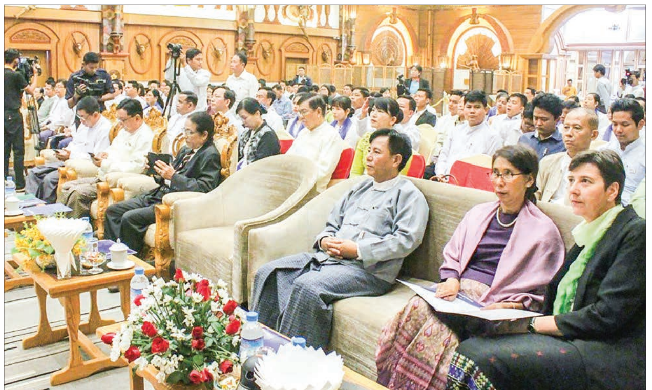
Union Minister U Thein Swe addresses the ceremony to celebrate National Skills Standards Authority ISO certification and to present NSSA certificates in Nay Pyi Taw.

A CEREMONY to celebrate the awarding of the ISO 9001:2015 certification to the National Skills Standards Authority (NSSA) and to present NSSA certificates was held yesterday morning at the Tongapuri Hotel,