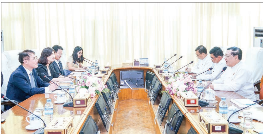
Union Minister U Thein Swe holds talks with Korean Ambassador Mr. Lee Sang-hwa at the Ministry of Labour, Immigration and Population yesterday.

UNION Minister for Labour, Immigration and Population U Thein Swe received the Republic of Korea Ambassador to Myanmar Mr. Lee Sang-hwa and party at the ministry meeting hall yesterday afternoon.