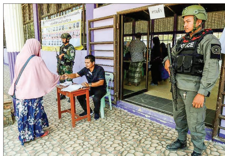
Complaints about alleged voting irregularities have dogged the Thailand election.

The junta-backed Phalang Pracharat party, whose prime ministerial candidate is