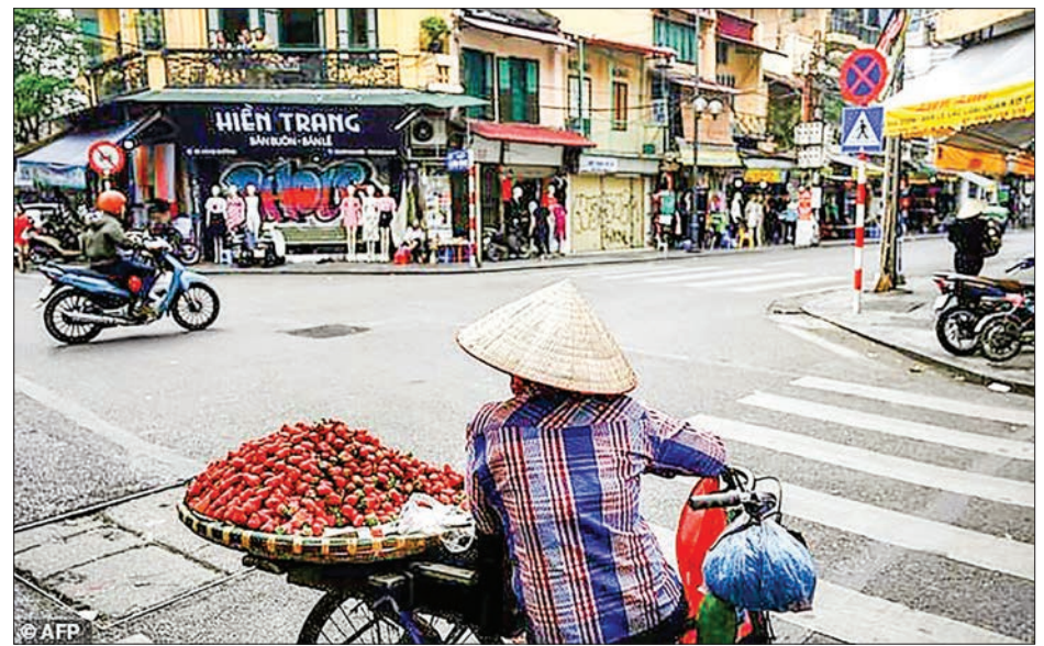
A Vietnamese vendor sells strawberries on her bicycle in Hanoi's Old Quarter.

The Chinese commerce ministry said a "large amount of work" remains to be done and both sides confirmed before this round of talks that another face-to-face negotiation was scheduled for Washington next week.—AFP ■