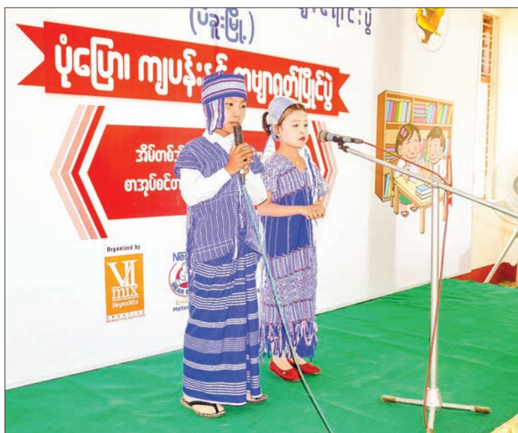
Ethnic students compete in the storytelling contest in ethnic languages on the second day of Children's Literary Festival in Bago yesterday.