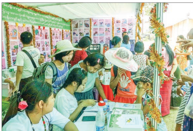
A book shop attracts students on the second day of Children's Literary Festival in Bago yesterday.