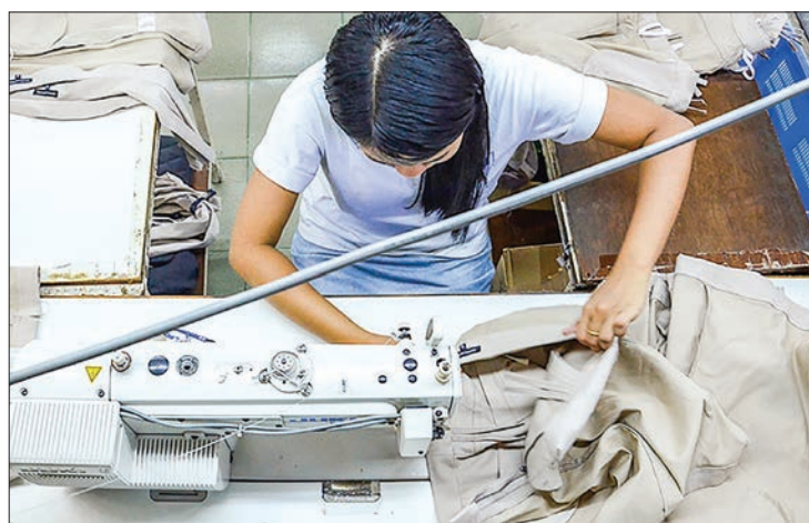
An employee works on a production line at a garment factory in Yangon.

"This is the result of an MoU. The program has been launched to allow young Myanmar entrepreneurs to study textile and garment technologies. The Guangxi institute will provide a full scholarship, covering accommodation, food, and charges for the course," said U