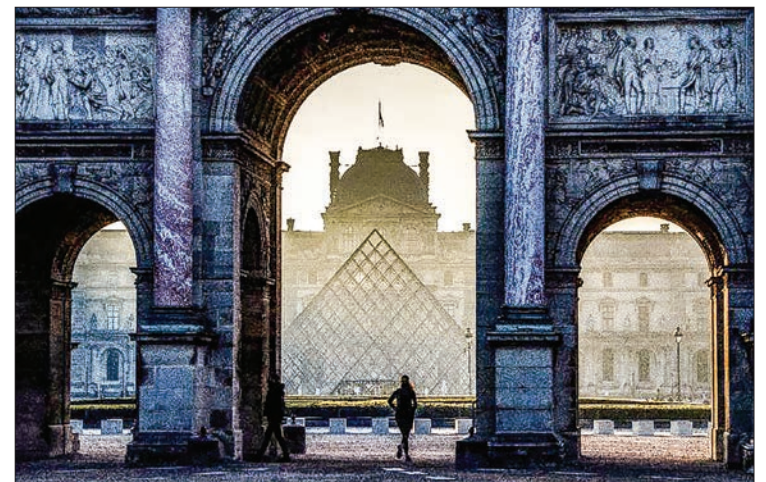
The Louvre museum, designed by Chinese born US architect Ieoh Ming Pei, celebrates its 30th anniversary on 29 March, 2019.

The Louvre evolved into a centre for arts, the prestigious Royal Academy of Painting and Sculpture taking up residence in the 1690s.