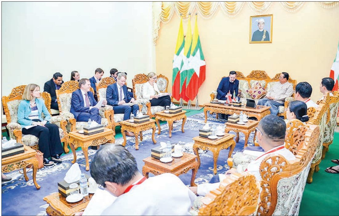
Union Minister U Win Khaing meets with Norwegian Minister of International Development Mr. Dag-Inge Ulstein in Nay Pyi Taw yesterday.

UNION Minister for Electricity and Energy U Win Khaing received Norway Minister for International Development Mr. Dag-Inge Ulstein at the Union Minister's guest hall in the Ministry yesterday morning.