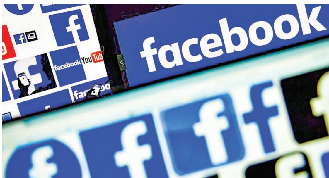
The tools have been used since last year in other countries where elections have been held, including the mid-term polls in the United States, and votes in Brazil and India.

All ads related to politics or issues must be clearly labelled, including indicating who is paying for the ad, and for any business or organisation, their contact details.