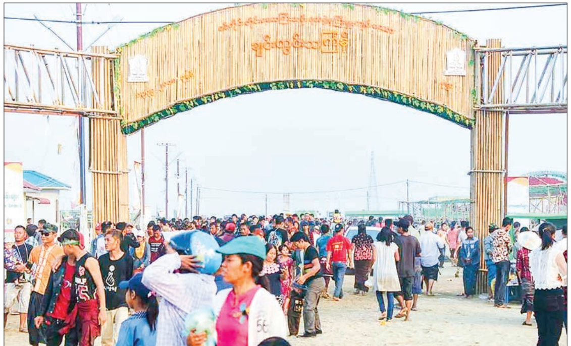
People celebrate 2018 Chindwin Thingyan Festival in Monywa Township, Sagaing Region.