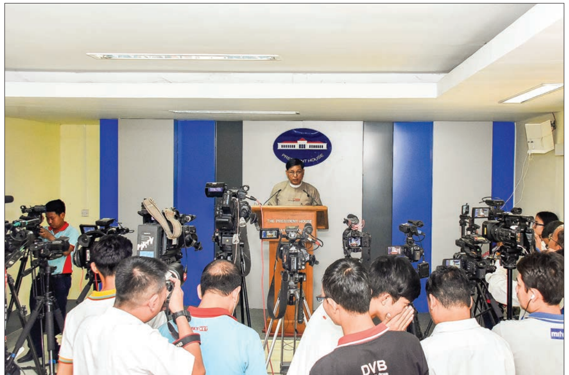
Director-General of the Office of the President U Zaw Htay gives the press conference in the Presidential Palace in Nay Pyi Taw yesterday.

After the Tamadaw's four-month unilateral ceasefire, the Peace Commission went to Chiang Mai, Thailand, in Jan-