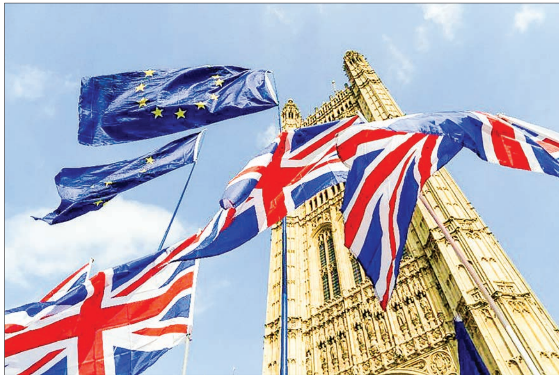
The House of Commons has twice rejected May's withdrawal agreement but has not been able to agree on any alternative.

May's sacrifice swayed some of her critics, including former foreign minister Boris Johnson, a potential leadership contender.