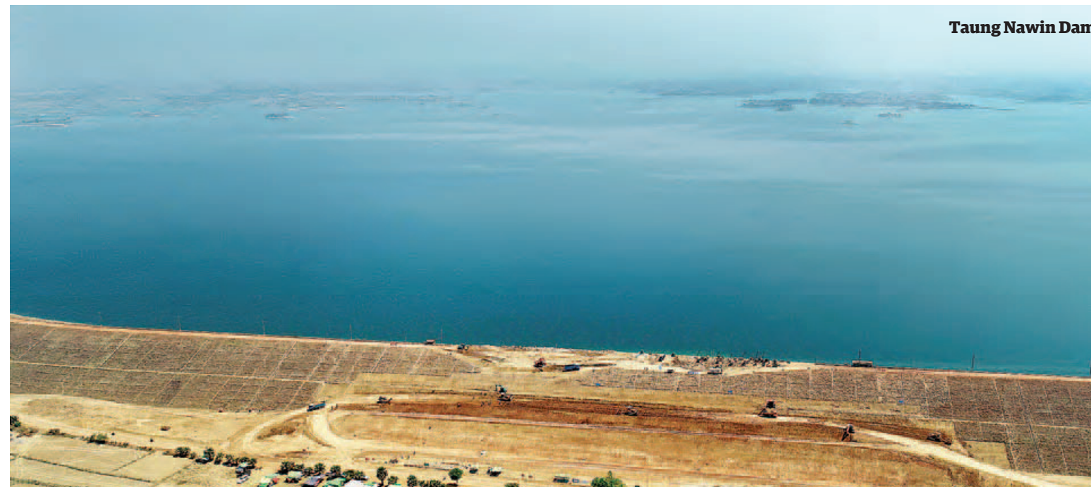
Taung Nawin Dam