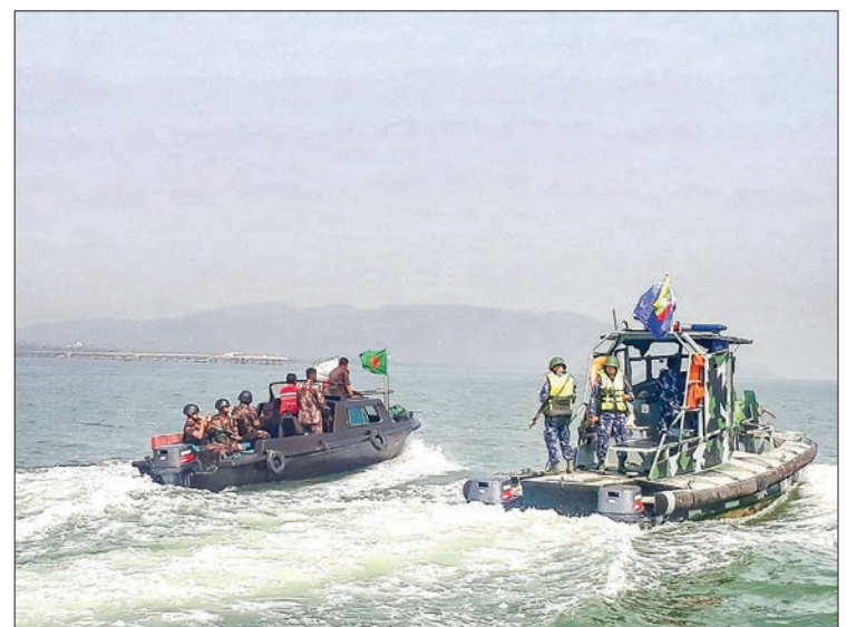
Myanmar Border Police and Border Guards Bangladesh conducting coordinated naval patrols.

Police Force in area-6, Maung-taw, and two water crafts from Bangladesh side participated in the patrol along the river, according to news release from the Myanmar Police Force.— GNLM (Translated by Kyaw Zin Lin)