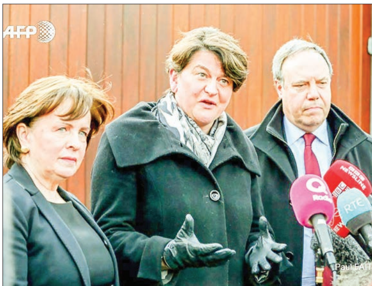
The Democratic Unionist Party's 10 MPs have propped up the Conservative government since the 2017 general election.

Experts have warned a launch of any kind would send the stuttering talks on denuclearisation into disarray. —AFP ■