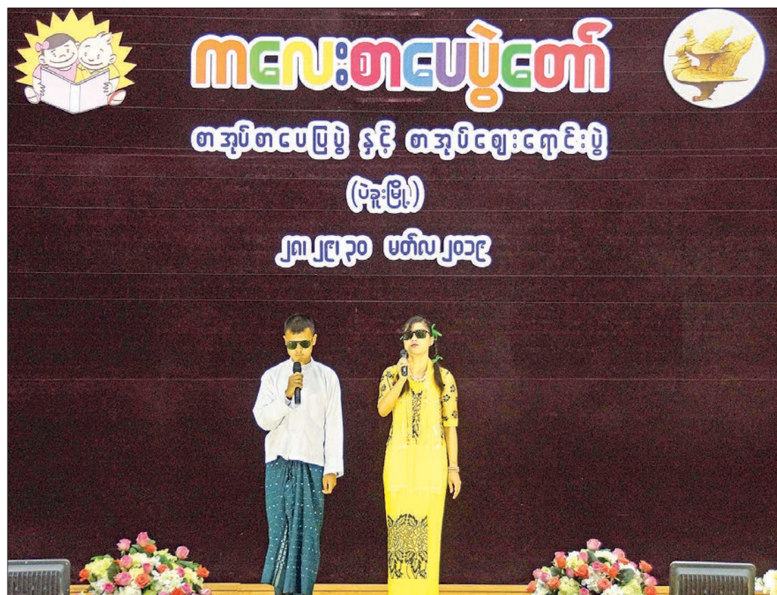
Students entertain the audience with songs at the opening of the Children's Literary Festival in Bago yesterday.

The main aim of the festival was to make the children happy. We want the children to be happy. However, it was important for all to be happy and the festival was held to provide long term sustainable happiness rather than short term happiness term happiness.