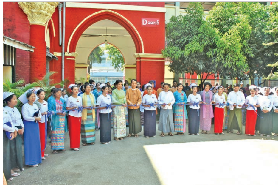
Yangon Central Women's Hospital accepts the 29 th commemorative Yangon City Heritage Blue Plaque yesterday.

The Blue plaque was unveiled and sprinkled