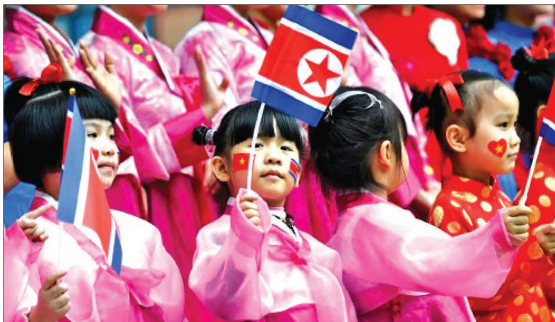
Patriotic pupils: Students wave Vietnamese and North Korean flags at a kindergarten in Hanoi.