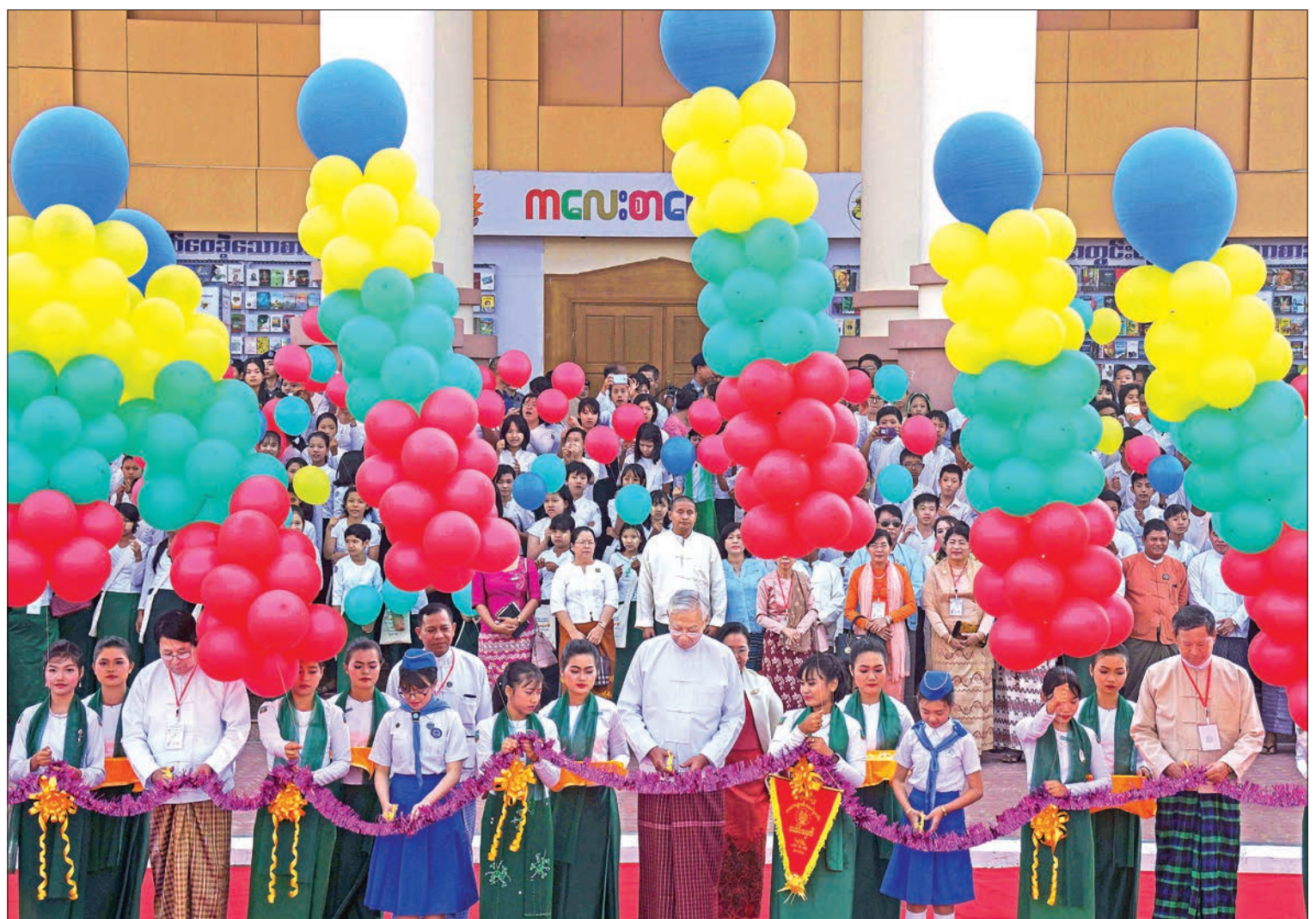
Former President U Htin Kyaw, centre, Union Minister Dr. Pe Myint, left, and Union Minister Dr. Myo Thein Gyi cut ceremonial ribbon to open the Children's Literary Festival at the Bago University in Bago yesterday.

President U Htin Kyaw delivering the opening speech. He said the festival was a happy occasion and festival for children in Bago Region. It can be said that the festival promotes the existing love for literature and was seen to include litera-