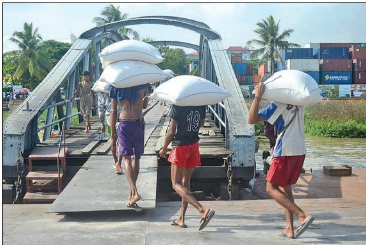
Labourers carry rice bags at Botahtaung Harbour in Yangon .

“The rice that has piled up at Muse is monsoon rice. Sure, trade of summer rice will be