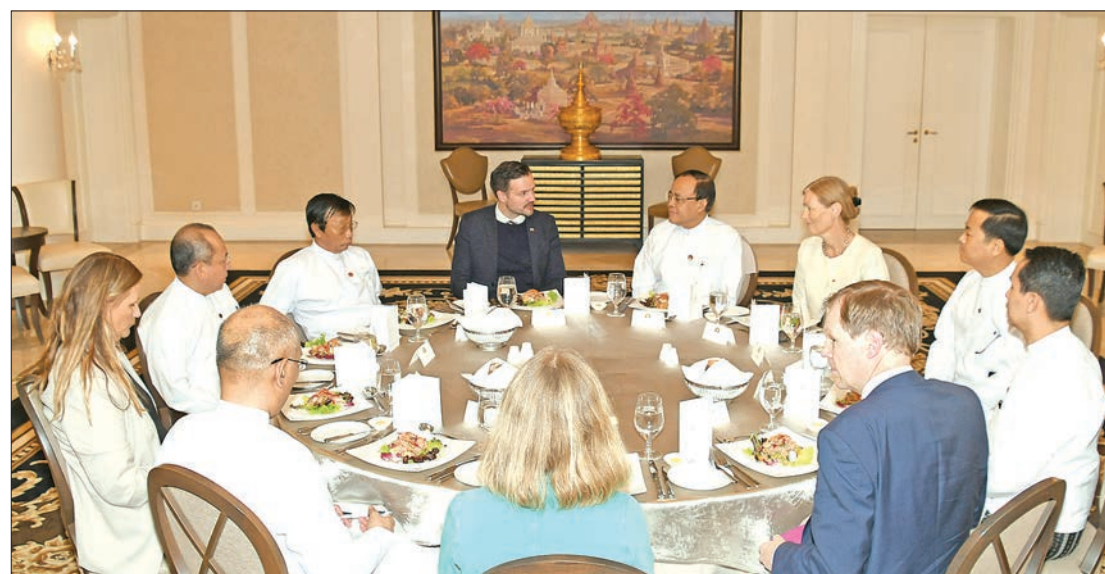
Norwegian Minister of International Development Mr. Dag-Inge Ulstein and his delegation attend a working lunch hosted by Union Minister U Kyaw Tin in Nay Pyi Taw yesterday.

fice Consultations mechanism between Myanmar and Norway. U Hla Kyaw, Deputy Minister of the Ministry of Agriculture, Livestock and Irrigation and officials from the Ministry of Foreign Affairs were also present at the luncheon.—MNA