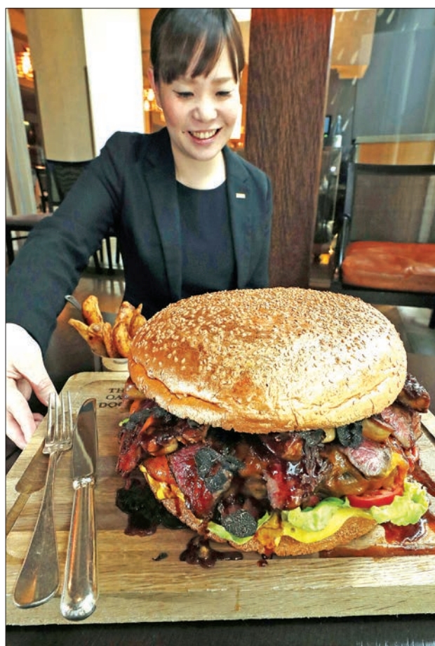
Photo taken on 28 March, 2019 shows a giant wagyu beef hamburger with gold-dusted buns, costing 100,000 yen ($908), to be offered at the Oak Door steakhouse in the Grand Hyatt Tokyo hotel in honor of the ascension of the new emperor.