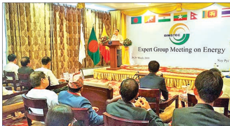
Union Minister U Win Khaing delivers the speech at the Expert Group Meeting on Energy in Nay Pyi Taw yesterday.

First, Union Minister U Win Khaing said Myanmar was taking up the duty of leading the energy sector under the BIMSTEC program. Socio-economic conditions of the people in the region depend not only on economic development but also on the correct management of natural resources. Energy sufficiency was the priority work of all and