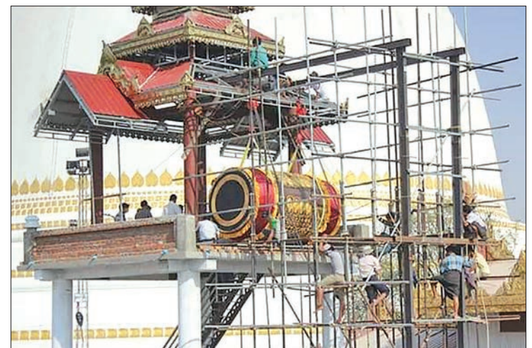
Workers prepare for housing world's largest drum at the Kaunghmudaw pagoda in Sagaing.

The drum measures 128 inches in length and 64 inches