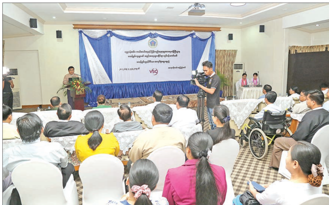
Union Minister Dr. Win Myat Aye delivers the speech at the workshop on effectively implementing handicap rights in cooperation with media in Nay Pyi Taw yesterday.

Next, Deputy Minister U Aung Hla Tun said the workshop was held to obtain the power of the media in implementing laws and rules that gave equal rights and opportunities for the handicapped. Their rights, grievances and losses were to be exposed using the power of the media