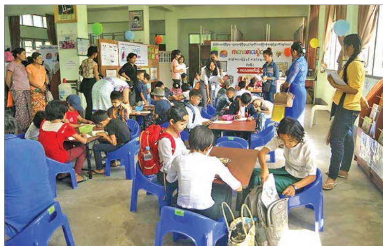
Children take part in the coloring contest in the Children's Literary Festival in Bago.

A total of 303 primary school students and 154 middle school students competed paper folding contest while 366 students competed in the charade contest, 532 students competed in jigsaw contest, 322 students took part in the sample building contest, 420 middle school students plus 450 primary school students competed in the colour painting contest and 5814 students participated together in the team building game.—Wai Lyan (Translated by Kyaw Zin Lin)