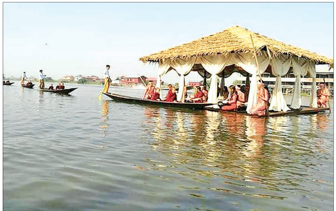
Charming scene of offering food to Sangha at Inle Lake, Nyaungshwe Township.

The festival will have 21 floating venues for food dona-