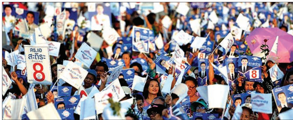
Around 7.6 million votes went to the junta-backed Phalang Pracharat with 94 per cent of ballots tallied.