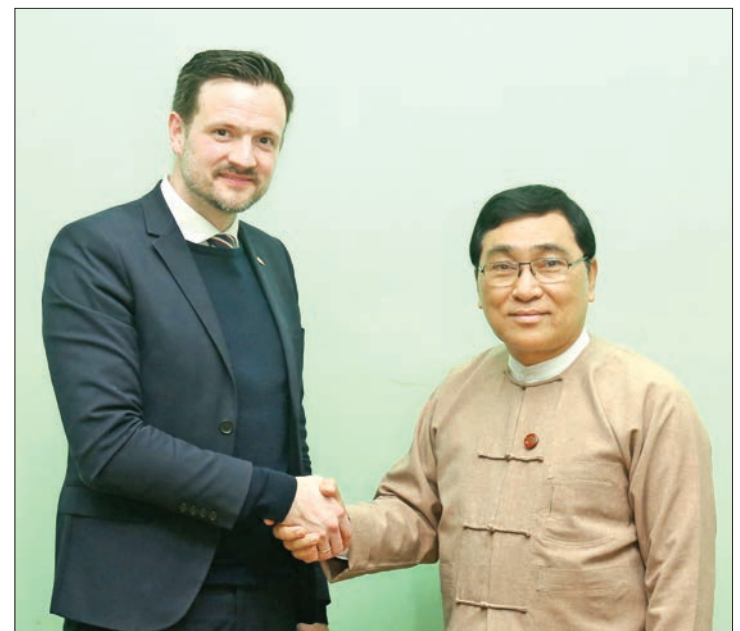
Union Minister Dr. Win Myat Aye shakes hands with Norwegian Minister of International Development Mr. Dag-Inge Ulstein.

for social economic development and stability in Rakhine State, cooperation of the ASEAN countries and internationals in repatriation processes, processes to close internally displaced person (IDP) camps, national level strategy drawing, equality in gender plus development programs for women and agendas to cooperate with Norway.—MNA (Translated by Kyaw Zin Lin)