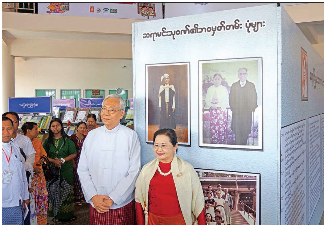
Former President U Htin Kyaw and wife Daw Su Su Lwin pose for a photo in front of the poster of Saya Min Thu Wun during an opening of the Children's Literary Festival in Bago.

Publishers also play an important role in publishing the great writings of the above mentioned writers and authors. Writings of great writers need to be published. So make some profit but make the books reachable (affordable) for children. Many good publishers who published book that encourage education