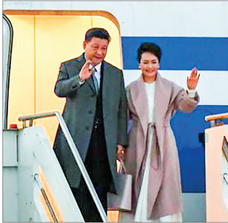
Mr Xi descended from his Air China Boeing 747 with first lady Peng Liyuan at Rome's Fiumicino airport before being whisked off to their hotel on 21 March, 2019.

NATO member Italy's plan to join China's ambitious mar-