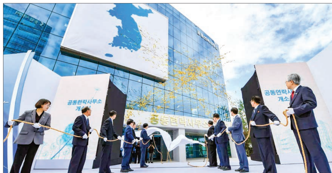
The four-storey joint liaison building includes separate Northern and Southern offices and a conference room.

Moon has long backed engagement with the North to bring it to the negotiating table, and has been pushing the carrot of inter-Korean development projects, among them the restarting of an industrial zone also in Kaesong and lucrative cross-border tourist visits by Southerners to the North's picturesque Mount Kumgang.