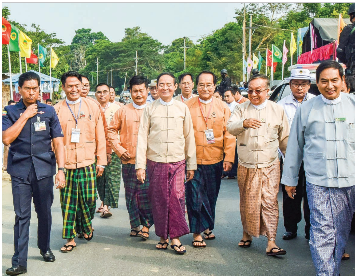
President U Win Myint inspects the completion of the two-lane Nant Myitkha Bridge on Myitkyina-Waingmaw road in Myitkyina.

The Nant Myitkha Bridge is a reinforced concrete steel frame type bridge and is on the Mandalay-Lashio-Bhamo-Myitkyina road. The maximum permitted load was 75 tons per vehicle. The bridge is a four lane bridge and at the moment a two lane portion was already