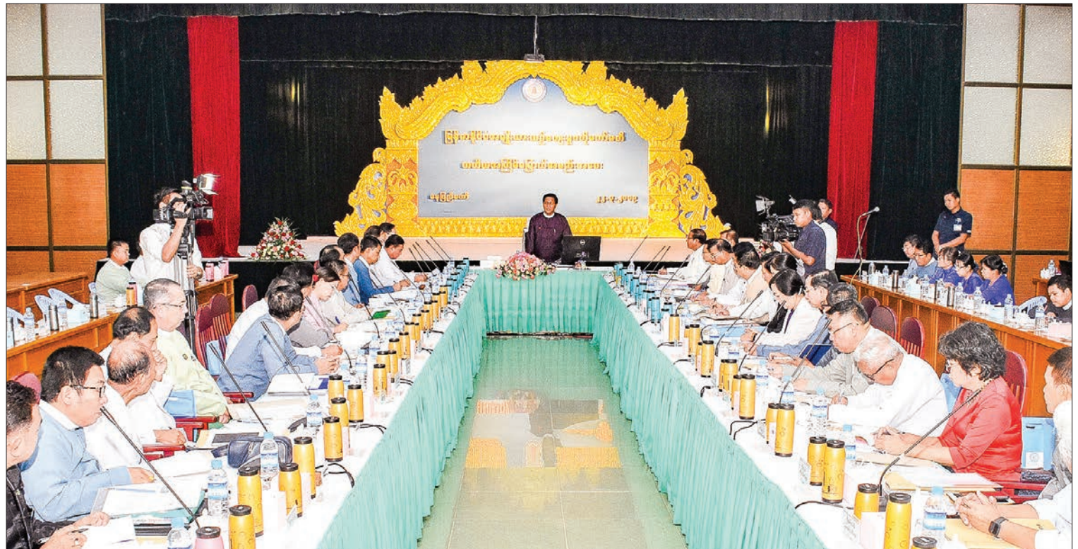
Vice President U Henry Van Thio delivers the address at the National Cultural Central Committee meeting at the Ministry of Religious Affairs and Culture in Nay Pyi Taw.

The International Council on Monuments and Sites (ICOMOS) had read the nomination