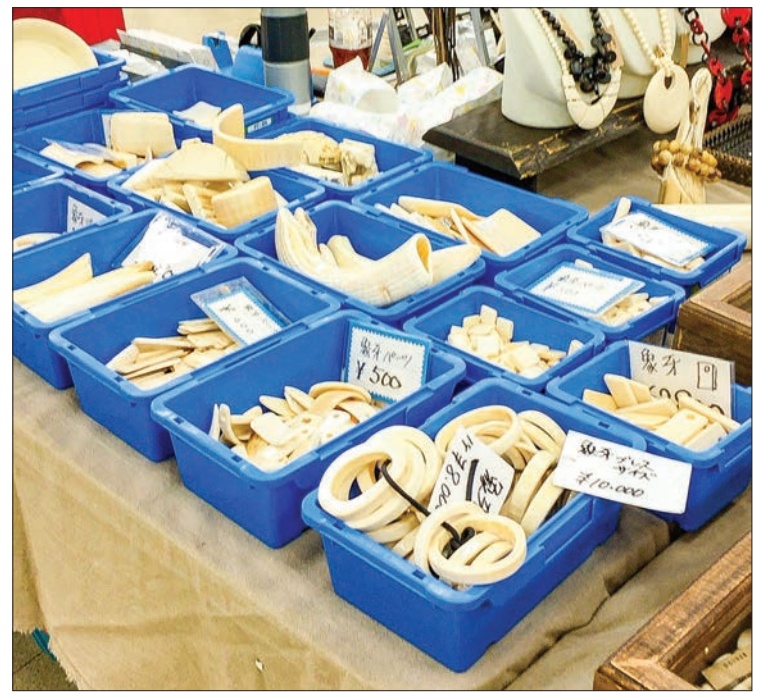
Ivory products are seen on sale at a market in Tokyo in this supplied photo taken in August 2017. Japan is fueling the internationally outlawed ivory trade by failing to curb “rampant” illegal exports to China and inadequately monitoring its own legal but poorly regulated domestic sales, a wildlife trade watchdog said on Dec. 20.

The conservation group said more than 2.4 tons of ivory was unlawfully exported from Japan to China and elsewhere between 2011 and 2016.—Kyodo News ■