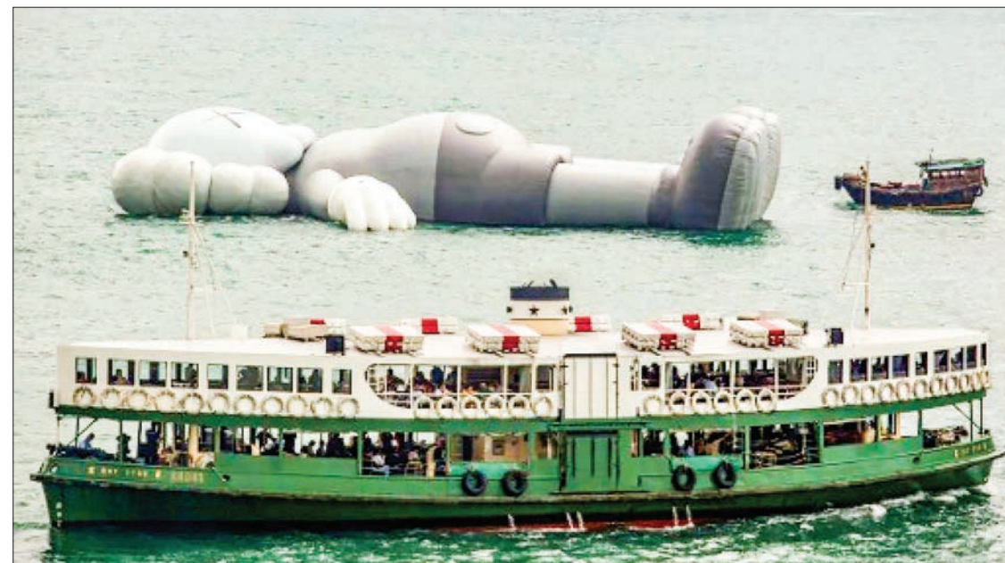
‘KAWS:HOLIDAY’, an inflatable sculpture by US artist and designer Brian Donnelly, known professionally as KAWS, is on display in Hong Kong’s Victoria Harbour.

“I don’t know what this one looks like, it’s just lying there,” she added, saying it reminded her of a corpse. — AFP