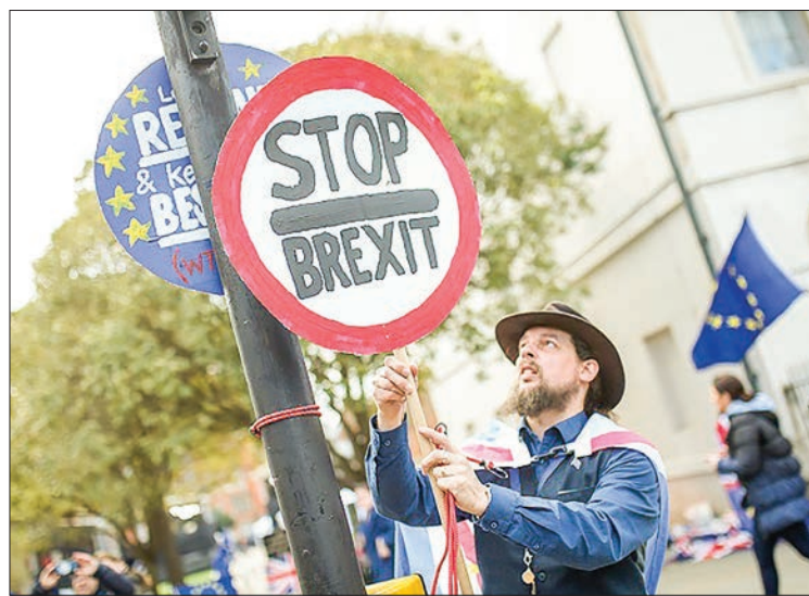
A demonstrator holds a placard outside the Houses of Parliament in London, Britain, March 11, 2019.

LONDON — A national petition to the British Parliament calling for Brexit to be cancelled received more than 2 million signatures by Thursday night.