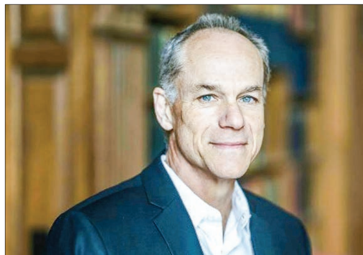
Theoretical physicist Marcelo Gleiser has been awarded the Templeton Prize Dartmouth College.

Gleiser joins Desmond Tutu, the Dalai Lama and dissident Soviet author Aleksandr Solzhenit-