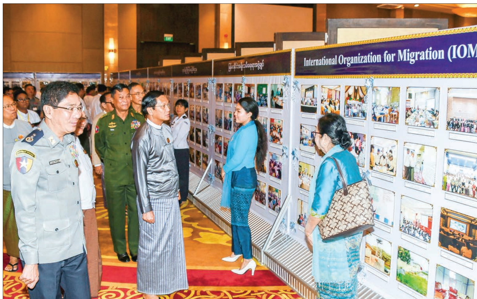
Vice President U Henry Van Thio visits booth at Anti-Human Trafficking Day ceremony in 2018.

Myanmar is responsible to take chair of SOM-ED for the year 2019 and has been participating in the educational activities of the ASEAN. The SOMTC Philippines hosted the ASEAN Cross-sectoral meeting on the implementation of Bohol TIP Work Plan (2017-2020) from 5-6