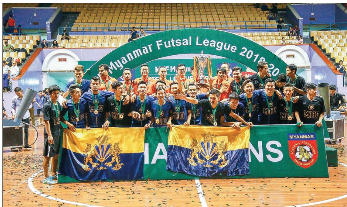
Team MIC, the Myanmar Futsal League 2018 winners celebrate after receiving the championship trophy.