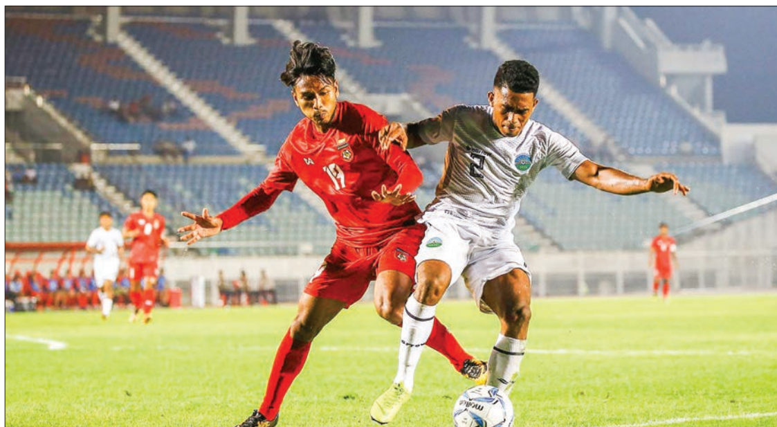
Myanmar (red) and Timor Leste (red) fight for the ball during yesterday's AFC U-23 Championship qualifier at the Thuwunna Stadium in Yangon.