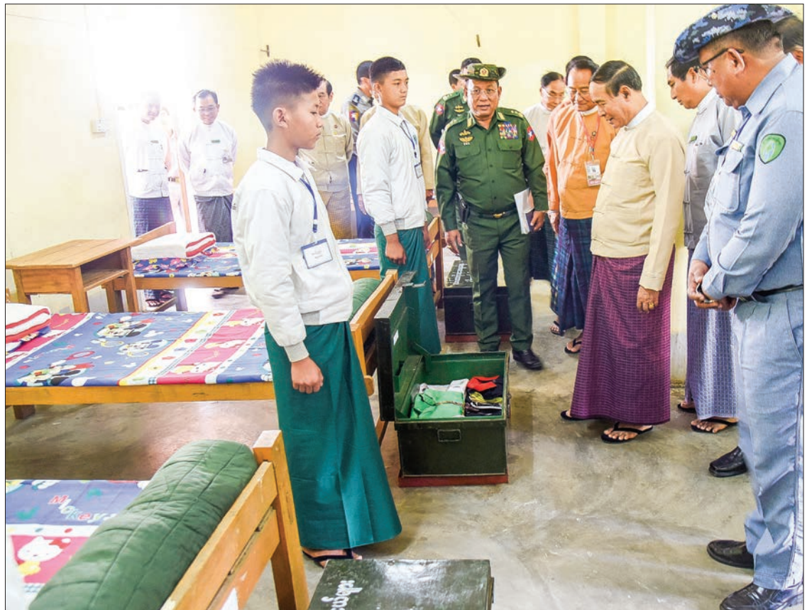
President U Win Myint inspects the living quarters at the youth training school in Myitkyina.