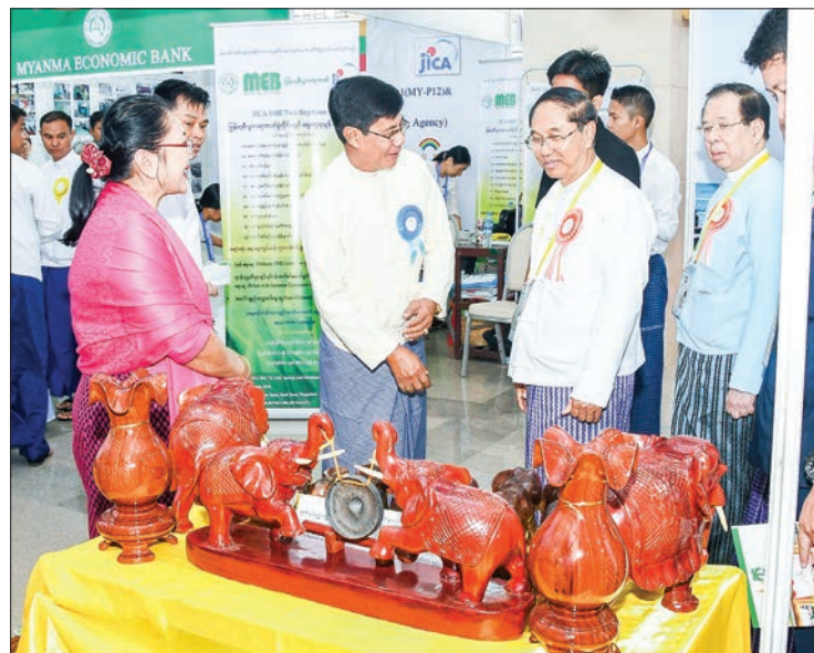
Vice President U Myint Swe inspects products displayed at the National-level MSMEs Products Trade Fair and Contest in Nay Pyi Taw.

The Vice President said the Union Government had been providing loans to MSMEs in need of capital by collaborating with domestic private banks. The loans include K30 billion from the National SME loan programme, K7.393 billion from the Credit Guarantee Insurance (CGI) system, JPY20 billion from the JICA Two Step Loan under the Japan Official Development Assistance, K250 billion from Myanmar Economic Bank loan, K200 billion from Myanmar Agricultural Development Bank, and Euro 15.30 million from the KfW, the German state-owned develop-