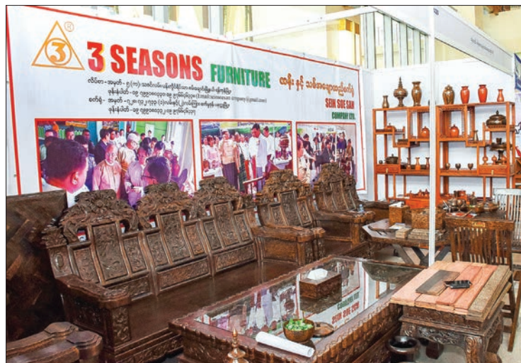
Furnitures and products displayed at the Micro, Small and Medium Enterprises (MSMEs) Products Trade Fair and Contest held in Nay Pyi Taw yesterday.