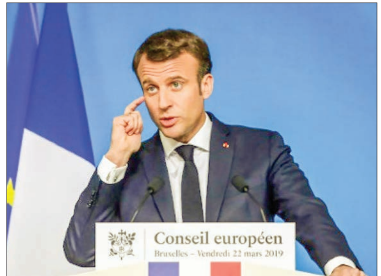
French President Emmanuel Macron accused his EU counterparts of not only failing to follow through on their pledges under the Paris climate agreement but also ignoring the demands of thousands of students who have marched in European streets AFP. PHOTO: AFP

This appeared to refer Poland’s concerns about protecting an economy heavily reliant on coal and Germany’s concerns to keep its economy competi-