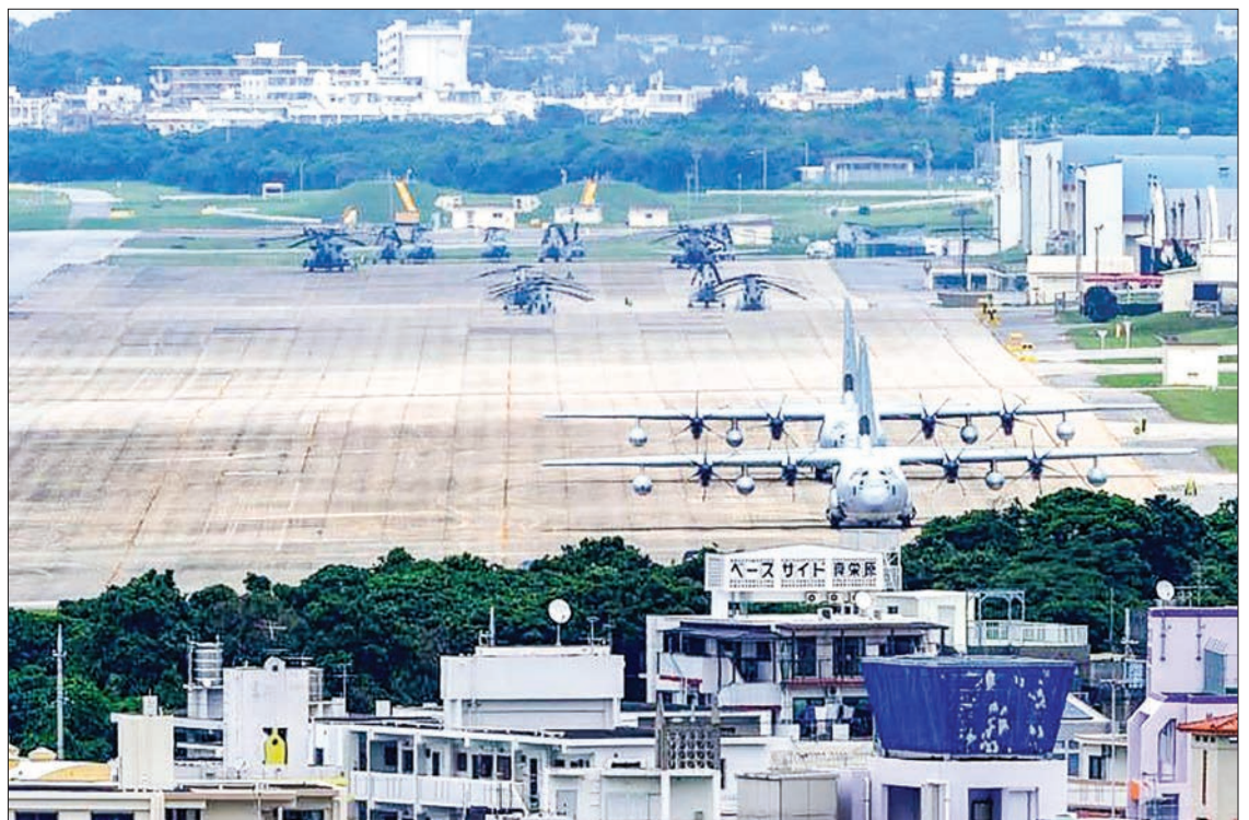
This file photo taken on April 24, 2010 shows planes and helicopters stationed at the US Marine Corps Air Station Futenma base in Ginowan, Okinawa prefecture, Japan.

been rising on the island, with locals insisting that the central government pay heed to the results of the referendum and move the base out of Okinawa and Japan altogether.—Xinhua ■