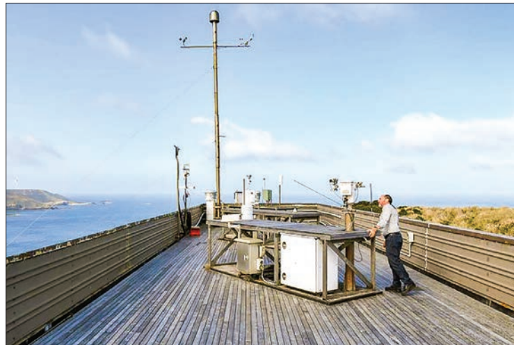
Mr Sam Cleland, the officer in charge of the Cape Grim Baseline Air Pollution Station, looking at the station’s equipment in Cape Grim, Tasmania.

When the wind blows from the southwest, Cleland and his team capture a sample using