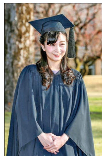
The princess, the younger daughter of Prince Fumihito and Princess Kiko, appeared in front of the press in a black gown, cap, and white high heels ahead of the graduation ceremony.

TOKYO—Princess Kako, the 24-year-old granddaughter of Emperor Akihito, expressed her wish for her sister’s happiness in a written answer to the media on the occasion of her graduation from International Christian University in Tokyo on Friday.