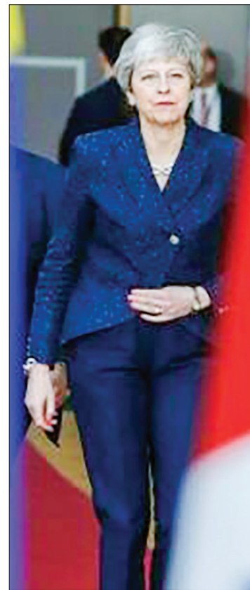
It still remains far from clear that British Prime Minister Theresa May will be able to get the withdrawal agreement she signed last November past the House of Commons.

sion, there is a chance the decision might be taken out of May's hands.