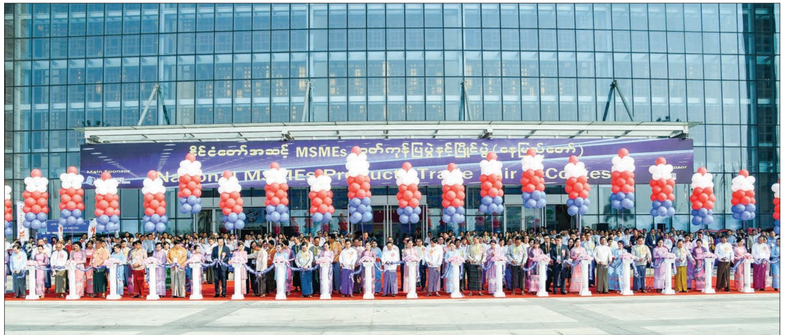
Vice President U Myint Swe, center, cuts ceremonial ribbon to open National-level MSMEs Products Trade Fair and Contest in Nay Pyi Taw.