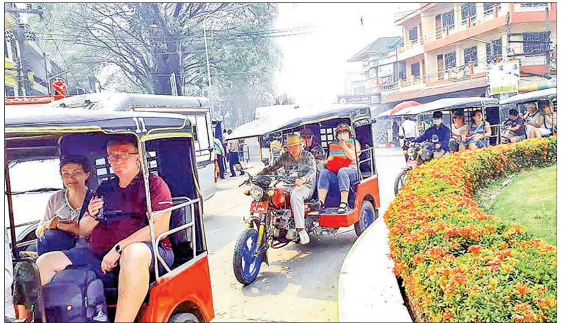
Tourists sightseeing with three wheeled motorcycle in Tachilek.

There has been a continuous stream of international tourists visiting Myanmar to explore its natural landscapes, visit tourist attractions, and observe cultural and social