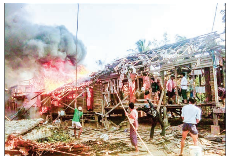
Local people putting out the fire.