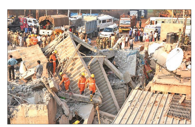
Around 400 rescuers have been scouring through tonnes concrete and steel after the building collapse.

rescuers with specialised equipment and sniffer dogs were deployed in the increasingly desperate operation.