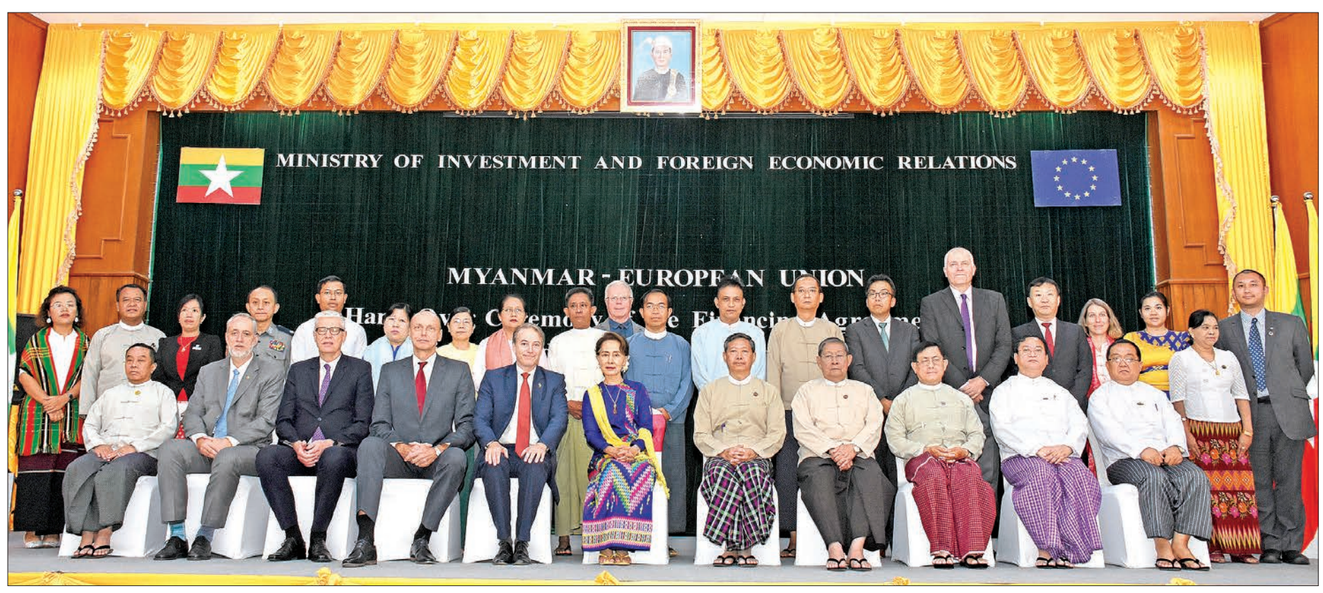
State Counsellor Daw Aung San Suu Kyi poses for the documentary photo together with participants at the hand-over ceremony of the Financing Agreement between Myanmar and the European Union for Enhancing the Education and Skills base in Myanmar held in Nay Pyi Taw yesterday.

STATE COUNSELLOR Daw Aung San Suu Kyi attended a Hand-over Ceremony of the Financing Agreement between Myanmar and the European Union for Enhancing the Education and Skills base in Myanmar held at the Ministry of Investment and Foreign Economic Relations in Nay Pyi Taw.