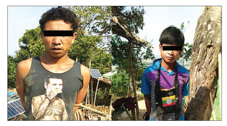
The two suspects captured near Yesochaung Village.

SECURITY forces conducting an operation on 20 March in Rakhine State found three members of the AA group planting landmines. One of them was killed and two were arrested.