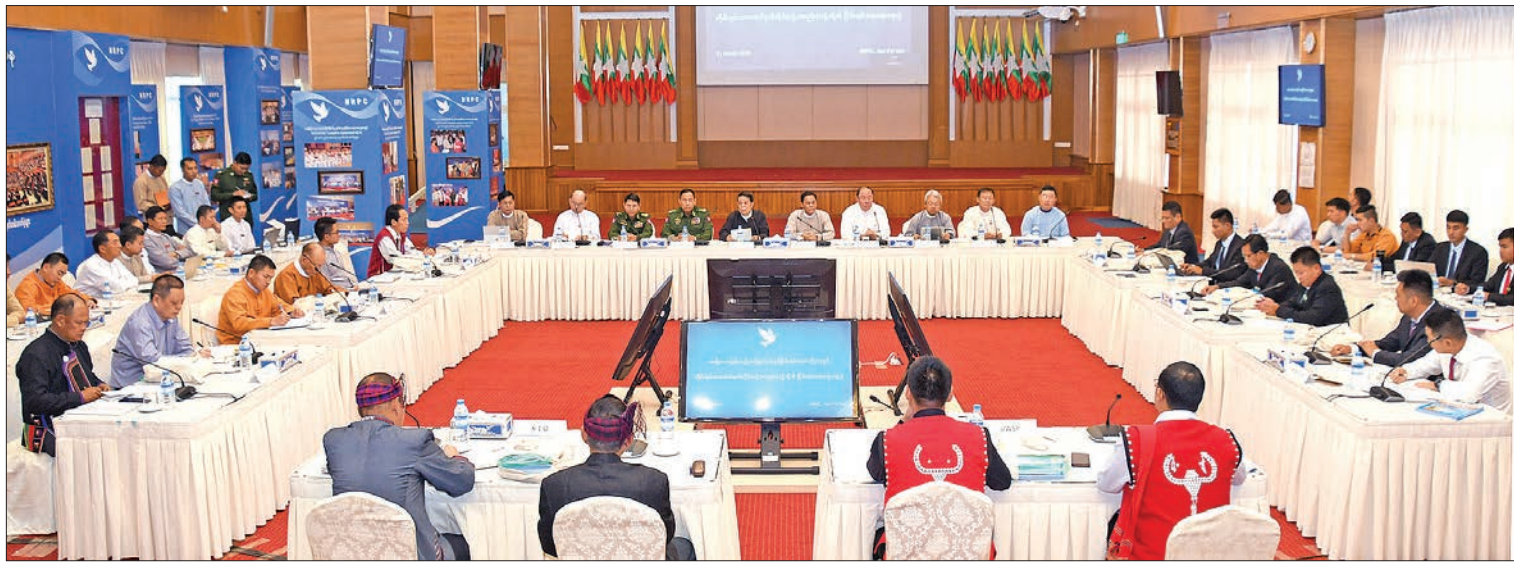
National Reconciliation and Peace Centre members and representatives from eight ethnic armed organizations held a meeting at the NRPC office in Nay Pyi Taw yesterday.