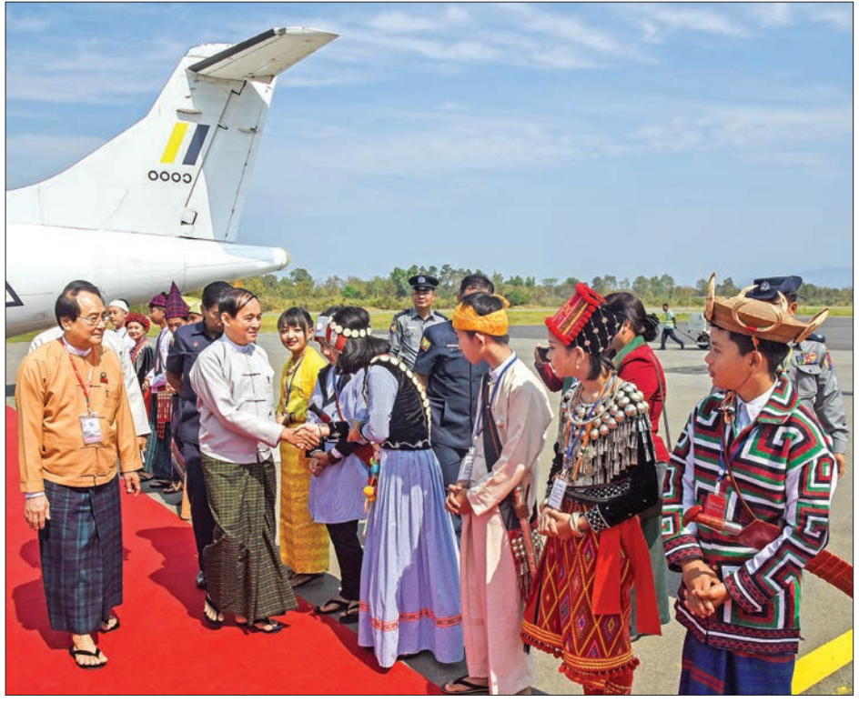
President U Win Myint is welcomed by ethnic youths in Myitkyina Airport.