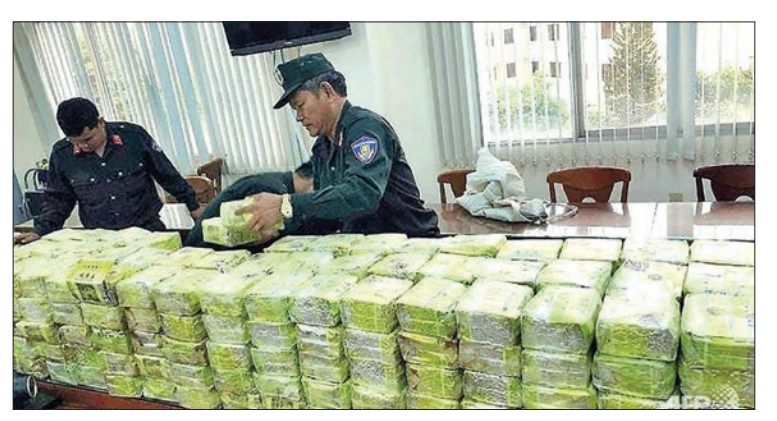
Vietnamese police display bricks of methamphetamine in Ho Chi Minh City after a major bust on 20 March, 2019.

The confiscated drugs were likely transported from Laos, travelling through Kon Tum province for "consumption in Ho Chi Minh City", the official Viet Nam