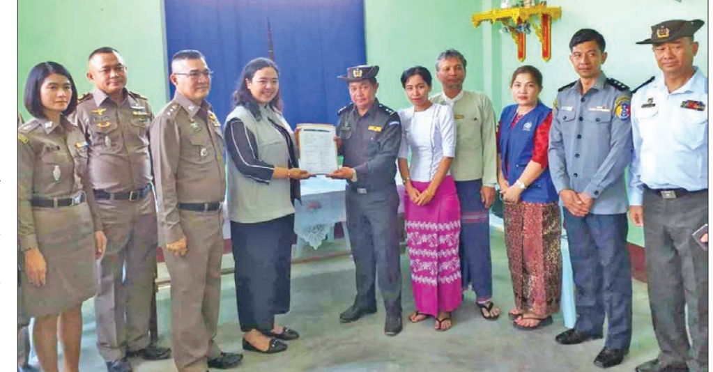
Eighteen Myanmar nationals, who were trafficked to Thailand were sent back to Myanmar through an arrangement of Ministry of Social Welfare, Relief and Resettlement and Thailand's Ministry of Social Development and Human Security.

at the temporary care center in Myawady Town. The Myawady Anti-Human Trafficking Police will look into their essential needs, travel documents, repatriation, and conduct necessary investigations.