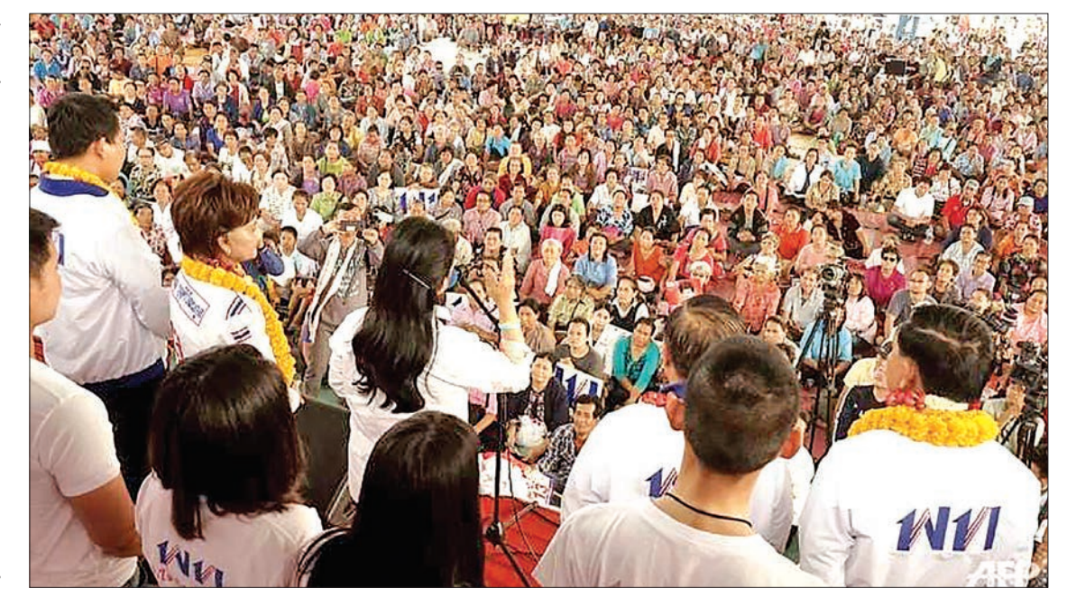
Thousands of Thais loyal to ex-premier Thaksin Shinawatra gather for a political rally in rural Chaiyaphum.

Thousands of rice farmers gathered in a school yard earlier this week for a Pheu Thairally in rural Chaiyaphum, applauding promises of better times ahead