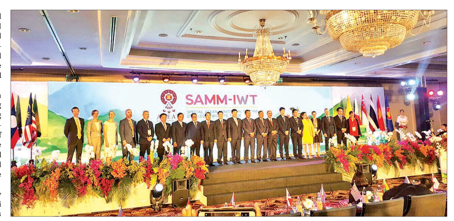
Union Minister U Ohn Win poses for the documentary photo with ministers from relevant ASEAN ministries at the Special ASEAN Ministerial Meeting on Illegal Wildlife Trade in Chiang Mai, Thailand.

The meeting was hosted by alternating ASEAN chair Thai Minister for Natural Resources and Environment. The meeting was attended by Union Minister for Natural Resources and Environmental Conservation U Ohn Win, ministers from relevant ASEAN ministries, senior officials and other officials, ASEAN Secretary General Mr. Dato Lim Jock Hoi, representatives for Britain, United States of America and European Union, Con-