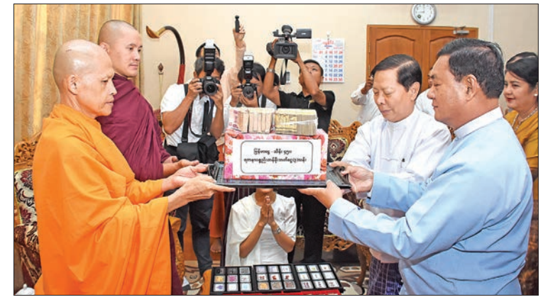
Union Minister Thura U Aung Ko accepts cash donations for construction of Eternal Peace Pagoda from Thai Sayadaws.