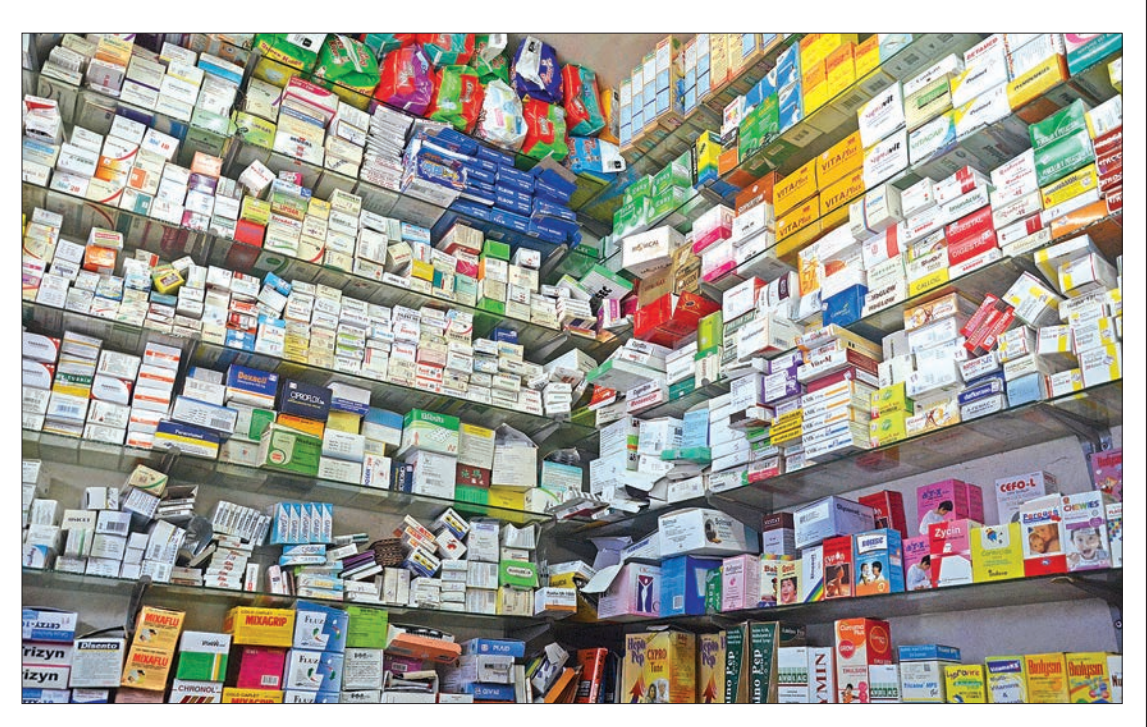
Western medicine products displayed on the pharmacy shelves at a drugstore.