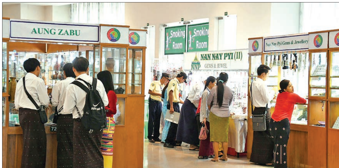
Gems merchants checking quality of gems and jewellery at the gems shops in the hall of 56 th Myanmar Gems Emporium in Nay Pyi Taw yesterday.