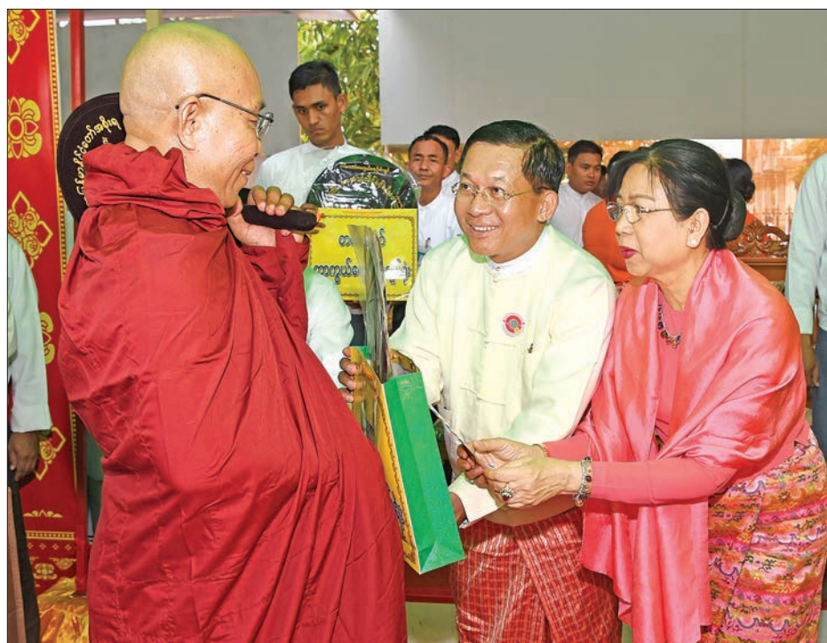
Commander-in-Chief of Defence Services Senior General Min Aung Hlaing and wife donate offertory to a Sayadaw.