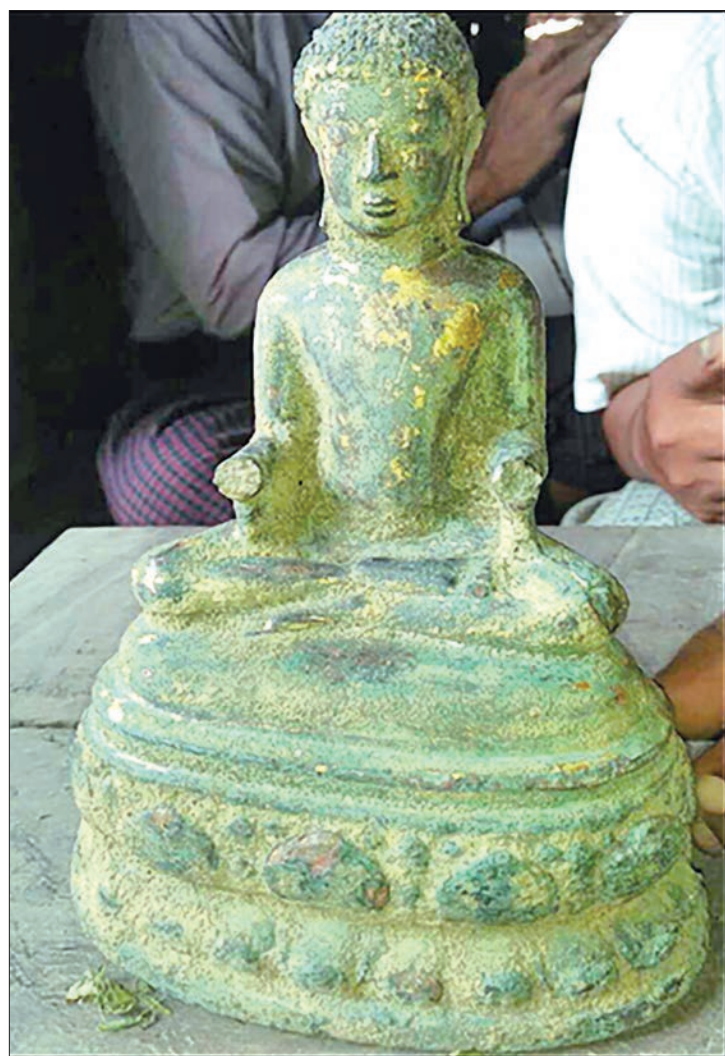
Pyu-era ancient Buddha statue found in Pyay, Bago Region.