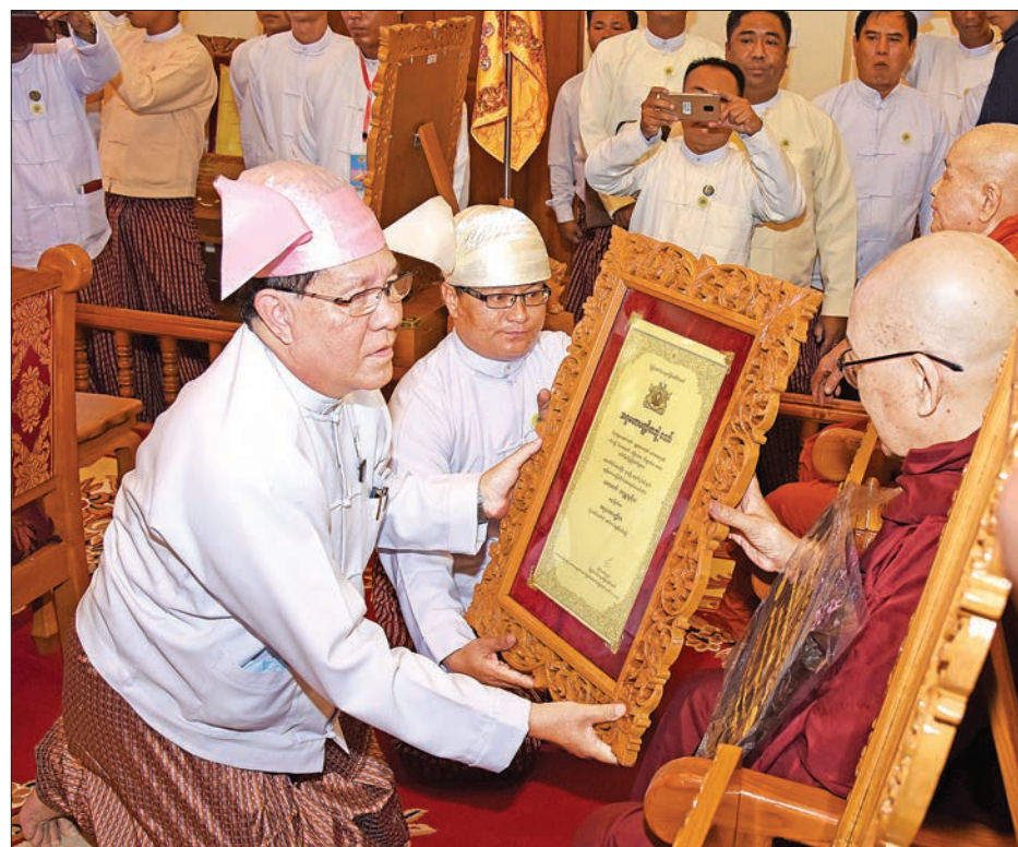
Chief Justice of the Union U Htun Htun Oo presents Agga Maha Panditta title to Sayadaw Bhaddanta Thuriya.