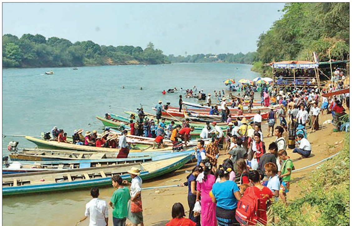
Small boats ferrying pilgrims during the Shwe Saryan pagoda festival

"We went to the pagoda festival on motorbikes. The festival was crowded with pilgrims. We had to pay K1,000 per person for a return trip. At the festival, we played with water, throwing it on one another," said a visitor