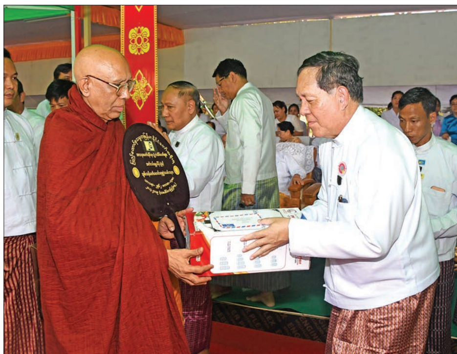
Chief Justice of the Union U Htun Htun Oo donates offertory to a Sayadaw.