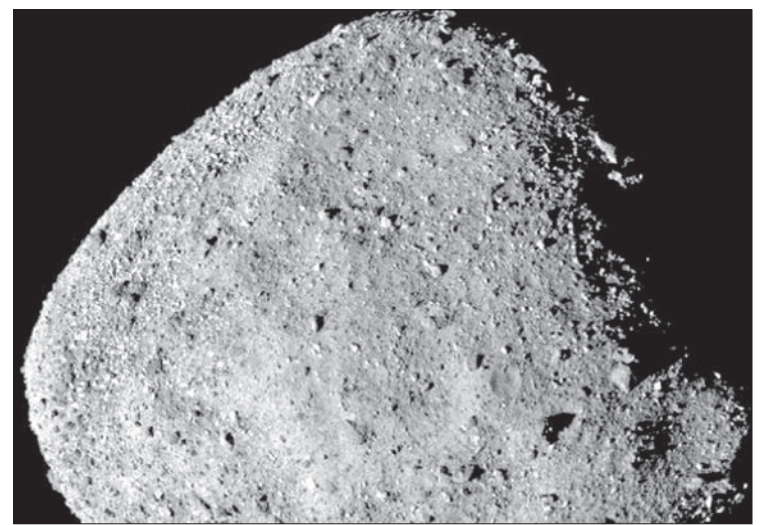
The asteroid Bennu, photographed in December 2018 by the NASA probe OSIRIS-REx, which aims to collect a sample next year.

The results indicated that the exposure to carbon dioxide concentration in multiple generations could enhance grain yield but exacerbate grain quality reduction in wheat. The short-term plant response to carbon dioxide concentration could not estimate the long-term response of wheat crops to a future carbon dioxide enriched environment, said the study.—Xinhua ■