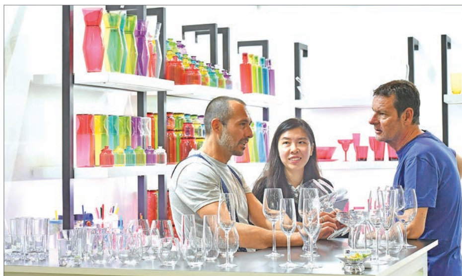
Asia's leading houseware fair. PHOTO: BUSINESS WIRE AFP

An array of seminars, networking events, product demo and launch pad sessions will be arranged during the fair to facilitate business matching and networking. Held concurrently in the same venue, the HKTDC Hong Kong International Home Textiles and Furnishings Fair will take buyers into the blossoming world of fine textiles.—AFP ■