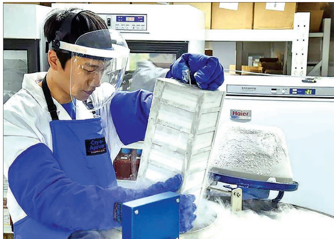
A member of staff handles samples at the gene bank.

Such a framework should be scalable, sustainable and appropriate for use at the international, regional, national and local levels, the WHO said. —Xinhua ■