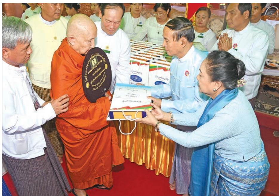
President U Win Myint and First Lady Daw Cho Cho donate offertory to a Sayadaw at the ceremony to donate provision to the Members of the Sangha.