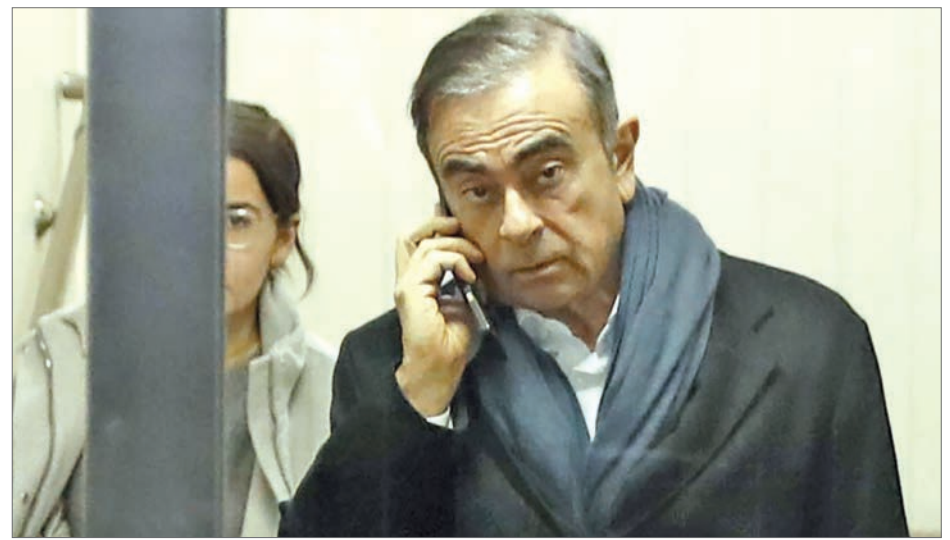
Ghosn leaves his lawyer's office in Tokyo on 12 March, 2019.