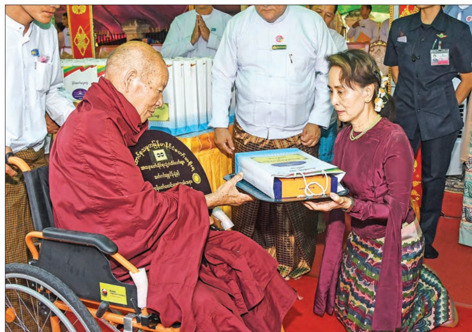
State Counsellor Daw Aung San Suu Kyi donates robe to a Sayadaw at the ceremony to donate provision to the Members of the Sangha.