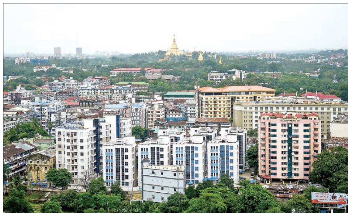
File photo shows aerial view of Yangon's real estate development.

The agriculture sector attracted four foreign investment with a capital of $14 million. Livestock and Fisheries sector witnessed seven foreign