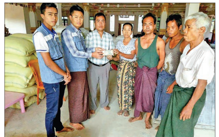
Disaster Management Department staff hand over cash assistance to IDPs in Ponnagyun Township.