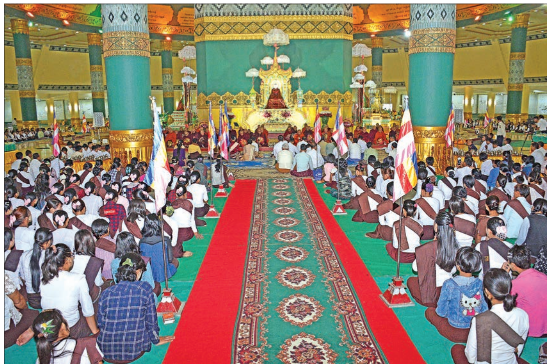
People from religious associations celebrate the 11 th Buddha consecration and lotus robe offering ceremony at the Uppatasanti Pagoda in Nay Pyi Taw.

A CEREMONY to mark the 11 th Buddha consecration and lotus robe offering was held at the cave of the Uppatasanti Pagoda, Nay Pyi Taw, yesterday.