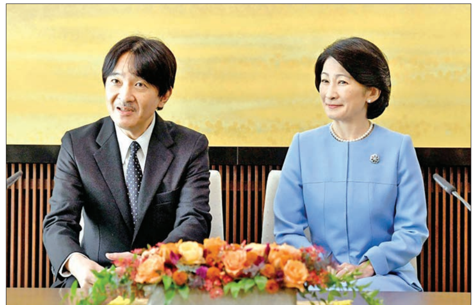
Japanese Prince Fumihito, the younger son of Emperor Akihito, and his wife Princess Kiko are planning an official trip to Poland and Finland for about 10 days in late June.

Their couple's younger daughter, Princess Kako, who will graduate from university this spring, could visit Austria and Hungary as Japan celebrates the 150th anniversary of diplomatic relations with the two countries, an official at the agency said. —AFP ■