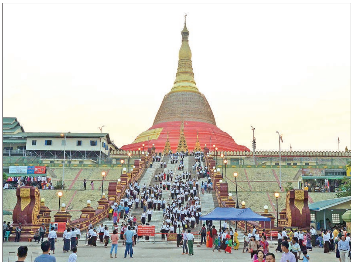
Devotees visiting the Uppatasanti Pagoda in Nay Pyi Taw on fullmoon day of Tabaung.