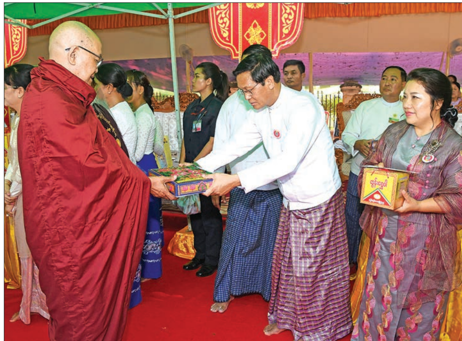
Vice President U Henry Van Thio and wife donate offertory to a Sayadaw.