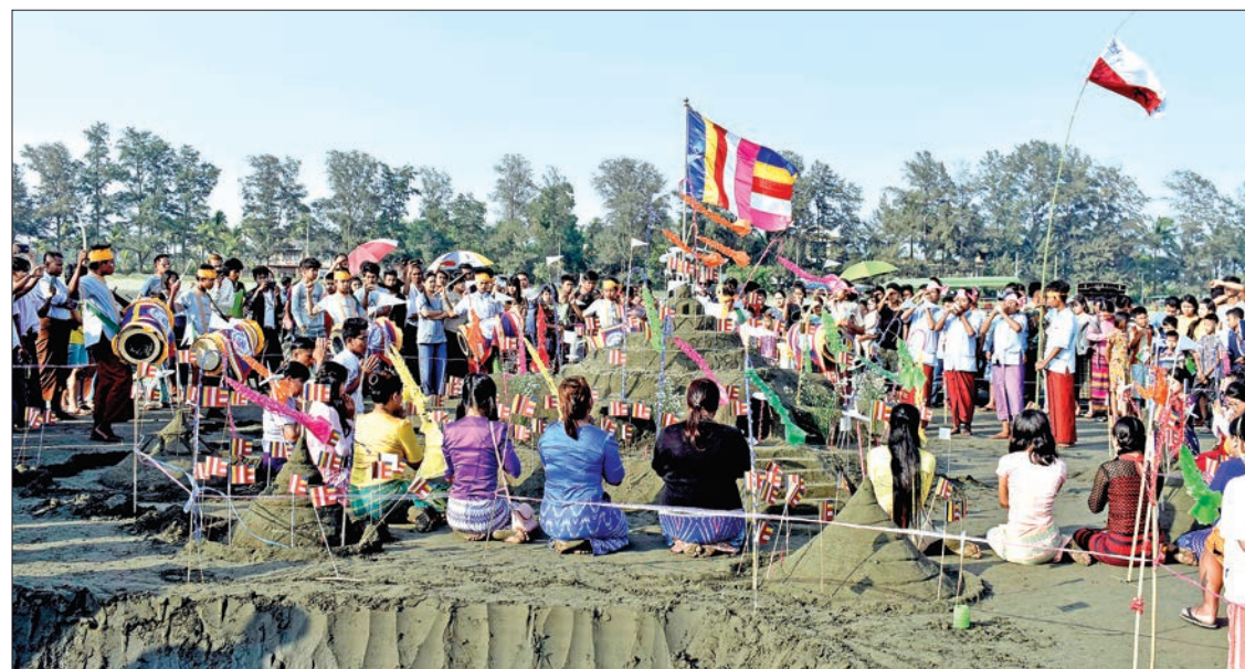
People participate in the Rakhine traditional sand pagoda festival held in Ngapali beach.