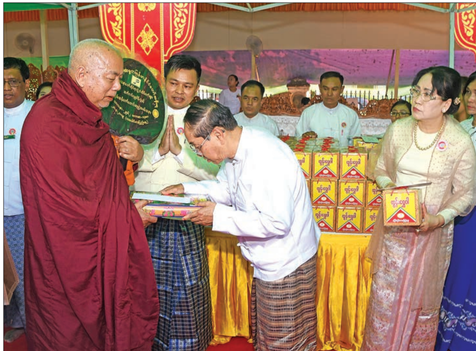
Vice President U Myint Swe and wife donate offertory to a Sayadaw.