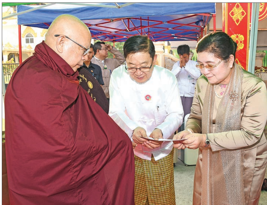
Pyithu Hluttaw Speaker UT Khun Myat and wife donate offertory to a Sayadaw.