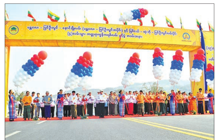
The opening ceremony of new four-lane asphalt roads between Mandalay, PyinOoLwin, Nawngkhio and Myitnge is held on 19 th March.

The four-lane asphalt roads were constructed by Oriental Highway under the BOT system (Build-Operate-Transfer). The roads are 48 feet wide. A total of K19 billion was spent on constructing the nine-mile long Myitnge-Htonebo section, while the 45-mile long Mandalay-PyinOoLwin section was built at a cost of K85 billion.—Aung Thant Khine (Translated by La Wonn)