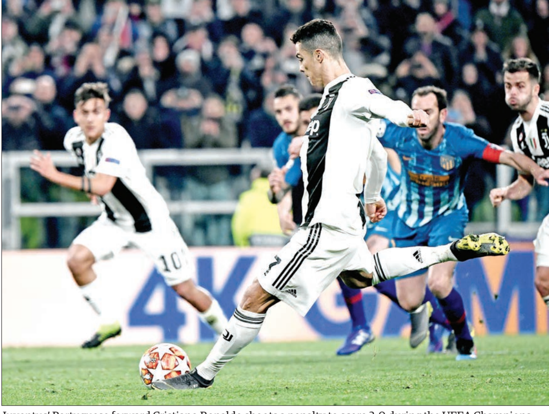
Juventus' Portuguese forward Cristiano Ronaldo shoots a penalty to score 3-0 during the UEFA Champions League round of 16 second-leg football match Juventus vs Atletico Madrid on 12 March, 2019 at the Juventus stadium in Turin

As the matches are recognized by FIFA, Myanmar needs a win to change its FIFA ranking, and the national team has promised entertaining matches and urged fans to watch them.— Lynn Thit(Tgi)