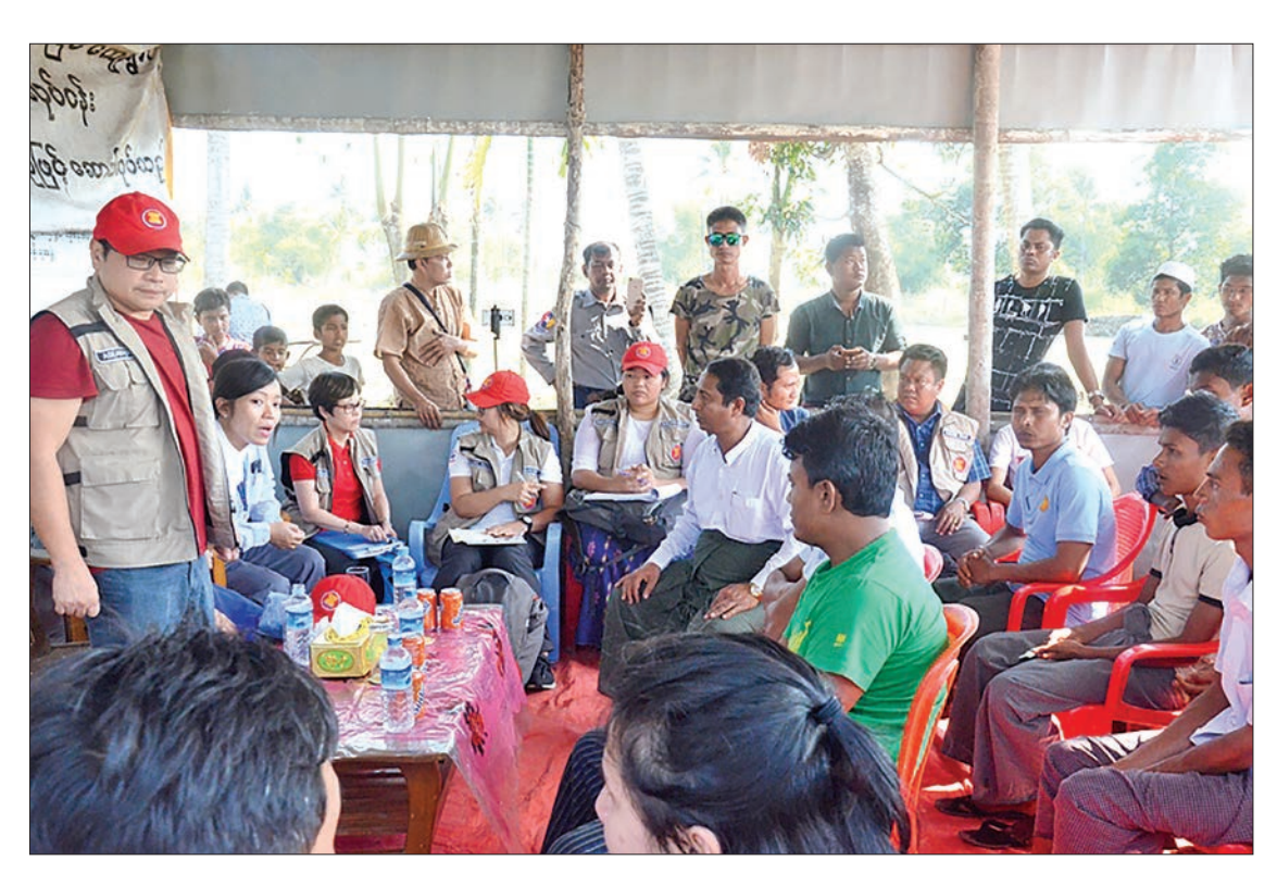
ASEAN-Emergency Response and Assessment Team meeting with local people during their visit to Pantawpyin Village in Maungtaw, Rakhine State.

ed a training in Nay Pyi Taw for safety of the members of the team and called on Union Minister Dr. Win Myat Aye on 6 March.