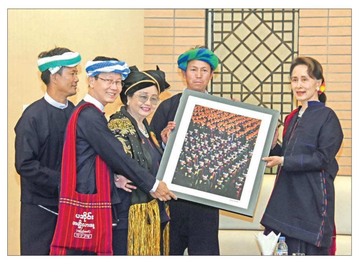
Pa-O ethnic dignitaries presents an award winning photo to State Counsellor Daw Aung San Suu Kyi at the ceremony to mark the Pa-O National Day event in Nay Pyi Taw yesterday.

celebrated this year to bring all the Pa-O ethnic people across the country in one place, to promote ethnic literature and tra-