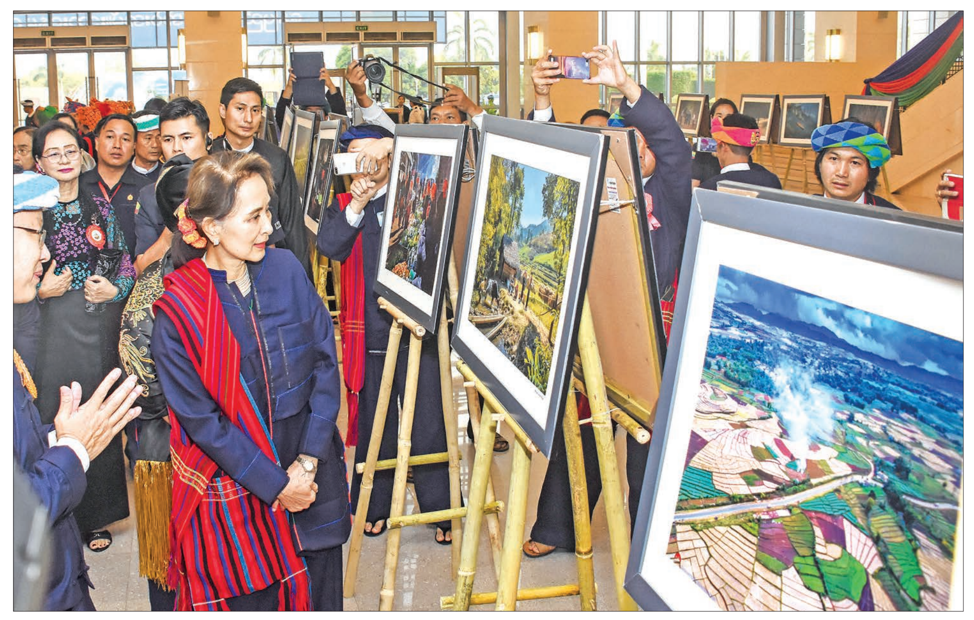
State Counsellor Daw Aung San Suu Kyi visits the photo exhibition at the event in Nay Pyi Taw yesterday to mark the 70th Pa-O National Day.