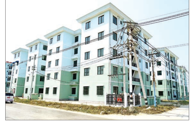
Low-cost housing units in Hlinethaya.

THE Urban and Housing Development Department has announced the sale of Kyansitmin low-cost housing units, located