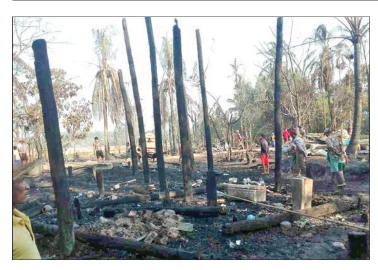
Fire destroys nine houses and left 34 people homeless in Ngamyinchaung Village on 12 March.