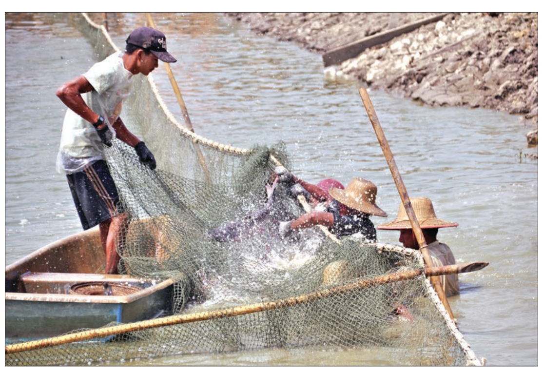
Workers harvest fish at a farm in Ayeyawady Delta.