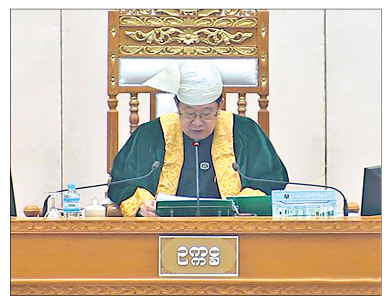
Pyithu Hluttaw Speaker UT Khun Myat.

Deputy Minister for Defence Rear-Admiral Myint Nwe replied that the navy is currently assuming the duties pertaining to coast guards as Myanmar does not have one yet. He said when the coast guard has been formed, the navy will take the lead in forming