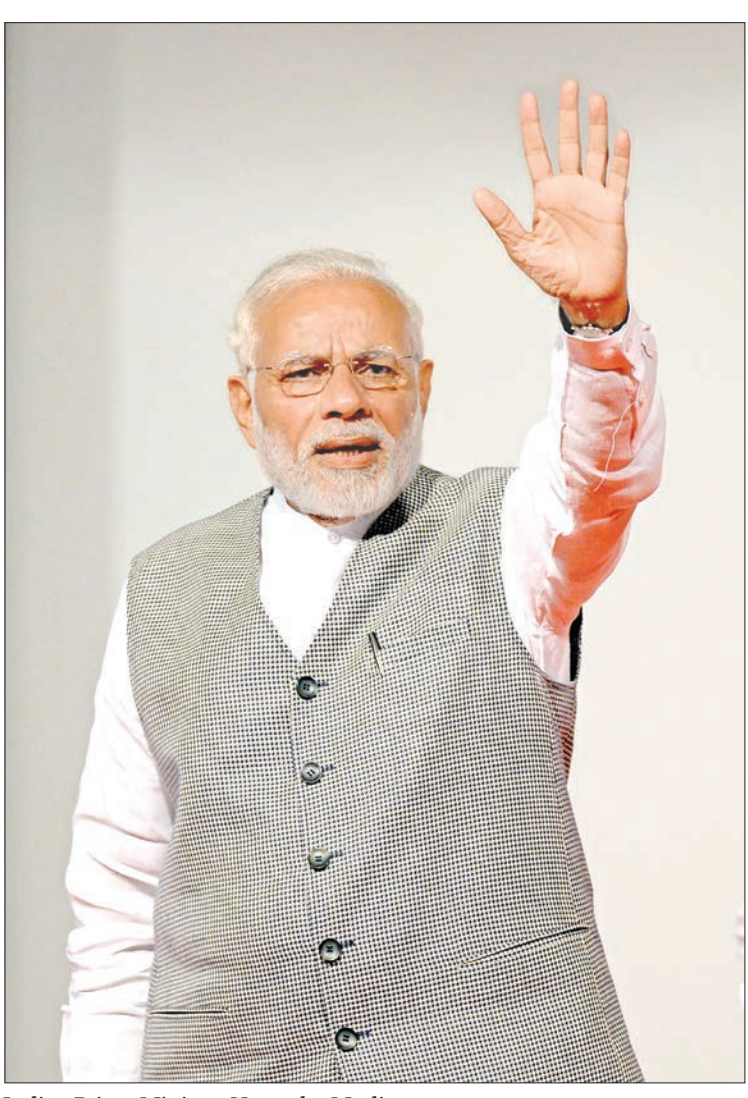
Indian Prime Minister Narendra Modi.

12 WORLD 14 MARCH 2019 THE GLOBAL NEW LIGHT OF MYANMAR