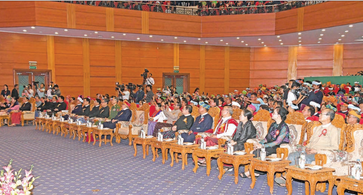
State Counsellor Daw Aung San Suu Kyi delivers the speech at the event to mark the Pa-O National Day in Nay Pyi Taw yesterday.