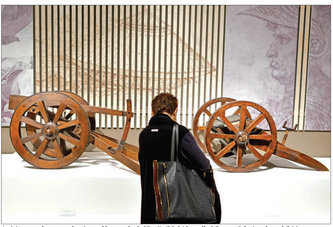
A visitor watches reproductions of Leonardo da Vinci's "Multi-barrelled Cannon" during the exhibition "Science Before Science" (La Scienza prima della Scienza) on March 12, 2019 at the Scuderie del Quirinale palace in Rome.

ROME (Italy)—A major exhibition dedicated to the scientific genius of Leonardo da Vinci opens in Rome on Wednesday, part of festivities to mark the 500<sup>th</sup> anniversary of the death of the artist and