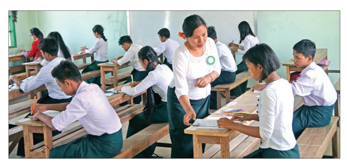
Students sit for matriculation exam yesterday.

Of the total students, 41 are taking the exam from the hospital, one is hearing impaired, 30 have physical disabilities, 17 are in prison, for Biology and