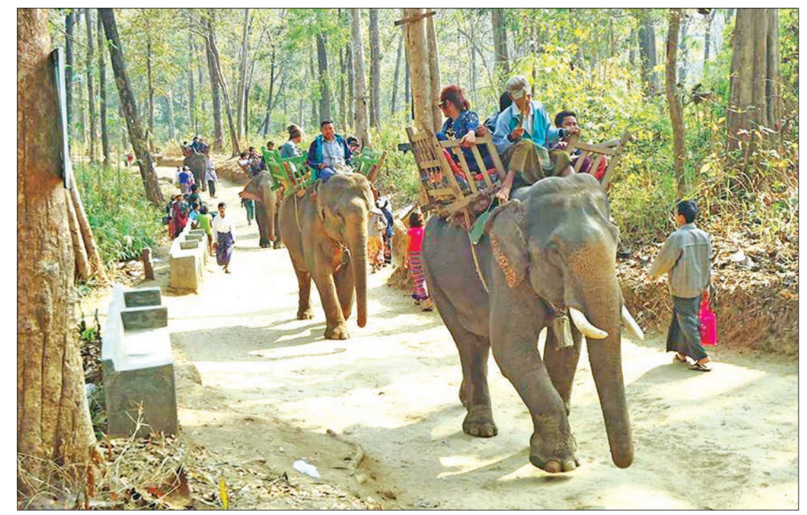
Pilgrims take elephant ride to Alaungdaw Kathapa Cave.

Arrangements have been made to upgraded the section of the road from Kapaingpwint to Gonenyin, from Nathtake to Thabatesayychaung and from Thabatesayychaung to Shukh-