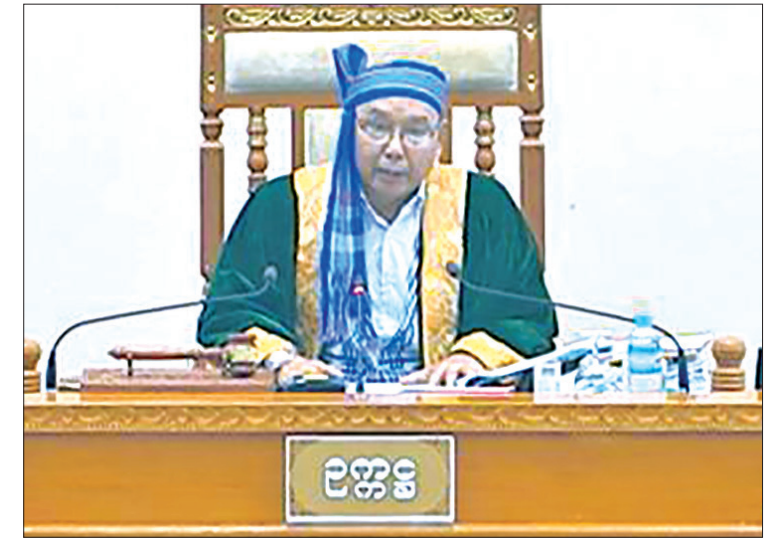
Amyotha Hluttaw Speaker Mahn Win Khaing Than.

At the Hluttaw session, U Win Maung of Magway Region constituency 6 asked if there was a plan to construct a three-storey RC residential unit with 90x30 feet, for the health employees for the 25-bed hospital in Sinbyugyun Town, Salin Township, Magway Region. Regarding to this query, Deputy Minister for Health and Sports Dr. Mya Lay Sein replied that the housing unit for the health employees had been included in the list of the scheme of the department of health in the 2019-2020 FY.