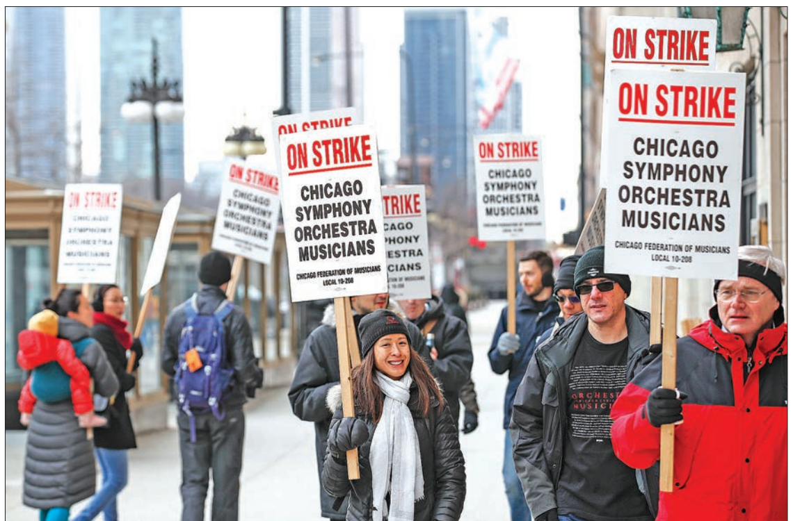
Members of the renowned Chicago Symphony Orchestra carry signs as they strike on 11 March, 2019 in Chicago, after 11 months of pay talks failed to reach an agreement. The musicians say the company is asking them to reduce overall salary and benefits despite increasing revenue from sales and donations.

The CSO's leadership has called the musicians' demands "unreasonable," while orchestra members warn that the board's plans would hurt their ability to attract and retain high-level players. ■