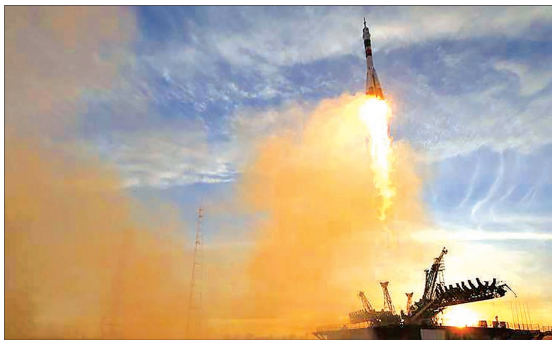
The next launch of the Soyuz MS-12 carrier rocket to the International Space Station is planned for 14 March.