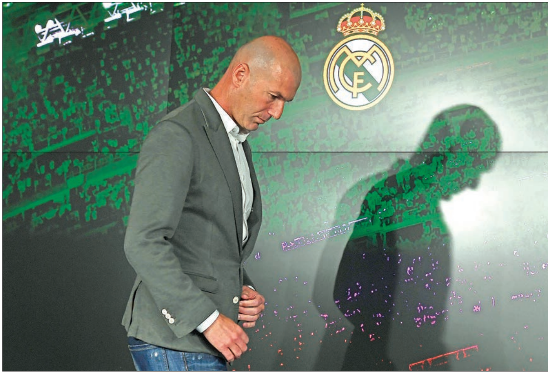
Real Madrid's newly appointed French coach Zinedine Zidane arrives to give a press conference on 11 March, 2019 in Madrid.