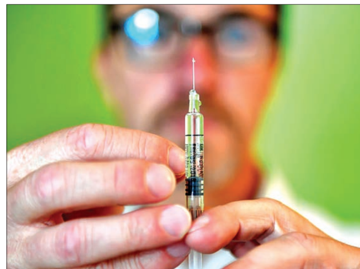
WHO recommends annual flu vaccines as the most effective way to prevent the spread of the disease, especially for healthcare workers and people at higher risk of influenza complications.

It insisted its new strategy would also have benefits beyond the fight against influenza, since it would also increase detection of other infectious diseases, including Ebola. — AFP ■