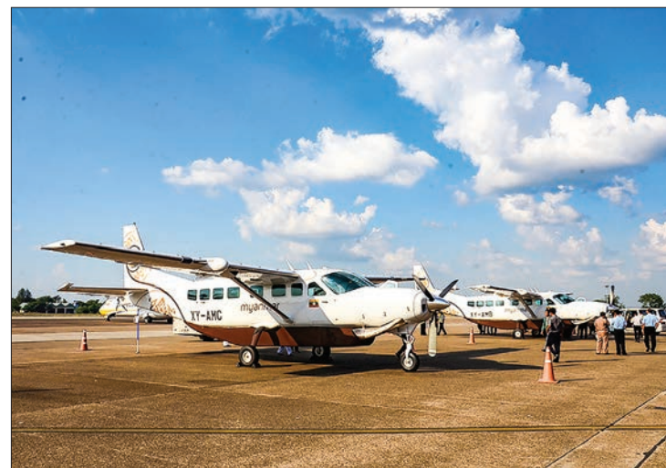
A Myanmar National Airlines's Grand Caravan Cessna aircraft seen at the airport.

At the request of the Magway Regional Government, the Ministry of Transport and Communications is planning to resume flight services between Yangon and Magway from April-end, said Dr.