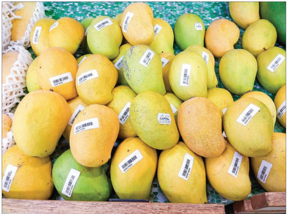
Myanma Seintalone mango.

"India is the world's largest mango producer, as per world mango production data, followed by China, where the mango harvest season falls around July. Therefore, exporters send man-