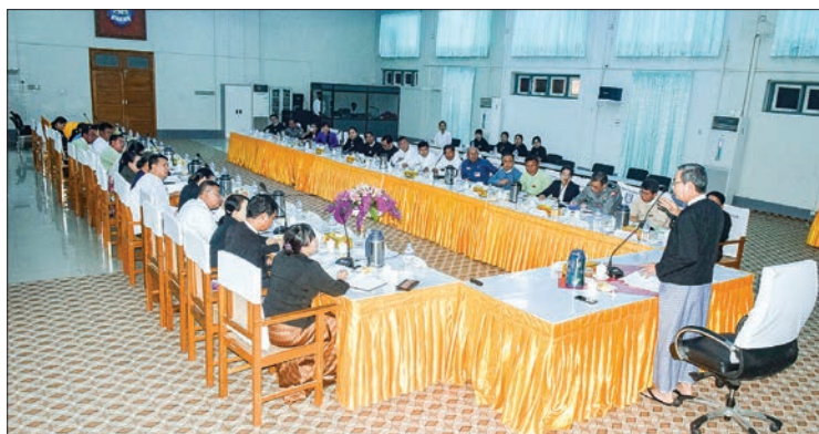
Deputy Attorney General U Win Myint delivers the speech at the meeting of Legal Affairs Work Committee on Elimination of Child Labor in Nay Pyi Taw.

The meeting was attending by Legal Affairs Work Committee members and departmental officials. — MNA ■