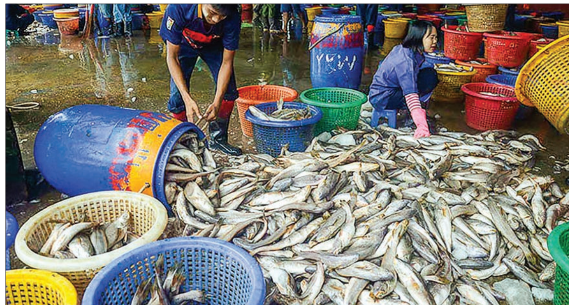
Workers select fish at the Nyaungtan Jetty in Yangon.

The country currently has nine ports incorporated with sea trade. The Yangon Port is the main gateway for Myanmar's maritime trade, and includes the Yangon inner terminals and the outer Thilawa Port. — Mon Mon (Translated by Ei Myat Mon)