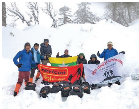
Meiktila hiking team celebrates as they reach 11,000-foot Mt. Phonekanrazi.

As a consequence, only six members of the hiking and mountaineer-