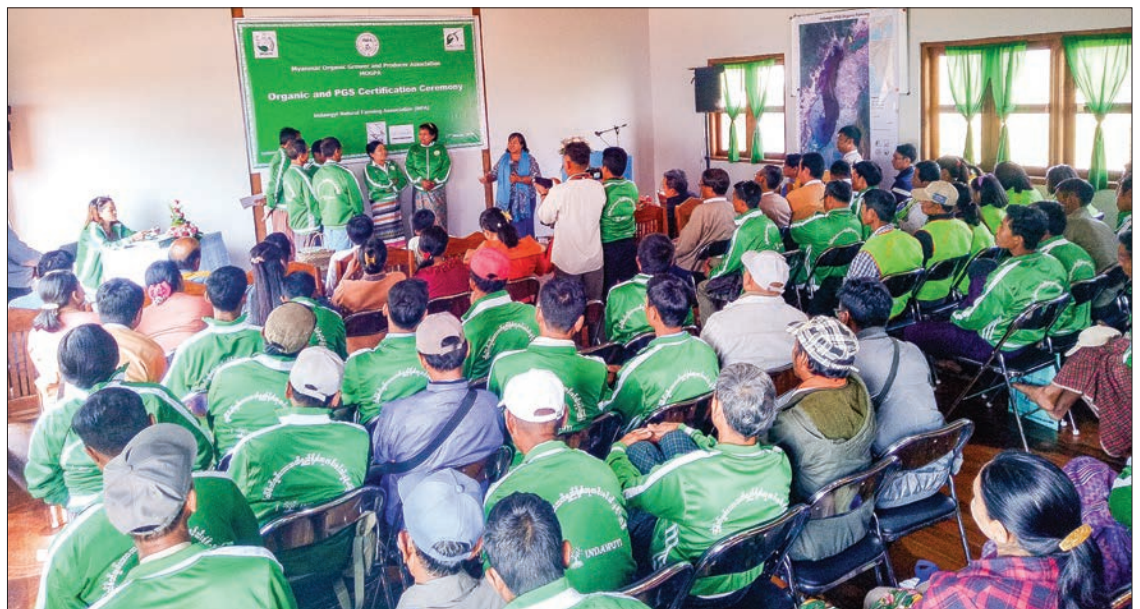
Local farmers attend the Organic and PGS Certification Ceremony.

In 2015, MOGPA and FFI teamed up to conduct organic farming and develop production