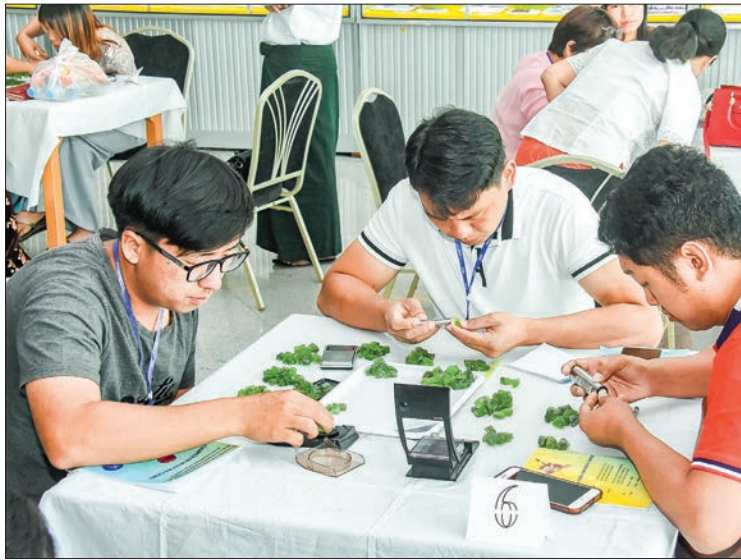
Traders check the quality of jade stones at the 56 th Gems Emporium in Nay Pyi Taw yesterday.

News: Kyaw Thu Htet