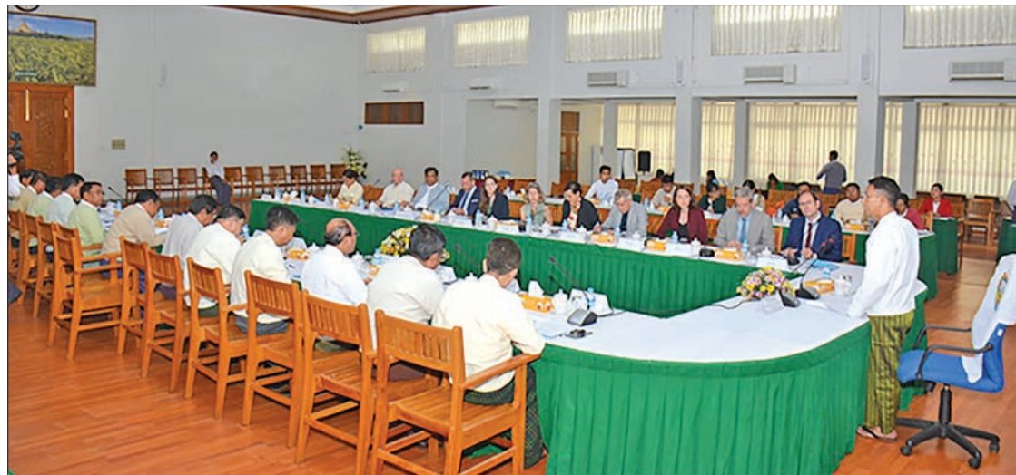
Union Minister Dr. Aung Thu addresses the workshop on enhancing rural nutrition with EU assistance.

Ministry for Agriculture, Livestock and Irrigation will be cooperating with Ministry