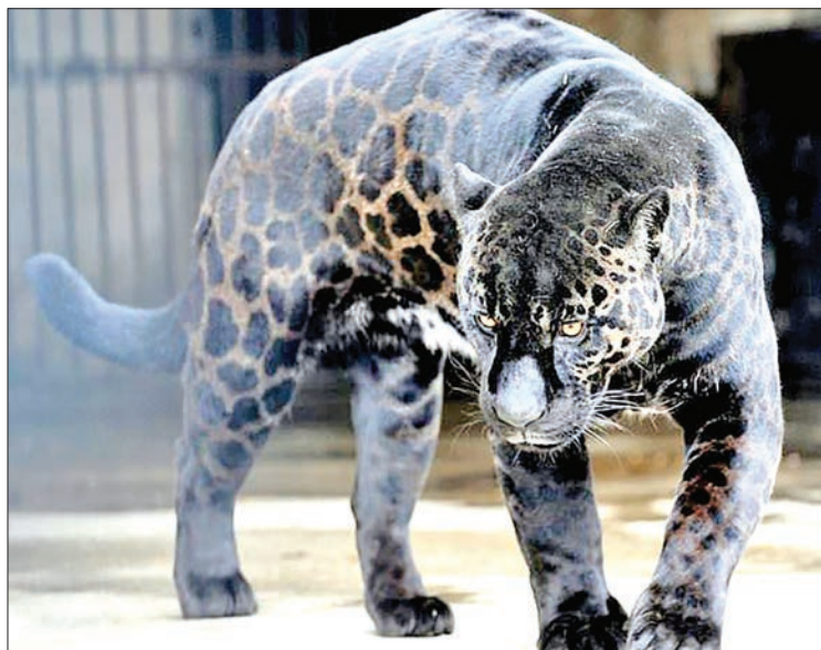
The jaguar, like this one pictured in Tbilisi on 10 February, 2010, dug its claws into the woman's arm.

He said his mother threw a water bottle into the cage to distract the animal long enough so that he could pull the woman away. The woman, in her 30s, reportedly needed some stitches on her left arm and returned to the zoo on Sunday to apologize for her behaviour.—AFP ■