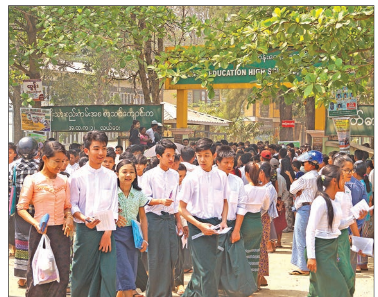
School children are seen in Lewe after the sixth day of the matric exam yesterday.