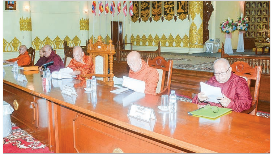
The 47-member leading committee of the 7 th State Sangha Maha Nayaka Committee holds 19 th meeting at the Wizaya Mingalar Dhammathabin Hall on Kaba Aye Hill in Yangon.

The 19 th meeting of the 47-member leading committee of the 7 th State Sangha Maha Nayaka Committee continued at the Wizaya Mingalar Dhammathabin Hall on Kaba Aye Hill in Yangon yesterday.