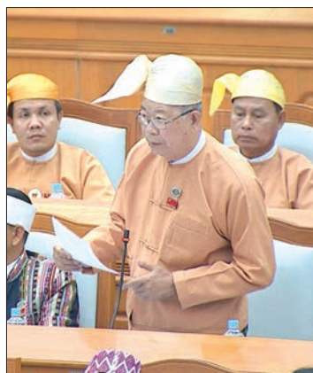
MP U Kyaw Thaug.