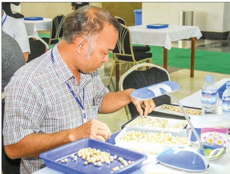
178 pearl lots were sold out at Euro 1.029 million yesterday.