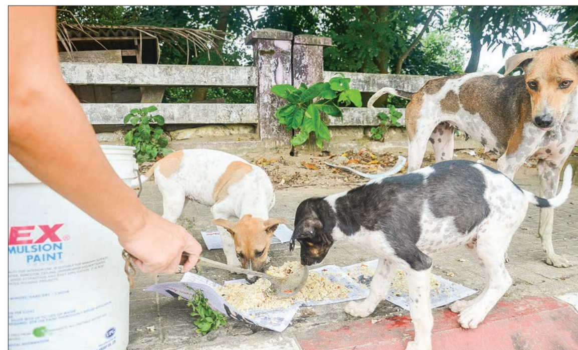
A woman feeding stray dogs in Yangon.