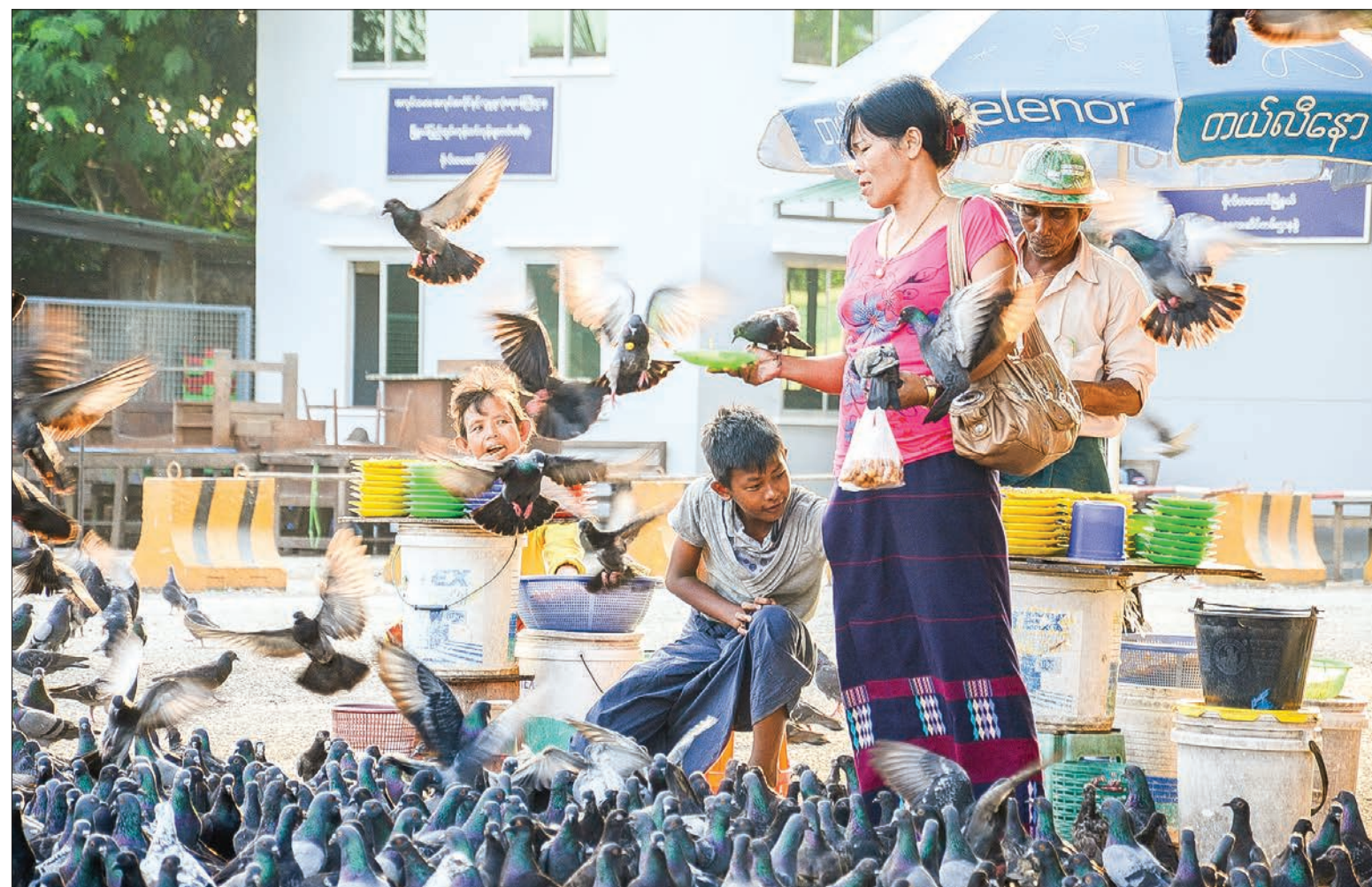
A woman feeding pigeons on a street in Yangon.

act of kindness for the simple act of feeding a being termed weaker than ourselves.