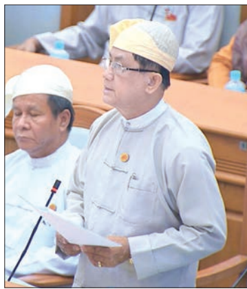
Deputy Minister for Planning and Finance U Maung Maung Win.