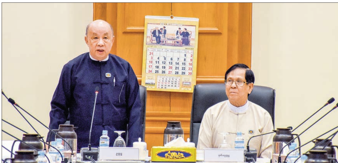
Pyidaungsu Hluttaw Deputy Speaker U Tun Tun Hein (Left) and Amyotha Hluttaw Deputy Speaker U Aye Tha Aung (Right) chair the meeting of the Joint Committee to amend the 2008 Constitution yesterday.

MEETING 5/2019 of the Joint Committee to amend the 2008 Constitution was held at Pyidaungsu Hluttaw Building D in Nay Pyi Taw yesterday afternoon.