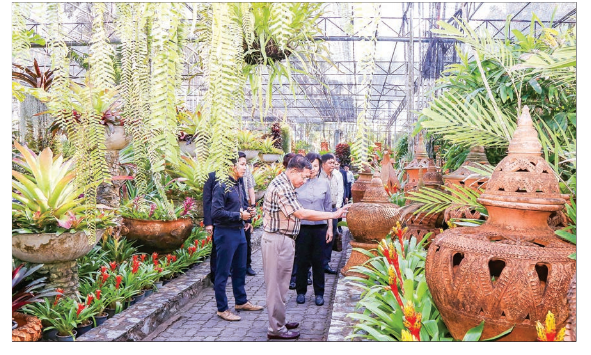
Senior General Min Aung Hlaing visits Nongnooch Garden in Pattaya, Thailand on 7 March.