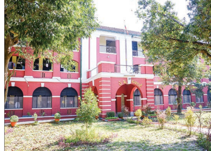
Bago Hall.

hues and cries, after the invaders who merged into the bushes swathed in darkness behind the halls. As the thieves were thought to come from the neighbouring villages, the students were strictly debarred by Principal D.J. Sloss from mixing with the villagers from Kamayut and other villages in the immediate vicinity of the premises.