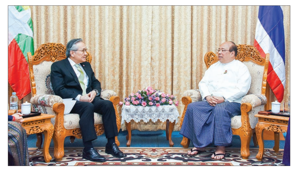
Union Minister U Thaung Tun receives Minister of Foreign Affairs of Thailand Mr. Don Pramudwinai in Nay Pyi Taw yesterday.

been established for more than 60 years and at the moment had offices in 18 countries. It had been working together with Ministry of Foreign Affairs for more than six years said the Pyithu Hluttaw Deputy Speaker and JCC Chairman. The graduation ceremony of the course was attended by officials, trainees and experts from Hluttaw offices and Ministry of Foreign Affairs. ----MNA/(Translated by Zaw Min)