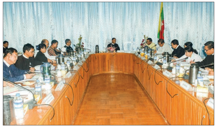
Union Attorney-General U Tun Tun Oo addresses implementing the recommendations regarding the Universal Periodic Review.

The Union Attorney-General said the working committee must review the 19 recommendations on democracy, peace, rule of law, and human rights to compile the report on Myanmar's human rights situation in 2020. He urged the meeting's attendees to actively give suggestions for ensuring the report is comprehensive. Following this, attendees discussed which facts should be included in the 2020 report, formation of working groups, and setting future tasks. --MNA (Translated by Zaw Htet Oo)