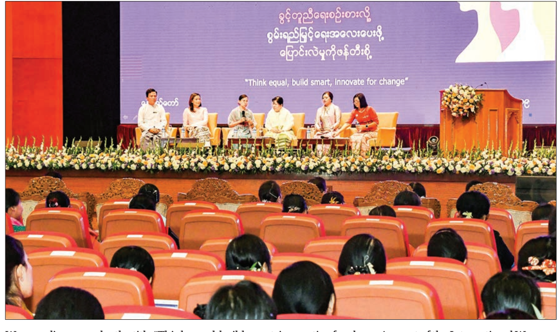
Women discuss under the title "Think equal, build smart, innovative for change' as part of the International Women Day ceremony in Nay Pyi Taw yesterday.