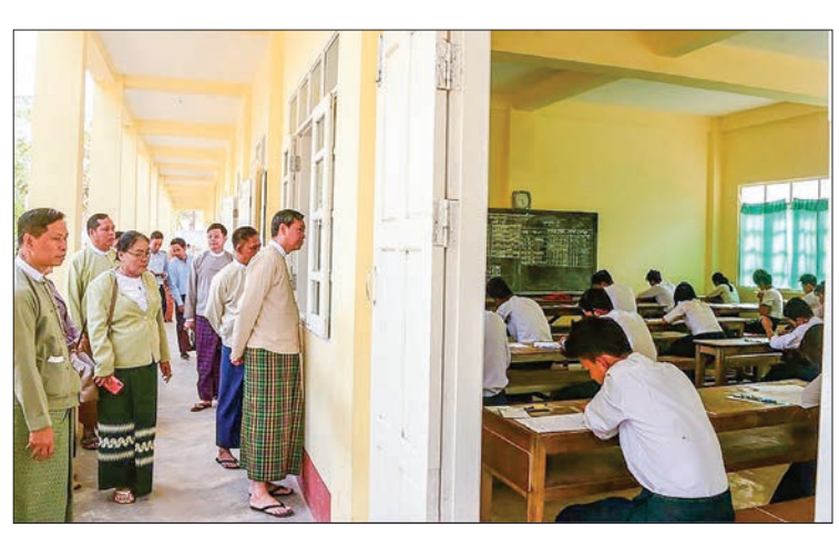
Union Minister Dr. Myo Thein Gyi visits the exam centres in Nay Pyi Taw yesterday.