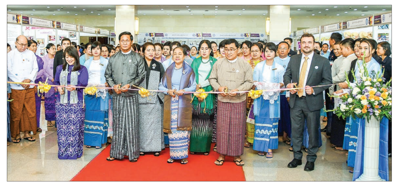
First Lady Daw Cho Cho, Vice President U Henry Van Thio and dignitaries open the International Women's Day ceremony in Nay Pyi Taw.

Myanmar was a country that was transitioning to a democracy based on political transition, economic transition and establishing peace. As a country working for national reconciliation based on establishing peace, gender equality in all sectors was an important and basic matter. In the third session of 21st Century Panglong Conference an agreement was reached in the political sector basic principle