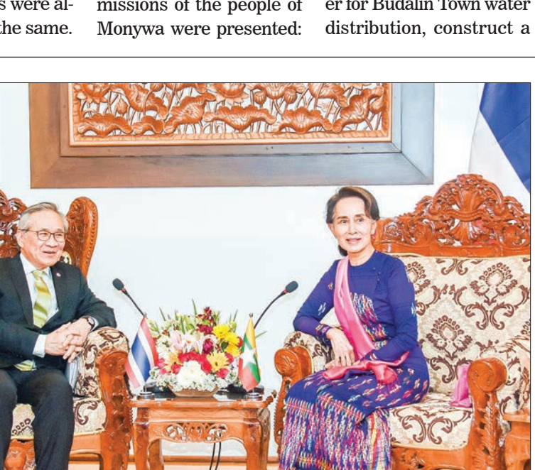
State Counsellor Daw Aung San Suu Kyi meets with Mr. Don Pramudwinai in Nay Pyi Taw.

The State Counsellor and party then left Monywa by special flight and arrived in Nay Pyi Taw in the afternoon. — MNA