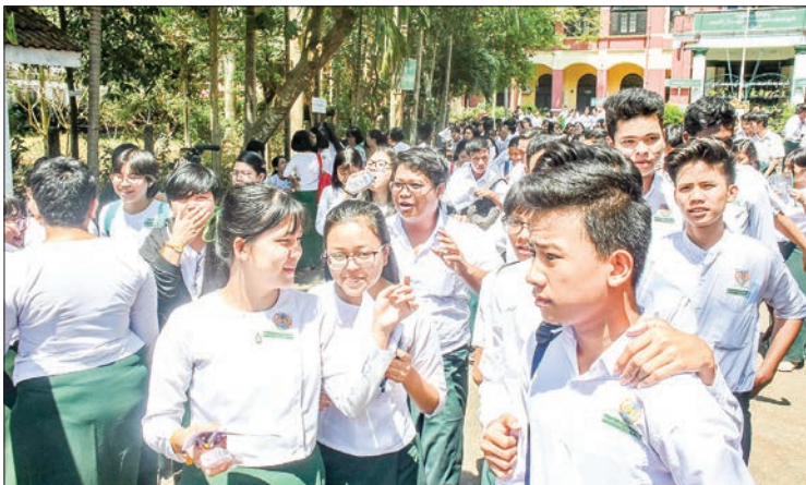
Students seen after sitting for the Mathematics subject as part of the matriculation exam.

matics subject on the third day of the Matriculation exams for