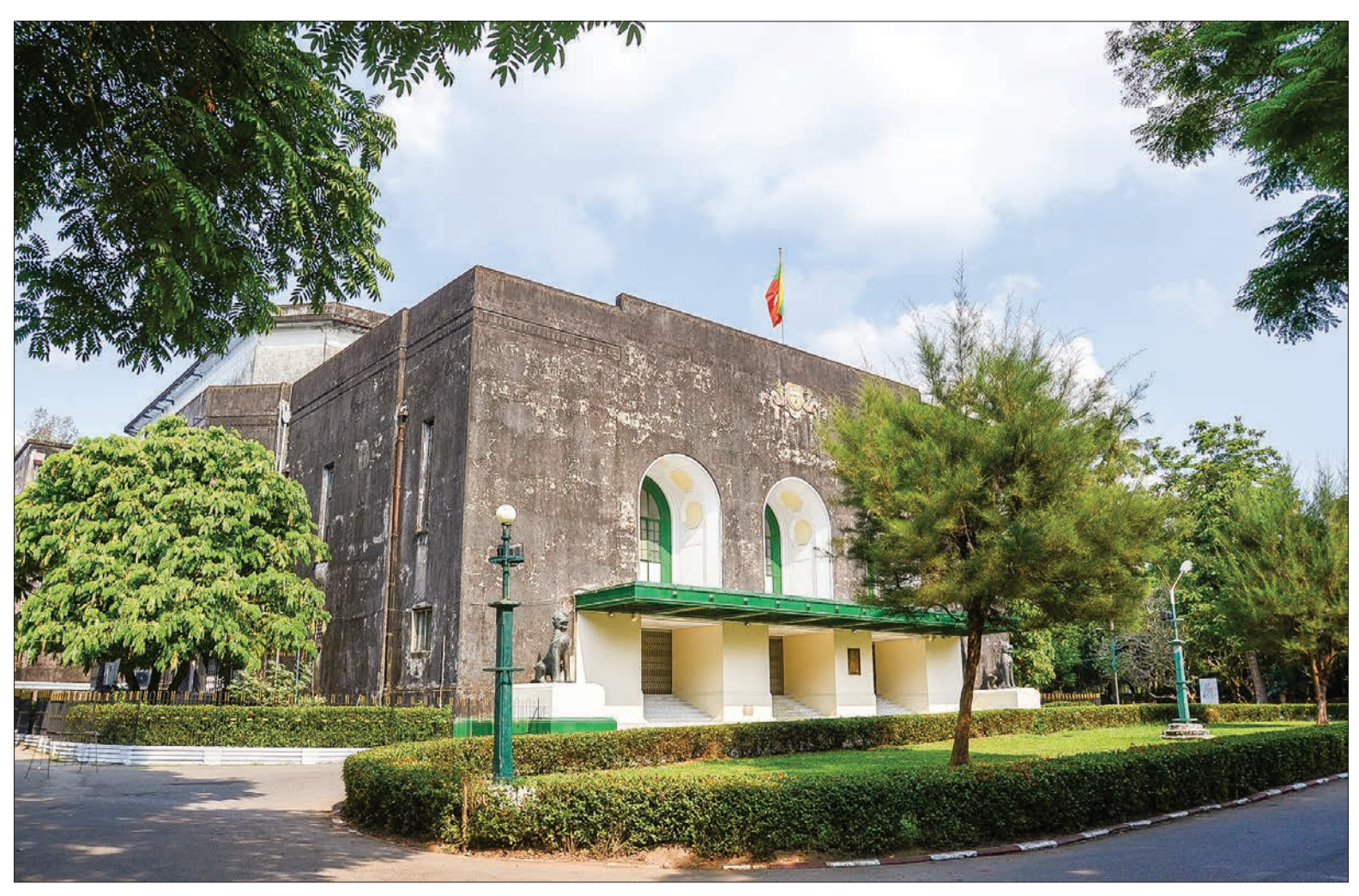
Convocation Hall at the University of Yangon.

In 1922, the Convocation Hall was constructed in the northern-most part of the estate. In 1924, wooden Tagaung and Pyi Halls of residence were built in the southern part of the Yangon University Estate near Pyi Road which was then a narrow tarred road. Man-students from Yangon University College started to be accommodated there in the 1925-26 academic year. As the estate was so thickly forested, the two halls were hidden from each other. In 1926, Bagan Hall, another wooden hall of residence, was built at the end of Victoria Lane which branched off due east from Pyi road.Since this hall was in isolation from other two halls, it was called 'Andaman