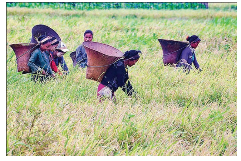
The local farmers in Shan State are harvesting the rice crop.