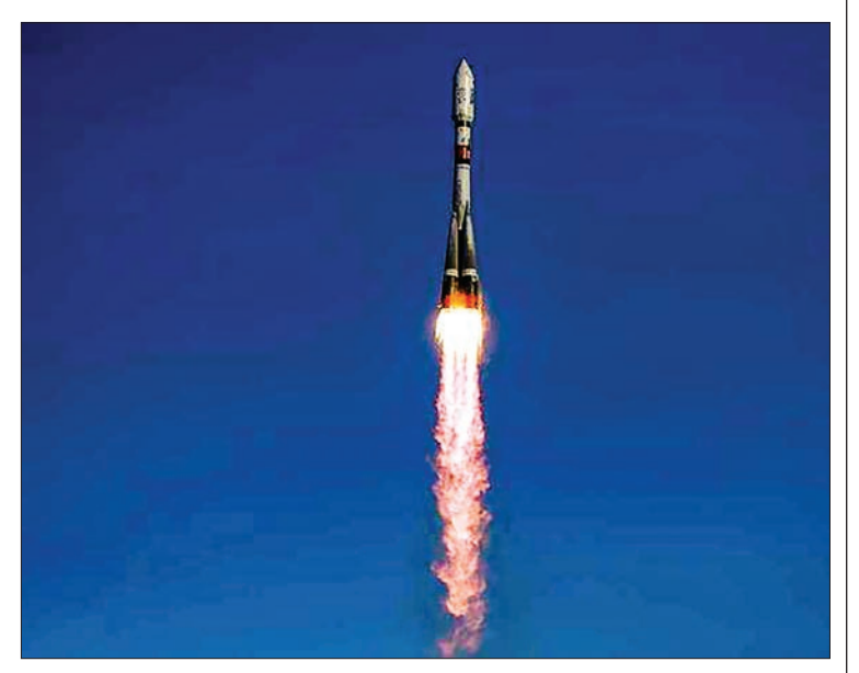
CosmoCourse plans to engage in space tourism starting from 2025.

Earlier, the CosmoCourse head his company was designing its own rocket engine as part of the suborbital flight project. The trials are to begin in mid-2020, but its prototypes are to be showcased this year.—Tass ■