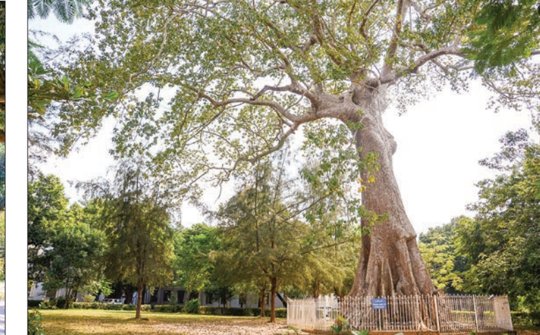
The Dalbergia kurzii tree, an important symbol of the Yangon University.

Republic of the Union of Myanmar Office of the President Order 8/2019