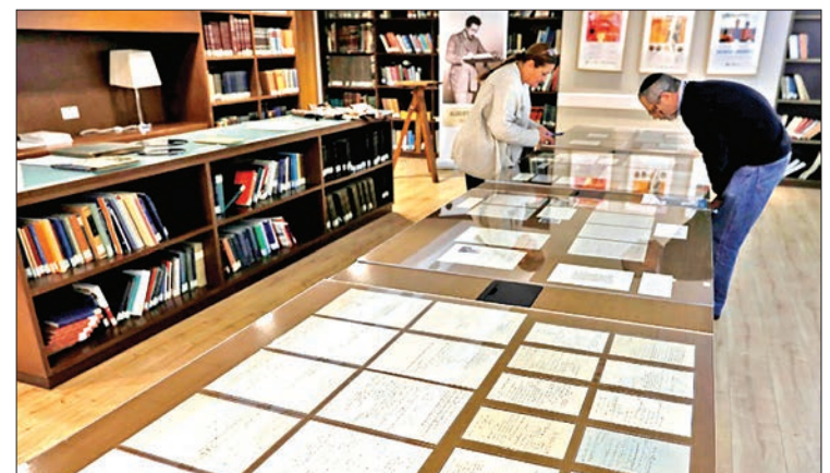
Visitors look at some of Albert Einstein's manuscripts on display in the Jerusalem's Hebrew University of Jerusalem.