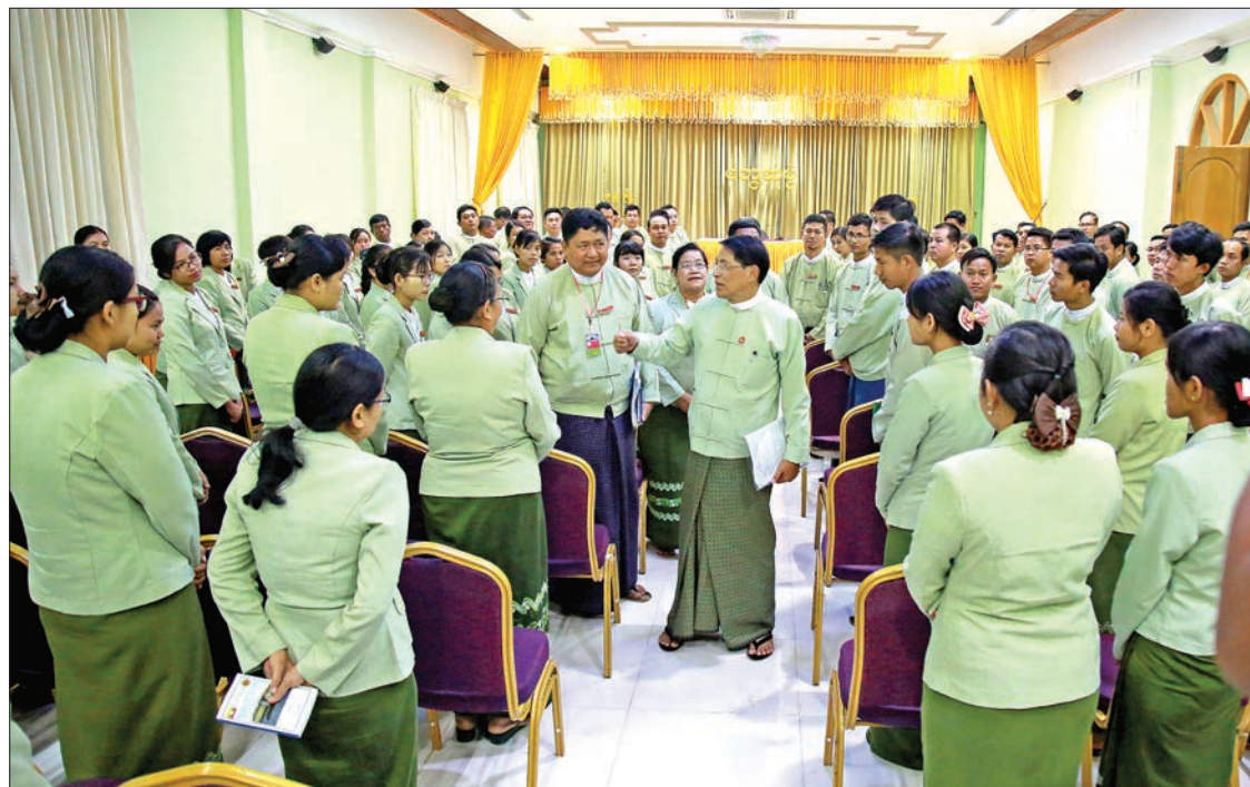
Union Minister U Min Thu meets with staff from Sagaing Region General Administration Department in Monywa yesterday.

The Union Minister said a workshop on reforms was held in Nay Pyi Taw with GAD staff from 26 to 28 February. It was attended by all the government secretaries of the states, regions and Nay Pyi Taw Council together with district administrators. The workshop discussed reform measures for the GAD based on its staff. The Union Minister said staff participated enthusiastically in the workshop and discussed the reforms with empathy. He