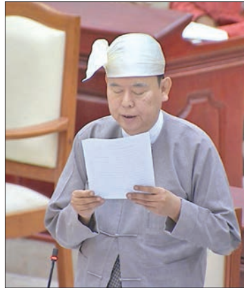
Deputy Minister for Education U Win Maw Tun.

A question by U Kyaw Shwe of Yanbye constituency on a plan to construct a Bailey bridge or a reinforced concrete bridge over Hone creek in Yanbye Township for ease of transport of Rakhine and Chin villages in the area was then answered by Deputy Minister U Kyaw Linn again. The