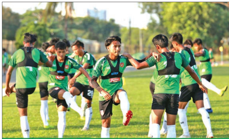
Myanmar team train for the AFC U-23 Championship 2020 Qualifiers.