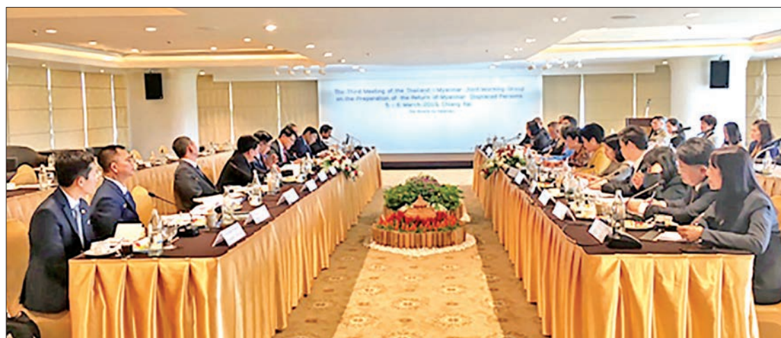
The Third Meeting of Myanmar-Thailand Joint Working Group on the preparation of the return of verified Myanmar nationals from Thailand being convened in Chiang Rai, Thailand.

The Third Meeting of Myanmar-Thailand Joint Working Group on the preparation of the return of verified Myanmar nationals from Thailand was con-