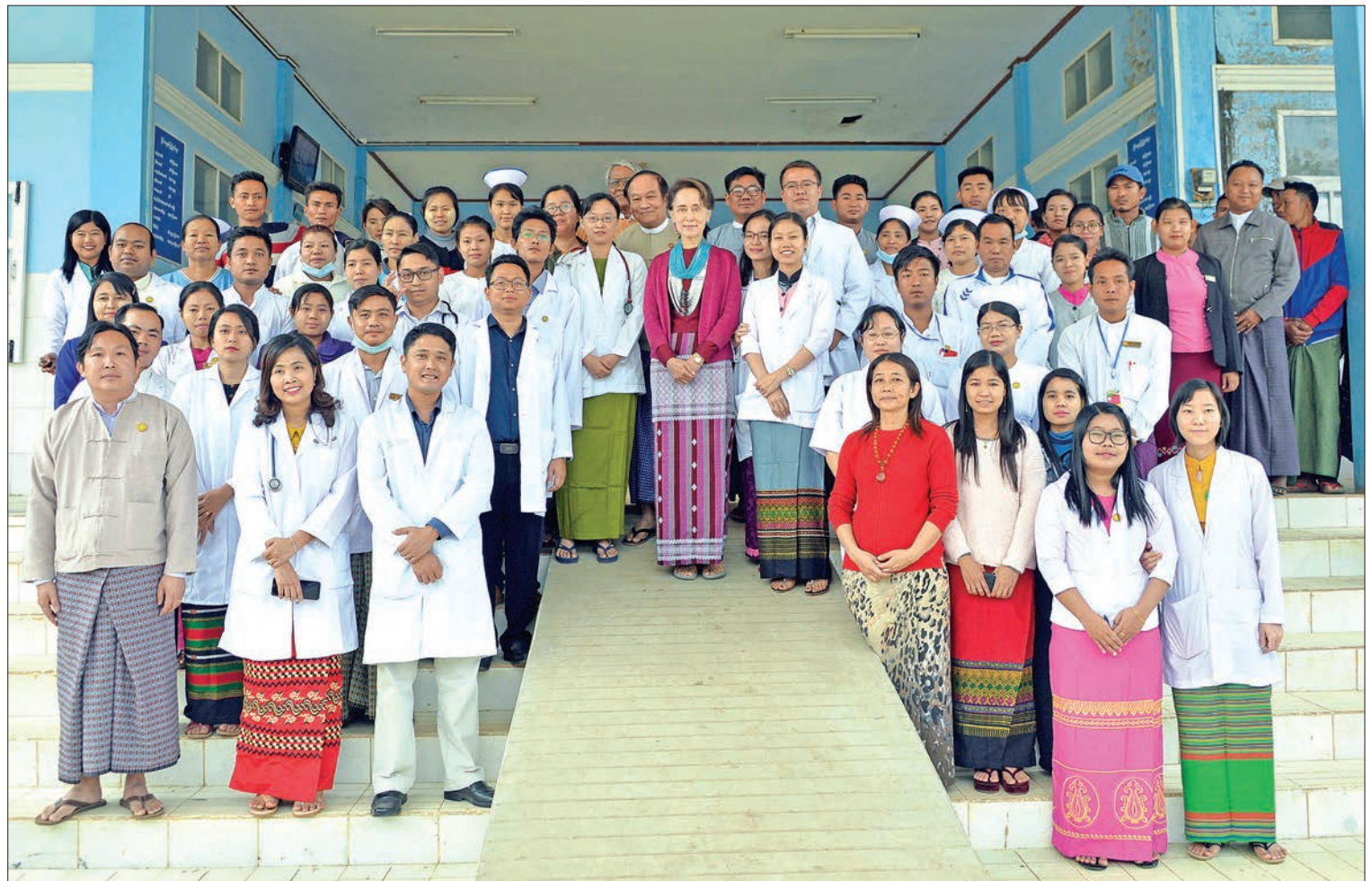
State Counsellor Daw Aung San Suu Kyi poses for documentary photo together with doctors and staff of the Monywa People's Hospital.

Measures taken by Members of Parliament represented the people and every issue in the country concerns each and every citizen: State Counsellor Daw Aung San Suu Kyi.