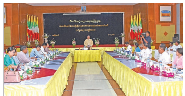
Union Minister U Soe Win addresses the first meeting of the Implementation Committee of the Central Provident Fund System in Nay Pyi Taw.

Following the Union Minister's speech, committee chair-