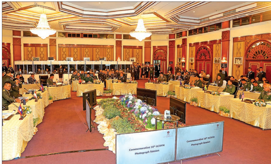
Senior General Min Aung Hlaing attends the 16 th ASEAN Chiefs of Defence Forces Meeting in Pattaya, Thailand.