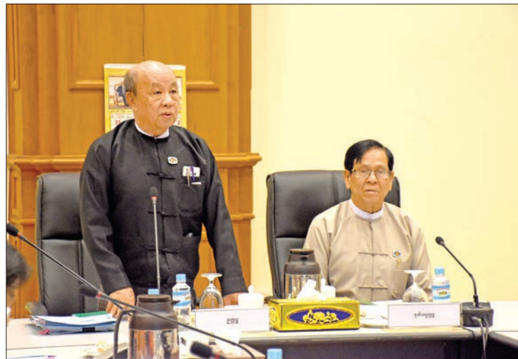
Pyithu Hluttaw Deputy Speaker U Tun Tun Hein addresses Meeting 3/2019 of the Joint Committee to amend 2008 Constitution in Nay Pyi Taw yesterday.

Meeting 3/2019 of the Joint Committee to amend 2008 Constitution was held at Pyidaungsu Hluttaw Building D in Nay Pyi Taw yesterday afternoon.