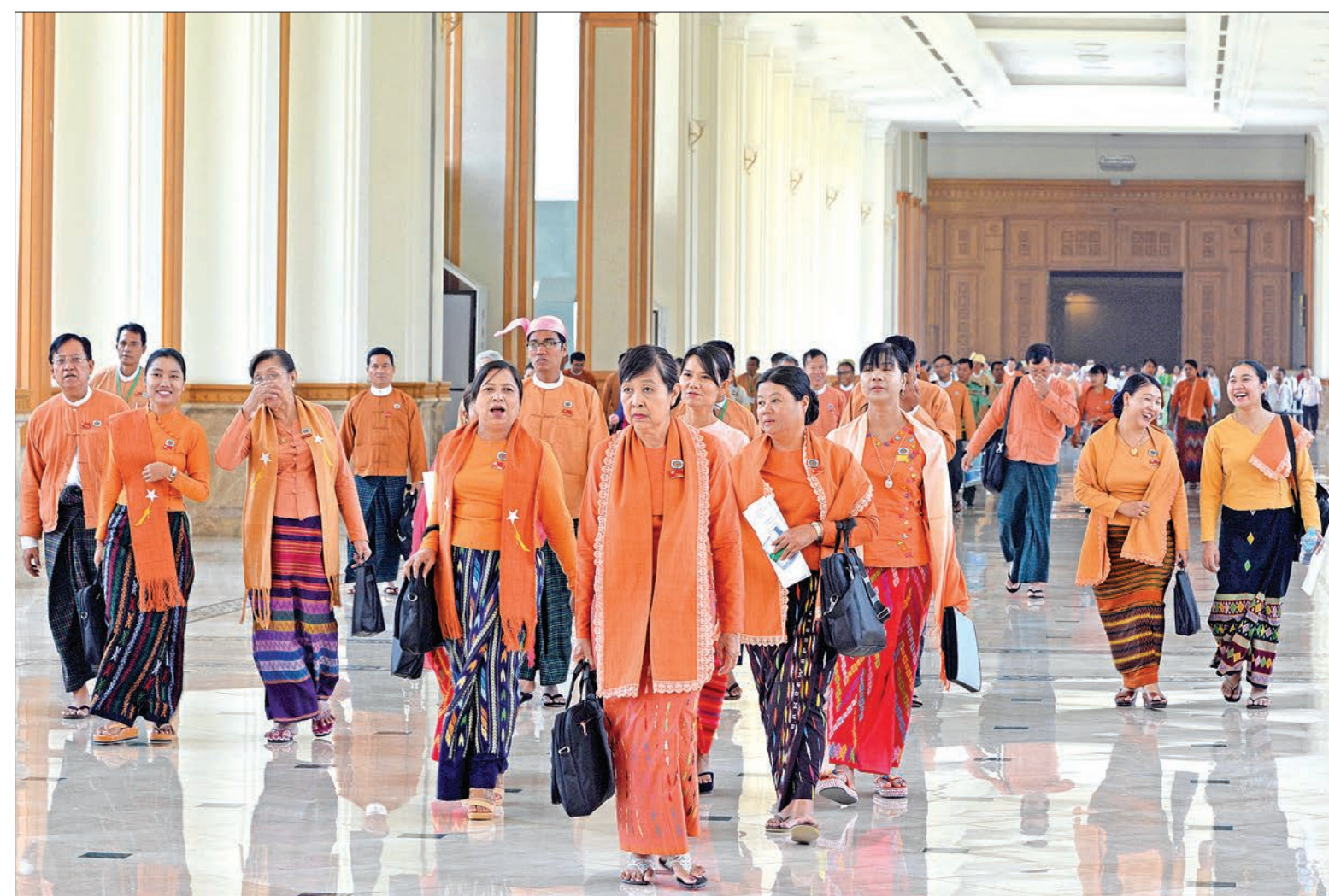
After 2015 election, the number of the women MPs increased to 13%. PHOTO: ASO

On this occasion, we are also looking at how we can support the Government of the Republic of the Union of Myanmar in creating conditions for women to increase their impact on the on-going transitions from conflict to peace, from military rule to democratic governance, and from a closed to a liberalized economy.