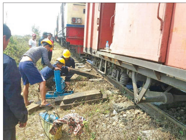
Engineers being repaired the route for the trains on Myitkyina Mandalay route.