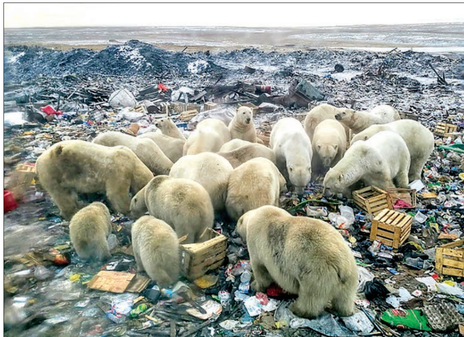
Current instructions to Russians in the Arctic focus on how to ward them off, but one expert insists: 'Put yourself inside a cage and let the bears roam around'.

But polar bear experts say the main reason the