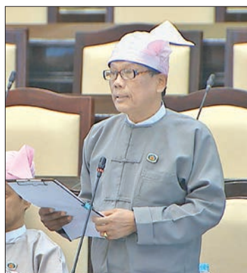
MP U Khin Maung Latt.

Deputy Minister for Agriculture, Livestock and Irrigation U Hla Kyaw on the other hand responded to a question raised by U Whey Tin of Chin State constituency 11 on a plan to construct a 40x30 ft. office building and six-room staff houses at head of Township Agriculture Department Office in Chin State, Paletwa Township,