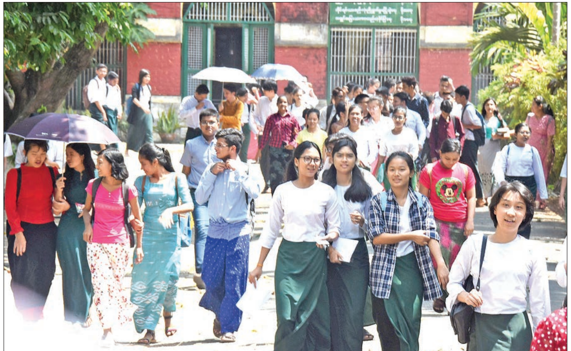
Students leave from exam room after sitting for their matriculation yesterday.

Out of 850,890 students sitting for their exams on the second day, 97 are taking the exam at hospitals, 24 are visually impaired, 15 are hearing impaired, 132 have physical disabilities, 182 are in prison, and 137 from Myawady, Kayin State.—MNA (Translated by Kyaw Zin Lin)