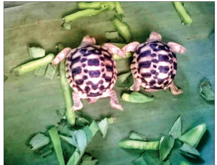
Conjoined star tortoises were successfully separated at the Lawkananda Wildlife Sanctuary in Bagan.