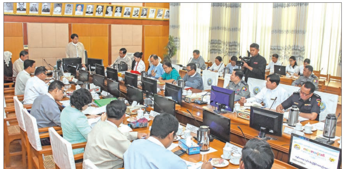
Union Minister for Information Dr. Pe Myint addresses the coordination meeting to successfully convene Children's Literary Festival (Bago).

The Children's Literary Festival (Bago) will be held at Bago University convocation hall for three days from 28 to 30 March. Children's Literary Festivals were jointly organized by Ministry of Information, Ministry of Education and relevant State/Region governments and were held with the aims to make children like and live with books and literature, become life-long learners, participate happily in the festival and gain the habit of working together, become learned, knowledgeable and sociable youths who will become future leaders. — MNA ■