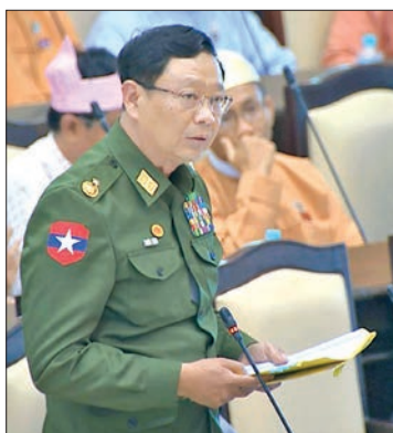
Deputy Minister for Home Affairs Maj-Gen Aung Thu.

A question posed by U Khin Maung Latt of Rakhine State constituency 3 on plan to take back cows and buffaloes stolen to Bangladesh and to apprehend the suspect thieves and robbers through bilateral discussion was first answered by Deputy Minister for Home Affairs Maj-Gen Aung Thu. The Deputy Minister said the matter was being raised through Border Relation Offices and flag meetings such as Myanmar-Bangladesh Battalion