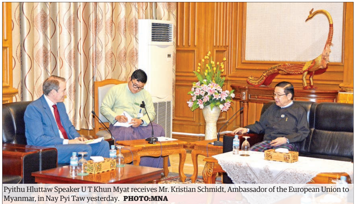
Pyithu Hluttaw Speaker U T Khun Myat receives Mr. Kristian Schmidt, Ambassador of the European Union to Myanmar, in Nay Pyi Taw yesterday.

During the meeting matters relating to strengthening EU-Myanmar relationship and cooperation between the parliaments, Constitution amendment matter conducted in the Hluttaw, other legislative matters, election matters, protection of children rights, arbitration of labour disputes and maintaining tax exemption agreement on Myanmar products were cordially and openly discussed and views exchanged. — MNA ■