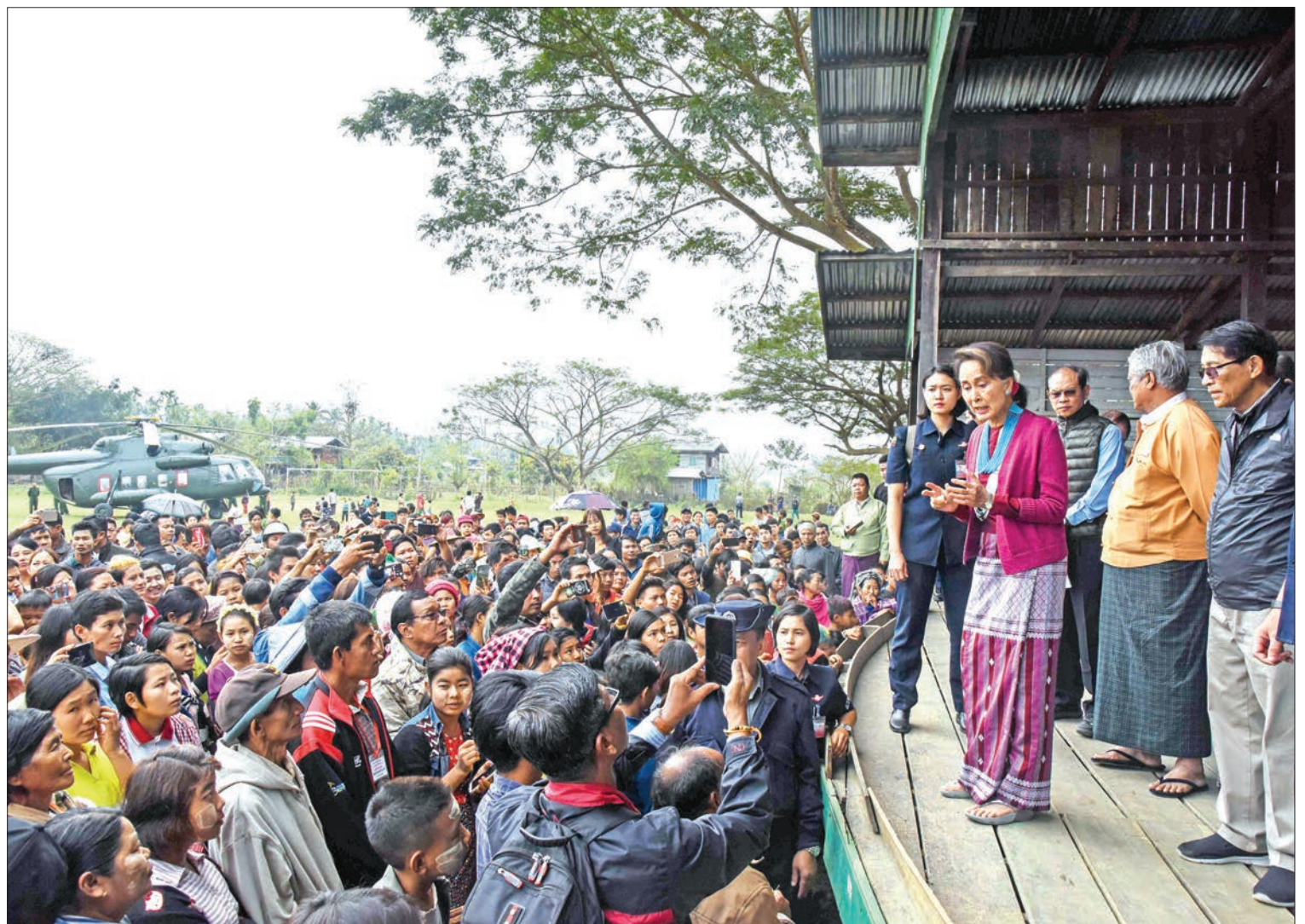
State Counsellor Daw Aung San Suu Kyi meets with local people in Htamanthi Village.

In response to their requests, Daw Aung San Suu Kyi said the nationwide electrification plan would cover 50 per cent of Myanmar. She said she will check whether Htaman-