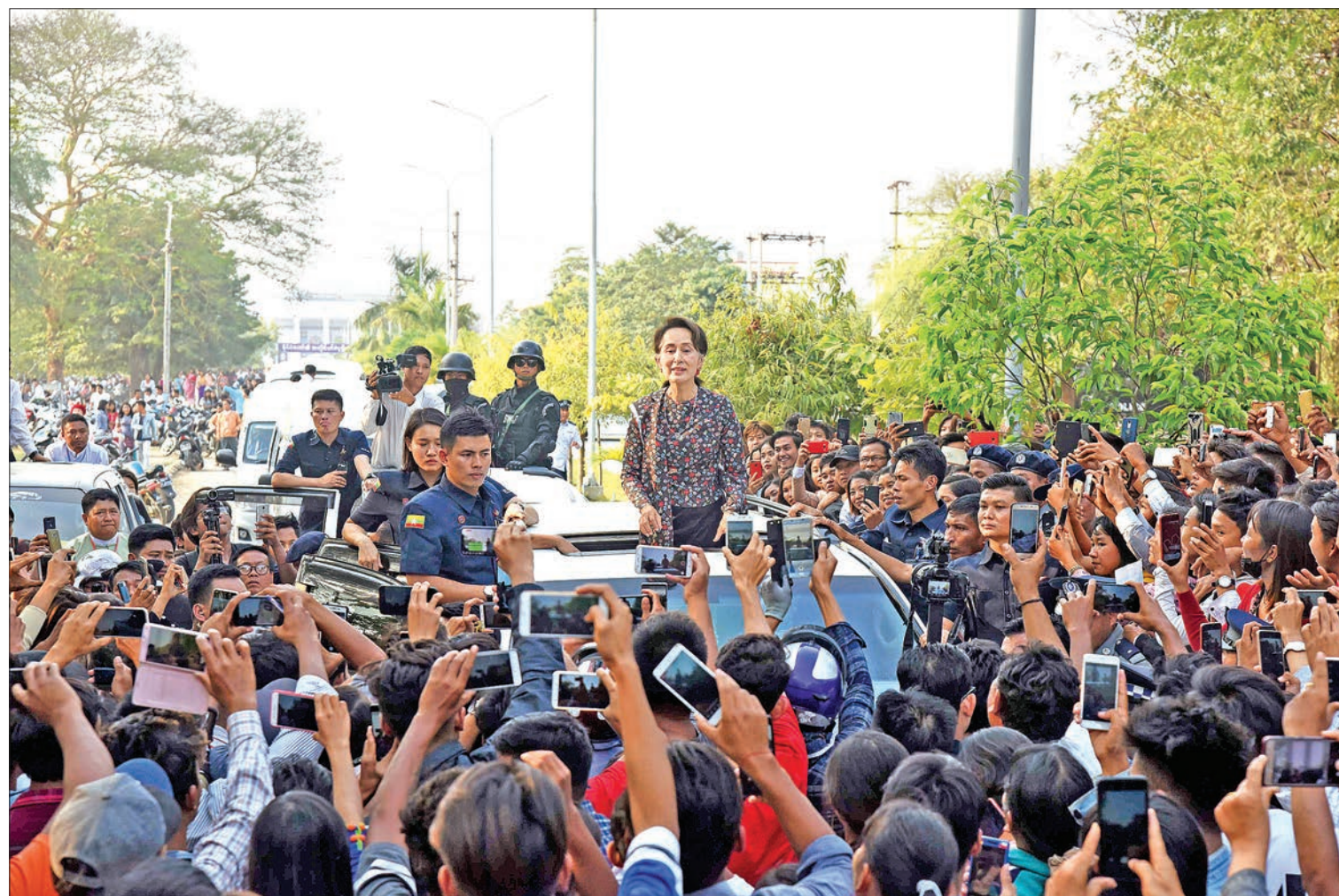
State Counsellor Daw Aung San Suu Kyi meets students from the Monywa University yesterday.

Afterwards, the State Counsellor greeted the local people, faculty members, students and town elders at the University and in Monywa. — MNA ■