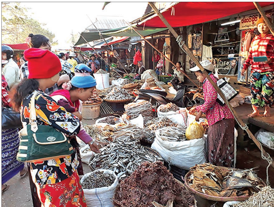
Dried fish stalls in a market.

“Although the Fisheries Department and the Myanmar Fisheries Federation are issu-