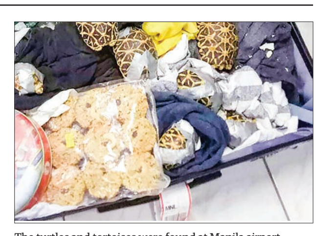
The turtles and tortoises were found at Manila airport on Sunday in the luggage of a Filipino passenger, hidden among clothes and shoes.