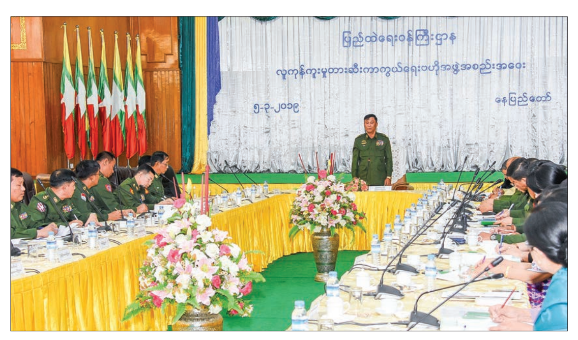
Union Minister Lt-Gen Kyaw Swe delivers the opening address at the meeting of the Central Body for Suppression and Prevention of Trafficking in Persons (CBSPTP).

CENTRAL Body for Suppression and Prevention of Trafficking in Persons (CBSPTP) held a meeting at Ministry of Home Affairs meeting hall in Nay Pyi Taw yesterday morning. CBSPTP Chairman Union Minister for Home Affairs Lt-Gen Kyaw Swe attended the meeting and delivered an open-