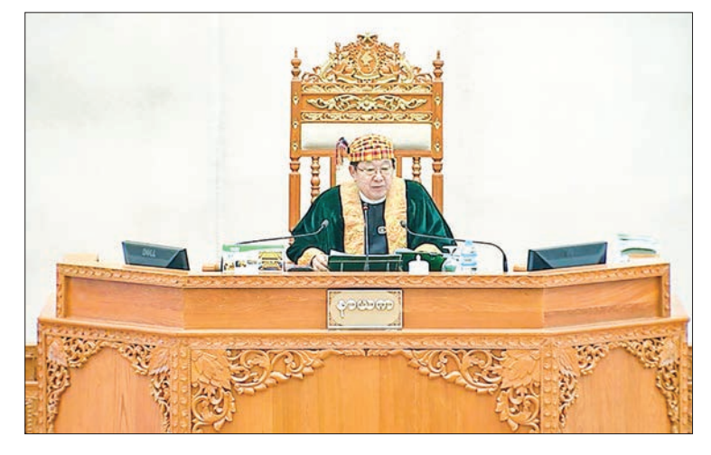
Pyidaungsu Hluttaw Speaker UT Khun Myat.

As the ultimate aim of Joint Committee to Implement Steps to Amend 2008 Constitution was to prepare a bill to amend sections in the Constitution that will also include Section 261, it was the opinion of the majority of the joint committee members that including the bill to amend Section 261 in the preparation works to Amend 2008 Constitu-