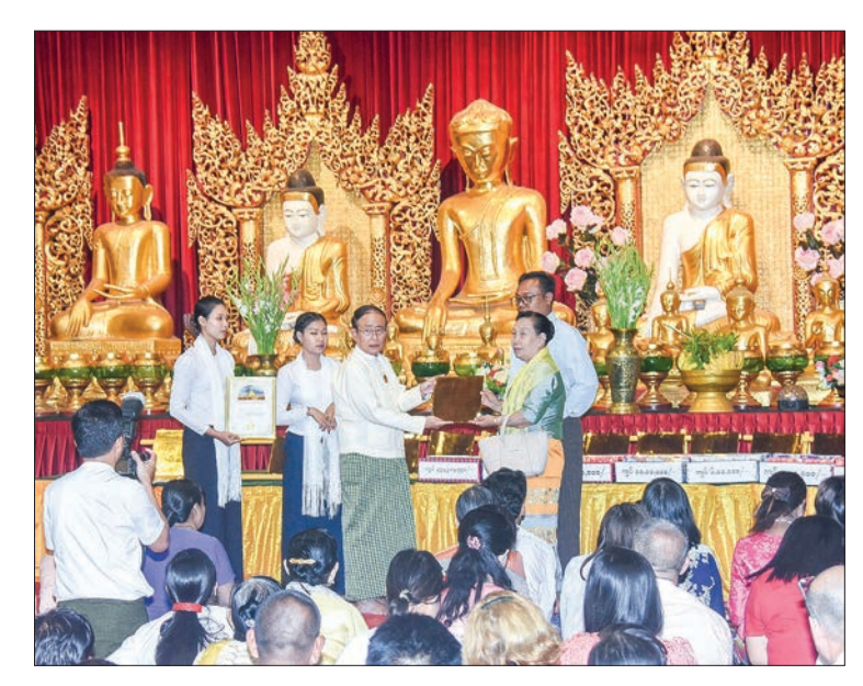
Shwedagon Pagoda Board of Trustees accepts a gold plate donated by wellwishers at the pagoda yesterday.