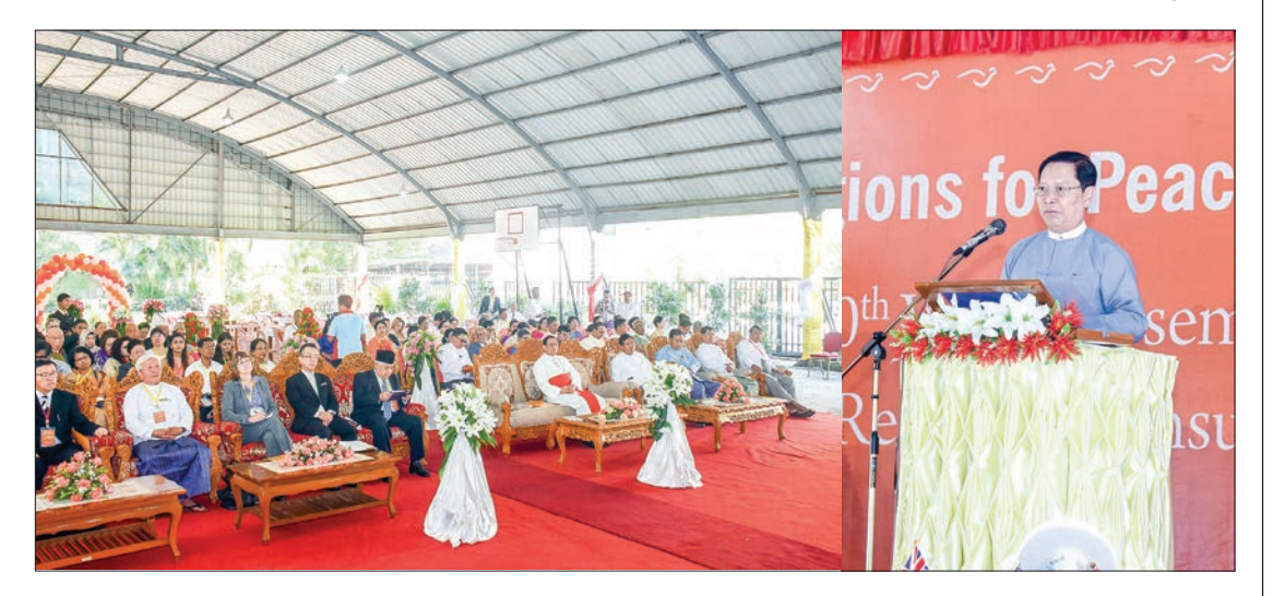
Union Minister Thura U Aung Ko delivers an opening address at the Asia Regional Consultation of the Religions for Peace in Yangon yesterday.

RELIGIONS for Peace-RfP Myanmar hosted the Asia Regional Consultation for the 10th World Assembly in Yangon yesterday.