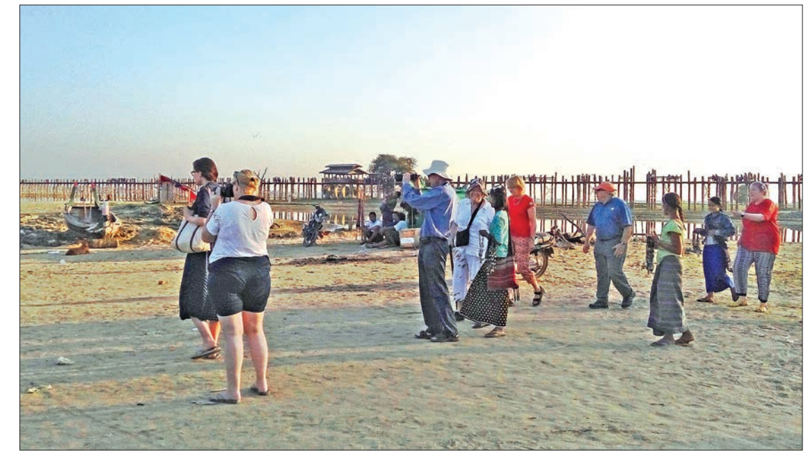
U Bein Bridge in Amarapura is one of the most popular attractions in MandalayR egion.

There has been a high influx of Chinese tourists in January this year. Of the 67,204 tourists entering Mandalay Region,