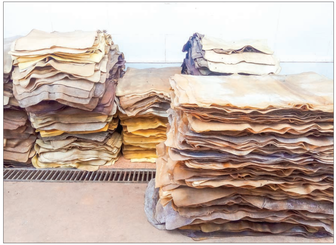
Natural rubber sheets seen at a rubber production Factory.

The Commerce Ministry is negotiating with Chinese authorities to increase quota limit and carry out barter system for Myanmar's rice and broken rice. It is also working to help farmers deal with challenges such as high input costs, procurement of pedigree seeds, high cultivation costs, and erratic weather conditions. — Ko Htet (Translated by Ei Myat Mon)