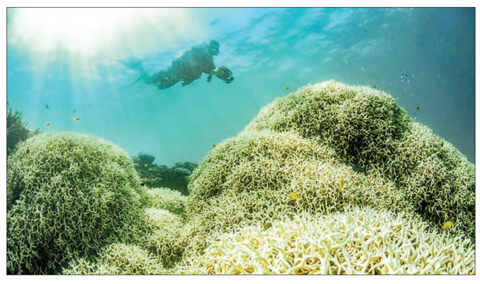
Globally, marine heatwaves are becoming more frequent and prolonged, and recordbreaking events have been observed in most ocean basins in the past decade.

Above the ocean watermark, on Earth's surface, 18 of the last 19 years have been the warmest on record, leading to more severe storms, droughts,