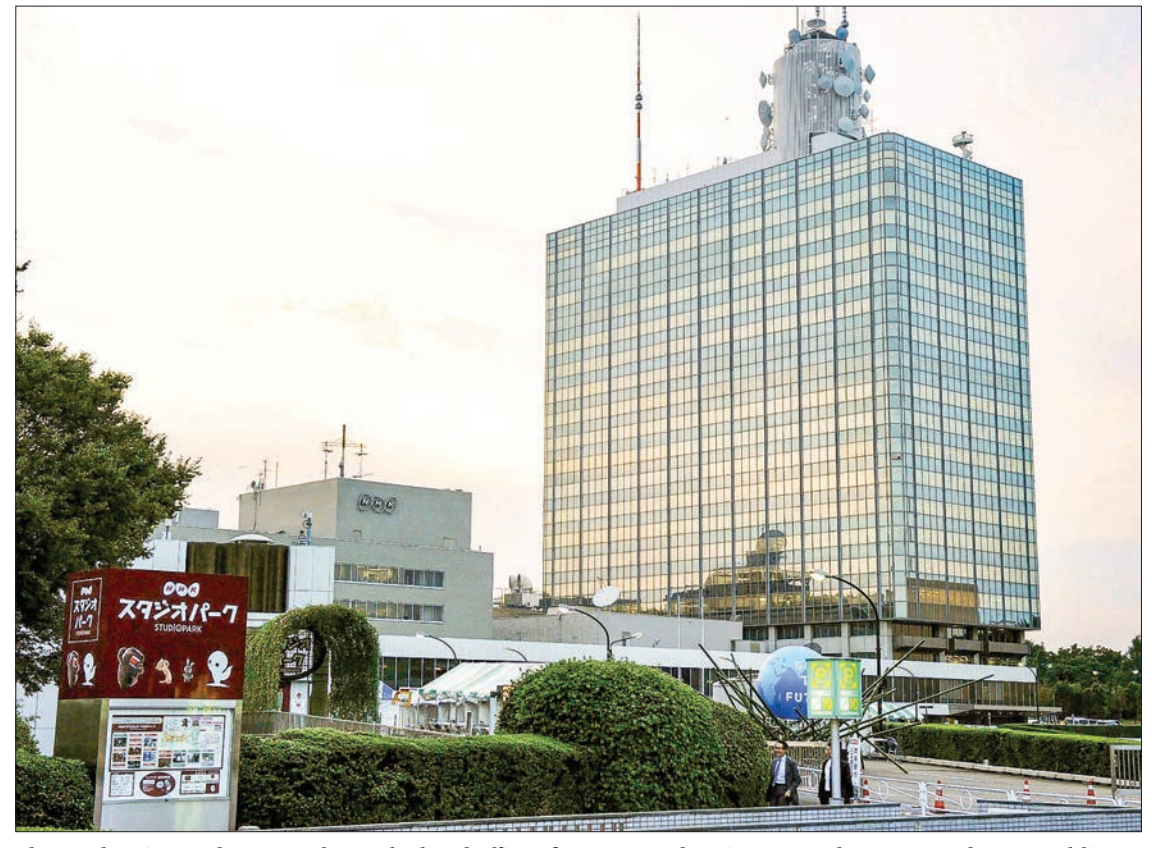
Photo taken in October 2010 shows the head office of Japan Broadcasting Corp., the country's largest public broadcaster widely called NHK, in Tokyo's Shibuya district.

The bill also stipulates measures to improve corporate governance as requested by a government panel which gave the green light to simultaneous streaming.—Kyodo News