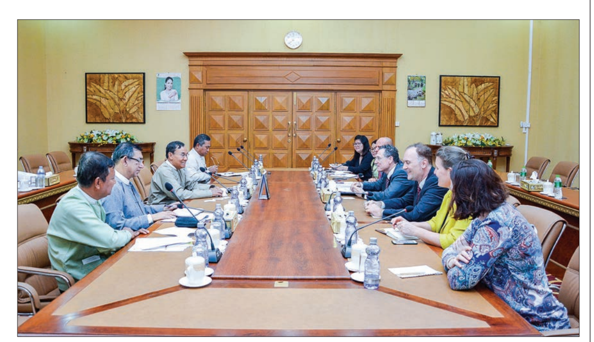
Union Minister for Natural Resources and Environmental Conservation (NREC) U Ohn Win meeting with the World Bank Program delegation led by Mr. Mark Austin.

Trade Mark Ads Call Thin Thin May, 0925 1022 355,09974424848