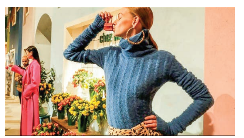
A model kisses a tiny Mini Chiquito handbag before the Jacquemus Paris fashion show My little treasure: A model kisses a tiny Mini Chiquito handbag before the Jacquemus Paris fashion show.

A shrunken version of the miniature and already cult $500 (440-euro) "Le Chiquito" bag — which the likes of Rihanna and Kim Kardashian have been spotted clutching between their thumb and forefingers — it is a