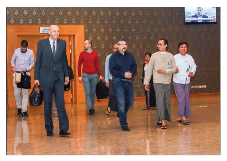
Deputy Minister for Foreign Affairs of the Czech Republic Mr. Martin Tlapa arrives at Nay Pyi Taw Airport.