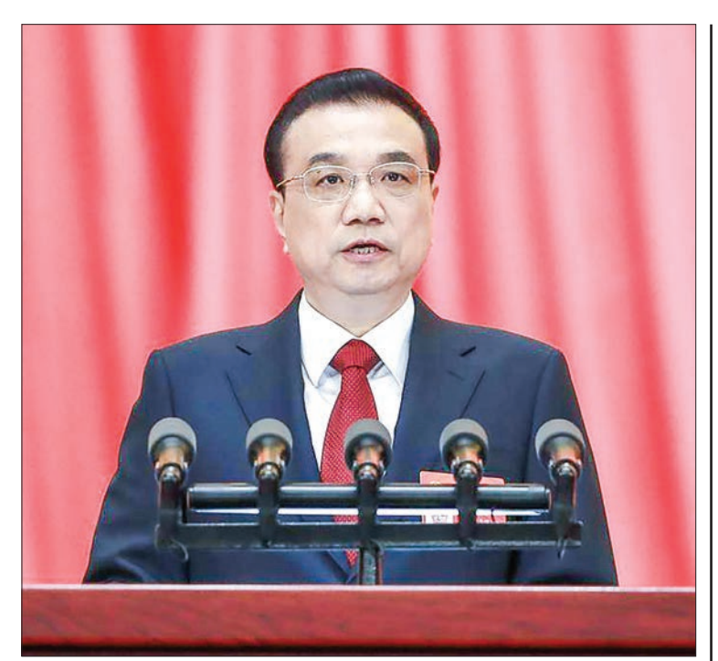
Chinese Premier Li Keqiang delivers a government work report at the opening meeting of the second session of the 13<sup>th</sup> National People's Congress at the Great Hall of the People in Beijing, capital of China on 5 March, 2019.

12 WORLD 6 MARCH 2019 THE GLOBAL NEW LIGHT OF MYANMAR