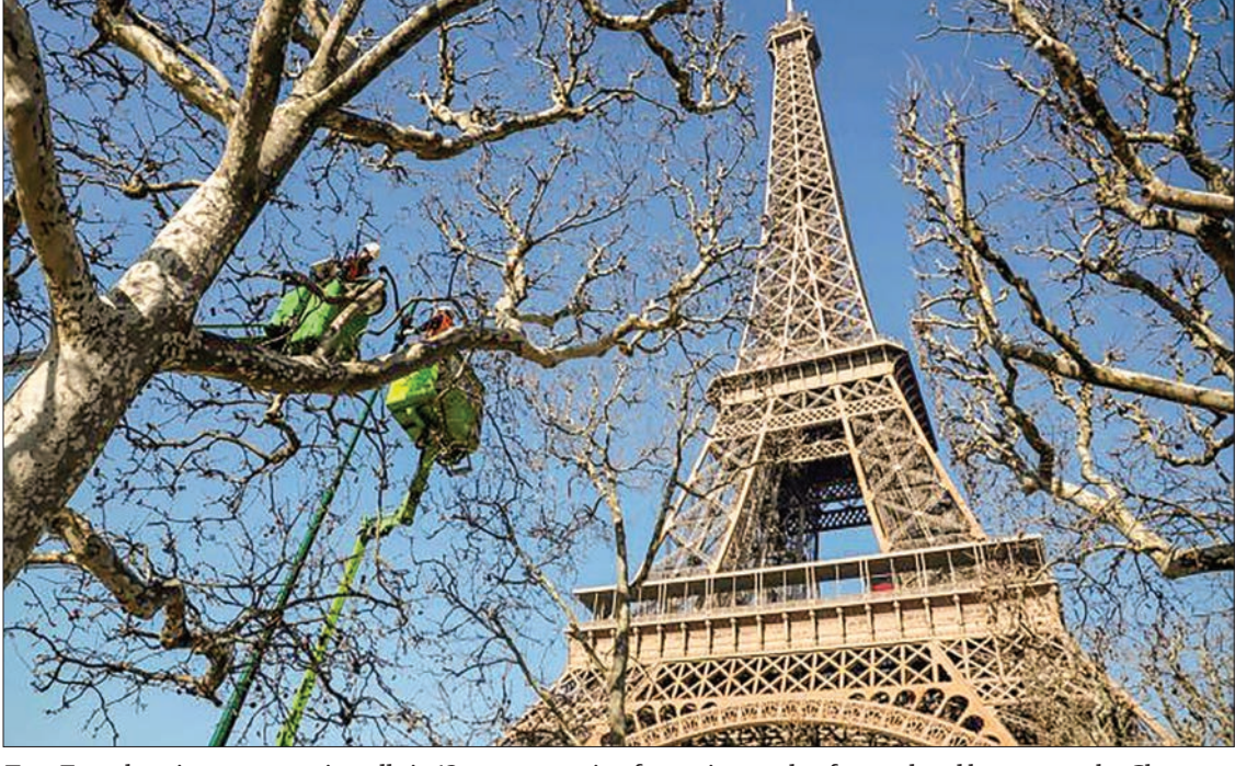
Two French artists are set to install six 13-metre rotating fountains made of crystal and bronze on the Champs-Elysees, adding a new attraction to the famed French avenue.

Paris have proved controversial in the past, notably a work by Jeff Koons which was created by the US artist as a tribute to victims of the 2015 terror attacks in the City of Light. The high-profile project — a giant hand holding multicoloured flowers — was denounced over its aesthetics and 3.5 million euro ($4 million) price tag. After lengthy deliberations, city authorities decided in October that the work will be installed in a garden of the Petit Palais exhibition space near to the Champs-Elysees.—AFP ■