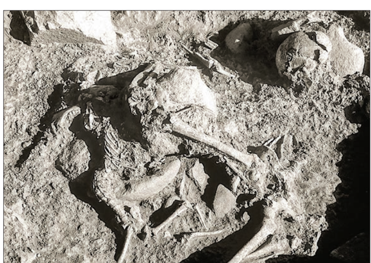
Special status accorded to some canines even extended to the grave.

ner, further proof that Neolithic canines carefully laid to rest were in a class of their own. The 5<sup>th</sup> millenium BC in southern Europe was dotted with a few large settlements, along with small villages or hamlets in plains or on hilltops. Archeologists have also unearthed the remains of simple farms, temporary shelters, and silos used to store grain.—AFP