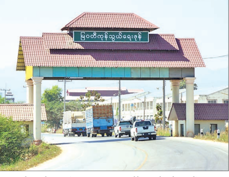
Myawady Trade Zone is Myanmar's second largest border trading post.

Myanmar conducts trade with neighboring Thailand via maritime routes as well as border points of entry. In border trade, goods are delivered main-