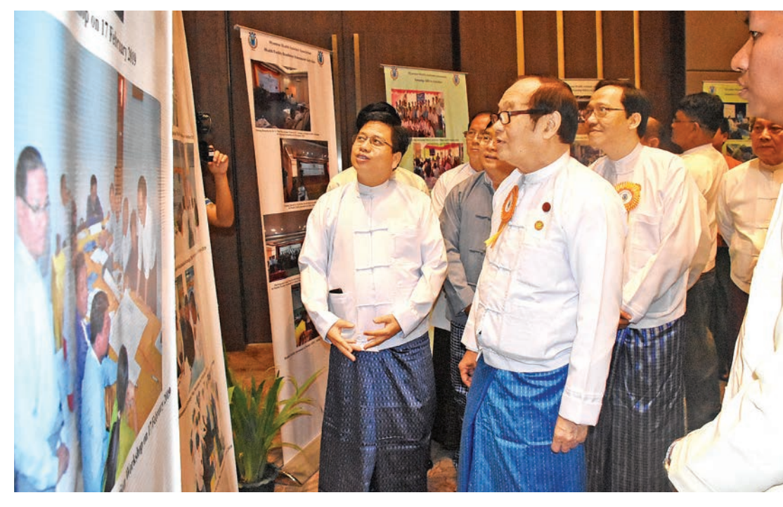
Union Minister Dr. Myint Htwe observes a poster at the Myanmar Health Assistants Association's ceremony.