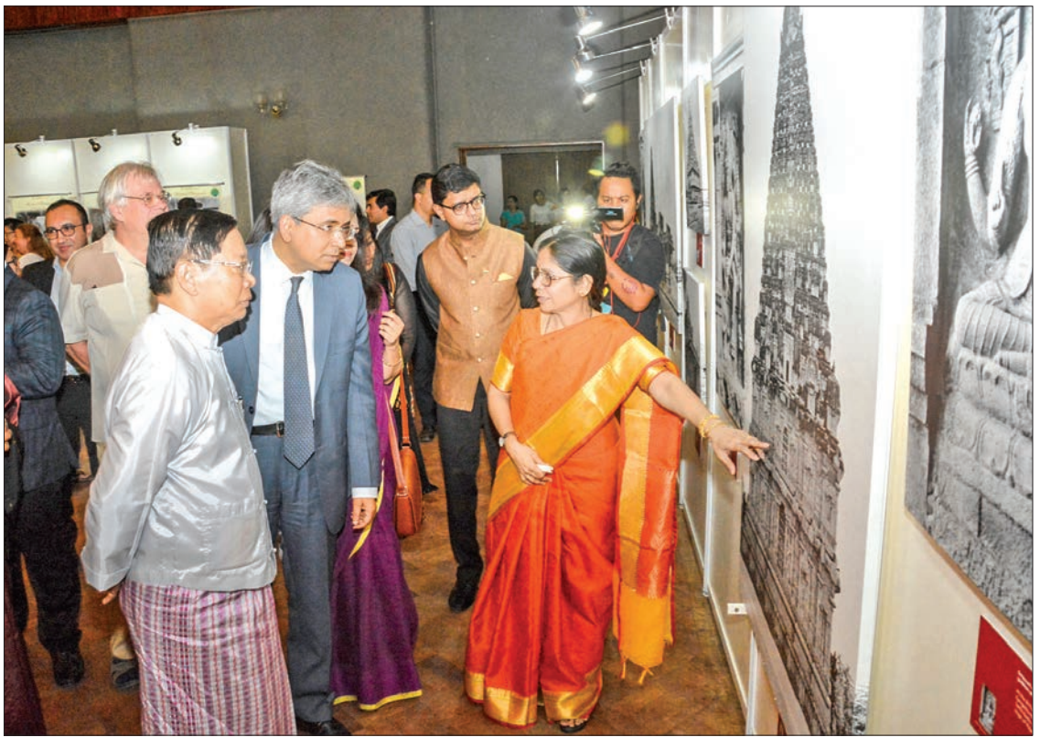
Union Minister Thura U Aung Ko visits the exhibition of Archival Photographs of the Chola Temples of India.

The Great Living Chola Temples are a group of Chola dynasty era temples built during 8<sup>th</sup> to 12<sup>th</sup> century CE. They are listed as a World Heritage Site of the United Nations Educational, Scientific and Cultural Organi-