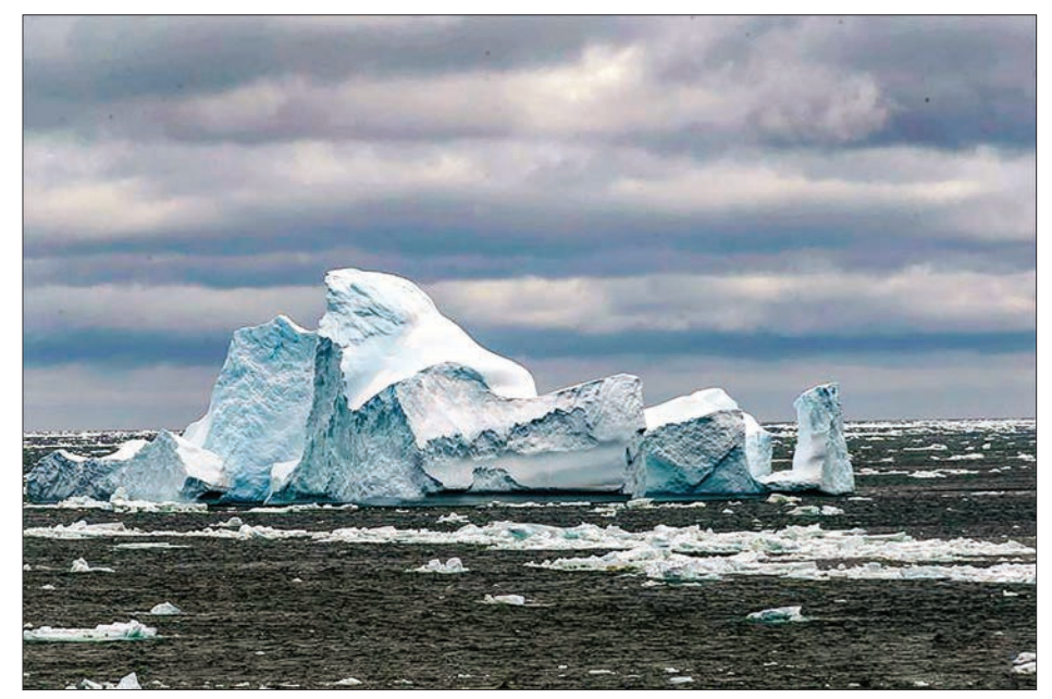
The Arctic Ocean could become ice-free as early as in 2030.

"You can hedge your bets," he said. But the shift in ocean temperatures in the Pacific means "there's more chance of it being on the earlier end of that window than on the later end," he added. The study was published Wednesday in the American Geophysical Union's journal Geophysical Research Letters.— Xinhua