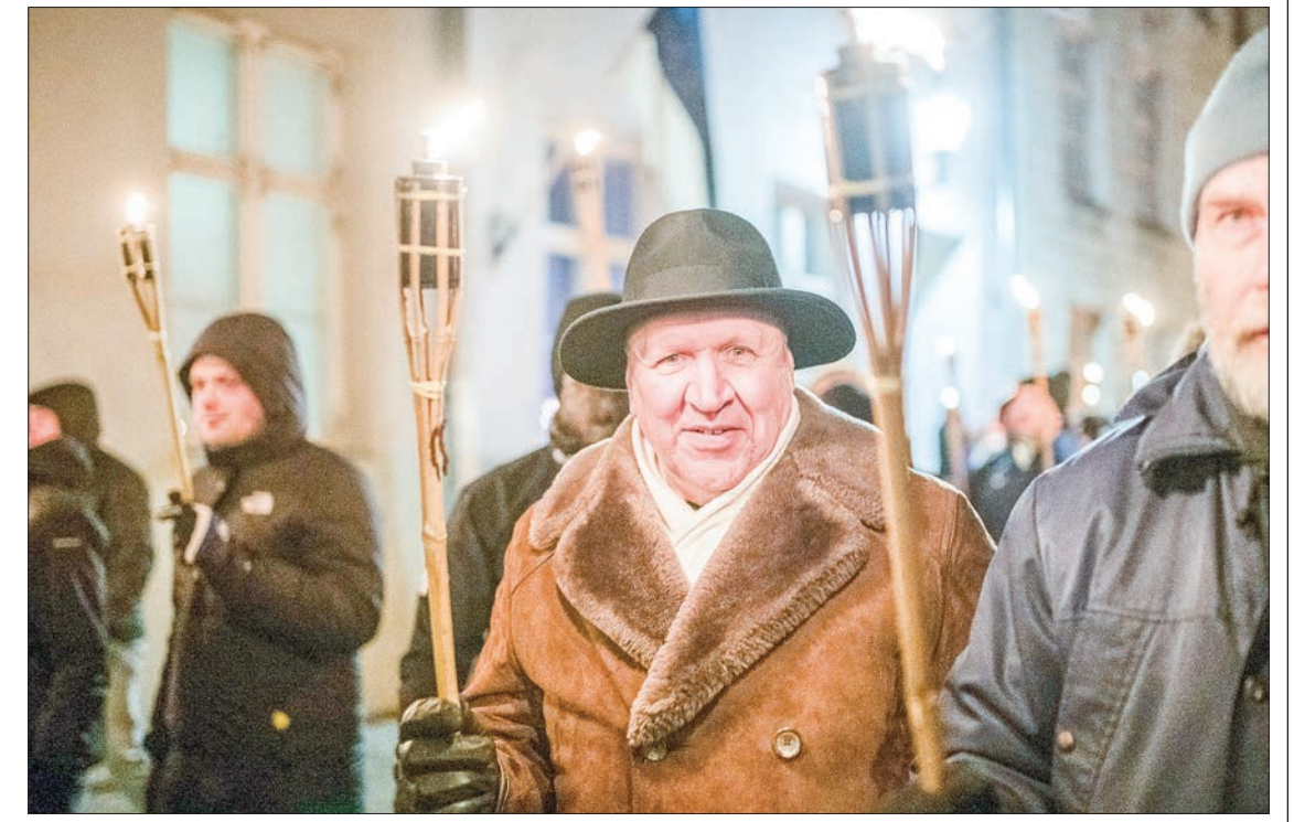
Far-right candidate Mart Helme has publicly expressed xenophobic, sexist and homophobic views, and the members of his EKRE party have included Nazi sympathisers.

Kaja Kallas was elected leader of the opposition liberal Reform party in April 2018 after having become an MP in 2011 and an MEP in 2014. A staunch europhile, she is the daughter of former Estonian prime minister Siim Kallas, who also led the Reform party before serv-