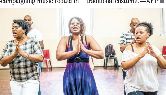
High note: The Soweto Gospel Choir, seen here in rehearsal, have won a Grammy for 'Freedom,' a tribute to Nelson Mandela.

Organized jointly by the National Art Museum of China and Lu Xun Culture Foundation, the exhibition will last until 17 March.—Xinhua