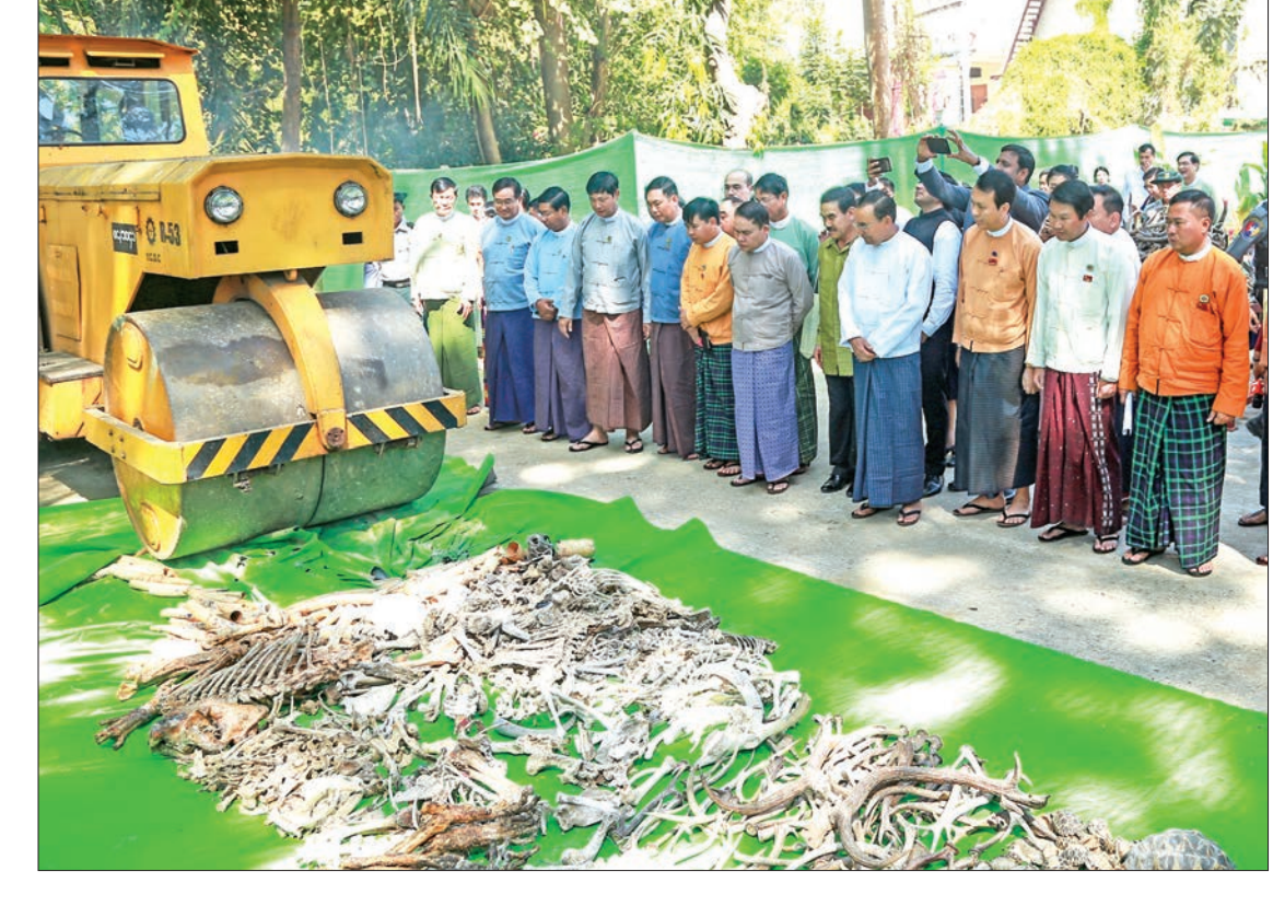
Union Minister U Ohn Win and officials attend the opening ceremony of the Elephant Museum in Yangon yesterday.

Present at the ceremony were Chief Minister of Yangon Region U Phyo Min Thein, regional cabinet members, MPs of the two houses, diplomats, representatives of the embassies, officials of the Ministry of Natural Resources and Environmental Conservation, resident representatives of UN agencies, representatives of NGOs, sister organizations, staff of Forest Department and guests.— MNA I ( Translation:TMT )