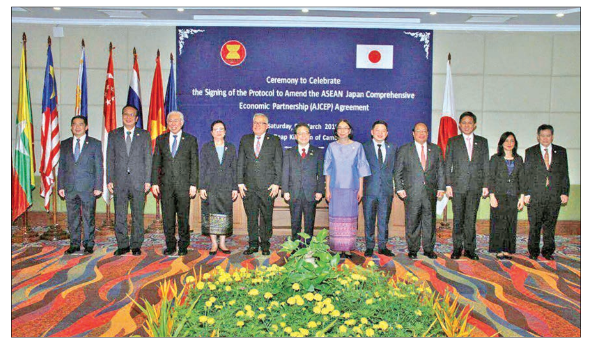
Union Minister U Thaung Tun (4th from right) poses for photo together with other delegates.

At the meeting, the Union Minister commended the RCEP Trade Negotiating Committee (TNC) for the good progress made to-date on both