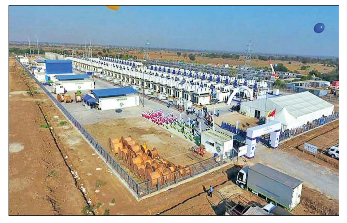
The newly opened 99-megawatt gas-fired station in Myingyan. The station will generate 90 megawatts in summer and 45 megawatts in the rainy season.

A 90-megawatt gas-fired station was opened in central Myanmar to serve as an additional power supply in summer when the domestic electricity demand reaches its peak.