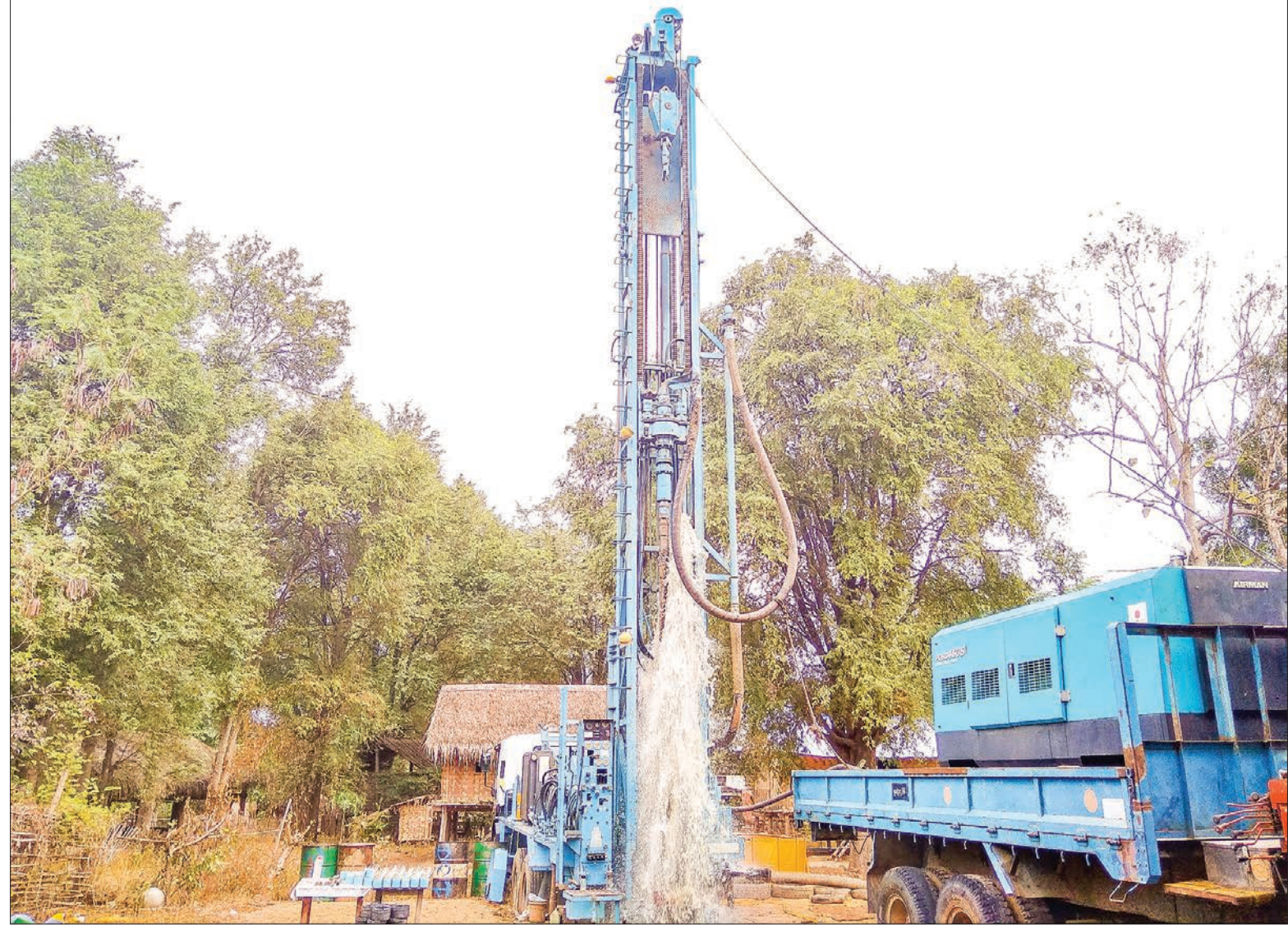
Water gushed out of a tube-well in Magway in the arid region of central Myanmar.